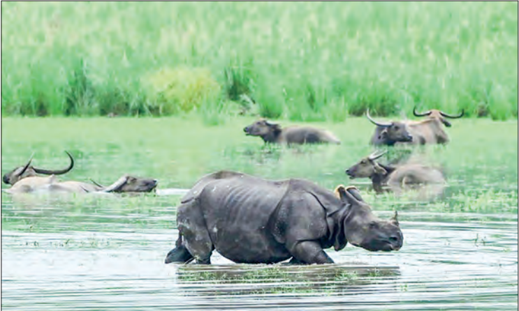
India's rhino population has almost tripled in the past four decades thanks to conservation and anti-poaching efforts, from 1,500 to more than 4,000 today.

morning, the weather bureau said the level of the Cau river, running across Thai Nguyen city, was more than a metre higher than the previous record level of 28.81 metres (94.5 feet) – when Typhoon Yagi devastated the country in September last year. — AFP