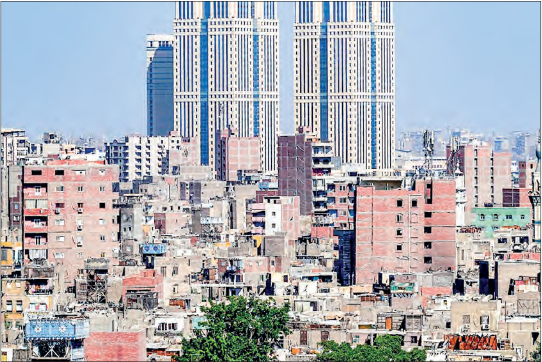
Delegations from Hamas, Israel and the United States are in Egypt for talks on ending the nearly two-year war in Gaza.

CHINESE and Malaysian armed forces will conduct a joint drill in Malaysia and its adjacent waters in mid-to-late October, according to a statement released by the Chinese Ministry of National Defense on Wednesday. Code-named “Peace and Friendship 2025,” the drill will focus on humanitarian assistance and disaster relief, as well as maritime security, said the statement. The live joint exercise will involve multi-service forces from the Chinese and Malaysian militaries. Other ASEAN member states have been invited to send observers, it said. This will be the sixth joint exercise program of the “Peace and Friendship” series. It aims to deepen practical cooperation between the militaries of China and Southeast Asian countries, enhancing their capability to address non-traditional security threats and safeguard regional peace and stability. — Xinhua