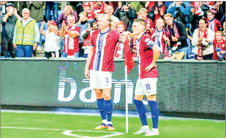
Erling Haaland, who is yet to play at a major tournament, already has a remarkable nine goals in qualifying.

tion until Tuesday when a victory over Latvia in Riga would secure a place at next year's finals in the United States, Mexico and Canada, if Serbia do not beat Albania on Saturday. England boast a seven-point lead over Albania with three matches to play, with Serbia a point further back but with a game in hand. — AFP