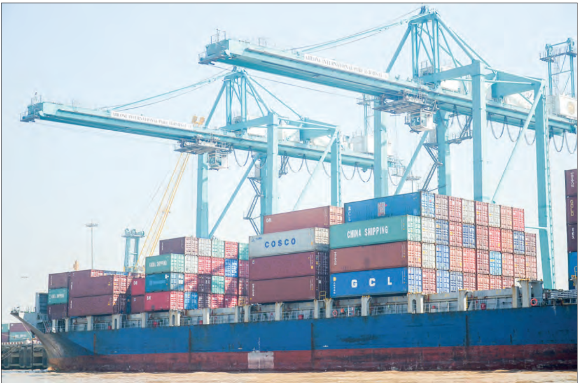
File photo shows containers being loaded and unloaded aboard container vessels at the international port of Yangon.

After the new navigation channel (Kings Bank Channel) accessing the inner Yangon River was found, the draft extension work was accelerated. Afterwards, the port can now handle larger ships. The container vessel MV SITC Zhaoming (185.99-metre LOA, 35.25-metre Beam, 29,232 GRT and 2,698 TEUs) of Hong Kong SAR-based SITC Shipping Line docked at Asia World Port Terminal for the first time on 22 June, which is the largest ship that AWPT