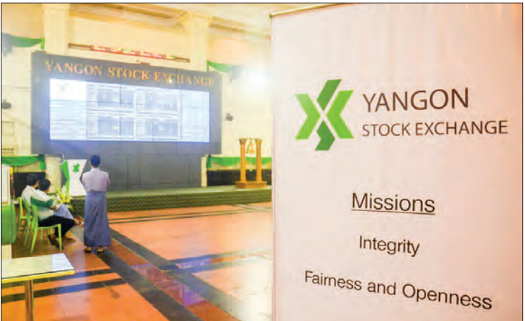
The panel is seen displaying stock-market indexes at the Yangon bourse.

The stock trading in September is up by over K86 million (42,560 shares) compared to that of August. — NN/KK