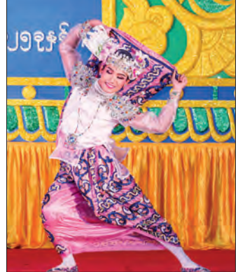
A dance contestant (male) at higher education level from Kayin State.

the basic education level (aged 15-20) male contest, higher education level male contest and female contest.