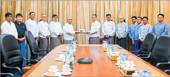
Union Minister U Khin Maung Yi receives the donations made by the Blue Sky rescue team from the People’s Republic of China in Nay Pyi Taw yesterday.

The music band performed in Mandalay and PyinOoLwin, and the Myanmar-Russia-Belarus joint concerts will be in Yangon and Nay Pyi Taw. — MNA/KTZH