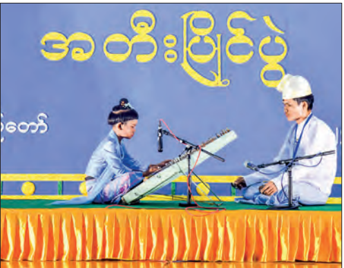
A Donmin contestant (female) from Sagaing Region.