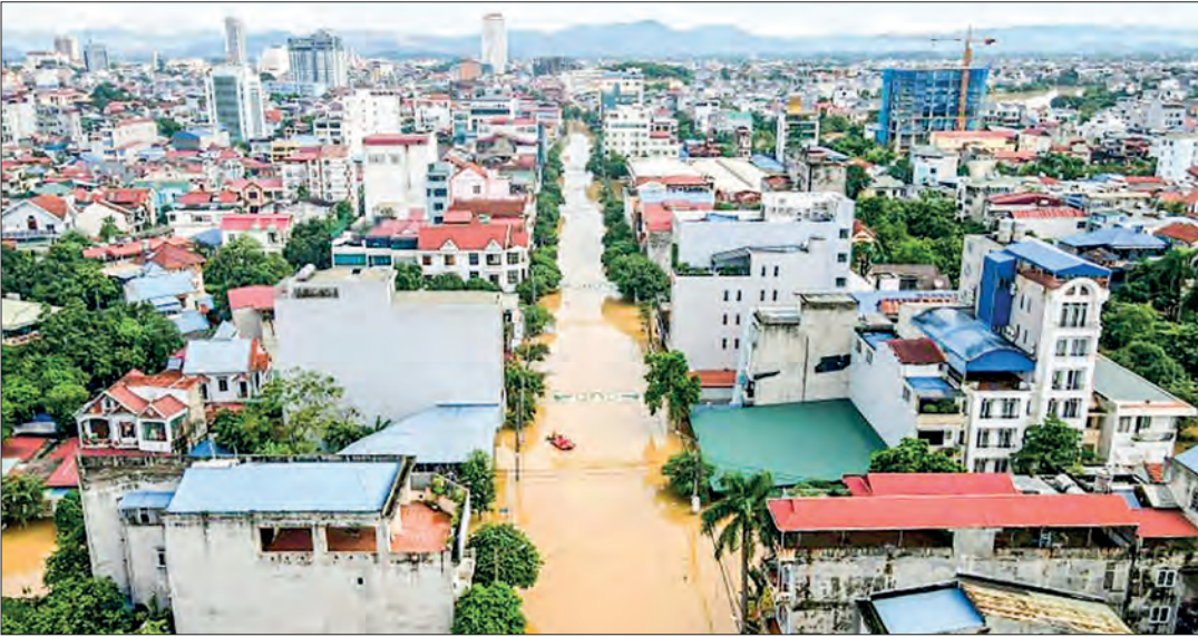
Record floods submerged streets in several communities in Vietnam on Wednesday, with at least eight people killed this week.

The Cau River surged over 1 metre above its previous record high of 28.81 metres (set during Typhoon Yagi in September 2024), trapping tens of thousands of residents.