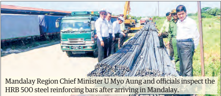
Mandalay Region Chief Minister U Myo Aung and officials inspect the HRB 500 steel reinforcing bars after arriving in Mandalay.

Including this latest shipment, 977.414 tonnes of HRB 500 steel bars have now been delivered — 486.886 tonnes in the first consignment and 490.53 tonnes in the second. Similar arrangements are being made to transport HRB 500 steel bars needed for rehabilitation and reconstruction projects in the Sagaing Region.