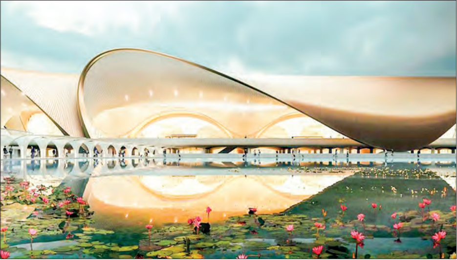
The project aims to ease congestion at the Mumbai International Airport and position Navi Mumbai as a global aviation and logistics hub.

PRIME Minister Narendra Modi on Wednesday inaugurated the Navi Mumbai International Airport (NMIA), a state-of-the-art greenfield airport set to transform air connectivity in the Mumbai Metropolitan Region and Western India. Developed under a Public-Private Partnership (PPP), the airport is operated by Navi Mumbai International Airport Pvt Ltd. (NMIAL) a joint venture (JV) between Adani Airports Holdings Ltd, holding 74 per cent and City and Industrial Development Corporation of Maharashtra Ltd (CIDCO) holding 26 per cent. The project aims to ease congestion at the