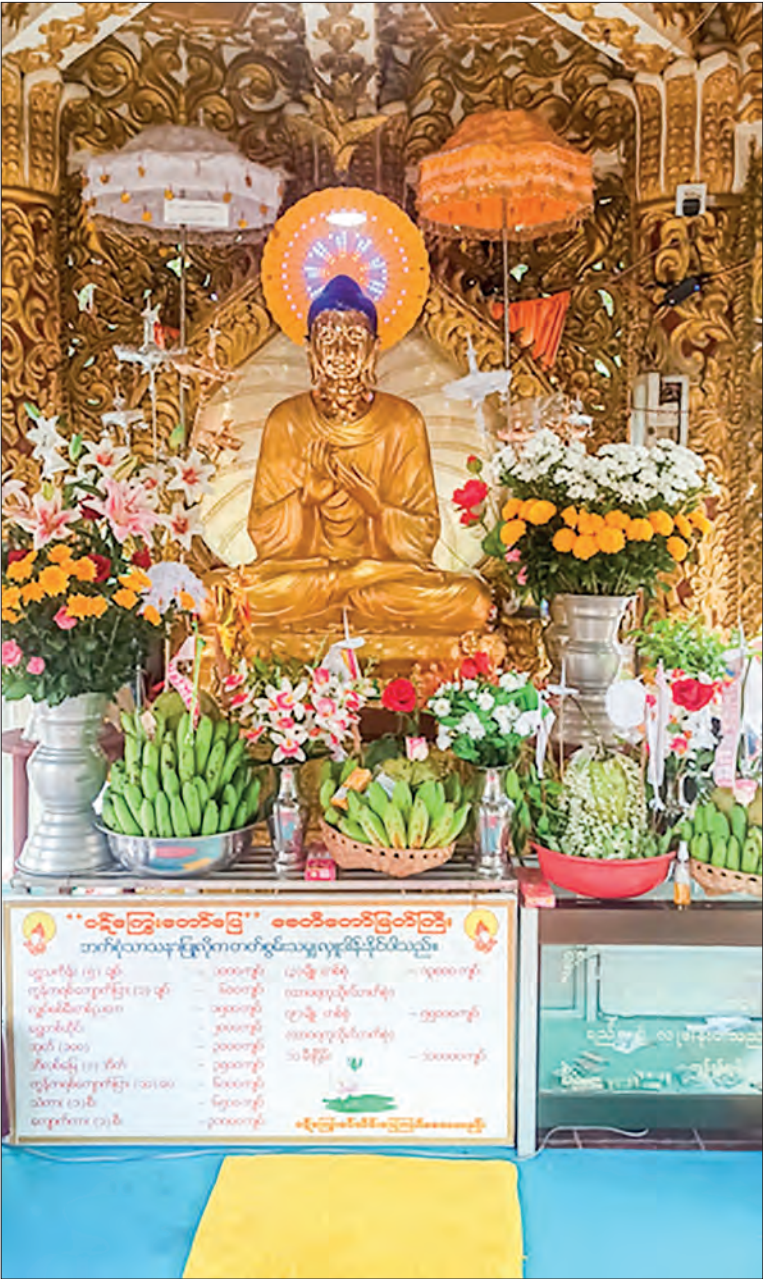
The Wutkywaetawpyay Buddha Image.

Finally, we made our way back to the Gandayon bus stop, where my friend and I parted. The afternoon sun was intense, and though I had rested under the trees, the heat made me tired. Still, the serene surroundings, sacred images, and the festive spirit of the pagoda compensated me for my fatigue.