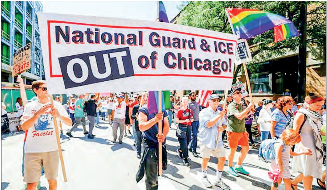
Protesters opposed to federal troop deployments in Chicago march in the city on 6 September 2025.

1,200 shootings and 360 homicides in Chicago in 2025 so far.