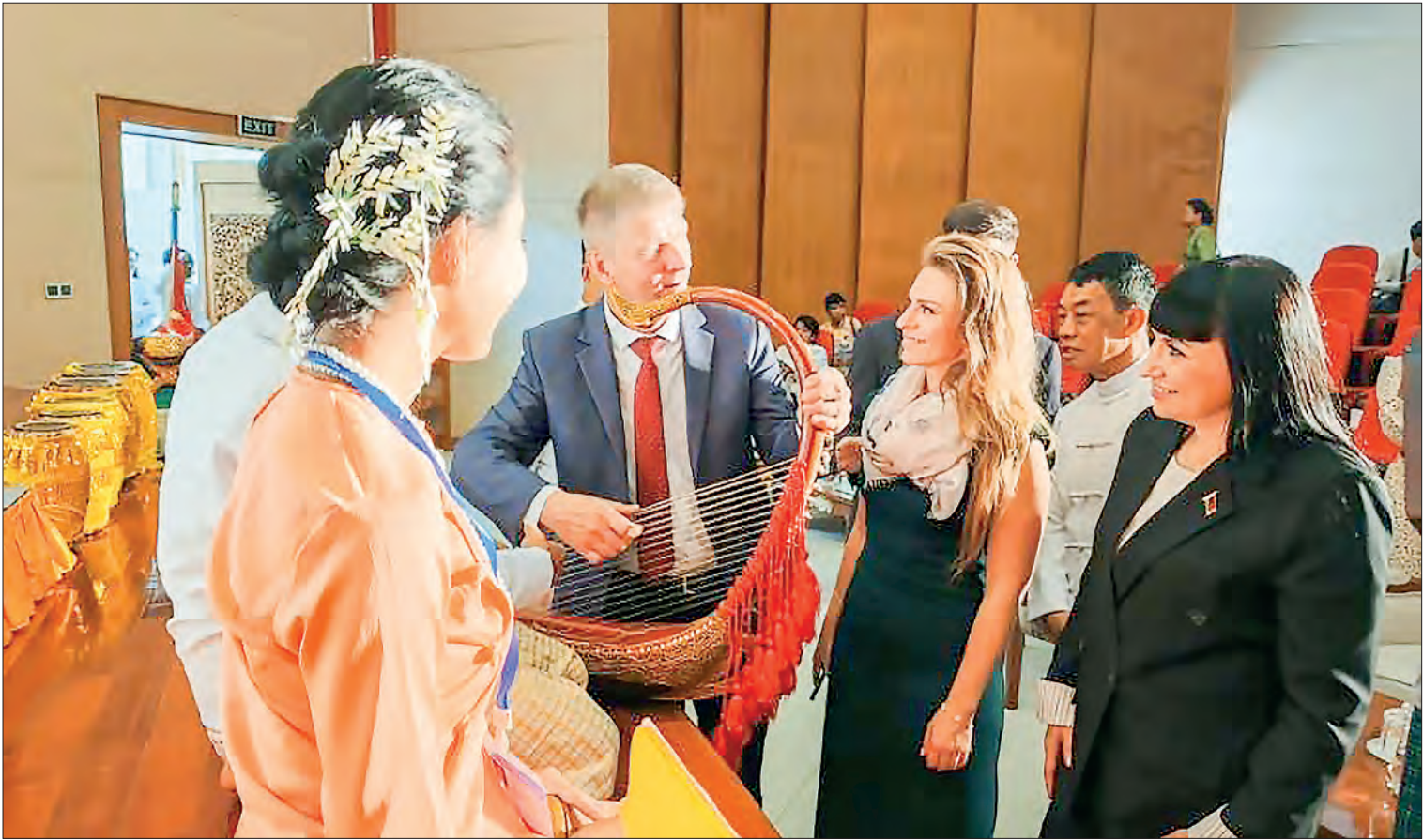
Belarusian entertainment troupe delegates examine a Burmese harp – one of Myanmar’s traditional musical instruments – during observation tour to the country’s traditional performing arts competition yesterday.

T o promote friendship between Myanmar and Belarus, an entertainment troupe from Belarus, currently visiting Myanmar, observed the 26 th Traditional Myanmar Cultural Performing Arts Competition 2025 (Central Level) yesterday. The troupe first visited the Ministry of Religious Affairs and Culture, where they observed the Donmin competition at the Cultural Treasure Hall. They also watched the Maha Gita song competition at the National