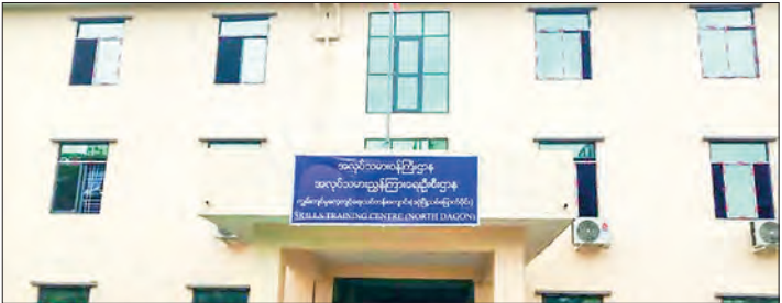
This image displays the signage of the Skills Training School under the Department of Labour in Dagon Myothit (North) Township, Yangon Region.

THE Safe Migration of the Ministry of Labour announced that 75 Myanmar workers leaving for Japan through licensed foreign employment service agencies will be allowed to attend an overseas job guide training course and receive Overseas Worker Identification Cards (OWICs). These 75 approved candidates are expected to attend the course on 9 October, and the OWICs will be issued to them on 10 October. If anyone fails to attend the course or obtain the card, they will have to resubmit, it said. For workers with an OWIC, agencies may request a dispatching approval within one week from the date of departure and submit again after preparing the list of workers to be sent, copies of passports, and OWICs in Excel soft copy to the Department of Labour, dolmigrationjapan@gmail.com , it announced. — MT/ZN