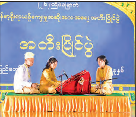
A Donmin contestant (female) from Bago Region.