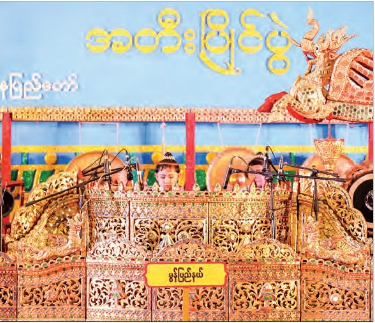
A traditional orchestra solo contestant (female) at basic education level from Mon State.