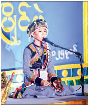
Maha Gita contestant (female) from Kachin State.

Similarly, the violin contest took place at the training theatre of the Ministry of Religious Affairs and Culture, and it included