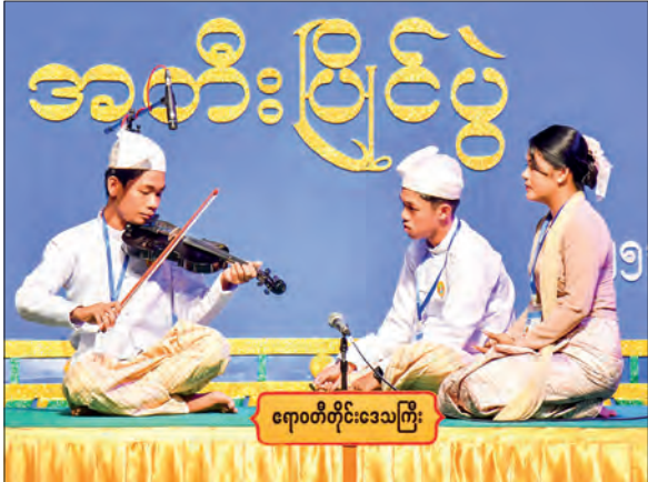
A violin contestant (male) from Ayeyawady Region.