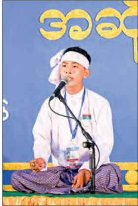
Classical and modern song contestants (male) at basic education level