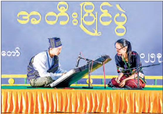
A Donmin contestant (male) from Chin State.