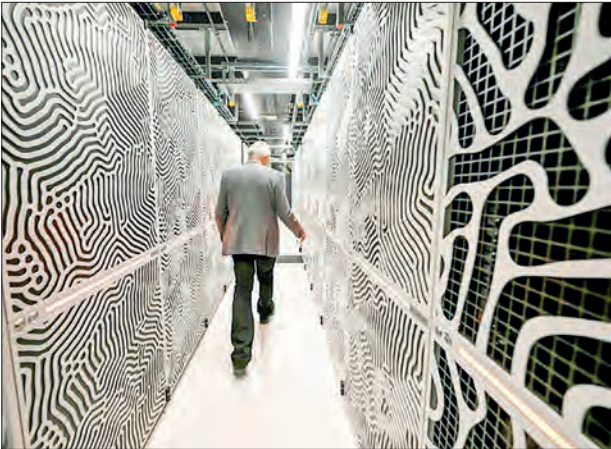
Brussels believes the European Union can still compete in the global AI race.

The European Commission committed €1 billion ($1.6 billion) to fund AI development in areas like pharmaceuticals, energy, and defence, focusing on “European AI-powered” tools and specialized models.