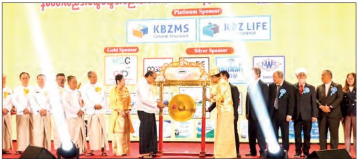
A commemorative photo from the 2025 AGM and General Assembly of the Myanmar Real Estate Services Association (Central), held on 7 October 2025.