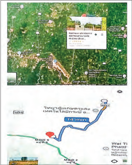
This image reveals a location map for the C of I mobile unit.

A Certificate of Identity (C of I) issuing mobile unit will be set up in southern Thailand, Krabi, on 10 October, according to the Department of Labour of the Ministry of Labour. For Myanmar migrant workers in Thailand, the C of I service has been provided in four provinces, including Samut Sakhon, Samut Prakan, Surat Thani, and Chiang Mai, as of 6 August 2025. The department said that a C of I station has been in operation in Samut Thani in southern Thailand at present. Workers in the province have been found seeking the C of I service in Samut Sakhon and Samut Prakan, adding burdens the workload of the stations. Therefore, a C of I mobile unit has been planned to be established in Krabi to provide efficient C of I services for Myanmar migrant workers from Phuket, Phang Nga, and Koh Samui islands in southern Thailand. The cost of the C of I application is just THB2,670, it said. — MT/ZS