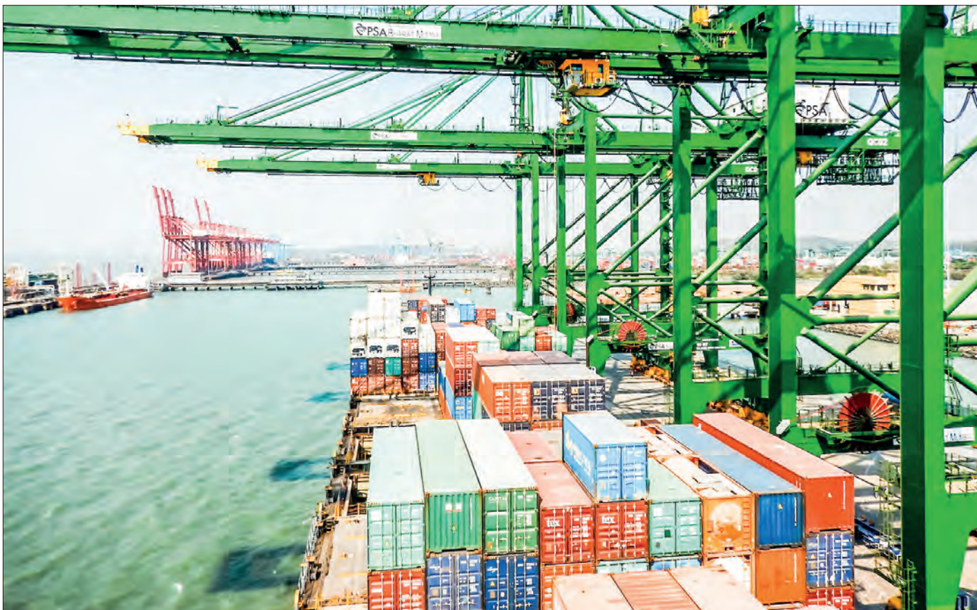
Jawaharlal Nehru Port Authority (JNPA) is amongst top global ports and India’s largest port by crossing 10+ million TEUs capacity in January 2025 and poised to achieve 10 million TEUs throughput by 2027.

Starmer called it “the biggest trade mission that the United Kingdom has ever sent to India,” involving a large UK delegation for economic discussions.