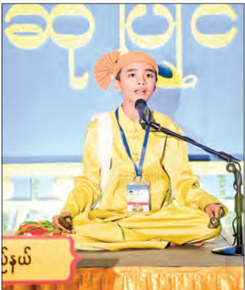
Maha Gita contestant (male) from Shan State.