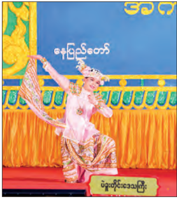
A male dancing contest (aged 15-20).