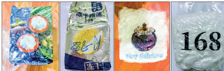
Photos reveal different kinds of drug packages seized by authorities.