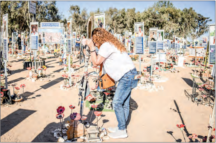
A woman reacts by one of the memorials of victims of the 7 October 2023 attacks at the Nova Festival grounds in Reim in southern Israel on the second anniversary of the attacks on 7 October 2025.

It resulted in the deaths of 1,219 people, mostly civilians, according to an AFP tally based on official Israeli figures. Militants also took 251 people hostage into Gaza, of whom 47 remain captive, including 25 the Israeli military says are dead. On Tuesday, senior Hamas official Fawzi Barhoum called the 7 October attack a “historic response” to Israel’s bid to “eradicate the Palestinian cause”. He also said Hamas was working to “surmount all obstacles” to sealing a deal in Egypt. — AFP