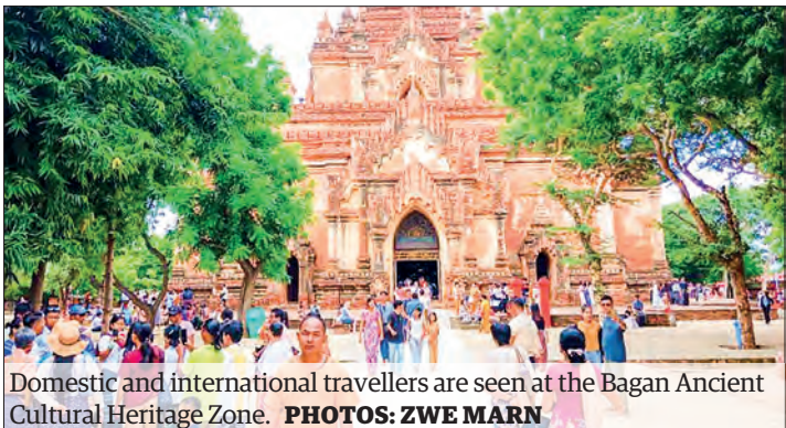
Domestic and international travellers are seen at the Bagan Ancient Cultural Heritage Zone.

Although a bridge along the Meiktila-Kyaukpadaung road was destroyed due to water erosion, 18 famous pagodas and temples in Bagan were crowded with visitors. — Thitsa (MNA)/KTZH