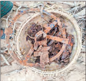
Newly unearthed ornamental umbrella and pinnacle on 5 October.