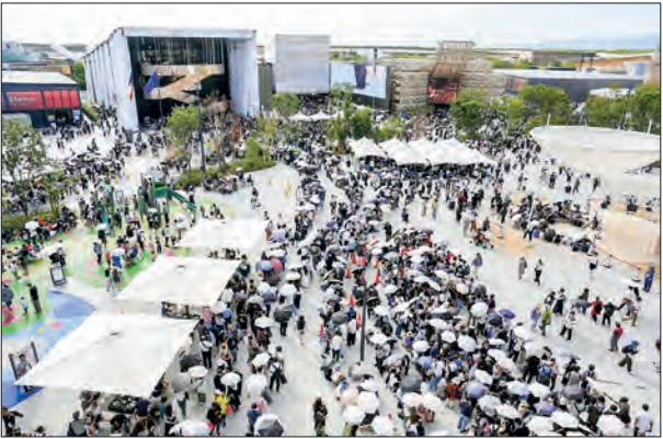
The World Exposition in Osaka is packed with people on 27 September 2025, as the number of visitors since the event’s start on 13 April reaches an estimated 22 million.

OPERATING expenses in Osaka are expected to show a surplus of up to 28