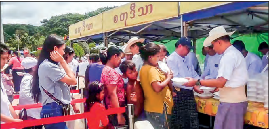
People visiting the Thadingyut Festival and MSME market in the People's Square, Yangon.

Moreover, two million acres of crops contribute to bee pollination annually. The beekeeping businesses near the crop fields contribute to the successful yield of the crop as well as quality bee production. — NN/KK