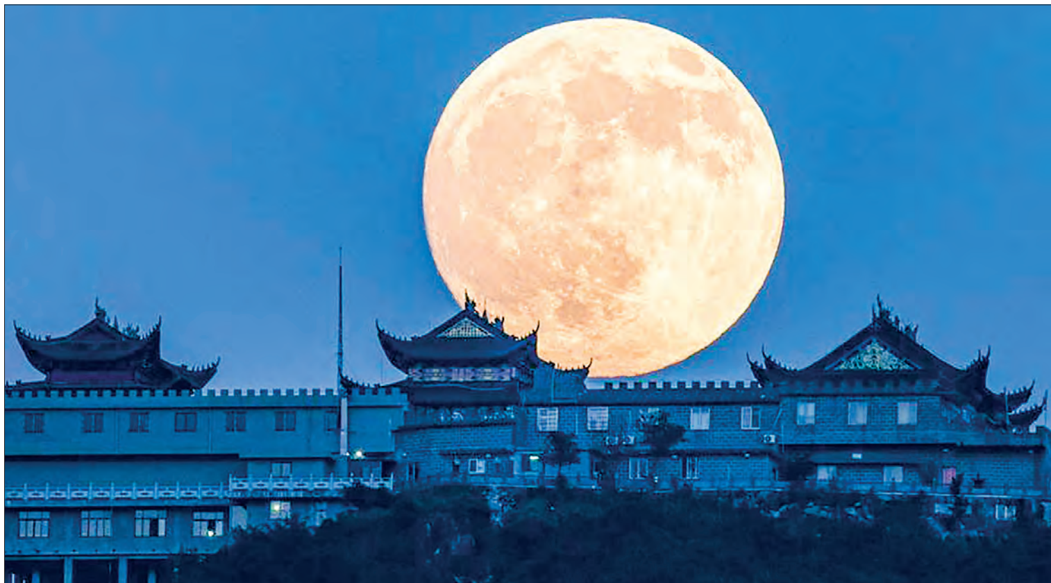
A full moon is pictured in Cangnan County of Wenzhou, east China's Zhejiang Province, 6 October 2025. Monday marks this year's Mid-Autumn Festival, which is celebrated annually on the 15 th day of the eighth month in the Chinese lunar calendar. People across China admire the full moon to celebrate the traditional holiday. PHOTO: XINHUA

His administration has imposed a basic tariff of 10 per cent on all countries since April, with much higher rates for some economies. — AFP