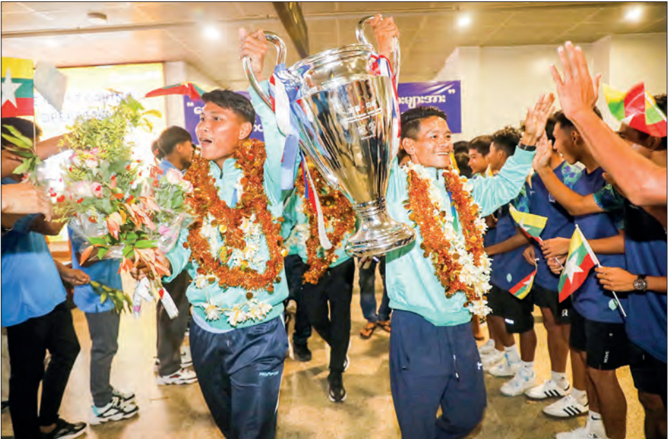
This photo shows the Myanmar ISPE FC men's football team being welcomed at Yangon International Airport yesterday.

and Physical Education, family members, fellow athletes, and enthusiastic fans waving flags and cheering with drums. Following the airport reception, the team proceeded to Kyaikkasan Sports Ground via Gate 9 on West Horse Racecourse Road, where students from the University of Sports and Physical Education (Yangon) greeted them with victory garlands and applause to celebrate their achievement. — MNA/KZL