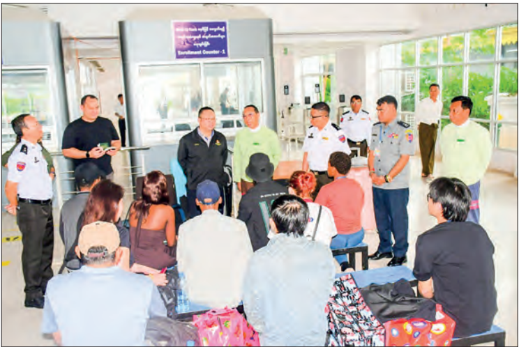
Immigration processes are underway for the repatriation of undocumented foreign entrants.

TEN foreigners who had illegally entered Myanmar through border routes after transiting neighbouring countries, including Thailand, were repatriated to their respective countries through the Myanmar-Thailand Friendship Bridge II in consideration of humanitarian concerns and bilateral relations, in line with legal procedures. The group included six South Africans, three Malaysians, and one Russian who had engaged in illegal online gambling, online scams, and other criminal activities in Myawady-Shwe Kokko, KK Park, and Kyaukkhat areas in Kayin State. To ensure the repatriation process was systematic and