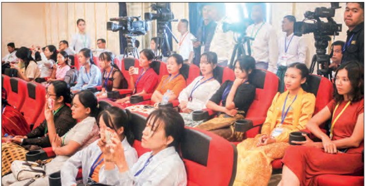
Spectators cheer on the contestants.