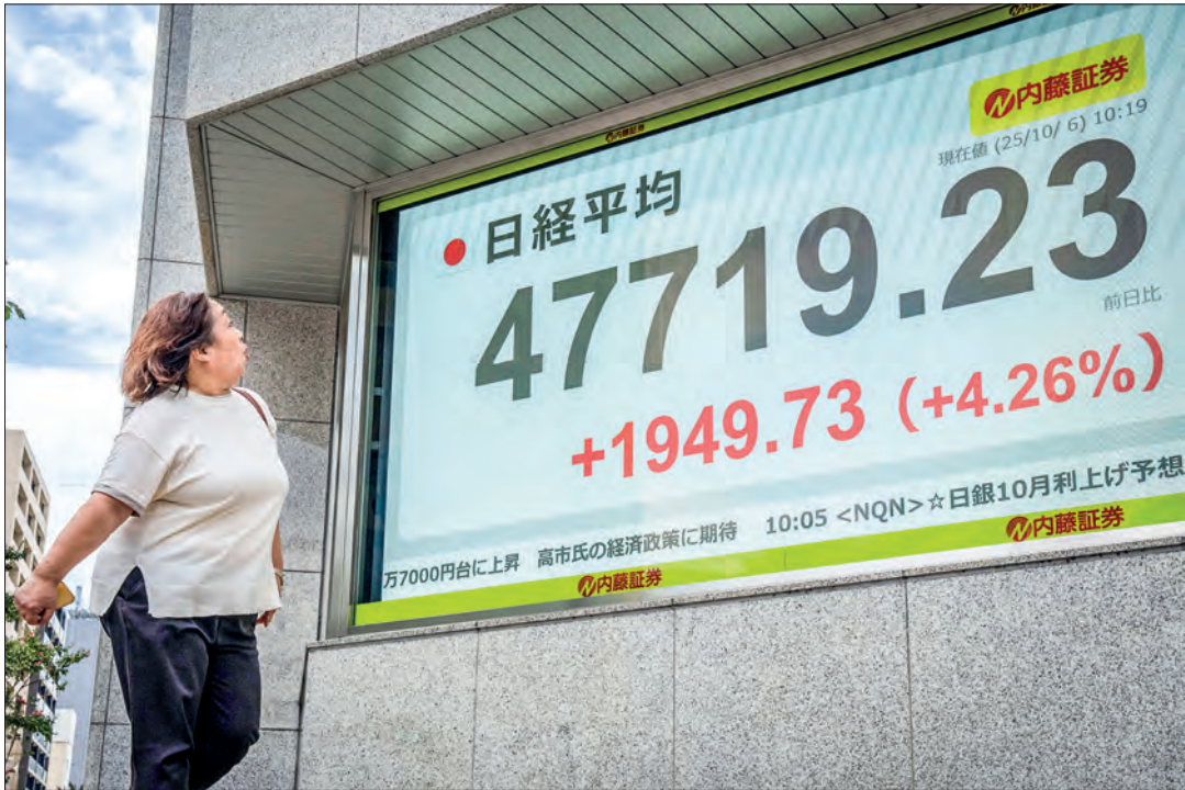
A woman looks at an electronic board displaying the Nikkei Stock Average on the Tokyo Stock Exchange along a street in Tokyo on 6 October 2025.

GLOBAL stocks steadied Tuesday and gold hovered around a fresh high as investors retreated to safety amid a US government shutdown and French political upheaval.