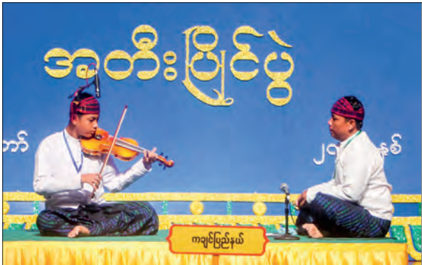
A violon contest (aged 10-15).