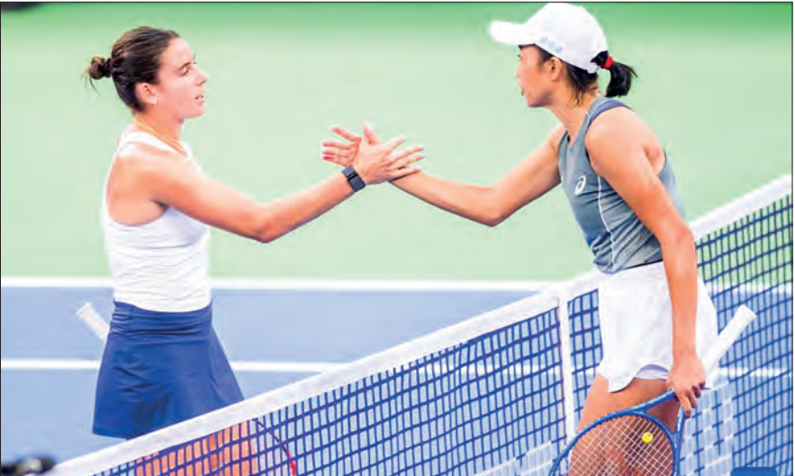
Zhang Shuai (R) of China greets Emma Navarro of the United States after their women’s singles round of 64 match at the 2025 Wuhan Open tennis tournament in Wuhan, central China’s Hubei Province, 7 October 2025.

Salah has fond memories of playing against Djibouti, scoring four goals in a 6-0 Cairo romp in the opening round of World Cup qualifying two years ago. It does not help Djibouti that they do not have a FIFA-approved stadium, so their ‘home’ match against Egypt will be staged in the Moroccan commercial capital Casablanca.