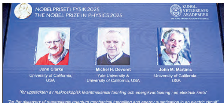
Photos of (LtoR) British physicist John Clarke at the University of California, USA, French physicist Michel H Devoret (University of California and Yale) and US physicist John M Martinis (University of California) are seen on a screen during a press conference on the awarding of the 2025 Nobel Prize in Physics at the Royal Swedish Academy of Sciences in Stockholm, Sweden, on 7 October 2025.

three independent thermobarometers to determine the temperature-pressure conditions under which the basalt crystallized. Basalt from the moon's farside, collected by Chang'e-6 and dated to 2.8 billion years ago, reveals that their mantle potential temperature is about 100 degrees Celsius lower than that of the nearside basalt returned by the Chang'e-5 mission, according to the study. — Xinhua