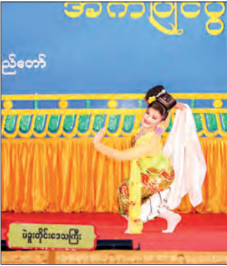
A female dancing contest (aged 15-20).