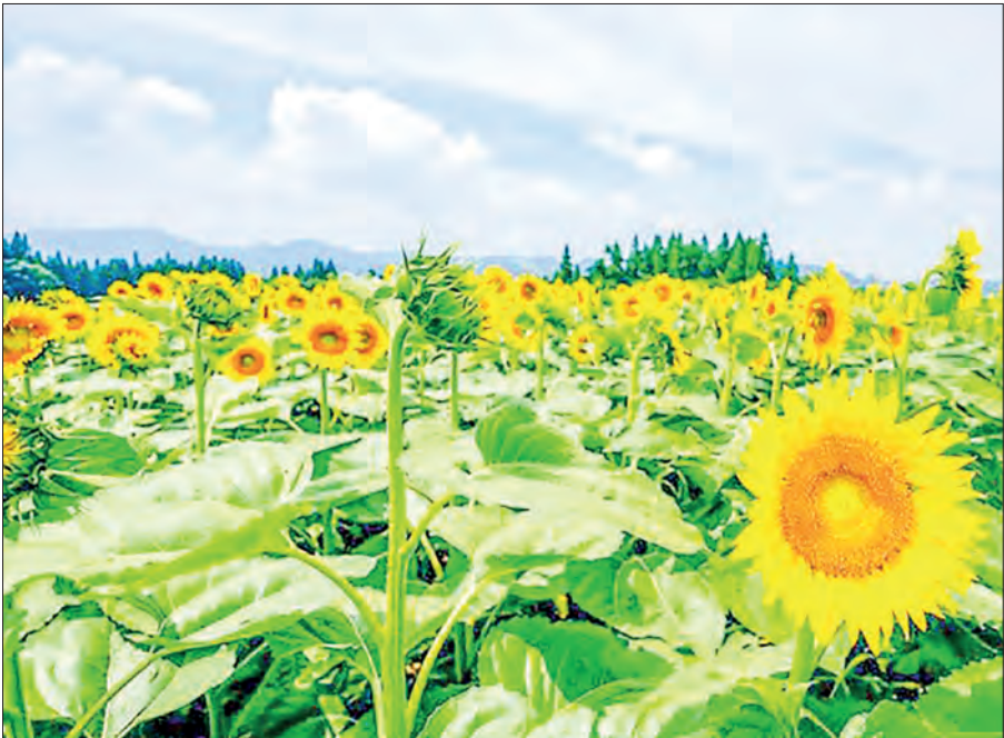
A thriving sunflower plantation.

CBM's move will control inflation and currency depreciation, maximize banks' interest income and bring about banking sector stability and financial stability, as per CBM's notification. — NN/KK