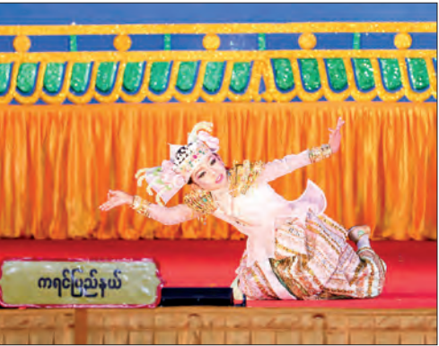
A male dancing contest (aged 10-15).