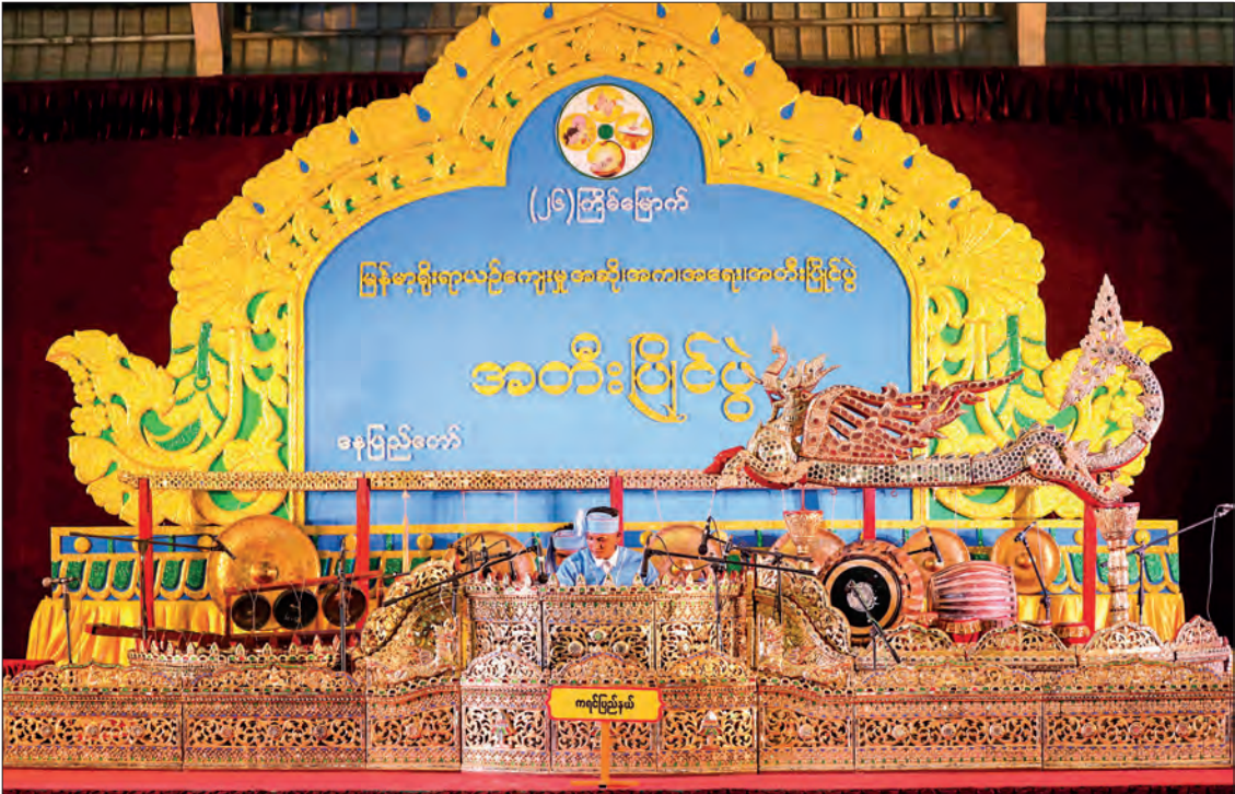
A solo performance at the traditional Myanmar orchestra contest for higher education men.

was participated in by students from higher education (men's and women's) and basic educa-