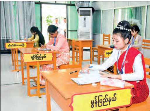
A song composing contest.