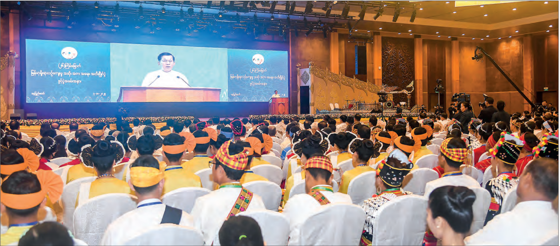
Acting President and State Security and Peace Commission Chairman Senior General Min Aung Hlaing delivers the opening address at the 26 th Traditional Myanmar Cultural Performing Arts Competition in Nay Pyi Taw yesterday.