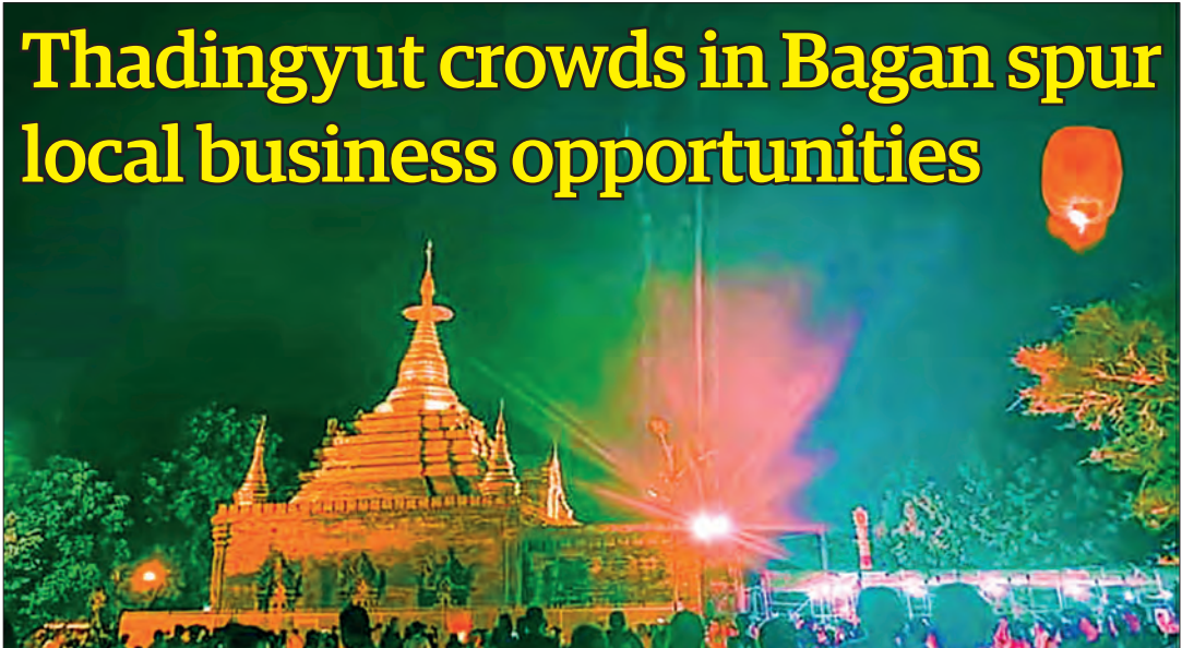
Pagodas in the Bagan Ancient Cultural Heritage Zone glow serenely under the lights.

ACCORDING to the observations at 5:30 am MST today, the tropical storm "MATMO" crossed the northern part of Vietnam, has moved west-northwestwards and downgraded into a Land Depression over northern Vietnam and the boundary areas of China. — DMH