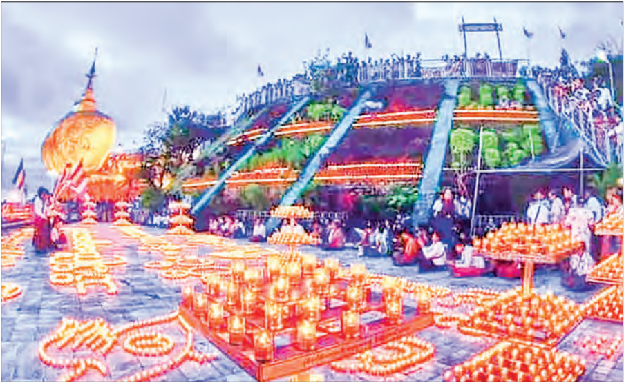
This photo captures the cable cars running up the mountain for pilgrims.

“The opening ceremony of the mountain, the Buddha Pujaniya Festival, and the consecration ceremony will be held on 6 October. As the number of pilgrims has been increasing since the end of September, we increased the number of mountain vehicles to 50 before the festival. Since the number of pilgrims has