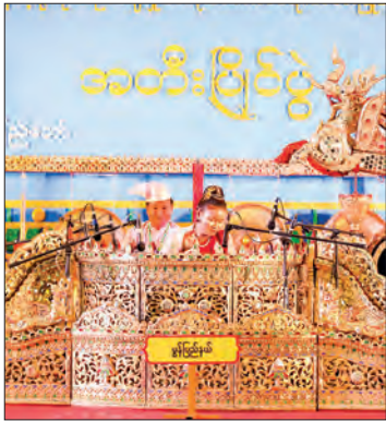
For higher education women.

The Performing Arts Competition (Central) comprises 1,661 contestants at the basic education (aged 10-15) and (aged 15-20) levels and higher education level under the systematic assessment of 107 panels of judges. — MNA/TTA