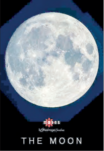
This photo illustrates the image of the Moon.

THE moment of the first supermoon for 2025 was visible in Myanmar on 7 October, the Myanmar Astronomy and Science Enthusiasts Society (MASES) said on 7 October. The supermoon or full moon, technically named perigee, occurs when the Moon comes closest to the Earth in its orbit. The distance from the Earth always varies due to the elliptical orbit, about 23855 miles on average. In this supermoon moment, the distance from the Earth to the Moon is 224,559 miles, it said. When a supermoon occurs, the distance between the Earth and the Moon seems closer and looks 14 per cent bigger and 30 per cent brighter than an average full moon. The supermoon, which was visible on 7 October, is the first for 2025, and three consecutive supermoons will occur in November and December 2025. With the view of the lighting festival of Thadingyut, the sky will be unusually brighter and the first supermoon will be visible at its best from Myanmar, said MASES. Saturn was bright together with the Moon on 6 October, had a chance to see the view, it added. — MT/ZS