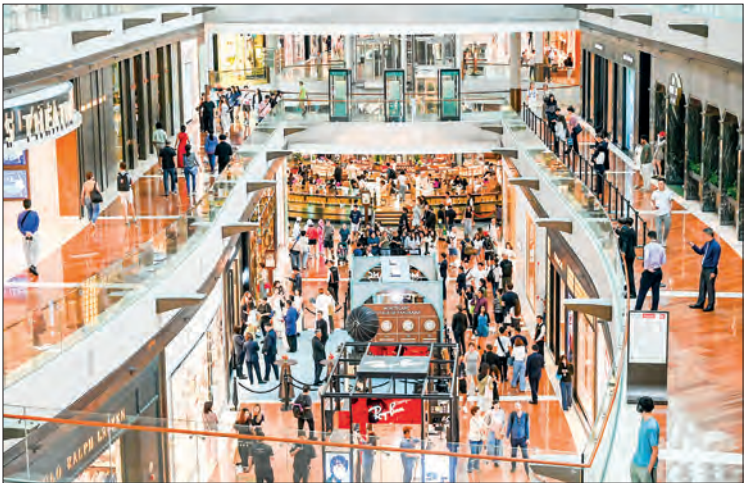
Visitors walk through the Marina Bay Sands shopping mall in Singapore on 11 September 2025.

Within the non-information and communications sectors, finance and insurance remained the top contributor, followed by wholesale trade and manufacturing. (1 Singapore dollar equals US$0.77) — Xinhua