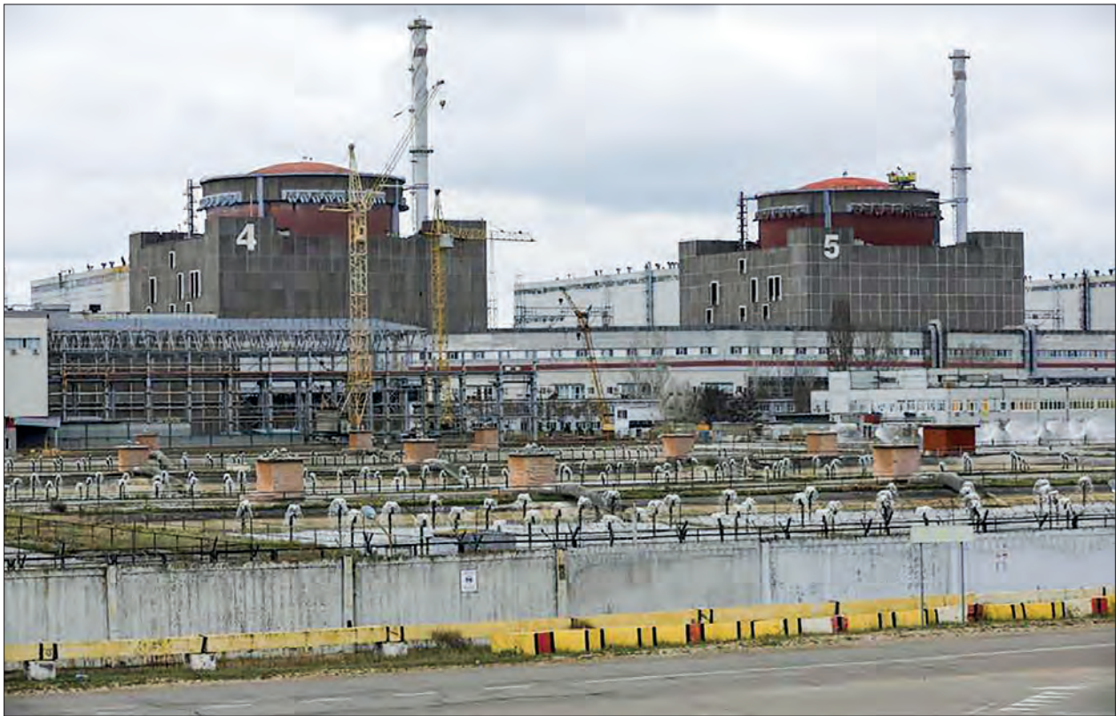
This photo taken on 29 March 2023 shows the Zaporizhzhia nuclear power plant in southern Ukraine.

MULTIPLE rounds of shelling were heard at the Zaporizhzhia Nuclear Power Plant (ZNPP) on Monday amid the longest off-site power loss of the plant, posing “growing risks” to its nuclear safety and security, according to a UN nuclear watchdog statement. The shelling occurred in the afternoon, totalling about 15 rounds at near and middle distance from the site. The ZNPP informed the International Atomic Energy Agency (IAEA) that two rounds of shelling struck