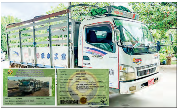
Photo shows confiscated vehicle carrying illegal items in Mandalay Region.

UNDER the supervision of the Illegal Trade Eradication Steering Committee, efforts to combat the illicit trade are continued effectively by the law.