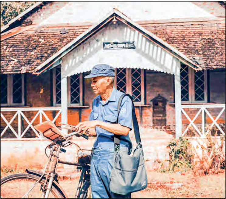
This photo features the Kalaw Post Office, designated as an ancient building.

December, January and February have been designated as the yearly climbing season of Mount Taungwine since 2023, which attracts not only locals but also pilgrims from other regions and states. — MT/ZN