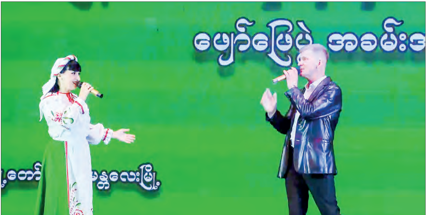
Belarusian vocalists sing traditional songs, modern songs and the songs composed about Myanmar at the Myanmar-Belarus Music Concert in Mandalay yesterday.