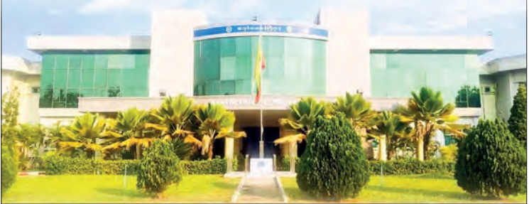
Ministry of Labour head office.

THERE are 179 agencies that haven't made submission of monthly reports on worker dispatch for September, said Safe Migration under the Ministry of Labour. It added that those agencies shall face fine as well as suspension for the sending process if they don't do in time. Overseas employment agencies have been instructed to make the submission of report on sending workers, and the submission is a must-do on monthly basis either they make sending or not, to dolmigrationsending@gmail.com , by deadline. If they fail to do by deadline, they shall face fine, said the ministry. — MT/ZS