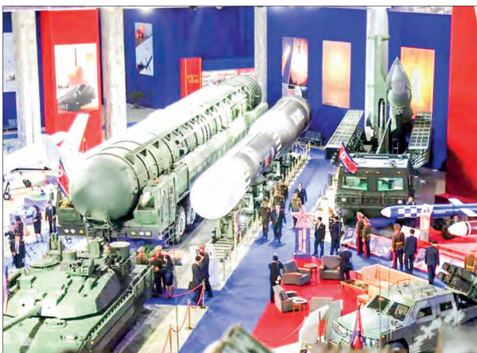
North Korea's leader Kim Jong-un attends opening of the Military Hardware Exhibition Defiance Development-2025 in Pyongyang.

Kim Jong-un stated that the exhibition showcases the achievements of key projects that have been advanced to strengthen the DPRK's military structure — centred on its nuclear deterrent — making it ever more modern and sophisticated. — SPUTNIK