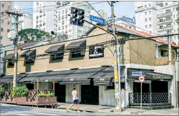
A view of the facade of Ministrao Bar in São Paulo which was closed following an operation investigating the sale of alcoholic beverages contaminated with methanol.

Federal police probe potential organized crime ties, while a “situation room” coordinates antidotes and crisis response. Businesses worry about lost revenue, with bar owners reassuring clients unaware of methanol's undetectable traits. — AFP