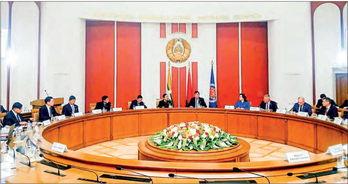
Union Minister Dr Wah Wah Maung and Belarusian Foreign Affairs Minister Mr Maxim Ryzhenkov discuss at the second meeting of the Myanmar-Belarus Joint Committee on Trade and Economic Cooperation in Minsk, the Republic of Belarus on 2 October.

To further accelerate bilateral trade and economic cooperation, the parties exchanged views on the potential and opportunities for collaboration in sectors covered by the agreements and roadmaps, including industry, agriculture and food, health and medicine, banking