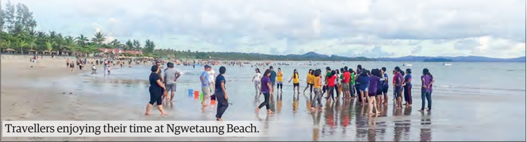
Travellers enjoying their time at Ngwetaung Beach.

To ensure safety, comfort, and enjoyment, the Ngwetaung Beach has been well-maintained. Visitors can enjoy services such as bicycle hire, motorboat rides, and horse riding, along with stalls offering local food, consumer goods, and souvenirs for convenience. — ASH/KZL