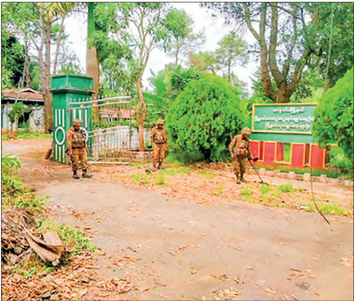
Tatmadaw members search for mines in an office in Kyaukme yesterday.

TATMADAW has fully regained control of Kyaukme Township in Shan State (North) after conducting counter-terrorism operations to ensure the safety and stability of local people. Tatmadaw, in cooperation with residents has been implementing reconstruction efforts to restore normal administration and rebuild the town. To enable the reopening of basic education schools and ensure safe and peaceful living for local ethnic people, security forces began mine clearance activities on 4 October. They have been removing different sorts of mines, and explosive devices planted by TNLA terrorists and their allied groups, especially in public areas frequently used by locals. In addition, to provide healthcare services for residents, doctors and nurses from the Ministry of Health and Tatmadaw have jointly opened a temporary hospital at Labha Muni Chinese Temple in Kyaukme. Medical teams have started offering healthcare services to local