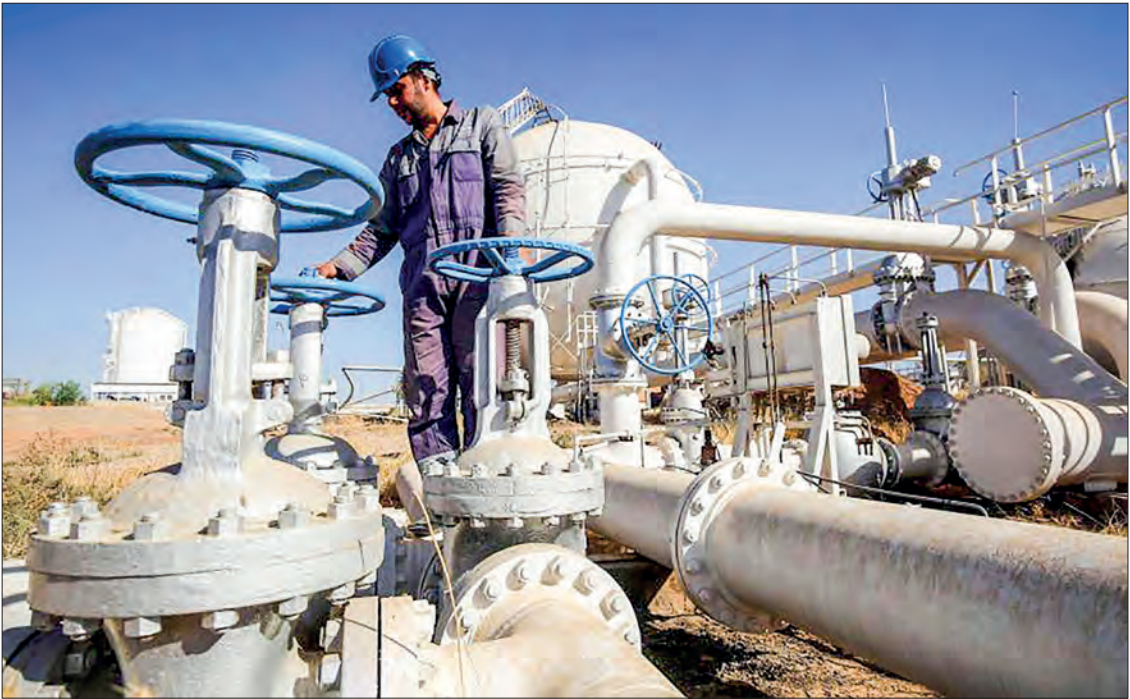
This is the first time the federal government in Baghdad has managed the export of oil produced in the Kurdistan Region, fulfilling the terms of a new agreement.

capable of carrying 650,000 barrels, now docked and loading at Ceyhan. On 27 September, the Iraqi Oil Ministry announced the resumption of crude oil exports from the Kurdish region through the Iraq-Türkiye pipeline. The resumption of Kurdish oil exports follows prolonged negotiations between Baghdad and the Kurdish regional government to resolve long-standing disputes over oil management and revenue sharing. The agreement is expected to significantly boost Iraq's federal budget and enhance its national oil export capacity.