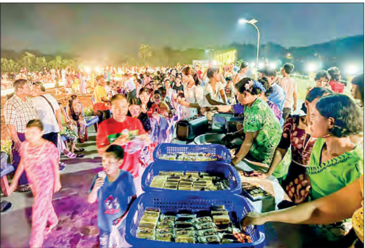
The oil lamp floating ceremony and charity feast on Thadingyut's full moon as seen in the previous year.

On religious holidays, the Taungwine Kandawgyi is usually packed with pilgrims, and in the morning and in the evening, it is one of the most popular attractions in Mawlamyine for walkers to enjoy a breeze.