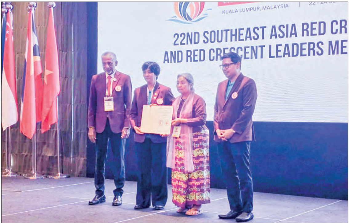
The Southeast Asia Red Cross Red Crescent Humanitarian Forum and the 22 nd RCRC Southeast Asia Leaders Meeting in progress. Kuala Lumpur Statement. RCRC Southeast Asia Leaders Meeting in 2026.