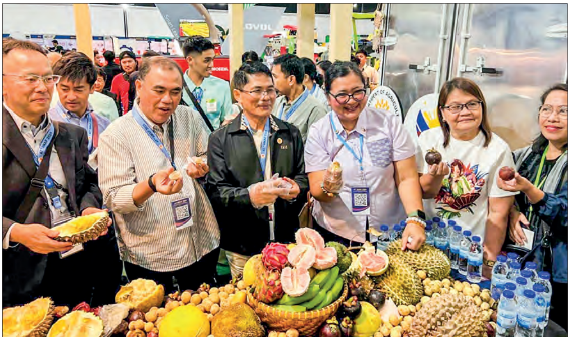
Delegates of ASEAN countries visit booths at the 30 th Agri-Link, 24 th Food-Link, and 19 th Aqua-Link exhibitions in Metro Manila, the Philippines on 3 October.