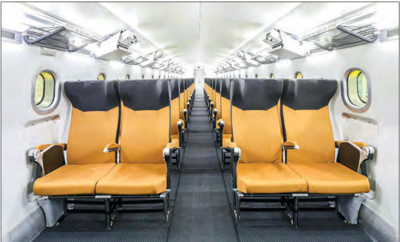
Photo shows the interior of the M10, a new maglev train test car of the Linear Chuo Shinkansen.

Non-reclining seats have been installed on the M10, a new test car