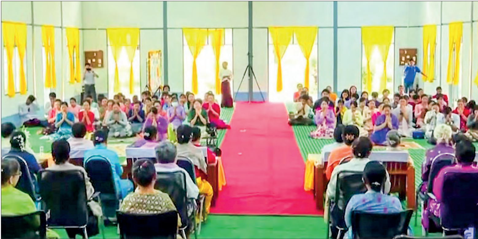
Marking World Teacher Day, the Thingangyun Education Degree College in Yangon organized the 20 th paying respects ceremony to the senior teachers on 5 October 2023.

In Myanmar society, respected individuals are those who uphold discipline, morality, and justice. Through their words, behaviour, and actions, they help maintain a dignified, peaceful, and just social order. Because of these honourable individuals, the community can live with a sense of security and trust. By showing respect to them, social hierarchies are properly maintained, and people who value dignity emerge, allowing moral principles to flourish. Therefore, paying reverence to those of high honour