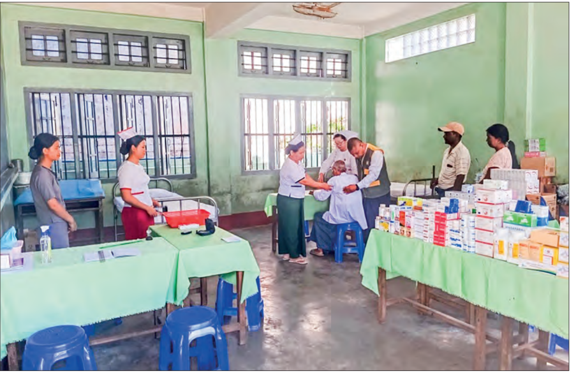
Health stuff pay treatments to resident of Kyaukme at the temporary people’s hospital in Kyaukme yesterday.

TATMADAW conducted a counter-terrorism operation to ensure peaceful living, successfully regained full control of Kyaukme Township in Shan State (North), and is working closely with residents to restore government administration, rebuild the town, and provide health care services. The Ministry of Health is working to restore health care coverage in Kyaukme Township, with health workers returning on 3 October to carry out these activities. While the 150-bed Kyaukme General Hospital, damaged by terrorist sabotage, is being renovated, a temporary hospital is operated at Labha Muni Chinese Temple in Ward 2, Kyaukme, to provide medical services to the local population. The facility is staffed by seven health workers, led by Dr Tun Nyunt Oo, Head of the Shan State (North) Department of Public Health and Medical Services, and Dr Myo Aung, Deputy Head of the District Medical Services Department. Today, a total of 55 patients — 22 men and 33 women — received health care services. The Ministry of Health is working to establish a mobile operating theatre for emergency surgeries at the temporary hospital and to provide necessary medicines, medical equipment, doctors, and health workers to deliver more effective health care services to the people of Kyaukme Township and the surrounding population. — MNA/GNLM