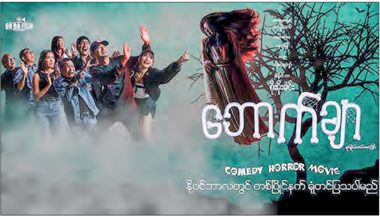
This photo features a poster of Myanmar movie “Voucher”.