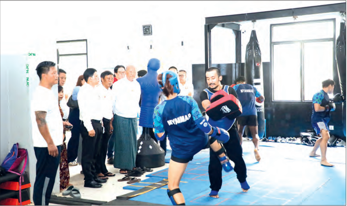
Union Minister, Myanmar Olympic Committee Chairman Jeng Phang Naw Taung observes the training of selected athletes in the Muay and Kickboxing events for the 33 rd SEA Games at Theinbyu Gymnasium.

The Union Minister also visited tentatively selected athletes currently training in Yangon for the 33 rd Southeast Asian Games,