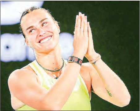
Aryna Sabalenka at the Australian Open earlier this year.

A successful title defence in Wuhan would help Sabalenka maintain her lead over her Polish rival but it will not be easy, with Anna Kalinskaya or Rebecca Sramkova looming as possible first opponents for the top seed. — AFP