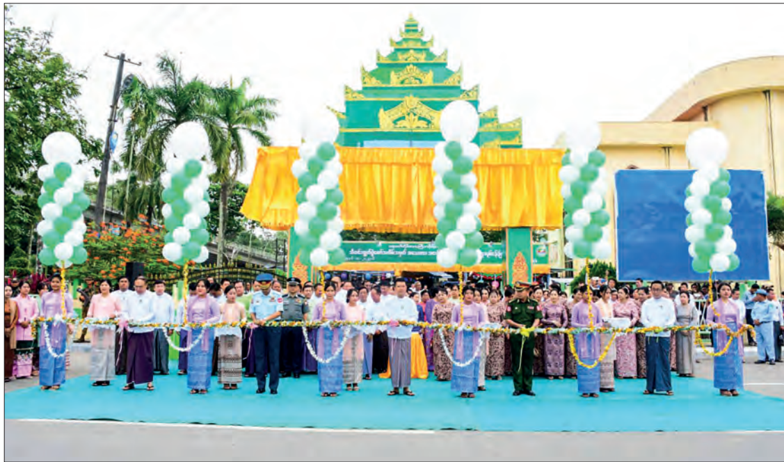
The opening ceremony of the Thadingyut MSMEs Expo and market fair in progress in Pathein Township, Ayeyawady Region on 4 October 2025.

Then, the Chief Minister and his team viewed Drum Seeders manufactured by Nilar Fiberglass enterprise, Shwemyintmo Industrial enterprise, the agricultural machinery produced by Hteiktan Industry and De Ayeya Industrial Association, MSMEs products displayed by 26 townships from eight districts. The Chief Minister emphasized the officials to promote the production of local products based on agriculture and livestock by districts and townships, to export food products not only to