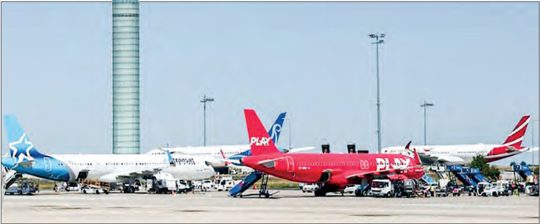
French air traffic controllers have demanded better pay and conditions.

the SNCTA said that it had "made progress on internal issues" and held "calm discussions with all parties involved," without providing further details. "No new strike notice date is planned," the union said. French air traffic controllers had initially planned to stage a strike in September and had later pushed it back to October. — AFP