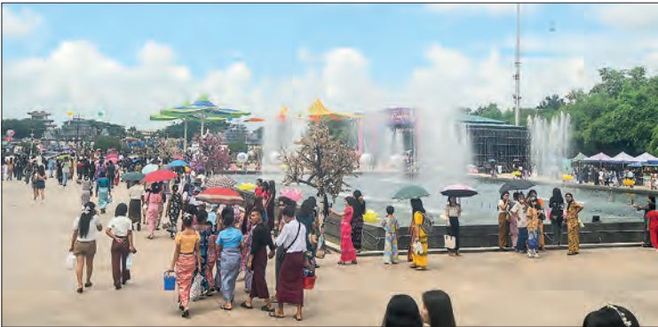
People’s Square in Dagon Township hosting the 2025 Yangon Region Thadingyut Festival Fair is packed with visitors on 5 October.

The festival features more than 620 booths operated by industrial zones, MSME entrepreneurs, the Department of Small-Scale Industries, the Department of Cooperative, the Yangon Region Investment Committee, the Union of Myanmar Federation of Chambers of Commerce and Industry (UMFCCD), the Myanmar