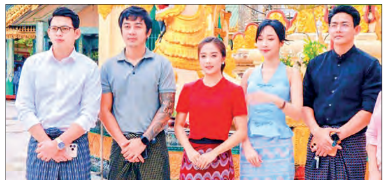
Artistes of the new romantic drama "Disappeared Days" seen at the shooting event.

The cast includes Academy Ye Aung and Academy May Than Nu, as well as Thatti, Moe Yan Zun, and many others. — ASH/MKKS