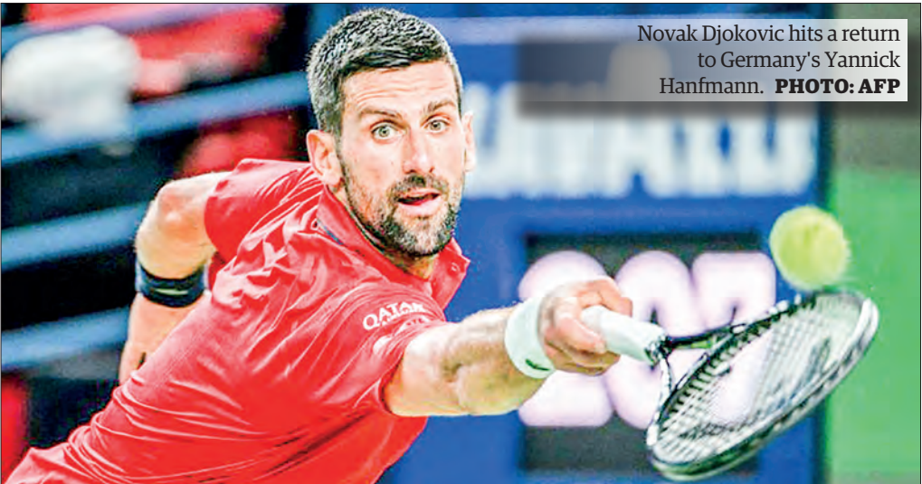
Novak Djokovic hits a return to Germany's Yannick Hanfmann.

looking to win a record-extending fifth title in Shanghai but was given a mighty scare by the 150 th -ranked German.