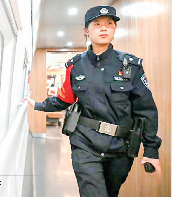
A police officer patrols a carriage on the bullet train on 24 January 2025.

In recent years, following the directions of the MPS, police departments across China have maintained high pressure on unlawful activities that infringe upon intellectual property and produce and sell counterfeit goods, the ministry added. — Xinhua