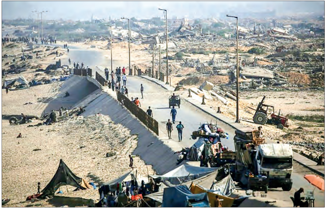
Vast swathes of the Palestinian territory have been turned to rubble.

Israeli Prime Minister Benjamin Netanyahu expressed hope for announcing the release of all Gaza hostages “in the coming days”.