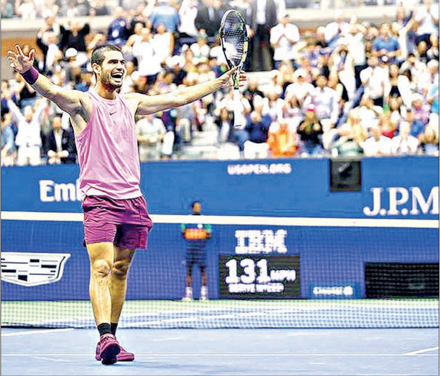
Carlos Alcaraz of Spain celebrates winning the men's singles final against Jannik Sinner of Italy at the 2025 US Open in New York on 7 September 2025.

"I want to start with Jannik. It is unbelievable what you have done this season," Alcaraz said on the trophy ceremony. "I see you more than my family, and it's great to share the court and the locker room with you. You improve every day working with your team, so congratulations to you, and it was a great performance this whole tournament." "I tried my best today. I couldn't do more," the 24-year-old Italian replied. "You are doing an amazing job. I know there's a lot of hard work behind this performance today, you were better than me. Enjoy it. It's a great moment." — Xinhua