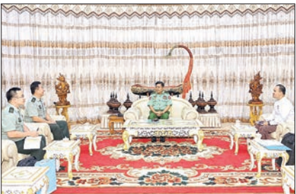
Union Defence Minister receives Chinese military attaché to Myanmar