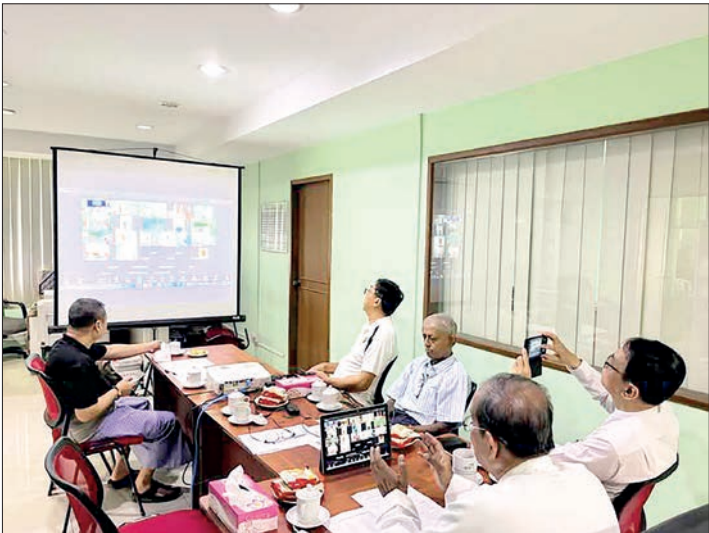
This photo reveals the Myanmar Fruit, Flower and Vegetable Producer and Exporter Association holding a Zoom meeting.

Under the leadership of the MFVP, the Myanmar Durian Growers and Exporters Association (Taninthayi Region) was formed, and similar organizations have been