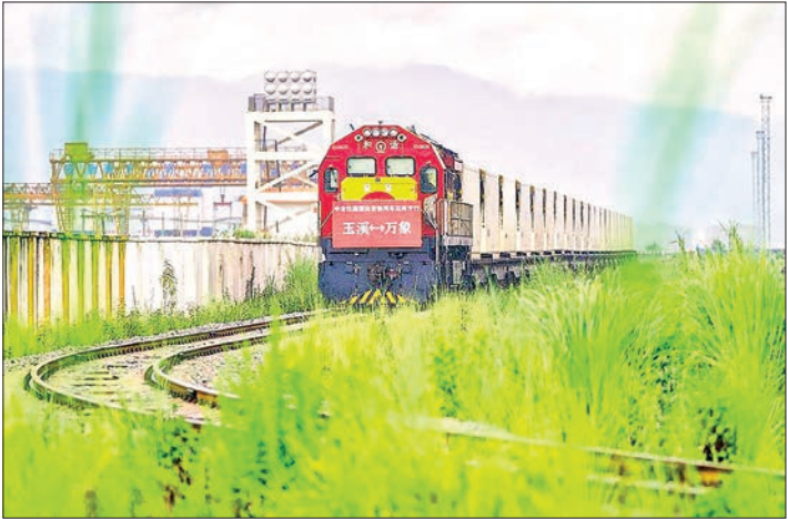
An international freight train bound for Lao capital Vientiane pulls out of Yanhe Station of China-Laos Railway in Yuxi City, southwest China’s Yunnan Province, 23 August 2025.

“Through the China-Laos Railway’s Lancang-Mekong Express, goods can be deliv-