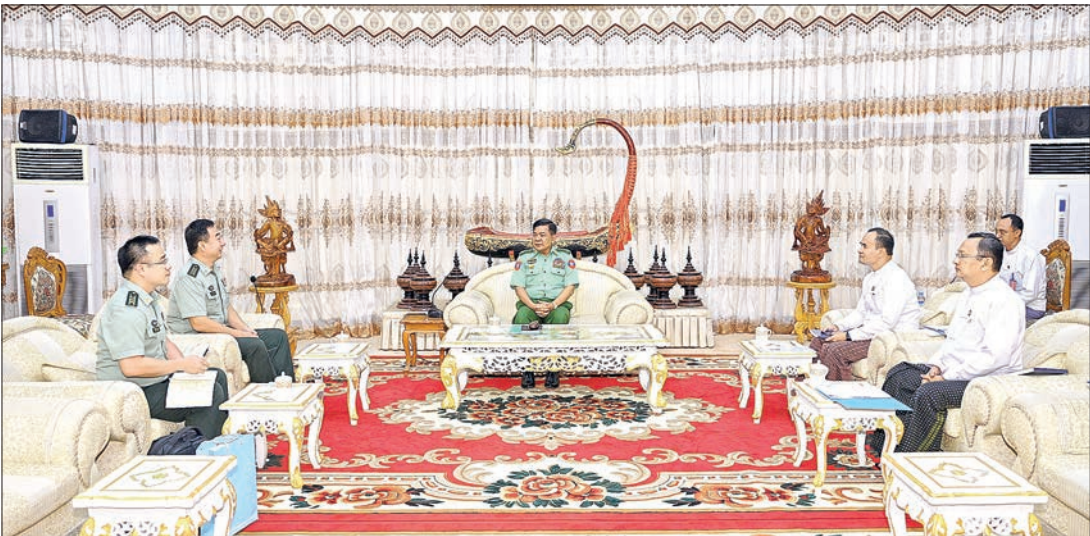
Senior Colonel Qu Zhe, Military Attaché of the People's Republic of China to Myanmar, pays a courtesy call on Union Minister General Maung Maung Aye yesterday.

Officials from the Ministry of Defence also attended the meeting together with the Union minister. — MNA/ MKKS