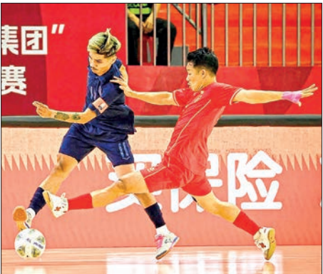
Myanmar and Cambodia in action during their Group B match. PHOTO: CAF

The semifinals, set for 9 August, will see Myanmar face Denmark. — Shine Htet Zaw/KZL