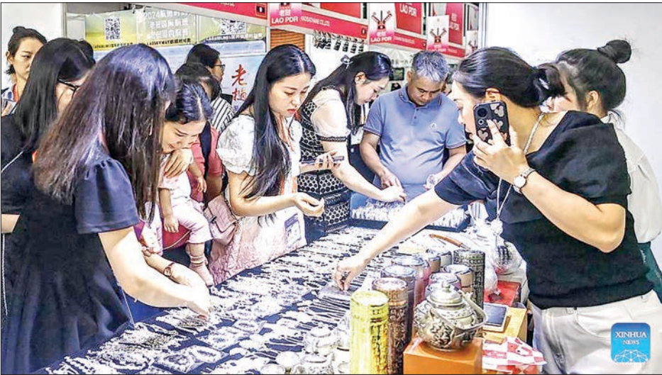
Visitors select products during the 21st China-ASEAN Expo at Nanning International Convention and Exhibition Centre in Nanning, south China’s Guangxi Zhuang Autonomous Region, 24 September 2024.

CHINA has remained the largest trading partner of the Association of South-east Asian Nations (ASEAN) for 16 consecutive