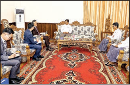
MoFA Union Minister receives Thai Ambassador

Yangon palm oil reference price set at K6,520 per viss