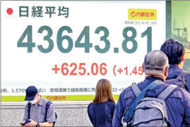
A financial board in Tokyo shows the 225-issue Nikkei Stock Average closing at 43,643.81 on 8 September 2025.

At 5 pm, the dollar fetched 147.52-53 yen compared with 147.36-46 yen in New York and 148.21-23 yen in Tokyo at 5 pm Friday. — Kyodo