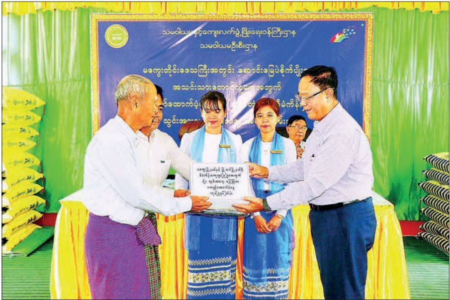
K54.6 million worth of fertilizer subsidy provided to three project villages in Magway and Myothit townships.

After the harvest, farmers will be required to repay the cost of the distributed inputs, together with loans from the Myanmar Agricultural Development Bank, cooperative loans, and Myasein-yaung loans.