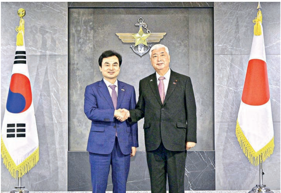
Japanese Defence Minister Gen Nakatani (R) and South Korean Defence Minister Ahn Gyu Back shake hands ahead of their meeting in Seoul on 8 September 2025.

JAPANESE Defence Minister Gen Nakatani and his South Korean counterpart Ahn Gyu Back agreed Monday in Seoul to reinvigorate reciprocal visits and regular meetings, as the two neighbours pursue stable ties regardless of changes in their governments and in the face of North Korea’s nuclear and missile threats. Nakatani, the first Japanese defence minister to visit South Korea in a decade, also affirmed with Ahn the importance of bilateral security cooperation as well as trilateral cooperation with the United States. “The ministers concurred that it is important to steadily advance Korea-Japan and Korea-US-Japan defence cooperation in the rapidly changing security environment, and shared the need to develop bilateral defence ties in a future-oriented manner,” the two ministers said in a joint press release. In particular, the two countries will explore the potential for “mutually beneficial and forward-looking cooperation in advanced science and technology fields such as artificial intelligence, unmanned