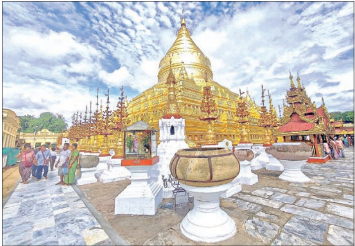
This photo shows pilgrims at the Shwezigon Pagoda in NyaungU on 7 September 2025.

VISITOR arrivals have mounted recently in Popa and Bagan, according to residents. An influx of people has now flocked to Popa to enjoy the famous ritual ceremony, “Aba Htwet Pwe”, marking the day Boe Min Gaung died, and they’ve also visited Bagan. “The arrival of visitors to Bagan is usually low in the monsoon, but there is a slight increase on public holidays and weekends. Recently, there