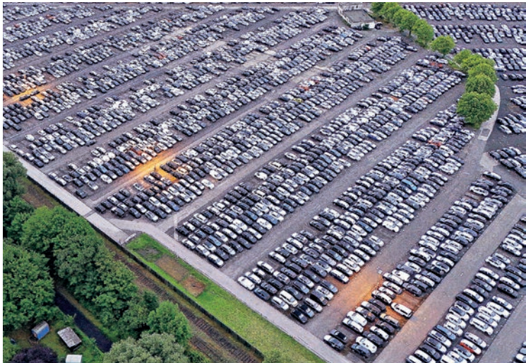
An aerial view taken on 4 August 2025 in Essen, western Germany, shows cars of various brands that are parked ready for sale and export at a car logistics terminal. Europe’s auto industry is relieved that the EU-US trade deal reduces short-term uncertainty but many, particularly in the struggling German sector, remain deeply worried about the long-term impact.

The trade surplus narrowed to 14.7 billion euros. — AFP