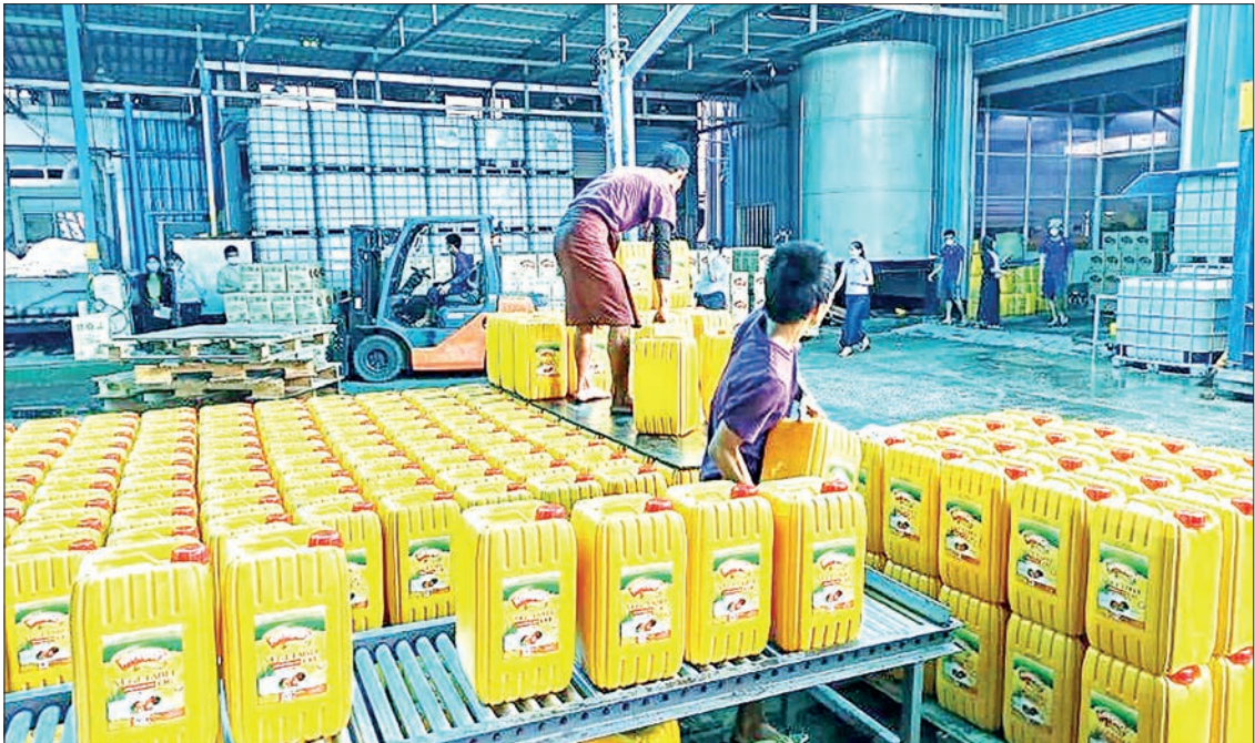
Workers seen organizing jerrycans of cooking oil for distribution and sale.

THE wholesale reference rate of palm oil set for the Yangon market slightly increased to K6,520 per viss for the week ending 14 September, up from K6,410 registered in the previous week, according to the Supervisory Committee on Edible Oil Import and Distribution. The Supervisory Committee on Edible Oil Import and Distribution under the Ministry of Commerce has been closely observing the FOB prices in Malaysia and Indonesia, adding transport costs, tariffs and banking services to decide the wholesale market reference rate for edible oil weekly. Despite the reference price, the market price is way too high. To control overcharging, the Consumer Affairs Department under the Ministry of Commerce informed consumers of