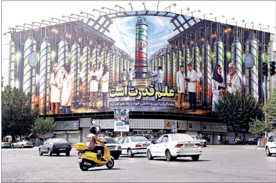
Iranians drive next to a billboard displaying pictures of nuclear scientists, centrifuges and a sentence reading in Farsi: “ Science is the power”, at the Enqelab square in Tehran, on 29 August 2025.

IRAN will accept limits on its nuclear programme and restrictions to uranium enrichment if international sanctions are lifted, its foreign minister said in a piece in The Guardian on Sunday. Iran “is ready to forge a realistic and lasting bargain that entails ironclad