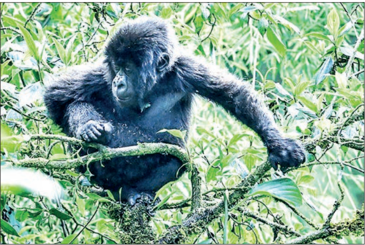
Around half of the babies will fall victims to vicious inter-family fights, experts say.

AUSTRALIA has halted logging on 176,000 hectares of forest along New South Wales' north coast to establish the Great Koala National Park, aiming to protect koalas from extinction. The ban affects six timber mills and about 300 workers, with the government pledging financial support, training, and services to those impacted. Koala populations in New South Wales have drastically declined due to deforestation, drought, and bushfires, risking extinction by 2050 without intervention. — AFP