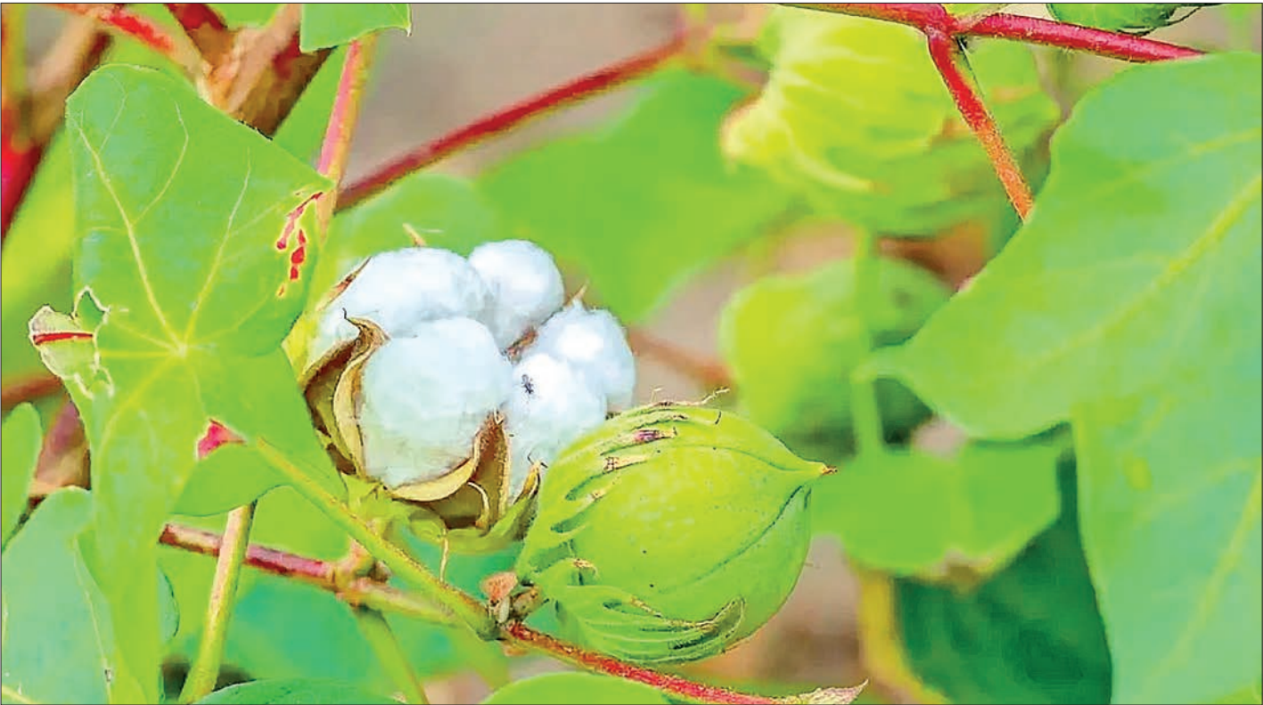
A close-up view of white cotton bulbs, they bloom across the cotton field.

ARMED groups, including those identified as PDFs, were invited in the interests of the Union to return to the legal fold, with the expectation of building a Union based on democracy and federalism. Understanding the State’s genuine goodwill, members of armed groups, including PDFs, who returned to the legal fold, have been handed back to their parents. For the voter list errors in the 2020 general election, requests to address the following were rejected. However, an attempt made to convene the Hluttaw based on the disputed election results was an attempt SEE PAGE 3