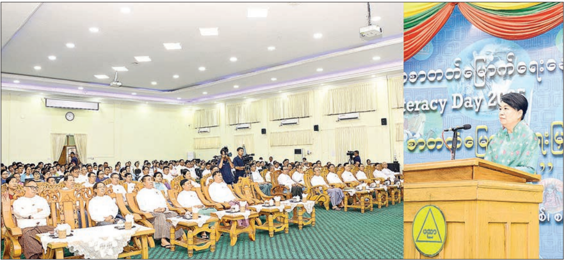
The 2025 International Literacy Day underway in Nay Pyi Taw yesterday, addressed by Union Education Minister Dr Chaw Chaw Sein.

Following this, Dr Chaw Chaw Sein, Union Minister for Education and Chair of the organizing committee for the International Literacy Day ceremony, explained that the day had been officially designated as International Literacy Day on 8 September through a resolution adopted at the World Literacy Congress, held under