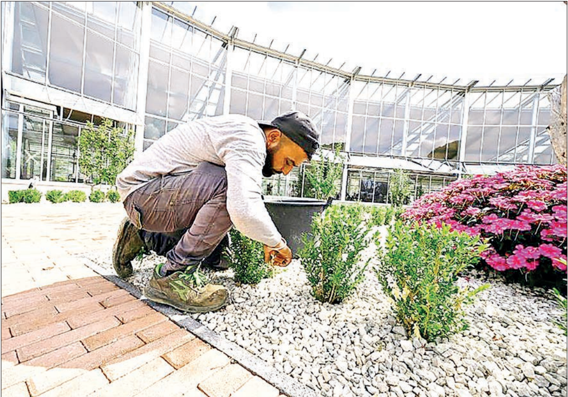
The centre was launched by Pope Leo's predecessor, Francis, in 2023.

POPE Leo XIV inaugurated a new training centre devoted to sustainability on the outskirts of Rome on Friday, following in his predecessor Francis's efforts to champion the environment. The Vatican-run centre, located in the papal residence next to Lake Albano southeast of Rome, boasts farming land, a nursery, vineyards, olive groves, a solar-panelled greenhouse and over 300 types of plants stretched over 55 hectares (136 acres). The late Pope Francis launched the project in 2023, offering courses to vulnerable groups such as refugees, migrants, people with disabilities, former prisoners, victims of domestic abuse and unemployed people. Christened 'Borgo Laudato Si' ('Praise Be to You Village') after an eponymous papal letter written by Francis, the centre links caring for the environment with social justice issues. Pope Leo toured the centre on Friday, feeding fish and other animals along the way before presiding over a liturgical celebration. — AFP