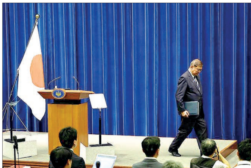
Japanese Prime Minister Shigeru Ishiba leaves after a press conference at the prime minister’s office in Tokyo, Japan, 7 September 2025.

WITH Japanese Prime Minister Shigeru Ishiba stepping down, Japan’s ruling Liberal Democratic Party (LDP) is bracing for a heated leadership contest as major contenders signal their intention to run.