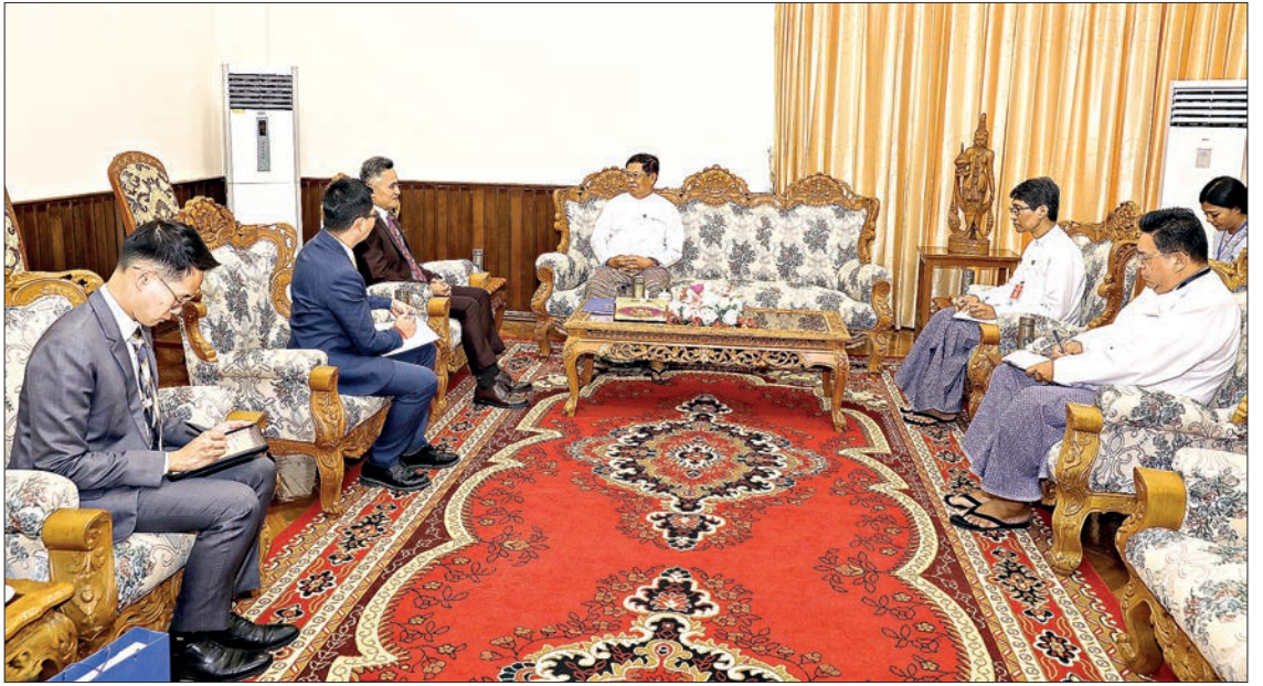
Thai Ambassador Mr Mongkol Visitsump calls on Union Minister U Than Swe yesterday.

ment of the existing friendly relations and bilateral partnership, and expansion of mutually beneficial cooperation, especially in the areas of trade and investment and facilitation of border trade between the two countries. Also present at the meeting were senior officials of the Ministry of Foreign Affairs. — MNA