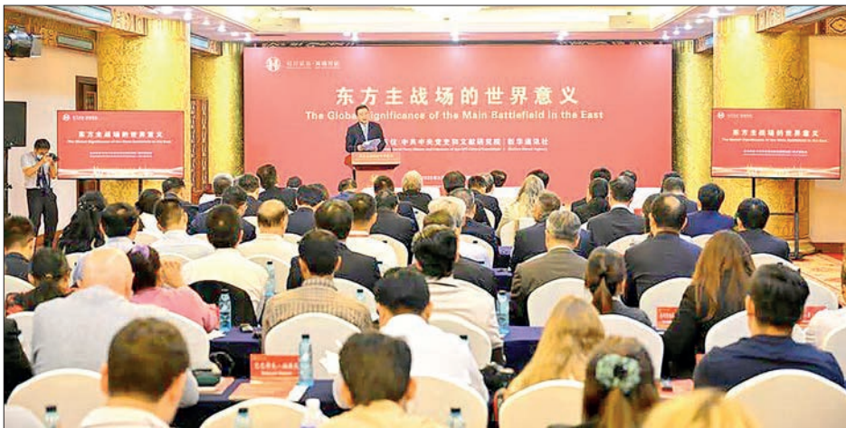
Report on Eastern Front of World War II launched in Beijing on 5 September 2025.

XINHUA News Agency and academic researchers released a report on the Eastern Front of the Second World War in Beijing on 5 September, under the theme of remembering history and upholding justice.