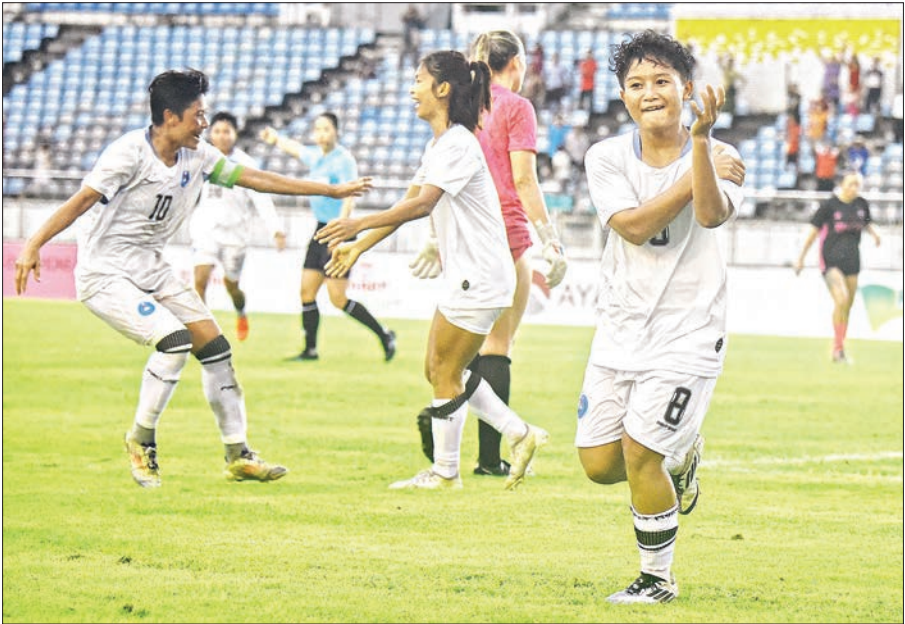
The photo shows the Myanmar women's club ISPE competing in the final round of the 2025-2026 AFC Women's Champions League.