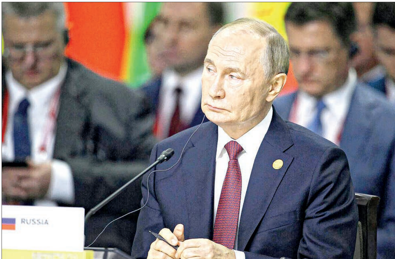
President of Russia Vladimir Putin during an expanded meeting of BRICS leaders during the 16 th BRICS summit in Kazan.