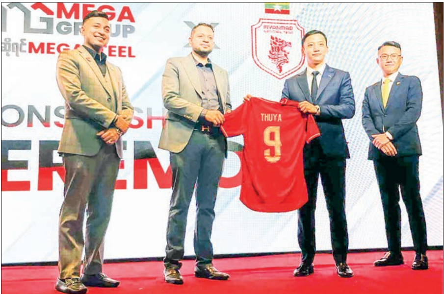
MFF and Mega Group of Companies sign sponsorship agreement in Yangon. ed in 2001, is a Myanmar-based manufacturer and distributor of steel and other construction materials.