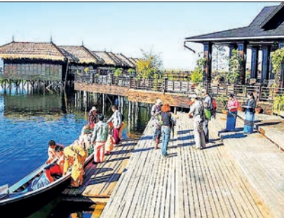
MTEA to sign MoU with Dehong Economic Association