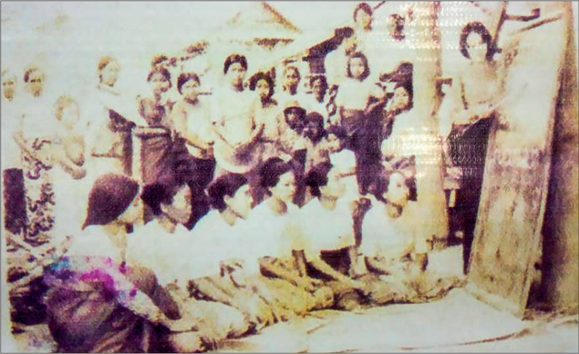
A file photo shows rural people are learning literacy course in Myanmar's 3-Rs movement at a village.

(now Nyaungkaing Village) in Meiktila Township, Mandalay Region, in collaboration with rural people. Such a plan was successful. Based on this experience, a community-driven approach was implemented without spending the government's budget, where teaching was conducted directly in the villages. By 1971, literacy was achieved throughout Meiktila District.