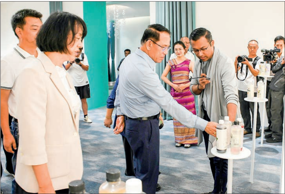
Union Minister U Maung Maung Ohn observes the displays at a traditional medicine manufacturing factory of Yunnan Yuanfang Biopharmaceutical Co Ltd yesterday.

Then, they visited a village in Yunnan Province, where officials provided infor-