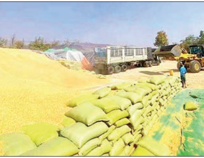
MyanTrade to seek new markets, boost maize exports via PPP