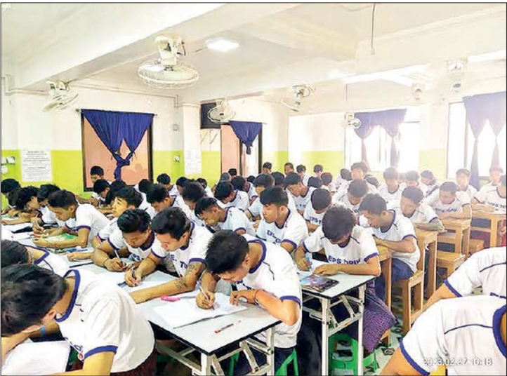
This image shows EPS-TOPIK candidates.

THERE are over 5,800 eligible applicants for Special EPS-TOPIK 2025, said the Government’s Public Overseas Employment Agency (POEA). The Ubiquitous Based Test (UBT) is designed for Myanmar workers who have officially worked in the Republic of Korea for at least three years under an employment contract and returned after 1 January 2010. Their test results determine eligibility to return to work in Korea. It has been scheduled for October, said the POEA under the Department of Labour.