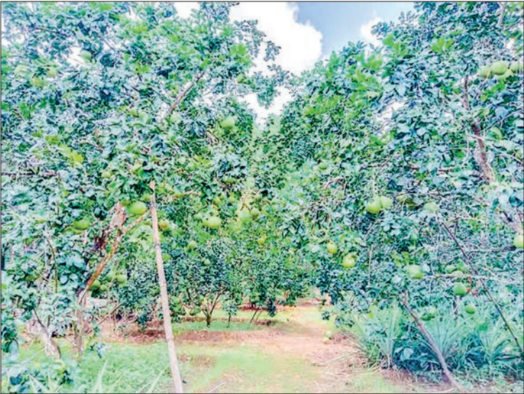
Sun Thit Tun pomelo farm which provides free pomelo buffet for social and rescue workers.

eternally our locally-grown pomelos for social and rescue associations because we want to help them feel fresh and relaxed during their journey, and this is like a good deed while doing our business," it said. The pomelo farm is located at Ingabo village in Kyaik-to Township on Yangon-Mawlamyine Road. Social and rescue workers can come to enjoy pomelo free there anytime. — MT/ZS