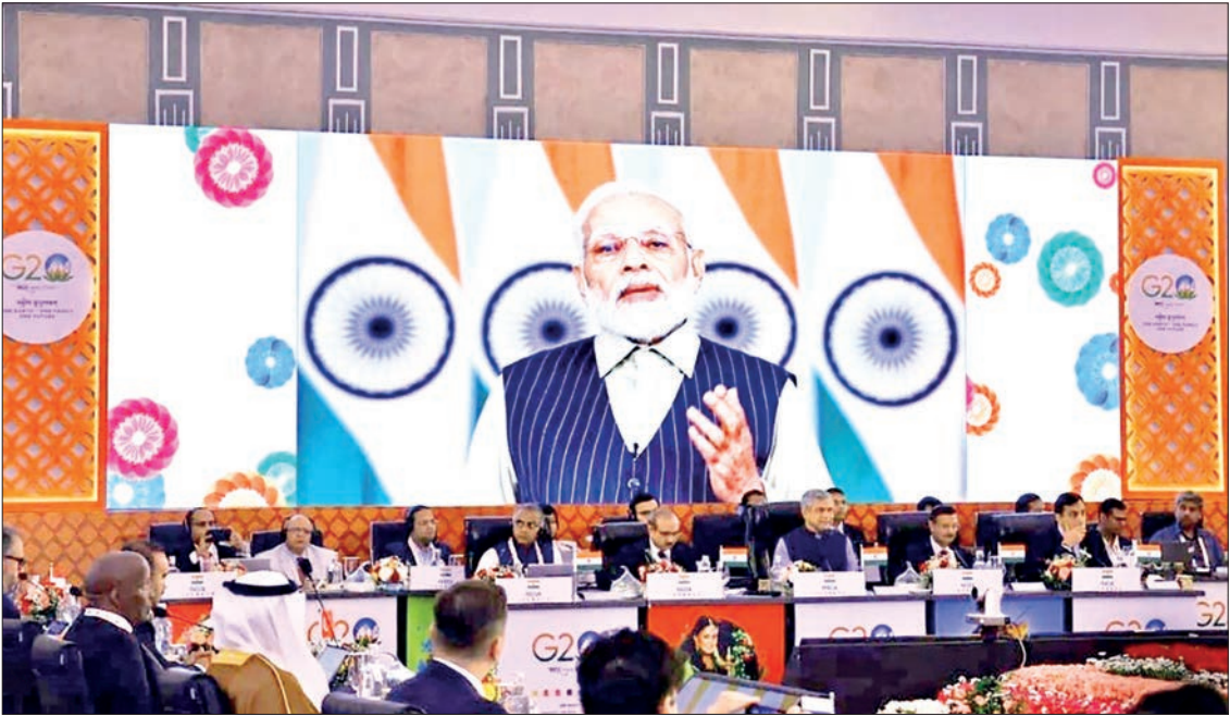
On 19 August 2023, Prime Minister Narendra Modi addressed the G20 Digital Economy Ministers’ Meet held in Bengaluru via video message.

“Today India’s digital economy is growing 3-4 times faster than the traditional economy, and