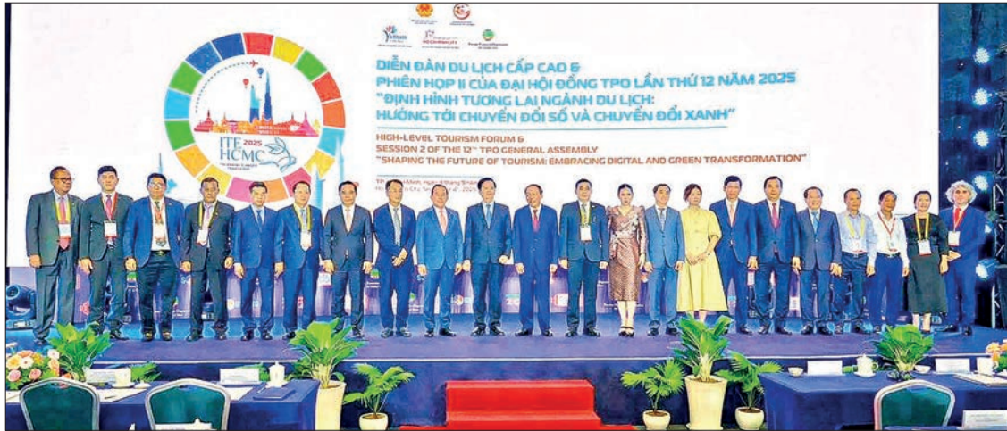
Attendees of Tourism Promotion Organization (TPO) General Assembly High-Level Tourism Forum pose for documentary group photo in Ho Chi Minh City, Vietnam.