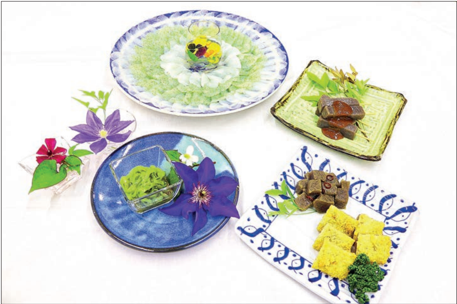
Several konnyaku dishes are pictured in May 2025 in Shimonita, Gunma Prefecture.

A recent survey in two major export markets of Japan’s konnyaku showed the low-calorie foodstuff made from a type of yam is well received, prompting the Japan Konjac Association to express hopes to boost exports further amid growing health consciousness among consumers. According to the online survey released by the association, of those who have eaten konnyaku before, 86.4 per cent of respondents in the West Coast in the United States and 64.4 per cent in France said they either “liked” or “somewhat liked” it.