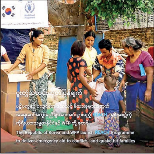
This photo features some activities of the project to provide food assistance to people in earthquake- and conflict-affected areas.

The Republic of Korea has provided US$10 million to the fund for the REACH programme, which will deliver two months of food rations or cash assistance through mobile money and vouchers to around 300,000 people in conflict- and earthquake-affected areas. — ASH/TH