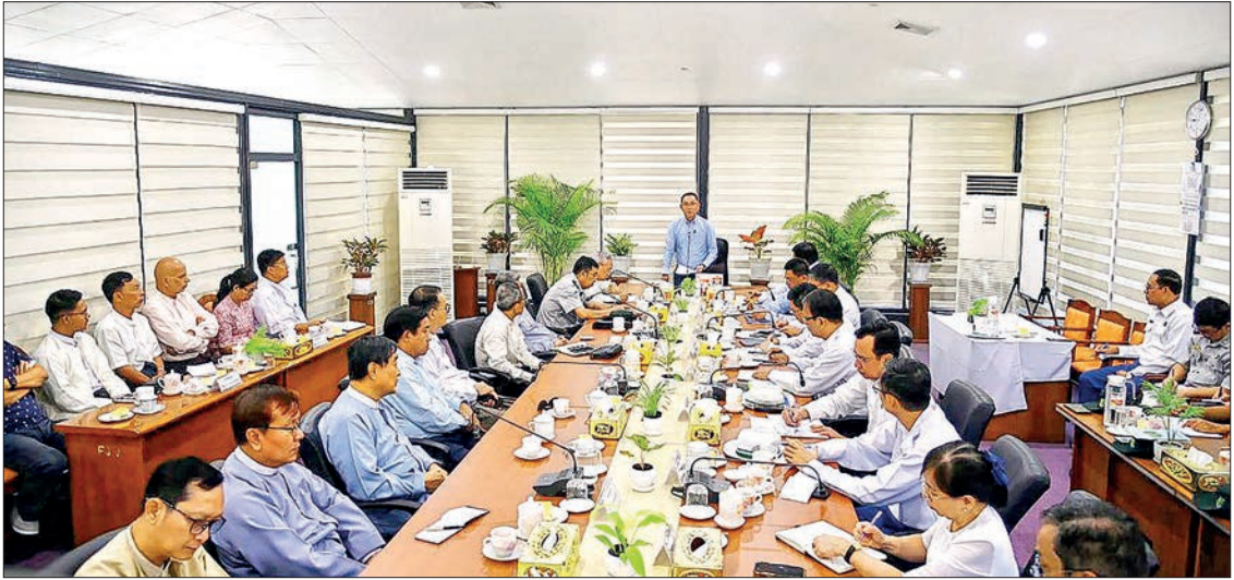
The Union minister meets officials from the Forest Department, the Myanma Timber Enterprise and entrepreneurs for the MSME development in the bamboo industry.

Enterprise and entrepreneurs held at the ministry office in Botahtaung Township in Yangon on 5 September. The Union minister emphasized that the use of technology to increase the production and export of finished products will provide more employment opportunities and contribute to the country's economic development. While the private sector