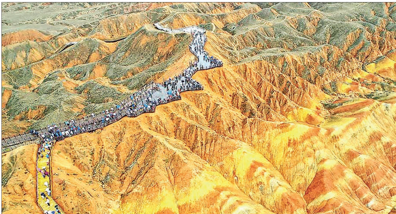
An aerial drone photo taken on 22 June 2025 shows tourists enjoying the scenery of Danxia landform in the rain at the Danxia National Geological Park in Zhangye, northwest China's Gansu Province.

A tourism promotion event highlighting the Hexi Corridor, a key artery of the ancient Silk Road, was held in Shanghai on Friday, attracting diplomats, entrepreneurs and representatives from international organizations to explore the corridor's millennia-old history and discuss opportunities for cooperation.