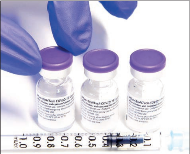
Swiss exports include gold and other precious metals, pharmaceutical products like vaccines and packaged medicines, and high-quality watches.

“I held constructive meetings in Washington with Secretary of Commerce Howard Lutnick, Secretary of the Treasury Scott Bessent and Trade Representative Jamieson Greer,” Parmelin said on X, following his fresh trip. — AFP