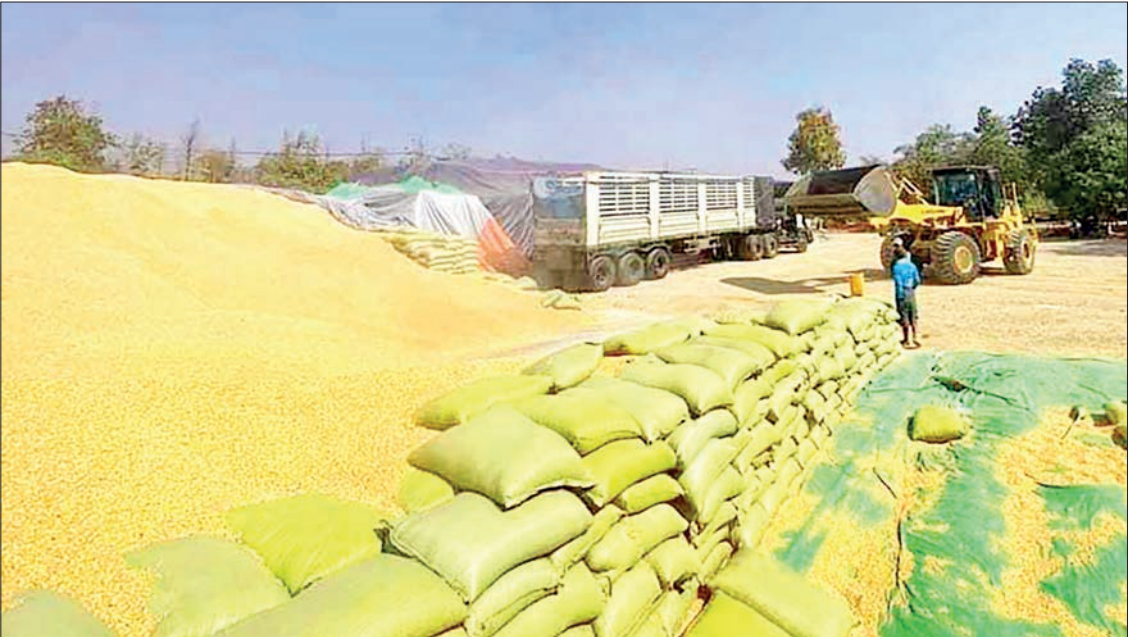
Piles of harvested maize are loaded onto a lorry for distribution and export.

fertilizer. Therefore, cornstarch production can substitute for imports. The director-general added that it is a potential item for exports beyond self-sufficiency. Myanmar's maize is required to meet the international quality standards and import regulations of target countries to expand its market reach. Myanmar Economic Attaches assigned in foreign countries will act as a bridge to analyze local consumption patterns and market demands, and connect Myanmar suppliers with foreign buyers. Myanmar will intensify Public-Private Partnerships in strengthening existing markets, such as the Philippines, Vietnam, Thailand, and China, and explore new potential markets, stated the director-general. — NN/KK