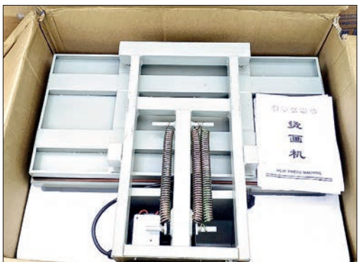
Confiscated illegal Non-Dairy Creamer, heat press machine and motorcycle across regions and states.

goods valued at K60.94 million without official documents at the Yadanabon bridge combined checkpoint, consumer goods valued at K25.605 million without official documents in Sagaing Township, an unregistered vehicle (estimated value of K60 million) at the jetty under the Yadanabon bridge and illegal teaks and hardwoods valued at K9.012 million in Toungoo and Nyaunglebin districts. The action was taken under the Export/Import Law, the Forest Law, and Customs procedures. Similarly, on 1 and 2 September, the on-duty teams nabbed two vehicles (estimated