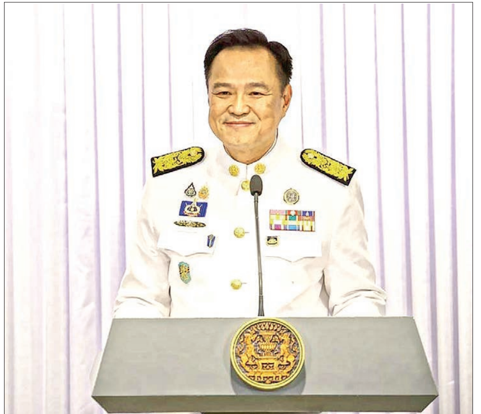
Thailand's new Prime Minister Anutin Charnvirakul gives a speech after receiving the royal endorsement for the post in Bangkok, Thailand, 7 September 2025.

Anutin said his administration would actively promote transparency and expedite legal proceedings where appropriate, emphasizing that the justice system must operate independently, in accordance with mechanisms outlined in the constitution and relevant laws. — Xinhua