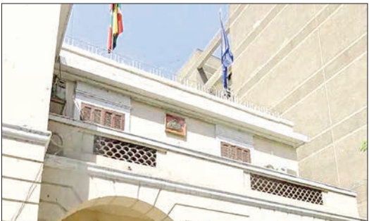
The Embassy of Myanmar in Cairo.

MYANMAR citizens who are in Egypt on a tourist visa or permit of residence should inform the Egyptian Immigration Department before leaving the country and acquire exit visas, the Myanmar Embassy in Cairo announced. The exit visa is a requirement because Egypt’s tourist visa/residence permit is for single entry only, it added. Therefore, if Myanmar nationals in Egypt wish to leave for a third country temporarily, they need to inform the respective immigration authorities to obtain exit visas, it said. If a person leaves Egypt without an exit visa and tries to re-enter, he/she may face difficulties such as being denied entry to Egypt at the airport