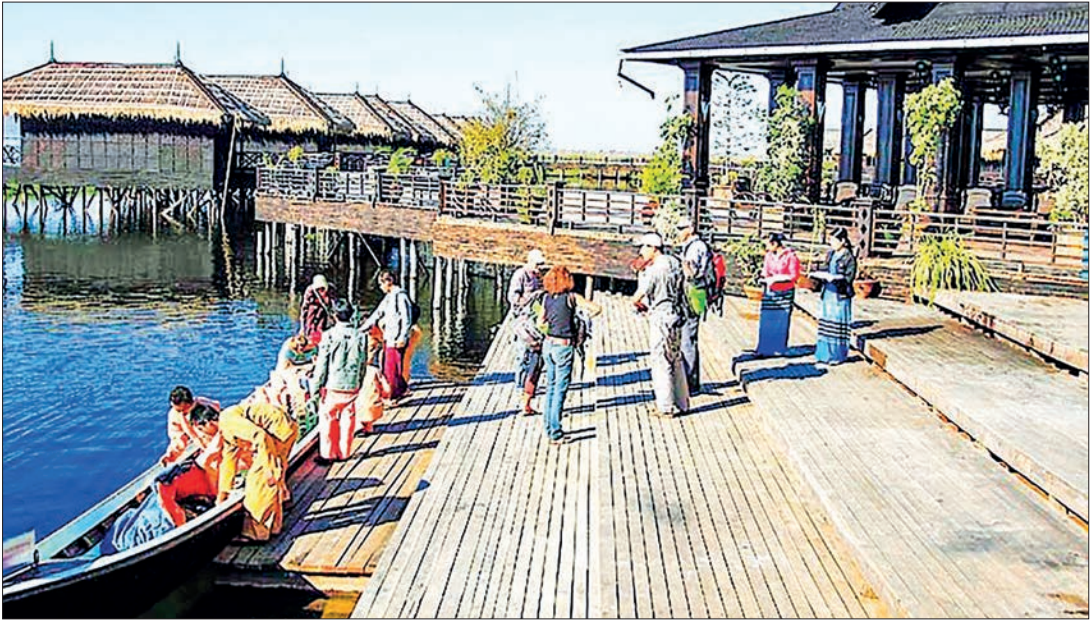
International tourists were travelling in Inlay region last year.