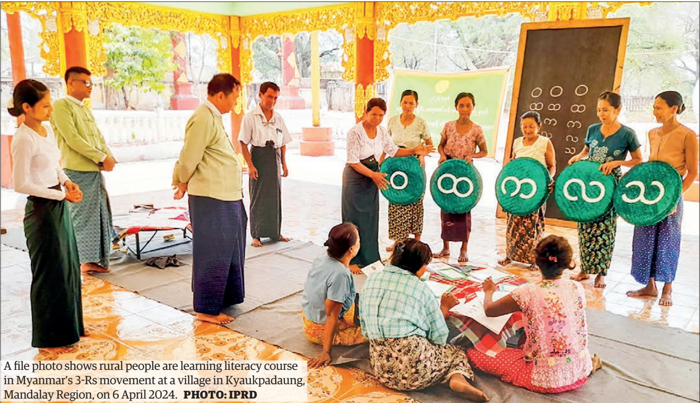
A file photo shows rural people are learning literacy course in Myanmar’s 3-Rs movement at a village in Kyaukpadaung, Mandalay Region, on 6 April 2024.

The mutual cooperation and support between the villagers and the students from universities, colleges and institutes were inseparable as key factors contributing to the overall success of the 3-Rs literacy campaign.