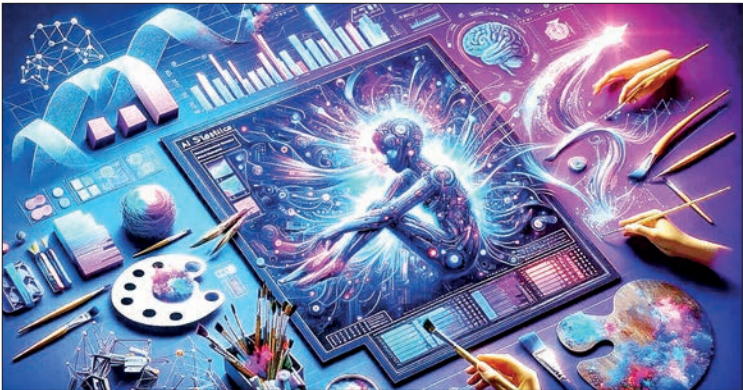
A sample illustration created with AI technology.

voting will be based on likes and reactions. The competition period will run from 24 to 30 September. Three cartoons receiving the most votes will be awarded prizes of K50,000, K30,000, and K20,000, respectively, along with e-certificates. To support participants who are new to AI tools or wish to learn more about the competition rules, RecyGlo Myanmar will also provide a one-day training session. — ASH/KZL