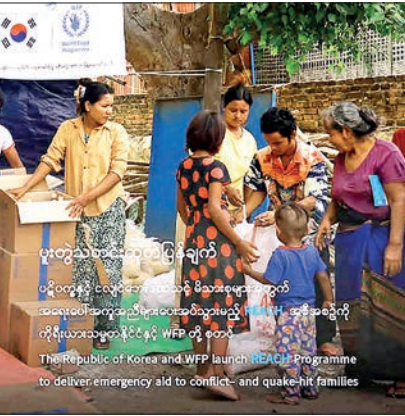
ROK, WFP launch aid for quake and conflict victims