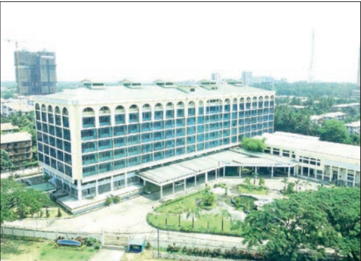
An aerial drone view of the Central Bank of Myanmar (CBM) in Yangon.

THE Central Bank of Myanmar (CBM) sold US$2.15 million to edible oil-importing companies and over $449,600 to fuel oil-importing companies on 5 September, in addition to an injection of 400,000 yuan into the market. CBM sold over $462,900 to CMP companies and those who made non-trade payments on that day. CBM sold over $2.3 million purchased from companies working on a Cut, Make and Pack basis, to edible oil-importing companies on 4 September. Furthermore, it sold over $248,800 to CMP companies and those who made non-trade payments on that day. CBM announced on 3 September that it would inject $30 million into fuel oil sector. Moreover, CBM sold over $1.8 million to edible oil-importing companies and over $32,755 to those who made non-trade payments on that day. CBM pumped over $1.075 million into the edible oil-importing companies on 2 September after sales of over $669,000 to CMP companies and those who made non-trade payments. CBM sold over $1.6 million to fuel oil-importing companies and over $128,000 to fuel oil-importing companies on 1 September through foreign reserve purchased from the companies working on a Cut, Make and Pack basis. Furthermore, CBM injected 800,000 yuan and 300,000 baht into the financial market. CBM also sold over $24,700 to the CMP companies