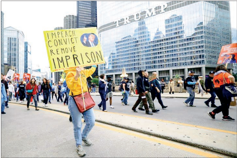
People hold anti-Trump signs as they march past Trump International Hotel & Tower in Chicago during a demonstration against the planned deployment of National Guard troops.

A fire broke out in Ukraine's government building in the capital following Russian drone attacks, authorities said on Sunday. According to preliminary information, the blaze was triggered after air defence downed a drone, Kyiv Mayor Vitali Klitschko wrote on Telegram. "For the first time, a government building, including its roof and upper floors, was damaged," said Prime Minister Yulia Svyrydenko on Telegram, adding, "Rescuers are extinguishing the fire." The State Service for Emergencies reported that at least two people were killed and 18 others wounded in the strikes. A nine-story apartment building in the Sviatoshynskiy district of Kyiv was partially destroyed in the attacks. — Xinhua