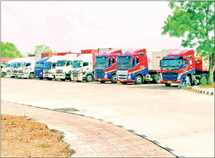
Trucks are seen stopped in Hpa-an.