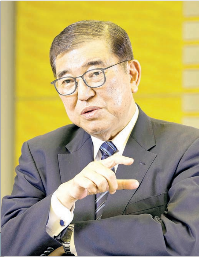
Japanese Prime Minister Shigeru Ishiba speaks at a press conference in Tokyo on 7 September 2025.

JAPANESE Prime Minister Shigeru Ishiba on Sunday expressed his intention to step down less than a year after taking the helm, in a surprise coming a day before his Liberal Democratic Party was supposed to decide whether to hold a snap presidential contest. On the back of recovering approval ratings for his Cabinet, Ishiba, once regarded as a reform-minded outsider within the LDP, tried to stay on as long as possible but apparently bowed to escalating pressure from party lawmakers. His departure, however, could herald political turmoil in Japan, as the LDP is likely to continue struggling to join hands with an opposition party to form a majority coalition in parliament due to policy divisions, even after Ishiba steps down, pundits say. Ishiba's announcement came after he held talks Saturday night with former Prime Minister Yoshihide Suga and farm minister Shinjiro Koizumi, both of whom are close to Ishiba. They are believed to have urged him to avoid a split in the LDP. — Kyodo