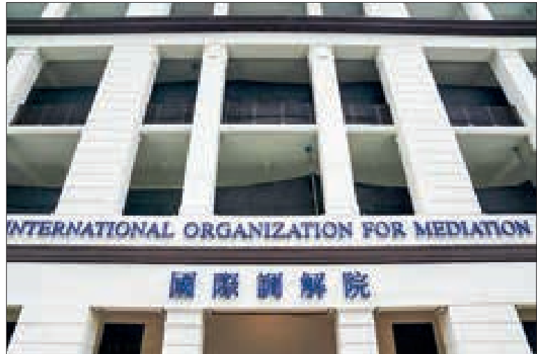
The building of the International Organization for Mediation Headquarters in China's Hong Kong SAR

(Honouring those responsible and all the volunteers involved in the prevention of dengue fever)