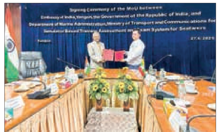
Document exchange marks India-Myanmar MoU signing.

The MoU aims to support Myanmar's efforts to provide competency-based training, assessment, and certification to its seafarers as per the STCW Convention. With the assistance of the Indian government, the collaboration will enhance the use of simulator facilities and improve the efficiency and quality of maritime examinations and certification processes in Myanmar. — MNA/KZL