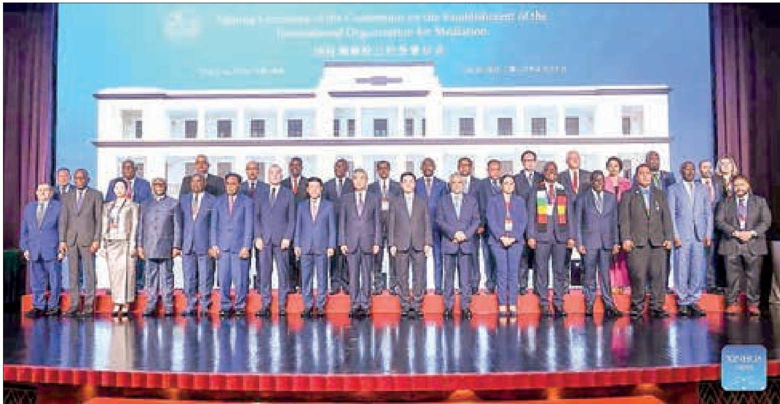
SIGNING CEREMONY OF THE IOMED/ XINHUA

High-level delegations from 85 countries across Asia, Africa, Latin America and Europe and