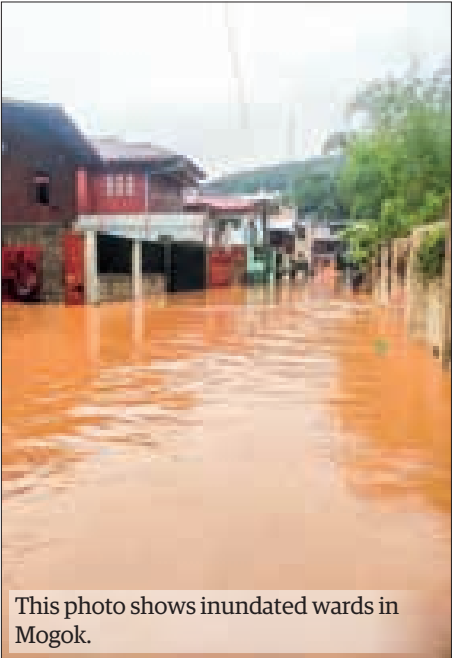
This photo shows inundated wards in Mogok.

STARTING from 26 June until 27 June morning, it has been raining heavily in Mandalay Region’s Mogok Township, resulting in a serious flood. “We had to turn back this morning because of the Myeni Creek landslides in Mogok. It is alleged that the blockage will continue for about the next three days. Those who are going to Mogok will need to do an enquiry, if not you will have to stay overnight on the road,” said a resident. Mintada, Sipinhaya, Dinshuchan, Zaythit and main streets in downtown wards, as well as Yeni Creek, have now been flooded. With riverbank erosion, some houses and roads have been damaged, said a resident. — Htun Htun/ZS