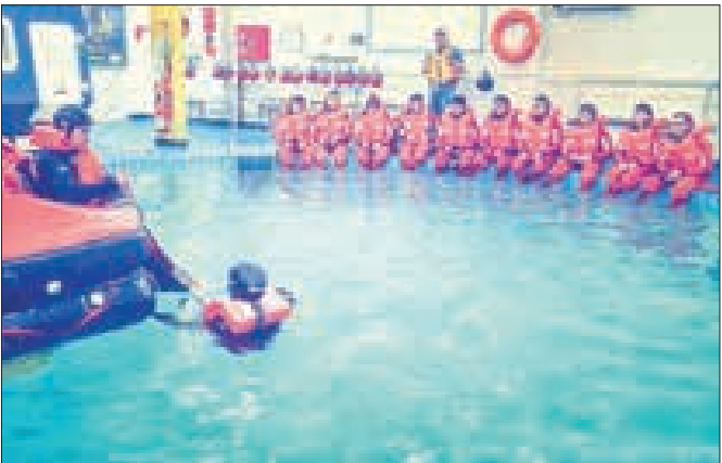
Seafarer trainees are seen attending both theoretical and practical training sessions. room course, and a spoken English course for cruise ship crew members.