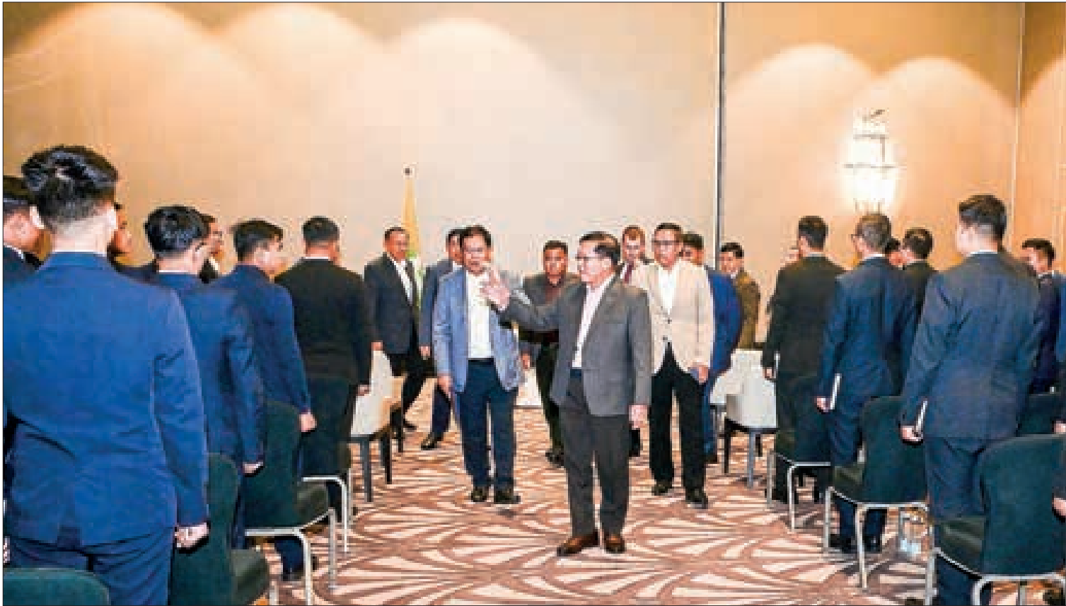
State Administration Council Chairman Prime Minister Senior General Min Aung Hlaing warmly greets officer trainees in Belarus yesterday.

are encouraged to value themselves and strive for the improvement of their own lives. By conducting themselves with discipline and diligence, they are expected to contribute to the honour and prestige of both Tatmadaw and the nation.