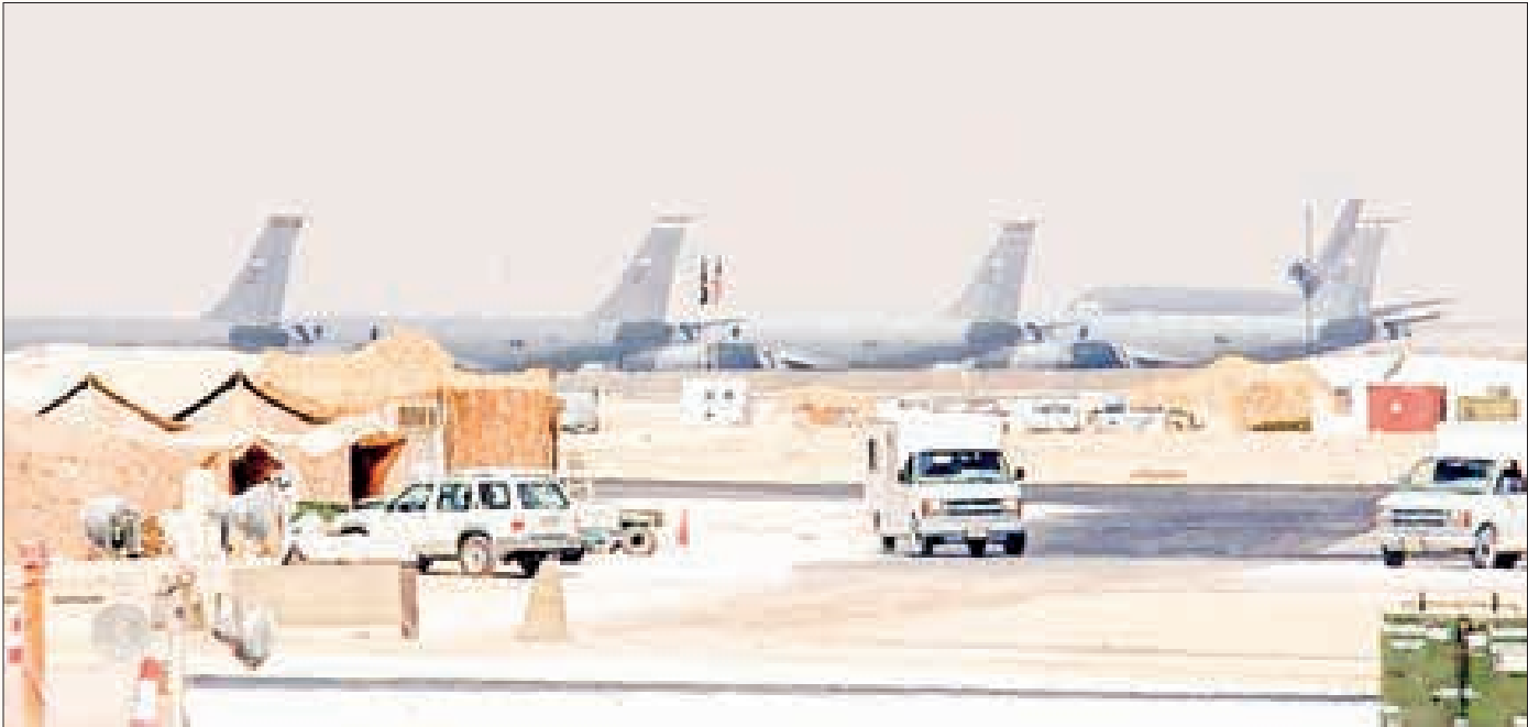
A general view of the Al-Udeid US military air base, south of Doha, on 23 October 2002

IRAN’S Supreme Leader Ayatollah Ali Khamenei claimed US President Donald Trump had “exaggerated” the effect of strikes on Iranian nuclear sites and threatened to target American military bases again, The Times of Israel reported. In a televised speech on Thursday, Khamenei said, “The American president exaggerated events in unusual ways, and it turned out that he needed this exaggeration.” Khamenei said the US “has gained nothing from this war”, adding that American strikes “did nothing significant” to Iranian nuclear facilities. He threatened, “Such an action can be repeated in the future, too” and mentioned that Iran has “access to key US centres in the region and can take action whenever it deems necessary”.