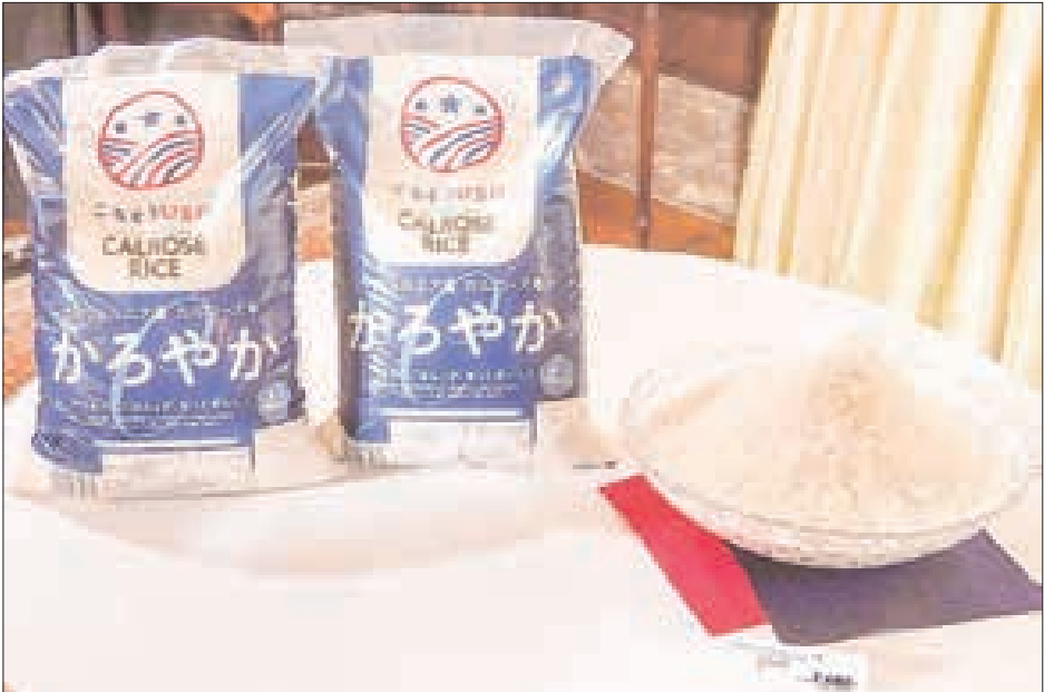
Photo taken on 13 May 2025 in Tokyo shows US-grown rice to be sold by Japanese supermarket operator Aeon Co. lease its stockpiles blamed for further inflating prices. Yasufumi Miwa, an expert on agriculture at the Japan Research Institute, noted that private imports may soon decline as the government has been selling stockpiled rice via direct contracts with retailers since late May, helping to ease prices. — Kyodo

PRIVATE sector imports of tariffed rice to Japan in May were 3.5 times the total volume brought in during all of fiscal 2024, revised government trade data showed Friday, as soaring prices of domestic rice have spurred demand for cheaper alternatives. According to the Finance Ministry's trade statistics, revised from a preliminary report issued earlier this month, 10,605 tonnes of tariffed rice were imported in May, a sharp increase from 115 tonnes in the same period last year. The United States, which accounted for 7,894 tonnes, followed by Chinese Taipei, Thailand, and Vietnam. Prices of domestic rice have continued to surge due in part to a supply shortage, with an auction system initially employed by the government to re-