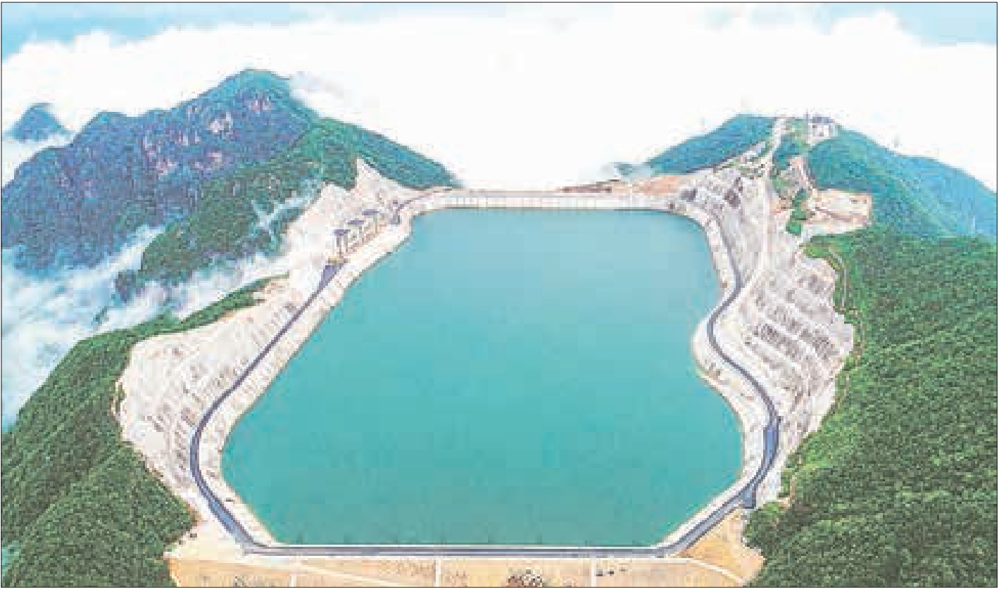
A bird's-eye view of a reservoir at a pumped-storage hydroelectric station in Huzhou, Zhejiang province.

The new standards aim to fill existing gaps in international standards and are expected to facilitate the construction of the Global Energy Internet.