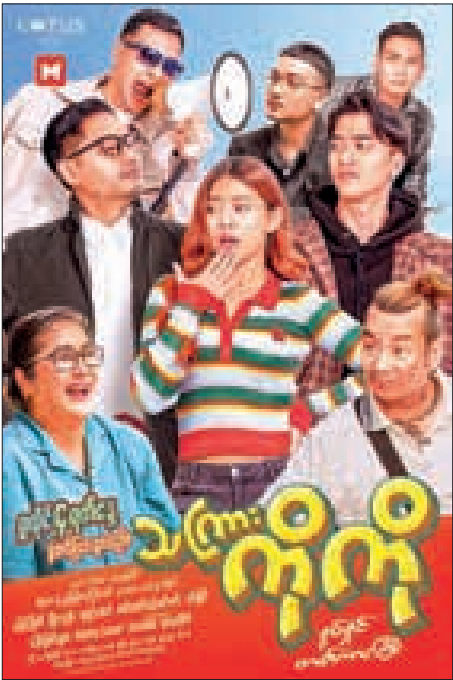
This photo features the poster for the romantic comedy film ‘Sugar Koko’.