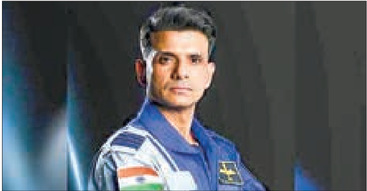
Shubhanshu Shukla’s journey marks a significant milestone for India, coming 41 years after Rakesh Sharma’s historic flight in 1984.

After receiving his official astronaut pin from Ax-4 Mission Commander Peggy Whitson, Shukla said, “I am no 634, that’s a privilege.”