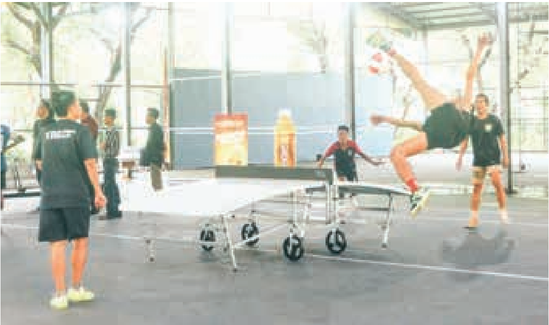
Male Teqball players are seen training in preparation for upcoming competitions.

MYANMAR will participate in Teqball for the first time at the XXXIII Southeast Asian Games, according to the Myanmar Teqball Federation during a team selection and media event held yesterday morning at the federation’s training facility in Kyaik Kasan Compound, Yangon. “This is our first national selection for Teqball ahead of the SEA Games. A demonstra-