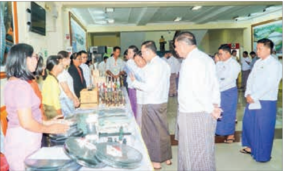
Deputy Prime Minister Union Planning & Finance Minister U Win Shein looks into the MSME products at yesterday's event.

90 per cent of businesses, creating job opportunities ranging from 60 to 70 per cent. He stated the need to utilize a digital system that can help promote work processes, expand the local and international market, and accelerate the services and competitions. He then pledged support for the government for MSME development in the country. The video clip on the MSME Products Exhibition and Competition was screened, and he observed the MSME products of the Union Territory (Nay Pyi Taw). The relevant officials reported on the work progress and participated in a paper reading session. — MNA/KTZH