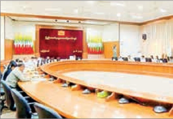
The Union Election Commission and the Myanmar Press Council meet in Nay Pyi Taw on 24 June 2025.