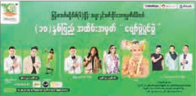
This image depicts the poster for the Danyingon Market Trade Fair.

THE Myanmar Agro Exchange Public Company Ltd will host a trade fair at the new building 7 of Danyingon wholesale market to mark the 10th anniversary. With two main parts, the event, which includes entertainment shows and games, has been scheduled from 29 June to 6 July at Danyingon fruit, vegetable and flower wholesale market. As the first part, the event will take place from 8 am to 8 pm from 29 June to 1 July, including a music show by singer Zwe Pyae, Ei Si Kway and Old Flame and game activities. The public can enjoy different kinds of products with special prices offered by booths at the exhibition. The second part will begin at 9 am from 4 July to 6 July, and singers Zwe Pyae, Nay Min Eain, and Eaint Chit will entertain in the morning. The Phoe Chit Troupe will entertain the audience with plays, operas and duo dances for three nights. Tickets can be bought at the market office and, enquiry made through 09 457020246. — MT/ZS