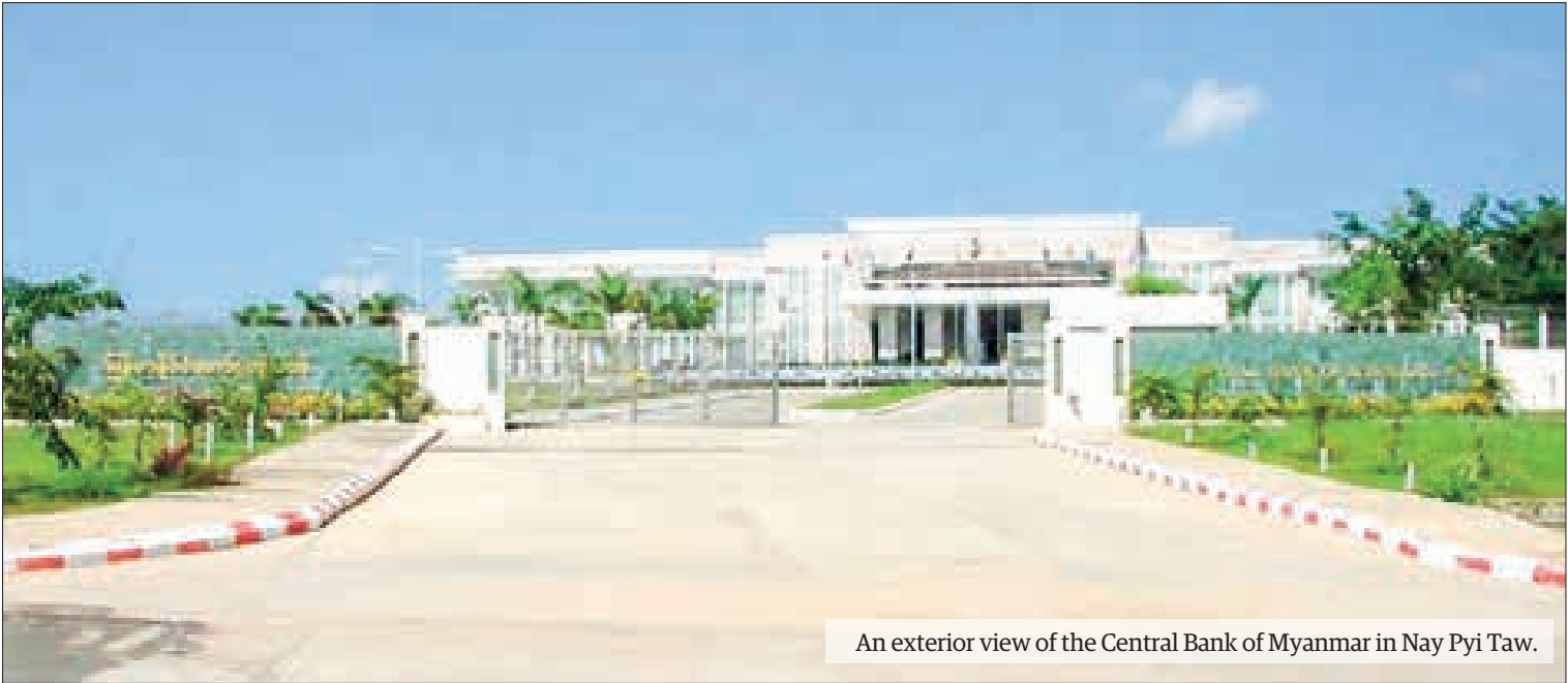
An exterior view of the Central Bank of Myanmar in Nay Pyi Taw.

CBM sold over $600,000 and 387,000 yuan on 20 June. Further-