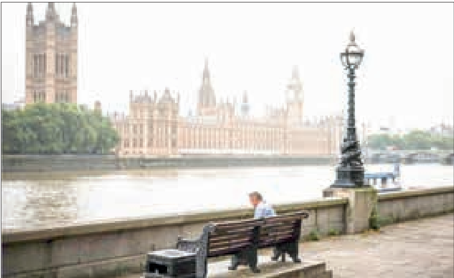
A man sits on a bench on the Southbank of the River Thames, with the Elizabeth Tower, commonly known by the name of the clock’s bell “Big Ben”, at the Palace of Westminster, in the background, in central London, on 2 September 2024.

IRANIAN Foreign Minister Seyed Abbas Araghchi said on Thursday that no arrangement or commitment had been made to resume negotiations with the United States. In an interview with state broadcaster IRIB, Araghchi said the possibility of restarting talks was under consideration but would depend on whether Tehran’s national interests were protected. Araghchi confirmed that the damage caused by the 12-day war with Israel was “serious” and experts from the Atomic Energy Organization of Iran were conducting a detailed assessment. On the same day, White House Press Secretary Karoline Leavitt confirmed that the United States has no meetings scheduled with Iran, one day after US President Trump said that the two sides would talk and meet “next week.” — Xinhua