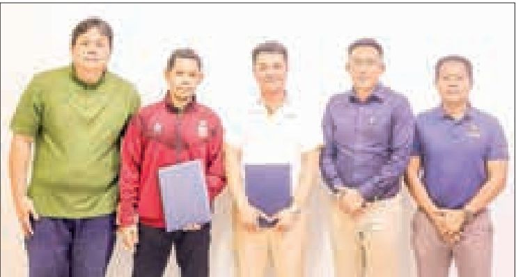
The group photo session takes place after the signing event.