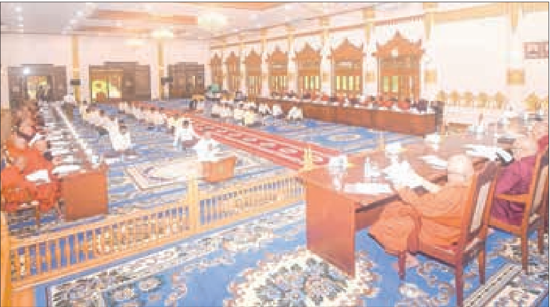
The second meeting of the Ninth 47-member State Sangha Maha Nayaka Committee in progress yesterday.