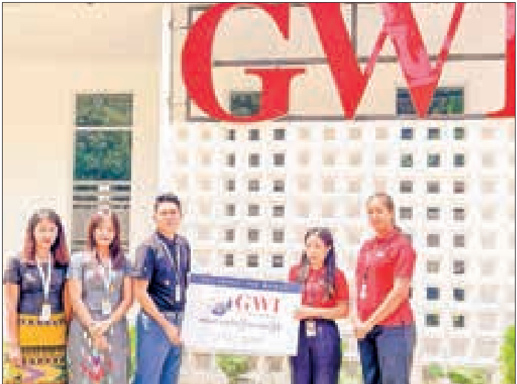
UMT Co Ltd officials receive compensation from GWI.

During the handover ceremony, a GWI official provided an overview of the compensation process and presented a payment of K250 million. A representative from UMT Co Ltd expressed gratitude to GWI for their prompt coordination and settlement of the claim.