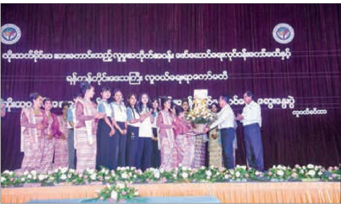
Union Minister U Maung Maung Ohn presents the flower basket and cash awards to performers at yesterday's event.