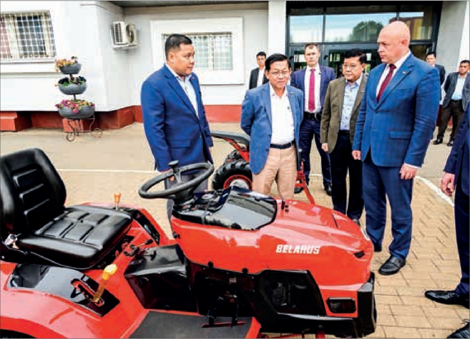
State Administration Council Chairman Prime Minister Senior General Min Aung Hlaing views the tractors and vehicles produced by the Minsk Tractor Works in Belarus yesterday.

The Senior General also visited the booth of the factory and exchanged gifts with the Bela-