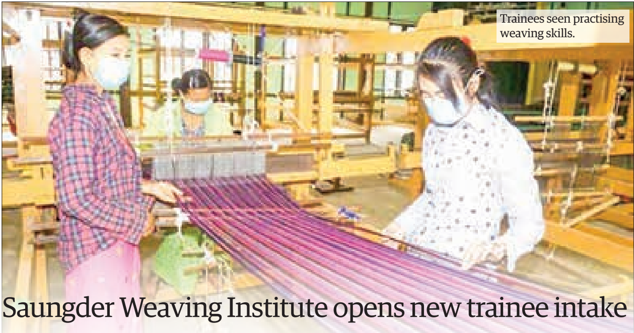
Trainees seen practising weaving skills.

prosecute those who attempt to manipulate the currency market under the existing laws. CBM allowed authorized dealers (private banks) to operate online foreign exchange trading freely as per the market rate, depending on supply and demand, starting from 5 December 2023. — NN/KK