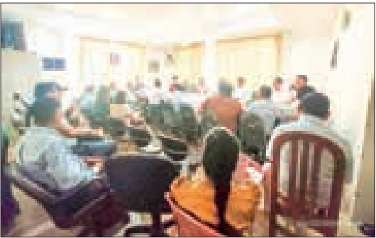
This photo shows MGEA holding the meeting on conducting the gold business development workshop on 22 June 2025.

MGEA called for gold entrepreneurs and those business entities in the industry to attend the workshop.