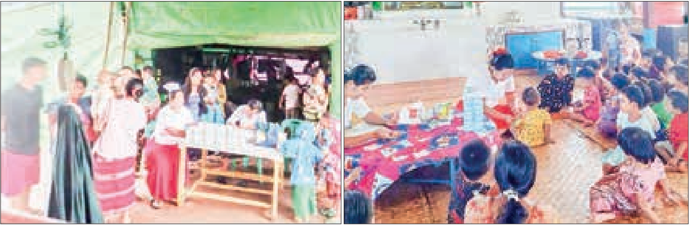
The Kyaikto Township Health Department provides healthcare to children.

FOR children aged under five years with malnutrition, nutritional powder for two months will be provided, said the Kyaikto Township Health Department. Nutrition for children under 5 is essential for their development, and essential nutrients are for brain development, physical growth and boosting the immune system, which prevents them from being infected with viruses, it said. Parents are invited to the department to have a check on height, weight and other healthcare so that they can know precisely about their children’s health. And if there are children under 5 who have under-nutrition, the department will give nutritional powder for two months. This support will help improve the children’s physical and mental health, and parents are urged to bring their children to receive this nutritional support, it said. — MT/ZS