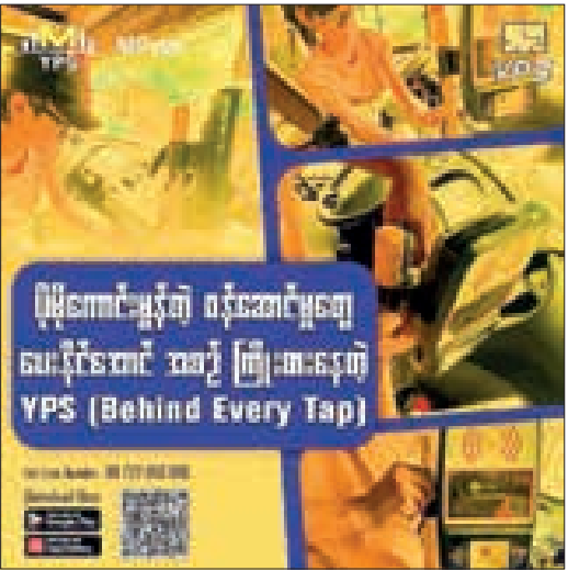
A notice showing YPS card readers being inspected for use.