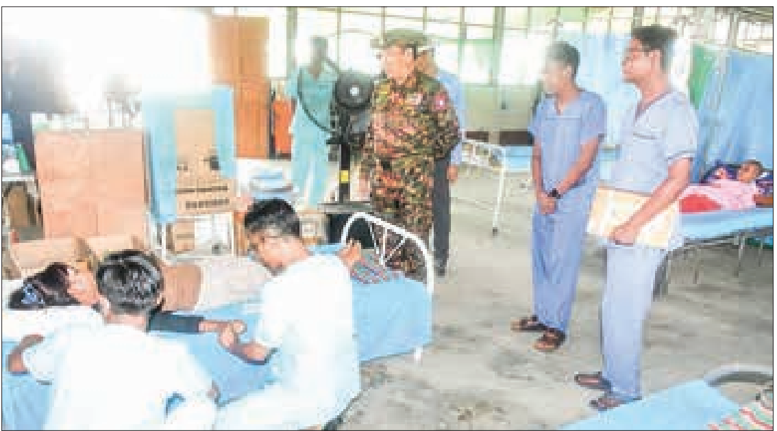
Lt-Gen Thet Pon views medical services provided by the Tatmadaw Mobile Medical Team.

quake at Sagaing Education Degree College, the relocated modular houses for earthquake victims in village areas, the completed construction of modular houses in the Maha Sekongyi Pagoda compound, and the renovation of religious buildings. They worked with authorities to make additional necessary arrangements. The team also oversaw the final clearance of residential buildings destroyed by the earthquake in Sagaing using heavy machinery. They monitored healthcare services provided to earthquake-affected monks, nuns, and residents by the Tatmadaw Mobile Medical Team and observed the purification of the Ayeyawady River by the Tatmadaw water purification vehicle to ensure the availability of clean drinking water. Similarly, Lt-Gen Soe Tint Naing from the Office of the Commander-in-Chief (Army) and his