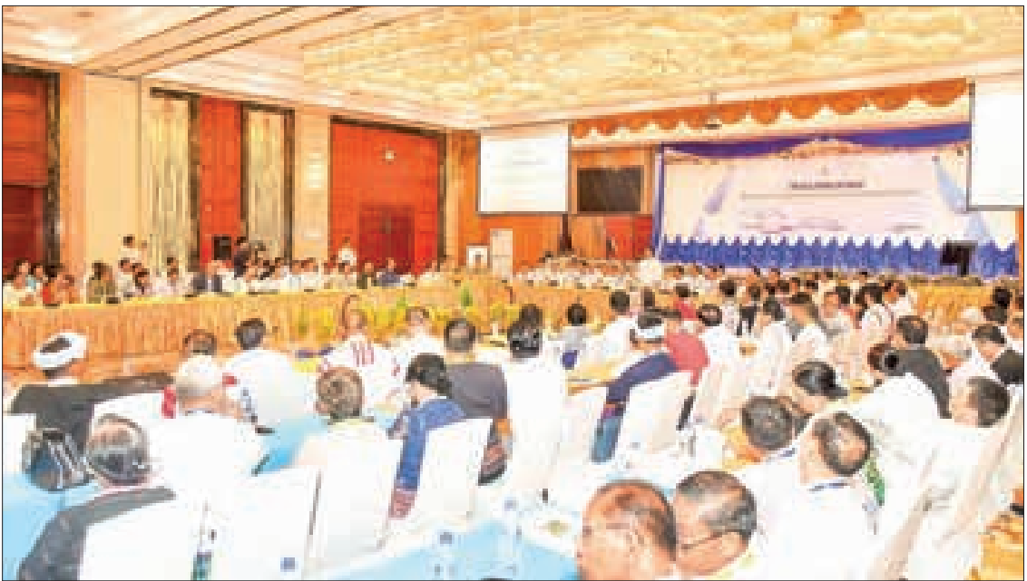
Finale of the 2025 Peace Forum held yesterday in Nay Pyi Taw.

istries concerned and organizations, rectors of universities, representatives of international and local NGOs and other observers. They are divided into two discussion groups: Group 1 and Group 2. During the morning session, both groups discussed under the theme: “Developing strategies to address humanitarian needs and tackle socio-economic challenges” and “Analyzing the various geopolitical perspectives and influences on the future of Myanmar, and developing strategies to be applied in the process of transformation.” In the afternoon, the forum