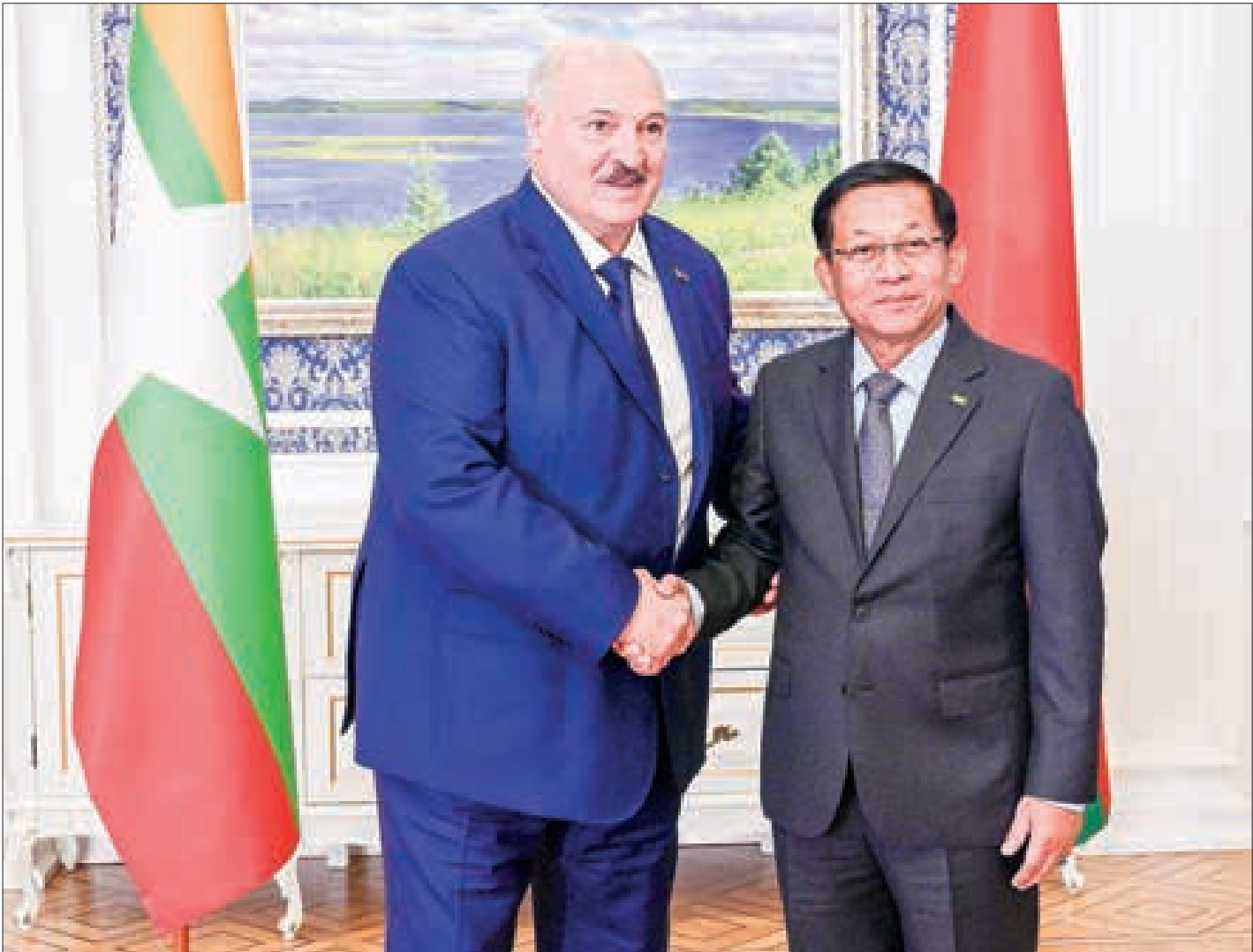
State Administration Council Chairman Prime Minister Senior General Min Aung Hlaing and Belarusian President Mr Alexander Gregoryevich Lukashenko exchange greetings at the Presidential Palace in Minsk yesterday.

The 4 th Eurasian Economic Forum 2025 (EEF 2025) provided many opportunities for cooperation between Myanmar and the member countries of the Eurasian Economic Union (EAEU).