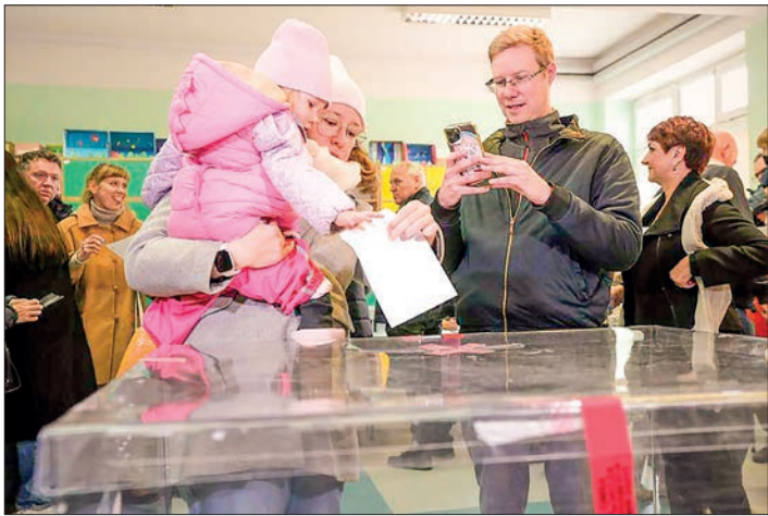
A girl and her mother cast a ballot together at a polling station in Warsaw, Poland, on 18 May 2025.

KAROL Nawrocki, an independent candidate backed by the opposition Law and Justice (PiS) party, won Poland’s presidential runoff election, the Polish National Electoral Commission (PKW) announced in a press conference Monday morning.