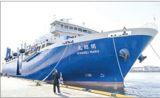
Photo shows a commercial whaling ship upon its arrival at Sendai port in Miyagi Prefecture on 2 June 2025, after conducting a hunt in the Sea of Okhotsk.

A commercial whaling ship returned to a port in northeastern Japan on Monday carrying 25 fin whales taken in the Sea of Okhotsk. The fin whale hunt in Japan’s exclusive economic zone, north of the northern island of Hokkaido, was conducted for the first time since Japan formally withdrew from the International Whaling Commission in 2019. About 320 tonnes of fin whale meat were unloaded at Sendai port in Miyagi Prefecture on Monday, with some 1.6 tonnes set to be transported to six markets across the country including Tokyo and Osaka as raw meat. The ship departed Shimonoseki port in the western Japanese prefecture of Yamaguchi on 21 April. The Japanese Fisheries Agency added fin whales to the list of commercial whaling target species in 2024, setting a catch quota of 60 for this year. As an International Whaling Commission member, Japan halted commercial whaling in 1988 but continued to hunt whales for what it called research purposes. The practice was criticized internationally as a cover for commercial whaling. — Kyodo