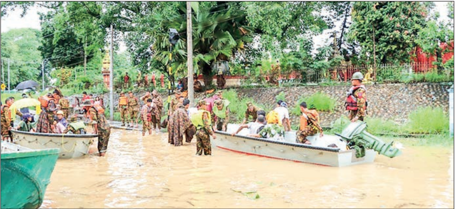
Relocation of residents underway.

DUE to heavy rainfall in Myitkyina, Kachin State, the water level of the Ayeyawady River began to rise on 1 June 2025, causing river water to overflow into neighbourhoods and villages located along the riverbanks. On 1 June, the water level of the Ayeyawady River rose to approximately 1,218 centimetres. According to the measurements on 2 June, the water level has receded to around 1,195 centimetres – about five centimetres below