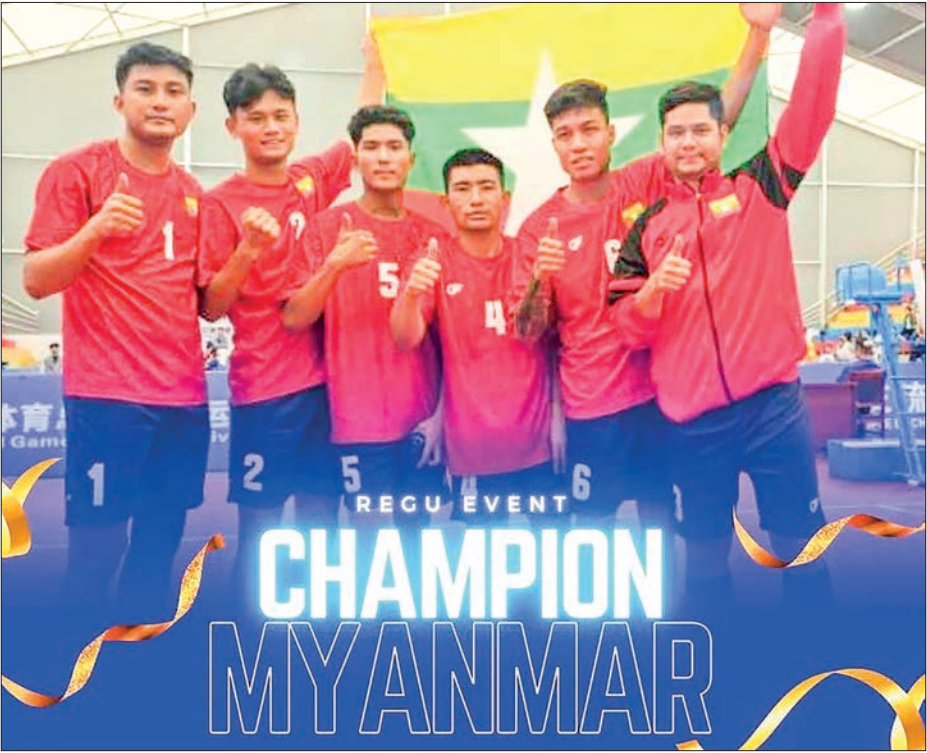
Gold medallist Myanmar men's Sepak Takraw team.

Laos team 2-0, and in the final, they faced Malaysia again and won 2-1 to claim the gold medal. In the women's regu event, the Myanmar team secured the bronze medal. The quadrant event of the Sepak Takraw Championship will continue on 3 and 4 June, with the Myanmar team participating. In the men's quadrant event, Group A includes Malaysia, Vietnam, and Myanmar, while Group B includes China, Laos, and Thailand. In the women's quadrant event, Group A includes China, Thailand, Myanmar, and Cambodia, while Group B consists of Vietnam, the Philippines, and Laos.