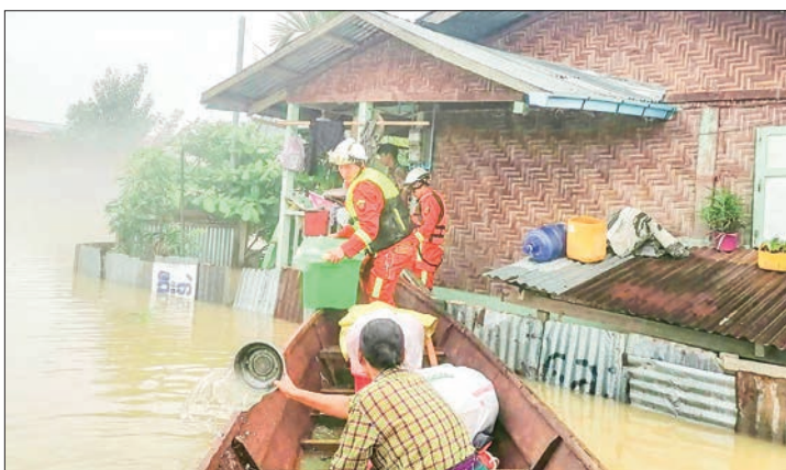
Flooding in Myitkyina seen on 2 June.

The Ayeyawady River in Myitkyina rose about two inches above the danger level on 2 June, and the Department of Meteorology and Hydrology has warned residents living in low-lying areas and along the riverbanks in Myitkyina Township to evacuate as soon as possible.