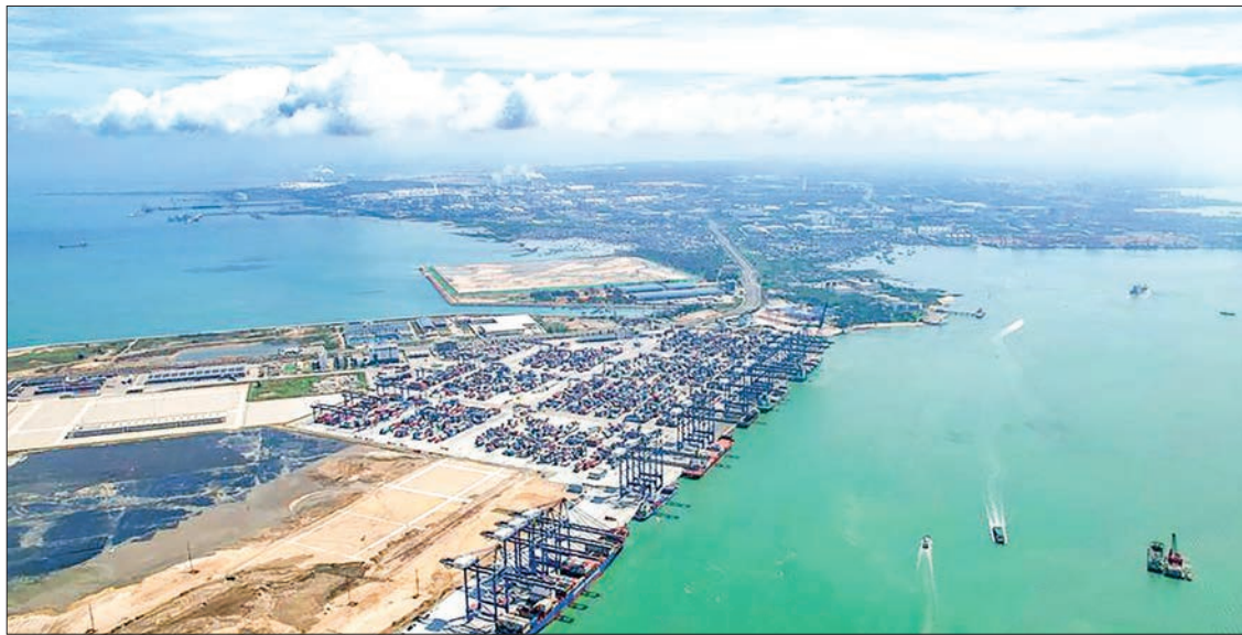
This aerial drone photo taken on 28 May 2025 shows a view of the Yangpu International Container Port in the Yangpu Economic Development Zone in Danzhou, south China's Hainan Province.

Container throughput, a leading gauge of trade health, increased 7.9 per cent year on year during this period to reach 110 million twenty-foot equivalent units (TEUs), according to the ministry.