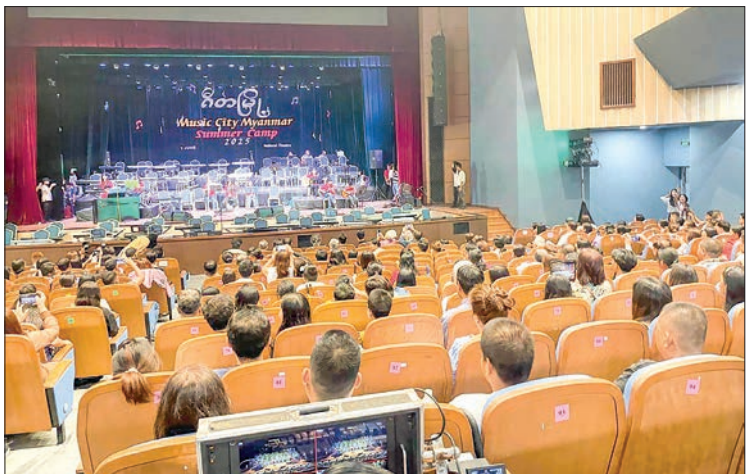
Graduation concert and art exhibition of Music City Myanmar Summer Camp 2025.