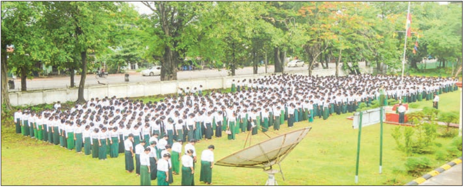
Photos above and at top show students returning to schools in Yangon and Bago Regions, Thazi, and Toungoo.