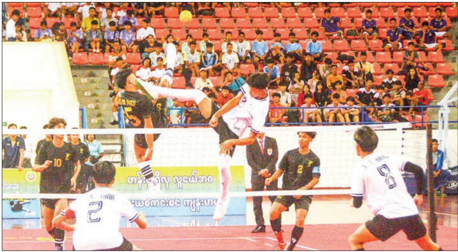
Shwepyitha and Thanlyin are competing in the 2025 U23 Inter-Township Sepak Takraw Tourney.

extended a warm welcome to the participating teams. Following the ceremony, the chief minister and attendees watched the first match of the tournament. A total of 45 men's teams and 22 women's teams are taking part in the competition, which will run until 9 June. — Arkar Lin/MKKS