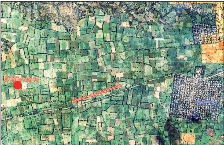
Location map of terrorist attack in Natmawk, Magway Region.

their proposal by saying she is serving her duties for the future of the students. Then, the couple was abducted to about two miles from her village and brutally killed. From 1 February 2021 to 1 June 2025, terrorist groups murdered 79 educational staff, while there were 35 injuries. Civilians strongly condemned terrorist attacks against teachers, and security forces carried out security measures promptly. — MNA/KTZH