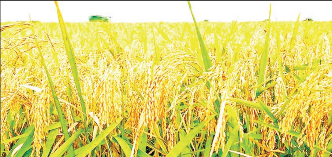
This photo depicts a vast thriving paddy field.

FROM PAGE 1 held in the Philippines in 2009 and the World’s Best Rice award in 2011 held in Vietnam. Myanma Pawsan is regarded as Myanma Pearl Rice in the global rice market. Moreover, efforts are being made to grab GI, the trust of the purchasing country and maintain the rice quality. Efforts will be made to integrate regionally cultivated varieties of Pawsan using technology in a way that preserves the original Pawsan’s quality and characteristics. Produc-