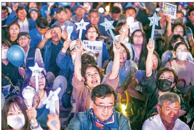
Supporters of Lee Jae-myung, the presidential candidate for South Korea’s Democratic Party, gesture during his final election campaign event ahead of the upcoming 3 June presidential election in Seoul on 2 June 2025.

CANDIDATES running in South Korea’s snap presidential election made a last push for votes on Monday, the eve of a poll triggered by ex-leader Yoon Suk Yeol’s martial law declaration.