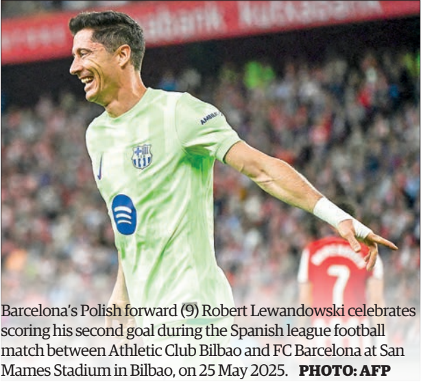
Barcelona's Polish forward (9) Robert Lewandowski celebrates scoring his second goal during the Spanish league football match between Athletic Club Bilbao and FC Barcelona at San Mames Stadium in Bilbao, on 25 May 2025.

FC Barcelona striker Robert Lewandowski expressed confidence in his ability to continue performing at a high level but declined to set a specific end date for his career at the club. The 36-year-old played a key role in Barcelona's La Liga and Copa del Rey double-winning season, scoring 42 goals across all competitions despite being sidelined late in the campaign with a muscle injury. Speaking to the Barcelona-based El Mundo Deportivo newspaper, Lewandowski was asked about his future and whether he has considered extending his stay beyond the remaining year on his contract. "I think I have enough time to decide what I want to do after next season. I can play at the same level as last season," said Lewandowski, who noted that there could always be "something else outside of football that can ultimately change what's on my mind." "That's why I think it's too early to think about these things now. I have a little time to rest, then I also have time for preseason and to prepare well for the season. I'm sure I'll be physically fit," he explained. — Xinhua