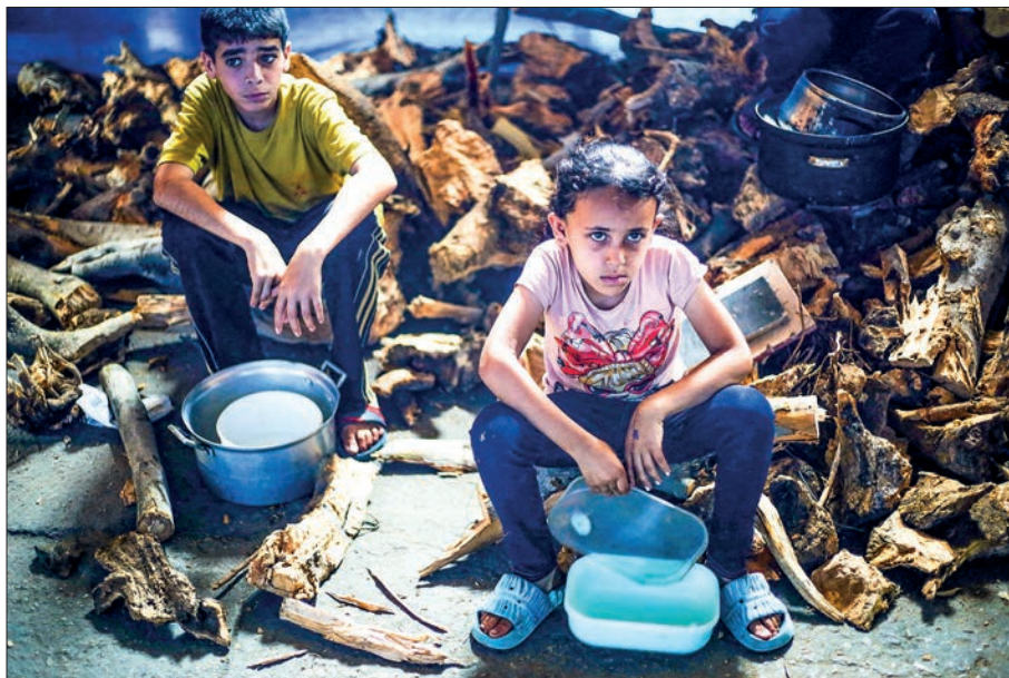
Palestinian children wait for food at a distribution point in Nuseirat, central Gaza Strip, 2 June 2025.

UN chief Antonio Guterres called Monday for an independent investigation into the killing of dozens of Palestinians near a US-backed aid centre in Gaza after rescuers blamed the deaths on Israeli fire and the military denied any involvement.