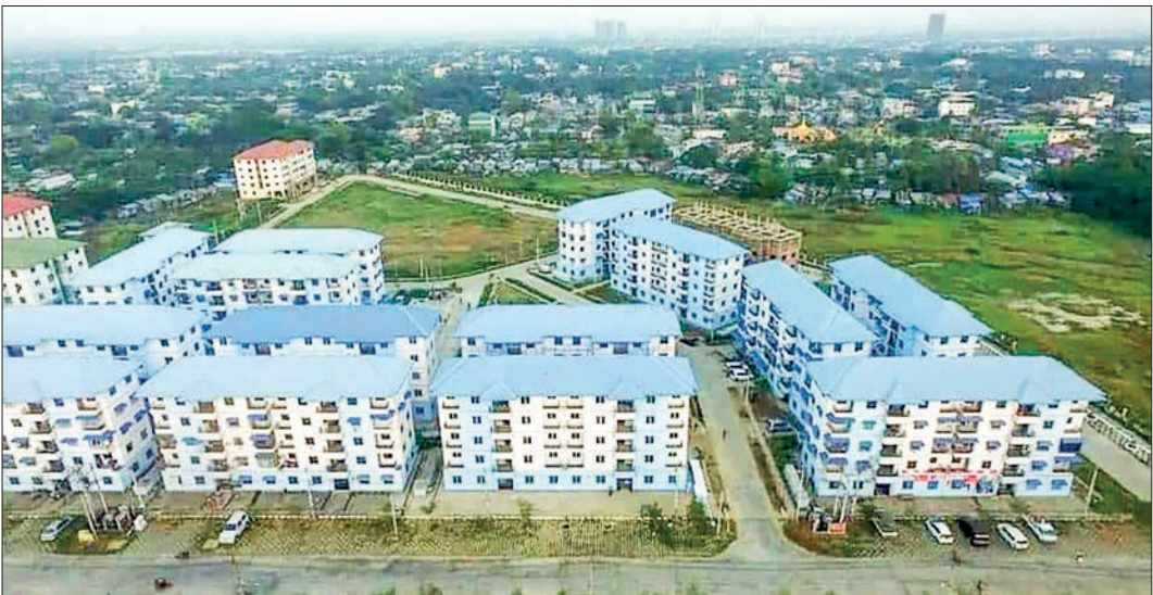
This picture captures apartment units to be sold under a home loan programme with a low interest rate from the CHID Bank.

Drawing lots will be held on 27 June 2025, and housing loans will be granted to those winners who are allowed to buy an apartment unit. — ASH/KK