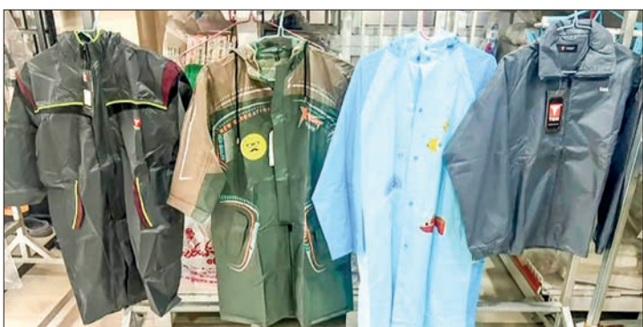
Raincoats are arranged for sale.

"I bought my child a long raincoat because it has rained heavily so the umbrella alone can't give full protection from rain. The raincoat can cover the school bag and uniform from rain. Raincoat is necessary because it is now monsoon season," she said. Monsoon items such as umbrellas, rainwear sandals and raincoats have been sold well recently. — MT/ZS