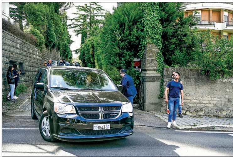
Vehicles of delegations leave the Omani embassy hosting a fifth round of nuclear talks between Iran and the United States, in Rome on 23 May 2025.

Western countries have accused Iran of seeking nuclear weapons, a charge Tehran has repeatedly denied, insisting it needs uranium for civilian power production.