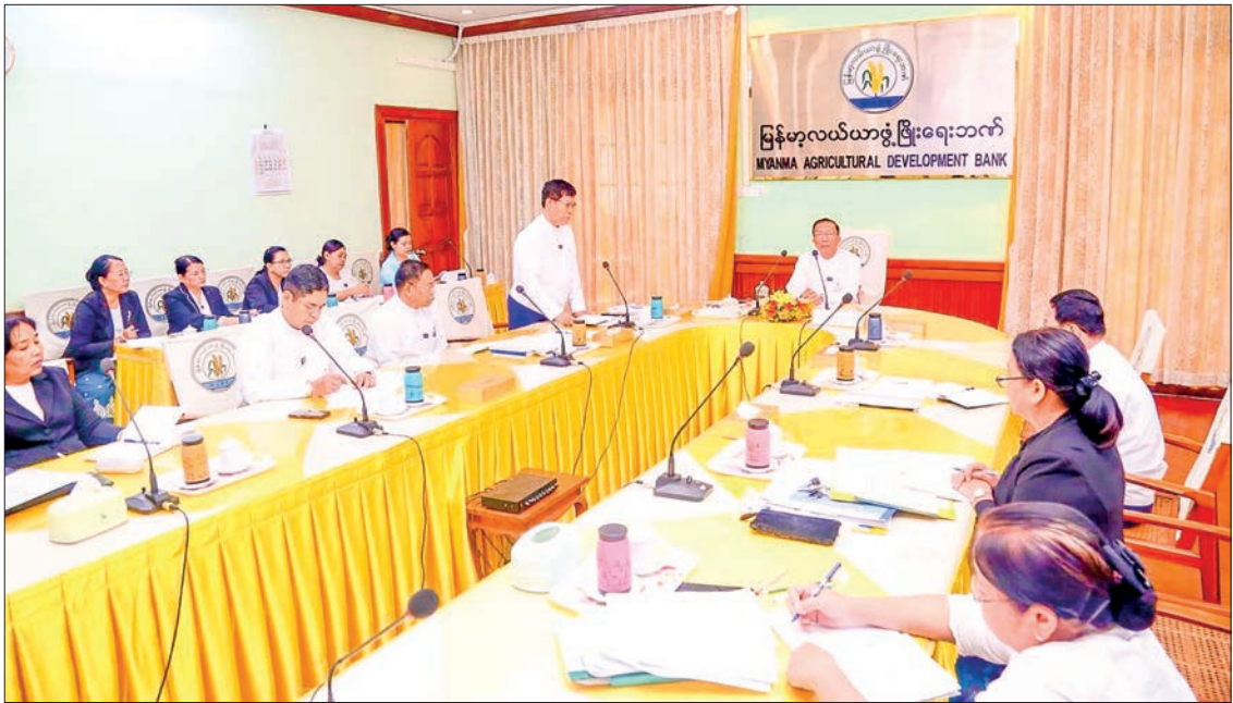
Deputy Prime Minister Union Planning & Finance Minister U Win Shein meets personnel from the Myanma Agricultural Development Bank.

DEPUTY Prime Minister and Union Minister for Planning and Finance U Win Shein met the managing director, general managers and departmental heads of the Myanma Insurance (head office) in Yangon yesterday. During the meeting, the Deputy Prime Minister urged responsible personnel to strive towards the development of insurance businesses collectively, the implementation of insurance protection schemes that benefit the public, and the establishment of a systematic and prompt compensation process for damage and losses of the government and private due to the Mandalay earthquake, and to become a reliable insurance