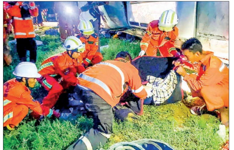
Fire brigade personnel at the accident scene carrying out rescue operations.

ELITE Express Public Company Limited has announced that there were victims of a road accident and the Elite Express family is providing timely medical care for the victims onboard the vehicle.