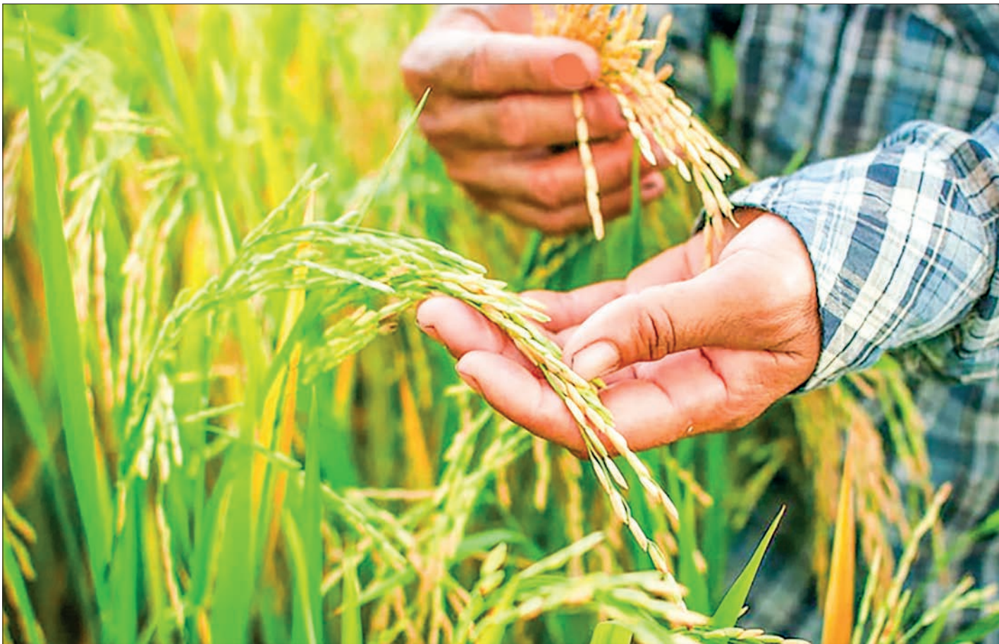
A farmer showcases Myanma Pawson paddy grain, globally known as Myanma Pearl Rice.

First exported in 2001-2002, Myanma Pawsan - known globally as Myanma Pearl Rice - earned international acclaim when Pyapon Pawsan won top honours at the World Rice Conferences in 2009 and 2011.