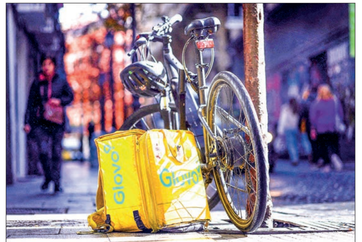
A food delivery firm Glovo's bag is pictured in Madrid on 2 December 2024.

The European Commission, which acts as the EU's competition watchdog, said the two companies admitted their involvement in the cartel and agreed to pay the fines to settle the case.