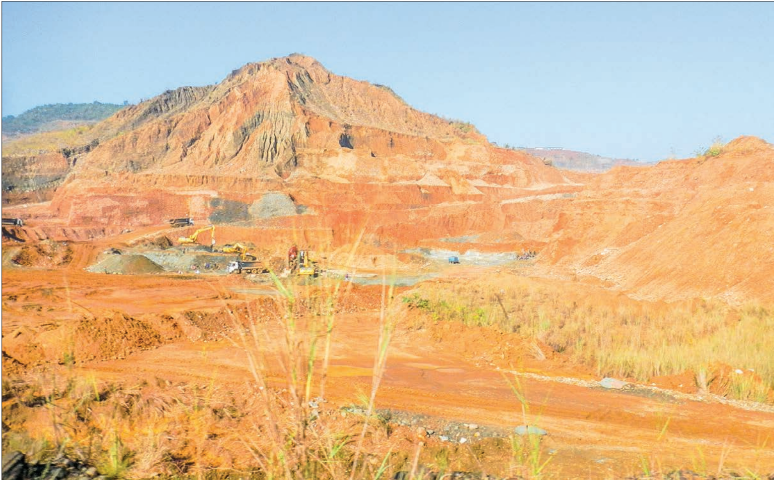
Opencut jade mines at Hpakan: PHOTO: THAN HTUN (2014)

of jadeite are situated in the neighbourhood of Namshamaw (25° 45’ 31”, 96° 22’ 28”):