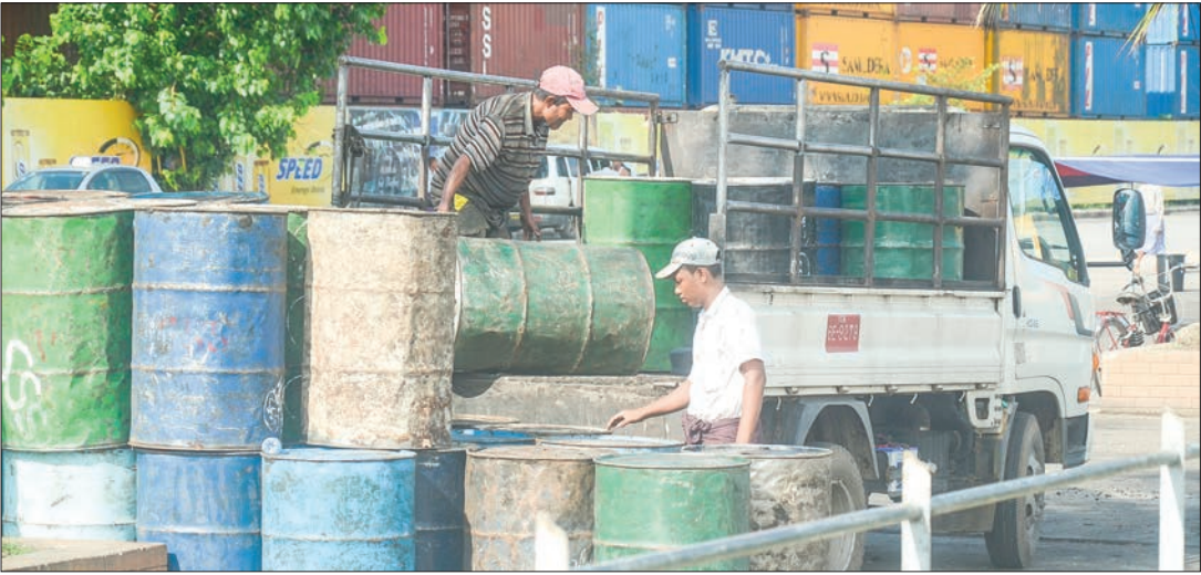
Barrels of cooking oil being loaded onto a truck for nationwide distribution.

The tender form can be purchased at the MR office located at the corner of Merchant Road and 51 st Street, Botahtaung Township, Yangon, starting from 2 June. Tender submission will be accepted by 2:30 pm on 2 July. Individuals can enquire about details through MR’s contact numbers 01 294352 and 01 291994. — NN/KK