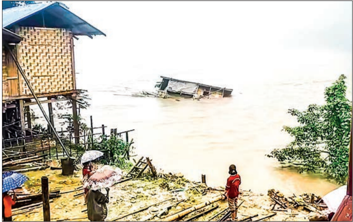
A house in Redam village of Khaunglanphu seen washed away by the Maykha flood on 1 June.

OVER 1,000 households in Kachin State have been evacuated as the level of the Ayeyawady River rises, the Myanmar Fire Services Department said on 2 June.