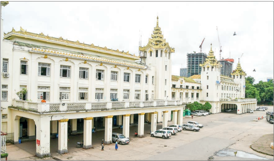
A general view of the Yangon Railways Station.

The opening tenders 94/MaMa/CE, 95/MaMa/CE, and 96/MaMa/CE are chain link fencing projects (Lots 1, 2, and 3 with