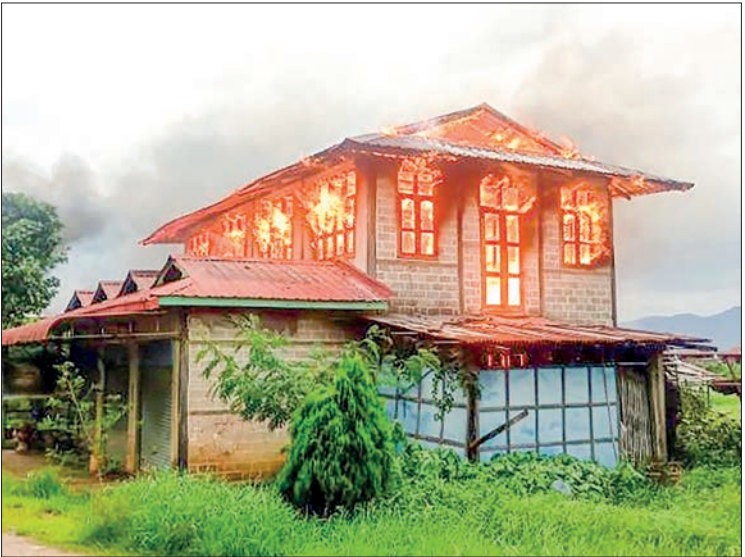
This photo shows a local’s house damaged by terrorist fire in Nyaungshwe Township.

fire to houses of innocent people in the village to have a way to retreat and then withdrew to the south of the village. So, security forces pursued terrorists as they retreated and continued to carry out the necessary security operations. Security personnel cooperate with residents and people’s militia (local) troops to carry out necessary security operations aimed at identifying and arresting the terrorists who set fire to the homes of innocent villagers. — MNA/TTA