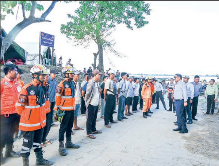
Kachin State Chief Minister U Khet Htein Nan encourages rescue teams who carry out rescue operation in Myitkyina, Kachin State, yesterday.

to specifications and practical plans be developed to resume factory operations. — MNA/TH