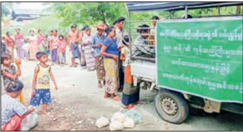
Mobile trucks offer fair-priced food in Sagaing

ACCORDING to statistics on the demand letters released by the Myanmar Embassy to Japan, more than 1,100 Myanmar workers would be recruited by up to 390 Japanese companies. The embassy has carried out timely verifications of demand letters received from the Ministry of Labour via the Ministry of Foreign Affairs, it said. It verifies whether labour supervisory companies and factories, or companies which offered jobs in Japan, are officially established or not, and resubmits its findings and remarks to the Ministry of Labour through the Ministry of Foreign Affairs. It is about 397 demand letters that the embassy submitted to the Ministry of Foreign Affairs after verification until 25 February 2025. According to it, over 360 Myanmar male workers and over 800 Myanmar female workers would be recruited by more than 390 Japanese companies. The embassy stated on 15 May, more than 1,200 Myanmar workers would be employed by up to 300 Japanese companies. — MT/ZS