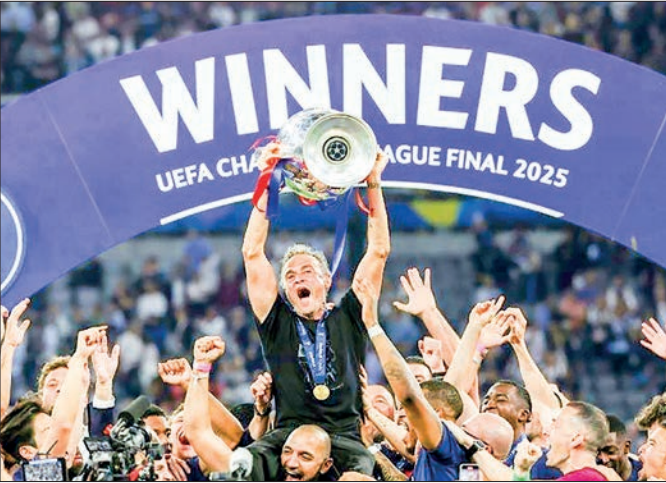
Paris Saint-Germain coach Luis Enrique lifts the Champions League trophy after his side outclassed Inter Milan in the final.

More than 100,000 people are expected to watch their heroes in the parade on Paris' showpiece avenue after the team won the biggest prize in European club football for the