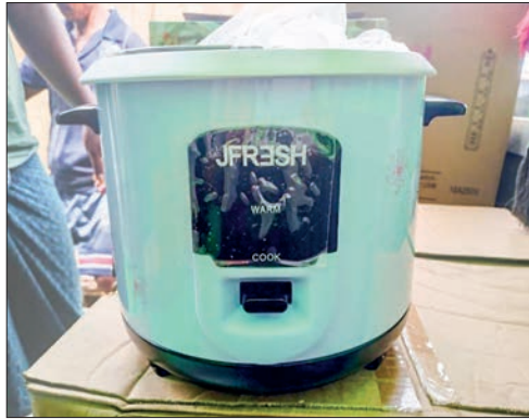
Smuggled rice cooker seized in Bago Region and an unregistered vehicle seized in Sagaing Region.

Meanwhile, inspections conducted by Sagaing Region Illegal Trade Eradication Task Force on the same dates led to the seizure