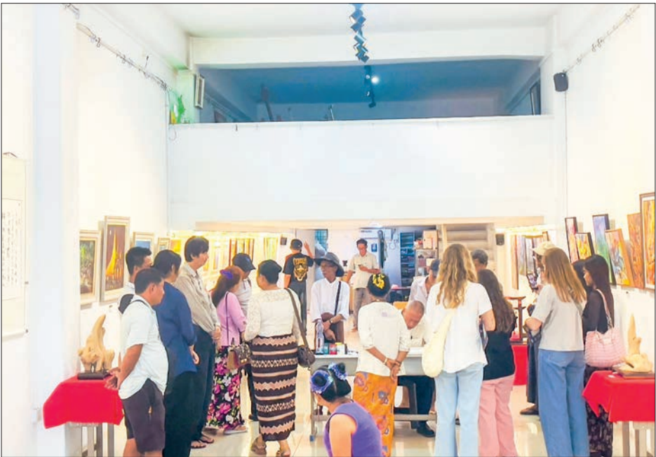
This photo depicts visitors enjoying artistic works of Myanmar and Chinese painters at China-Myanmar Friendship Art Exhibition.

A group art exhibition titled “China-Myanmar Friendship Art Exhibition” is be-