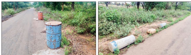
Homemade landmines planted by PDF terrorists along the road in Pakokku Township.

In Pakokku Township of Magway Region, improvised mines were discovered yesterday on public roads used by residents. Acting on tip-offs from local people who oppose terrorism, security personnel conducted