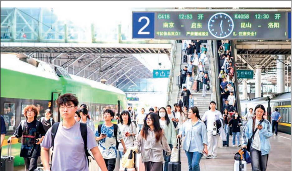
Passengers prepare to board a train at Nanjing Railway Station in Nanjing, East China's Jiangsu province, 30 April 2025. The Dragon Boat Festival, also known as Duanwu Festival, falls on Saturday this year.

CHINA'S railway network is expected to handle approximately 80.5 million passenger trips during the five-day travel rush around Dragon Boat Festival holiday, the national railway operator said Friday. The travel rush period kicked off Friday, a day ahead of the 3-day holiday, while Saturday is expected to witness the peak passenger flow for this period, with roughly 18.3 million railway trips predicted nationwide, said China State Railway Group Co, Ltd. According to China's 12306 railway booking platform, popular destinations for this year's holiday include Beijing, Shanghai, Guangzhou, Chengdu, Hangzhou, Wuhan, Xi'an, Nanjing, Changsha and Zhengzhou. Platform data also shows that the Beijing-Shanghai, Beijing-Jinan, Beijing-Taiyuan, Beijing-Nanjing and Shenzhen-Hong Kong routes are among the most popular during the period. To cater to elevated travel needs, China's railways have increased capacity while also improving service quality to ensure better passenger experiences.