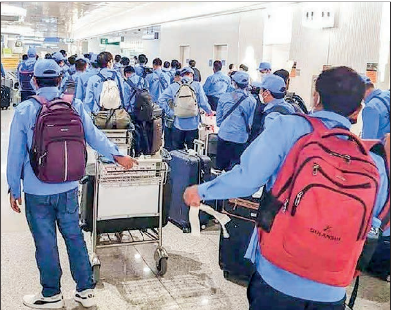
Myanmar workers seen at the airport.

ACCORDING to statistics on the demand letters released by the Myanmar Embassy to Japan, more than 1,100 Myanmar workers would be recruited by up to 390 Japanese companies. The embassy has carried out timely verifications of demand letters received from the Ministry of Labour via the Ministry of Foreign Affairs, it said. It verifies whether labour supervisory companies and factories, or companies which offered jobs in Japan, are officially established or not, and resubmits its findings and remarks to the Ministry of Labour through the Ministry of Foreign Affairs. It is about 397 demand letters that the embassy submitted to the Ministry of Foreign Affairs after verification until 25 February 2025. According to it, over 360 Myanmar male workers and over 800 Myanmar female workers would be recruited by more than 390 Japanese companies. The embassy stated on 15 May, more than 1,200 Myanmar workers would be employed by up to 300 Japanese companies. — MT/ZS