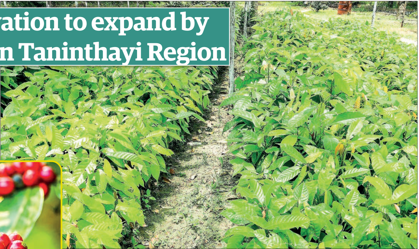
Photos show coffee saplings at a nursery in Taninthayi Region (above) and coffee beans (left photo).

With suitable water sources, land conditions and climate, Taninthayi Region is not only home to perennial crops such as rubber, oil palm and coconut but also favourable for cultivating Robusta coffee. Due to these advantages, the department is implementing plans to expand coffee cultivation across the region this year. “In the 2024-2025 financial year, we expanded coffee by 1,874 acres in Taninthayi Region. As of today, the total area under coffee cultivation has reached 3,022 acres. In Myeik District alone, 940 acres were added in 2024-2025, bringing the district’s