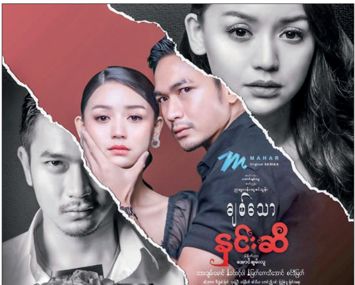
Promotional poster for the drama series “Chit Thaw Hninzi” (the Beloved Rose).