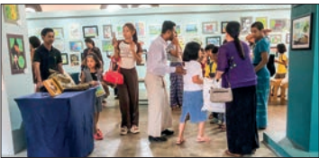
Private Fine Art Teaching exhibition runs 31 May-2 June

tunities, and help Myanmar coffee enter international markets. To support this, the department is providing both training and free seedlings to farmers. Coffee plantations in Myeik District have been established in Taninthayi and Mawtaung townships, as well as in Bokpyin Township, with acreage expanding in targeted areas. Farmers can maintain regular contact with the department for ongoing technical support. As coffee cultivation expands, farmers’ incomes and the local socio-economic conditions are expected to improve. — Myint Oo (Myeik)/KZL