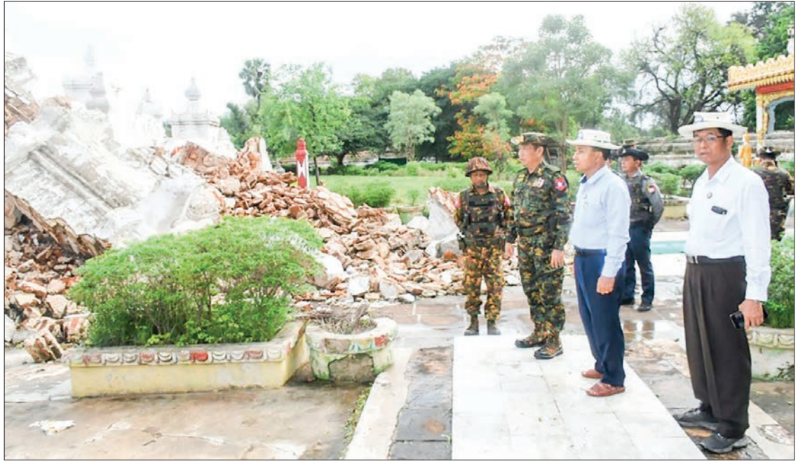
Chief Minister of Sagaing Region U Myat Kyaw and Lt-Gen Thet Pon view collapsed Myatheintan Pagoda in Mingun of Sagaing Township yesterday.

Lt-Gen Myo Thant Naing from the Office of the Commander-in-Chief (Army) over-viewed dredging of drains along Yangon-Mandalay highway in Kyaukse and repairing of buildings at the rural health centre in Phyauckseikpin Village and sales of construction materials at the