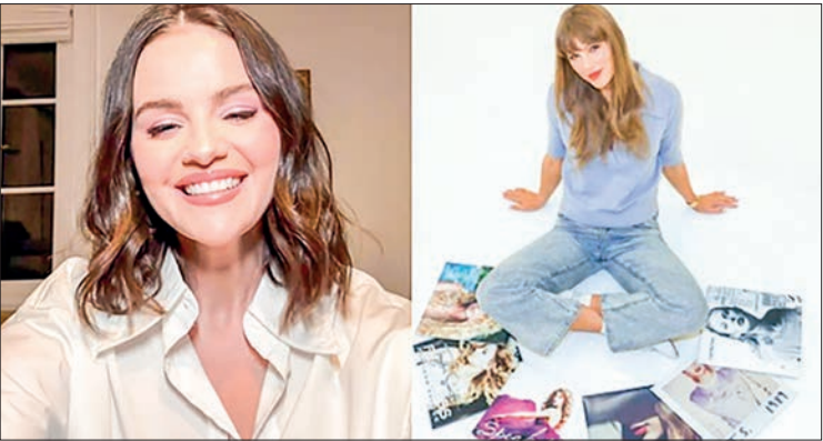
Gomez and Swift have been friends since 2008.

achievement by posting photos of herself surrounded by her early albums, referencing her hit song “You Belong with Me” from the album Fearless. This milestone comes after a challenging period when Swift’s music catalog was sold to music executive Scooter Braun without her consent, prompting her to re-record her albums as “Taylor’s Version” to regain ownership.