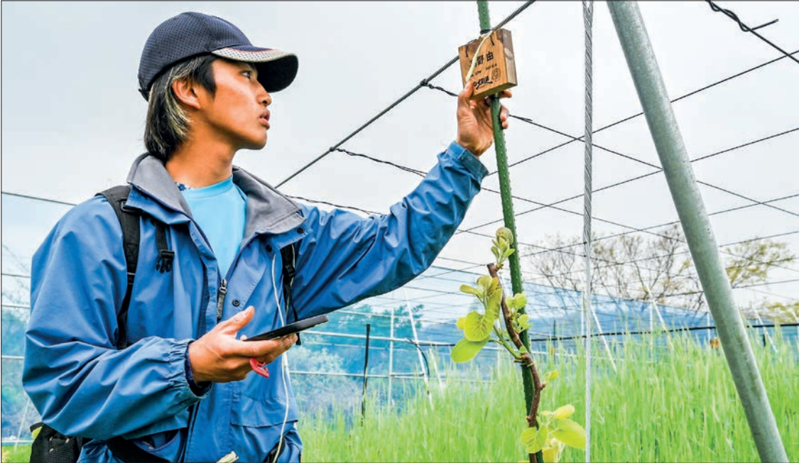
This photo taken on 24 April 2025 shows a farm worker checking on kiwi fruit vines at ReFruits Co., a company hoping to revitalise agriculture in the area by growing kiwi fruits, some five kilometres (three miles) from the stricken Fukushima nuclear power plant in the town of Okuma, Fukushima prefecture.

The contaminated soil is currently stored in interim facilities near the nuclear plant, with a government commitment to find permanent storage by 2045.