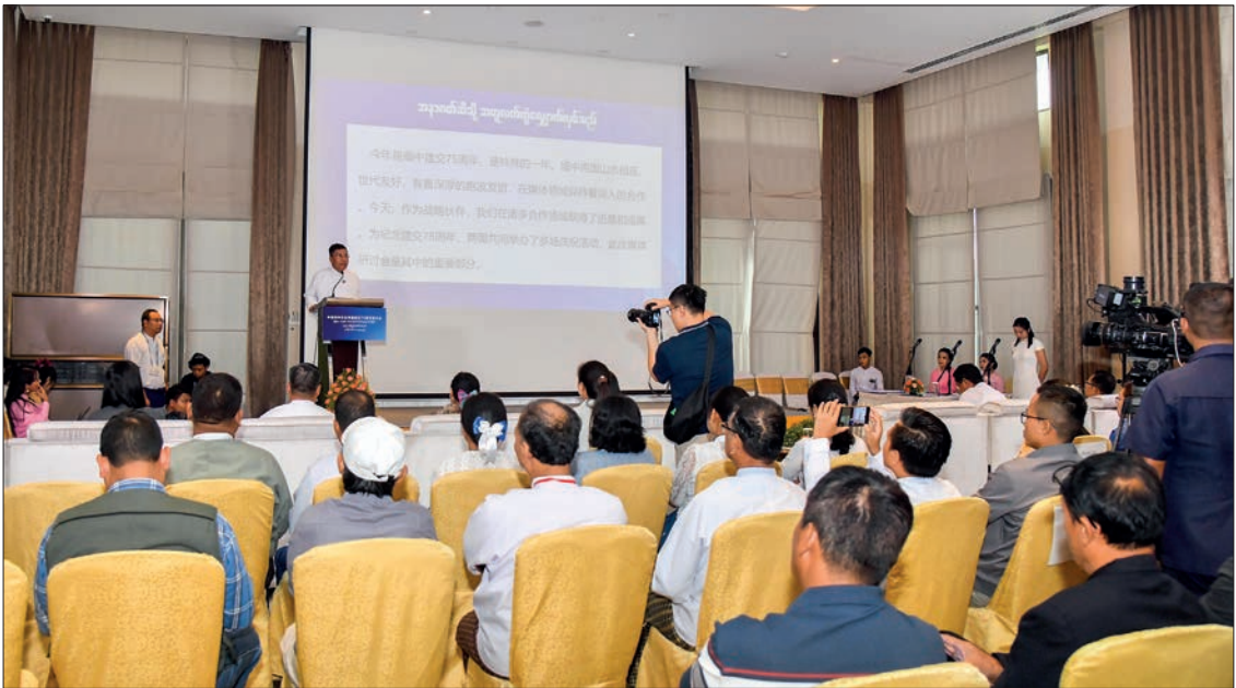
Deputy Minister for Information U Ye Tint delivers speech at the Myanmar-China Media Dialogue commemorating the 75 th anniversary establishment of diplomatic relations between China and Myanmar at the Parkroyal Hotel in Nay Pyi Taw yesterday.

Deputy Minister U Ye Tint then delivered a speech, noting that this year marks the diamond jubilee of Myanmar-China diplomatic relations — a milestone of great significance for both nations. He expressed confi-