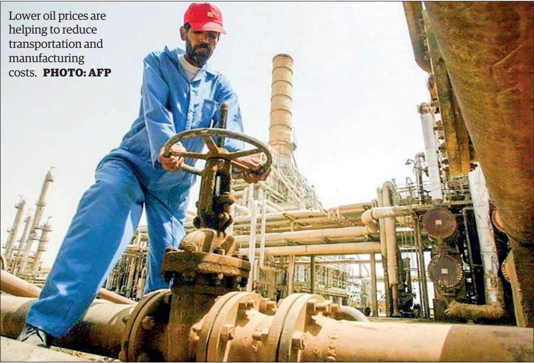
Lower oil prices are helping to reduce transportation and manufacturing costs.

US President Donald Trump's tariffs, his "drill baby drill" approach, and OPEC+'s decision to increase crude output have driven oil prices to their lowest levels since the COVID-19 pandemic. Currently, Brent North Sea crude is trading below $65 per barrel, a significant drop from over $120 in 2022 after Russia's invasion of Ukraine. This decline is beneficial for