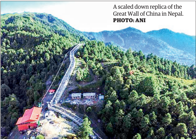
A scaled down replica of the Great Wall of China in Nepal.

A scaled-down replica of the Great Wall of China built on the foothills of the Shailung, by Shailung Rural Municipality, has been gathering tourists in recent times. In the Tamang language, 'Shai' means one hundred and 'Lung' means hillocks, as one can view 108 hillocks in this area has always been