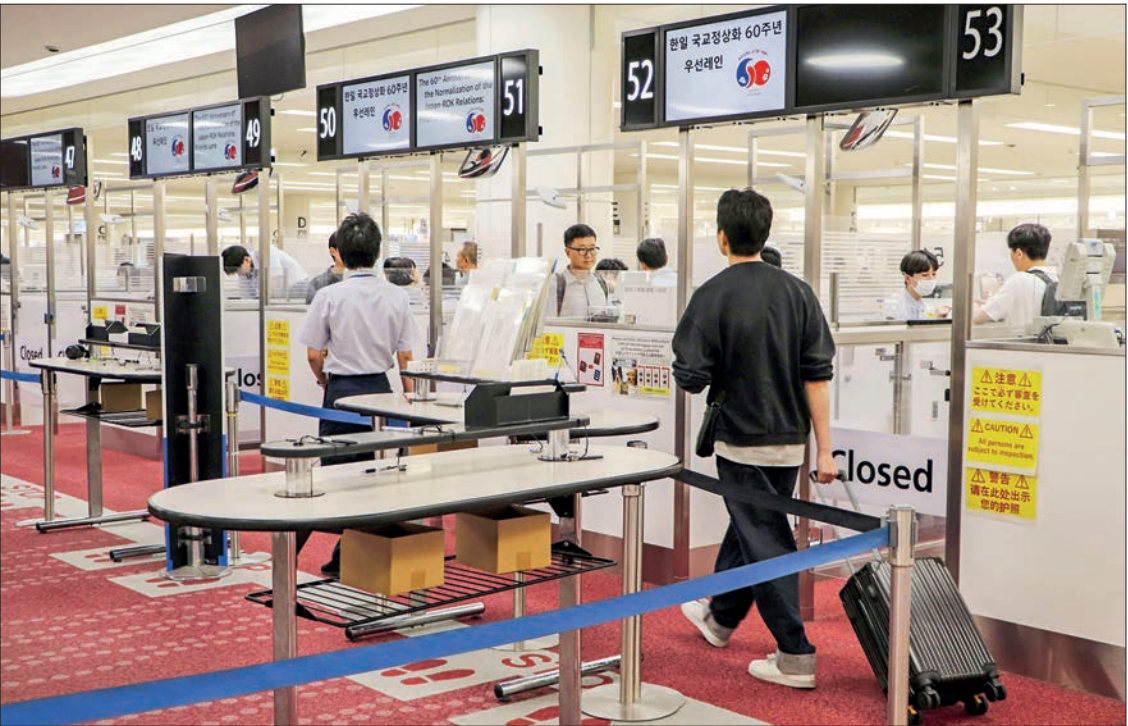
Photo shows dedicated entry lanes for South Korean visitors at Haneda airport Terminal 3 in Tokyo on 1 June 2025.

boring nation, and he expressed hope that the two countries will deepen their relations. It is the first time a Japanese airport has designated a lane for a specific nation, according to the Immigration Services Agency. People who have visited the respective countries within the past year and have registered in advance are eligible to use the perk, which is available for flights arriving between 9 am and 4 pm. The two nations signed on 22 June 1965, a basic treaty that led to the normalization of diplomatic ties. — Kyodo