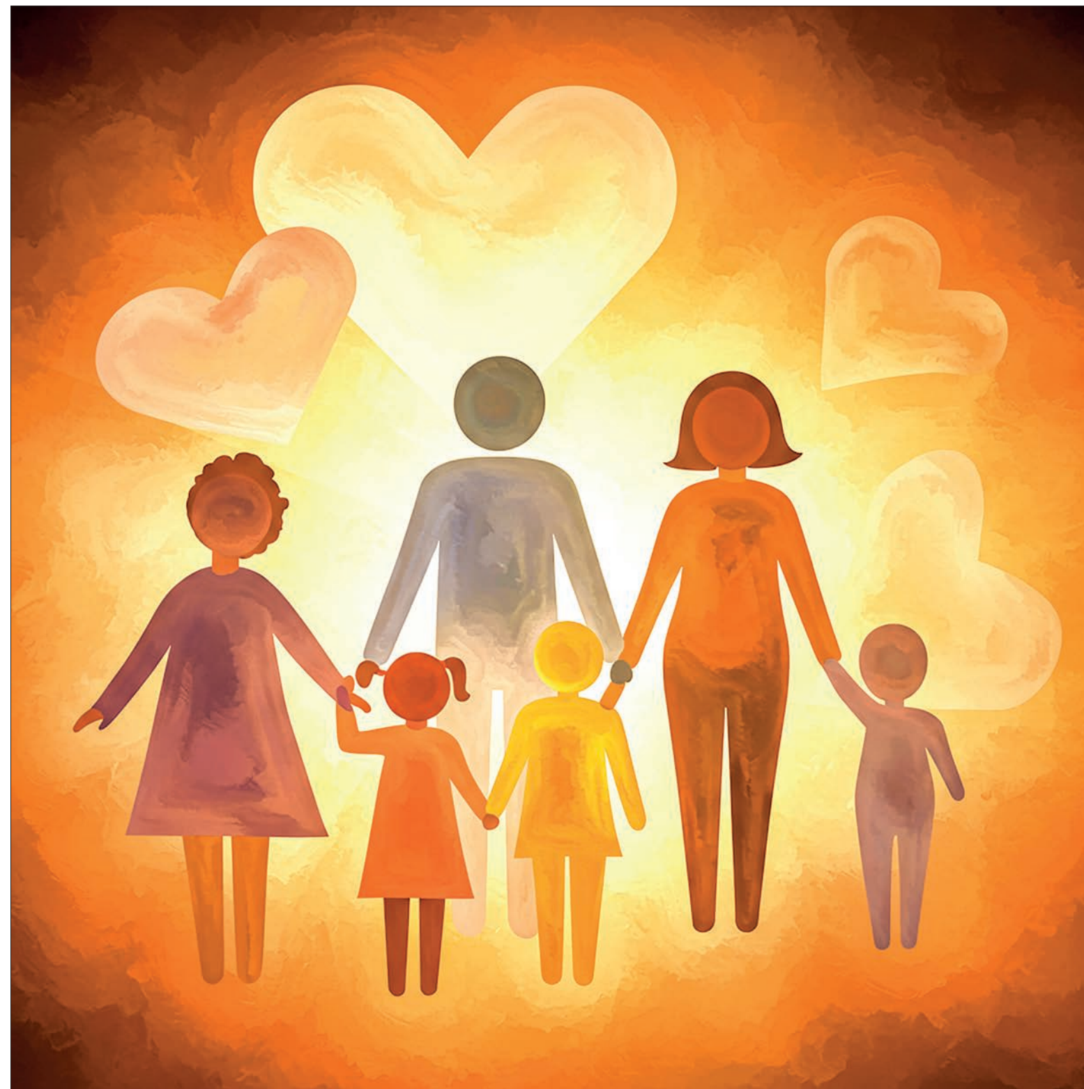
Children raised in loving environments are more likely to express love and affection towards others.