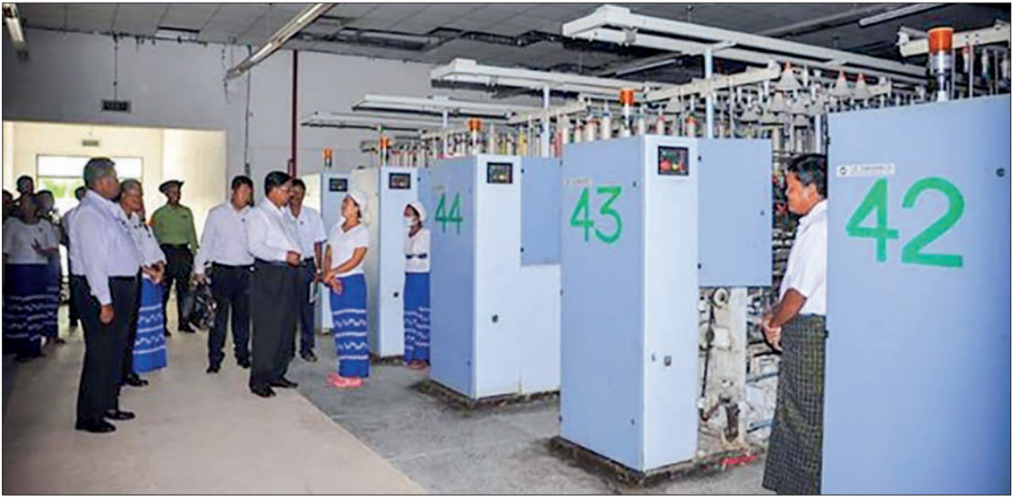
This photo showcases Union Minister for Industry Dr Charlie Than inspecting No 8 Garment Factory in Pyawbwe Township, Mandalay Region.

minimize losses from unforeseen natural disasters, systematically recording and conducting equipment repair work, emphasizing occupational safety during maintenance, continuously supervising and inspecting to prevent damage to fixed assets, and making concerted efforts to resume production at the factory as soon as possible.