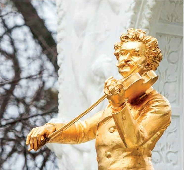
This year is the 200 th birthday of Austria’s world-famous waltz composer Johann Strauss II.