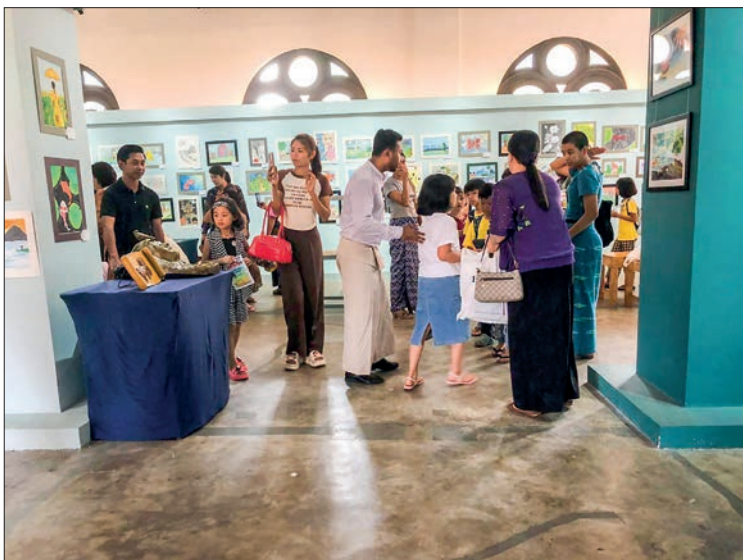
Private Fine Art Teaching group exhibition takes place at the Secretariat Yangon.

The collection features paintings in various sizes, including 24 by 24 inches, 36 by 24 inches, 18 by 24 inches, and 18 by 18 inches. — ASH/KZL