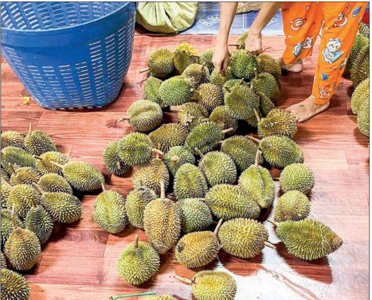
This photo showcases durian fruits from Ye Township, in the domestic market.

State, Shan State, and Taninthayi Region. “Last year, durian fruits didn't fetch good prices because the yield was high,” a durian grower from Ye Township said, adding that small durian fruits are fetching good prices this year. Durian fruits from Ye Township are primarily sold in the domestic market and are purchased not only for consumption but also for making jam. “Not many local fruits are exported overseas; most are sold domestically and supplied to Upper Myanmar,” he continued. The durian season in Myanmar occurs in May, June, and July, and the trees are now in full bloom. — MT/TH