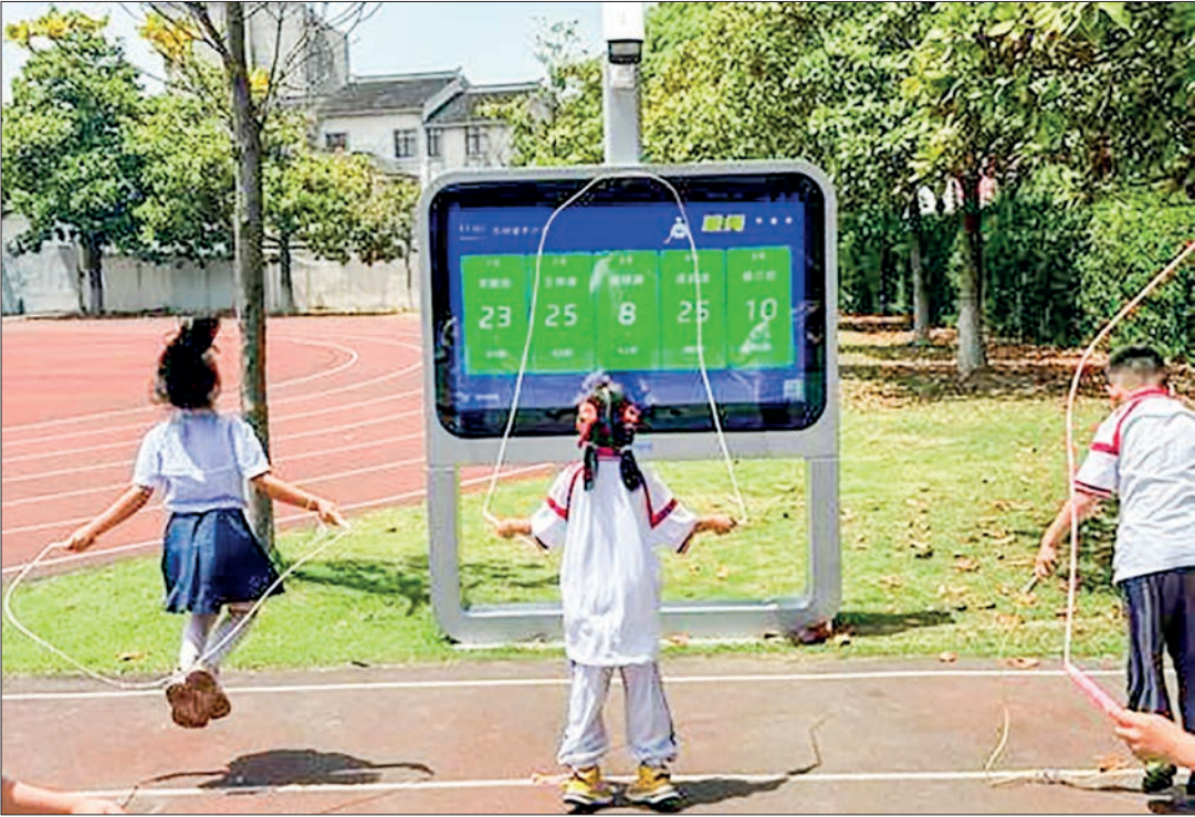
An AI-enabled screen updates a leaderboard in real time.

Their innovative routines have gone viral on social media, attracting significant attention.