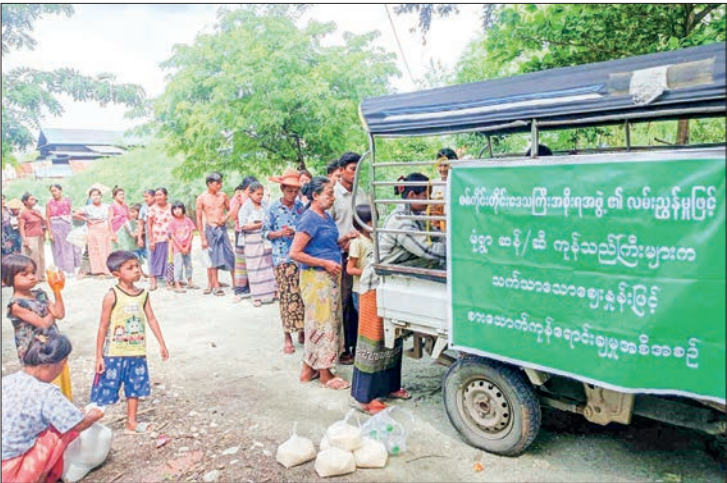
The photo shows a market truck selling foodstuffs at affordable prices to residents in Sagaing.

THE Ministry of Commerce and Sagaing Region government jointly arranged food trucks to sell basic foodstuffs, meat and eggs at fair prices at the quake-affected staff housing in Sagaing starting from 30 March, and yesterday marked 62 days of operation. Yesterday, mobile trucks sold the basic foodstuffs, including rice, cooking oil, salt, beans, dried fish, egg and noodles to the departmental staff in Sagaing. Daily sales will continue in the coming days. — MNA/KZL