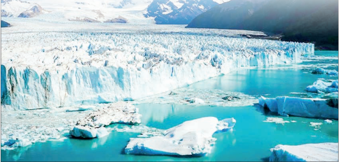
Glacier preservation efforts in 2025 focus on raising global awareness about the critical role of glaciers and the impacts of their melt, particularly in the context of climate change and water resources.

ference marked the launch of a new global initiative: the Dushanbe Process for Glacier Preservation. In his keynote speech, Rahmon said the outcomes of the conference, including the Dushanbe Declaration and the Dushanbe Glaciers Appeal, would serve as a foundation for coordinated international action on glacier preservation. — Xinhua