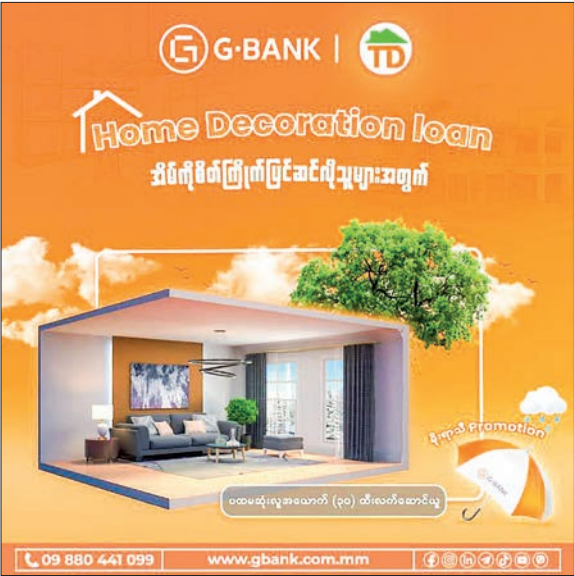
G Bank has offered low-interest home decoration loan.

THE Ministry of Commerce and Sagaing Region government jointly arranged food trucks to sell basic foodstuffs, meat and eggs at fair prices at the quake-affected staff housing in Sagaing starting from 30 March, and yesterday marked 62 days of operation. Yesterday, mobile trucks sold the basic foodstuffs, including rice, cooking oil, salt, beans, dried fish, egg and noodles to the departmental staff in Sagaing. Daily sales will continue in the coming days. — MNA/KZL