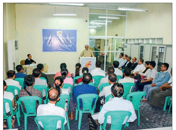
This photo showcases Chairman Dr Tin Tun Oo of the Myanmar Press Council speaking at graduation of journalism training course on 30 May.

The programme includes subjects such as basic journalism, journalism English, mass communication, online