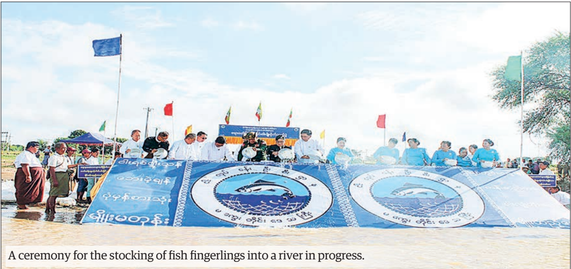
A ceremony for the stocking of fish fingerlings into a river in progress.

THE Department of Fisheries has announced plans to stock over 38 million fingerlings across Myanmar during the 2025-2026 financial year. The fingerlings will be released mainly into the country's major rivers — the Ayeyawady, Thanlwin, Chindwin, and Sitoung. In addition, stocking will take place in other rivers, streams, lakes, and natural ponds nationwide. The primary species to be introduced include rohu, catla, and mrigal carp. This nationwide stocking ini-