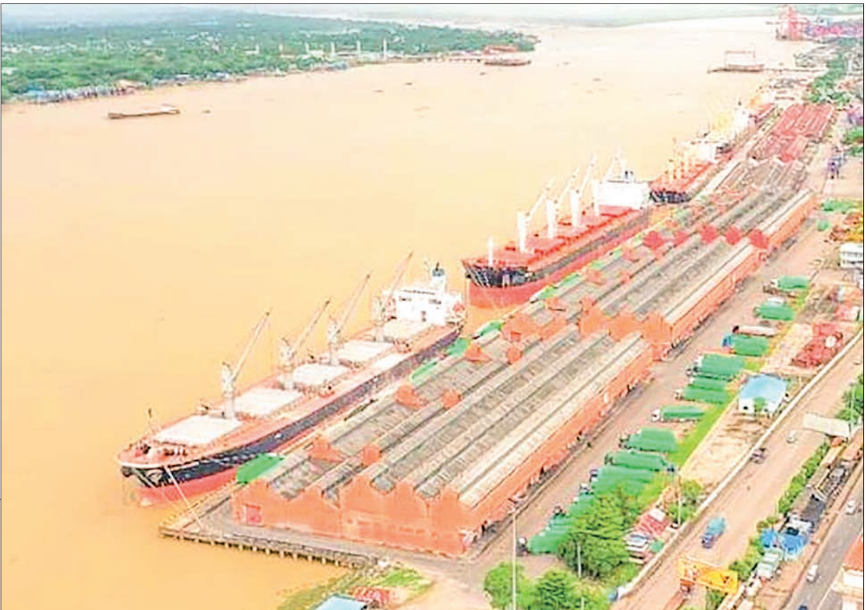
An aerial drone view of vessels in line at Yangon Port along the Yangon River.

MYANMA Insurance Training School will provide an insurance agent course (Batch 17) on 13 May to produce insurance advisor careers. The training school is making concerted efforts to help compensate for the loss of earthquake survivors. The school offers courses to produce insurance advisors to bridge the gap between insurance companies and policyholders. They will provide guidance and advice for investment in various insurance schemes, assist the customers by explaining the claim process and help them fill out the necessary forms. Those interested can apply to the school and enquire about details through the contact numbers 09 403891139 and email institute.mi05@gmail.com of the Myanma Insurance Training School located at No 627-635, Merchant Road, Yangon. — NN/KK