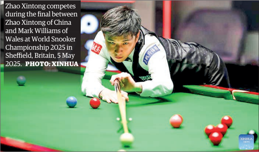
Zhao Xintong competes during the final between Zhao Xintong of China and Mark Williams of Wales at World Snooker Championship 2025 in Sheffield, Britain, 5 May 2025.

CHINA’S Zhao Xintong became the first Asian player to win the World Snooker Championship after beating veteran Mark Williams 18-12 on Monday. “I can’t believe it. It’s like a dream,”