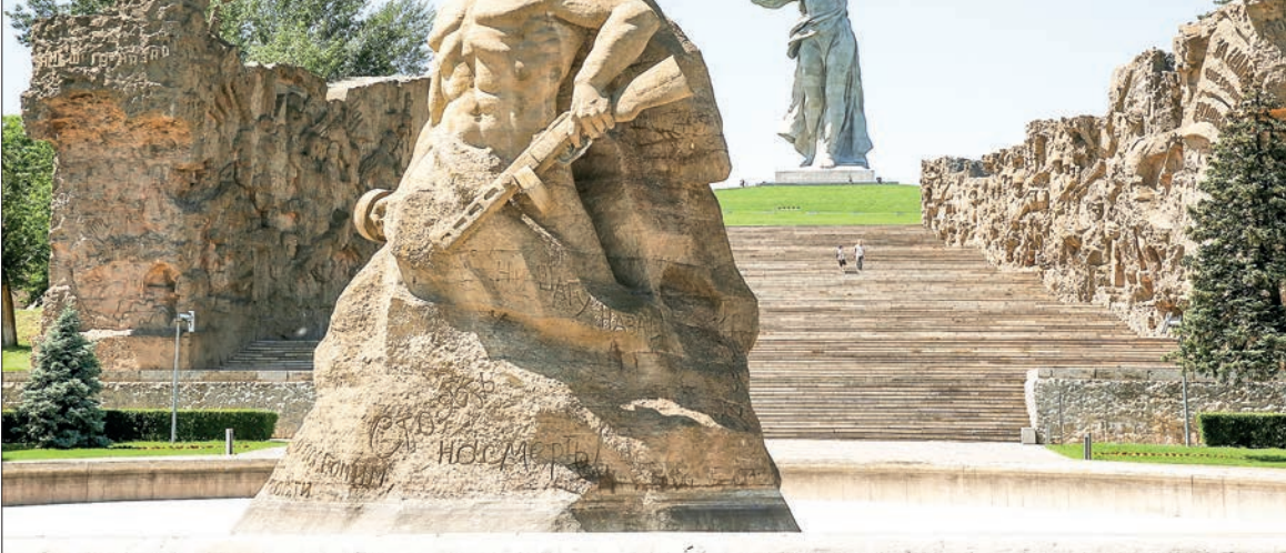
Despite all controversies in international relations, Russia has always advocated the establishment of an equal and indivisible security system, which is critically needed for the entire international community.

Attempts to glorify Nazism have become evident in many parts of Europe. In the Baltic