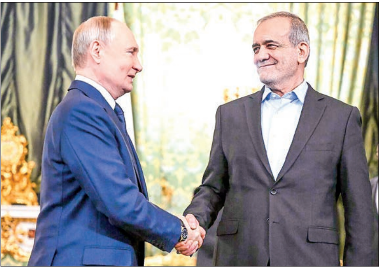
Russian President Vladimir Putin and Iranian President Masoud Pezeshkian shake hands before a meeting at the Kremlin in Moscow, Russia.

PEZESHKIAN cordially congratulated Putin and all Russian citizens on the 80 th anniversary of Victory Day. Russian President Vladimir Putin and Iranian President Masoud Pezeshkian have discussed the development of bilateral co-operation based on the comprehensive strategic partnership agreement, the Kremlin said on Tuesday. The leaders have also discussed the progress of the Oman-mediated negotiations between Iran and the United States on the Iranian nuclear programme, the statement said, adding that Putin confirmed Russia’s readiness to promote dialogue to achieve a fair agreement on the Iranian nuclear programme. Additionally, Putin expressed sincere condolences to Pezeshki-