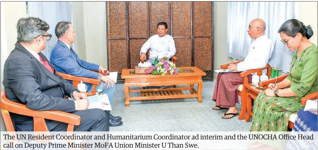
The UN Resident Coordinator and Humanitarian Coordinator ad interim and the UNOCHA Office Head call on Deputy Prime Minister MoFA Union Minister U Than Swe.