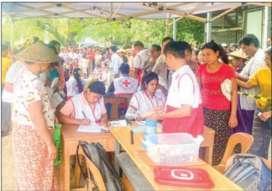
This photo captures an event where MRCS officials are providing cash assistance to households in earthquake-affected areas.

THE Myanmar Red Cross Society (MRCS) has been providing food, consumer goods, and cash to households in areas affected by the Mandalay earthquake since early May, according to the organization. A total of K50,000 per household was provided to families in areas affected by the earthquake. This included 296 households in Nyanatheik-di Ward of the Nay Pyi Taw Council Area, 320 earthquake-affected households in Wachet Village (Wachet Hsinphyushinhla), Kyaukta Village, and Taungnyo Ywathit Villages in Sagaing Township, Sagaing Region. Similar assistance was also extended to 31 households in Kyatmintoon Extension Ward, Myitta Chantha Temporary Camp, Kyaukse Township, Mandalay Region, and 248 households in Nampan Ward, Nandawun Ward, Mongthaukinn, Pepininn, and Thaleooinn Village in Nyaungshwe Township, Shan State (South), totalling 859 households. In addition, each household in the Mandalay earthquake-affected areas received food, kitchenware, tarpaulins, mosquito nets, and personal hygiene products for both women and men. The MRCS will continue providing food, consumer goods, and cash to households in the remaining areas affected by the earthquake. — ASH/TH