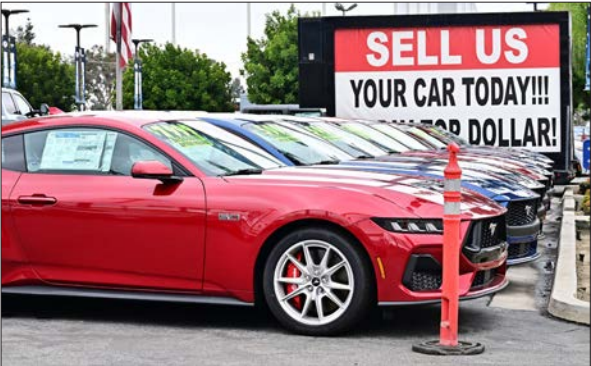
A Ford Mustang is seen at a used car dealership in Montebello, California, on 5 May 2025.

viously telegraphed due to slowed output at plants in Kentucky and Michigan where new vehicles are being launched. In March, Ford began shipping the new Ford Expedition and Lincoln Navigator to customers. Profits fell in Ford’s “Pro” division, which is geared towards fleet and sales to businesses, and in its “Blue” division, which consists of conventional internal combustion engine cars. But losses declined in Ford’s electric vehicle division. Ford described its underlying business as “strong”, saying it had been on track with the prior projection of between $7 and $8.5 billion in adjusted operating earnings, excluding tariff-related impacts. Ford’s measures to limit tariffs thus far include adjusting vehicle shipments from Mexico to Canada to avoid triggering US tariffs, said House. The company was also avoiding levies on parts that “merely pass through the US”. — AFP