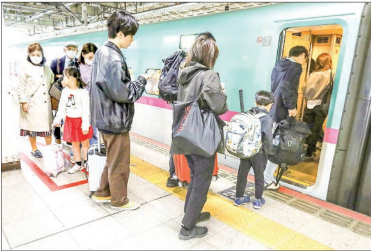
THE rush of travellers returning to Tokyo and other major cities peaked on Tuesday, the last day of the latter half of Japan's Golden Week holidays, with train stations and airports crowded

People board a shinkansen bullet train at JR Sendai Station in Sendai, northeastern Japan, on 6 May 2025.