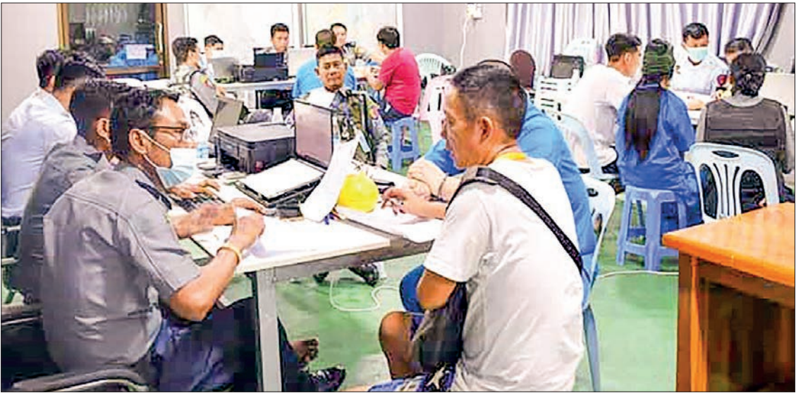
Immigration processes are underway for the deportation of undocumented entrants.

AUTHORITIES have deported 128 foreign nationals linked to telecom fraud cases, transferring them to their respective countries through the Myanmar-Thailand Friendship Bridge II, with 14 foreign nationals apprehended for further investigation. The deported individuals had illegally entered Myanmar via border routes, mainly through neighbouring countries, including Thailand. They were discovered operating online gambling and telecom fraud schemes in KK Park, Maetawthalay, and Kyaukkhat areas of Myawady Township, Kayin State. The deportees include 55 Chinese Taipei, 41 Ethiopians, 15 Sri Lankans, 12 Nepalese and five Sierra Leonean nationals. The deportation process was conducted in line with international humanitarian principles