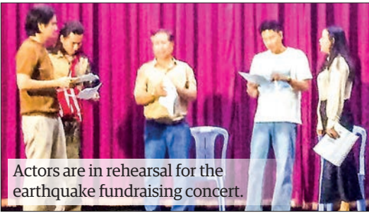
Actors are in rehearsal for the earthquake fundraising concert.

If people want to take a seat at a good location, tickets can be booked at the hotline numbers 09 880942792 and 09 880942793. — MT/ZS