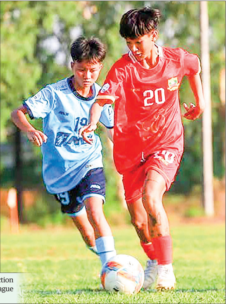
Shan United and YREO players in action during their Myanmar Women's League match.