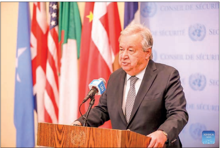
UN Secretary-General Antonio Guterres speaks to the press outside the Security Council Chamber at the UN headquarters in New York, on 5 May 2025. “Make no mistake: A military solution is no solution,” Guterres said on the tensions between India and Pakistan, at the press encounter on Monday.

Guterres once again strongly condemned the terror attack in Pahalgam on 22 April, and extended his condolences to the families of the victims. “Targeting civilians is unacceptable — and those responsible must be brought to justice through credible and lawful means,” he said. The UN chief stressed that it was essential, “especially at this critical hour, to avoid a military confrontation that could easily spin out of control,” and “now is the time for maximum restraint and