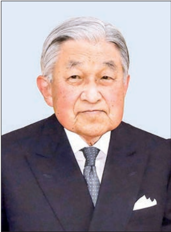
Former Emperor Akihito.

HUMANITY recorded an unexpected and “unsettling” slowdown in development in 2024 as the global post-pandemic recovery began losing steam, well before President Donald Trump dramatically cut US international aid, the UN warned Tuesday. The world had rebounded from the shock of the COVID-19 pandemic by 2023, as measured by the UN’s Human Development Index (HDI), which charts living standards, health and education. But that rebound appears to be losing momentum, according to the United Nations Development Programme’s annual report, released Tuesday. If that “unsettling” slowdown becomes the new normal, achieving levels of human development once hoped for by 2030 “could slip by decades — making our world less secure, more divided, and more vulnerable to economic and ecological shocks,” warned UNDP head Achim Steiner. Recent drastic cuts to international aid announced by several countries — most notably the United States, where Trump has slashed programmes and dismantled USAID, the country’s main foreign development arm — will exacerbate the issue, Steiner told AFP in an interview. If wealthy countries stop funding development, “this will ultimately impact economies, societies, and yes, I think it will also register maybe a year or two down the line in the Human Development Index, lower life expectancy, declining incomes, more conflicts,” Steiner said. — AFP