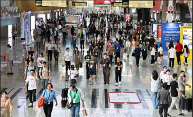
This photo shows a scene of the 137 th China Import and Export Fair in Guangzhou, south China’s Guangdong Province, 5 May 2025.

year on year and representing 64.9 per cent of all overseas buyers. The event also attracted over 527,000 online buyers from 229 countries and regions around the world. — Xinhua