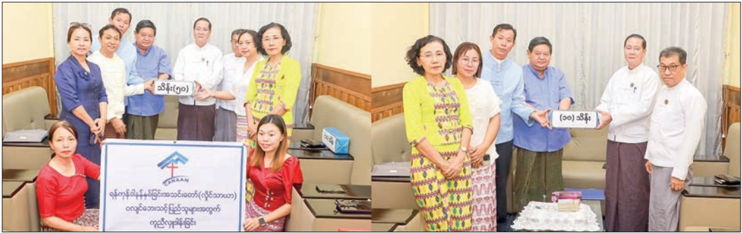
Deputy Minister U Soe Kyi accepts the donations from the Chinese Baptist Church and the Myanmar Council of Churches' Central Committee for Peace.

TO support the needs of earthquake-affected civil servants and to assist with rehabilitation efforts, the Yangon Canaan Chinese Baptist Church donated K5 million and 50 two-Pyi bags of rice. In addition, the Myanmar Council of Churches' Central Committee for Peace contributed K1 million. The donations were handed over yesterday afternoon at the office of the Disaster Management Centre (DMC), under the Ministry of Social Welfare, Relief and Resettlement. Deputy Minister U Soe Kyi of the Ministry of Social Welfare, Relief, and Resettlement accepted the donations, expressed words of thanks, and presented certificates of appreciation in return. — MNA/MKKS