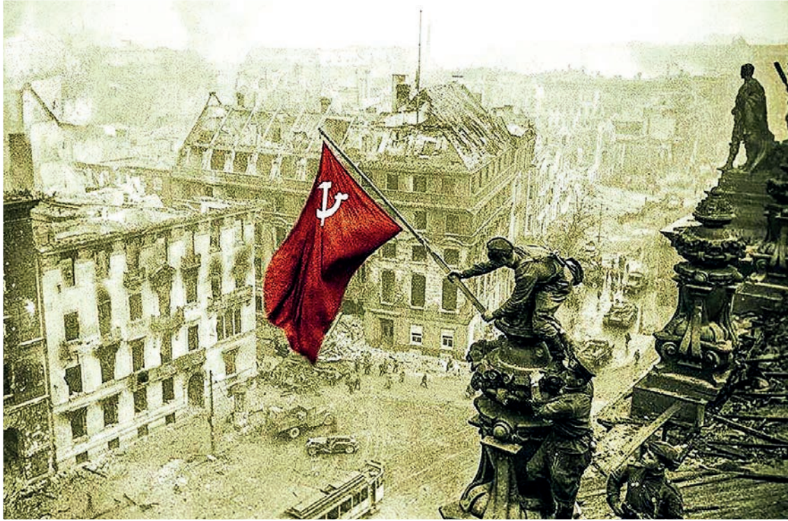
World War II ended eighty years ago, but we still hear its echo in ongoing major conflicts around the globe provoked by those who claim exceptionalism and superiority, not unlike Das Dritte Reich (the 3 rd Reich)'s Berlin.

The Great Victory gave a tremendous boost to national independence movements and launched the process of decolonization. Military victories of the Soviet Army on the European battlefield, enfeebling the Axis, stimulated the formation of the Anti-Fascist People's Freedom League in Myanmar (then Burma) in 1944 that unified all patriotic forces in the movement aimed at liberation from the Japanese occupation despite the