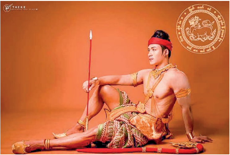
Prince Sudhanu’s usual costume style when he goes out hunting.

when they are out in the forest. He is holding bows and arrows, wearing a sash, a light headscarf, shoes and sandals,” he said. His re-making was aimed at reviving Myanmar’s mythical characters, and he was happy to find that young people have been recently interested in the clothing of ancient princes and court clothes. “Now, I see many people taking this kind of dress seriously and showing interest. Models are recreating the styles of ancient kings, princes and warlords and competing, and it’s great to see people interested. As people want to preserve their traditional heritage and wear it, I’m really happy,” he said.