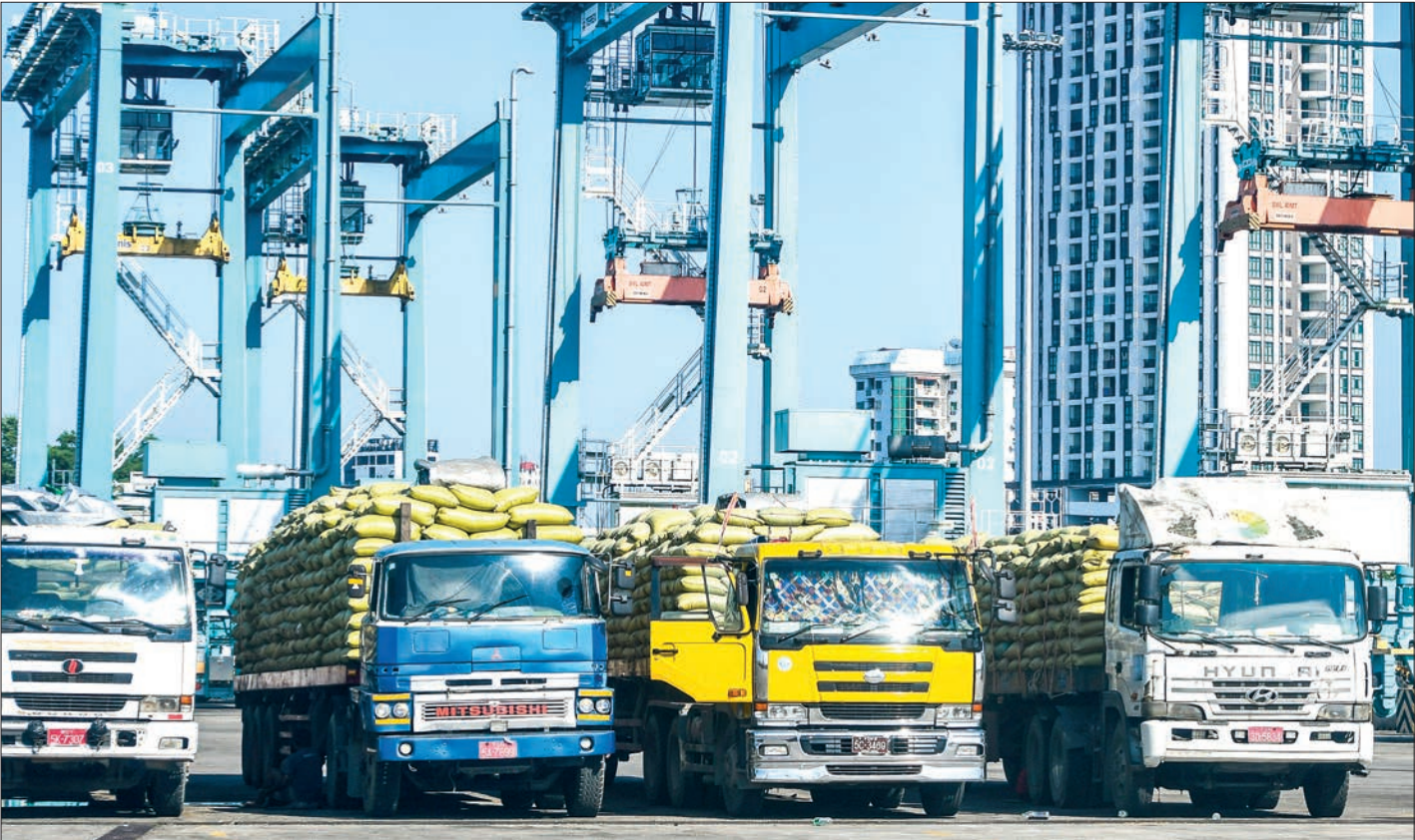
Lorries loaded with export cargo await transfer to overseas vessels at Yangon Port.

Mandalay's markets are bustling as international buyers, particularly from China and India, arrive to secure Myanmar's high-quality pulses.