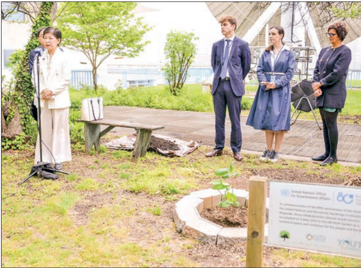
Izumi Nakamitsu (L), UN undersecretary-general for disarmament affairs, speaks at a ceremony to plant saplings grown from seeds that survived the 1945 atomic bombing of Hiroshima at the UN headquarters in New York on 5 May 2025.

TWO saplings from Hiroshima United Nations in New York as a symbol of global peacebuild-