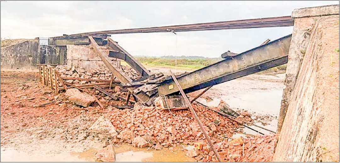
Terrorist mine blast cripples critical railway bridge between Hninpale-Taungsoon stations.

Office Mr Asad Cheng. Also, 14 more Chinese nationals were apprehended in Myawady's KK Park area yesterday for illegal entry and suspected involvement in online fraud. From 30 January to 6 May 2025, Myanmar authorities detained a total of 9,059 foreigners for illegal entry, with 7,713 already deported via Thailand. The remaining 1,346 are awaiting deportation and are currently under proper custody. The Myanmar government is taking firm action against individuals involved in online scams and gambling. Investigations are ongoing in cooperation with international organizations, particularly under the trilateral partnership between Myanmar, China and Thailand to dismantle such cross-border criminal networks. — MNA/KZL