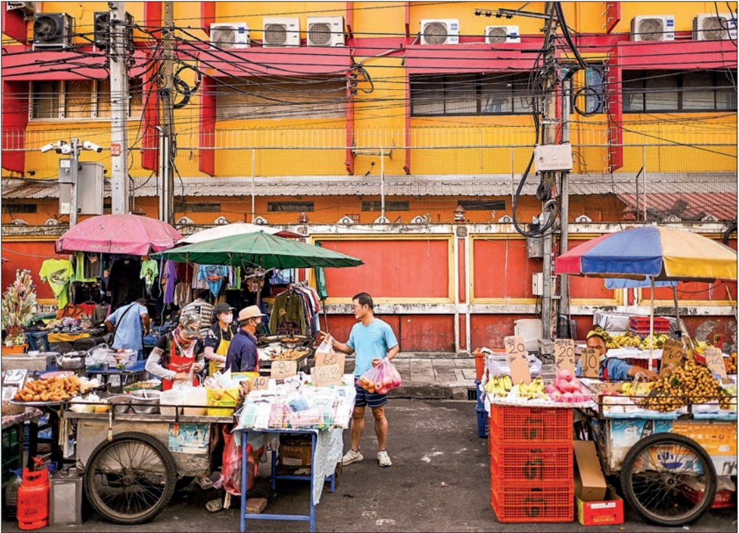
A man (C) buys food from a vendor at a morning market along a street in Bangkok on 22 January 2025.

He noted that headline inflation in May is expected to remain near the previous month's level, possibly declining for the second consecutive month, due to lower global crude oil prices, the government's measures to reduce living costs, and increased supply for fresh vegetables. — Xinhua