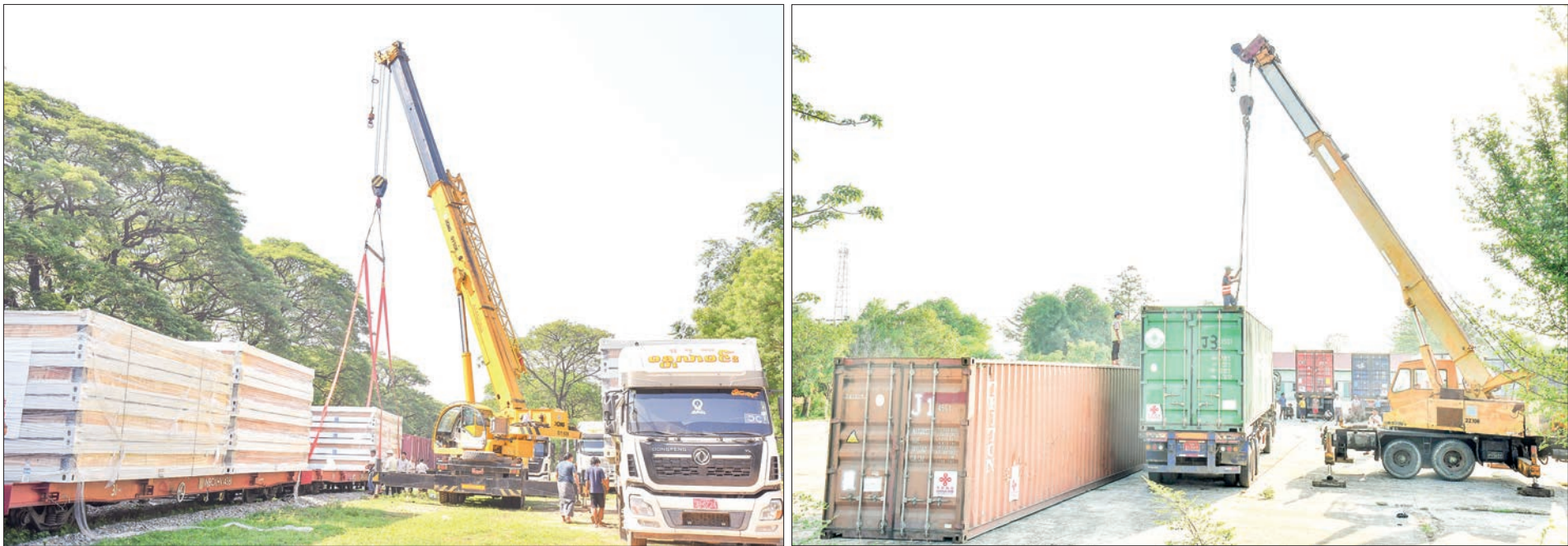
Aid in action: Chinese-prefabricated offices reach Ywataw Station (L) and Tabaung Ground (R), transported from Thilawa Port.

UNION Minister for Social Welfare, Relief and Resettlement Dr Soe Win, who is also the Second Vice-Chair of the National Disaster Management Committee, inspected the arrival of 108 modular (prefabricated) offices from Thilawa Port to Ywataw railway station yesterday. The Union minister checked the condition of modular (prefabricated) offices being systematically loaded onto trucks using cranes and distribution processes to the relevant ministerial offices. Union Minister Dr Soe Win also inspected the placement of container boxes, which include furniture and equipment to be used in the temporary office rooms transported by 16 trucks from the Thilawa Port, at the Taboung ground in front of the Uppatasanti Pagoda. Among these items, 25 modular (prefabricated) offices were distributed to the Union Supreme Court, five to the Constitutional Tribunal of the Union, 30 to the Ministry of Foreign Affairs and 44 to the Ministry of Natural Resources and Environmental Conservation. — MNA/KTZH