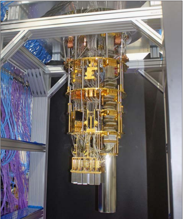
A newly developed quantum computer is unveiled to the press in Wako, Saitama Prefecture, on 22 April 2025.

tional Business Machines Corp says on its website. Challenges that might take a classical computer thousands of years to complete might be reduced to a matter of minutes, according to IBM. Competition over development is intensifying among countries, as quantum computing is expected to be used for a wide range of applications in the financial, pharmaceutical and other sectors. — Kyodo