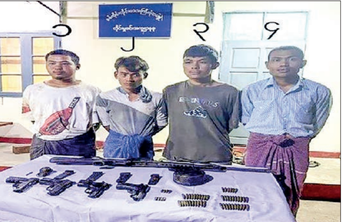
Photos reveal offenders alongside seized weapons and related items.