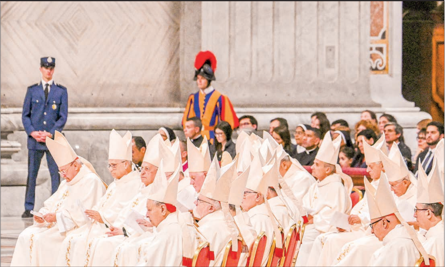
Cardinals (Bottom) attend the Ninth Novemdiale mass at St Peter's Basilica in The Vatican, on 4 May 2025.

Representing 70 countries across five continents, the group is the largest and the most international ever, and many of the cardinals do not know each other.