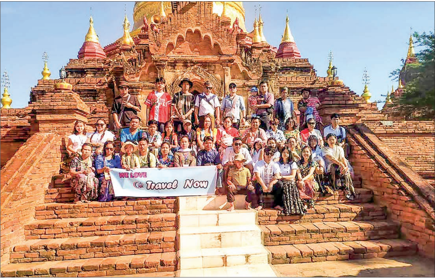
Photo displays tourists on the Bagan-Popa trip.

ior General. During the visit, she will talk with the Chairwoman of the Federation Council of the Federal Assembly of the Russian Federation. On the goodwill trip, State Administration Council members, Union ministers and senior officers will accompany the Senior General and his wife. — MNA/TTA