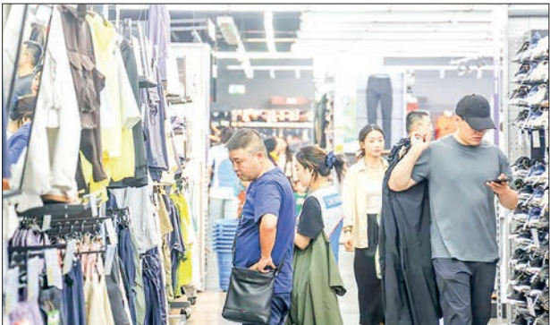
People select goods at a Decathlon store on Nanbin Road, Nan'an District, southwest China's Chongqing, 19 April 2025.

In 2025, the country pledged to intensify counter-cyclical adjustments, raising the deficit-to-GDP ratio to four per cent and setting the government