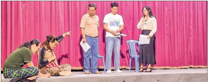
Rehearsals in progress at the Myanmar Motion Pictures Organization Hall on 4 May.

ON 5 May, a 4.8 magnitude earthquake hit centring Myanmar, and Thailand felt it, according to the Nation. The quake at a depth of 16 kilometres struck near Thawaddi village in Sagaing Region’s KhinU Township in Shwebo District on 5 May morning, said the earthquake observation section under the Thai Meteorological Department. The epicentre is near the Thailand border and at 22.387 degrees North and 96.284 degrees East inside Myanmar, and aftershocks from 1.9 to 3.0 magnitude were also recorded from yesterday morning to noon at similar locations and most centred in Myanmar and felt in Thailand’s Chiang Rai District. — Htun Htun/ZS