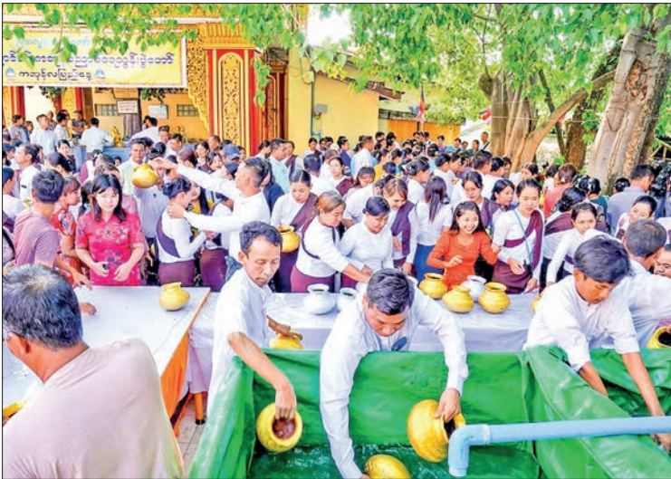
The Kason water pouring festival in the previous year.

sharing in the China-Myanmar “Belt and Road” development for mutual benefit, aiming to achieve equality, mutual interest, and success. The Lancang-Mekong Cooperation Special Fund has supported more than 110 “small but good” projects. China-Myanmar cooperation has contributed to Myanmar’s job creation, uplifting people’s livelihoods and economic development, she stated. Diplomatic relations between the Republic of the Union of Myanmar and the People’s Republic of China were established on 8 June 1950, and 8 June this year marks the auspicious 75 th anniversary of diplomatic relations.