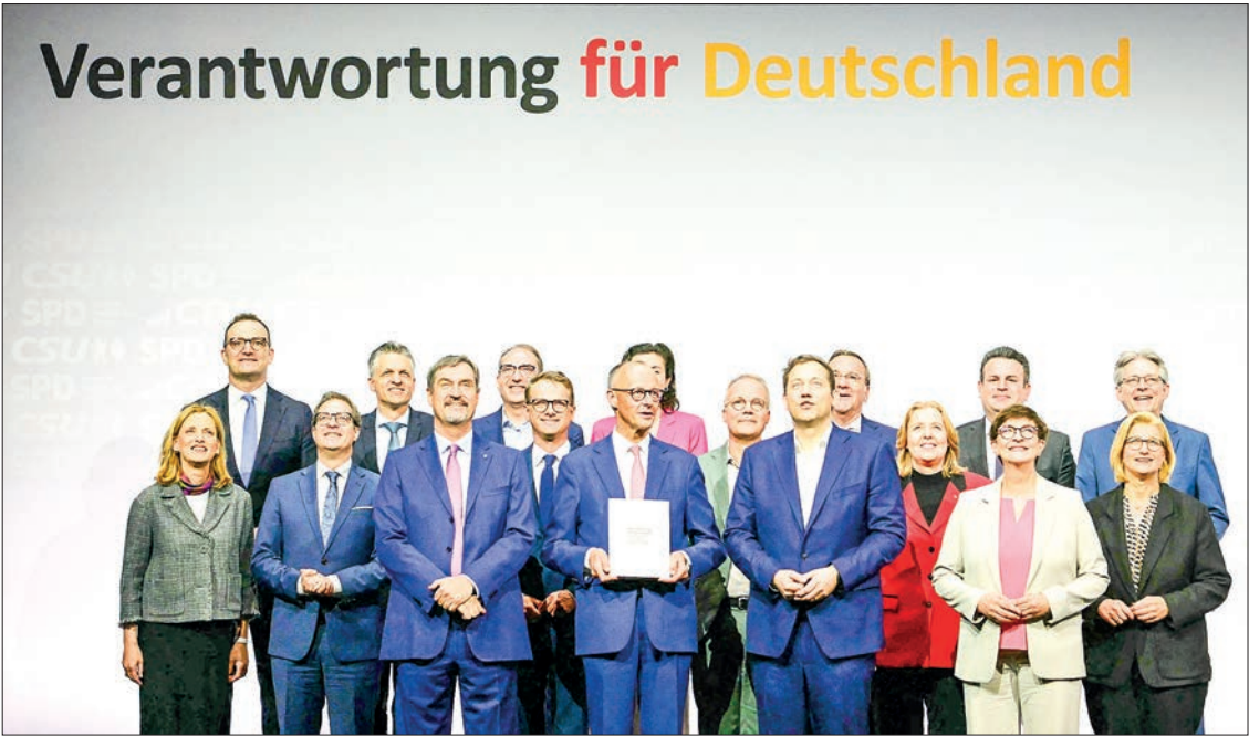
The leader of Germany's conservative Christian Democratic Union (CDU) party Friedrich Merz (C), the co-chairman of Germany's Social Democratic Party (SPD) Lars Klingbeil (C-R) and the leader of Bavaria's conservative Christian Social Union (CSU) party Markus Soeder (C-L) pose with members of the new cabinet and party officials after signing a coalition deal to form the country's new government, on 5 May 2025 in Berlin.

According to SPD's announcement of key positions