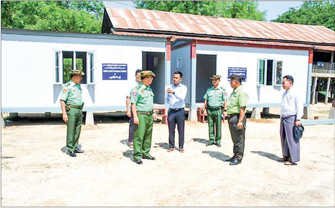
Recovery efforts intensified in Sagaing, Mandalay, and Kyaukse under Tatmadaw's senior officers.