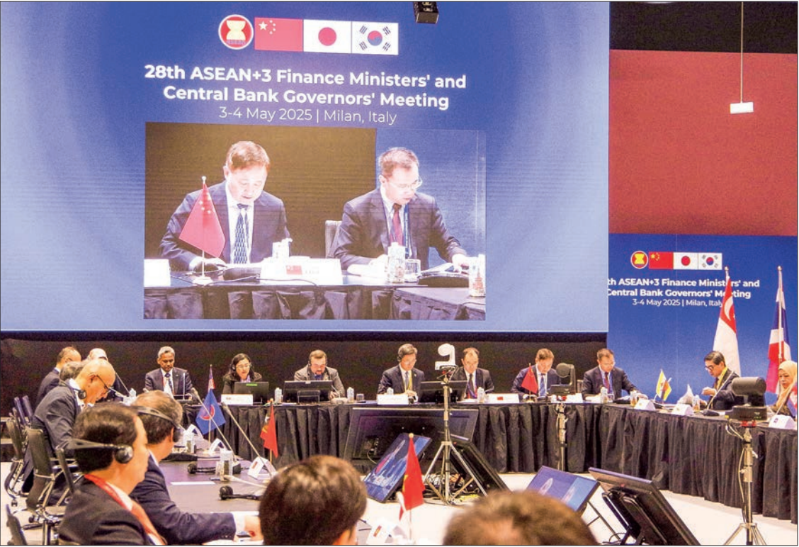
Finance ministers and central bank governors of the Association of Southeast Asian Nations plus China, Japan, and South Korea hold a meeting in Milan on 4 May 2025.

ASEAN members Cambodia and Vietnam are facing hefty US levies of 49 per cent and 46 per cent, respectively, although Trump later announced a 90-day pause for most countries except China. Trump imposed tariffs of 24 per cent on imports from Japan, including a baseline levy of 10 per cent that remains in place as negotiations continue.