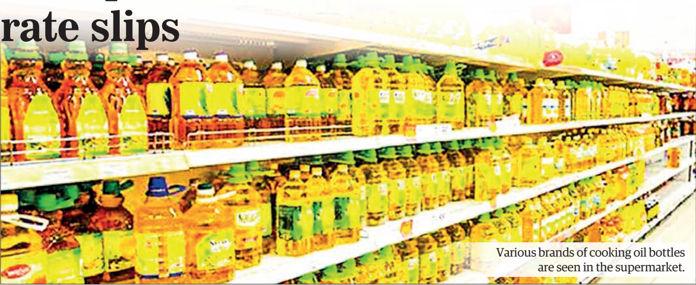
Various brands of cooking oil bottles are seen in the supermarket.

THE wholesale reference rate of palm oil set for the Yangon market decreased to K6,700 per viss for the week ending 11 May from K6,735 per viss in the previous week (28 April to 4 May), according to the Supervisory Committee on Edible Oil Import and Distribution.