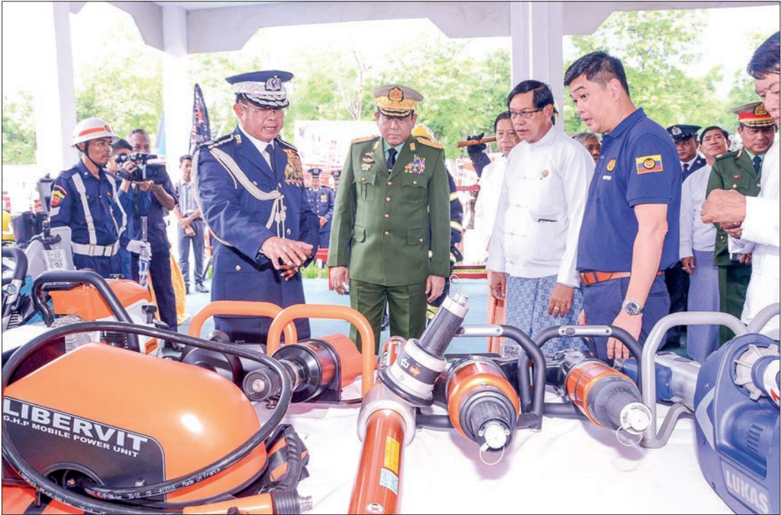
Union Minister Lt-Gen Tun Tun Naung views the display at the 79 th Fire Brigade Day celebration yesterday.

The Fire Brigade must be strengthened through manpower, equipment, and technology to transform both in form and essence and effectively meet future challenges. This remarkable achievement reflects the Myanmar Fire Services Department’s ability to operate at an inter-