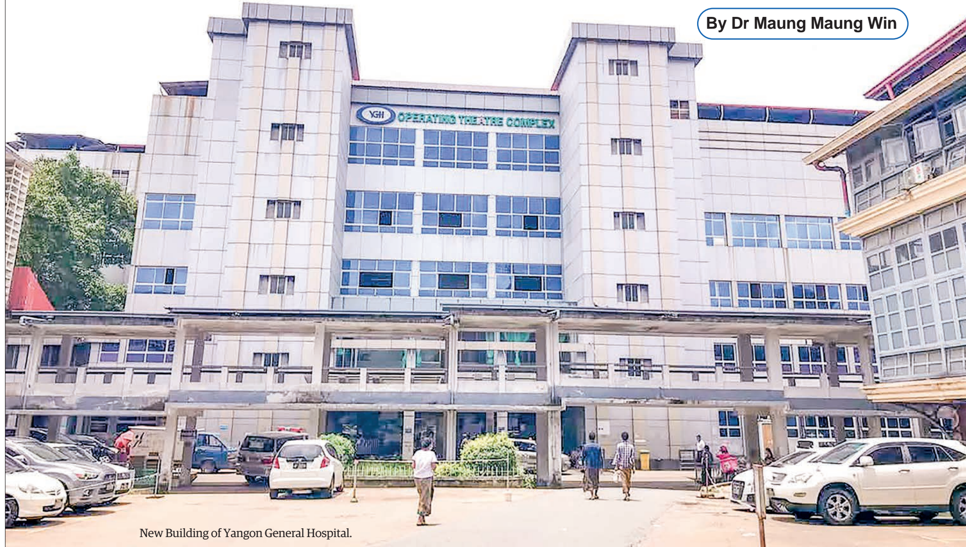
New Building of Yangon General Hospital.

to get the investigations and provide a diagnosis. They will, then, recommend patients a treatment plan and give them advice on how to manage their existing conditions and prevent future health problems. But, if required, they may refer patients to appropriate specialists based on their medical conditions. Alternatively, patients can directly book an appointment with specialists. In specialized consultation, specialists are inclined to pry a detailed history out of patients and go deeper in examining them by performing specialized tests and techniques. Patients will be recommended for advanced diagnostic tests like blood tests, biopsies, echocardiograms, stress tests, CT, MRI or other imaging for a confirmed diagnosis. These investigations are usually conducted within the OPD or at the associated facilities. Then, a treatment tailored to the diagnosis will be provided. Patients can purchase medicines from the on-site pharmacy or external medical