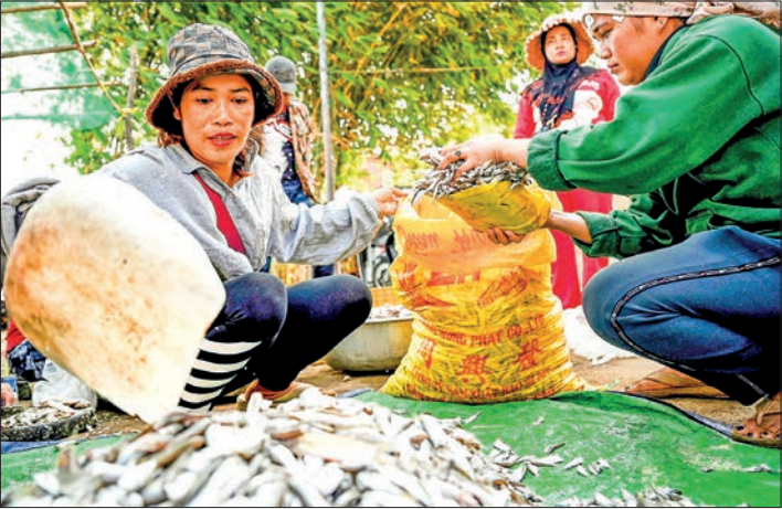
A vendor loads fish into a bag to be made as ‘prahok’ (fermented fish paste) at Chrang Chamres village along the Tonle Sap river in Phnom Penh on 6 January 2025.

Türkiye has been grappling with rising inflation for years. The annual inflation rate slowed to 38.1 per cent in March, marking its lowest since December 2021. — Xinhua