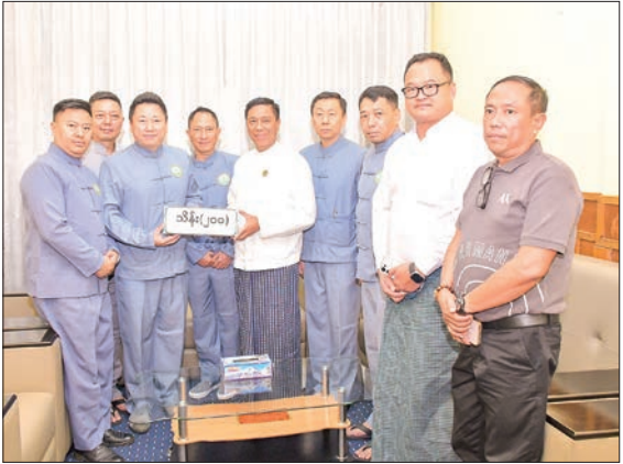
Union Minister Dr Soe Win accepts cash donations yesterday.

Union Minister Dr Soe Win accepted the cash donation and gave the certificate of honour in return.