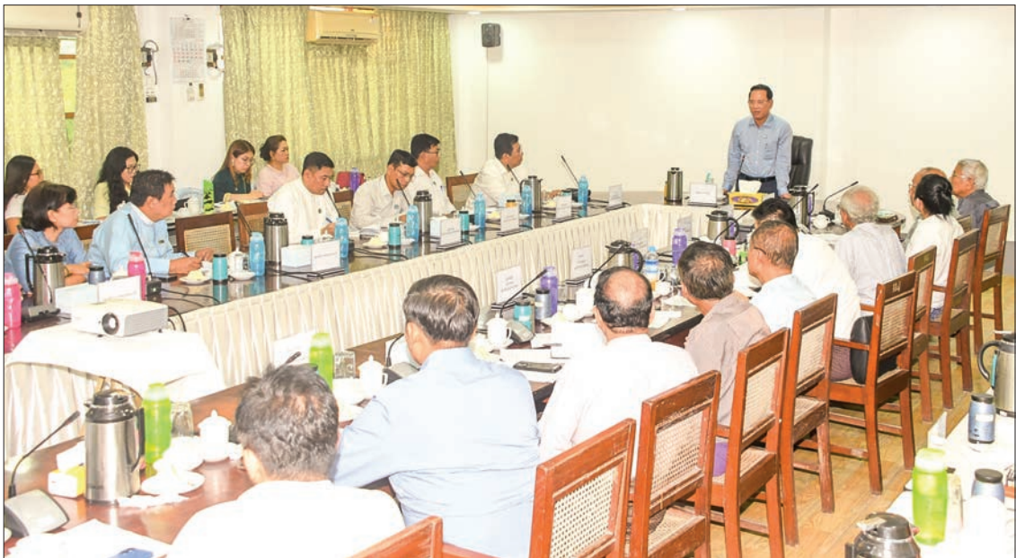
Union Minister U Maung Maung Ohn presides over the coordination meeting for the fundraising show for quake survivors.

UNION Minister for Information U Maung Maung Ohn attended a work coordination meeting on holding of a fundraising variety show for the victims of the Mandalay earthquake yesterday. In his speech, the Union minister said that currently, efforts are underway to clear debris and carry out rehabilitation activities in the quake-affected areas. Therefore, the artistes should make efforts to uplift and support the people who have been affected by the quake. The Head of State has also instructed that the buildings must be constructed to withstand earthquakes, to prevent such severe impacts from oc-