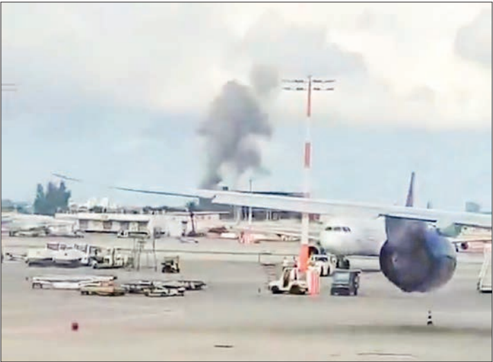
This video grab shows smoke rising after a missile hit Ben Gurion Airport in Tel Aviv, Israel, 4 May 2025.

claimed responsibility for a missile attack that hit a driveway leading to the main terminal of Ben Gurion Airport, Israel's main international airport.