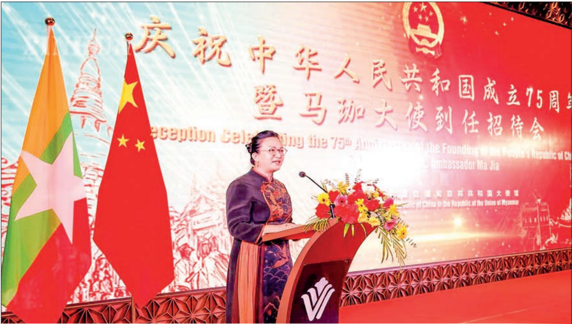
Caption: The welcome ceremony for Ambassador Ms Ma Jia and the 75 th anniversary of the founding of the People’s Republic of China in Yangon on 27 September 2024.

NO matter how the situation changes, China’s policy towards Myanmar for peace, stability and sustainable development will never change, said Ms Ma Jia, Chinese Ambassador to Myanmar, in a state-media article. The ambassador made the remarks in state-run newspapers in Myanmar on 5 May. China respects Myanmar’s sovereignty and territorial integrity, supports Myanmar’s development path in line with its conditions, and has actively assisted Myanmar in promoting the peace process in northern Myanmar based on the wishes and demands of various parties. China always focuses on consultation, cooperation, and