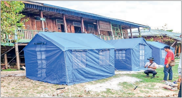
Photos (above and below) show relief supplies being distributed to earthquake survivors in Nay Pyi Taw Council Area, Mandalay Region, Shan State, and Sagaing Region.