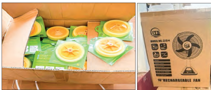
Confiscated illegal items in Shan State.

On 2 May, combined teams supervised by the Shan State Illegal Trade Eradication Task Force conducted inspections at various locations. Authorities discovered 51 types of consumer goods without customs clearance near Muse Township's Sinphyu checkpoint, with an estimated value of K8.275 million. In Hopong Township of the Pa-O Self-Administered Zone, inspections on 11 vehicles travelling from Tachilek to Taunggyi led to the seizure of 41 types of consumer goods, four types of industrial materials, and five types of food products. These items had no legal documentation and were valued at approximately K485.908 million. The vehicles involved—five Mitsubishi Fuso trucks, four Nissan Diesel trucks, one Hino Profia truck and one Shwe Chan truck—were valued at K550 million. The total estimated value