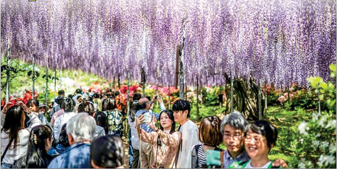
Traditionally, Golden Week gives Japanese workers one of their longest breaks in the year, with many taking the opportunity to see other parts of Japan.