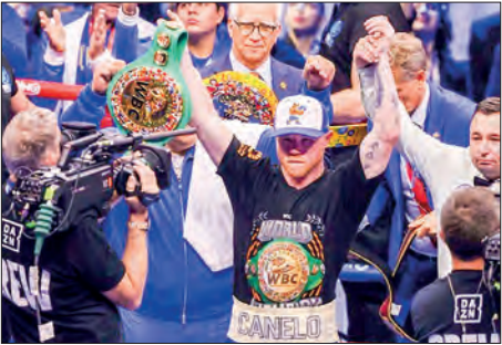
Mexico's Canelo Alvarez celebrates after unifying the super middleweight titles against Cuba's William Scull.