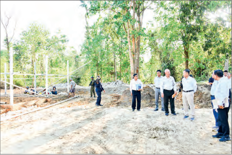
Vice-Senior General Soe Win inspects sites chosen for construction of bashas as temporary accommodation for staff members and families of the Constitutional Tribunal of the Union.

Union Minister for Commerce U Tun Ohn reported to the Vice-Senior General on completion of temporary staff housings, ongoing projects and relocation of staff and their fam-