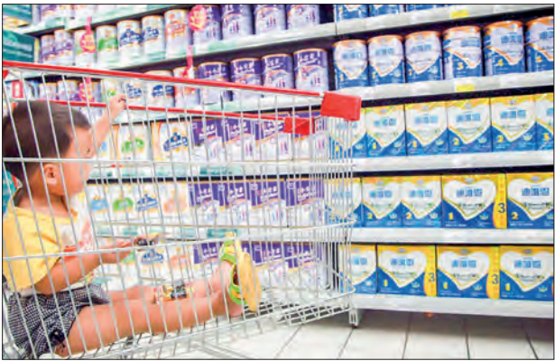
Dairy prices climbed by 2.4 per cent month-on-month and meat prices jumped 3.2 per cent.

GLOBAL food prices edged higher in April, driven in part by new import tariff policies in the United States, the United Nations Food and Agriculture Organization (FAO) reported Friday. According to FAO, prices increased for grains and cereals, dairy products, and meat, pushing its benchmark Food Price Index up by 1 per