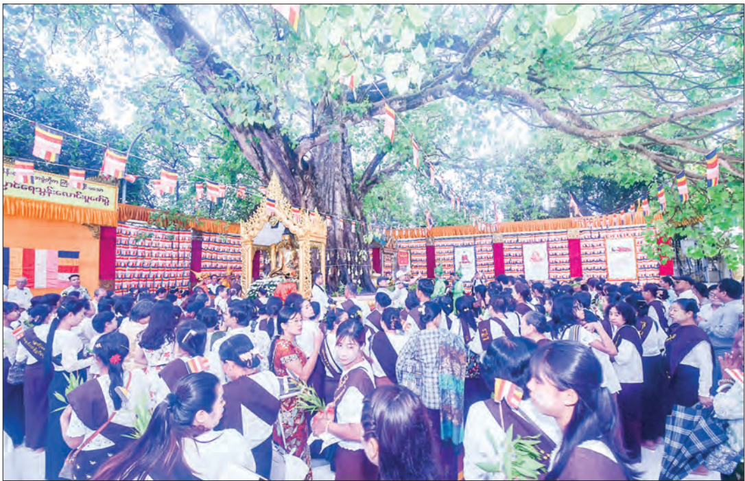
Devotees are seen pouring water onto the Maha Bodhi tree at the Shwedagon Pagoda in the previous year.

(Excerpt from the speech given by Chairman of the State Administration Council Prime Minister Senior General Min Aung Hlaing at the ceremony of presenting awards to outstanding students who passed the matriculation examination 2024 with distinctions in all subjects on 22 July 2024)