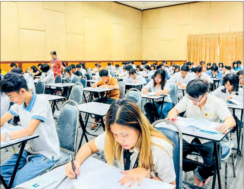
Candidates take ITPEC exam.

THE Information Technology Professionals Examination Council (ITPEC) exams, recognized by seven countries, were held simultaneously on 27 April in Yangon Region, Mandalay Region, Magway Region and Kayin State. These exams were organized by the Myanmar Computer Professionals Association under the leadership of the Myanmar Computer Federation to promote development in information and communication technology. A total of 370 candidates sat for the Information Technology Passport Examination (IT Passport), while 763 candidates took part in the Fundamental Information Technology Engineer Examination (FE). ITPEC exams are held twice a year, and the October 2024 session saw 733 individuals pass nation-