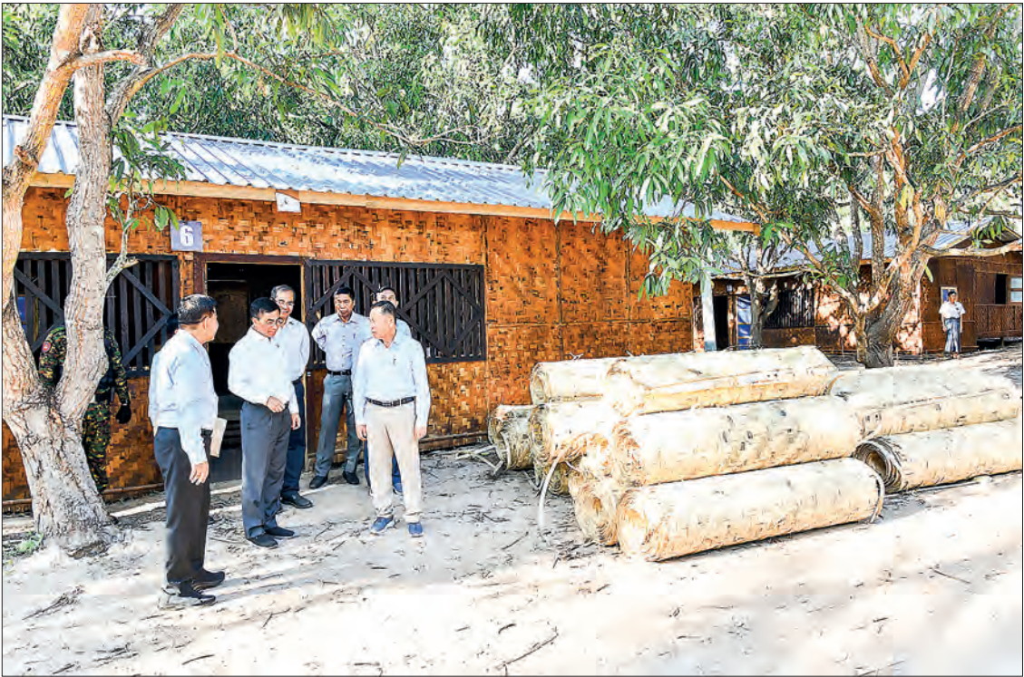
Vice-Chairman of the State Administration Council Deputy Prime Minister Vice-Senior General Soe Win observes the temporary staff housing of the Ministry of Labour in Nay Pyi Taw yesterday.

At the Ministry of Natural Resources and Environmental Conservation, Union Minister U Khin Maung Yi reported to the Vice-Senior General on construction of the temporary staff housing on a 22-acre land and the plot chosen for construction of the modular house. The Vice-Senior General inspected relocation of staff and their fam-