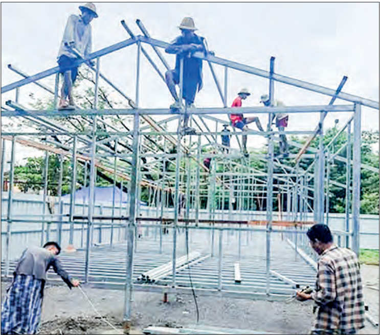
This photo captures a site where Myanmar Muslim Aid (MMAID) is building temporary shelters for people affected by the Mandalay earthquake.

Local committees will screen and approve families truly in need of housing to live in the temporary shelters. Currently, approximately 60 workers are working tirelessly to construct the shelters for those affected by the Mandalay earthquake, ensuring they can move in as soon as possible. — ASH/TH