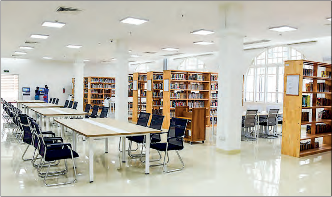
National Library of Myanmar (Yangon)