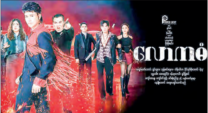
Poster for Lawkadan.