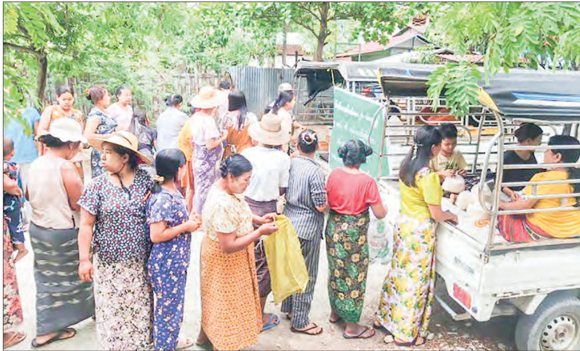
Photo shows market truck selling foodstuffs at affordable prices to residents in quake-affected areas.

Since 30 March 2025, trucks have been visiting several locations including the Yezin University of Agriculture, Nay Pyi Taw Railway Station, the staff housing of Locomotive Shed, Nursing Training School, Ottarathiri Hospital Staff Housing, Padauk Housing, Gangaw Housing, res-