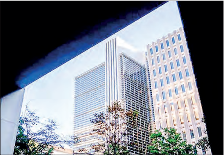
An Indian delegation will present the SVAMITVA Scheme and Gram Manchitra platform at the World Bank Land Conference 2025 from May 5-8 in Washington, DC.

international forum on land governance. This year's World Bank Land Conference, themed "Securing Land Tenure and Access for Climate Action: Moving from Awareness to Action", will bring together global leaders, policymakers, experts and development partners to explore strategies for securing land tenure, modernising land administration