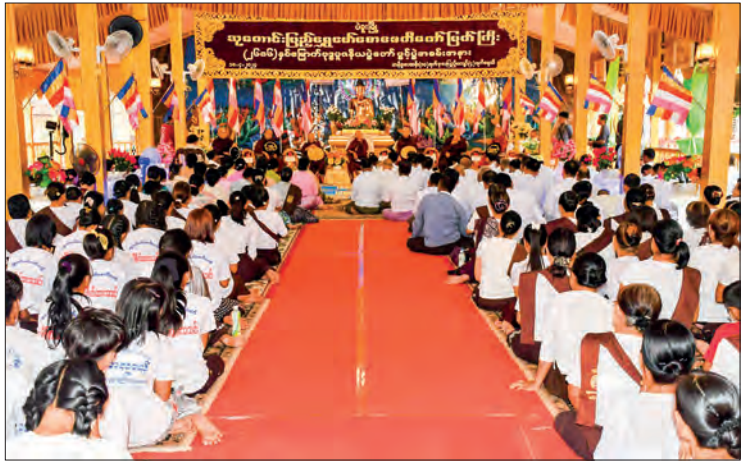
The Shwemawdaw Pagoda’s sacred Buddha Day celebration and banyan water-pouring ceremony held in previous year.