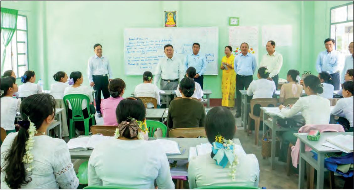
Union Minister for Education Dr Nyunt Pe meets teachers from high schools and private schools at Training of Trainers (TOT) sessions for high school teachers preparing to teach students retaking the 2025 matriculation examination, yesterday.

At No 5 BEHS in Zabuthiri Township, the Union minister observed university professors and teachers conducting lessons. He stated that the matriculation examination, as the final stage of basic education, determines students' life goals, and the purpose of the re-examination of the matriculation exam is to ensure fairness, dignity, and job opportunities by