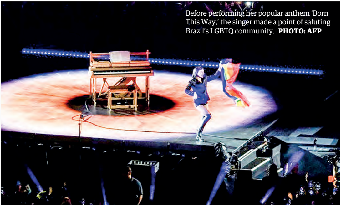
Before performing her popular anthem 'Born This Way,' the singer made a point of saluting Brazil's LGBTQ community.

The concert exceeded initial attendance estimates of 1.6 million, boosting the local economy by $100 million.