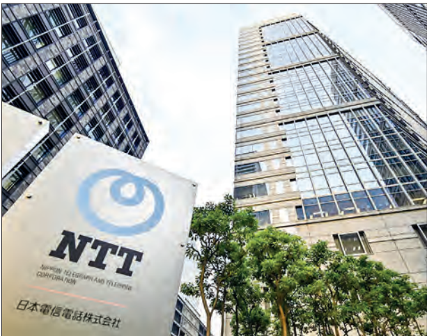
File photo taken on 7 June 2021, shows a building that houses the headquarters of Nippon Telegraph and Telephone Corp in Tokyo.

between mid-March and early April, also found concerns about potential biases in AI-based assessments and doubts over the technology's ability to accurately evaluate student abilities. Some also said relying on AI that is trained on a company's own hiring data could "undermine diversity," while others placed importance on direct communication between recruiters and candidates. Among companies