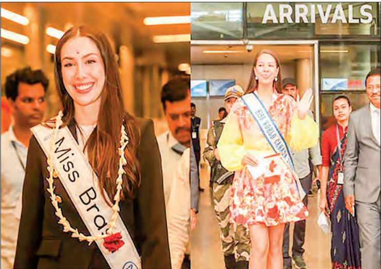
Both beauty queens were warmly welcomed by Telangana state government officials at Rajiv Gandhi International Airport (RGIA) with the traditional hospitality the region is known for.

The young beauty queen from Kota, Rajasthan, is focused on delivering her best performance at the competition. — ANI