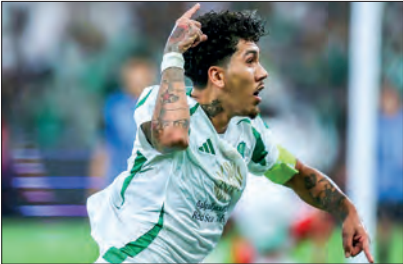
Al Ahli's Roberto Firmino celebrates during the AFC Champions League final against Kawasaki Frontale.

ROBERTO Firmino said he was proud of making history with his Saudi club and becoming an Asian Champions League winner; six years after lifting the prestigious European equivalent with Liverpool.