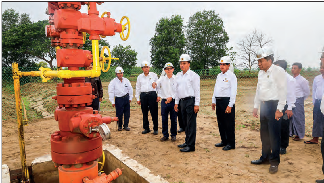
Electricity and Energy Development Commission Chair State Administration Council Member Deputy Prime Minister Union Minister Admiral Tin Aung San inspects production of Well No 56 in Aphyauk Natural Gas Field in Taikkyi Township, Yangon Region on 3 May.

The Commission Chair made the remarks during his visit to the Myanma Oil & Gas Enterprise (MOGE)'s Aphyauk Natural Gas Field in Taikkyi Township, Yangon Region on 3 May, and the Maubin (South) Oil and Natural Gas Field in Maubin Township, Ayeyawady Region, to inspect the progress of oil and gas production and the ongoing 2D seismic survey for oil and gas exploration in the Sapag-