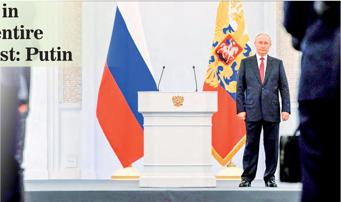
Russian President Vladimir Putin stated that Russia did not start its military operation in Ukraine earlier because it believed in the possibility of a peaceful resolution through the Minsk agreements.