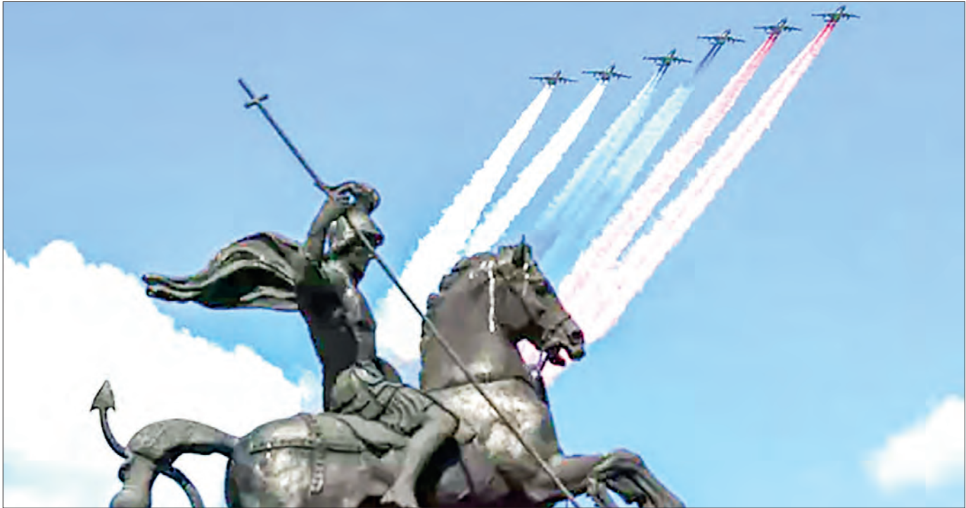
Sukhoi Su-25 close air support jets fly over Red Square in Moscow during the military parade to commemorate the 75 th anniversary of Victory in World War II.

CHINESE President Xi Jinping will pay a state visit to Russia from 7 to 10 May and attend the celebrations marking the 80 th anniversary of the Victory in the Great Patriotic War in Moscow, at the invitation of President Vladimir Putin of the Russian Federation, a foreign ministry spokesperson said on Sunday. — Xinhua