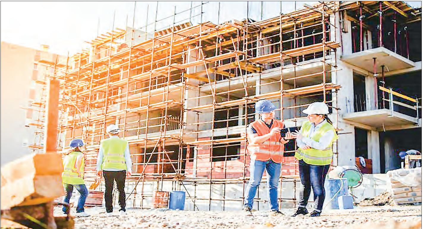
This photo shows ongoing construction project.

90 teachers to teach students from Sagaing who will retake matriculation exam