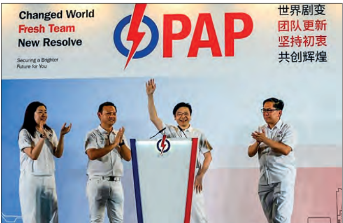
Singapore Prime Minister Lawrence Wong of the People's Action Party (PAP) waves to supporters as he celebrates a resounding election victory.

The PAP, the ruling party since Singapore's independence in 1965, was widely expected to win again. Much of the focus was on the margin of victory, following a decline in the PAP's vote share from 69.86 per cent in 2015 to its lower share in the previous election. — Xinhua