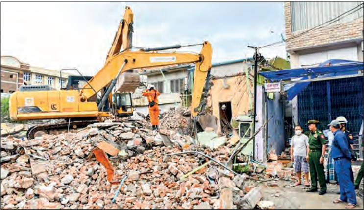
Lt-Gen Myo Moe Aung observes removing debris efforts by using heavy machines in Chanayethazan Township, Mandalay yesterday.

The Chief Minister and Lt-Gen Thet Pon from the Office of the Commander-in-Chief (Army) inspected collapsed religious buildings at Shinpin Nankaing Pagoda in Htonbo Ward and removal of debris from the collapsed public housings in Panbedan and Moeza wards. The Chief Minister presented foodstuffs to teachers from Basic Education High Schools in Potan Ward.