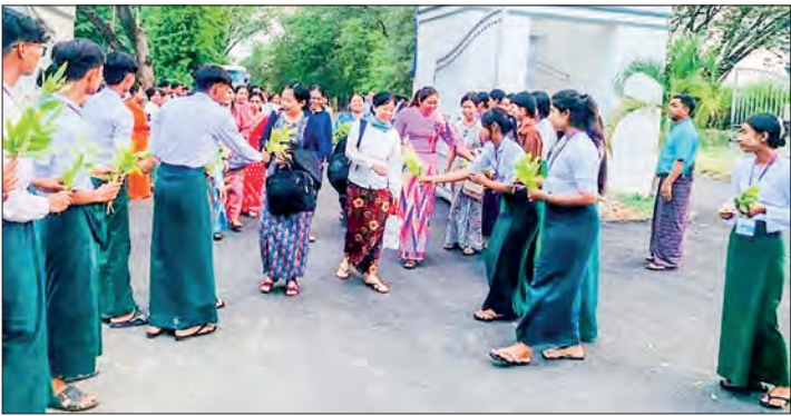
The Sagaing Region Education Officer, officials and students welcome 53 faculty members from Yangon Region who arrived in Sagaing on 1 May.

Out of 90 faculty members, 53 teachers from Yangon University arrived in Sagaing on the evening of 1 May. They were welcomed by the Sagaing