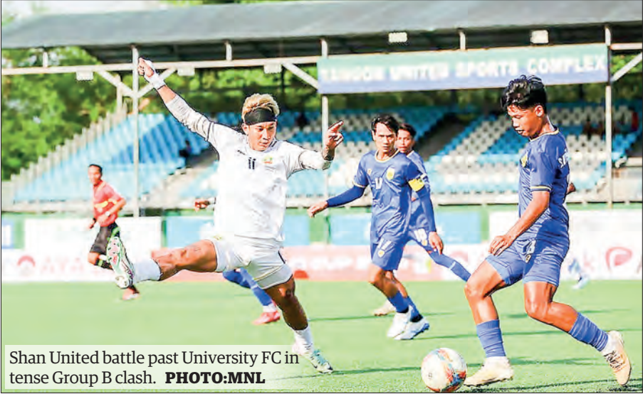
Shan United battle past University FC in tense Group B clash.