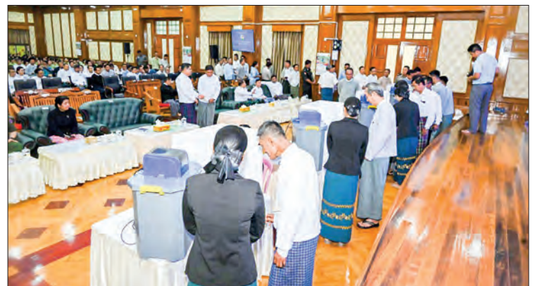
Departmental officials and representatives from political parties participate in a practical voting session using the machine.