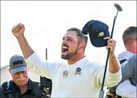
American Bryson DeChambeau won the title at LIV Golf Korea on Sunday.

"We always believed we could be champions and we have done it." — AFP