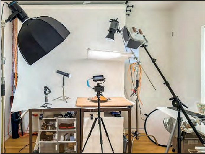
Indian companies are leveraging Genai tools for creative purposes and campaign optimisation, content performance improvement and audience engagement.

ADOPTION of Artificial Intelligence (AI) can increase revenues by 10 per cent and reduce costs by 15 per cent for media and entertainment companies, Ernst & Young (EY) asserted in a report published during the first edition of WAVES Summit. The global media and entertainment (M&E) industry is