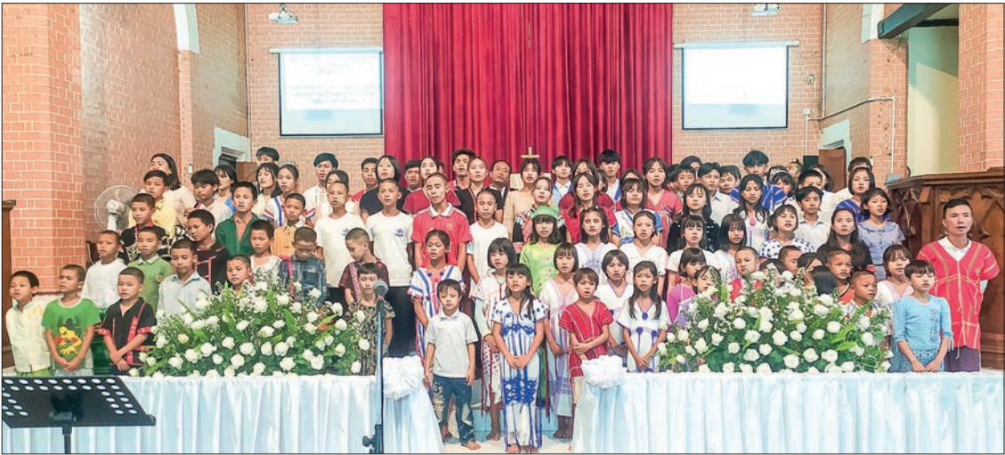
Youth Choir performs for peace and earthquake victims in Yangon.