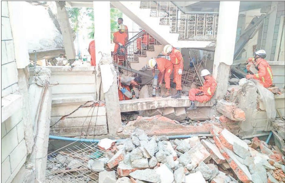
Clearup efforts underway at some buildings damaged by the earthquake.

ACCORDING to the Buildings Restoration, Utilization and New Buildings Construction Supervision Committee, repair and reconstruction works will be carried out in earthquake-affected areas across various regions damaged by the strong earthquake in Mandalay. These efforts will be implemented using a multi-pronged approach. This approach includes assigning the original construction companies to undertake the repair works, engaging companies currently implementing construction projects under relevant ministries, and also involving companies endorsed by three professional engineering associations. Additionally, the Nay Pyi Taw Development Committee and the respective