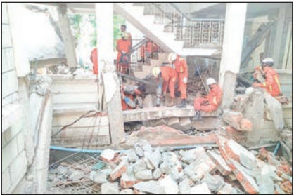
Mandalay Region to launch reconstruction of quake-damaged buildings