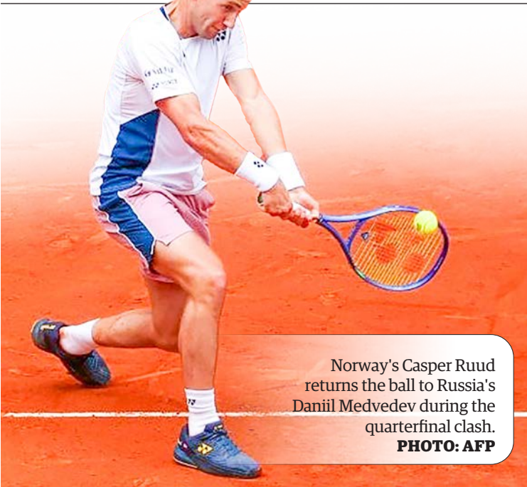
Norway’s Casper Ruud returns the ball to Russia’s Daniil Medvedev during the quarterfinal clash.

fastest times ever in the 1,500-metre freestyle, and has not been beaten in the event since she lost a race in Maryland way back in 2010 when she was just 13 years old. Ledecky, who won her first Olympic title at the 2012 London Games, has already indicated she plans to extend her career to the Los Angeles Olympics in 2028. Her time on Wednesday was around five seconds quicker than her winning time in the 1,500-metre final in Paris last August. "I don't feel like I'm close to being finished in the sport yet," Ledecky said of her plans for the future after her win in Paris last year. — AFP