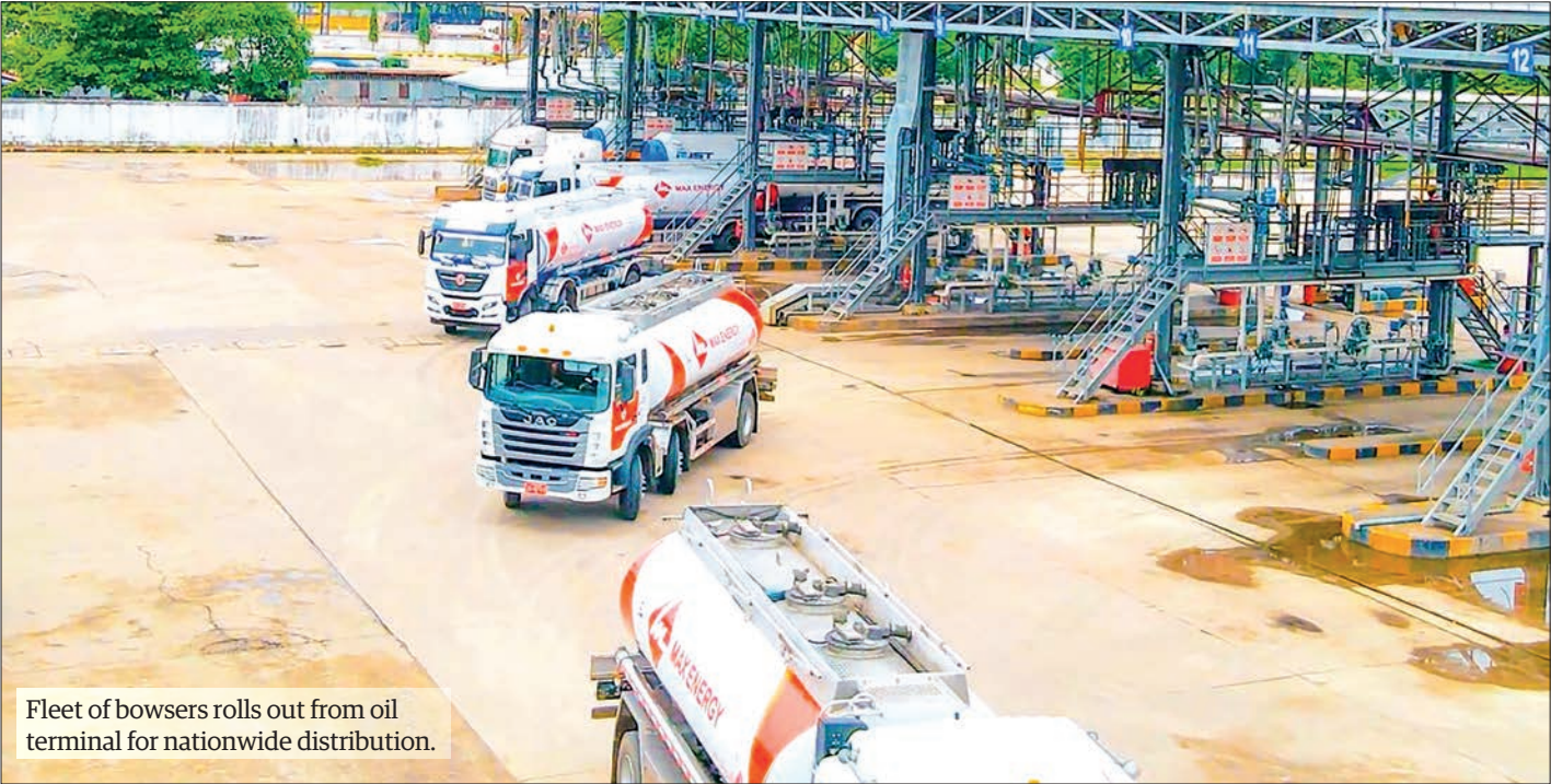
Fleet of bowsters rolls out from oil terminal for nationwide distribution.

CBM has been collaborating with law enforcement agencies to combat and prosecute those who attempt to manipulate the currency market under the existing laws.