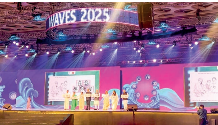
Photos capture the opening of the World Audio Visual and Entertainment Summit 2025 and its enthusiastic participants.

entertainment innovators, and prominent Indian artistes. This inaugural WAVES 2025 summit aims to bring together innovation across the media and entertainment landscape. Scheduled from 1 to 4 May at the Jio World Convention Centre, the event is designed to explore opportunities, tackle challenges, and envision the future of global media and entertainment. The summit also serves as a platform for collaboration and innovation through global networking among stakeholders across the sector. Its objectives include opening new frontiers, fostering cross-border cultural exchange and mutual understanding, enhancing creativity, and identifying strategic pathways forward. There will be discussions on policy trends and engagement strategies with local communities through powerful community radio platforms. — MNA/KZL