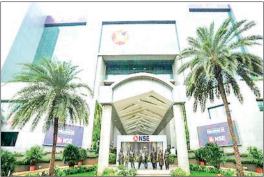
The total investor base reached 11.3 crore by the end of March 2025.

INDIA'S stock markets added 2.1 crore new investors during the financial year 2025-26, marking a strong 23.2 per cent growth in investor registrations, according to a report by the National Stock