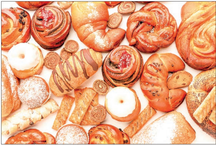
Crisps, croissants, doughnuts, muffins, sweets and hot dogs all count as ultra-processed food.