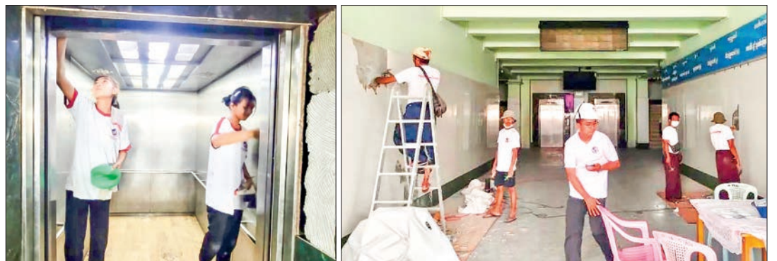
Recovery measures underway at the Mandalay General Hospital.

Mandalay and Sagaing to provide urgent medical care. Collaborative efforts with relevant organizations are ongoing to restore healthcare services in the region, ensuring that those affected by the earthquake receive timely and essential treatment.