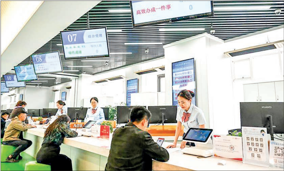
Staff members handle businesses related to private enterprises at the government service centre of Dongsheng District in Ordos City, north China's Inner Mongolia Autonomous Region, 16 April 2025.