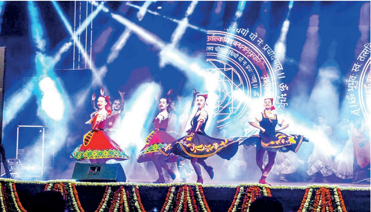
10 th India-International Dance and Music Festival.

Union Minister L Murugan will unveil the white paper titled "India's Live Events Economy: A Strategic Growth Imperative" on 3 May.