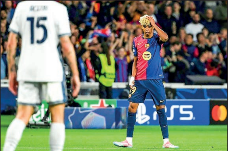
Barcelona forward Lamine Yamal celebrates scoring his team’s first goal against Inter Milan.

FOR 22 minutes Barcelona did not seem to believe they would reach the Champions League final, and then Lamine Yamal decided enough was enough. Inter Milan raced into a semifinal first leg two-goal lead, but the 17-year-old star’s brilliance helped Barca come from behind to secure a 3-3 draw on Wednesday and leave the tie in equilibrium ahead of the return in Milan next Tuesday. After Marcus Thuram and Denzel Dumfries produced two outstanding finishes even the most resolute fans started to wonder if this was a bridge too far. It was Barcelona’s first semifinal since 2019, and the team powered by teen spirit, shorn of injured top goalscorer Robert Lewandowski came up against an experienced, wily side, runners up in 2023 and looking to go one better this time. It has been a decade since the Catalan giants last reached the final, winning in Berlin with Lionel Messi as their omnipotent leader, and Barcelona are dreaming of a return to Germany for the Munich final on 31 May. Fear tried to set in but Yamal was too quick for it. Three minutes after Inter’s second, he struck. After all, he said on the eve of the game he had left his fears behind playing in the park in his hometown of Mataro. The winger, on his 100 th appearance for the club, showed strength to shrug off Thuram, skill and speed to ditch Henrikh Mkhitaryan and produced a precise, lethal finish. — AFP