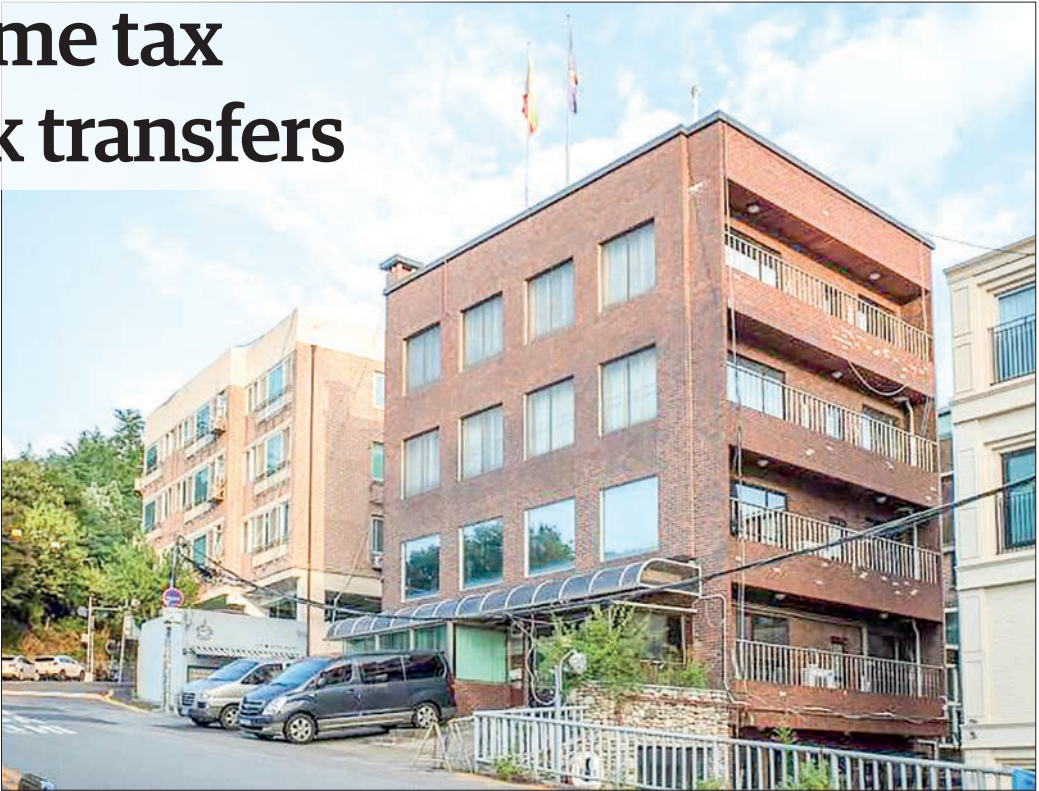
The Myanmar Embassy to the Republic of Korea.

those arriving no later than 1 January 2025 to pay KRW192,000 for six months at a rate of KRW32,000 per month, respectively. Advance payment is to be made in person or through a representative to the Bank of Korea Account 174-910001-24801 (KEB, Hana Bank), Beneficiary Name: Myanmar Embassy, and it is advised not to transfer money via mobile banking. If paying by a representative, only the name of the taxpayer, rather than the representative, must be written as the sender. Taxpayers can retrieve their payment receipts at the embassy by showing the original bank deposit slip, it said. — MT/ZN