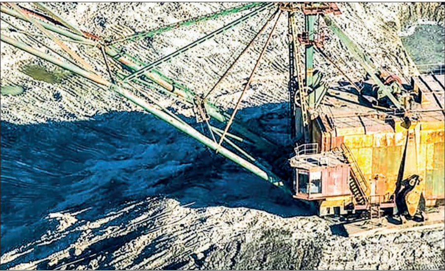
Ukrainian Prime Minister Denys Shmyhal announced that the minerals agreement would be signed soon.

THE United States has excluded provisions on security guarantees, such as continuation of providing military aid to Ukraine, from the text of the rare minerals deal, The New York Times reported on Thursday, citing an unnamed former US official familiar with the matter. Washington reportedly rejected this provision at an early stage of its work on the deal's text. The US Treasury Department earlier said Washington and Kyiv signed an agreement to establish the United States-Ukraine Reconstruction Investment Fund, which, according to the Ukrainian government, is part of a broader minerals deal between the two countries. — SPUTNIK