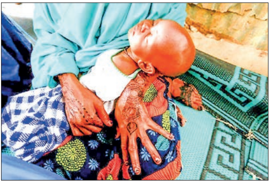
A mother carries her sleeping baby at the Gubio camp in Maiduguri, Nigeria.

An aid freeze ordered earlier this year by US President Donald Trump has slashed budgets for many humanitarian programmes.