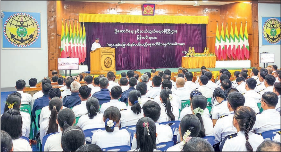
SAC Member Deputy Prime Minister MoTC Union Minister General Mya Tun Oo speaks on the 148 th Anniversary of Myanmar Railways yesterday.

ister, deputy ministers, and the managing director presented honorary awards. These were given to railways, factories, and hospitals across the country for outstanding performance; to staff members who fulfilled their duties with exceptional commitment and to employees who took swift and effective action during natural disasters such as floods and earthquakes to ensure the safety of passengers and restore rail services promptly. Awards were also given to staff who rescued colleagues trapped in damaged staff housing during the earthquake. The event concluded with a group photo. — MNA/KZL