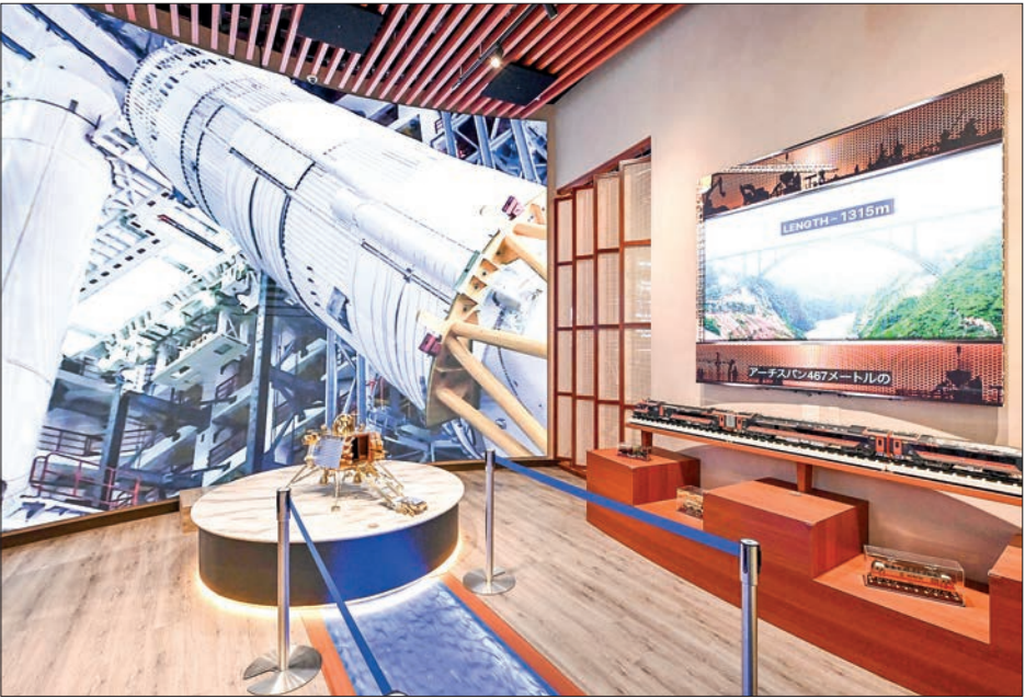
Photo shows the interior of India's pavilion at the 2025 World Exposition in Osaka on its opening day on 1 May 2025.

from building a self-built Type A pavilion but was still unable to complete the construction work before the 13 April opening. Brunei, meanwhile, is part of the "Commons" pavilion, where participants install their booths in a shared space. The construction of the Nepali pavilion has been suspended due to unpaid fees for the builders. — Kyodo