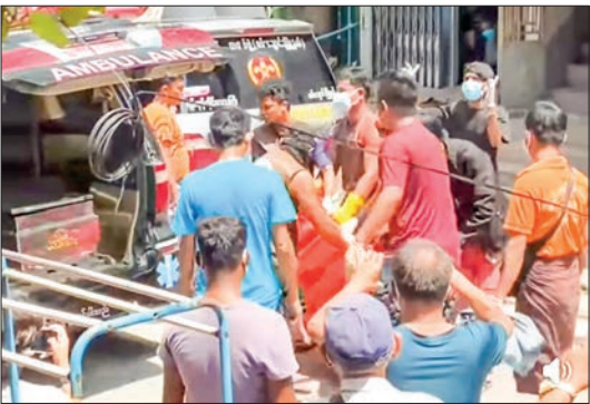
This photo displays bodies being carried from the apartment.

A family of four, including an eight-year-old child and a dog, was found dead on 1 May inside their apartment on the fourth floor of the building in