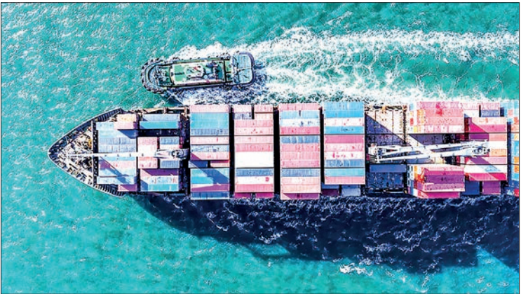
The US economy contracted by 0.3 per cent in the first quarter of 2025, largely due to a surge in imports ahead of President Trump's new tariffs.

THE US economy unexpectedly contracted in the first three months of the year on an import surge triggered by Donald Trump's tariff plans, although the president pinned the blame squarely on his predecessor. The sharp increase in imports was a reflection of businesses and consumers stockpiling foreign goods to get ahead of Trump's sweeping trade levies, which went into effect earlier this month. All three major Wall Street