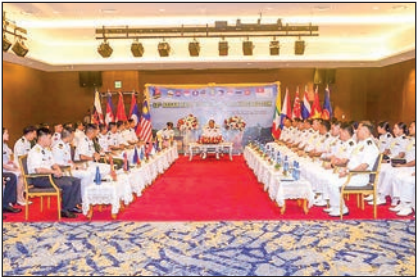
Myanmar hosts 12 th ASEAN Navy Young Officers Interaction in Yangon