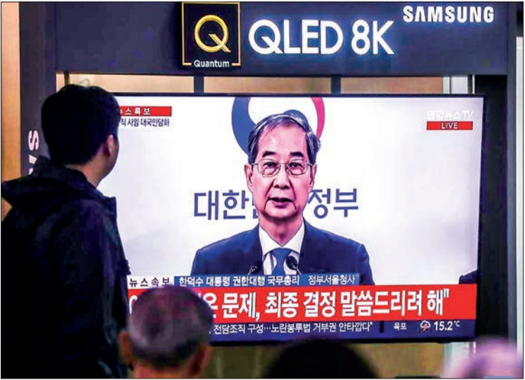
People watch a televised address by Han Duck-soo at Seoul Railway Station in Seoul, South Korea, 1 May.

SOUTH Korea's acting president and Prime Minister Han Duck-soo announced his resignation on Thursday in a televised address to the nation, amid wide expectations for his presidential run. Han said that he decided to step down in order to do what he can and has to do at the time of crisis faced by the country, noting that unless the extreme politics are abandoned and the foundation for cooperation is es- tablished, division and conflict will be repeated no matter who will be in power. He emphasized that he will go all the way to be the best for South Korea at this moment and in the future to the end. With Han's resignation, Deputy Prime Minister and Minister of Economy and Finance Choi Sang-mok will serve as acting president. Han is widely predicted to announce his bid for the 3 June snap presidential election on Friday. He has been one of the favored presidential hopefuls for conservative voters following the removal of former President Yoon Suk-yeol from office over his botched martial law imposition. A recent survey showed Han garnered a support rate of 13 per cent, surpassing approval scores of the conservative People Power Party's presidential contenders. — Xinhua