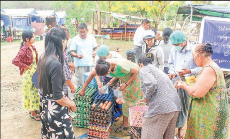
Residents seen purchasing eggs at fair prices.

THE Livestock Breeding and Veterinary Department, Livestock Breeding Federation and business people arranged food trucks under the supervision of the Ministry of Agriculture, Livestock and Irrigation to sell chicken and eggs at the fairer prices at the quake-affected staff housing in Nay Pyi Taw. They sold 50 visses of chicken and 40,500 eggs at Wunna Theikdi and Thukha Theikdi wards of Nay Pyi Taw yesterday. Moreover, the officials sold 85,045 eggs, 40 visses of mutton, 786.10 visses of chicken, 300 visses of pork and 50 visses of beef in the Union Territory (Nay Pyi Taw), Mandalay Region and Sagaing Region. — MNA/KTZH