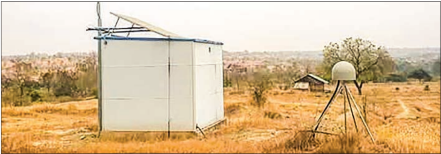
This photo showcases a GPS device used for monitoring ground movement. cus on the Sagaing Fault. The GPS device can calculate annual ground movement as well as ground movement during earthquakes, while also determining the direction and speed of the moving ground.

LOCATED in an earthquake zone, Myanmar’s Department of Meteorology and Hydrology (DMH) and the Myanmar Earthquake Committee have jointly installed GPS devices and 10 seismometers at 17 meteorological stations since 2011 to monitor and calculate ground movements, according to the Myanmar Earthquake Committee. GPS devices, installed to monitor ground movements that could trigger major earthquakes, are used to measure faults in cities such as Bago, Yamethin, Heho, and Loilem, with a particular fo-