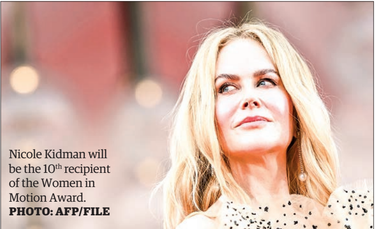
Nicole Kidman will be the 10 th recipient of the Women in Motion Award.

This commitment to promoting female representation in cinema has made her a powerful example of what Women in Motion has been advocating for over the past decade, as per The Hollywood Reporter. — ANI