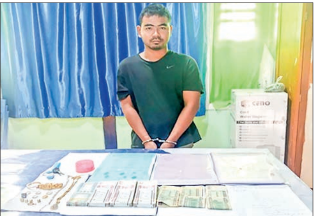
This photo displays detained suspect and recovered evidence in murder case.