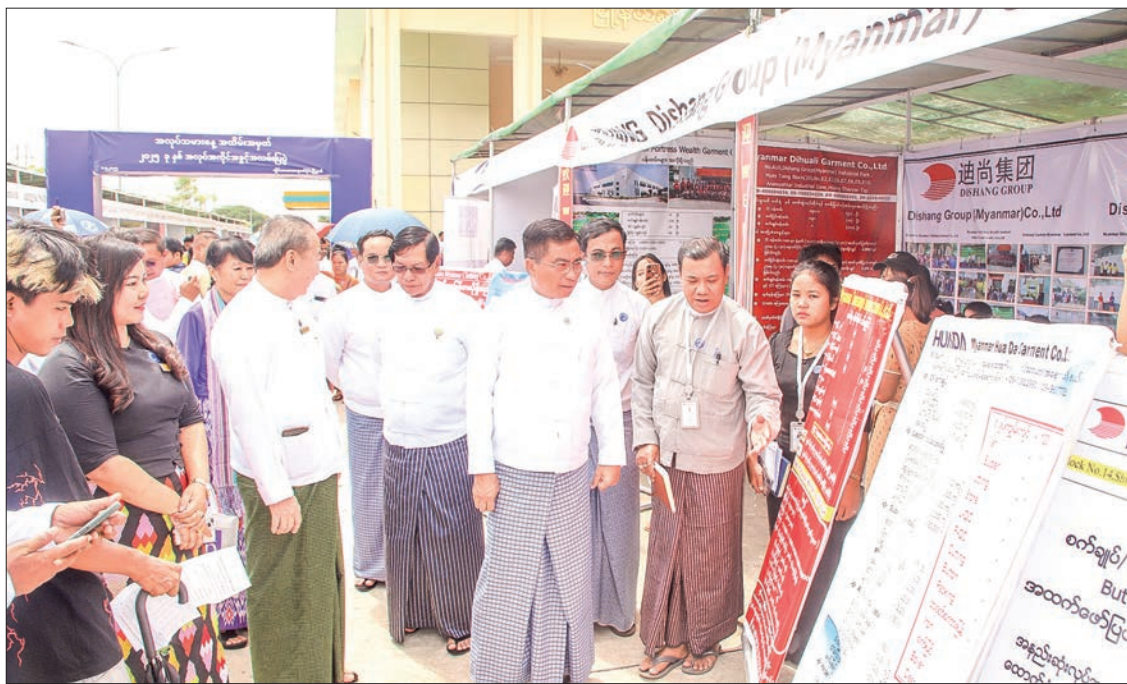
Union Minister U Chit Swe views the job fairs on International Workers' Day yesterday.

The Ministry of Labour aims to create a peaceful and stable working environment by establishing good tripartite relations among the Government, employers and employees, enforce-