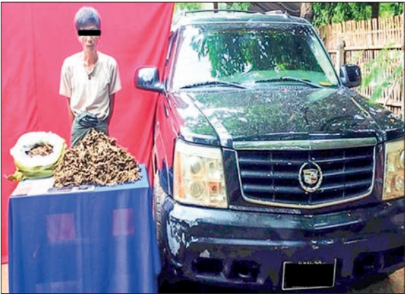
Offenders are seen alongside confiscated drugs and vehicles.

ACCORDING to the Myanmar Police Force, over K1.5 billion worth of narcotic drugs, including one million stimulant tablets and 2.3 kilogrammes of marijuana, were seized in Waw and Thaton townships. Acting on a tip-off, a combined team consisting of members of the Anti-Drug Police Force intercepted a Toyota Lexus at around 1 pm on 28 April near Nyaungkhashay village in Waw Township, Bago Region. The vehicle was travelling from Tatkon to Mawlamyine, driven by Moe Win Hlaing with Kyaw Khine Oo. During the search, authorities found and confiscated 1 million