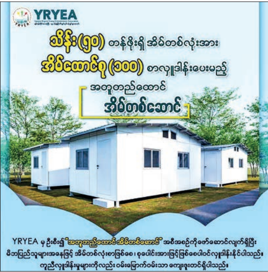
YRYEA's "Build a House Together" programme is presented with model houses.

THE Yangon Region Young Entrepreneurs Association has announced that it will donate houses worth K5 million each to 100 households in earthquake-stricken areas. YRYEA has been providing relief efforts in earthquake-affected areas by opening mobile clinics, providing health care, and donating tents, and home starter kits. Moreover, it will continue to implement the "Build a House Together" programme to alleviate the suffering of people in these disaster-hit cities as humanitarian aid for rehabilitation. The house's dimensions will be 12 feet by 40 feet for K5 million. Well-wishers are invited to donate to a whole house or make any contributions for collective participation in the "Build a House Together" programme. They can contact the YRYEA Office at 09 266559323 and 09 266559324. — MT/ZN