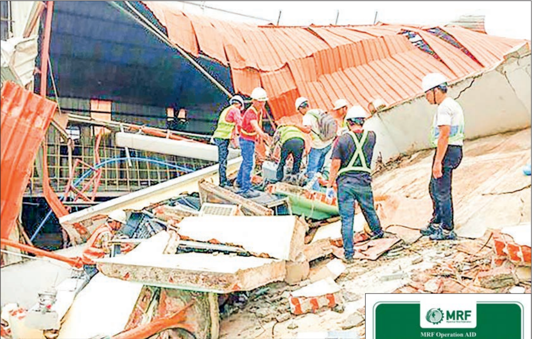
MRF Operation AID clears rubble in ongoing recovery efforts.

THE Myanmar Rice Federation (MRF) prioritizes reconstruction activities for quake survivors under the MRF Operation AID (Action in Disaster) programme starting in May, following intensified efforts in rescue activities. Those activities include assistance to the stakeholders included in the rice and paddy crop supply chain in quake-hit areas, helping agricultural organizations, departments concerned and civil service personnel, and collaboration with internal and international organizations for resettlement and relief. MRF launched Operation AID programme on 1 April 2025 for humanitarian and disaster relief efforts in earthquake-hit areas (Nay Pyi Taw, Mandalay, Sagaing and southern Shan State), with an initial fund of K1.5 billion donated by MRF members, affiliated associations, and well-wishers. MRF also expressed sincere appreciation to those who contributed to the funding and