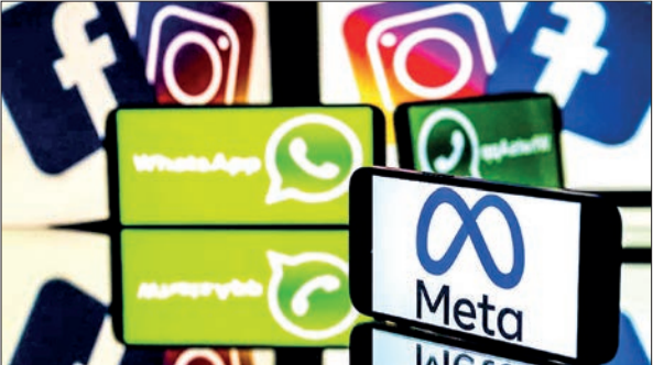
The company's quarterly net income increased to $16.6 billion, a leap of 35 per cent. PHOTO: AFP/FILE

of Facebook, Instagram and WhatsApp, and based in Menlo Park, California. The family daily active people (DAP) was $3.43 billion on average for March 2025, an increase of six per cent year over year. Its cash, cash equivalents and marketable securities were $70.23 billion as of 31 March 2025. Cash flow from operating activities was $24.03 billion and free cash flow was $10.33 billion. — Xinhua