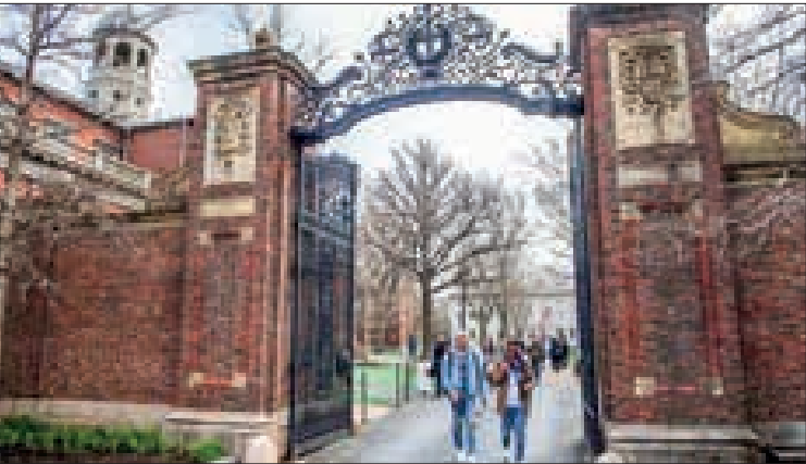
People walk through a gate as they exit Harvard Yard on the campus of Harvard University in Cambridge, Massachusetts, on 15 April 2025.

universities to issue forms to admitted students from abroad that they can use for applying visa to enter the US, according to DHS. As per the university's data, 6,793 international students study in Harvard University and comprise 27.2 per cent of its enrolment in the 2024-25 academic year. On Wednesday, DHS announced the cancellation of two federal grants worth US$2.7 million to Harvard University. In a statement, a Harvard spokesperson said that the university is aware about the letter. However, they stand by their previous statement that they "will not surrender its independence or relinquish its constitutional rights". — ANI