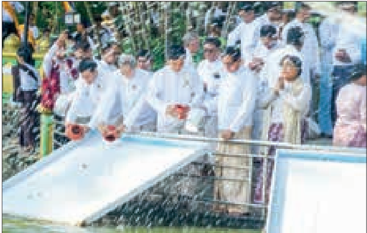
The fish-releasing ceremony at Shwedagon Pagoda.

A total of 1,000 fish were released and fed during a ceremony at Shin Uppagutta Lake in Singuttara Park, on the pagoda’s lower terrace near the northern archway, attended by cabinet members from the Yangon Region government as part of the New Year celebrations.