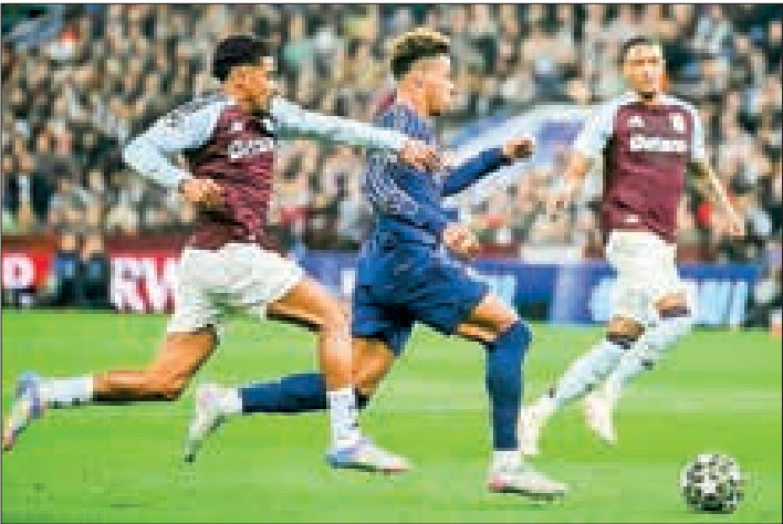
Aston Villa are targeting a return to the Champions League next season.

LIVERPOOL could seal the Premier League on Sunday should the runaway leaders condemn Leicester to relegation and Arsenal suffer a Champions League hangover