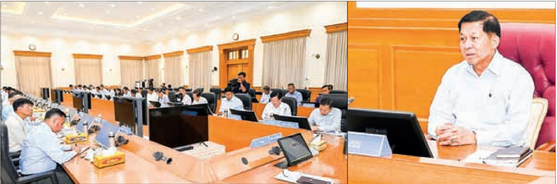
State Administration Council Chairman Prime Minister Senior General Min Aung Hlaing addresses the Union government meeting yesterday in Nay Pyi Taw.