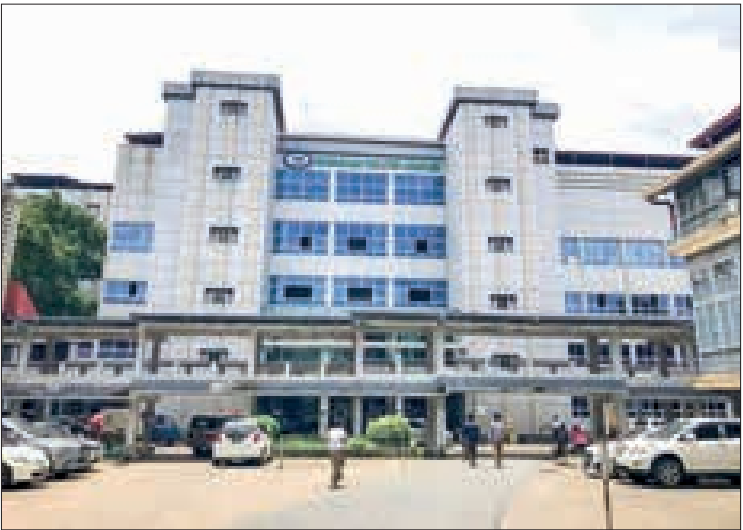
The outpatient ward at the new Yangon General Hospital.