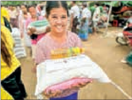
This picture shows donations by the Myanmar Wanbao Mining Copper Ltd, FAW Group and CRFD.

Similarly, FAW Group and CFRD also joined hands in rescue activities in earthquake-affected Mandalay and Nay Pyi Taw areas and provided temporary shelters and relief supplies to earthquake survivors.