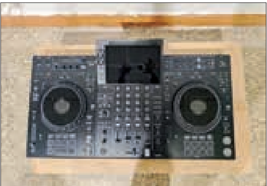
Confiscated items at Yangon International Airport.