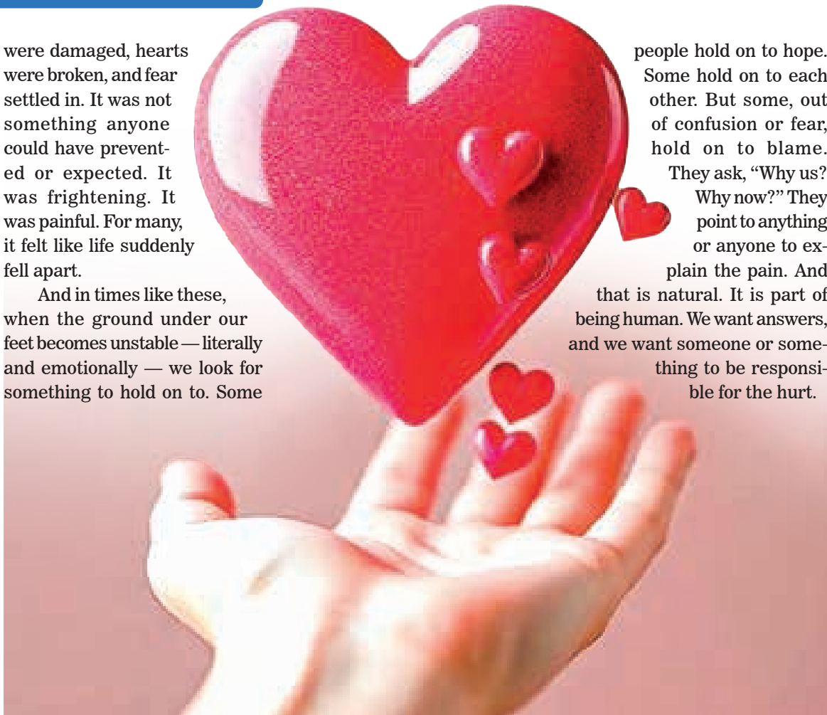
Embrace kindness, patience, and understanding daily. Allow healing and growth, teaching that pain leads to new beginnings and insights. ILLUSTRATION: CONCEPT ART

And in times like these, when the ground under our feet becomes unstable — literally and emotionally — we look for something to hold on to. Some