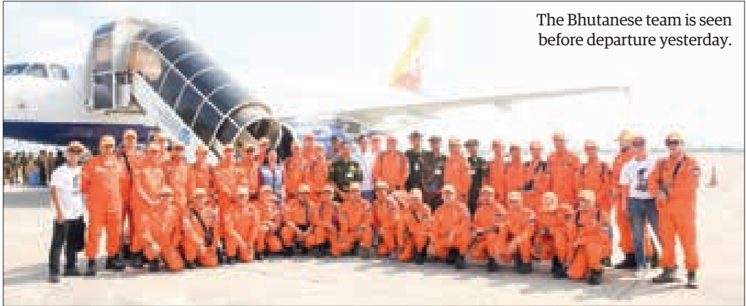
The Bhutanese team is seen before departure yesterday.

The team provided medical check-ups, treatments, and surgical procedures between 3 and 16 April for people affected by the earthquake. — MNA/KZL