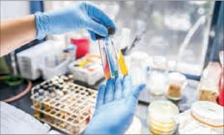
The agreement promotes technology transfer on mutually agreed terms, supports building national pandemic preparedness capacities, and encourages routine immunization and biological risk management.

ment aims to enhance global pandemic prevention, preparedness, and response, addressing the inequities highlighted during the COVID-19 pandemic. Guided by principles of equity, solidarity, and transparency, the agreement emphasizes respect for state sovereignty. A key component is the proposed Pathogen Access and Benefit-Sharing System (PABS), which facilitates rapid sharing of pathogen data with pharmaceutical companies to expedite the development of vaccines and treatments. Countries will commit to sharing data on emerging pathogens, ensuring equitable access to resulting health products. The agreement also addresses technology transfer, advocating for “mutually agreed” terms rather than mandatory transfers, with incentives to promote sharing of production know-how, especially to developing nations. — AFP