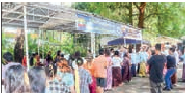
This photo captures the families of the Interfaith Dialogue Group (Central) donating refreshments to people.

On the Myanmar New Year Day, many pilgrims from across the country came to pay homage to the Shwedagon Pagoda, filling the four stairways and parking areas, where charity feast offerings were generously provided.