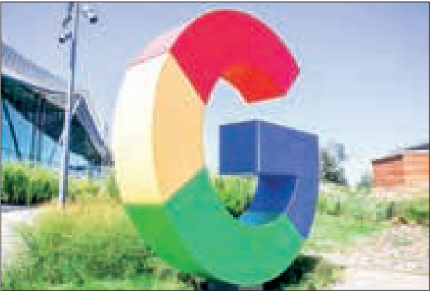
This is a landmark victory in the ongoing fight to stop Google from monopolizing the digital public square.