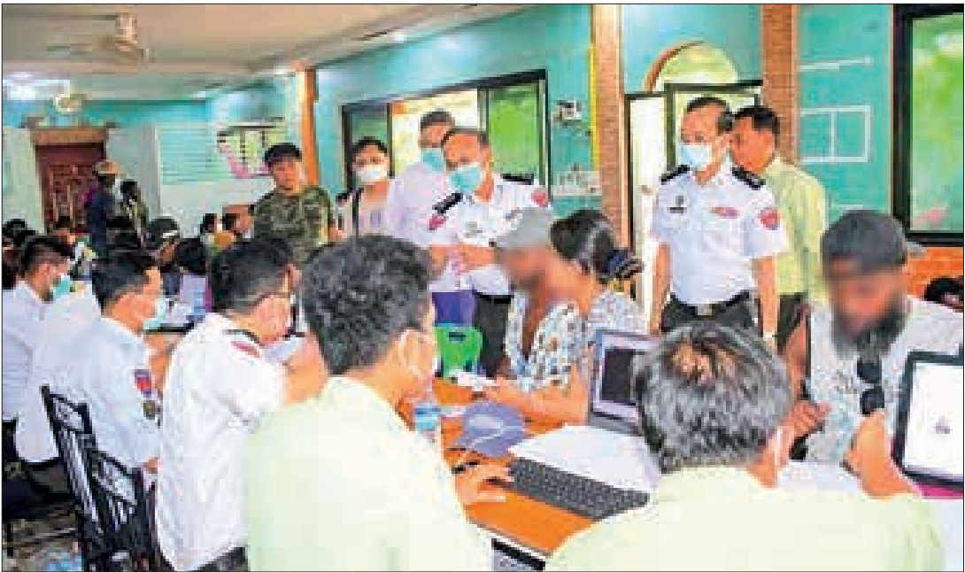
Immigration officials processing deportation of undocumented foreign nationals.

MYANMAR authorities detained 278 foreign nationals yesterday for illegally entering the Kyaukkhet area in Myawady, Kayin State, via illegal routes. Between 30 January and 18 April 2025, a total of 9,018 illegal immigrants were identified and detained in Myanmar. Of this number, 7,288 individuals have already been deported through Thailand to their respective countries, while arrangements are being made to deport the remaining 1,729 individuals. These individuals are currently under detention while awaiting repatriation. The Myanmar government takes strict action against illegal online fraud and scam operations, particularly in border areas. Authorities are collaborating with neighbouring countries and international organizations to crack down on illegal online gambling networks and telecom fraud, ensuring effective investigations and legal actions against those involved. — MNA/KTZH