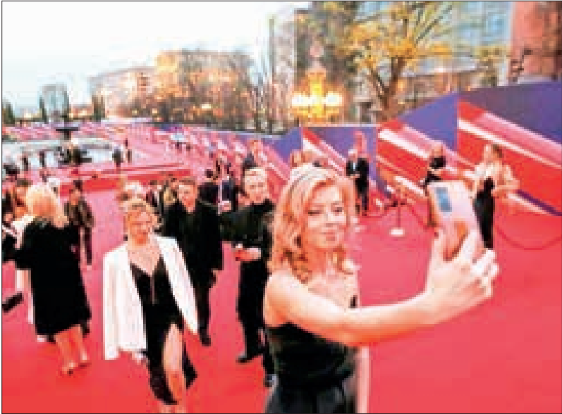
Guests pose for photos as they arrive to attend the opening ceremony of the 47 th Moscow International Film Festival in Moscow, Russia, on 17 April 2025.

THE 47 th Moscow International Film Festival (MIFF) opened Thursday in the Russian capital, with a dedicated BRICS film programme featured among its lineup.