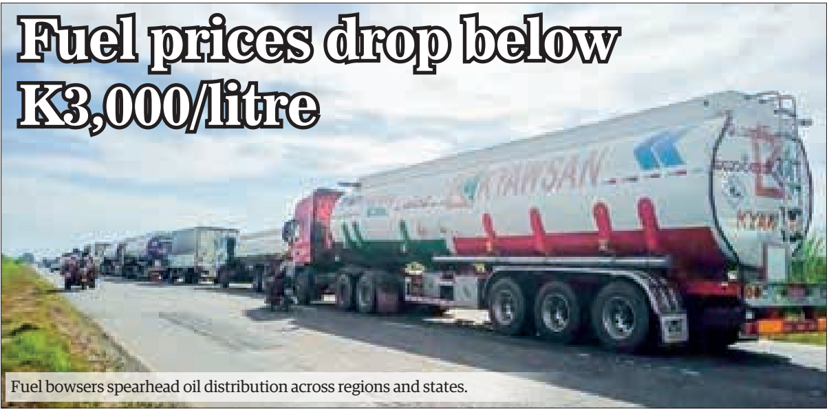
Fuel bowzers spearhead oil distribution across regions and states.