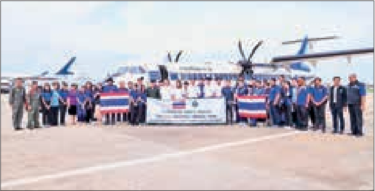
The third batch of the Royal Thai Armed Forces Task Force arrives in Myanmar on 18 April 2025.

Thailand always stands in support of the people of Myanmar. — GNLM