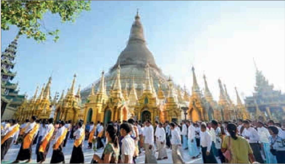
The Shwedagon Pagoda and devotees on its precinct.

THE 1387 Myanmar New Year and fish-releasing ceremonies were held at the Shwedagon Pagoda on New Year Day, 17 April, according to the pagoda board of trustees, with the New Year ceremony taking place at the prayer hall of ancient Buddha images on the southern part of the pagoda, where venerable monks recited Paritta to ward off dangers and share merits.