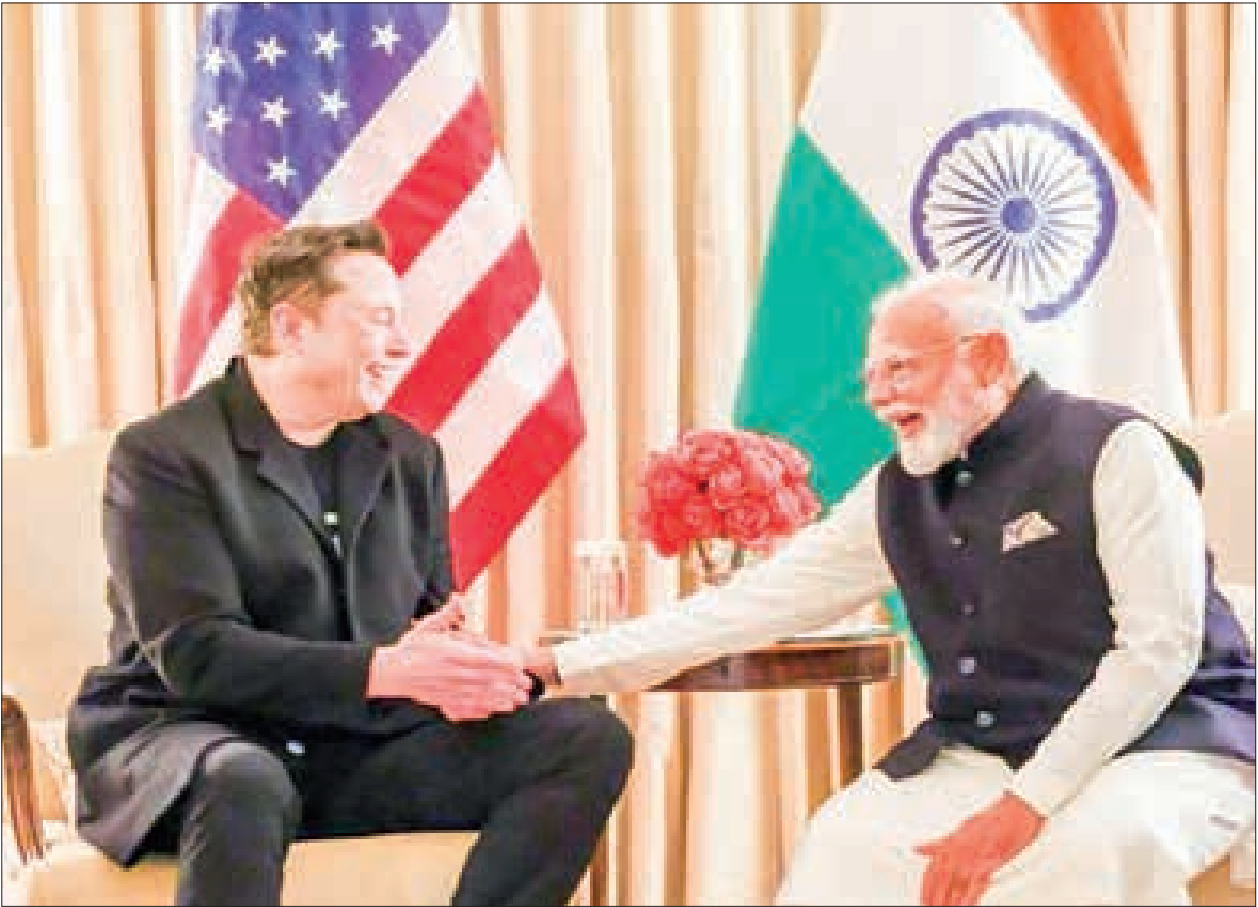
They explored opportunities in innovation, space exploration, artificial intelligence, and sustainable development.

Earlier in February, Elon Musk called on PM Modi at Blair House in Washington, DC. During the meeting, PM Modi and Musk discussed strengthening collaboration between entities of India and the US in innovation, space exploration, artificial intelligence, and sustainable