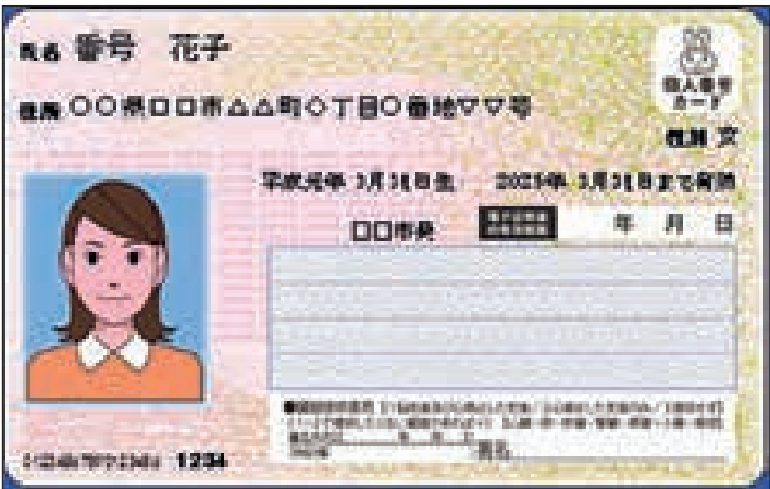
A sample "My Number" card supplied by the Internal Affairs and Communications Ministry.

The suspension occurred due to erroneous data from a credit union association, which claimed the accounts were unusable.