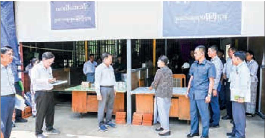
The Senior General looks into the temporary clinic set up by the Ministry of Legal Affairs.

carry out office work, and providing temporary accommodation for staff families. In his response, the Senior General stressed the need to promptly move away important documents, machinery and movable materials from the offices. It is necessary to seek advice from earthquake and construction professionals in rebuilding the offices and departments to have resilience to earthquakes in the long run. In constructing the buildings, it is necessary to systematically plan and equip the required water and electrical lines to ensure long-term durability. The government will systematically provide temporary housing for staff families. The government will arrange