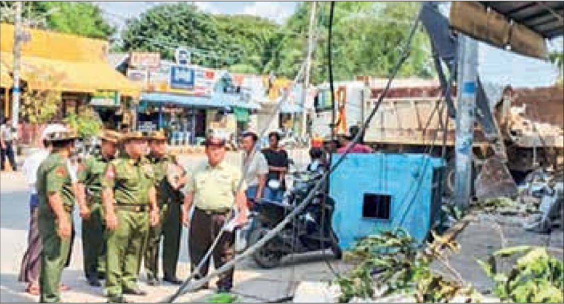
Lt-Gen Myo Thant Naing and officials concerned oversee the rubble cleanup in Kyaukse.

They also inspected the quake-affected buildings in Taungthaman monastery and instructed the officials to conduct cleanliness activities and reconstruction processes.