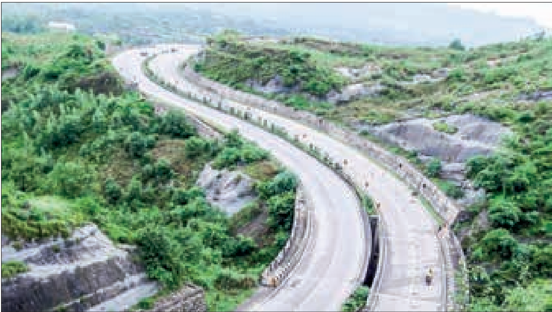
IMEC will include railways, roadways, energy pipelines, and clean energy infrastructure, including undersea cables. The photo shows Jammu-Srinagar highway.

Goyal highlighted that IMEC will link not only trade but also civilizations and cultures from Southeast Asia to the Gulf and Central Europe.