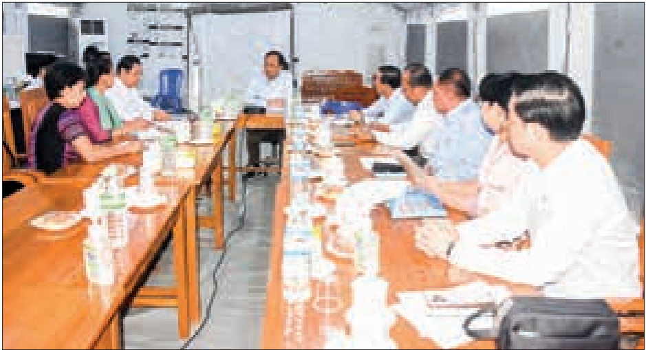
Union Minister Dr Thet Khaing Win holds talks with the IFRC delegation.

graduated from any local or foreign university are only eligible, under MEXT's guidelines. Registration in Google Form will be accepted until 3 pm from 14 April to 6 May, and applications will be accepted until 3 pm from 7 to 14 May. Documents which are not registered in Google Forms are not acceptable, it said. The submission of necessary documents such as MEXT's application form, university attended, certificate of graduation, research plan, and screenshot proof of application will be addressed to the MAJA office located in Thingangyun Township, Yangon, either in person or by post, by 3 pm on 14 May. Eligible candidates for the written test, which is scheduled on 17 May, will be announced on 15 May, and the interview will be held at the Yangon exam station. Detailed information will be announced on 20 May, together with written test results. The interviews will be held on 31 May and 1 June, and the Embassy of Japan to Myanmar will continue the selection of shortlisted candidates. The exam timetable will be sent to eligible candidates by email on 15 May. — MT/ZS