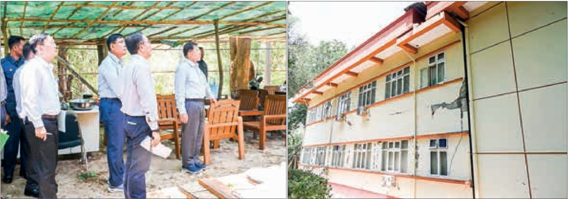
State Administration Council Chairman Prime Minister Senior General Min Aung Hlaing views the damaged portion of the ministries' offices in Nay Pyi Taw yesterday.

(Excerpt from guidance given by Chairman of the State Administration Council Prime Minister Senior General Min Aung Hlaing to Shan State cabinet members and state-level departmental officials on 3 September 2024)