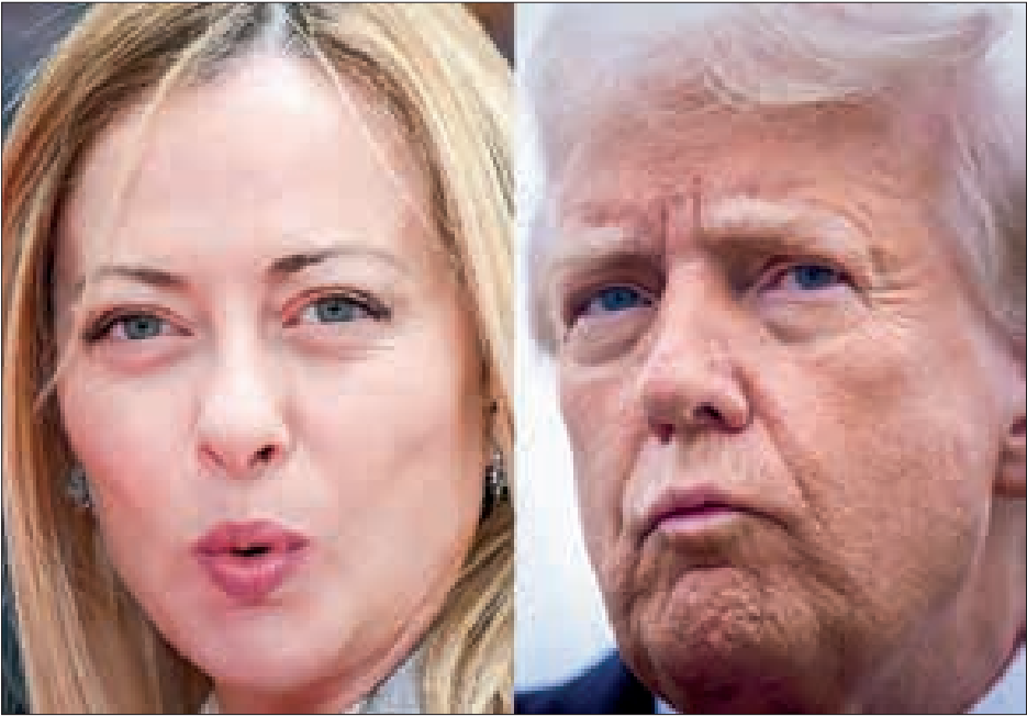
Italy's Prime Minister Giorgia Meloni will try to convince US President Donald Trump to cut his tariffs on EU goods.

Meloni has urged calm and called on the EU not to retaliate, positioning herself as a potential bridge to de-escalate the conflict through her relationship with Trump.