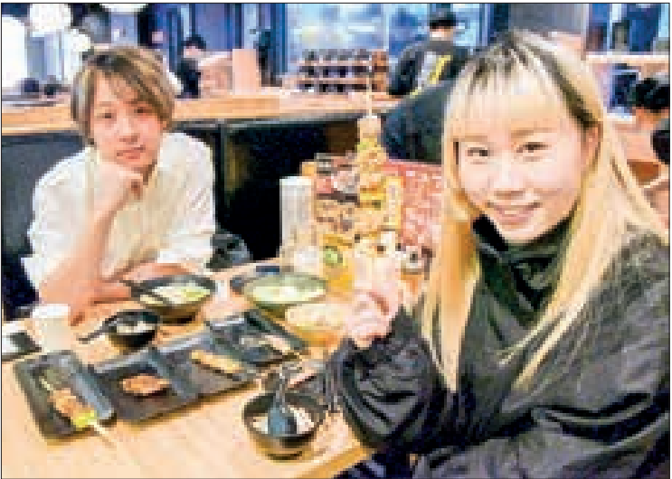
Diners enjoy “yakitori” skewered grilled chicken at Torikizoku’s first mainland China location in Shanghai in March 2025.

CHINA’S dining scene is thriving as Japanese chains like Torikizoku, Sushiro, and Saizeriya capitalize on economic challenges by offering affordable dining options. Torikizoku, a popular yakitori chain from Osaka, opened its first location in Shanghai in late February, pricing all items at a uniform 18 yuan ($2.50). This pricing strategy allows customers to enjoy a variety of dishes without worrying about costs, contributing to its immediate popularity. The store manager reported a two-and-a-half-hour wait for about 200 customers on opening day, many of whom were familiar with the chain from Japan. Local diners appreciate the value, with one 28-year-old praising the affordability compared to typical yakitori prices in Shanghai. A graduate student expressed satisfaction at being able to enjoy Japanese cuisine for around 100 yuan. Amid rising unemployment and a stagnant economy, private consumption in China has declined, with the consumer price index rising only 0.2 per cent year-on-year in 2023 and 2024. Torikizoku aims to expand to 650 stores in China, mirroring its presence in Japan. Sushiro and Saizeriya are also experiencing growth, with Sushiro expanding to 51 outlets and Saizeriya operating over 400 stores, targeting 7,000 to 10,000 locations in the future. — Kyodo