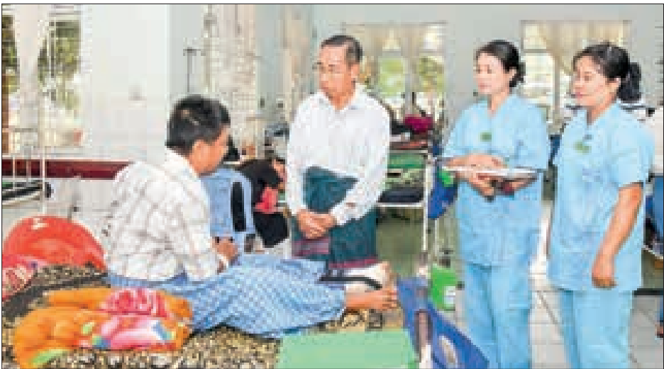
SAC Member Mahn Nyein Maung offers comfort to patients at the Nay Pyi Taw General Hospital. Yesterday, the Council Member donated a total of 120 bags of rice, 400 visses of potatoes, 200 visses of tomatoes, 1,200 eggs, four cartons of instant noodles, yoghurt, oral rehydration solution and K1.5 million worth of lunch.

STATE Administration Council Member Mahn Nyein Maung visited Nay Pyi Taw General Hospital (1,000-bed) yesterday morning to meet with health workers and earthquake-affected patients to provide food and cash assistance. First, SAC member Mahn Nyein Maung met with patients who were injured in the earthquake at the Neurology and Orthopaedics Wards of the General Hospital (1,000-bed) and encouraged their health and living conditions by providing oral rehydration solution and instant noodles.