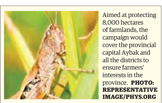
Aimed at protecting 8,000 hectares of farmlands, the campaign would cover the provincial capital Aybak and all the districts to ensure farmers' interests in the province.

Aimed at protecting 8,000 hectares of farmlands, the campaign would cover the provincial capital Aybak and all the districts to ensure farmers' interests in the province, said Gulabudin Ghiasi.