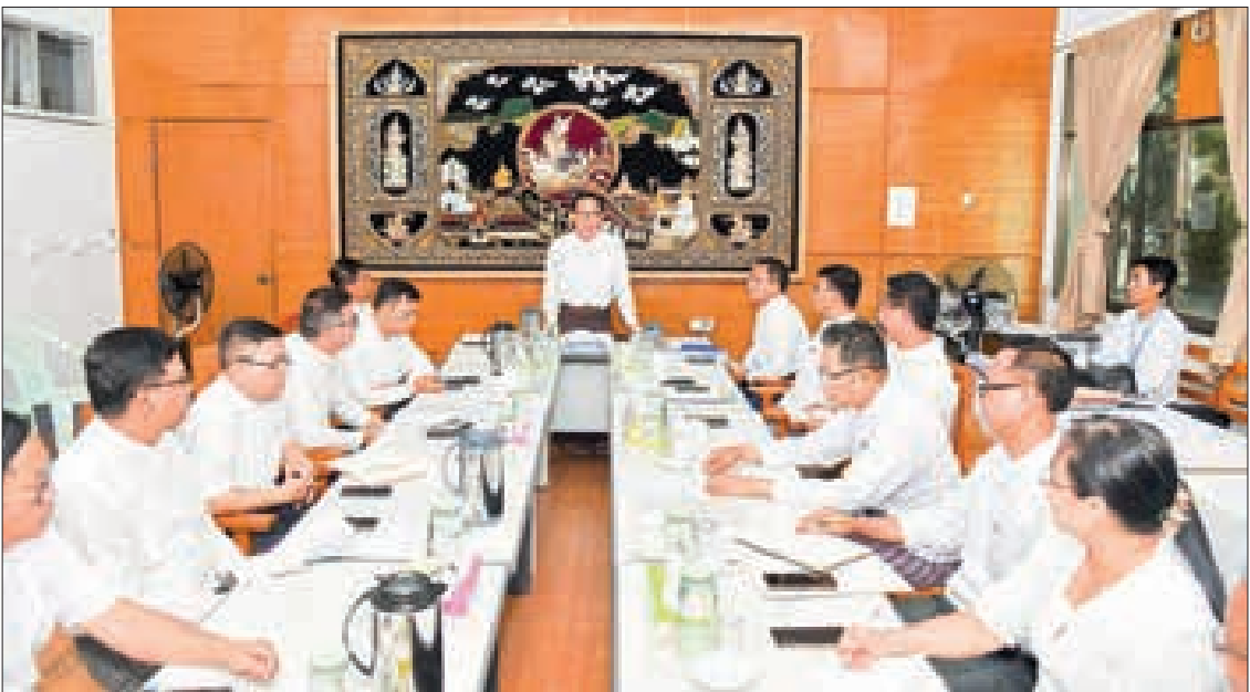
Union Minister U Maung Maung Ohn holds discussions to aid earthquake-impacted staff.

THE Ministry of Information provided its quake-affected staff with cash assistance in Nay Pyi Taw yesterday. Speaking at the event, Union Minister for Information U Maung Maung Ohn said the people and staff faced losses due to the earthquake. Although some departments experienced significant casualties and damage to buildings due to the earthquake, the department suffered minimal casualties as a positive outcome amid the worst, and all should stay strong. Currently, it needs to spread true information continuously to the people via the state-owned media or online as it is important to prevent false information circulation to the people and staff. After the quake, some staff returned to their native while some served their duties as usual. Therefore, all the staff must perform their respective duties after the Thingyan holidays. He then highlighted the role of staff and encouraged them to