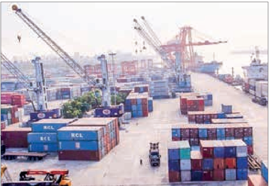
A glimpse of the container yard with working terminals at the port.

for 25 per cent of Myanmar’s exports, while India constitutes about 52 per cent of various pulses exports from Myanmar. Myanmar’s export items must follow the Sanitary and Phytosanitary – SPS protocol and meet other standards and criteria of the trading partners to sell the goods in the competitive market. The government will coordinate the departments concerned to facilitate the trade and to implement government-to-government pacts to penetrate more international markets, he added. — NN/KK