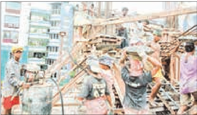
This image depicts labourers working on a construction site. A female mason training course, which aims to create more job opportunities for women, will be conducted in

Yangon on 5 May free of charge, according to the Myanmar Construction Entrepreneurs Federation. MCEF's technology development committee will organize it and employment will be created after finishing, said MCEF. Women aged between 18 and 35 who have at least primary education are eligible, and MCEF will provide accommodation and food during the training. Trainees are limited to 50 and interested persons can register by 30 April. The duration is 14 days. For more information, any individual can contact MCEF numbers at 09 893217109, 09 660282000, 09 422721757 and 09 250609740. MCEF is located at the corner of Thanthuma Road and Waizayanta Road in Thingangyun Township, Yangon Region. — MT/ZS