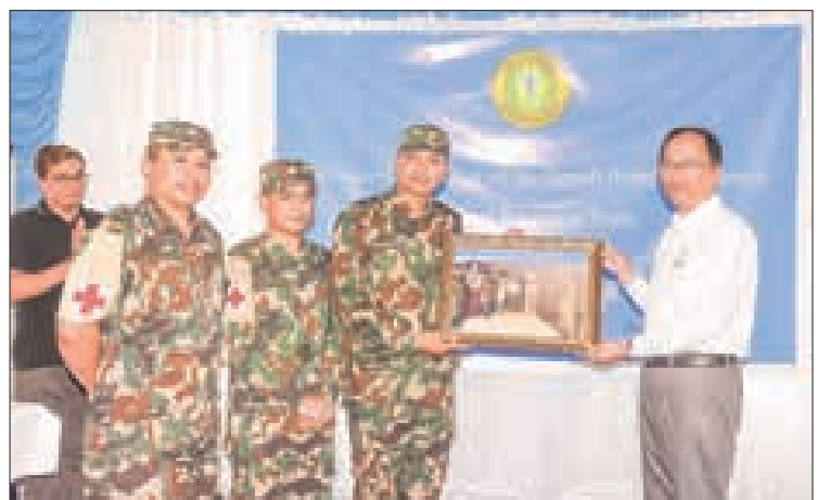
Union Minister Dr Thet Khaing Win offers gifts to the Nepali Tatmadaw Emergency Medical Team yesterday.

The Union minister also met the staff of the Public Health Department and Yamethin District General Hospital (100-bed). He appreciated the staff for their efforts and presented K1 million for the staff of the Yamethin District Public Health Department and K1 million for the staff of the Yamethin District General Hospital (100-bed) in addition to relief kits. — MNA/KTZH