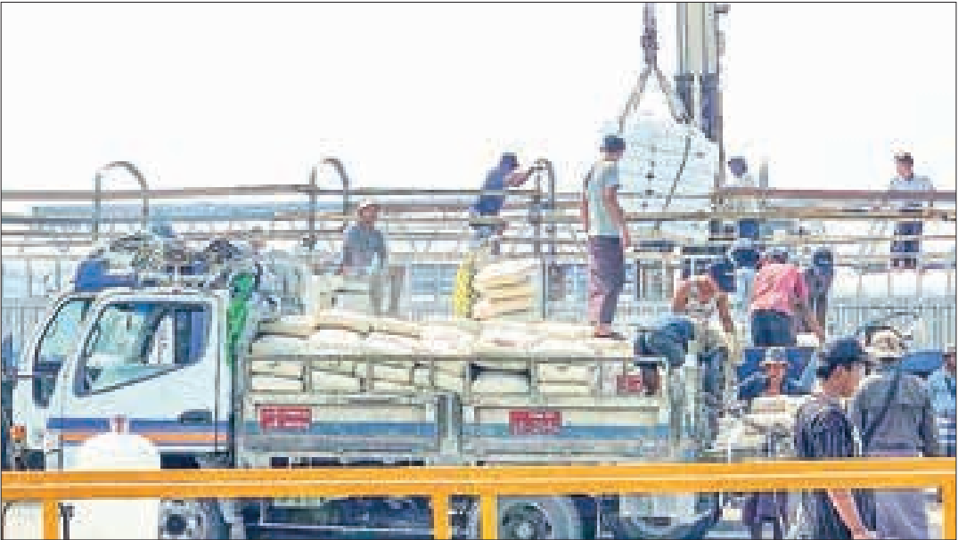
This photo shows imported cement bags being discharged from the vessel at the port.

TO rapidly meet the domestic cement demand for construction projects nationwide during this dry season and bolster domestic production, cement imports are being permitted.