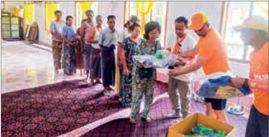
The Bhutan Royal Medical Team providing healthcare to quake-stricken people in Nay Pyi Taw.

THE Royal Medical Emergency Response Team of Bhutan, currently providing healthcare to earthquake-affected people in Nay Pyi Taw, donated a water purifier and emergency personal care items to Masoeysin Monastery in Pyinmana on the morning of 9 April. The team presented the donations to the monastery's presiding Sayadaw Bhaddanta Revata, including a water purifier, a 2,000-litre water tank, rice, cooking oil, sugar and other relief items. They then distributed emergency personal care kits to quake-affected locals near the monastery. The total value of the donation was over K100 million, which included a K45 million automatic water purification sys-