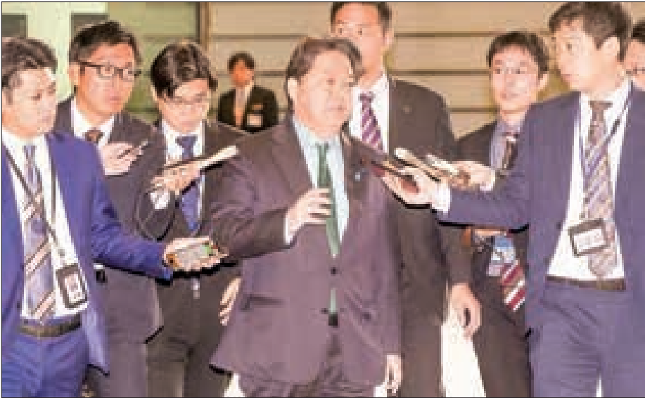
Japan's Chief Cabinet Secretary Yoshimasa Hayashi (C) talks to the press at the prime minister's office in Tokyo on 10 April 2025.

Japan plans to launch bilateral ministerial talks to address the impact of higher US tariffs.