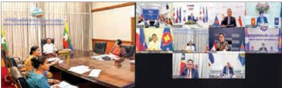
Union Minister Dr Kan Zaw participates in the online Special ASEAN Economic Ministers' Meeting held yesterday.

THE delegation led by Myanmar ASEAN Economic Minister, Union Minister for Investment and Foreign Economic Relations, Dr Kan Zaw, attended the special ASEAN Economic Ministers' Meeting via videoconference yesterday morning.