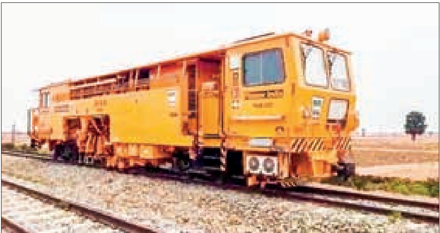
An MOW locomotive carrying out repair work on railway tracks.

FOLLOWING the severe earthquake on 28 March, Myanma Railways under the Ministry of Transport and Communications repaired damaged railway lines and bridges using manpower and machinery. Passenger and cargo trains, including container trains, resumed operations along the Yangon-Mandalay route starting on 5 April. To further strengthen the railway infrastructure, reinforcement work is ongoing using All TM heavy machinery between several stations on the Yangon-Mandalay line: between Ywapale and Hanza stations, between Nyaunglunt and Magyibin stations and between Phyu and Nyaungbintha stations. Work includes gravel filling, packing and adjusting concrete sleepers. To ensure convenient travel and transport, passenger and cargo