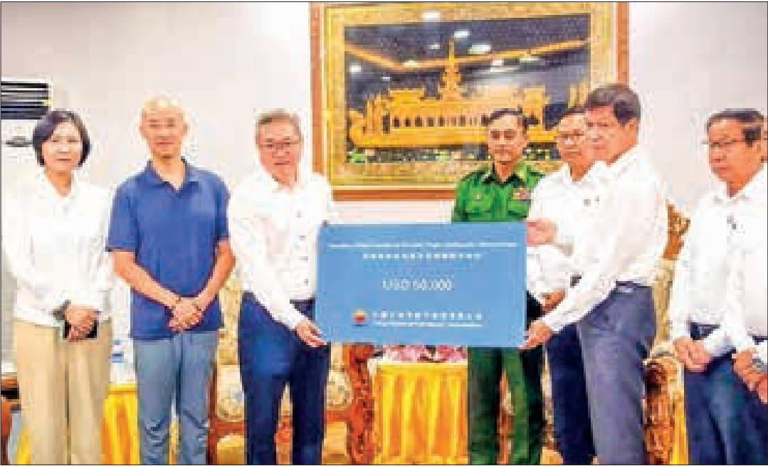
This photo captures Mandalay Region Chief Minister U Myo Aung accepting donations from Chinese companies, including the China National Petroleum Corporation (CNPC).

protect them from various dangers. — ASH/MKKS