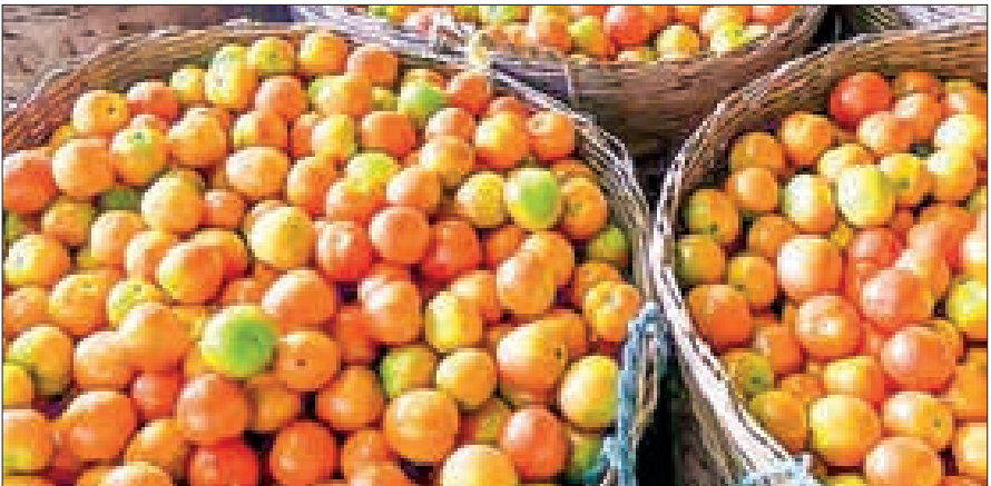
This photo displays vegetables being organized for sale at the Aungban vegetable market.

MGMA initiated fundraising with K100 million to support relief supplies to those affected by the devastating earthquake on 28 April 2025 and donated K200 million to the Committee on Disaster Management on 1 April 2025, including the K100 million fund designated for the Phase II Programme of flood rescue and resettlement activities. — NN/KK