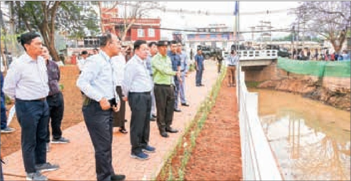
The Senior General is pictured during his inspection tours in Kalaw and Aungban.

In his instruction, the Senior General underlined that the railway station must be systematic with a fence. The yard of the station must be for the employees of Myanmar Railways and passengers only. It must be a systematic, neat and tidy station. Documentary photos of the railway station must be displayed systematically. — MNA/TTA