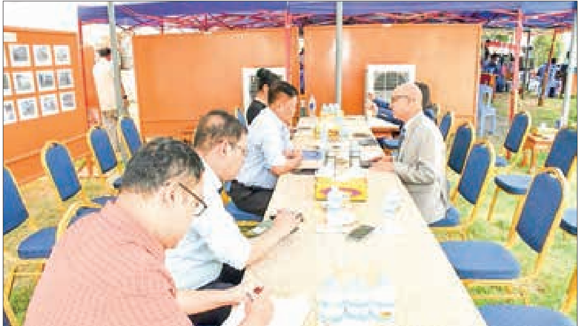
Deputy Prime Minister Union Foreign Affairs Minister U Than Swe meets Nepali Ambassador Mr Harishchandra Ghimire yesterday.

The Deputy Prime Minister and Union Minister for Foreign Affairs of Myanmar expressed his appreciation to Nepal for providing humanitarian assistance and sending a medical team to Myanmar in the aftermath of the devastating earthquake. Both sides discussed working closely in the rescue and relief efforts of the victims of the earthquake.