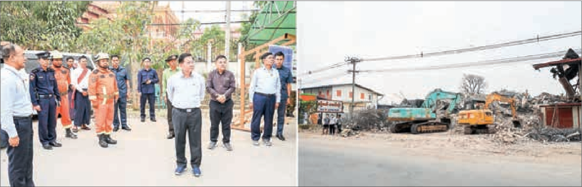
State Administration Council Chairman Prime Minister Senior General Min Aung Hlaing assesses search-and-rescue operations and debris cleanup efforts in Kalaw and Aungban, southern Shan State.

(Excerpt from guidance given by Chairman of the State Administration Council Prime Minister Senior General Min Aung Hlaing to Shan State cabinet members and state-level departmental officials on 3 September 2024)