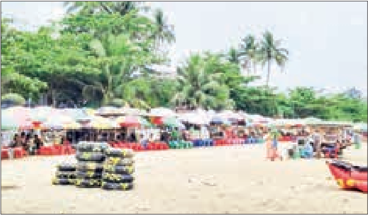
This photo shows the current situation of Chaungtha Beach recorded on 6 April 2025. hsaung were thronged with visitors including family vacations and company trips, he said. Similarly, there are still visitors in Bagan after the quake struck, according to residents. Except for Mandalay and

AFTER the Mandalay earthquake, visitor arrival to Ngwehsaung Beach has been low, according to residents and visitors. Hotel rooms were booked for Thingyan since March but some were resold and cancelled, said a resident. “It may be related to the quake. The beach has yet to be crowded. People postponed their bookings and some resold. It seems the visitor arrival won’t be large this year. Some visitors won’t come. Rooms are still available. There are just a few visitors for now at the beach,” said a travel planner. Over previous years, even in early April before the Thingyan Festival, the two local famous beaches – Chaungtha and Ngwe-