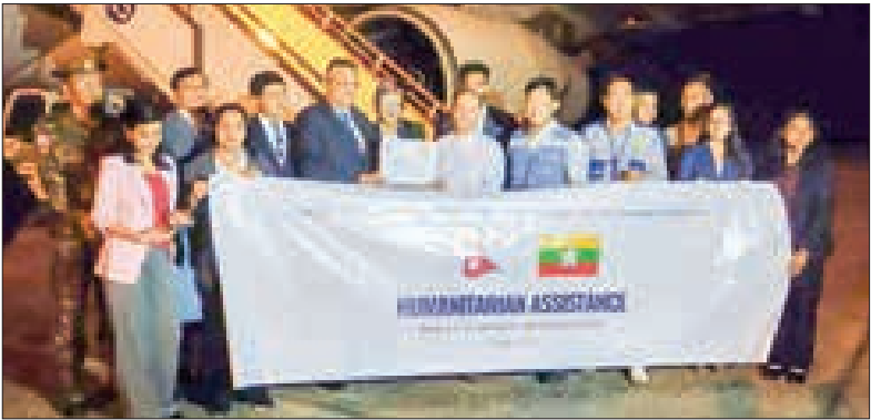
The acceptance ceremony for Nepali aid in progress at the airport upon its arrival.