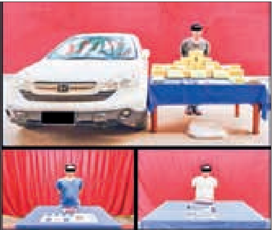
Arrestees are seen alongside confiscated drugs and vehicle.

Legal proceedings have been conducted against the offenders, and an ongoing investigation is underway to apprehend others involved in the case. — MNA/MKKS