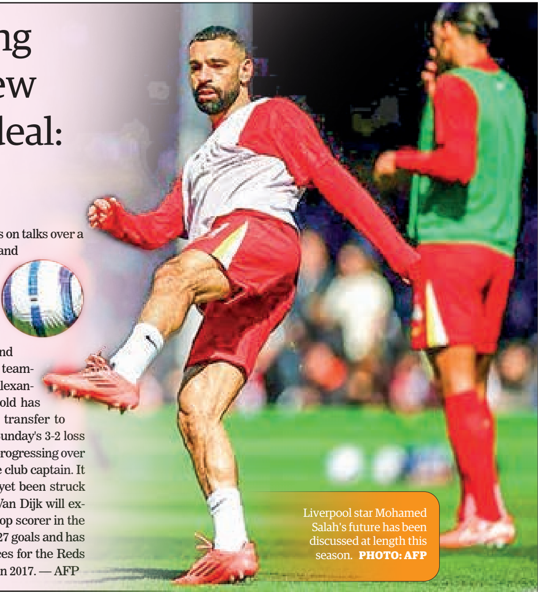
Liverpool star Mohamed Salah's future has been discussed at length this season.

LIVERPOOL are making progress on talks over a new contract for Mohamed Salah and the Premier League leaders are increasingly confident he will stay at Anfield next season, according to reports on Wednesday. The 32-year-old Egypt international is out of contract at the end of this season along with Liverpool teammates Virgil van Dijk and Trent Alexander-Arnold. While Alexander-Arnold has been linked strongly with a free transfer to Real Madrid, Van Dijk said after Sunday's 3-2 loss to Fulham that negotiations were progressing over a much-discussed new deal for the club captain. It is understood no agreement has yet been struck but there is optimism Salah and Van Dijk will extend their contracts. Salah is the top scorer in the Premier League this season with 27 goals and has netted 243 times in 394 appearances for the Reds since joining the club from Roma in 2017. — AFP