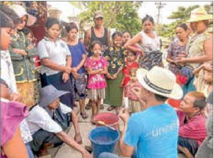
This image reveals UNICEF (Myanmar) distributing water and purification sachets to people affected by the earthquake.

helpful for children during critical times. Similarly, UNICEF has supplied hygiene kits to protect the health of earthquake-affected children and families in Sagaing Region. The organization is continuing to support other affected areas with essential aid for both families and children. — ASH/KZL