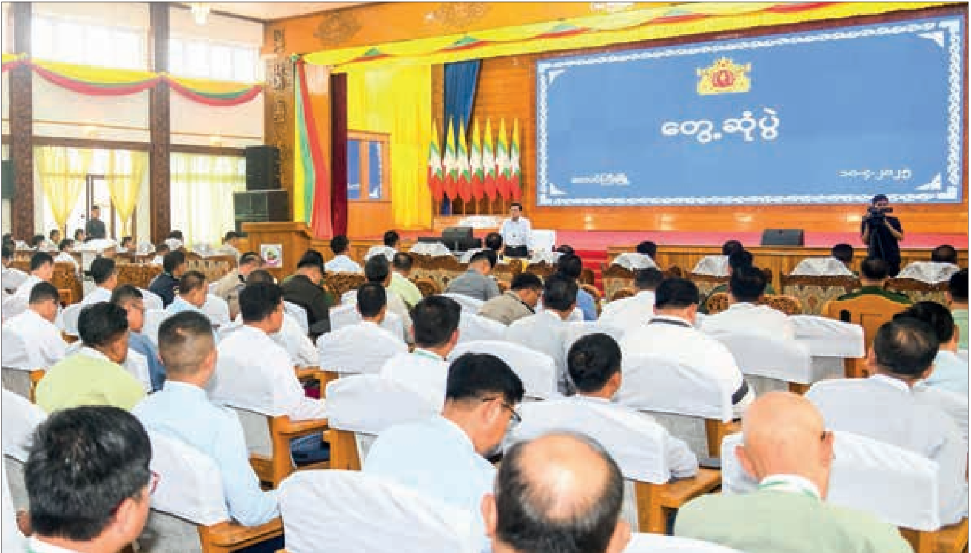
State Administration Council Chairman Prime Minister Senior General Min Aung Hlaing meets departmental personnel at different levels in Taunggyi yesterday.

Chairman of the State Administration Council Prime Minister Senior General Min Aung Hlaing held separate meetings with departmental personnel at different levels at the city hall in Taunggyi and at the meeting hall of the Pa-O Self-Administered Zone in Hopong, Shan State (South) to talk about the earthquake disaster and regional development measures.