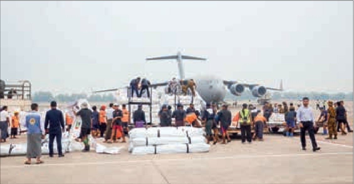
Humanitarian aid arrives at Yangon airport from the UAE.