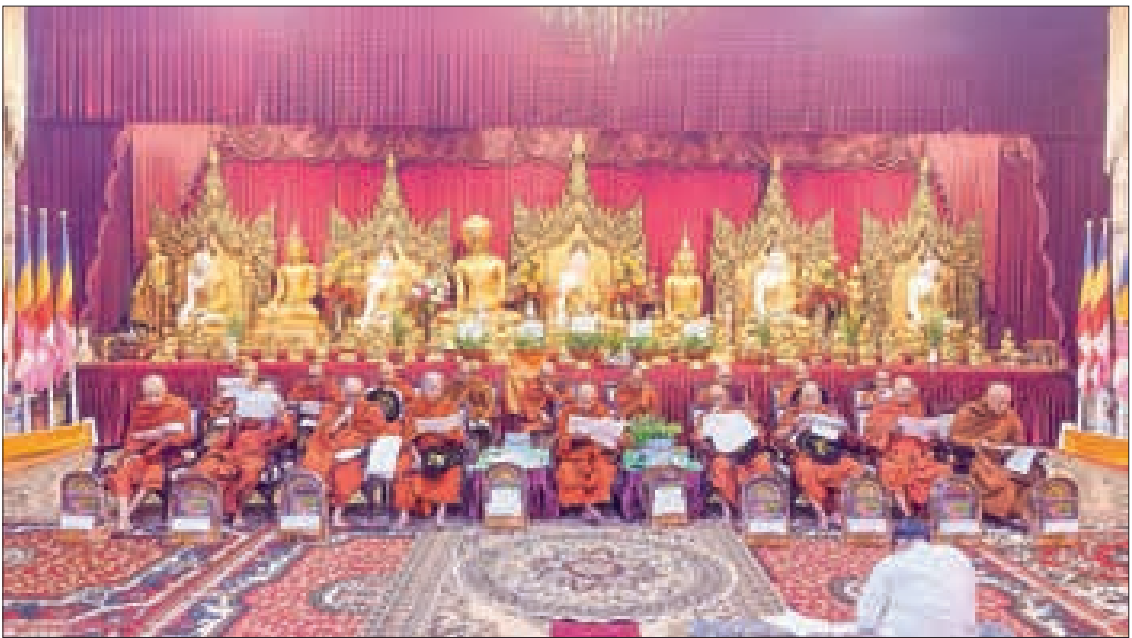
This photo shows the Paritta recitation event held at the ancient Buddha statues prayer hall in Shwedagon Pagoda.

The opening ceremony was held on 8 April at the Ancient Buddha statues prayer hall at the southern stairways of Shwedagon Pagoda. The reciting event was attended by the Yangon Region Sangha Maha Nayaka Committee Chairman along with Sanghas, members of the Yangon Region government, department