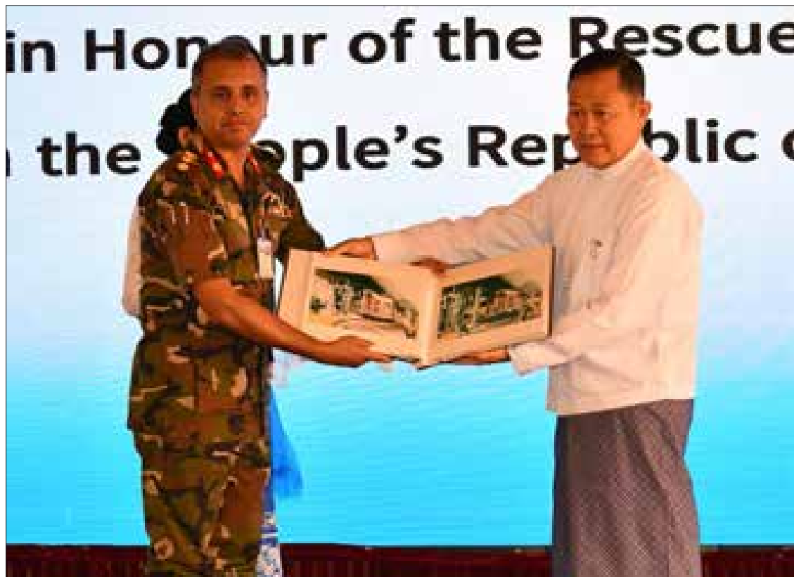
State Administration Council Vice-Chairman Deputy Prime Minister Vice-Senior General Soe Win presents appreciation document and gifts to Bangladeshi search-and-rescue, and medical teams.

of 55 personnel led by Colonel Shamim Iftakhar and Colonel Nasir — comprising search and rescue teams, support and relief teams, medical teams, and structural engineering teams — arrived in Nay Pyi Taw at 2:00 pm on 1 April, along with 69 types of modern search and rescue equipment, and participated in rescue operations.