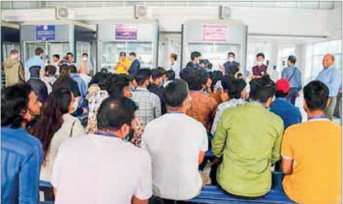
Immigration process in progress for undocumented foreigners.

AFTER the Mandalay earthquake, visitor arrival to Ngwehsaung Beach has been low, according to residents and visitors. Hotel rooms were booked for Thingyan since March but some were resold and cancelled, said a resident. “It may be related to the quake. The beach has yet to be crowded. People postponed their bookings and some resold. It seems the visitor arrival won’t be large this year. Some visitors won’t come. Rooms are still available. There are just a few visitors for now at the beach,” said a travel planner. Over previous years, even in early April before the Thingyan Festival, the two local famous beaches – Chaungtha and Ngwe-