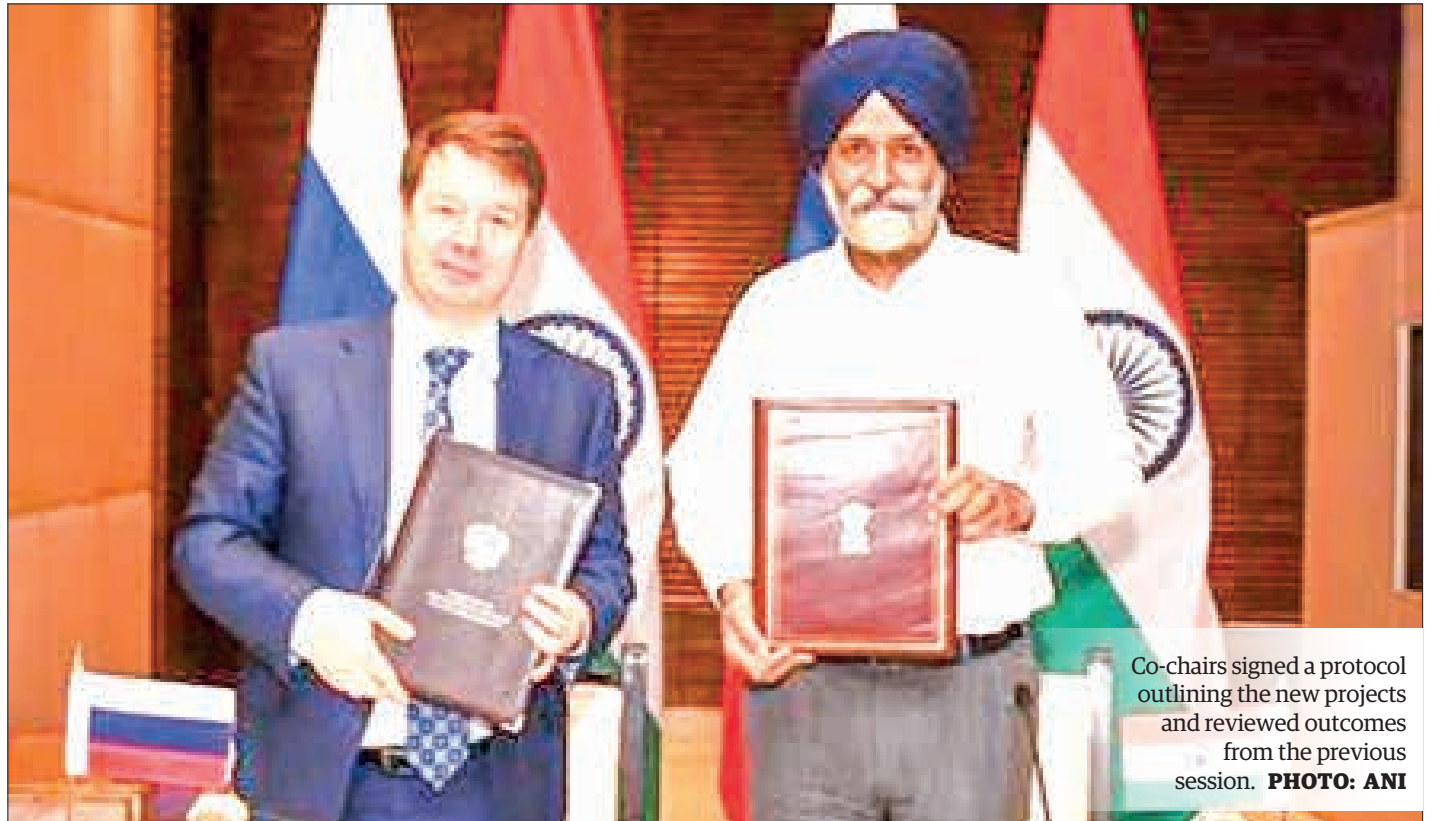
Co-chairs signed a protocol outlining the new projects and reviewed outcomes from the previous session. PHOTO: ANI

Although one of the most difficult aspects of building the system is the parasite's changing morphology throughout the mosquito's life cycle, BRIN is optimistic that the technology will make a substantial contribution to malaria eradication efforts in Indonesia. BRIN has also encouraged collaboration among scholars, industry, and government to create AI that is relevant to local requirements. — Xinhua