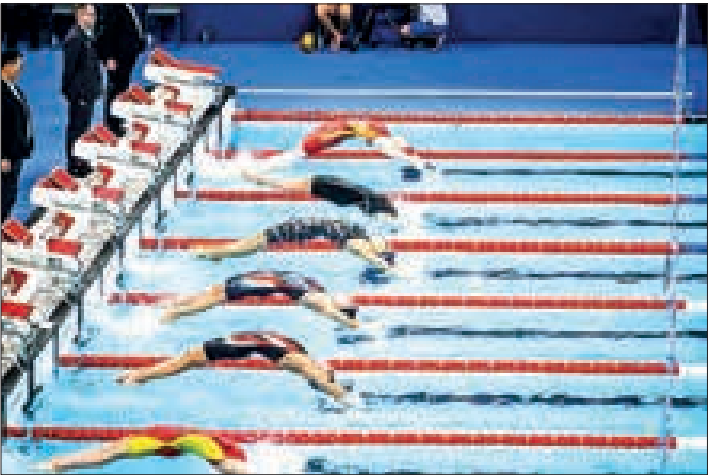
Six new swimming events will be contested at the 2028 LA Olympic.

ADAM Peaty announced Wednesday he intends to compete at a fourth Olympics after six new swimming events were added to the 2028 Los Angeles Games in what he called "an amazing decision". The International Olympic Committee ratified a move that will see the 50-metre back-