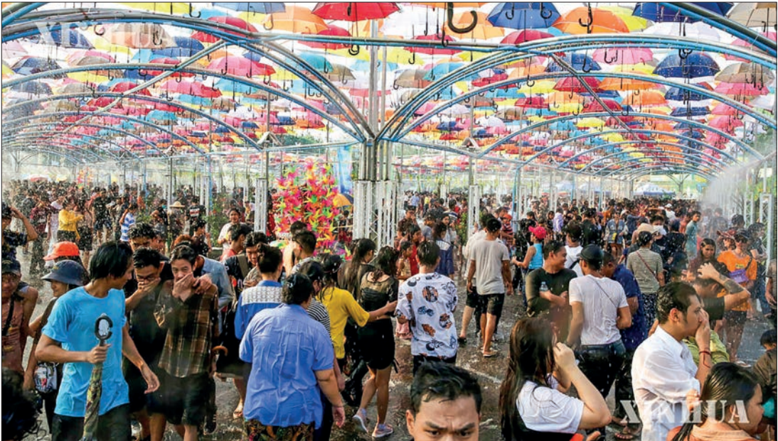
A glimpse of the People’s Square Thingyan Festival in the previous year.