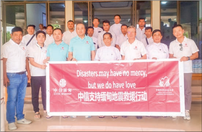
Donation event of CITIC Group (Myanmar) Company for powerful earthquake-affected employees of Ministry 2 at the Office of the Chairman of the SAC held in Nay Pyi Taw yesterday.