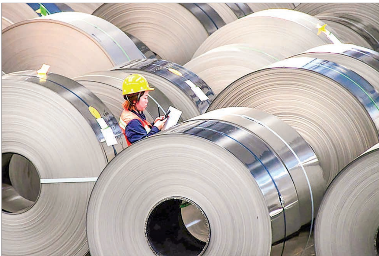
A staff member inspects stainless steel products at Tsingtu Group in Fu'an County of Ningde, southeast China's Fujian Province, 17 August 2022.

Since 2018, the US has imposed tariffs on over $500 billion worth of Chinese exports and implemented policies to contain China.