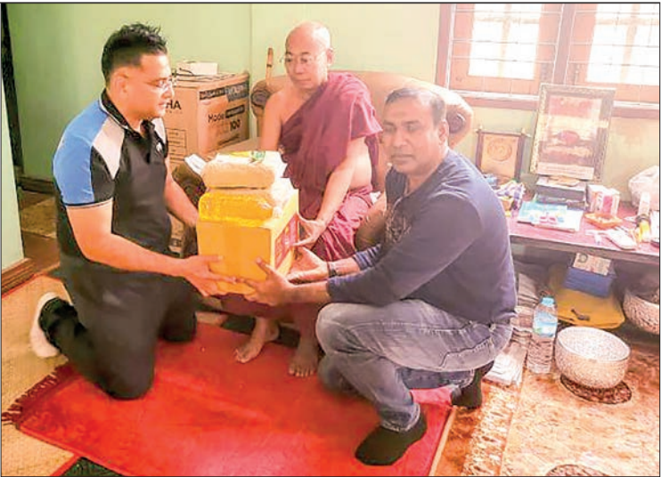
The Myanmar-Muslim Business Entrepreneurs' Association (Temporary) handing over cash and kind.

The Ministry of Religious Affairs and Culture, through the Department of Archaeology and the National Museum, continues to carry out systematic excavation and preservation of Myanmar's ancient cultural heritage. In this context, the department will continue its efforts to preserve and develop the newly uncovered Inwa-era heritage structure revealed by the Mandalay earthquake, with plans to open it to the public for study and appreciation. — ASH/KNN