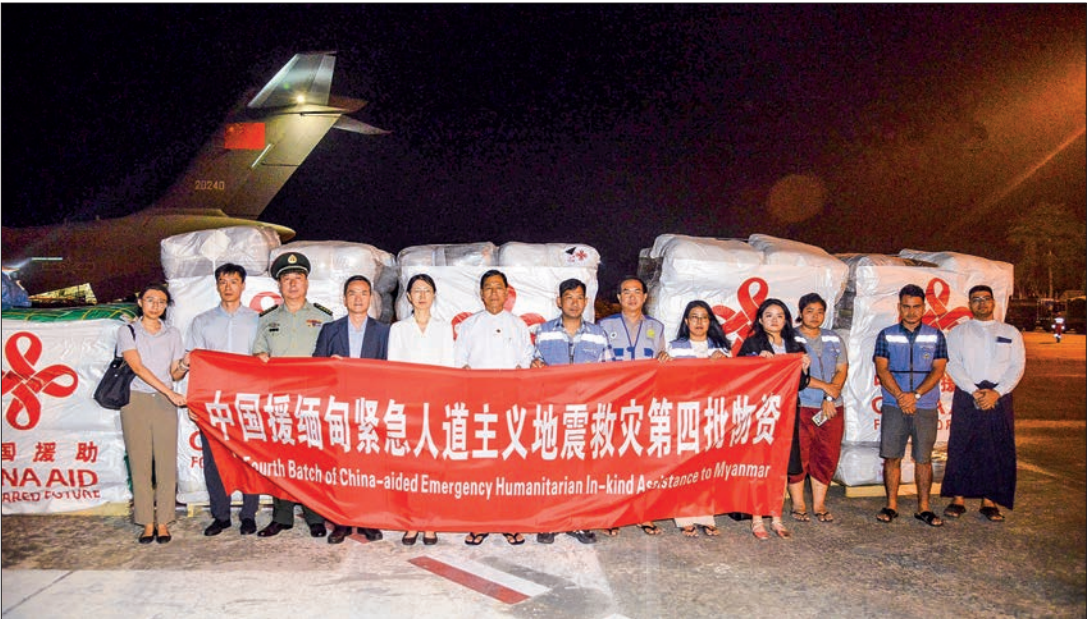
The acceptance ceremony for China-aided humanitarian materials is underway at the airport.

Region Chief Minister U Soe Thein, regional ministers, officials from the Ministry of Foreign Affairs and the Ministry of Social Welfare, Relief and Resettlement and Mr Jia Junjie, Minister Counsellor of the Chinese Embassy to Myanmar, along with other embassy staff. Tatmadaw personnel, Yangon City Development Committee staff and local cargo workers loaded the relief items onto vehicles. Under the supervision of the Yangon Region government, the supplies were then sent to Nay Pyi Taw to be delivered to the earthquake-affected areas. — MNA/KZL