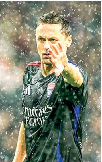
Lyon's Nemanja Matic had spells at Chelsea and Manchester United.

"But if you're one of the statistically worst goalkeepers in Man United's modern history, then he needs to show that before he says (anything). We will see." — AFP