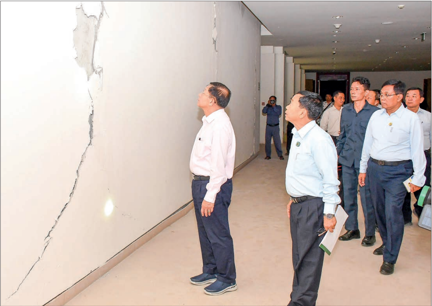
State Administration Council Chairman Prime Minister Senior General Min Aung Hlaing looks into the fragmented portions of the Myanmar International Convention Centre I (MICC I) in Nay Pyi Taw.