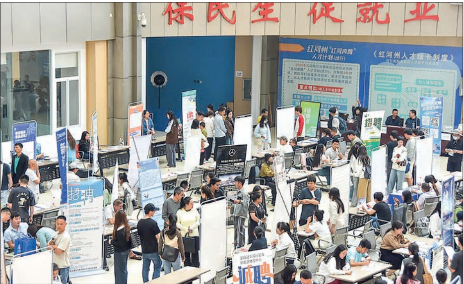
A job fair for college graduates is held in Honghe Hani and Yi Autonomous Prefecture, southwest China's Yunnan Province, China, 29 March 2025.

and evaluation tools, and reinforcing supports and safeguards for graduate employment. The document sets the goal of establishing a nationwide employment services network that is inclusive, well-functioning and reliable within three to five years, laying a solid foundation for graduates to find jobs. — Xinhua