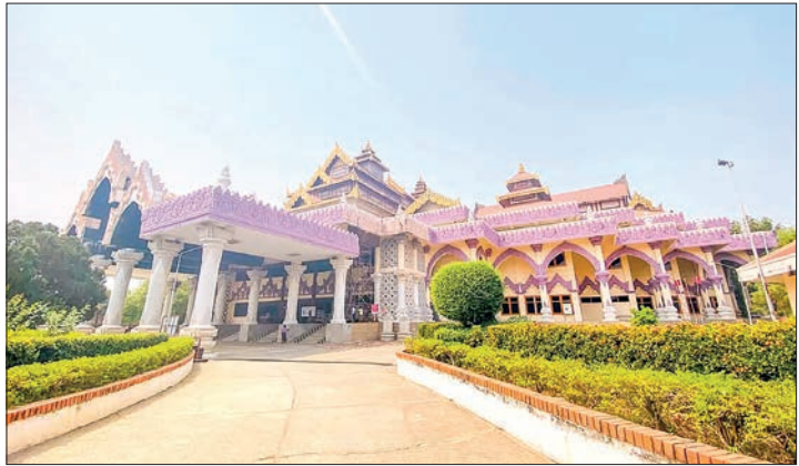
The façade of the Bagan Archaeological Museum.

The museum will be closed during the Thingyan holidays. — MT/ZS