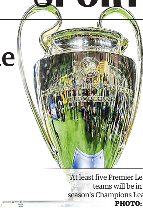
At least five Premier League teams will be in next season's Champions League.

have as many as seven clubs in next season's Champions League — the top five teams in the league, plus the Champions League winners and the Europa League winners if they finish outside the top five.