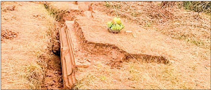
A view of parts of the Inwa-era ancient cultural heritage structure unearthed due to the powerful Mandalay earthquake.

DUE to the recent powerful earthquake in Mandalay, a cultural heritage structure from the Inwa period that emerged from underground will be systematically excavated and preserved, according to the Department of Archaeology and National Museum under the Ministry of Religious Affairs and Culture. Plans are also underway to make the site accessible to the public for educational purposes. It is reported that parts of the southern Thayetkin staircase of the structure were first discovered in 2009 during a brick-making activity by residents. Since then, the Department of Archaeology and National Museum has preserved the site. The recent earthquake has led to the further exposure of cultural heritage elements connected to the previously discovered