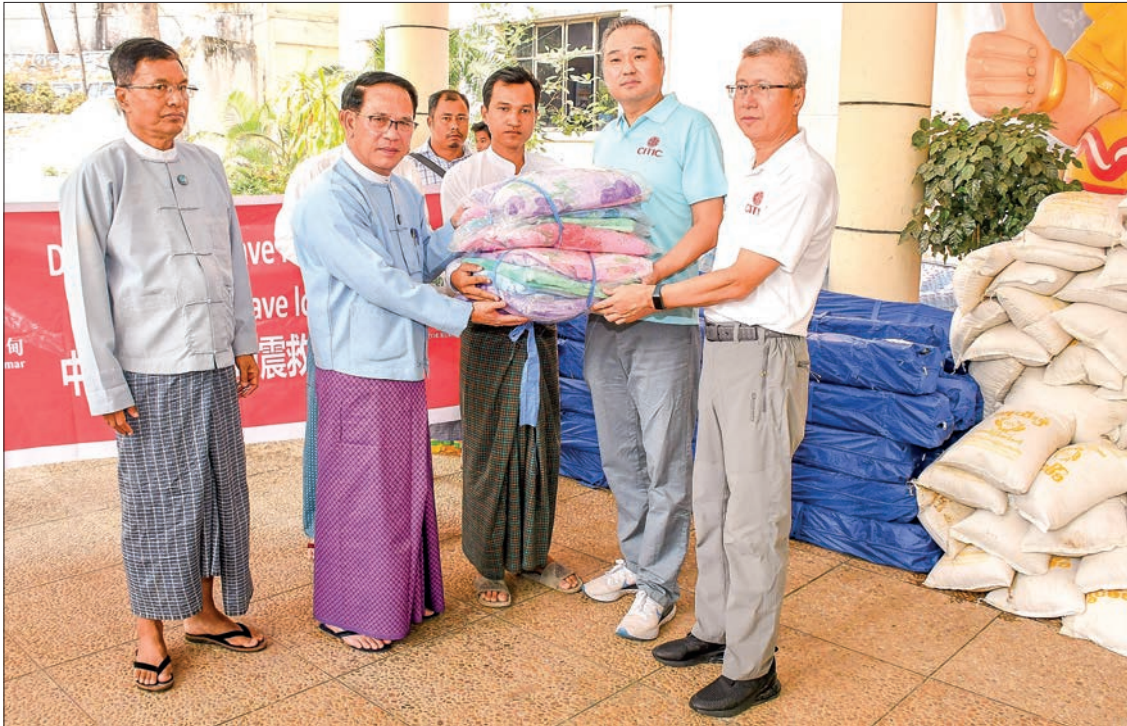
Union Minister U Maung Maung Ohn accepts the donations of CITIC Group (Myanmar) Co Ltd at the ministry in Nay Pyi Taw yesterday.