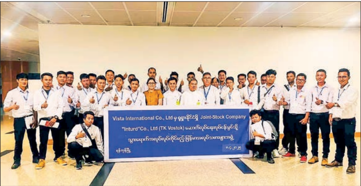
Myanmar workers seen before departing for Russia.

After the event, the Union minister discussed the promising opportunities in promoting bilateral cooperation in the energy sector with the delegation led by the vice-president of PTTEP International Ltd. The directors-general, managing directors, departmental officials and relevant officials of PTTEP International Ltd attended it. — MNA/KTZH