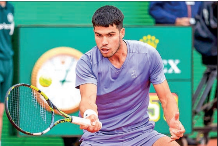
After dropping the opening set Carlos Alcaraz roared back to beat Francisco Cerundolo at the Monte Carlo Masters.

"The most important change was the return, I tried to return closer to the line and push him." The world No 3 booked himself a last 16 date against the German Daniel Altmaier, 84 th in the world, who saw off the French veteran Richard Gasquet 7-5, 5-7, 6-2. — AFP