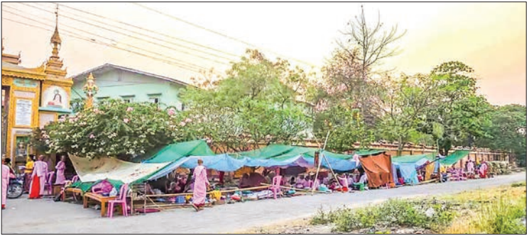
Nuns are seen living on the roadside.

Bhaddanta Tejaniya. The donation included K45 million worth of an automatic water purifier, 10,000 litres capacity water tank, 100 personal emergency kits and 2,000 drinking water bottles, amounting to over K100 million. — MNA/KTZH