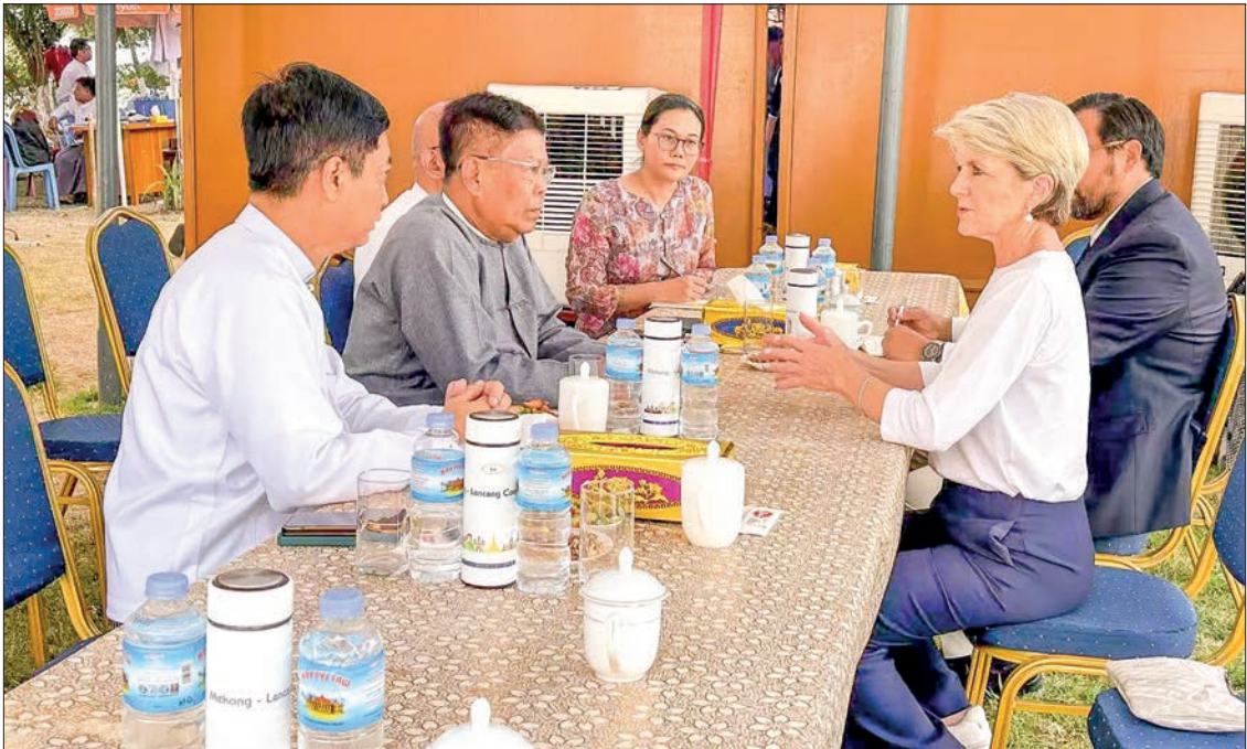
Deputy Prime Minister Union Minister U Than Swe receives Special Envoy of the United Nations Secretary-General on Myanmar Ms Julie Bishop in Nay Pyi Taw yesterday.

They discussed matters to be coordinated between Myanmar and the United Nations concerning assistance and response efforts for the people affected by the earthquake. The Special Envoy also expressed her sincere condolences and empathy for the loss of lives and livelihoods caused by the Man-