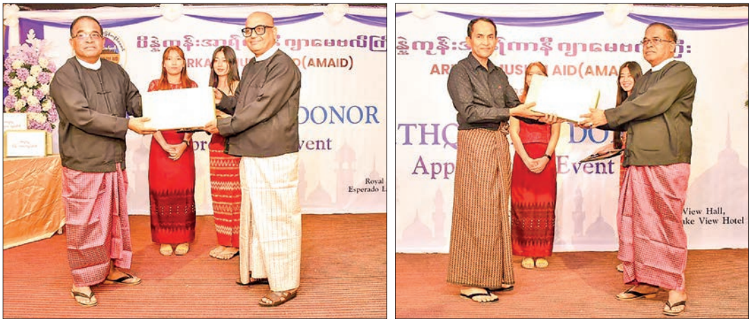
Photos showcase a ceremony where the Interfaith Friendship Group and donors provided K1.06 billion to AMAID on 8 April at the Esperado Lake Hotel.

A ceremony was held on 8 April at the Esperado Lake Hotel on Kanyeiktha Road, Mayangon Township, Yangon Region, where the Interfaith Friendship Group and donors donated K1.06 billion to Arkani Muslim Aid (AMAID), an organization supporting earthquake-affected people in Sagaing and Mandalay regions.