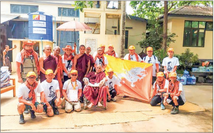
Group photo documenting the donation event by the Bhutan medical relief team.

Oo, Deputy Minister for Foreign Affairs U Lwin Oo, and departmental officials. — MNA/MKKS Chinese SAR teams begin their journey home from Nay Pyi Taw Tatmadaw Airport.