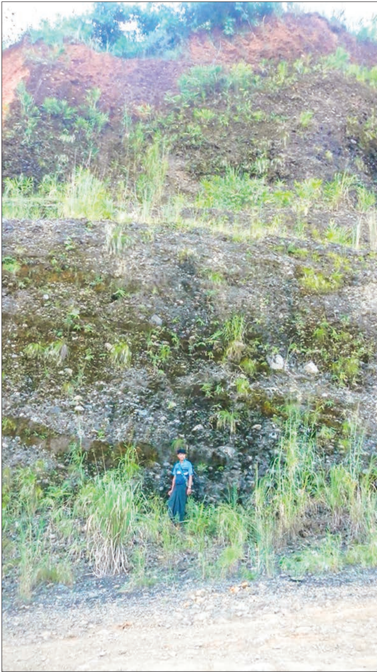
Uru Boulder Conglomerate.

Old Kachin Workings.: Many old Kachin workings are to be seen to the southwest of the Dwingyi (big mine). When the jadeite was first discovered here at Tawmaw there were only three of four feet of overburden in places, and the covering of serpentine was practically absent. The depth of the numerous deserted pits seldom exceeds six feet. The abandoned water races used to sluice away the overburden are still to be seen. The general section of