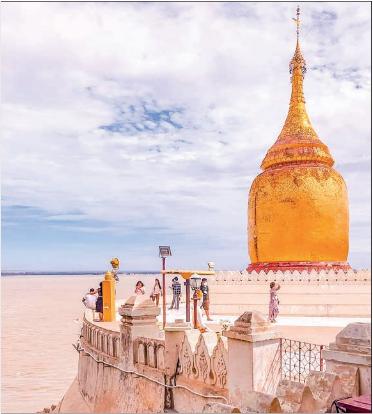
Travellers are seen against the backdrop of beauty and serene scenes of the Bagan Ancient Cultural Heritage Zone.

The people are urged to receive vaccination of COVID-19 without fail as full-time vaccination of COVID-19 and receiving booster shots can effectively mitigate infection of the virus, severe suffering from the disease and increase of death rate due to the disease.