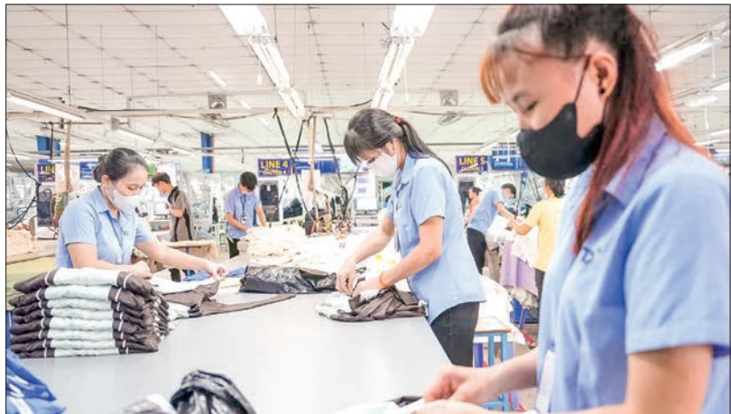
Garment workers in Ho Chi Minh City on 3 April. The 46 per cent US tariffs threaten to devastate Vietnam's economic growth plans.

"Trade wars benefit no one, but harm everyone," he said. "In a global context as complex as the one we are in, the Spanish government is firmly committed to the opening up of our country and Europe to Southeast Asia," he added. — AFP