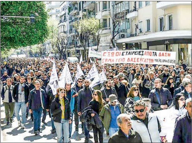
Greek unions called for a 24-hour strike against the high cost of living.

MORE than 15,000 people took to the streets in Greece on Wednesday in the second 24-hour general strike this year, calling for higher wages to match the rising cost of living. Transport ground to a halt as air traffic controllers joined the action, while rail and public transport as well as island ferry services were hit. Schools, courts, banks and public offices were also shut as part of the demon-