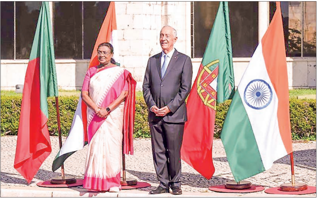
Indian President Droupadi Murmu during her visit to Portugal.

This will be the first visit by an Indian president to Slovakia in 29 years.