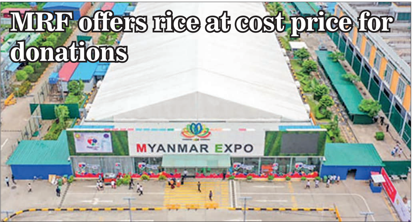
An aerial drone view of the Buy to Donate and Help Trade Fair organized by Myanmar Digital Economy Association is held at Fortune Plaza to provide humanitarian aid to earthquake victims.

CBM pumped over $88 million, 7.5 million yuan and 161 million baht in February and over $124 million, over 13.8 million baht and over 4.8 million yuan in January 2025. CBM aims to curb the instability in the foreign exchange market and the currency devaluation. According to CBM's notification on 15 March, it has been collaborating with law enforcement agencies to combat and prosecute those who attempt to manipulate the currency market under the existing laws. CBM allowed authorized dealers (private banks) to operate online foreign exchange trading freely as per the market rate depending on supply and demand, starting from 5 December 2023. — NN/KK