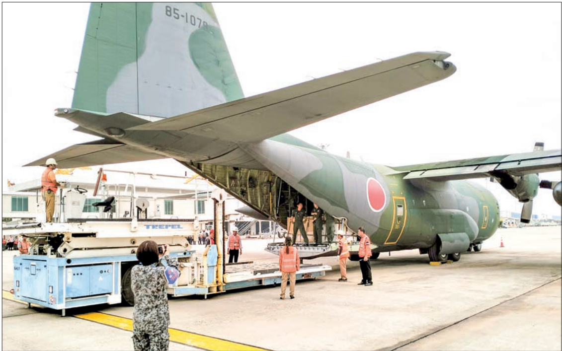
Ground services are provided free of charge for earthquake relief materials at the newly reopened airport.

In the aviation sector, international aircraft carrying relief supplies, provisions, medicines, and rescue teams began arriving daily on 29 March 2025 at Yangon International Airport,