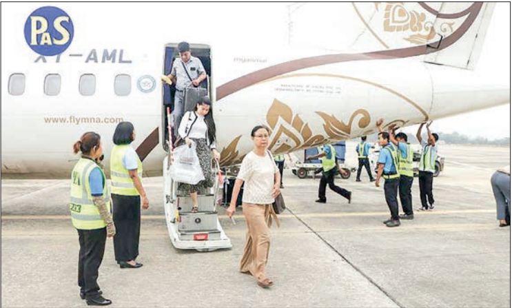
This photo reveals travellers at Nay Pyi Taw International Airport.

the powerful earthquake that struck on 28 March and allowed time for essential repairs and maintenance at the airport. Domestic flight services began resuming on 7 April, with MNA and Air Thanlwin restarting operations on that date. Mingalar Air is set to resume its services on 9 April. — ASH/MKKS