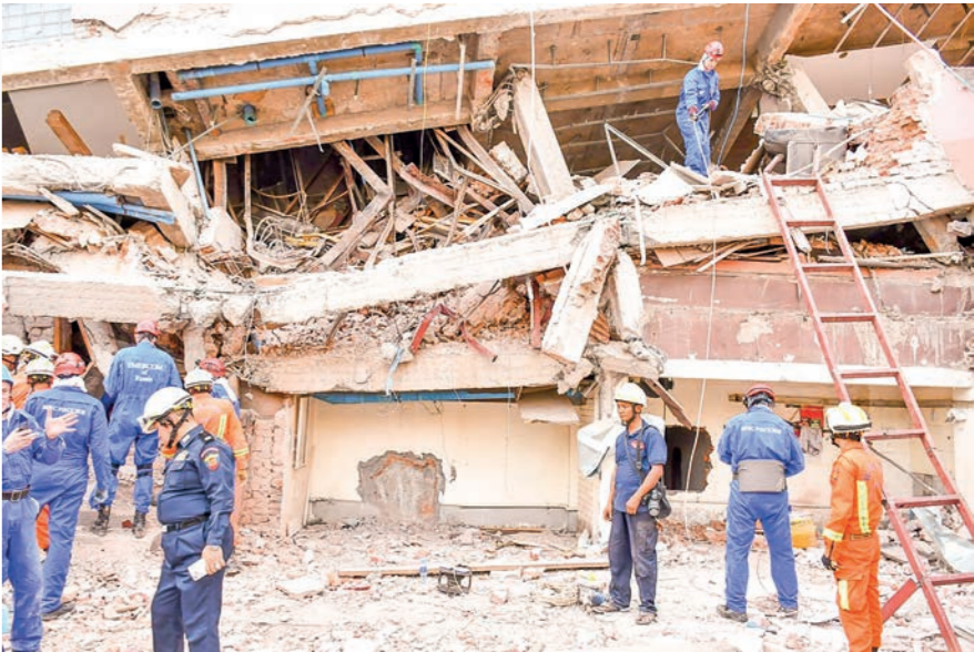
Chinese and Russian rescuers in collaboration with Myanmar counterparts making relief efforts.

Then there’s the emotional side. A kind word or a helping hand can lift someone’s spirits when they’re drowning in sadness. But we need more than quick comfort. Healing those hidden hurts takes time. Hotlines where people can talk, one-on-one chats with counsellors, or even group sessions could make a difference. Gathering for prayers or small acts of kindness can remind everyone they’re not alone. The survivors have lost so much – homes, loved ones – but we can surround them with care and support. It’s about holding each other up, even when everything else has fallen.