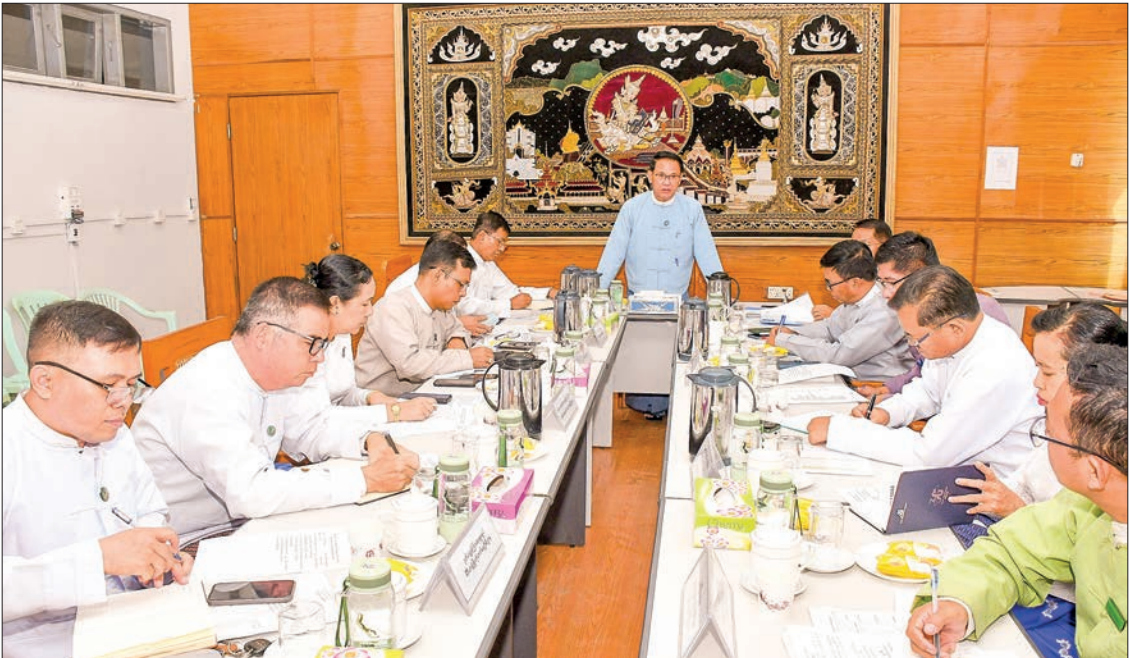
Union Minister U Maung Maung Ohn remarks at the meeting of the National Disaster Management Committee and the News and Information Work Committee in Nay Pyi Taw.

THE National Disaster Management Committee and the News and Information Work Committee meeting was held at the Ministry of Information in Nay Pyi Taw yesterday. Union Minister for Information U Maung Maung Ohn, who is also Chair of the News and Information Work Committee, said the media sector is more important during the outbreak of natural disasters than at normal times. Currently, it is crucial to eliminate fake news and misinformation through the media and to issue awareness programmes on natural disasters, damage and losses, rescue operations, rehabilitation efforts, and messages of support from international countries, promptly. It is vital for both the government and the public to have access to accurate and reliable information. The committee members also should continuously monitor the statements