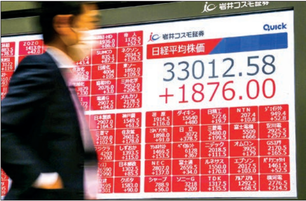
A financial data screen in Tokyo shows the Nikkei stock index closing at 33,012.58 on 8 April 2025, up 1,876.00 points from the previous day.

All industry sectors advanced on the top-tier Prime Market, with gainers led by nonferrous met-