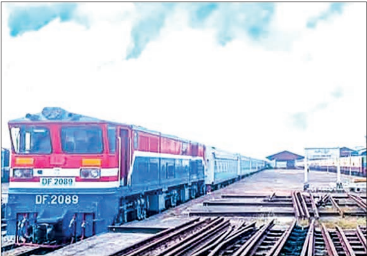
One of the special Yangon-Mawlamyine up-trains and down-trains.

Yangon at 9:15 am with eight ordinary and four upper coaches. The No 82 AAR down-train, which runs daily from Mawlamyine, will operate as usual. Down-train tickets will be sold at the Mawlamyine Station from 7 to 3 pm daily, with the upper class for three days in advance and the ordinary class for one day in advance. The special down-train will stop at Mottama, Paung, Zinkyaik, Yinnye, Thaton, Theinseik, Hninpale, Taungzun, Mayangon, Kyaikto, Kyaikkatha, Moppalin, Theinzayet, Waw, Bago, and Todegaungkalay stations, it said. — MT/ZN