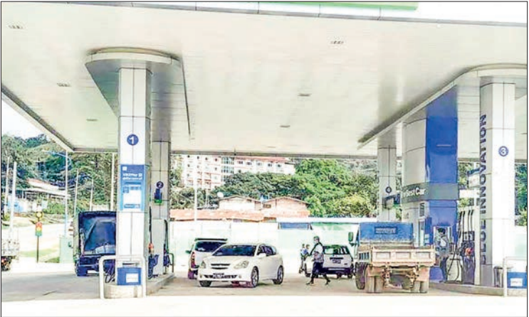
Vehicles being refuelled at a petrol station in downtown Yangon are captured in this image.

13.8 million baht and over 4.8 million yuan in January. CBM aims to curb the instability in the foreign exchange market and the currency devaluation. According to CBM's notification on 15 March, it has been collaborating with law enforcement agencies to combat and prosecute those who attempt to manipulate the currency market under the existing laws. CBM allowed authorized dealers (private banks) to operate online foreign exchange trading freely as per the market rate depending on supply and demand, starting from 5 December 2023. — NN/KK