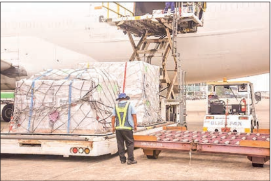
Relief aid from Australia being discharged upon their arrival at the airport.