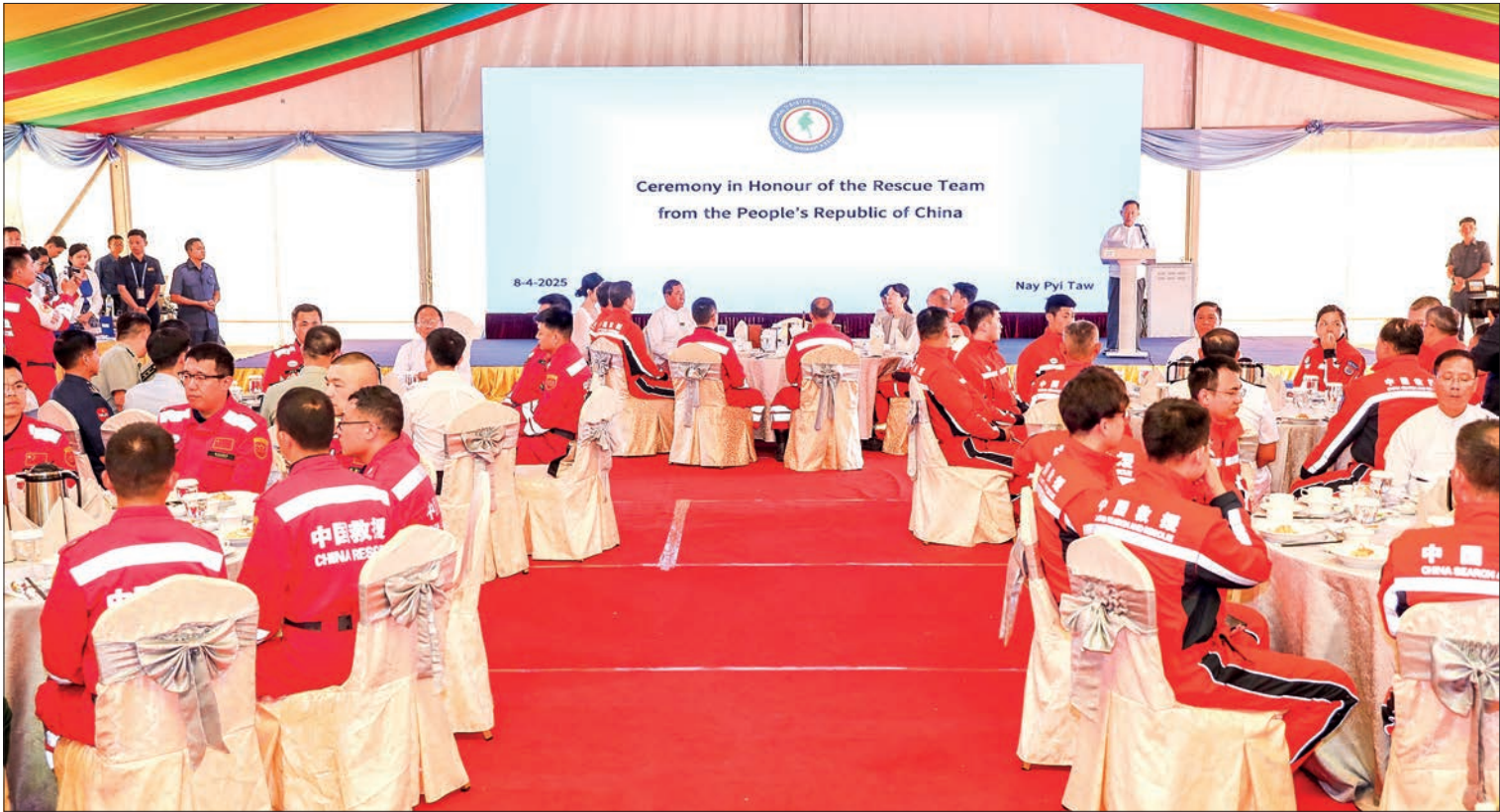
State Administration Council Vice-Chair Deputy Prime Minister Vice-Senior General Soe Win speaks on the honourable accasion to the Chinese emergency rescue teams yesterday.

China earliest dispatched 265 rescuers in four teams to Nay Pyi Taw. Moreover, China International Search and Res-