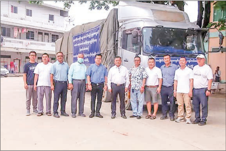
This photo showcases donors along with donated items from the Tachua Chinese Temple in Tachilek.

THE Tachua Chinese Temple in Tachilek, Shan State (East), and generous donors donated food, medicine, and supplies to those affected by the Mandalay earthquake for the second time on 7 April, with the total donation amount reaching approximately