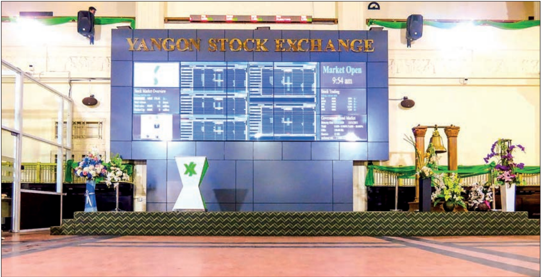
This image highlights the stock shares-indexing panel at the Yangon Bourse, capturing key market data.