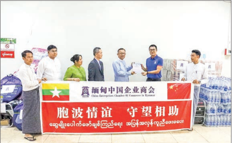
Union Minister Dr Kan Zaw presents the certificate of gratitude to CECCM.

DUE to the powerful Mandalay earthquake on 28 March, a total of 6,730 mobile communication base stations were damaged. Thanks to the restoration efforts of mobile operators, 5,999 stations had been successfully repaired as of 6 April. Nationwide, only 731 stations remain in need of repair — 62 belonging to MPT, 237 to ATOM, 164 to Ooredoo, and 268 to Mytel. Although 15 post offices under Myanma Post were temporarily closed due to the earthquake, operations had resumed as normal by 31 March. Postal services at the central post offices in Nay Pyi Taw and Mandalay have also returned to regular operation. Among the many damages caused by the severe earthquake, the quick restoration of electricity and communication services, along with the prompt construction and placement of temporary shelters, have been particularly notable achievements. These quick wins have been widely recognized and appreciated by both the general public and civil servants, who have expressed gratitude towards the government and responsible personnel. — MNA/MKKS