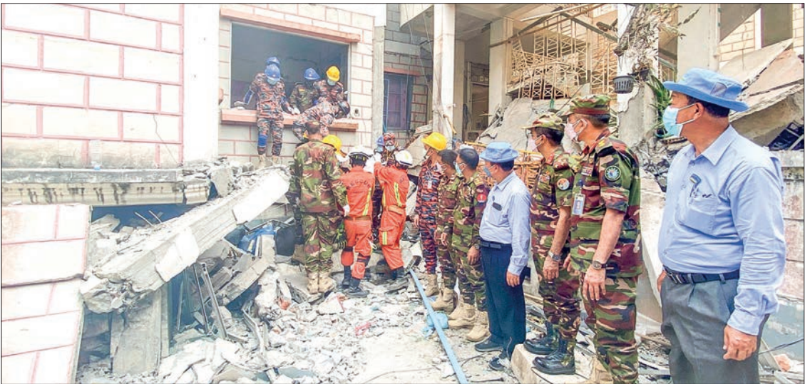
The Bangladesh Engineer and Fire Service Team working alongside local teams to recover bodies from the rubble in Nay Pyi Taw.

IN solidarity with the people of Myanmar, Bangladesh has swiftly responded to the earthquake-affected people of Myanmar. Two consignments of relief materials containing a total of 31.5 metric tonnes of relief materials including tents, food packets, medicines, and other essential supplies have been handed over to Myanmar already. On 30 March 2025, two Bangladesh Air Force/Army aircraft (C-130 and CASA) carrying the first consignment of the relief items landed at Yangon International Airport and on 1 April 2025, similar 03 aircraft carrying the second consignment of relief materials landed at the Nay Pyi Taw International Airport. Bangladeshi Ambassador to Myanmar Dr M Monwar Hossain handed over the relief materials to Yangon Region Chief Minister U Soe Thein in Yangon and to Ambassador at Large of Myanmar Foreign Ministry U Kyaw Tun at the Nay Pyi Taw Airport. It may be mentioned that a Bangladesh Navy Ship, carrying more than