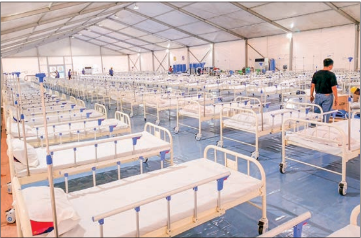
This image showcases the expanded field medical facility, designed to offer enhanced care for earthquake survivors.

water. After the meeting, the Union minister and party presented the donated relief items to the quake-affected staff of the Ministry of Information. At noon, the Union minister received a Chinese delegation led by Minister Counsellor Dr Zheng Zheng of the Embassy of China in Myanmar Dr Zheng Zheng at the temporary office building of the ministry and discussed the damage after the powerful earthquake, Chinese humanitarian assistance to quake victims and further bilateral cooperation. Afterwards the Union minister and party inspected the construction of relief camps for staff by the UAB foundation at Dhana Theikdi stadium in Zabuithiri township, food, access to electricity and clean water, and a location to establish a clinic for healthcare services. — MNA/KTZH