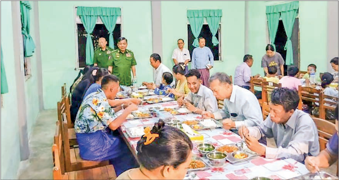
SAC Member Deputy Prime Minister Union Defence Minister General Maung Maung Aye views round the staff's temporary relocation facility. MEMBER of the State Administration Council Deputy Prime Minister and Union Minister for Defence General Maung Maung Aye, accompanied by ministry officials, visited the

housing and temporary evacuation areas of the ministry's personnel and staff affected by the strong earthquake and met their families yesterday evening. The General and his team first met and encouraged the staff and their family members of the ministry residing in the Wunna Theikdi Housing Complexes (1, 2, 3, and 4), which the inspection teams from the Ministry of Construction's Department of Buildings determined to be fit for re-occupancy, and instructed the responsible officials to take strict measures to fulfil the employees' needs, including drinking water and sustenance. The Union minister and his team proceeded to the local training school where employees and their families from Padauk Housing Complex (603), (755), (756) and Acre Tahtaung Housing Complex (1394) were temporarily evacuated because the teams from the Ministry of Construction's Department of Buildings determined their housing complexes were not suitable for re-occupancy. The General met and spoke to the staff and their families, instructing officials to take strict measures to ensure they have access to sufficient drinking water, adequate food, medical treatment, and other necessities, and to coordinate based on the reported needs of family members. — MNA/TH