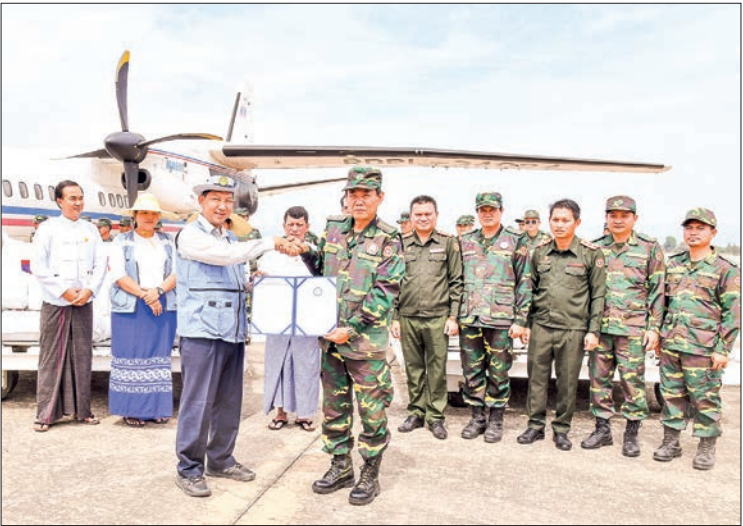
A handover event of rescue and relief supplies at the airport.

five aircraft from Belarus, China, Vietnam, Singapore, and Laos arrived at Yangon International Airport and Nay Pyi Taw International Airport, carrying 60.46 tonnes of relief supplies. Efforts are underway to ensure these donated relief items reach the hands of affected people as quickly and efficiently as possible.