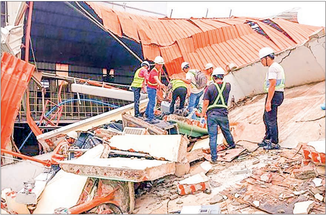
Post and telecoms staff hard at work repairing systems to restore regular connectivity.

DUE to the powerful earthquake, communication was disrupted at 6,730 mobile communication base stations out of more than 26,000 stations across 11 regions and states, including Nay Pyi Taw Council Area, Mandalay Region, and Sagaing Region. Thanks to the concerted efforts of telecom operators, approximately 6,000 base stations had been restored by 7 April. As of now, mobile communication has resumed at 96 per cent of base stations in Nay Pyi Taw, over 88 per cent in Mandalay Region, and 91 per cent in Sagaing Region. In order to ensure that people in the earthquake-affected areas have access to internet services, the Myanmar Internet Exchange Association has opened two Wi-Fi centres under the Mudra Project – one at Mingalar Yankin Public Housing and the other at the old airport in Chanmyathazi, both in Man-