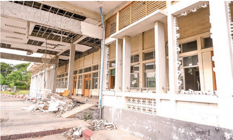
The damaged sections of the hospital.

C HAIRMAN of the State Administration Council Prime Minister Senior General Min Aung Hlaing, accompanied by Council Joint Secretary General Ye Win Oo and party, yesterday afternoon inspected the loss and damage at the medical wards and staff housing of Nay Pyi Taw People's Hospital (300-bed) caused by the Mandalay earthquake. The Senior General and party viewed round damaged parts of medical wards, intensive care units, staff housing, and operation theatres in the compound of the hospital