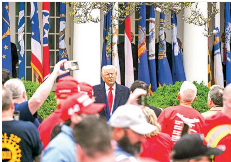
US President Donald Trump looks at attendees after delivering remarks on reciprocal tariffs during an event in the Rose Garden entitled “Make America Wealthy Again” at the White House in Washington, DC, on 2 April 2025.

US President Donald Trump said Monday the European Union's proposal for an exemption from tariffs on industrial products, including cars, is not enough to account for the transatlantic trade deficit.