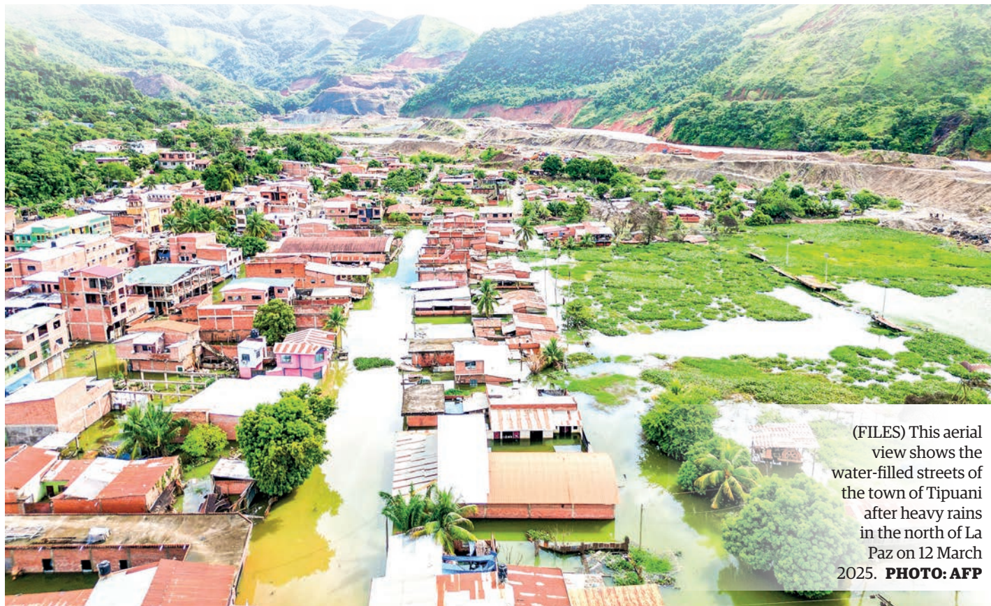
(FILES) This aerial view shows the water-filled streets of the town of Tipuani after heavy rains in the north of La Paz on 12 March 2025.

He also disclosed that a “very big meeting” involving “very high-level” officials would be taking place this Saturday. The discrepancy over whether the talks are direct or indirect has persisted since early March, when Trump stated he had sent a letter to Iranian leaders — via the United Arab Emirates — proposing direct negotiations on Iran's nuclear programme. — Xinhua