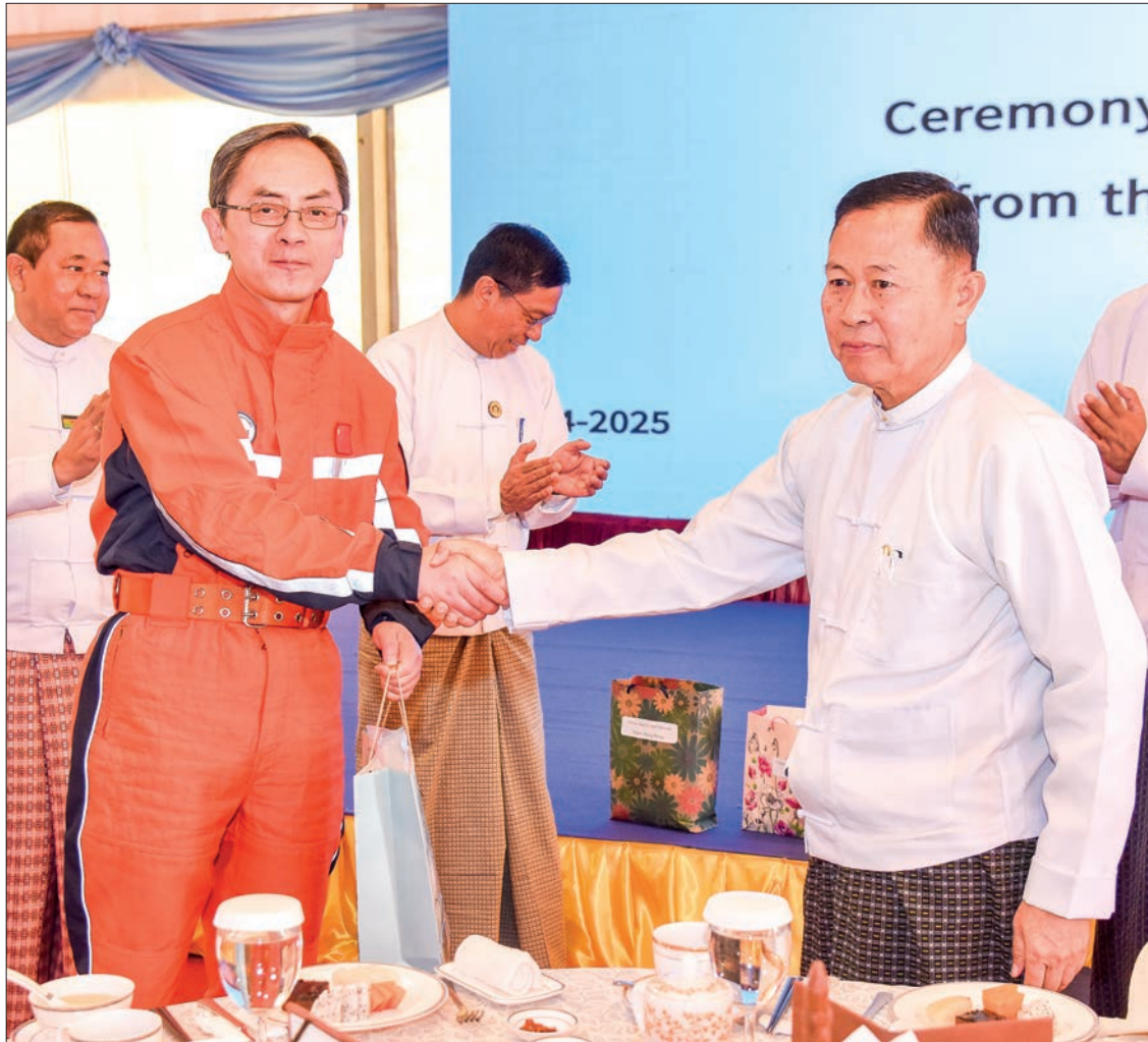
Vice-Senior General Soe Win honours the Chinese disaster response teams in Nay Pyi Taw.

At the same time, it was also observed that members of the China International Search and Rescue Team (CISAR) (Beijing), comprising 118 personnel and seven search-and-rescue dogs, as well as 89 members of the Chinese Blue Sky Search and Rescue Team and 51 members of the Hong Kong China Search and Rescue Team, carried out tireless and