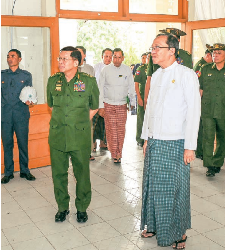
State Administration Council Chairman Prime Minister Senior General Min Aung Hlaing views round the damaged parts of the 300-bedded Nay Pyi Taw People's Hospital yesterday.