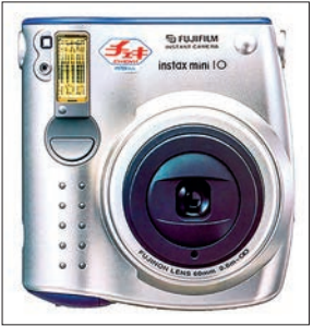
Supplied photo shows Fujifilm Corp's first-generation "instax" instant camera model released in 1998.

UNIT sales of Fujifilm Corp's "instax" instant camera series have exceeded 100 million, the