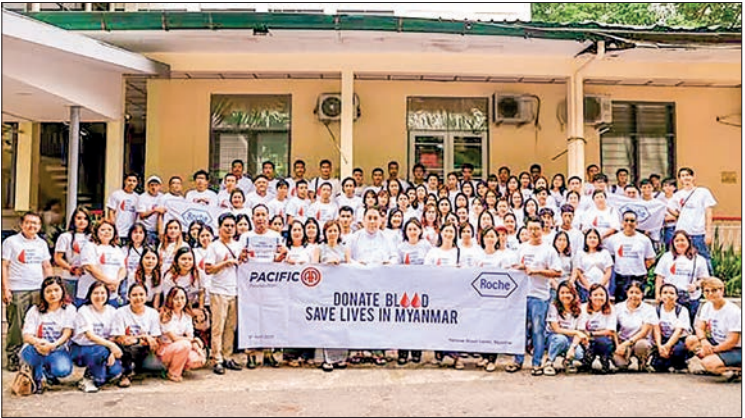
Scenes from the blood donation event held by the Pacific AA Foundation and Roche Myanmar at the National Blood Centre.

All participating staff and donors received Feropac iron supplements (192 bottles), as well as breakfast and lunch. — ASH/MKKS