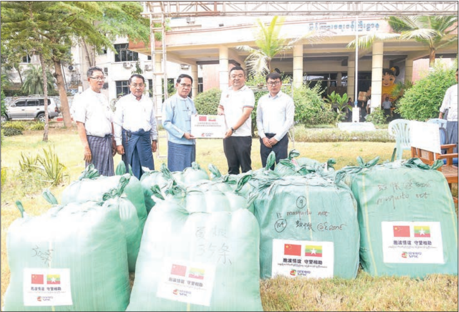
Union Minister U Maung Maung Ohn accepts the donated relief items.

UNION Minister for Information U Maung Maung Ohn received the first batch of relief supplies donated by the State Power Investment Corporation (SPIC) of China through the Myanmar Consulate General in Kunming for the earthquake-affected people yesterday in Nay Pyi Taw. First, the Union minister appreciated the donation and explained the damage after the earthquake, rescue operations, measures to ensure access to electricity and drinking water, arrangements to resume the office operations and rehabilitation processes. Then, an official from SPIC clarified the donation and committed further assistance. Then, they presented the relief supplies to the Union minister. Similarly, the officials of SPIC donated the relief supplies for the Ministry of Electric Power.