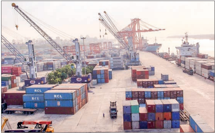
Containers are seen at the container yard and port terminals.

FOLLOWING the negative consequences of the powerful earthquake, the Trade Department under the Ministry of Commerce has been granting import licences for essential goods required, including pharmaceuticals, steel bars, zinc sheets, cement, construction materials, electrical devices and water supplies, industrial machinery and spare parts, promptly on the same day