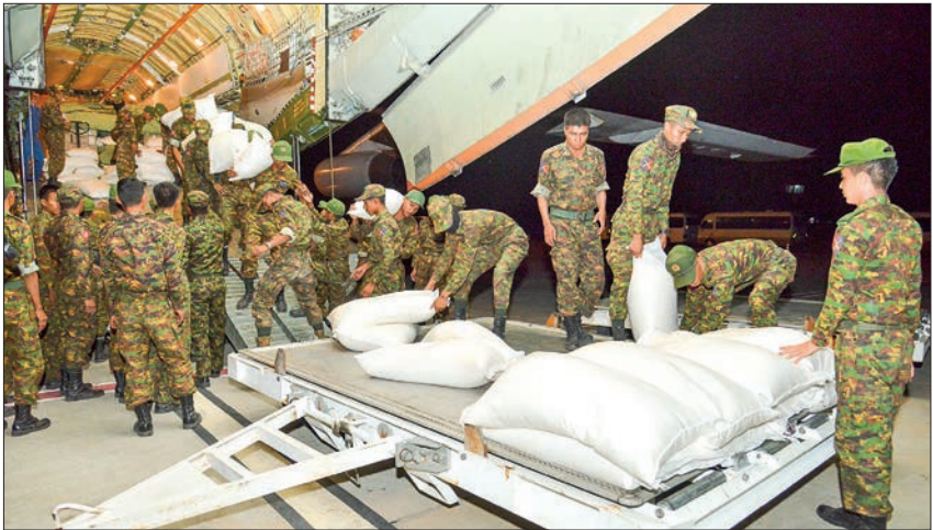
Relief supplies from Belarus.