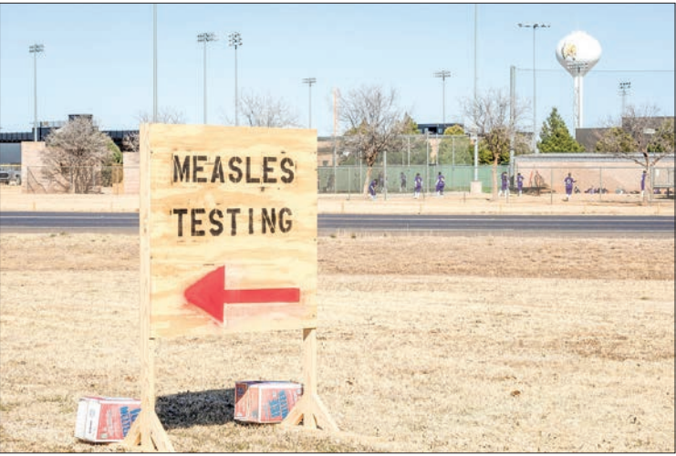
(FILES) Signs point the way to measles testing in the parking lot of the Seminole Hospital District across from Wigwam Stadium on 27 February 2025 in Seminole, Texas.

The CDC has recorded cases stretching from Alaska to Florida, as well as in New York City. Texas had reported its first measles death, also of a child, in late February — marking the first US fatality from the disease in nearly a decade. The death of a New Mexico adult last month was also classified by the CDC as a measles-related fatality. The vast majority of measles cases tallied by the CDC — 97 per cent — are patients not vaccinated against the measles, it