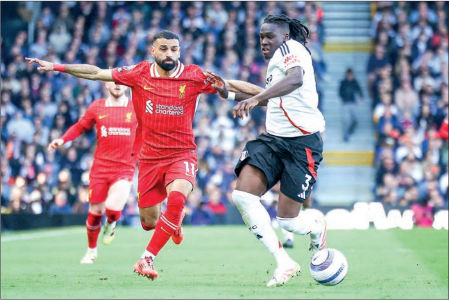
Fulham's Italian-born Nigerian defender (3) Calvin Bassey (R) vies with Liverpool's Egyptian striker (11) Mohamed Salah (L) during the English Premier League football match between Fulham and Liverpool at Craven Cottage in London on 6 April 2025.

LIVERPOOL stumbled in the Premier League on Sunday with a 3-2 defeat away to Fulham, putting the brakes on Arne Slot's side's efforts to take another step towards securing this season's title.