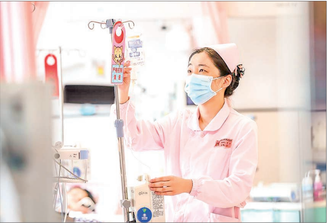
A nurse works at a maternal and child health care hospital in Huai'an City, east China's Jiangsu Province, 12 May 2024.

IN 2024, China recorded a maternal mortality rate of 14.3 per 100,000 live births, an infant mortality rate of 4 per 1,000, and a mortality rate of 5.6 per 1,000 for children under the age of five, according to health authorities. In recent years, China has seen consistent improvements in maternal and child health. The maternal mortality rate has declined at an average annual rate of around four per cent, while both the infant mortality rate and the under-five mortality rate have seen average annual decreases of approximately five per cent. Notable progress has also been made in the prevention and treatment of major diseases affecting women and children. Over the past five years, mortality rates among infants and children under five caused by birth defects have each dropped by more than 30 per cent. In addition, the incidence of severe and disabling birth defects, such as neural tube defects and Down syndrome, has declined by 21 per cent. The rate of mother-to-child transmission of HIV has also fallen, currently standing at