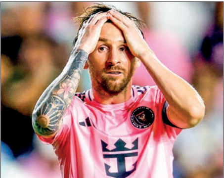
Inter Miami CF's Argentine forward (10) Lionel Messi reacts during the Major League Soccer (MLS) match between Inter Miami CF and Toronto FC at Chase Stadium in Fort Lauderdale, Florida, on 6 April 2025.

On Saturday, Arsenal was held to a 1-1 draw at Everton. Leandro Trossard scored after an assist from Raheem Sterling to put Mikel Arteta's side ahead, but in the second half, Myles Lewis-Skelly's clumsy challenge on Jack Harrison allowed Iliman Ndiaye to equalize from the penalty spot. Quick-fire goals from Morgan Rogers and Donyell Malen saw Aston Villa to a 2-1 win at home against Nottingham Forest. — Xinhua