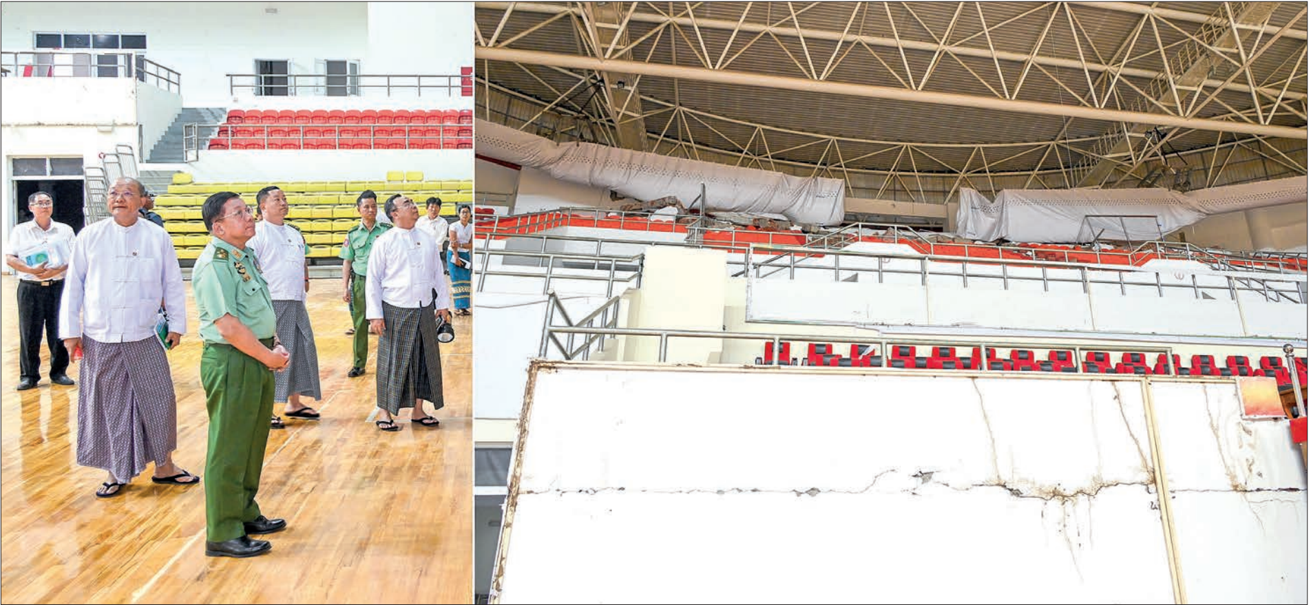
State Administration Council Chairman Prime Minister Senior General Min Aung Hlaing inspects damaged sections of Wunna Theikdi Sport Complex in Nay Pyi Taw yesterday.

SAC Chairman Prime Minister Senior General Min Aung Hlaing inspected the loss and damage at Wunna Theikdi Sports Complex caused by the Mandalay earthquake.