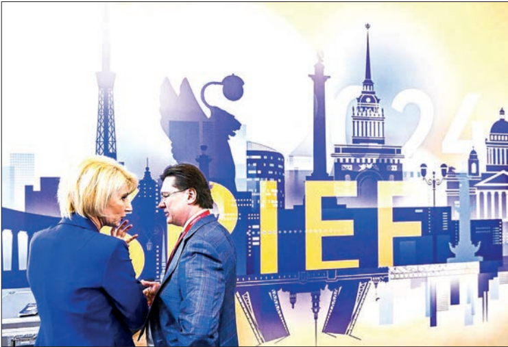
SPIEF-2024. Forum participants at the ExpoForum Congress and Exhibition Centre.

THE main theme of the St Petersburg International Economic Forum (SPIEF) in 2025 will be “Common Values — the Basis for Growth in a Multipolar World”, the Roscongress Foundation said on Monday. “The main theme of the forum in 2025 will be ‘Common Values — the Basis for Growth in a Multipolar World,’” the foundation said in a statement. The western Russian city of St. Petersburg will host the annual economic forum from 18-21 June. SPIEF 2024 brought together 1,800 guests from 139 countries and territories and saw the signing of more than 1,000 agreements worth a total of 6.4 trillion rubles ($74 billion). — SPUTNIK