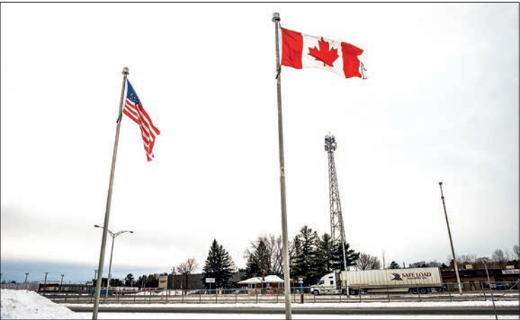
The Canadian and US flags fly near the Canada-US border in Blackpool, Quebec, Canada, on 2 February 2025.

CANADA has launched a complaint with the World Trade Organization over the steep tariff imposed on car imports by US President Donald Trump, the global trade body said Monday. "Canada has requested WTO dispute consultations with the United States concerning US measures imposing a 25 per cent duty on automobiles and automobile parts from Canada," the organization said. The request was filed last Thursday — the day the additional levy came into effect for all cars and car parts not manufactured in the United States, but it was only circulated to WTO members on Monday. In the request, the Canadian government charged that the tariffs were "inconsistent with United States' obligations" under international trade laws. Canada immediately hit back on the levies, saying Thursday it would impose a 25 per cent tariff on tens of thousands of vehicles imported from the United States. Since coming to power last January, Trump has unleashed a barrage of tariffs, and last week hit countries and goods around the world, sending markets crashing. Canada was largely spared from the sweeping global tariffs Trump announced last Wednesday,