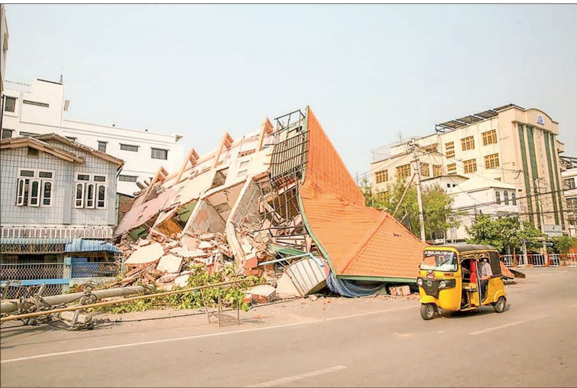
This photo taken on 29 March 2025 shows a damaged building after an earthquake in Mandalay, Myanmar.

By the time an earthquake starts to occur, most earthquake victims usually do not know in