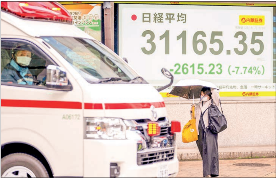
A pedestrian (R) stands in front of an electronic board showing the numbers of the Nikkei Stock Average on the Tokyo Stock Exchange along a street in Tokyo on 7 April 2025. unlikely to stop declining unless US stocks cease falling further,” said Yutaka Miura, senior technical analyst at Mizuho Securities Co. The circuit breaker was triggered for Nikkei stock futures, temporarily halting trading due to the sharp fall. South Korea’s bench-

STOCK markets across the Asia-Pacific traded sharply lower on Monday as financial turmoil sparked by the US “reciprocal tariffs” escalated recession fears worldwide. Hong Kong’s Hang Seng Index dropped 2,445.19 points, or 10.7 per cent, to end at 20,404.62 points in Monday’s morning session. The retreat widened from 9.28 per cent at opening. This came on top of losses in Japan, where the benchmark Nikkei stock index shed 2,843.48 points, or 8.42 per cent, in the first 15 minutes of trading, the lowest intra-day level since October 2023. “Japanese stocks are