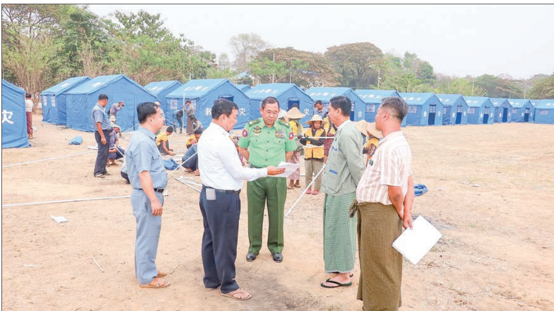
Union Minister Lt-Gen Tun Tun Naung and Union Minister Dr Soe Win inspect the construction of tents in Nay Pyi Taw.

The vice-chairs inspected the construction of temporary tents, bathrooms and toilets and access to water and electricity in Wunna Theikdi and Dhana Theikdi wards.