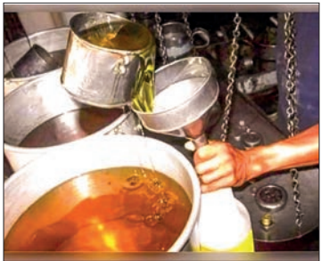
A vendor arranging cooking oil for sale at the market.

The department is working together with the Myanmar Oil Dealers' Association and the cooking oil importing companies