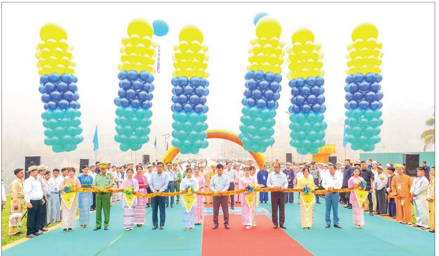
The new Thanlwin Bridge inaugurated on the Meiktila-Kengtung-Tachilek Union Highway yesterday, attended by SAC Secretary General Aung Lin Dwe.

completion can bring development to the border trade sector and promote the socioeconomic status of local ethnic people. — MNA/KTZH