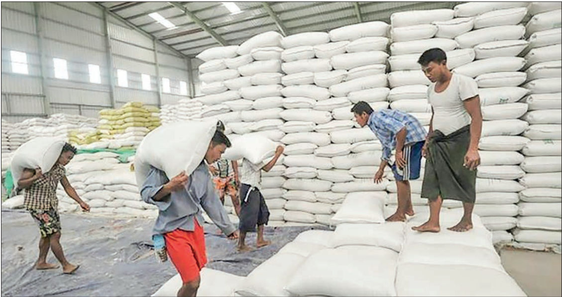
Workers diligently stacking export rice bags at the warehouse.

Most exports went from maritime trade, while border