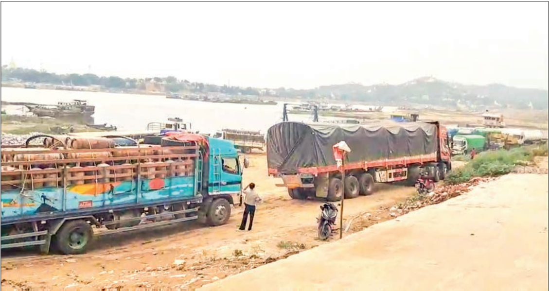
Efforts underway to ensure smooth freight lorry travel in quake-hit regions.

THE Ministry of Transport and Communications has been working to ensure smooth and accessible travel for people affected by the natural disaster and facing difficulties due to the earthquake. Both the aviation and maritime transport sectors have been operating in a timely manner, with daily updates issued to inform the public. In the maritime sector, to ensure regular transport of passengers and goods between Mandalay and Sagaing, from 31 March to 6 April 2025, a total of 902 cargo vehicles and 551 small passenger vehicles were transported free of charge by private-owned vessels and barges between the Shwe Kye-tyet Jetty in Mandalay and the Sagaing Jetty. From 7 April onwards, cargo vehicles carrying relief supplies continue to be transported free of charge,