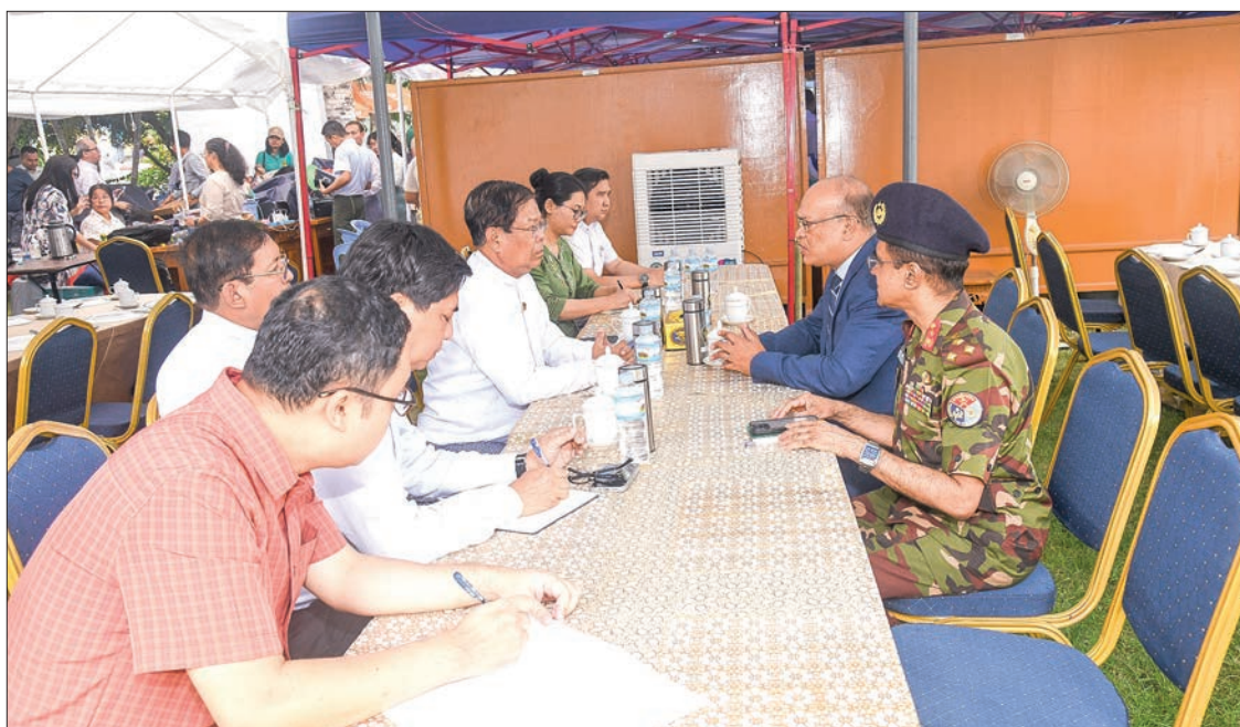
Deputy Prime Minister Union Foreign Affairs Minister U Than Swe meets INGO representatives.

The Deputy Prime Minister and Union Minister for Foreign Affairs of Myanmar expressed his appreciation to Bangladesh for providing humanitarian assistance and sending medical teams to Myanmar in the aftermath of the devastating earthquake. Both sides discussed working closely in the rescue and relief efforts of the victims of the earthquake. They exchanged views on ways to further strengthen bilateral ties, including fostering closer