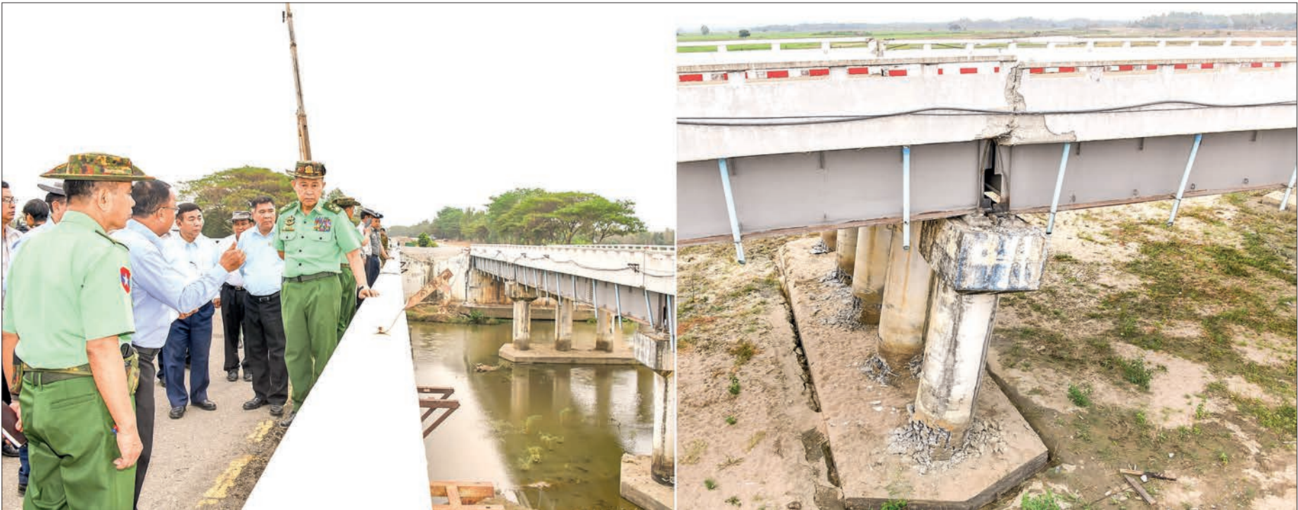
State Administration Council Vice-Chairman Deputy Prime Minister Vice-Senior General Soe Win inspects the damaged parts of the Swa Creek Bridge on the Yangon-Mandalay Expressway in Bago Region.

(Excerpt from guidance given by Chairman of the State Administration Council Prime Minister Senior General Min Aung Hlaing to Shan State cabinet members and state-level departmental officials on 3 September 2024)