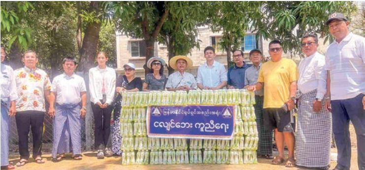
Myanmar Motion Pictures Organization hands over food to relevant officials to donate to earthquake victims.

at religious buildings, monastic schools, mosques, and homes that collapsed in Sagaing, by deploying heavy machinery and skilled workers. Additionally, the Foundation continues to donate food supplies and cash to monks, nuns, and people affected by the earthquake. — ASH/KNN