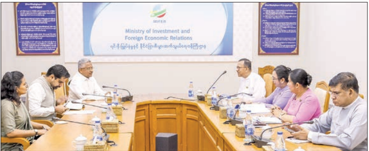
Union Minister Dr Kan Zaw meets the Indian Ambassador yesterday.

expressed deep gratitude to India’s help in response to the powerful earthquake, and they cordially exchanged views on security measures and bilateral cooperation in different sectors. — MNA/KTZH