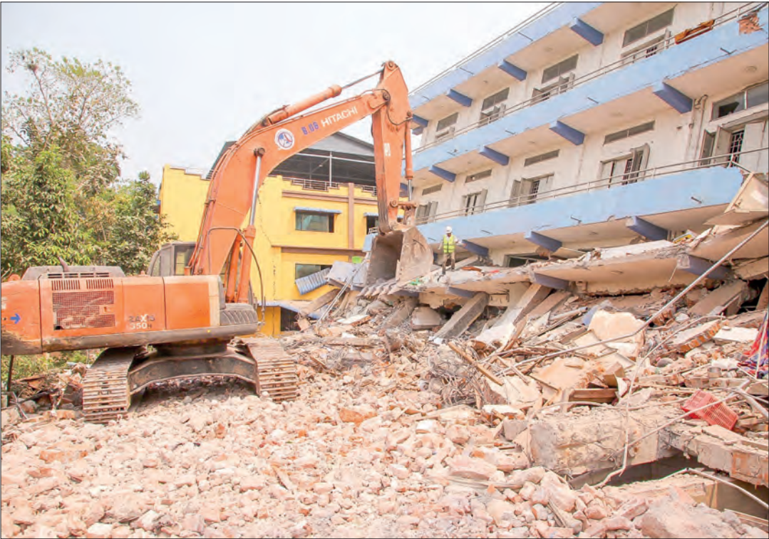
Backhoe excavator cleaning debris of Masoeyein Monastery in Mandalay. PHOTO: KO MOE

the Lao People's Democratic Republic. He then signed the condolence book to formally convey Myanmar's sympathy and solidarity. — Zwe Htet Ko (IPRD)/KZL