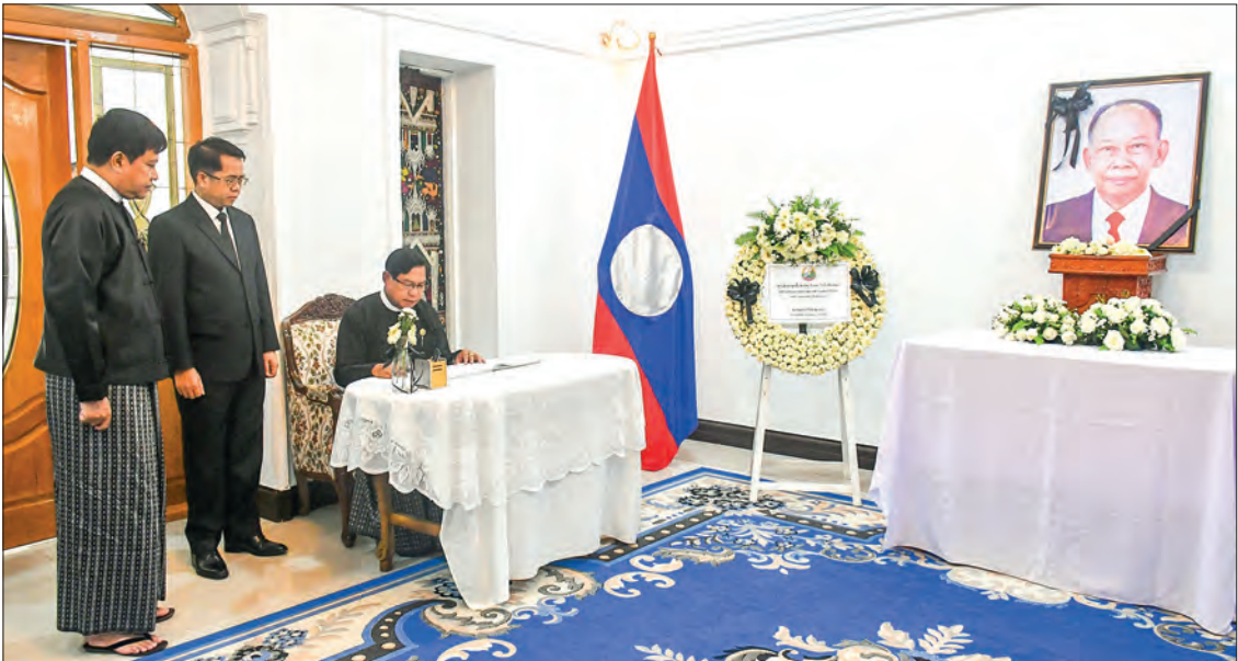
Yangon Region Chief Minister U Soe Thein signs the book of condolence on the demise of the former President of Laos in Yangon yesterday.