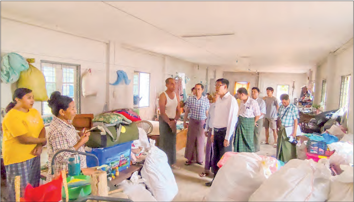
Member of the State Administration Council Deputy Prime Minister and Union Minister General Mya Tun Oo visits temporary accommodation camps for the quake-affected families of employees under the ministry in Nay Pyi Taw yesterday.

At Nay Pyi Taw Railway Station in Pobbathiri Township, the Union Minister inspected