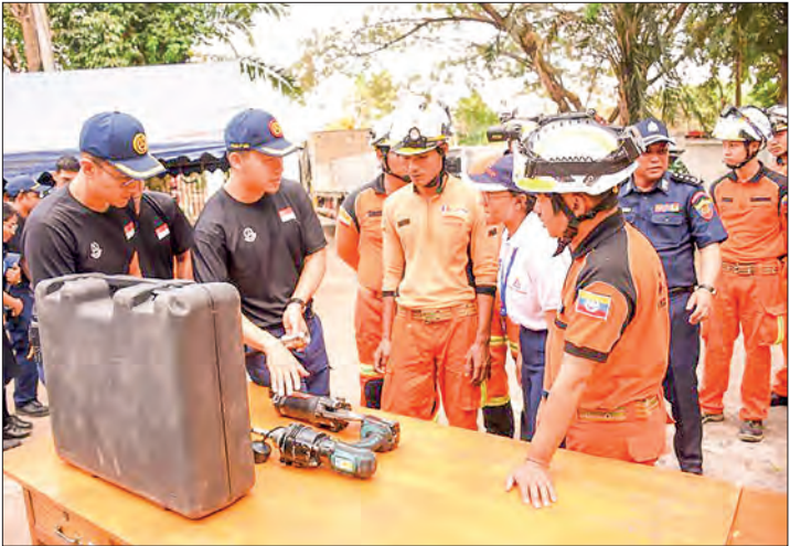
Singapore Civil Defence Force donates rescue equipment to Fire Services Department. types of rescue equipment to Fire Services Department to assist in their efforts, with the handover taking place at the Fire Brigade Headquarters.