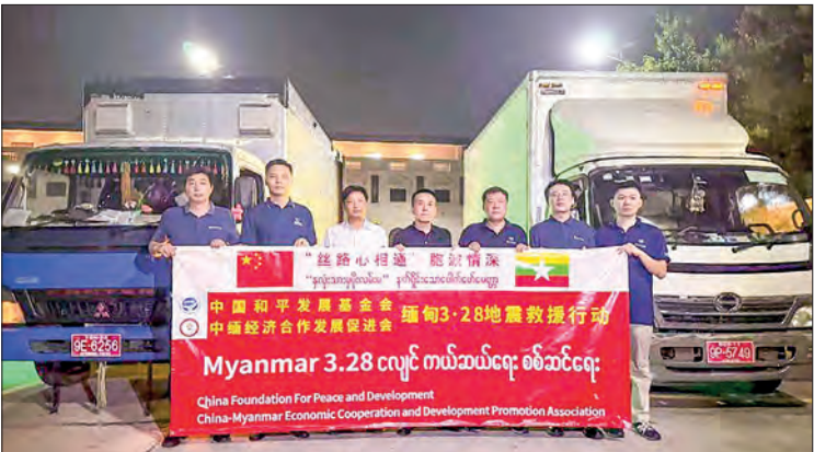
China Foundation of Peace and Development (CFPD) and China-Myanmar Economic Cooperation and Development Promotion Association (CMECDPA) seen with donations.

CHINA Foundation of Peace and Development (CFPD) and China-Myanmar Economic Cooperation and Development Promotion Association (CMECDPA) donated foodstuffs and necessary utensils to the people from the quake-affected Nay Pyi Taw and Mandalay on 4 April. In this regard, those associations provided purified drinking water, instant noodle, biscuit, solar-powered lighting, disposal towels, germicide, hand sanitizer, masks and antibiotic medicines and others to the people. Such a donation aims to enable students and disaster affected people to overcome crises. These supplies were transported by China FAW Jiefang Group International Automobile Co, Ltd free of charge. — ASH/TTA