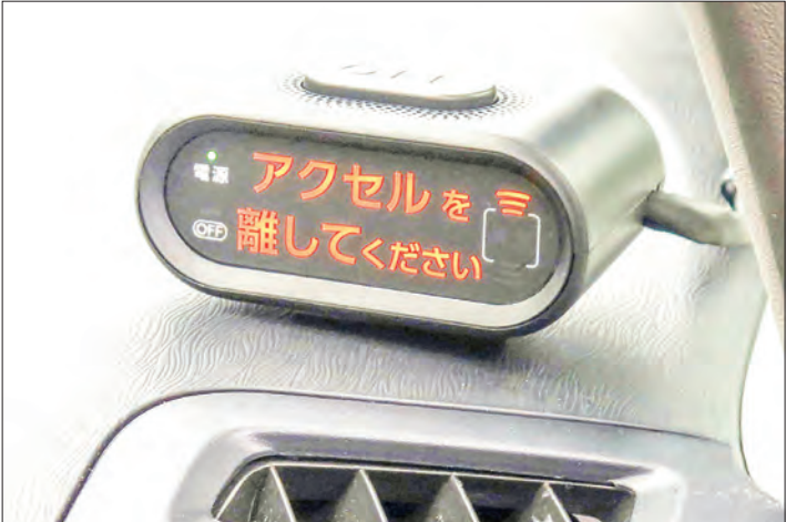
Photo taken in December 2018 in Nagakute, Aichi Prefecture, shows a Toyota Motor Corp device designed to prevent crashes caused by the misapplication of gas pedals. PHOTO: KYODO

This regulation aims to reduce accidents caused by elderly drivers mistakenly accelerating instead of braking.