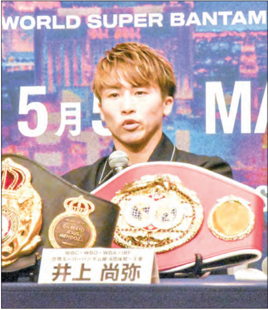
Undisputed super bantamweight boxing champion Naoya Inoue speaks at a press conference in Yokohama on 5 April 2025.

UNDISPUTED super bantamweight boxing champion Naoya Inoue said Saturday he is looking to impress the crowd in Las Vegas when he takes on Ramon Cardenas of the United States on 4 May. "I'm excited," the Japanese star, nicknamed "Monster," told a press conference in Yokohama. "Since I fight in the United States, I want to think about a knockout. But even if it's a win by decision, I want to put on a show." Inoue will fight in the United States for the first time since June 2021, when he knocked out Michael Dasmarinas of the Philippines in the third round of their bantamweight title match. On Cardenas, ranked first by the World Boxing Association, Inoue said, "He is an all-around fighter. He throws excellent lead punches and is very tough." On 4 May, ESPN plans to broadcast Inoue's match, the main event of the day at