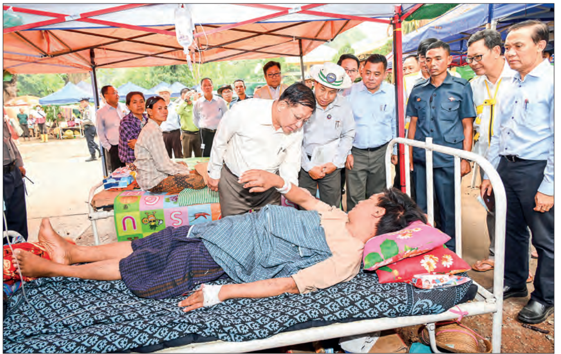
SAC Chairman Prime Minister Senior General Min Aung Hlaing comforts a patient receiving medical treatments in Sagaing General Hospital.

aged Sitagu Sangha Sannipata monastery, the Senior General instructed officials to reconstruct the building as quickly as possible. He also inspected the change in the primary axis of the earthquake-affected road in