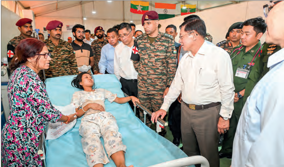
SAC Chairman Prime Minister Senior General Min Aung Hlaing encourages a patient being treated by Indian medical team at the 60 Parachute Field Hospital of the Indian Armed Forces in the old airport of Chanmyathazi Township, Mandalay, yesterday.