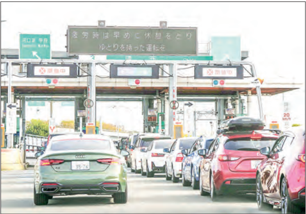
Electronic toll collection lanes are closed at a toll gate of the Chuo Expressway's interchange in Fuchu, Tokyo, on 6 April 2025, due to a system problem.

AUTOMATIC lanes at more than 90 expressway tollgates in Tokyo and six other prefectures were shut down Sunday due to a system outage. Central Nippon Expressway Co said it opened the affected lanes to traffic, allowing tolls to be paid online later, as it investigates the cause and works to restore the system following a failure in the electronic toll collection control system early Sunday.