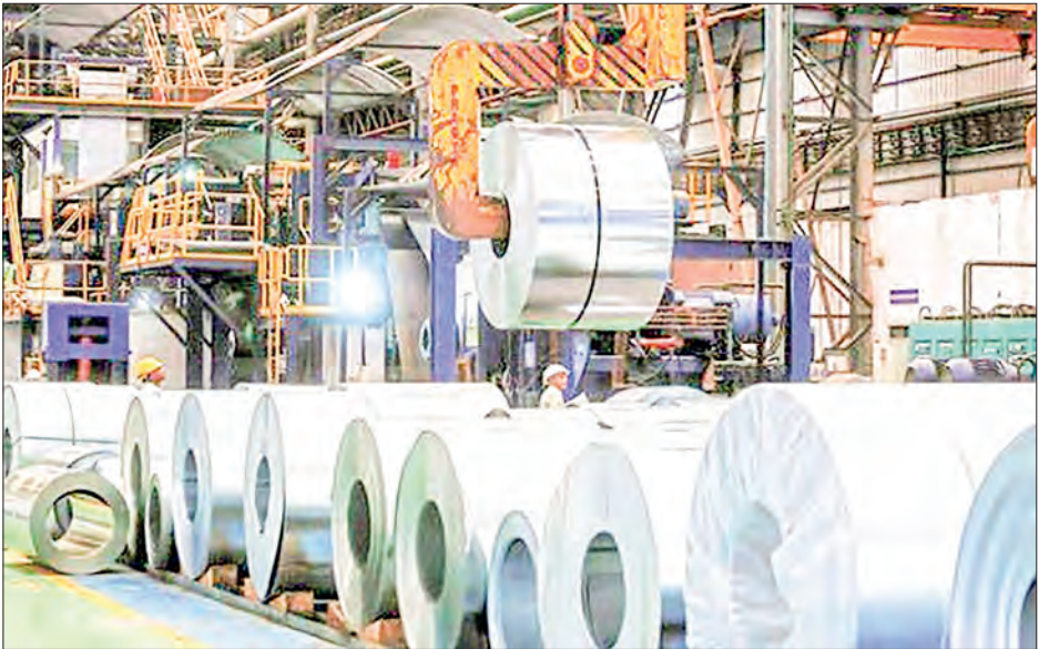
For direct reduced iron arc furnace (DRI-EAF) steel production, the report indicates potential savings of 2 to 5 per cent.

The steel sector alone contributes 9.4 GW to this opportunity, driven by the high cost of grid power, which can be cost-effectively offset by solar. In some setups, like standalone arc furnaces used in secondary steelmaking, solar could reduce production costs by up to 10 per cent, the report added. — ANI