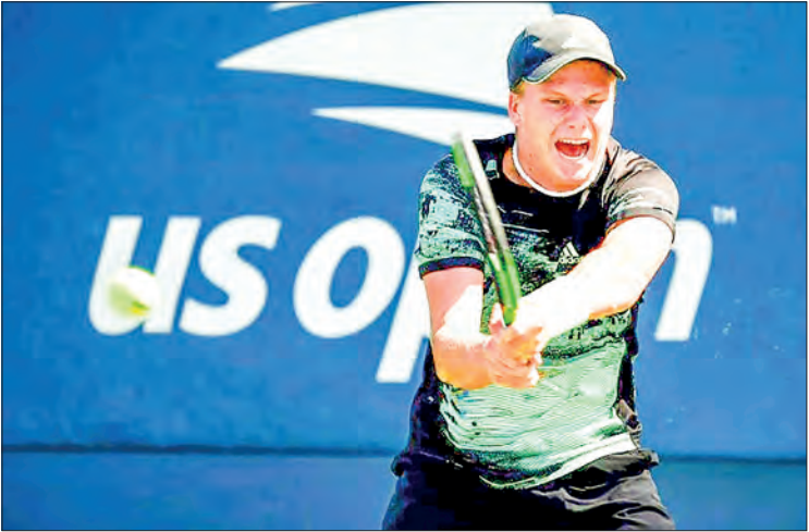
Jenson Brooksby reached the final of the US Men's Clay Court Championship beating Tommy Paul in three sets.

The match was blighted by several lengthy rain delays and concluded seven and a half hours after it began when Brooksby's backhand return winner secured the tie-break win in the third. "I've been able to recall a lot of those (match point) moments this tournament and I think I've gotten stronger as each of those have gone on," said Brooksby who is ranked 50th in the world. "I'm just really pleased with how I've kept my mental composure here the whole week so far," he said. — AFP