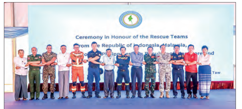
Union SWRR Minister Dr Soe Win poses for documentary photo together with rescue teams of ASEAN countries yesterday.

UNION Minister for Social Welfare, Relief and Resettlement Dr Soe Win attended a ceremony in Nay Pyi Taw yesterday afternoon to present certificates of appreciation and gifts to search and rescue teams from ASEAN countries — Indonesia, Malaysia, the Philippines, Singapore, and Vietnam — for their collaborative efforts in searching for and rescuing individuals trapped in collapsed buildings in the powerful earthquake on 28 March.