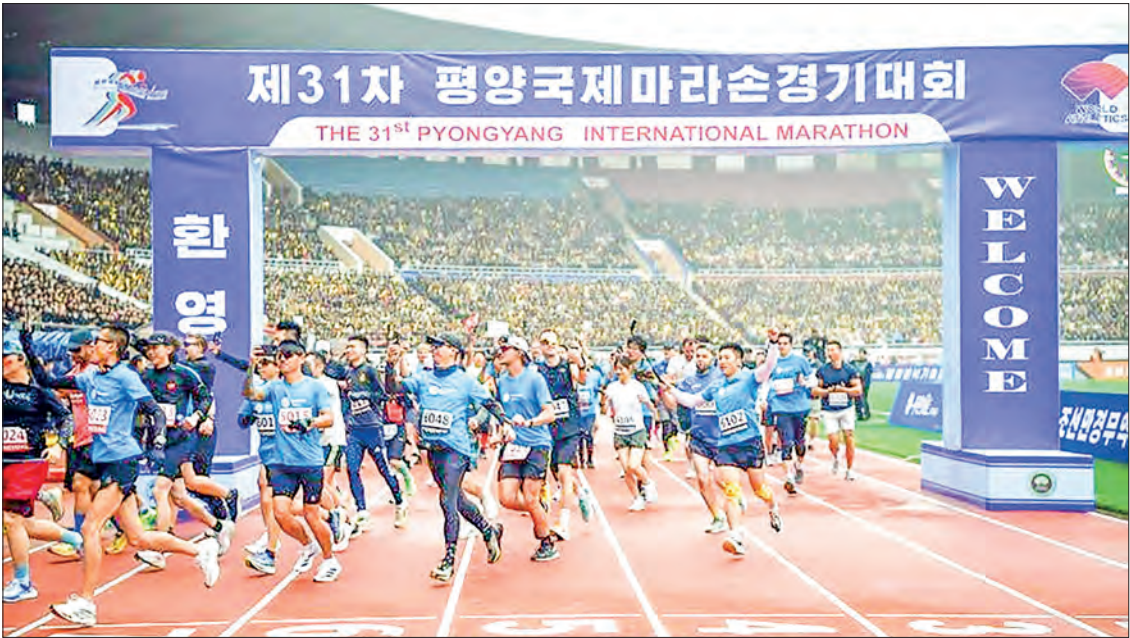
Participants take part in the 31st Pyongyang International Marathon at Kim Il Sung Stadium in Pyongyang on 6 April 2025.