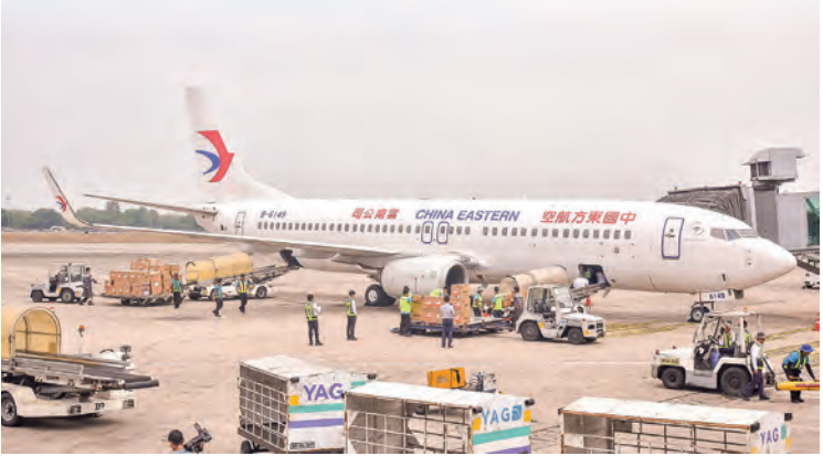
This photo reveals relief aid arriving from China at Yangon International Airport.

today. Well-wishers donate cash and materials to the affected people. On 6 April, two planes from two countries carrying 38.128 tonnes of relief supplies landed at Yangon International Airport. Arrangements are being made to distribute the relief supplies donated by well-wishers to affected people as quickly as possible. — MNA/TTA