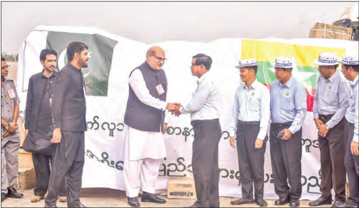
Yangon Region Chief Minister U Soe Thein accepts humanitarian aids from Pakistan at Yangon International Airport yesterday.