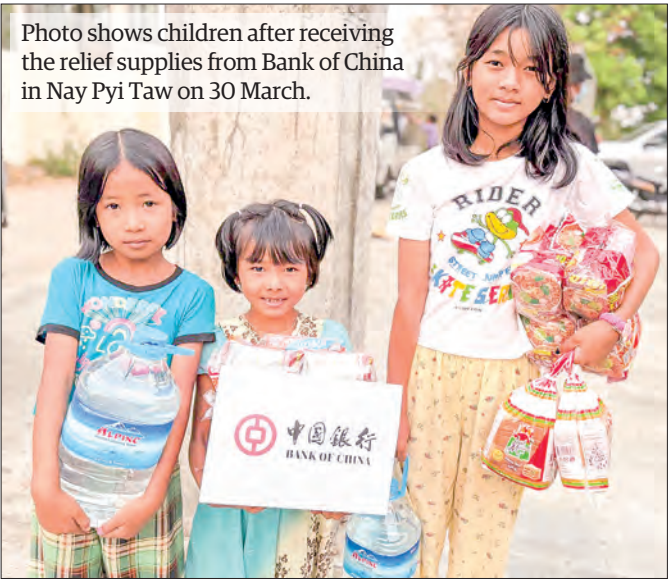
Photo shows children after receiving the relief supplies from Bank of China in Nay Pyi Taw on 30 March.

THE Bank of China (Yangon Branch) cooperates with China Rural Development Foundation donated relief supplies to the earthquake victims in Nay Pyi Taw on 30 March. In the first batch donation, they donated 1,620 cartons of instant noodle, 540 pieces of bread, purified drinking water, 270 mosquito nets, mosquito coils, and necessary utensils to some 1,600 people from 270 households. In the aftermath of the earthquake, the Bank of China (Yangon Branch) launched the corporate online banking services on a daily basis. It opens the Chinese-English-Myanmar emergency phone line in order to provide counseling and assistance to the users from the affected areas with utmost efforts to ensure smooth running of basic financial services. The Bank of China decided to provide assistance for reconstruction of houses of the people in the affected areas so as to overcome challenges together with Myanmar people. — GNLM