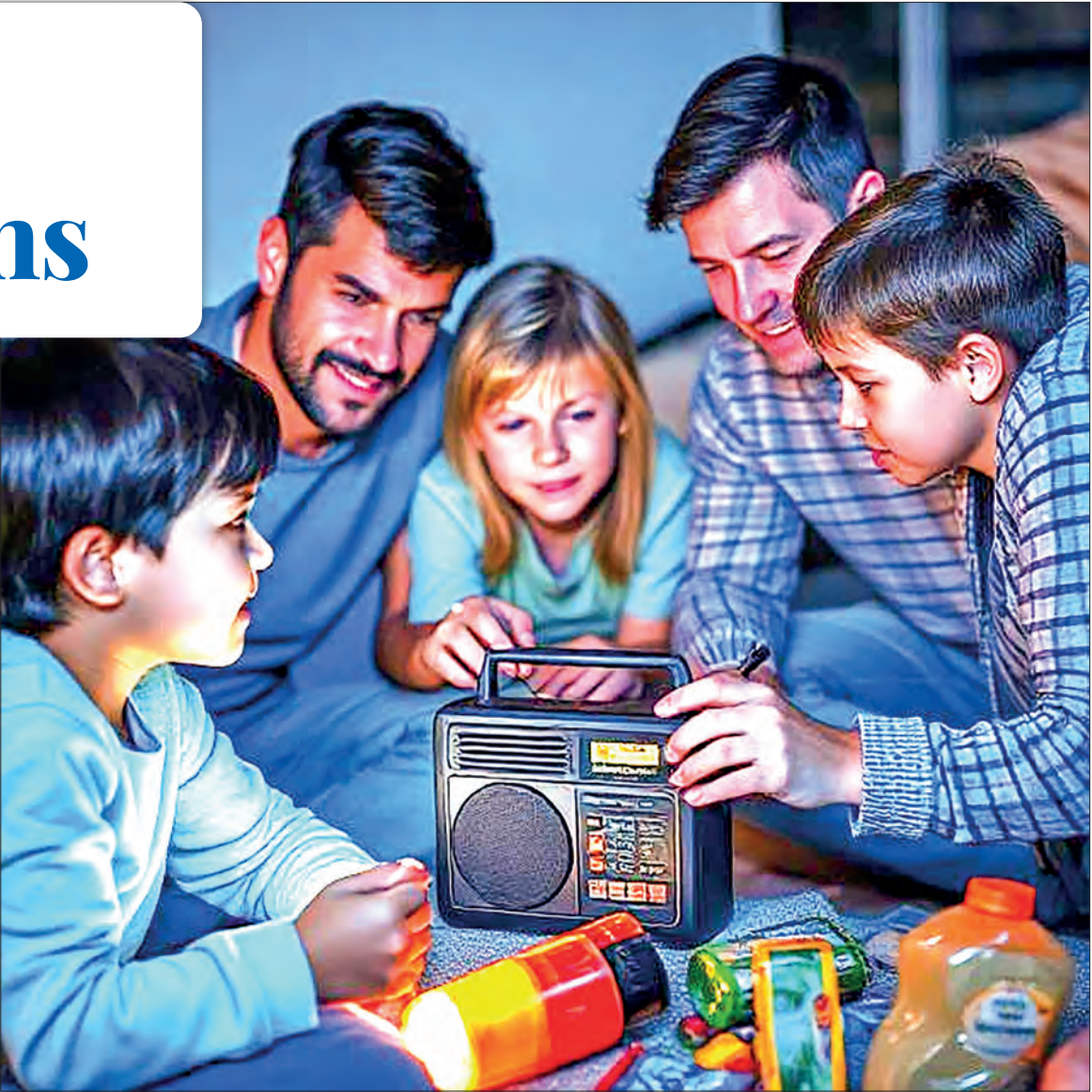
After an earthquake, it is crucial to use battery-powered devices to listen to emergency broadcasts for important updates and safety information. ILLUSTRATION: CONCEPT ART

Vulnerable Individuals: Help those in need, especially the elderly and children. v. Prepare for Possible Evacuation: Have an emergency bag ready with essentials. In addition, after an earthquake, the area may experience structural damage, injured individuals, disrupted utilities (electricity, water, gas), and possible aftershocks. Buildings may be unsafe to enter, and there is a risk of fires, landslides, or tsunamis in coastal regions. Emergency services may be limited, and communication networks can be affected. People should stay alert, help others, and follow official instructions for safety and recovery.