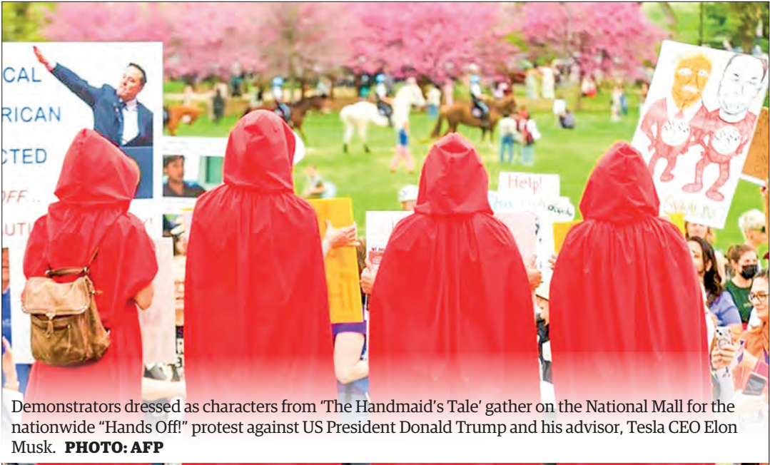
Demonstrators dressed as characters from ‘The Handmaid’s Tale’ gather on the National Mall for the nationwide “Hands Off” protest against US President Donald Trump and his advisor, Tesla CEO Elon Musk.

HUNDREDS of thousands of protesters gathered in dozens of cities across the United States and Europe on Saturday to protest the controversial policies of US President Donald Trump’s administration, including the imposition of so-called “reciprocal tariffs”, the shutdown of federal agencies and the deportation of immigrants. In the United States, around 600,000 people joined over 1,400 protests across all 50 states under the theme of “Hands Off”, according to the organizers. Organized by a coalition of more than 150 groups, including civil rights organizations, labour unions and veterans’ associations, demonstrators gathered at state capitols, federal buildings, congressional offices, So- cial Security Administration headquarters, city halls and public parks. “This peaceful movement is powered by everyday people — nurses, teachers, students, parents — who are rising up to protect what matters most. We are united, we are relentless, and we are just getting started,” said Rahna Epting, executive director of the activist group MoveOn. — Xinhua