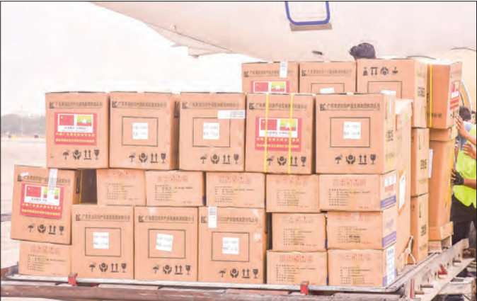
Arriving humanitarian aids from China at Yangon International Airport yesterday.