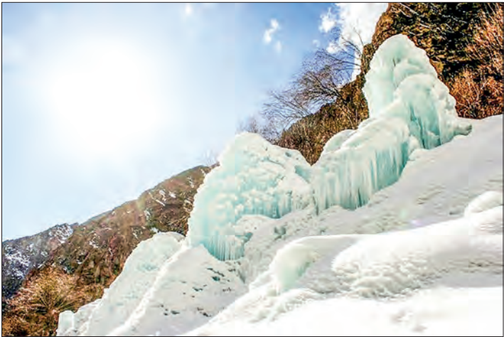
The ice forms in the shape of cones that resemble Buddhist stupas, and act as a storage system — steadily melting throughout spring when temperatures rise.

AT the foot of Pakistan's impossibly high mountains whitened by frost all year round, farmers grappling with a lack of wa-