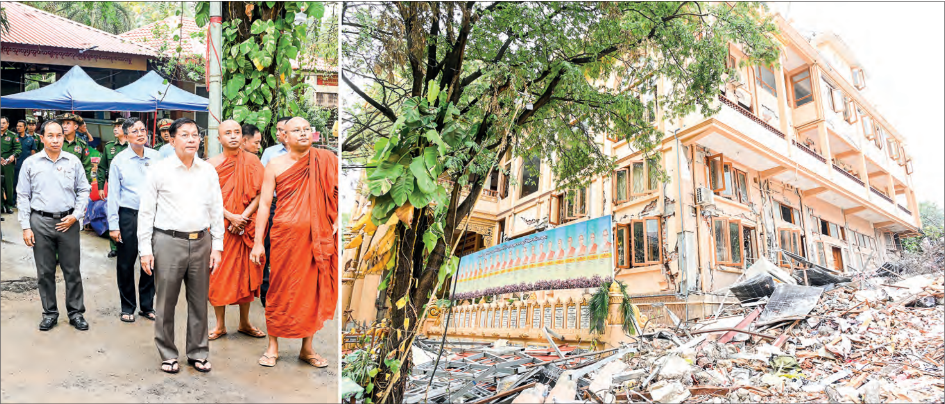
Chairman of the State Administration Council Prime Minister Senior General Min Aung Hlaing views round the damaged parts of the Thakyadita nunnery yesterday.

(Excerpt from guidance given by Chairman of the State Administration Council Prime Minister Senior General Min Aung Hlaing to Shan State cabinet members and state-level departmental officials on 3 September 2024)