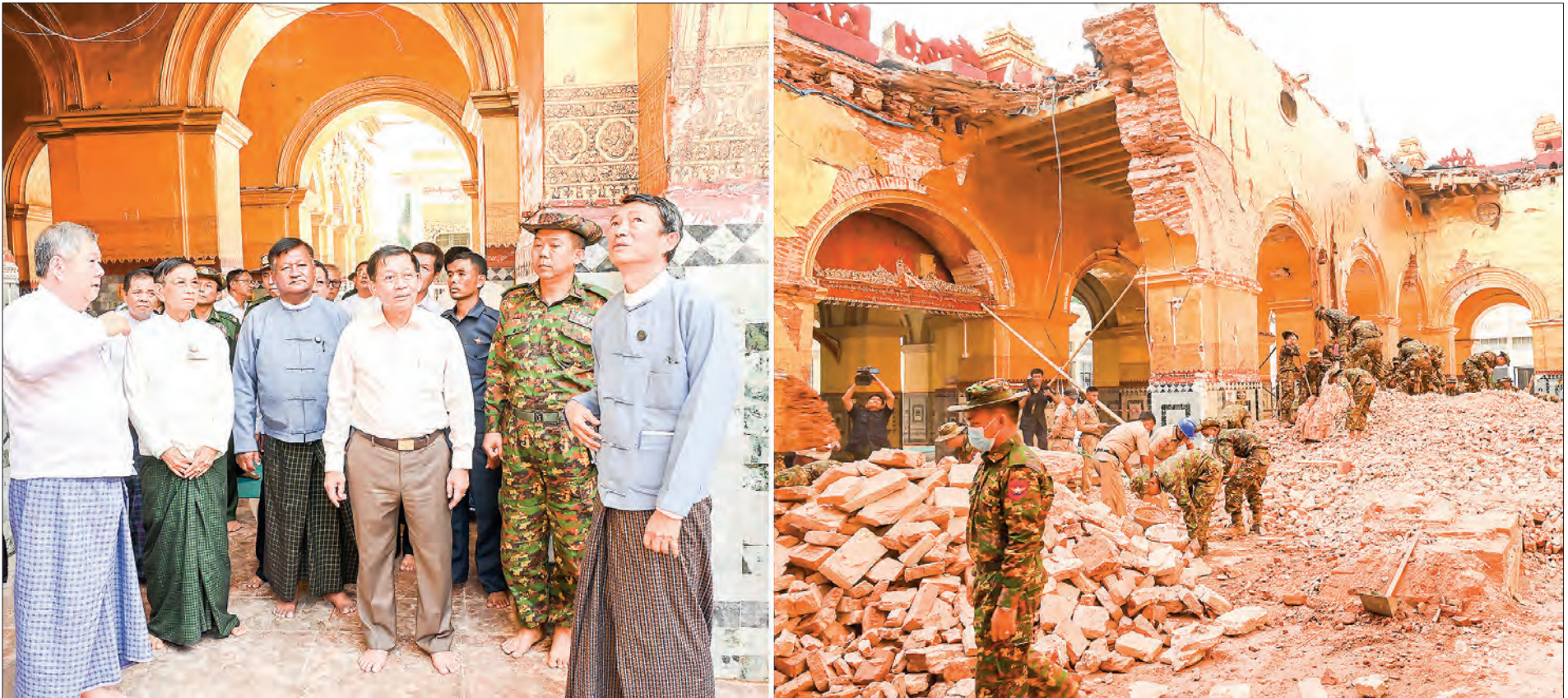
State Administration Council Chairman Prime Minister Senior General Min Aung Hlaing inspects the cleaning works in Maha Muni Buddha Image, in Mandalay yesterday.