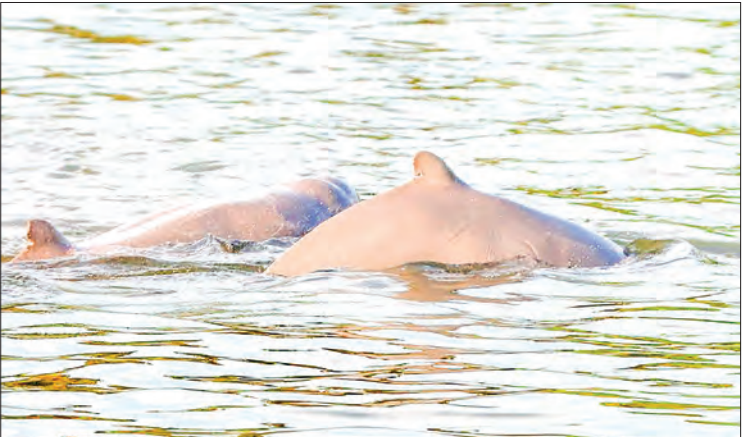
Mekong Irrawaddy dolphins swim in the Mekong River in Kratie province, Cambodia, on 8 March 2025.

ANOTHER newborn Mekong Irrawaddy dolphin has been sighted, raising the number of newborn dolphin calves in Cambodia to six so far this year, the Ministry of Agriculture, Forestry and Fisheries (MAFF) said in a press release on Saturday. The new calf, about four days old, was spotted on Friday at the Kampi dolphin pool in Kratie province's Chetr Borei district by a team of researchers from the Fisheries Administration and the World Wide Fund for Nature.