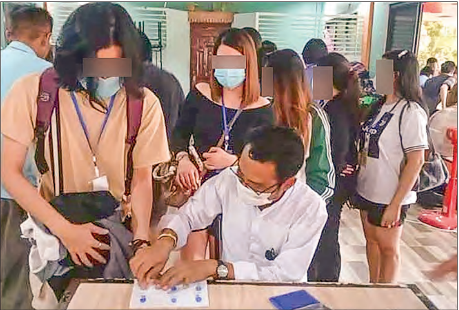
Official collects the personal information and records of an illegal entrance.

THE Bank of China (Yangon Branch) cooperates with China Rural Development Foundation donated relief supplies to the earthquake victims in Nay Pyi Taw on 30 March. In the first batch donation, they donated 1,620 cartons of instant noodle, 540 pieces of bread, purified drinking water, 270 mosquito nets, mosquito coils, and necessary utensils to some 1,600 people from 270 households. In the aftermath of the earthquake, the Bank of China (Yangon Branch) launched the corporate online banking services on a daily basis. It opens the Chinese-English-Myanmar emergency phone line in order to provide counseling and assistance to the users from the affected areas with utmost efforts to ensure smooth running of basic financial services. The Bank of China decided to provide assistance for reconstruction of houses of the people in the affected areas so as to overcome challenges together with Myanmar people. — GNLM