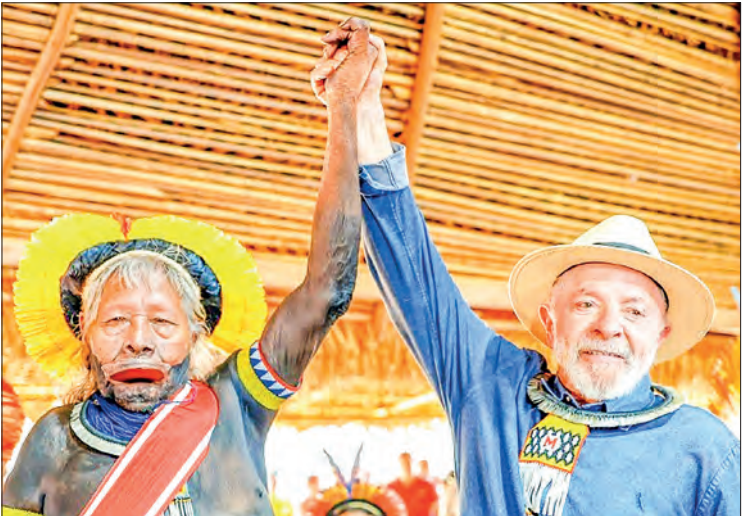
Brazil’s best-known Indigenous leader Chief Raoni Metuktire wants President Luiz Inacio Lula da Silva to designate more Amazon land as protected Indigenous territory to help prevent deforestation.

BRAZILIAN President Luiz Inacio Lula da Silva admitted Friday that his government “still has a lot to do” for Indigenous communities battling for survival in the Amazon rainforest. Lula, who will host this year’s UN climate change conference in the Amazon city of Belem in November, made the remarks during a visit to the village of the Amazon’s most famous resident and campaigner, Chief Raoni Metuktire. Brazil’s left-wing leader, who has made Amazon protection a key plank of his presidency, praised the “important role” played by Indigenous communities in the fight against climate change during his visit to the Capoto-Jarina Indigenous Territory in Mato Grosso state. The meeting with Raoni, who has travelled the world to highlight the plight of the Amazon rainforest, comes days before thousands of Indigenous Brazilians gather in the capital Brasilia for a rally. On returning to power in 2023, Lula resumed designating chunks of Amazon land as protected Indigenous territory, a process that had been halted by his far-right predecessor Jair Bolsonaro. Indigenous leaders complain that the process has been too slow, however. Official data shows that demarcated Indigenous territories, where deforestation is a crime, are far less susceptible to land clearance for agriculture and illegal mining. — AFP