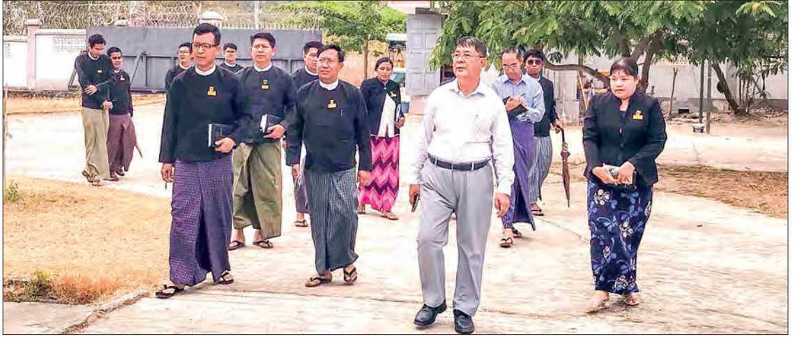
Union Chief Justice U Tha Htay inspects temporary locations for courtrooms at Zeyathiri District Court yesterday.

He also examined the site behind the district court, where four temporary courtrooms are planned to be constructed. They also inspected minor damage caused by the earthquake at the Zeyathiri District Court and Pobbathiri Township Court and stressed the need for carrying out necessary repairs. He also looked into staff relocation. — MNA/KZL