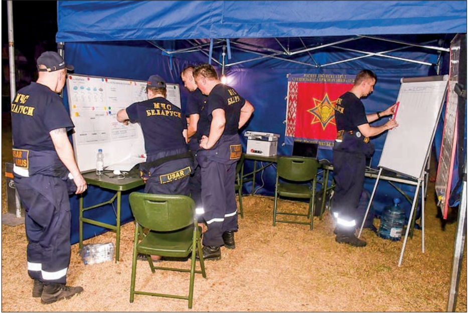
Belarusian medics ready earthquake relief efforts at a Mandalay field clinic.

THE earthquake has resulted in 3,003 deaths, 4,515 injuries and 351 missing persons in the six affected states and regions as of yesterday. Fire Services Department with local and international search and rescue teams continues operations in the affected areas. Thus, they have rescued 653 survivors and recovered 582 deceased individuals trapped under collapsed structures. Donors from home and abroad are providing financial and material assistance to the victims. A total of six aircraft from five countries arrived at Nay Pyi Taw International Airport yesterday, carrying 55 emergency response personnel and 35.505 tonnes of search and rescue equipment and relief supplies. Authorities are working to swiftly distribute the relief supplies to those in need. — MNA/KZL