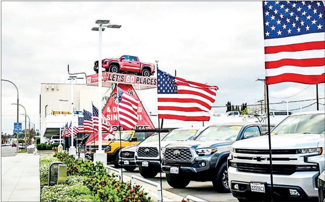
US President Donald Trump has announced sweeping tariffs on automobile imports, taking effect 3 April 2025.

Trump has consistently advocated for tariffs as a solution to America’s trade imbalances, despite opposition from economic experts who question their effectiveness.