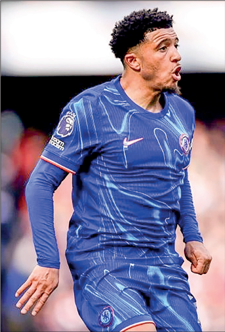
Jadon Sancho is on loan at Chelsea from Manchester United.

CHELSEA boss Enzo Maresca on Wednesday admitted Jadon Sancho "could do better" but was non-committal over the forward's future at Stamford Bridge. Reports last week said Chelsea were willing to sign the winger on a permanent deal from Manchester United despite a £5 million ($6.5 million) clause that would allow them to cancel the agreement. Sancho moved to Stamford Bridge on loan in August in a deal that reportedly included an obligation for Chelsea to buy the player for between £20 and £25 million. But after a promising start to life at the club the 25-year-old's form has dipped and details have emerged of a way out for the London club if they paid a cancellation fee.