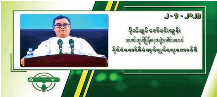
SAC Information Team Leader Maj-Gen Zaw Min Tun.

The case occurred near Ohmati village of Nawnghkio township, and the people can see that the clash between Tatmadaw and TNLA is occurring in that place on news pages. At 9 pm on 1 April, nine vehicles left from Nawnghkio Township, and Tat-