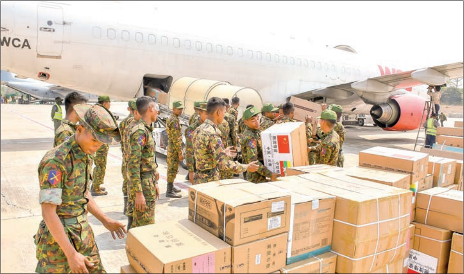
Tatmadaw members carry humanitarian aid from China and the Philippines at the Tatmadaw Airport in Nay Pyi Taw.

Information Team State Administration Council