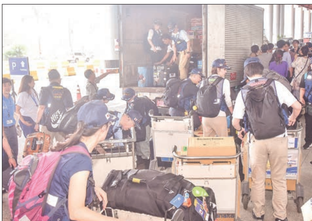
JICA's medical team arrives at the Yangon International Airport yesterday.

THE flight carrying JICA doctors, nurses, humanitarian aid and medicines arrived at Yangon International Airport yesterday.