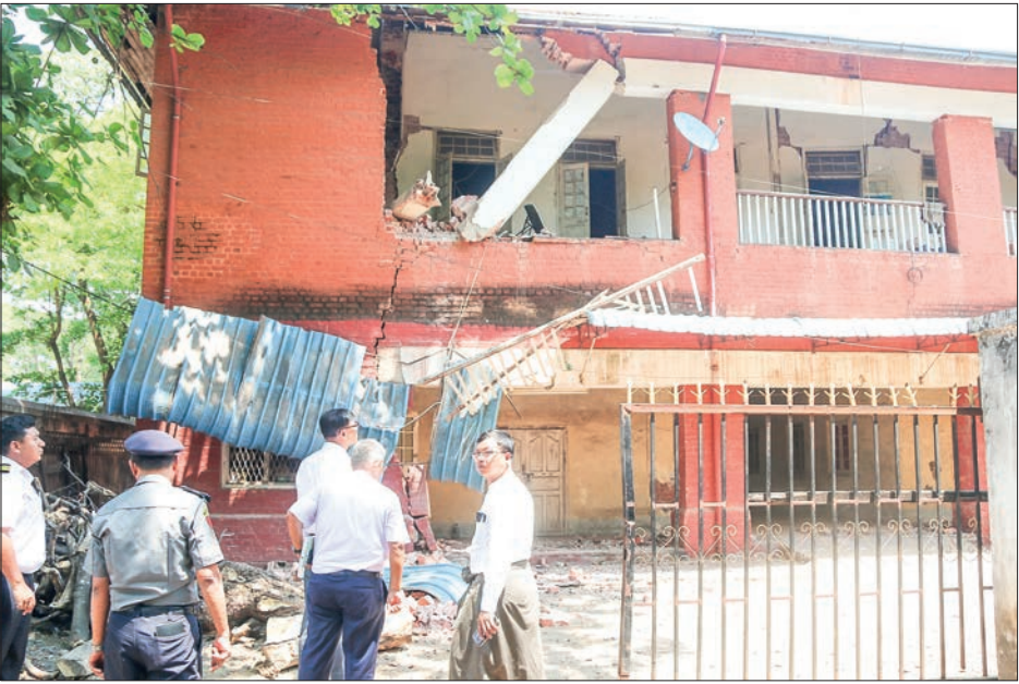
SAC Member Deputy PM MoTC Union Minister General Mya Tun Oo inspects the damaged office and housing buildings.

His Excellency, Senior General Min Aung Hlaing Chairman of the State Administration Council Prime Minister of the Republic of the Union of Myanmar Nay Pyi Taw Your Excellency, The news of the devastating earthquake in Myanmar, which resulted in human casualties and widespread destruction, was received with heavy heart in Belarus. On behalf of my compatriots and myself, I express words of deep sympathy to Your Excellency, the families of the victims, and survivors of the disaster. Our thoughts are the leadership and all the people of Myanmar at this difficult moment. I wish a speedy recovery to the injured people and stabilization of the situation. Aleksandr Lukashenko President of the Republic of Belarus 28 March 2025