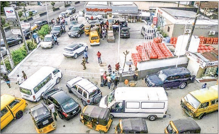
The oil sector is a key part of Nigeria’s economy — generating massive wealth and government revenues while also being dogged with corruption. PHOTO: AFP

“The board’s restructuring is crucial for enhancing operational efficiency, restoring investor confidence, boosting local content, driving economic growth and advancing gas commercialisation and diversification,” Tinubu’s media adviser, Bayo Onanuga, said in a statement. — AFP