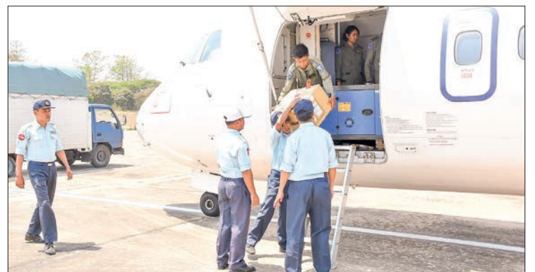
Tatmadaw members unload the humanitarian aid from the Nippon Foundation.

THE Nippon Foundation wishes to extend sincere condolences to everyone affected by the major earthquake that struck Myanmar and surrounding areas on 28 March 2025.