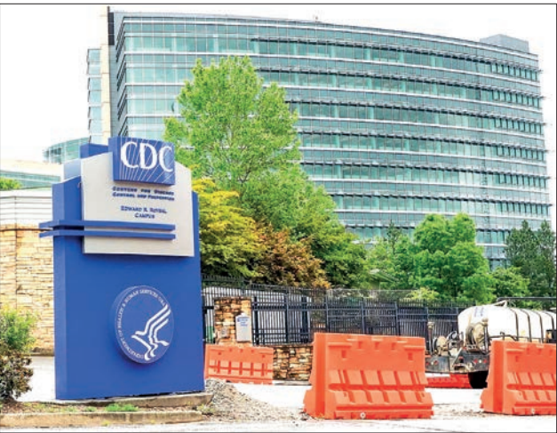
The layoffs affect the Department of Health and Human Services and the federal agencies it oversees, such as those in charge of approving new drugs (FDA), responding to epidemics (CDC) or medical research (NIH).

MASS layoffs began at the major US health agencies on Tuesday as the Trump administration embarks on a sweeping and scientifically contested restructuring that will cut 10,000 jobs. US Health Secretary Robert F Kennedy Jr said the layoffs were part of a major reform of his department, aiming to refocus efforts on chronic disease prevention. Calling it a "difficult moment for all of us", Kennedy said "our hearts go out to those who have lost their jobs". "But the reality is clear: what we've been doing isn't working," he added, complaining that "Americans are getting sicker every year" despite increasing spending at the federal agencies guiding US health policy. According to photos and testimonials posted on social media, employees learned of their dismissal early on Tuesday morning by email or by having their access badges not working when they showed up to work in the morning. — AFP