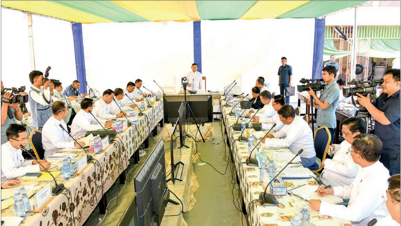
State Administration Council Vice-Chair Deputy PM Vice-Senior General Soe Win addresses the meeting of the National Disaster Management Committee yesterday in Nay Pyi Taw.

He recounted that the Prime Minister has also instructed that all international relief