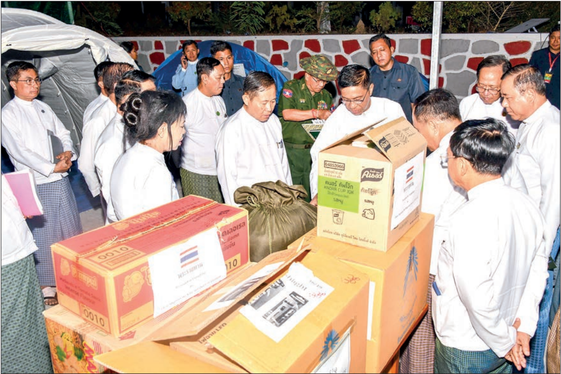
Vice-Senior General Soe Win looks into the relief materials donated by the international community.

Committee member Union ministers and the Nay Pyi Taw Council Chairman discussed the arrival of rescue planes and aid, loss and damage of religious buildings, houses and staff housings, loss of lives of members of the Sangha, civilians, staff members and families, conducting emergency rescue operations, food, accommodation and security of affected staff members from ministries, offers of international community to conduct rescue and rehabilitation, damage of cultivable lands and dams, spreading of information about current situations in the international landscape, opening of temporary hospitals and clinics, readiness of aircraft and