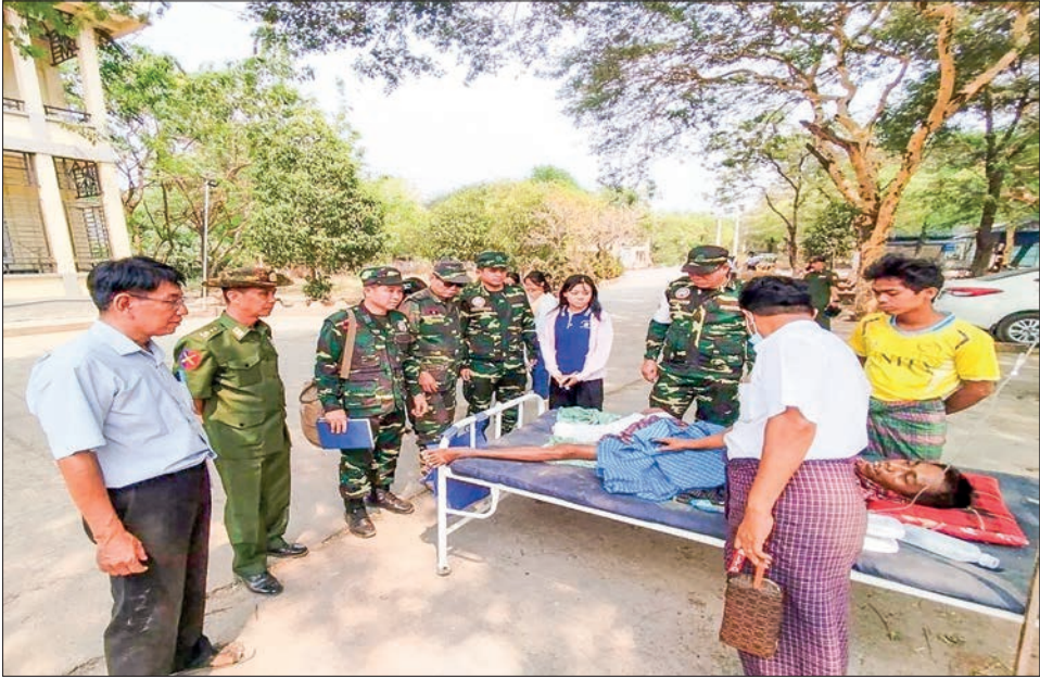
Laotian medical team provides critical care to earthquake survivors in Kyaukse.