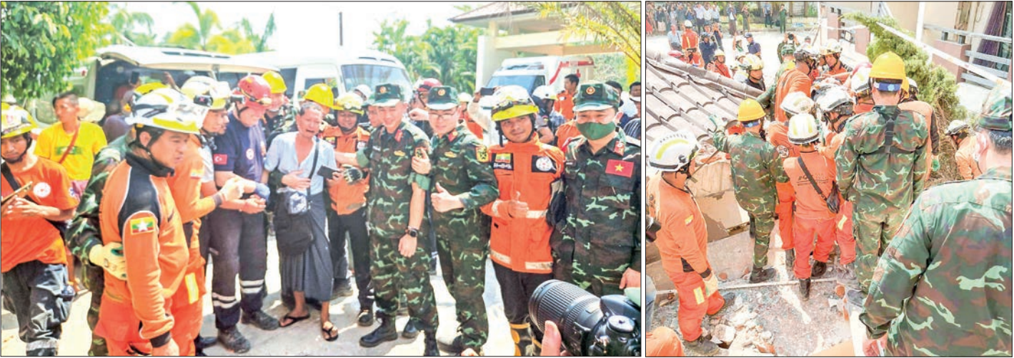
Photos capture rescuers from the Myanmar Fire Services Department, the Special Search and Rescue Team, and teams from Türkiye and Vietnam as they rescue a 26-year-old man from the debris in Nay Pyi Taw.

from Singapore to save one survivor and four dead bodies, with 50 Thai rescue members in searching for three dead bodies, with 106 Vietnamese rescue members in searching seven dead bodies and with eight rescue members from Türkiye in saving two survivors, totalling four survivors and 16 dead bodies. Similarly, in Mandalay Region, a total of 167 members from Russia collaborated in the rescue efforts, resulting in the discovery of one survivor and six deceased individuals. Moreover, 84 members from China (Beijing), 116 members from China's Blue Sky Rescue Team, and 51 members from China (Hong Kong) worked together, locating two survivors and 14 deceased individuals. Furthermore, 80 members from India participated in the process, leading to the discovery of 11 deceased individuals. In total, three survivors and 31 deceased individuals were found during the operations. Likewise, in Sagaing Region, 50 members from Malaysia assisted in the search, locating six deceased individuals. According to reports, the rescue committee, in collaboration with 12 rescue teams from seven different countries, conducted search and rescue operations across Nay Pyi Taw Council Area, Mandalay Region, and Sagaing Region. As a result, they were able to rescue seven survivors and recover 53 deceased individuals. — MNA/TTA