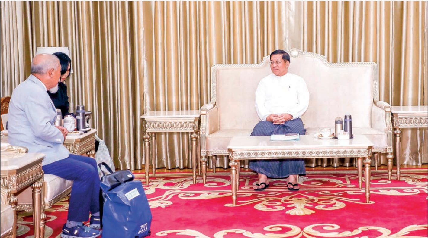
State Administration Council Chairman Prime Minister Senior General Min Aung Hlaing receives Mr Yohei Sasakawa, Special Envoy of the Government of Japan for National Reconciliation in Myanmar and Chairman of the Nippon Foundation yesterday in Nay Pyi Taw.

S AC Chairman Prime Minister Senior General Min Aung Hlaing held talks with the Special Envoy of the Government of Japan for National Reconciliation in Myanmar and the Nippon Foundation Chairman. Mr Yohei Sasakawa, Special Envoy of the Government of Japan for National Reconciliation in Myanmar and Chairman of the Nippon Foundation called on Chairman of the State Administration Council Prime Minister Senior General Min Aung Hlaing at the Tatmadaw Guesthouse in Nay Pyi Taw yesterday afternoon and donated rescue and relief