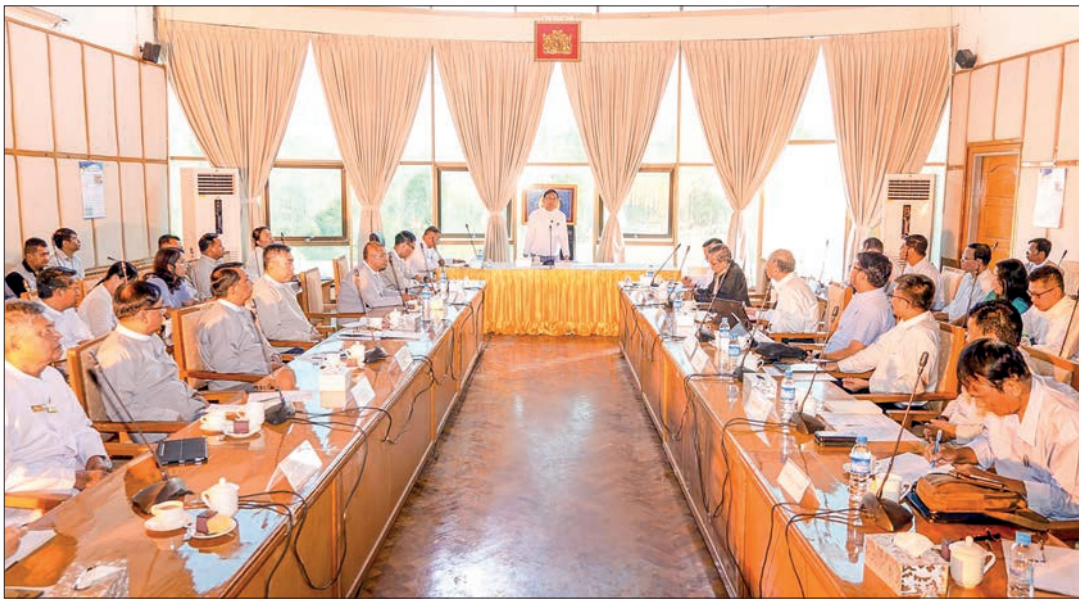
A coordination meeting on inspection and reconstruction processes of buildings damaged by the earthquake in progress in Nay Pyi Taw yesterday.

A coordination meeting on inspection and reconstruction processes of buildings damaged by the earthquake, with the participation of expert inspection teams, was held yesterday at the Ministry of Construction in Nay Pyi Taw.