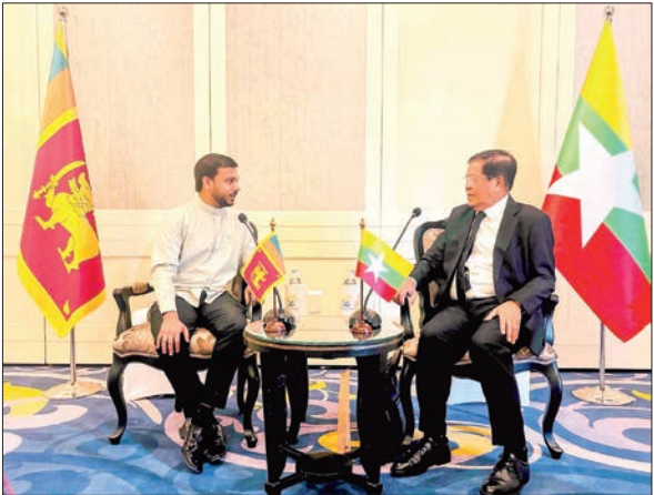
Deputy Prime Minister Union Minister for Foreign Affairs U Than Swe meets Sri Lankan Deputy Minister of Foreign Affairs, Foreign Employment, and Tourism Mr Arun Hemachandra in Bangkok, Thailand, yesterday.

The Deputy Prime Minister and the Union Minister for Foreign Affairs explained the rescue and relief efforts of the Myanmar Government following the devastating earthquake on 28 March 2025. He appreciated international humanitarian assistance and was grateful to Sri Lanka and other countries for sending medical and rescue teams to Myanmar. Both sides discussed further strengthening of friendship and cooperation between Myanmar and Sri Lanka. — MNA