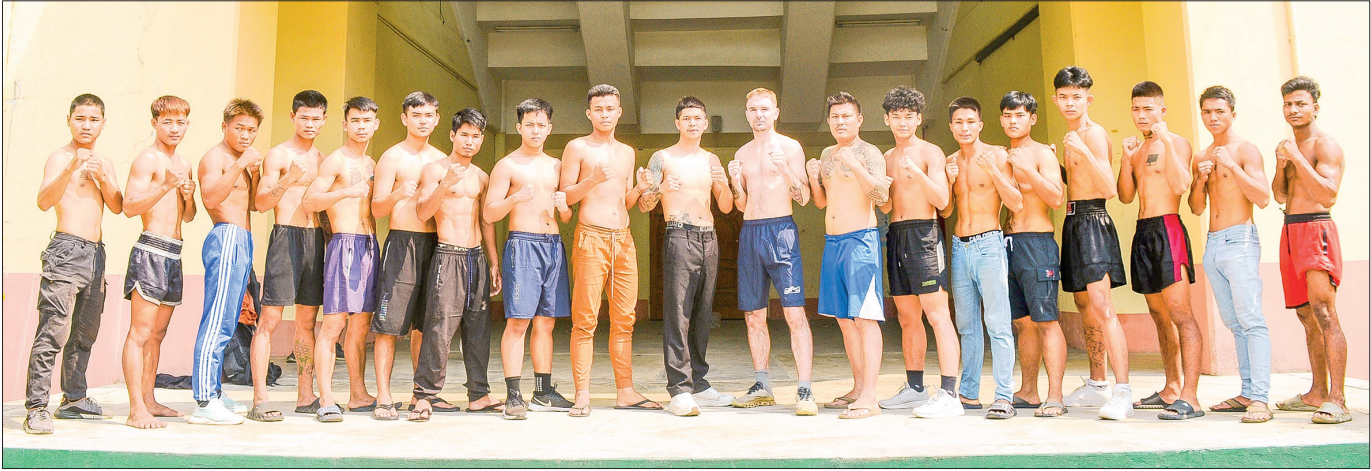
Young fighters pose for the group photo.

THE Myanmar Fight traditional boxing tournament, organized by the Department of Sports and Physical Education, the Myanmar Traditional Boxing Federation and MMAG Company will take place at 1 pm on 8 April at the Theinbyu Gymnasium in Yangon. Fighters from various clubs will compete in the event. The tournament will feature 10 bouts of three rounds where Thai fighters will compete against Myanmar opponents. The event is open to the public free of charge and Skynet TV will broadcast it live. With sponsorship from a Union of Myanmar Economic Holdings Public Company Ltd, the Myanmar Traditional Boxing Federation and MMAG Company plan to hold these tournaments regularly every month.