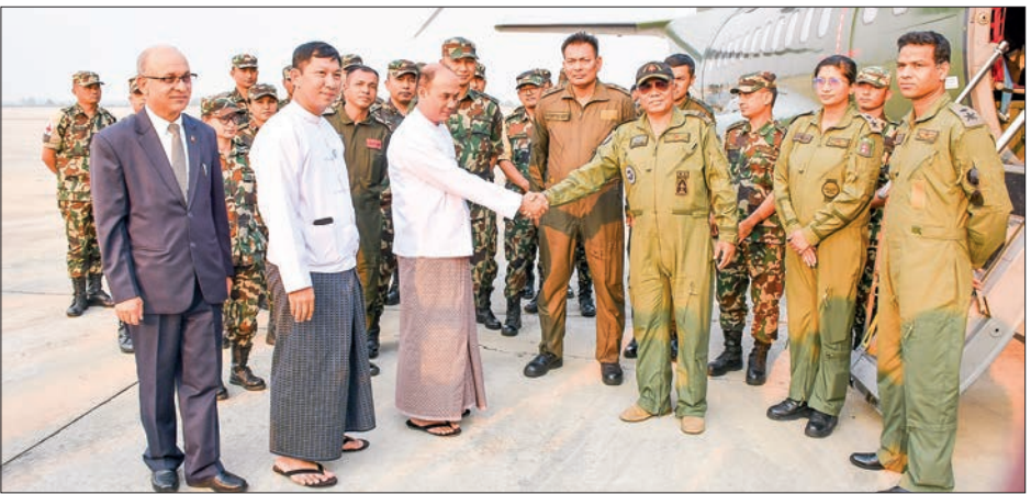
Officials from the Ministry of Foreign Affairs and the Ministry of Social Welfare, Relief, and Resettlement welcome the newly arrived rescue and medical teams from Nepal at the Tatmadaw Airport in Nay Pyi Taw.

Officials from the Ministry of Foreign Affairs and the Ministry of Social Welfare, Relief, and Resettlement welcomed the newly arrived rescue and medical teams at the airport. These teams will be deployed to the earthquake-affected areas to carry out search and rescue operations and provide medical treatment to the affected communities without delay. – MNA/MKKS