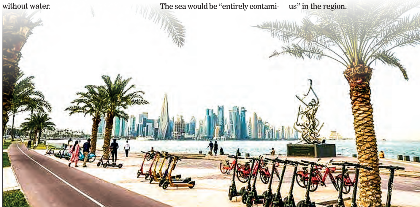
The skyline of Qatar's capital Doha, which like other Gulf Arab states is in an arid desert region.

He said Qatar opposed military action against Iran and that it would “not give up until we see a diplomatic solution between the US and Iran”. — AFP