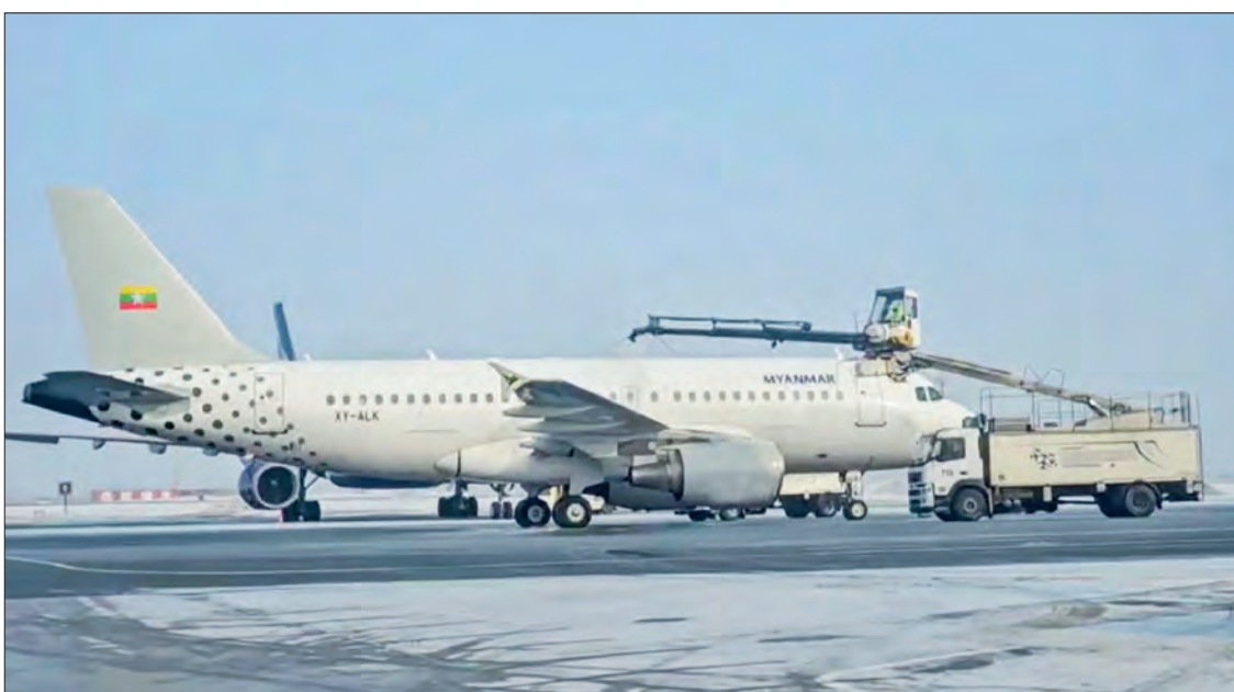
A special plane carrying a high-level Myanmar delegation led by SAC Chairman Prime Minister Senior General Min Aung Hlaing was being cleaned before leaving the airport due to the covering of snow.

On arrival back at the airport, Leader of the Information Team of the State Administration Council Maj-Gen Zaw Min Tun who accompanied the Senior General replied to questions raised by media.