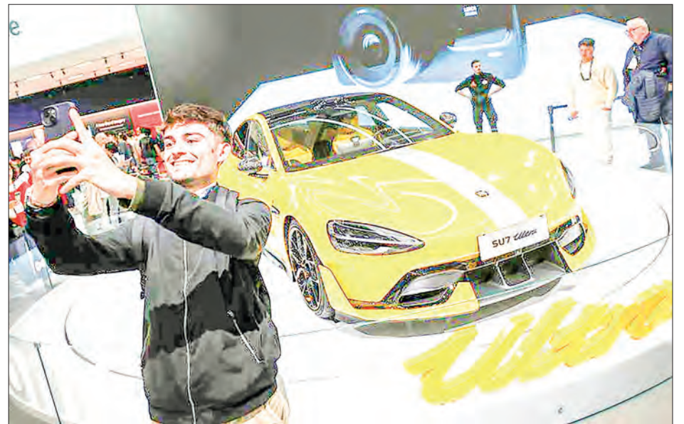
A man takes a selfie with a Xiaomi SU7 Ultra at the 2025 Mobile World Congress in Barcelona, Spain, on 6 March 2025.

The mobile industry flourishes through cross-border partnerships in re-