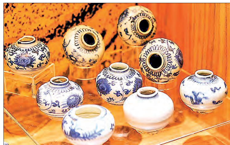
The Brunei Maritime Museum showcases the nation's rich maritime culture and history, attracting tourists and fostering cultural understanding.

BRUNEI has seen an increase in visitors touring cultural galleries, libraries, and historical sites, with 8,655 visitors recorded in 2024, up 70 per cent compared to 2023, a minister has said.