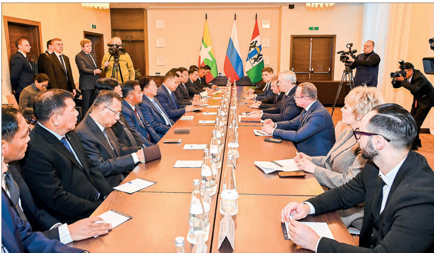
State Administration Council Chairman Prime Minister Senior General Min Aung Hlaing and Governor of Novosibirsk Travnikov Andrey Alexandrovich meet at Grand Autograph Hotel in Novosibirsk yesterday.

They exchanged views on promotion of cooperation between Myanmar and Novosibirsk Region, operation of bilateral tourism and trade services, potential for further enhancement of friendly relations between the two countries through bilateral cooperation, learning of Myanmar officer trainees at universities in Novosibirsk, running of direct flights between Novosibirsk and Myanmar and Mandalay, bilateral export of products, opening of the Myanmar Consulate-General to promote relations and cooperation Myanmar and Novosibirsk, and potential for development of health, education, health, transport, tourism, industry, and economic and commercial sectors