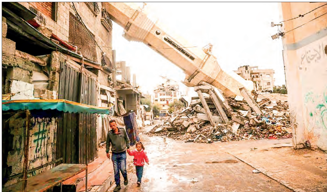
The initial phase of the Israel-Hamas truce brought relative calm to Gaza after more than 15 months of war devastated the territory.

ISRAEL on Sunday prepared to send a delegation to Doha for further talks on the Gaza truce, as Hamas called for an immediate start to negotiations on the ceasefire's second phase, which it hopes will lead to a permanent end to the war.