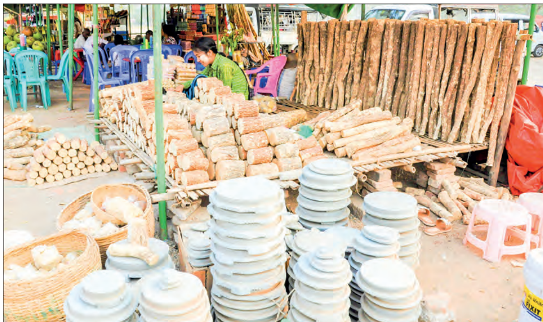
Vendors prepares Shinmataung Thanaka and stone slabs for sale at Ananda temple.

THE service of applying traditional Myanmar Thanaka for domestic and international travellers visiting the pagodas and temples in the Bagan Cultural Zone is a source of income for the locals of Bagan, and the travellers also enjoy applying Myanmar Thanaka, according to the locals.