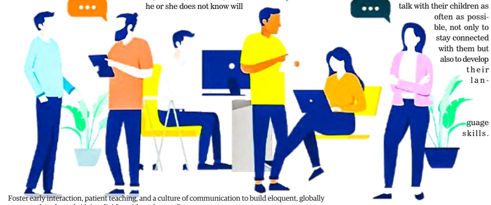
Foster early interaction, patient teaching, and a culture of communication to build eloquent, globally connected students, bridging divides with understanding.