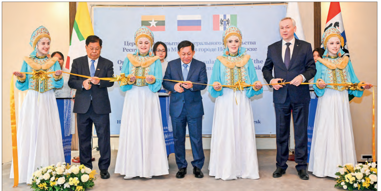
State Administration Council Chairman Prime Minister Senior General Min Aung Hlaing, Deputy Prime Minister Union Minister U Than Swe and the Governor of Novosibirsk cut the ribbon of opening ceremony of the Myanmar Consulate-General.

Senior General Min Aung Hlaing urged families of Myanmar Consulate-General and officer trainees to enhance friendly relations and cooperation between Myanmar and Novosibirsk.