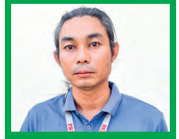
Naung Taw Lay (Chief Editor, Myanmar National Post)