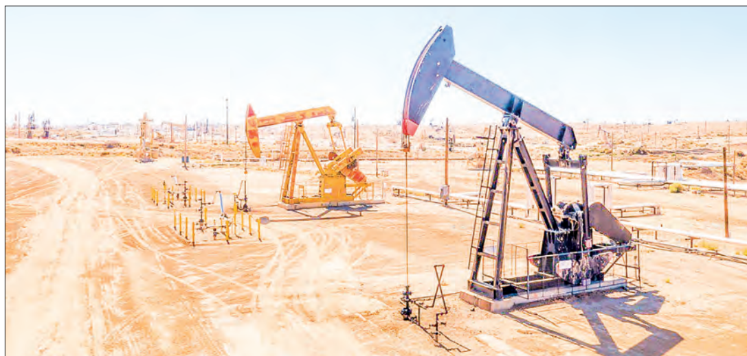
The Turkish minister announced plans to drill 153 new oil wells, primarily in the Gabar region of southern Sirnak province, eastern Van province, and southern Diyarbakir province, along with the areas near the Türkiye-Syria border. PHOTO: FILE PHOTO FOR REPRESENTATIONAL PURPOSES ONLY

When elaborating on work to enhance Türkiye's natural gas production, the minister said that 7 million cubic metres of natural gas is produced daily from the Sakarya Gas Field in the Black Sea, enough to meet the needs of approximately 3 million households. — Xinhua