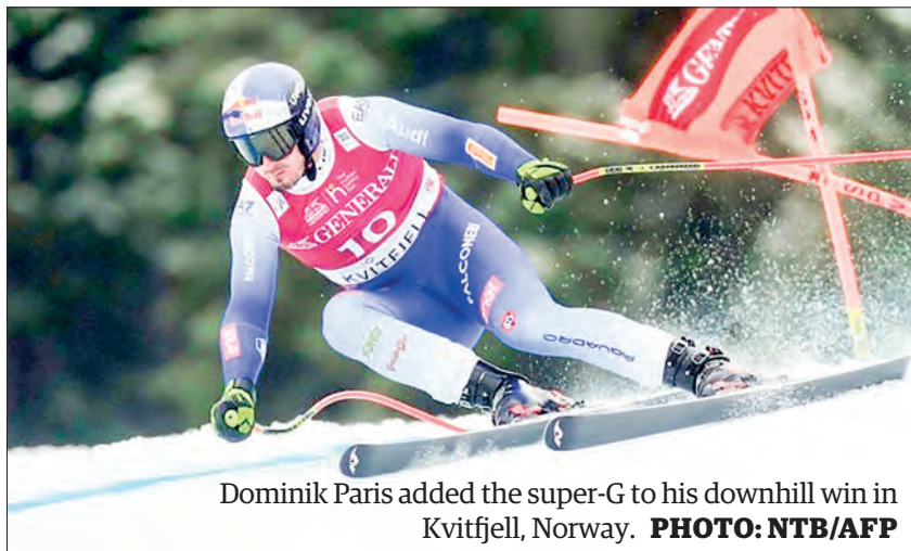
Dominik Paris added the super-G to his downhill win in Kvitfjell, Norway.

The professional sports management programme is conducted by international experts and it covers 13 specialized subjects related to sports administration. This marks the first time a recipient from the Yangon Region Football Federation has been awarded this scholarship among all state and regional football federations.—ASH/KZL