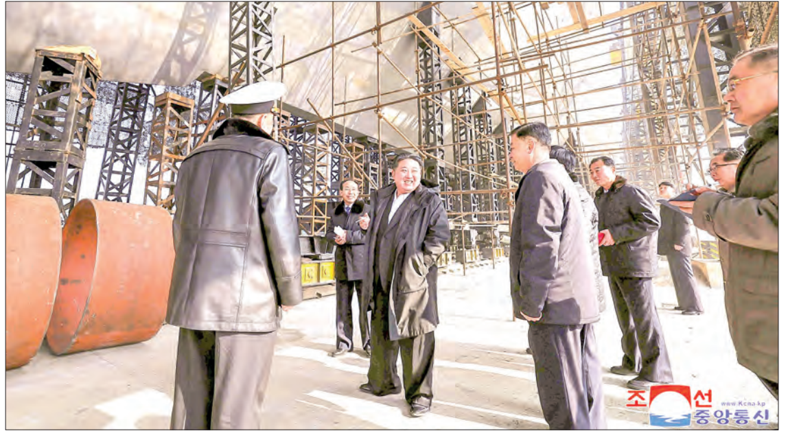
In this undated photo provided on 8 March 2025, by the Democratic People's Republic of Korea government, DPRK top leader Kim Jong-un (centre) visits a shipyard to construct warships at an undisclosed place in the country.

He stressed the need to decisively enhance the war-