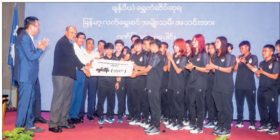
Officials present cash award to the Myanmar women's national football team.

A ceremony to honour the Myanmar women's national football team, which won champions in the Four-Nation Women's Football Invitational Tournament