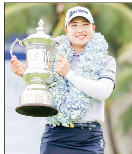
Japan's Rio Takeda celebrates after winning the Blue Bay LPGA tournament at the Jian Lake Blue Bay Golf Course on China's Hainan Island on 9 March 2025.

In the tournament, Myanmar competed in a round-robin format against Nepal, Kyrgyzstan and Lebanon. The team secured a 3-1 victory over Lebanon, a 5-0 win over Kyrgyzstan and played to a 2-2 draw against host Nepal, finishing as group leaders and advancing to the final. In the championship match, Myanmar defeated Nepal 2-0 to claim the title.