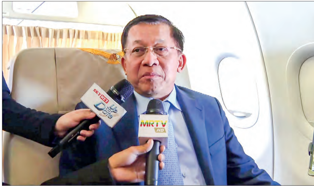
SAC Chairman Prime Minister Senior General Min Aung Hlaing

I am on official State visits at the invitation of President of the Russian Federation, Vladimir Vladimirovich Putin, and President of Belarus Aleksandr Gregoryevich Lukashenko. Since these are official invitations, the visit is highly beneficial for our country. During the trip, we had extensive discussions and collaborations in various sectors between our two nations. In particular, we focused on economic cooperation. Moreover, we emphasized expanding tourism sector. We also discussed cooperation in education, science and technology, healthcare, sports, culture, law, and defence. Moreover, I had the opportunity to explain Myanmar's political developments, which were fully acknowledged and accepted by