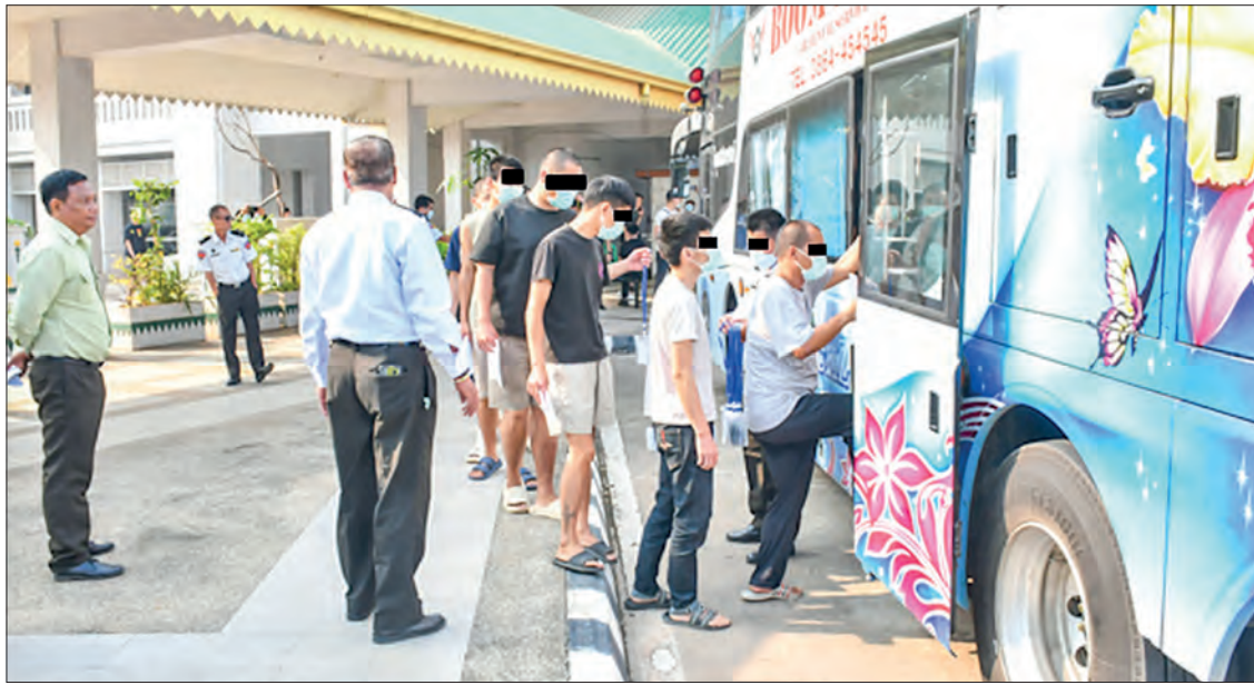
Immigration and officials processing the transfer of 214 foreign undocumented entrants.

Most of these foreign nationals were lured into engaging in online gambling, telecom fraud, and other illegal activities in the Shwe Kokko, Maethawtalay, and KK Park areas of Myawady after entering the country illegally. According to their confessions, almost all of them crossed into Myanmar illegally through border crossings with neighbouring countries.