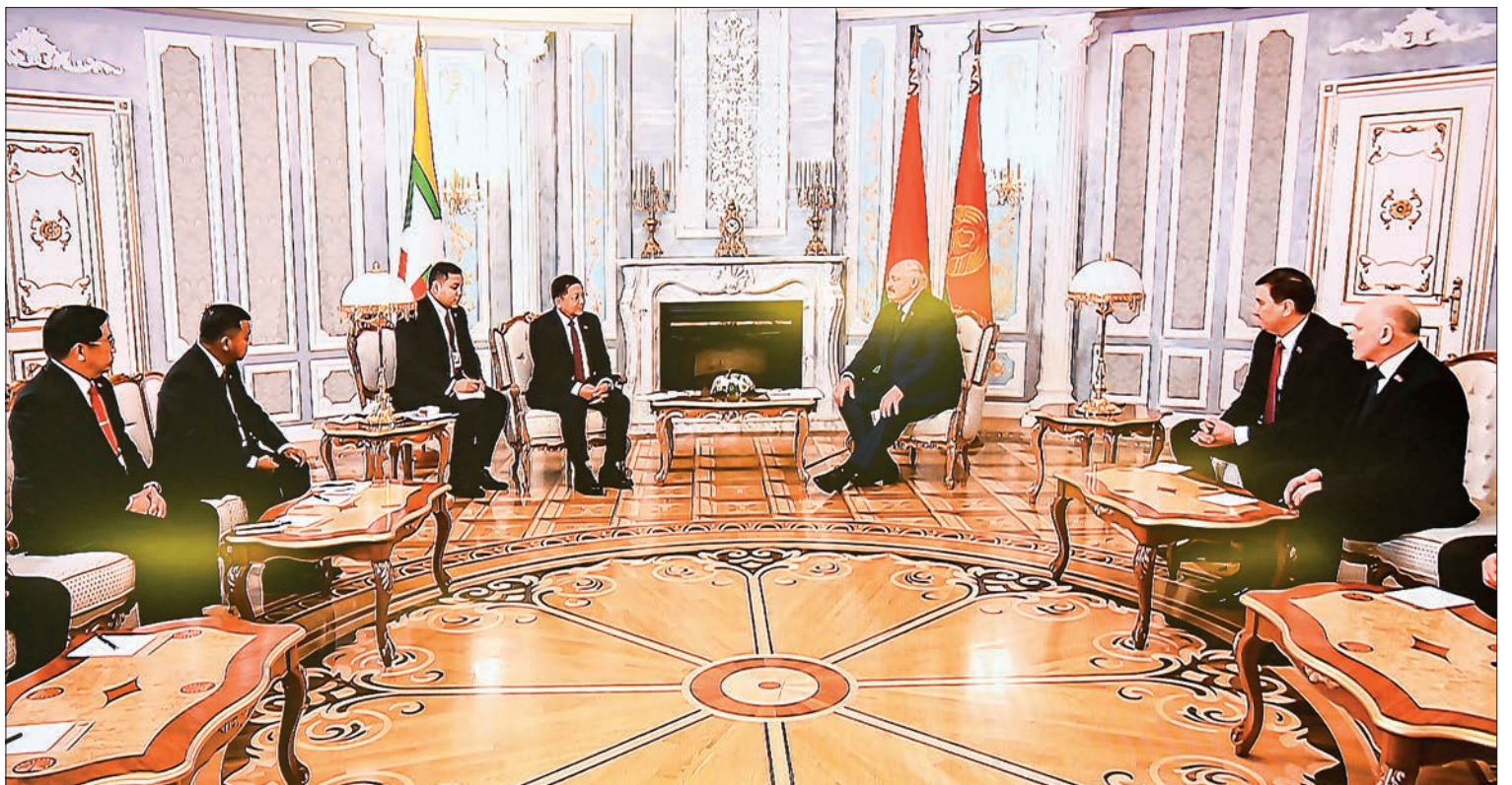
Belarusian President Mr Alexander Gregoryevich Lukashenko and SAC Chairman Prime Minister Senior General Min Aung Hlaing meet at the Presidential Palace on 7 March 2025.

They cordially exchanged views on the enhancement of cooperation in various sectors including bilateral diplomatic relations, economic, agriculture, industry, education, science and technology, culture and sports sectors, plans to promote cooperation in the defence sector, potentials for further strengthening bilateral relations through sectoral cooperation between the two countries, Myanmar-Belarus trade and economic coop-