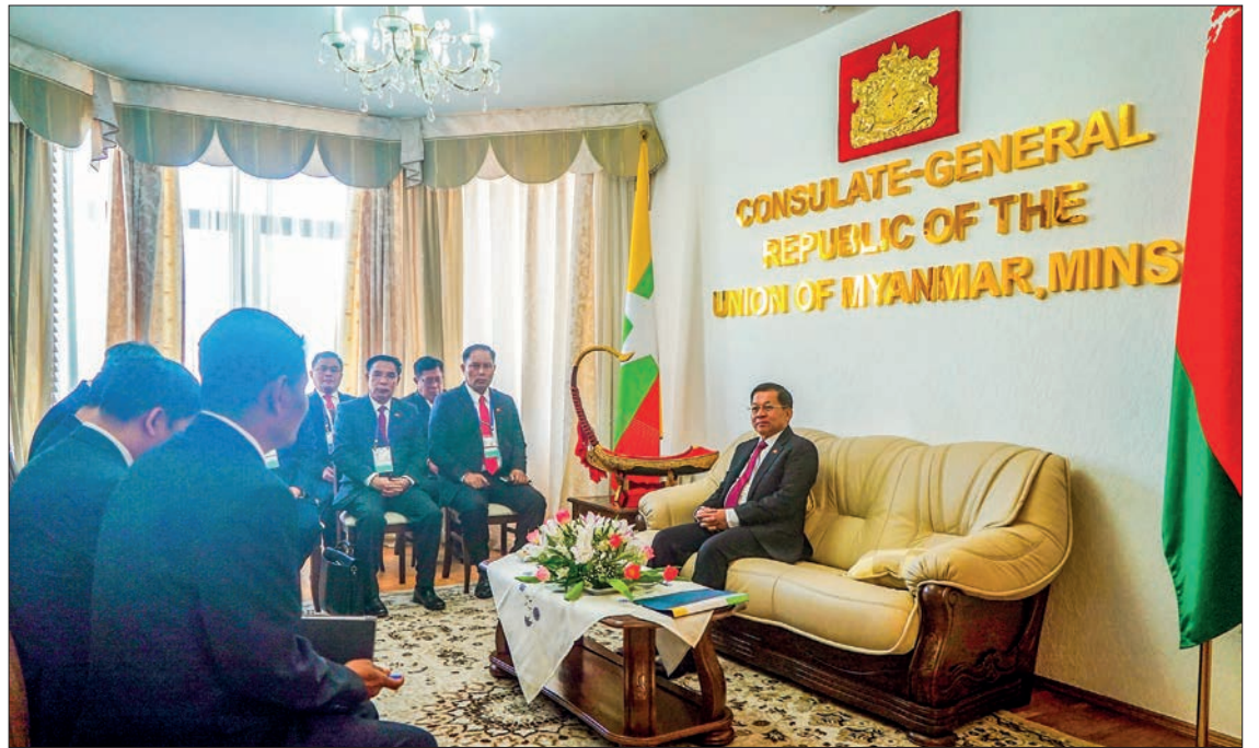
State Administration Council Chairman Prime Minister Senior General Min Aung Hlaing meets officer trainees learning in Minsk, Belarus.

In the morning, the Senior General visited the Myanmar Consulate-General in Minsk and met the staff of the Consu-