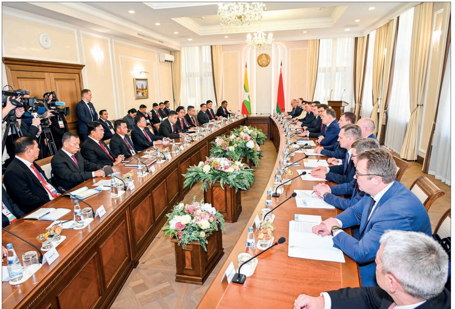
SAC Chairman Prime Minister Senior General Min Aung Hlaing holds talks with Belarusian Prime Minister Mr Roman Alexandrovich Golovchenko at the latter's office yesterday.

At the meeting, they openly exchanged views on the enhancement of friendship and cooperation between two countries through the goodwill visit to Belarus, the successful holding of Myanmar-Belarus Business Forum and signing of MoUs, the export of locally produced products between two countries, export of industrial crops including rice of Myanmar to Belarus, mutual benefits through cooperation between Myanmar possessing fine soil for agriculture and live-