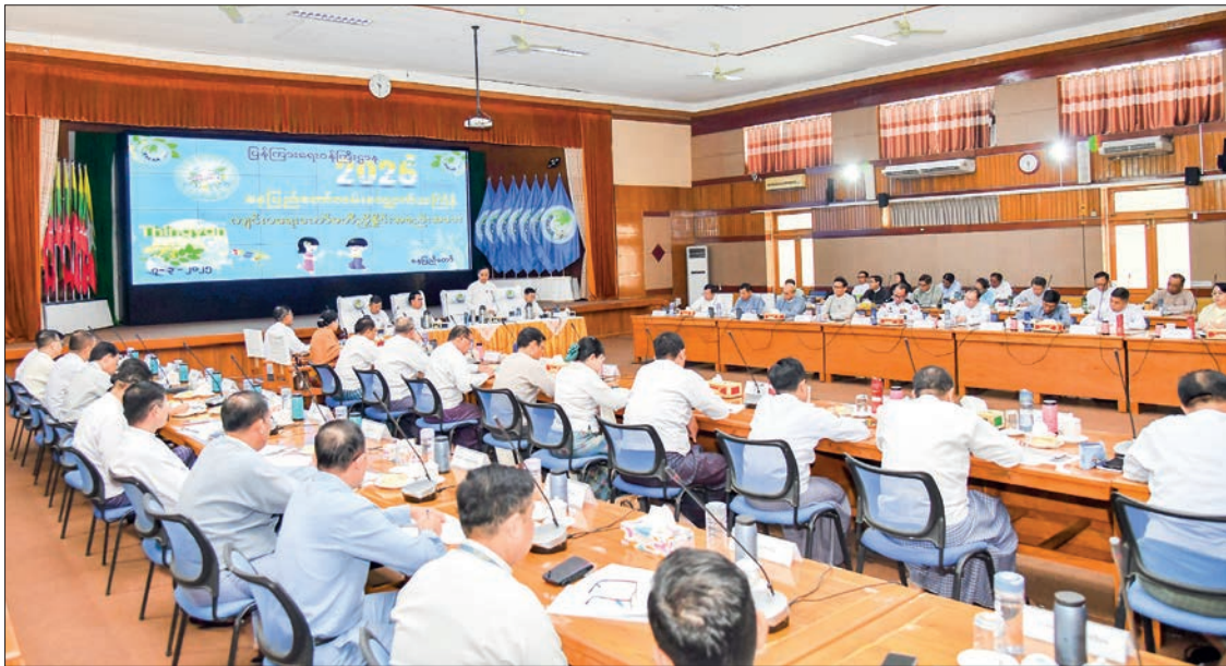
The coordination meeting on the successful holding of the Nay Pyi Taw Walking Thingyan in the 2025 Traditional Myanmar Thingyan Festival in progress yesterday.

A coordination meeting on the holding of Nay Pyi Taw Walking Thingyan to celebrate the 2025 Myanmar Traditional Thingyan Festival was held at the Ministry of Information in Nay Pyi Taw yesterday.