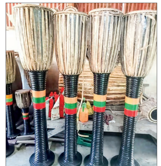
This image depicts Shan's long and short drums in the market.

Other Myanmar musical instruments that used to rule the fields in the past include bronze gong, iron gong, bronze bell, big drum, alms bowl, various lacquerware and Byaw drum, while Shan long and short drums among them are currently the most popular. — Thit Taw/ZN