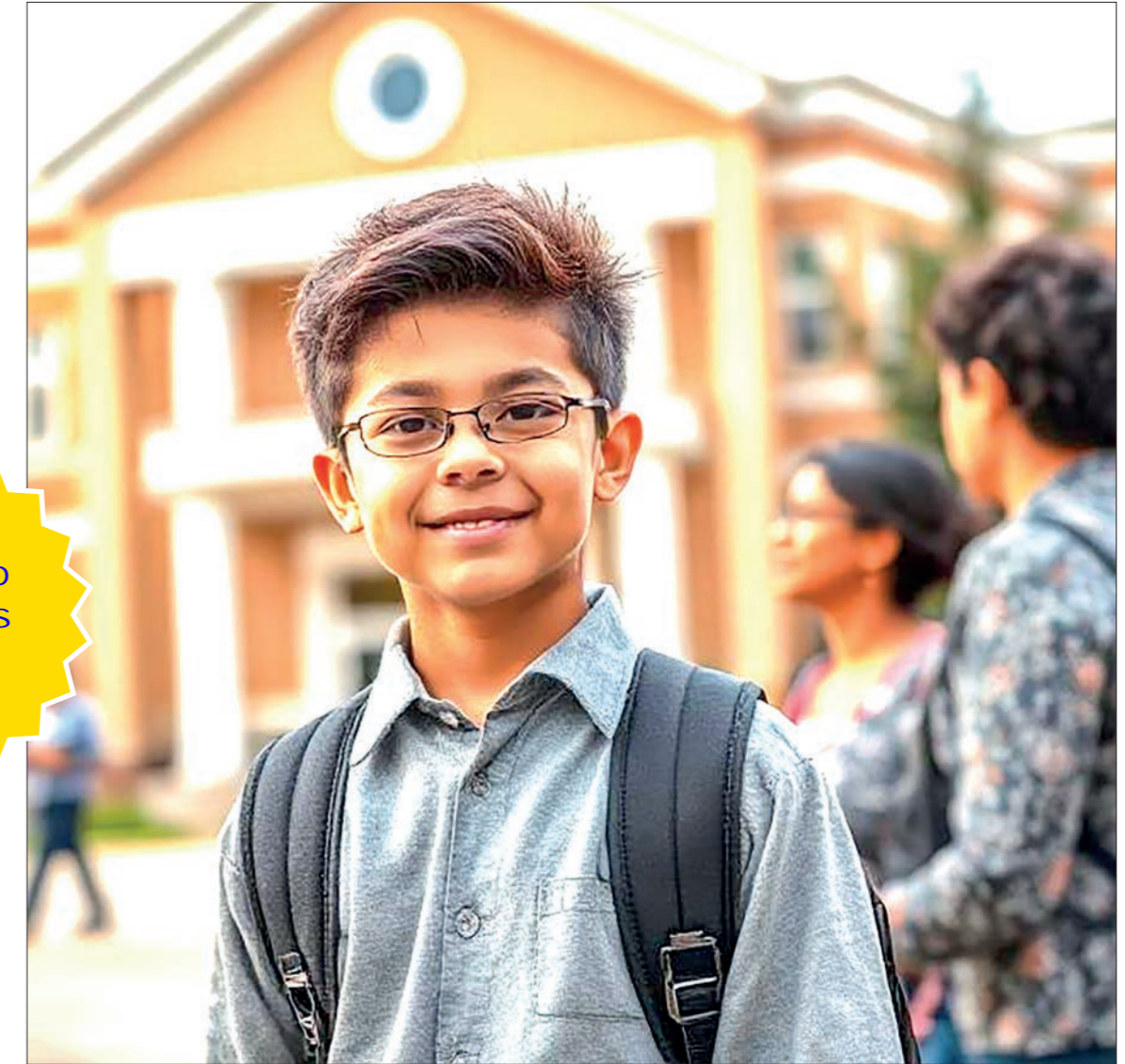
ILLUSTRATION: REPRESENTATIONAL IMAGE/CONCEPT ART

though their parents would like them to pursue education only, it stands to reason that the children will never excel in their studies. Unfortunately for them, some students do not find an opportunity to learn from good teachers who have mastery of both subject matter and instructional methods. Unless these students have powerful self-directed learning or independent study, they will also infrequently do extremely well in their school subjects. Some students compete against others for classroom learning activities, but they do not study at home for love or money, knowing that other students do not do their homework, either. The worst of it is that students are learning in an environment where their educational