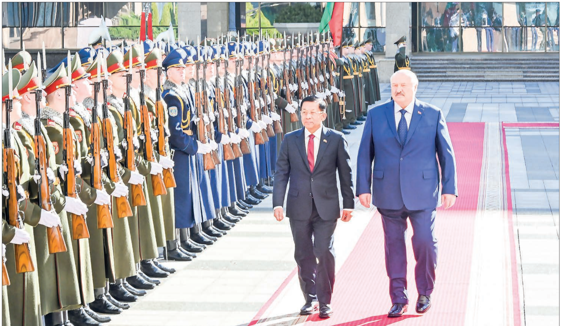
Belarusian President Mr Alexander Gregoryevich Lukashenko welcomes State Administration Council Chairman Prime Minister Senior General Min Aung Hlaing with the salute of the Guard of Honour at the Presidential Palace on 7 March 2025.

S tate Administration Council Chairman Prime Minister Senior General Min Aung Hlaing, who is currently in Belarus on his official State visit at the invitation of President Mr Alexander Gregoryevich Lukashenko of the Republic of Belarus, was welcomed by the President of the Republic of Belarus alongside the Guard of Honour at the Presidential Palace yesterday morning.