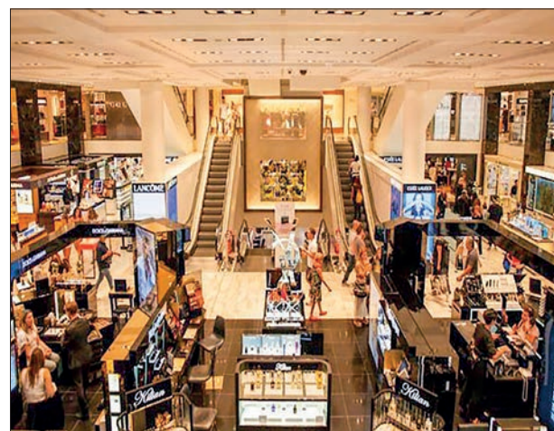
Inflation in pulses remained under control due to improved supply conditions.

certain risks persist. Global asset price volatility, particularly in gold and base metals, has not yet significantly impacted inflation, as energy prices have remained relatively low. However, tariffs on metals could drive up prices in the coming months. In February, increased demand led to higher prices for metals such as copper and zinc. — ANI