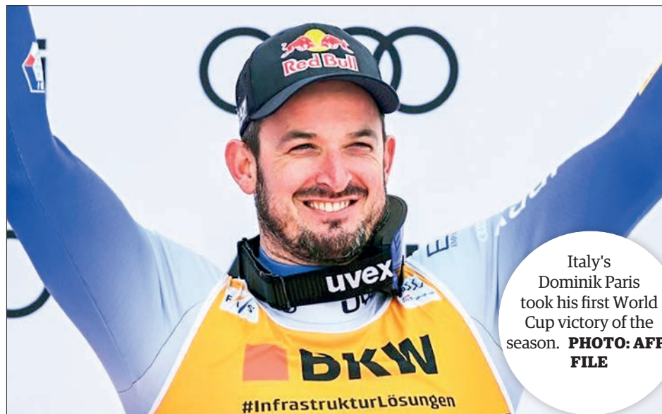
Italy's Dominik Paris took his first World Cup victory of the season.

Stefan Rogentin was third at 0.63sec, Franjo Von Allmen placed fourth at 0.83sec after a characteristically wild ride, and Alexis Monney finished fifth at 0.89sec. — AFP