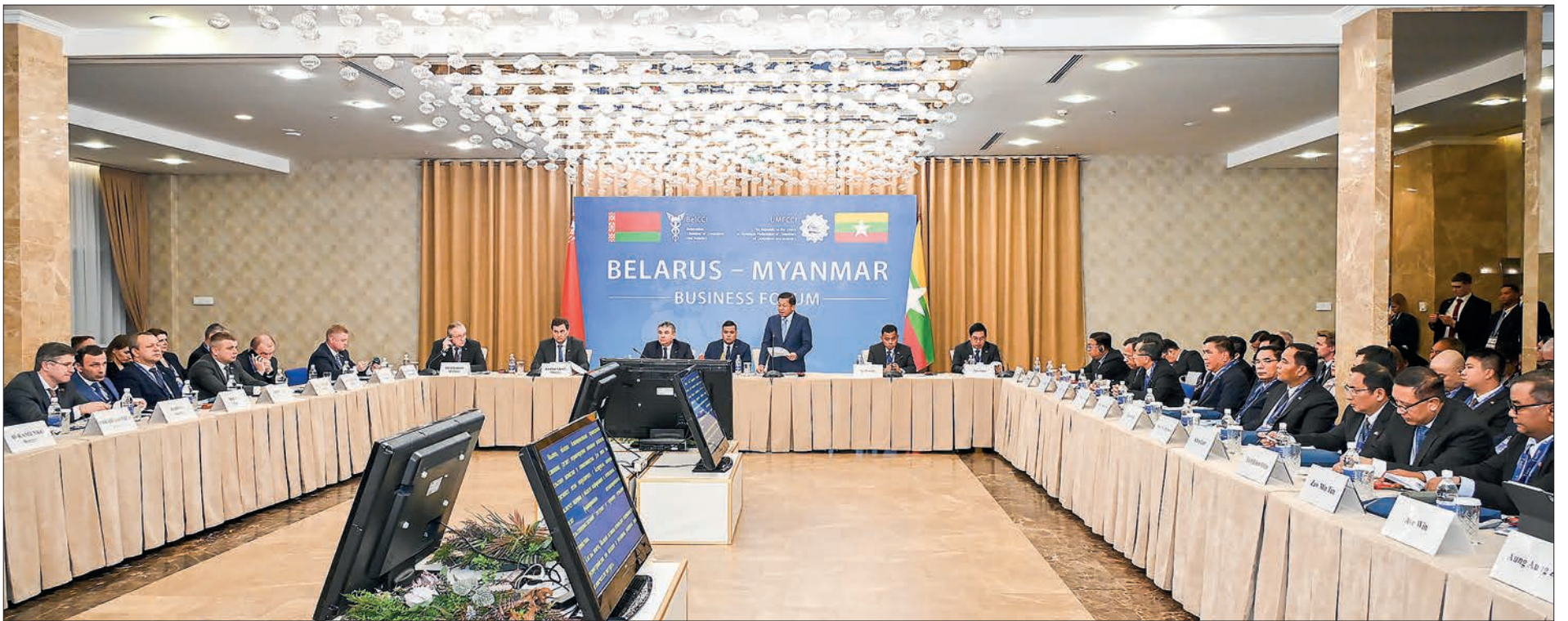
State Administration Council Chairman Senior General Min Aung Hlaing addresses the Myanmar-Belarus Business Forum at the Hotel President in Minsk on 6 March 2025.

Senior General Min Aung Hlaing expressed his confidence that the successful economic discussions held together with Belarus would lead to greater future collaboration and an enhanced partnership between the two countries.