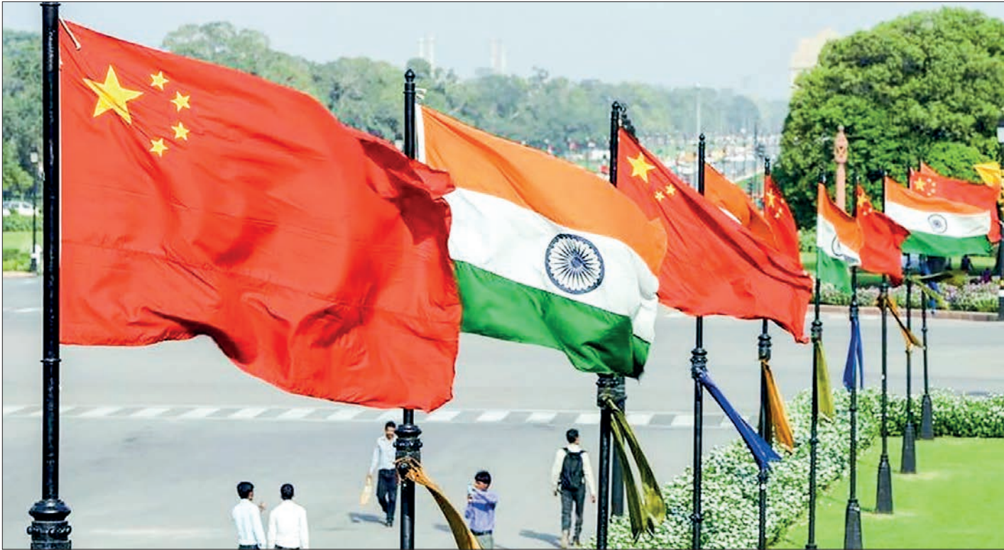
In this undated file photo, Indian and Chinese national flags flutter side by side at the Raisina hills in New Delhi, India.