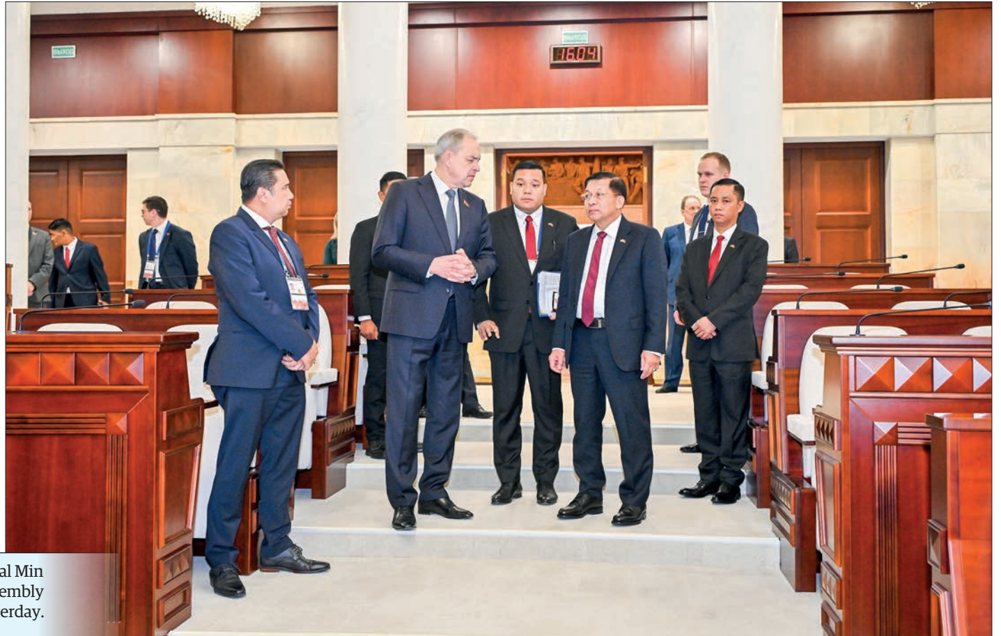
SAC Chairman Prime Minister Senior General Min Aung Hlaing meets Belarusian National Assembly Chairman Mr Igor Petrovich Sergeenko yesterday.

At the meeting hall, they cordially discussed cooperation between the Hluttaws of the two countries, legislation, ongoing measures to hold free and fair elections in Myanmar; observation made by Myanmar delegates in the general election of Belarus, sending of observers from Belarus to Myanmar election and further enhancement of friendship and cooperation between two Hluttaws.