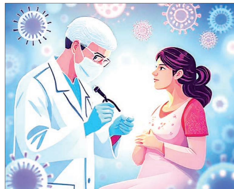
This discovery brings us one step closer to making CAR T-cell treatment more successful for a greater number of patients. ILLUSTRATION: CONCEPT ART

Researchers have discovered that by restoring the energy balance of T cells, they can enhance the effectiveness of immunotherapy. This finding opens up new avenues for improving cancer treatment.