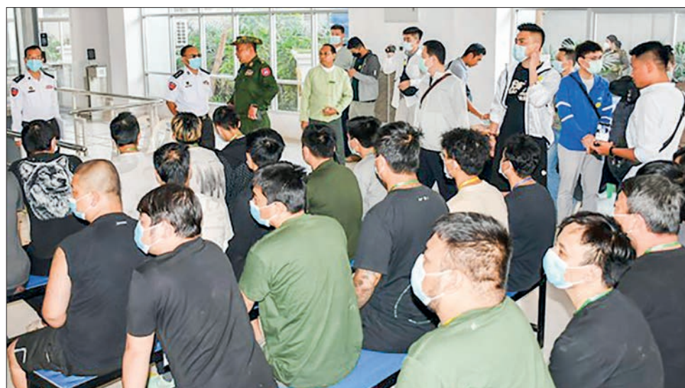
Myanmar Immigration and officials processing undocumented foreign entrants.