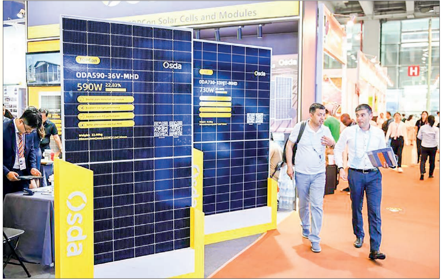
Overseas purchasers walk past a booth exhibiting solar battery products during the 135th session of the China Import and Export Fair in Guangzhou, south China's Guangdong Province, 15 April 2024.

action fails, look for the reason within oneself," Wang urged the United States to first go over what had happened. He said the United States should rethink