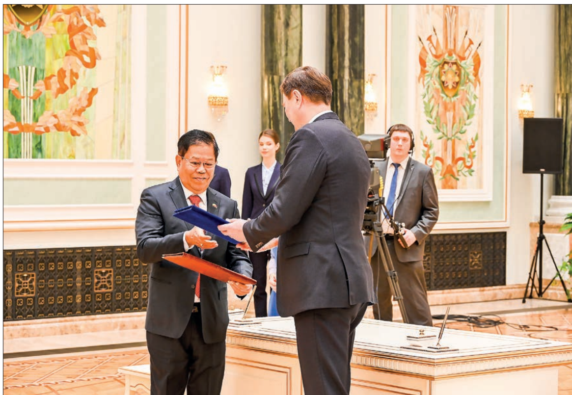
Deputy Prime Minister and Union Minister for Foreign Affairs U Than Swe and the Belarusian Minister of Foreign Affairs exchange MoU notes.

cussed despite their locations at a far distance, enhancement of diplomatic and defence relations between the two countries as good friendliness countries, plans to sign the memoranda of understanding between the two countries during the visit of the Senior General, holding coordination meetings between Ministries of Foreign Affairs of two countries, potentials for cooperation in dairy product production and cultivation of industrial raw crops, promotion of cooperation in bilateral trade and economy, investment measures, and cooperation in various sectors including manufacturing of agricultural machinery.