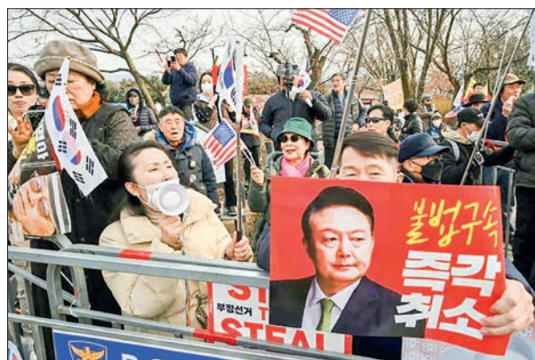
Supporters of arrested and impeached South Korean President Yoon Suk Yeol gathered to show their loyalty.

A South Korean court Friday approved the release of President Yoon Suk Yeol from detention, following his arrest and subsequent indictment over his brief