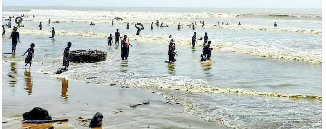
Beachgoers enjoying the Saleaintan Beach.

The journey to the beach is also convenient and those who want to take an overnight trip can stay at nearby resorts. It is anticipated that the visitor arrival will rise in this Thingyan, said residents. — MT/ZS