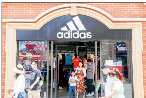
Consumers pass an Adidas store in Changzhou, Jiangsu province, on 2 May 2024.