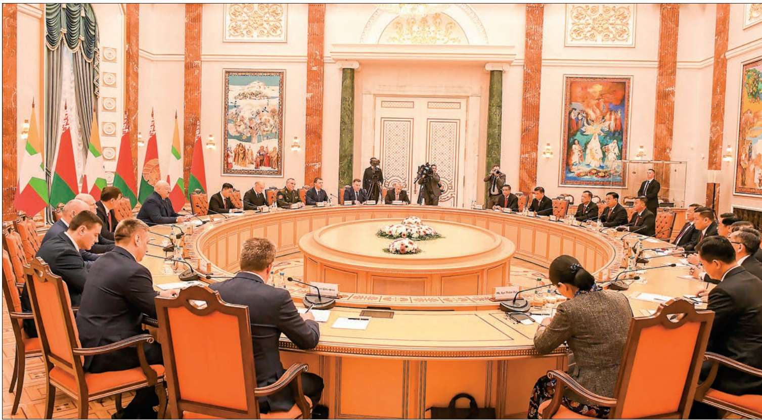
SAC Chairman Prime Minister Senior General Min Aung Hlaing holds talks with Belarusian President Mr Alexander Gregoryevich Lukashenko on 7 March 2025.

The Myanmar-Belarus State-level meeting took place at the Presidential Palace in Minsk of the Republic of Belarus yesterday afternoon, attended by Chairman of the State Administration Council Prime Minister Senior General Min Aung Hlaing and President of the Republic of Belarus Mr Alexander Gregoryevich Lukashenko.