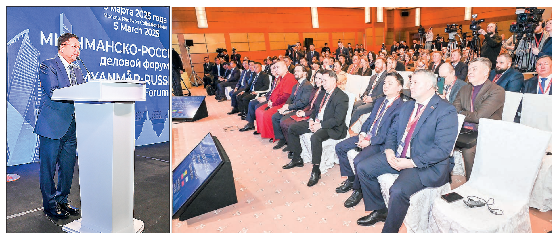
State Administration Council Chairman Prime Minister Senior General Min Aung Hlaing speaks at the Myanmar-Russia Economic Forum in Moscow yesterday.