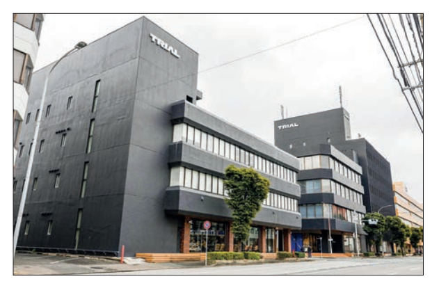
Photo shows the headquarters of Japanese discount supermarket chain operator Trial Holdings Inc in Fukuoka on 5 March 2025.

Consignees of cargo carried on M.V UNI-ACTIVE