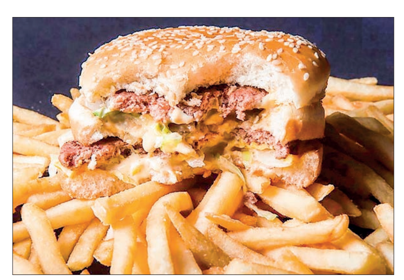
Obesity has soared has people eat more unhealthy foods, researchers have warned.

That commitment was also needed for strategies "that improve people's nutrition, physical activity and living environments, whether it's too much processed food or not enough parks," Kerr said.