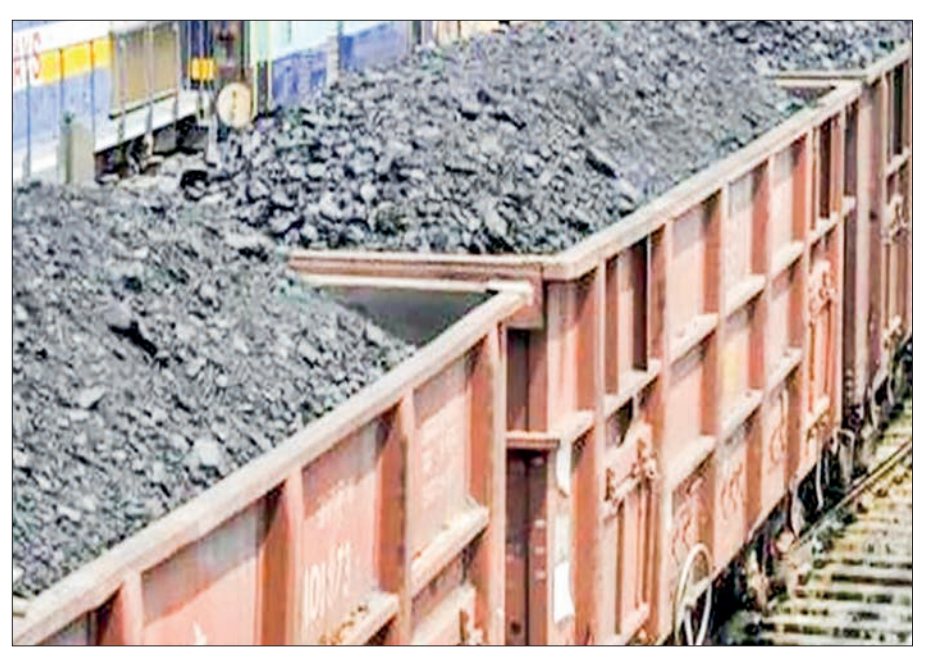
India's coal sector continues its strong performance with significant growth in both production and dispatch up to February 2025.

India's coal production for the month of February reached 928.95 million tonnes (MT), reflecting a 5.73 per cent increase compared to 878.55 MT in the same period last year, as per the ministry's data released on 1 March. — ANI