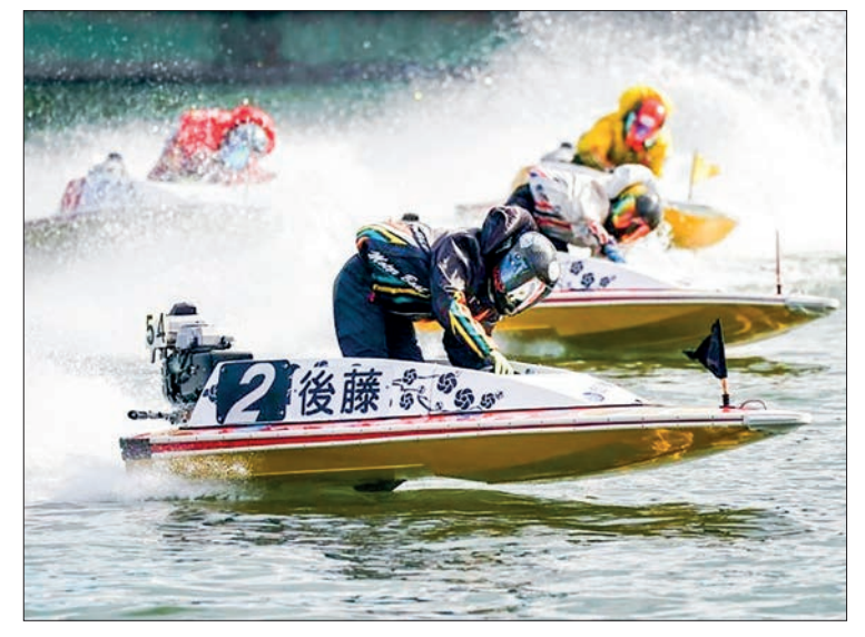
Japan's powerboat racing started as an outlet for legal betting.