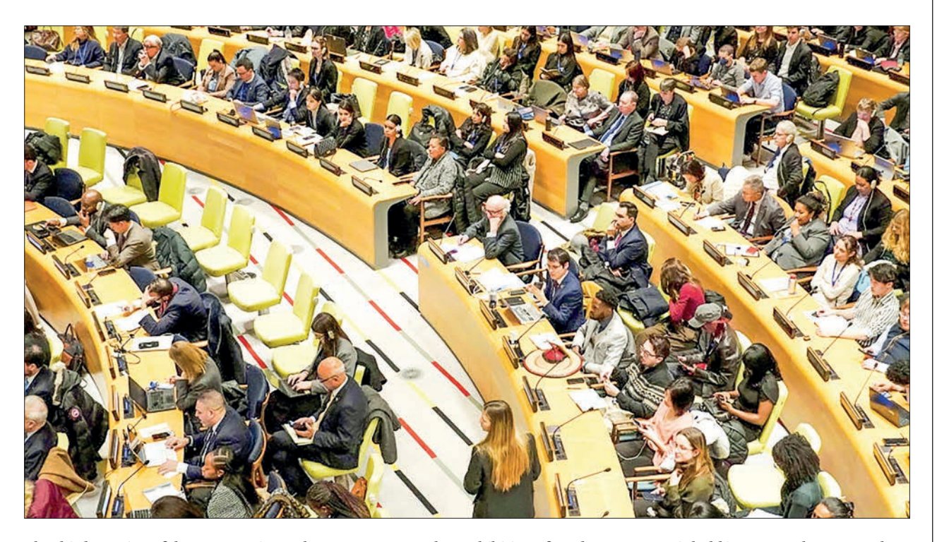
The third meeting of the state parties to the 2021 Treaty on the Prohibition of Nuclear Weapons is held in New York on 3 March 2025.

THE state parties to a UN treaty on banning nuclear weapons met in New York on Monday, with a Hiroshima atomic bomb survivor's son repeating his call for the eradication of such arsenals.