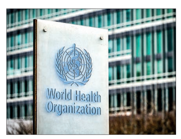
This photograph taken on 2 December 2021 shows a sign of the World Health Organization (WHO) next to theirs headquarters, in Geneva.

The United Nations health agency said it was