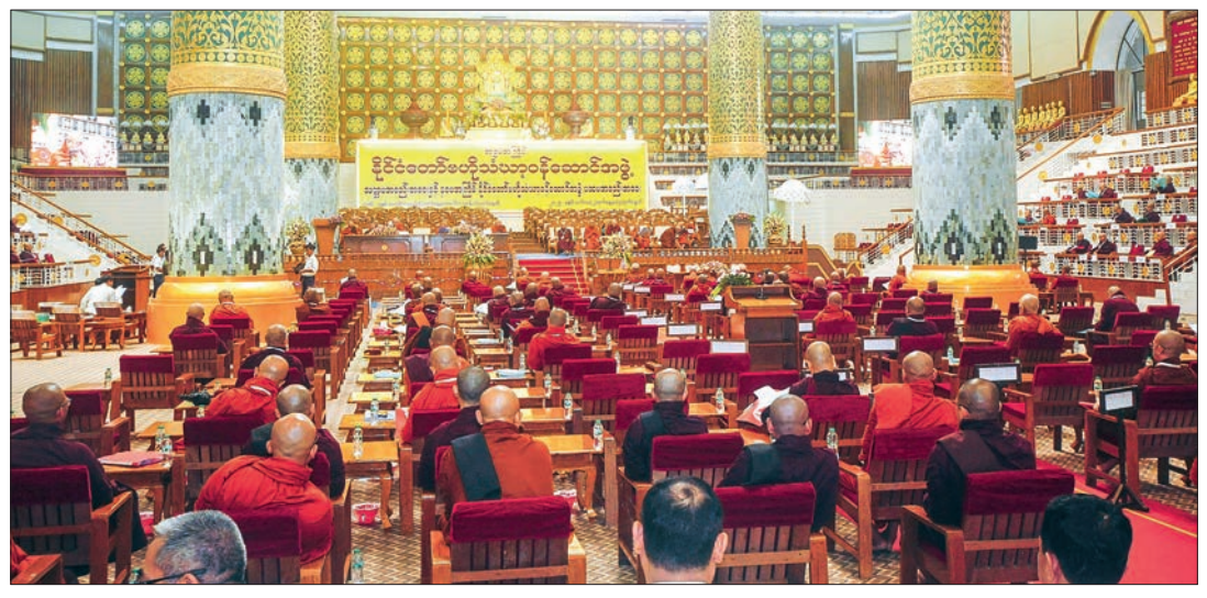
The first meeting of the ninth State Central Sangha Working Committee in progress yesterday in Yangon.

THE Ninth State Central Working Committee of the Sangha held its first meeting Committee, and the Presidat Maha Pasana Cave on Thi- ing Sayadaw sought approvals ri Mingala Kaba Aye Hill in Mayangon Township, Yangon Region, yesterday morning.