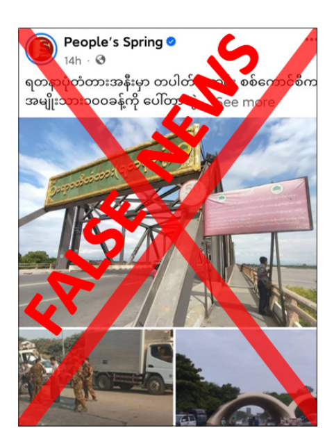
This screenshot discloses misinformation.

The false reports are part of a wider effort by PDF terrorists to disrupt peace in local communities. Authorities, in collaboration with residents, are conducting necessary security checks and patrols. These illegal media outlets are attempting to ize peace and stability. — MNA/KZL