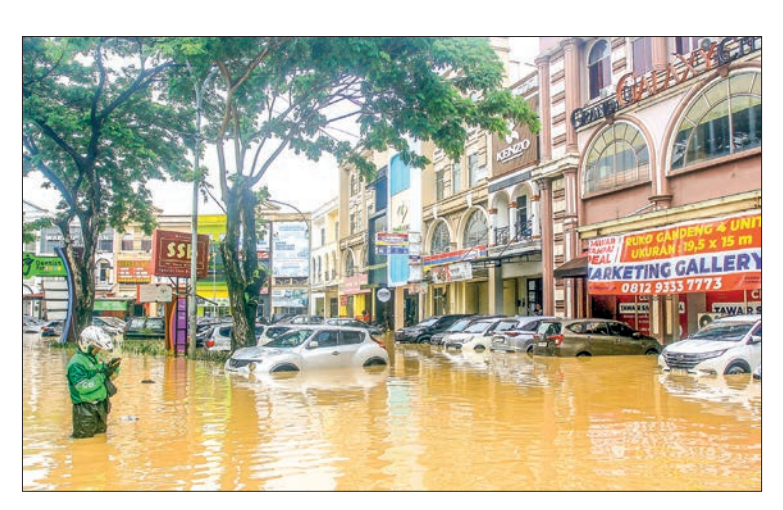
An online motorcycle taxi driver uses a smartphone while standing in the middle of the flood where several cars are submerged at the Grand Galaxy Shopping Area in Bekasi, West Java, on 4 March 2025.

"The heavy rain was caused by the detection of atmospheric waves such as the Equatorial Rossby wave and the Kelvin wave, followed by the formation of a low-pressure area and the convergence of several wind patterns from various directions," said Karnawati. — Xinhua