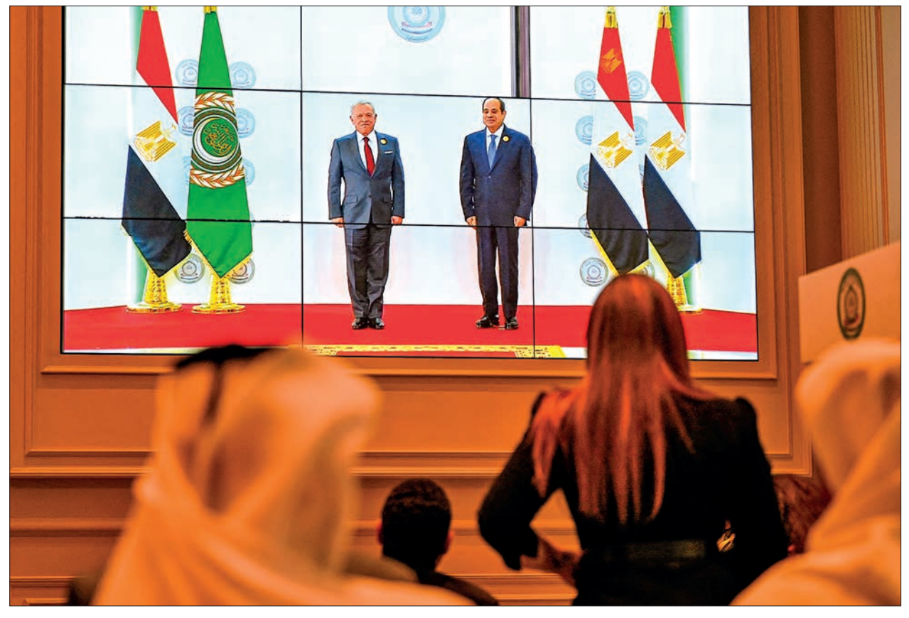
People watch on a big screen as Egypt's President Abdel Fattah al-Sisi (R) welcomes Jodran's King Abdullah II ahead of an Arab League summit on Gaza on 4 March 2025.

Egyptian President Abdel Fattah al-Sisi and Bahrain's King Hamad are expected to deliver opening remarks, according to a scheduled shared by the Arab