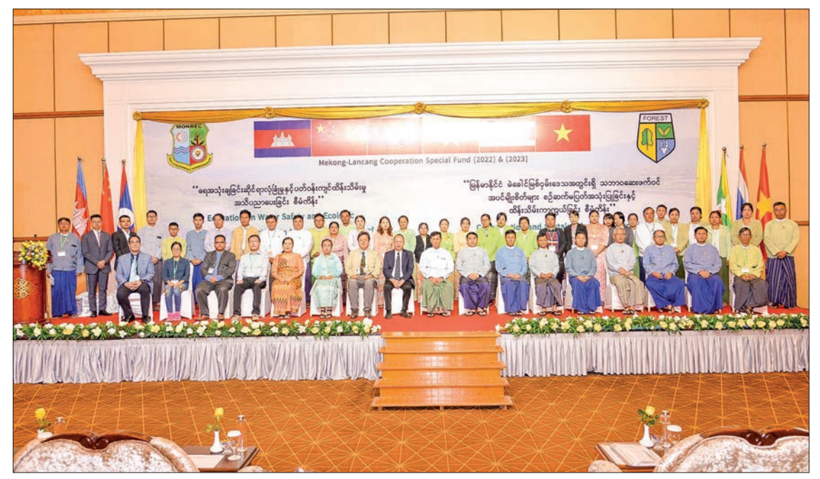
Attendees of the "Project Completion Workshop" and the "Regional Workshop" of the Mekong-Lancang Cooperation Special Fund (2022) pose for the documentary group photo at Hotel Max in Nay Pyi Taw yesterday.

A commemorative video showcasing projects implemented under the Mekong-Lancang Cooperation Special Fund was screened, followed by project officials explaining their respec-