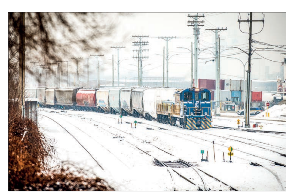
(FILES) A freight train is seen near the Port of Montreal in Montreal, Canada, on 3 February 2025.

Trump has also signed plans for sweeping "reciprocal tariffs" that could hit both allies and adversaries. — AFP