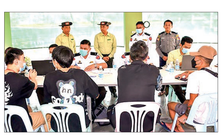
Immigration processing undocumented foreign migrants.

MYANMAR authorities yesterday arrested 253 foreigners who illegally entered the Myawady-Shwe Kokko and