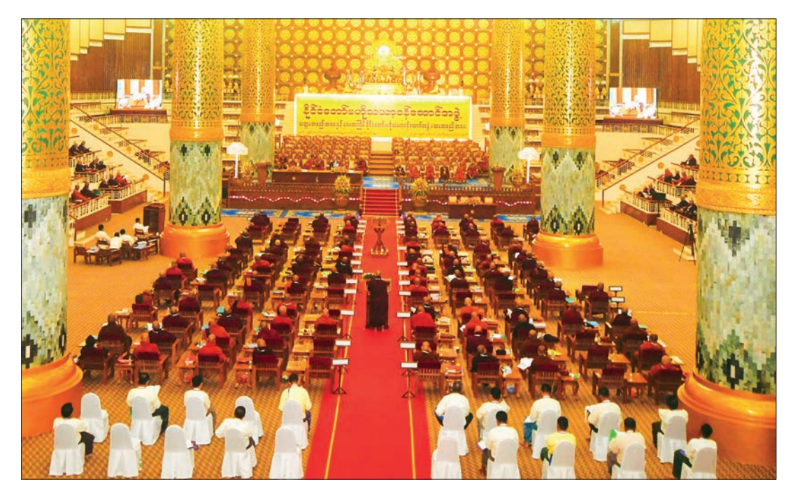
The second-day session of the seventh meeting of the Eighth State Central Sangha Working Committee in progress yesterday in Yangon.

THE Eighth State Central Sangha Working Committee of the Sangha held its second-day session of the seventh meeting at Maha Pasana Cave on Thiri Mingala Kaba Aye Hill in Mayangon Township, Yangon Region, yesterday morning.