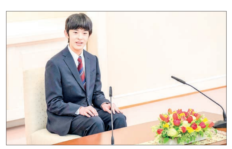
This handout photo taken and released on 3 March 2025 by the Imperial Household Agency of Japan shows Japan's Prince Hisahito attending his first press conference at the Imperial Palace in Tokyo.

JAPAN'S Prince Hisahito, the nephew of Emperor Naruhito and second in line to the Chrysanthemum Throne, expressed Monday his desire to approach his public duties with care and awareness as he fulfills his role as an adult member of the imperial family.