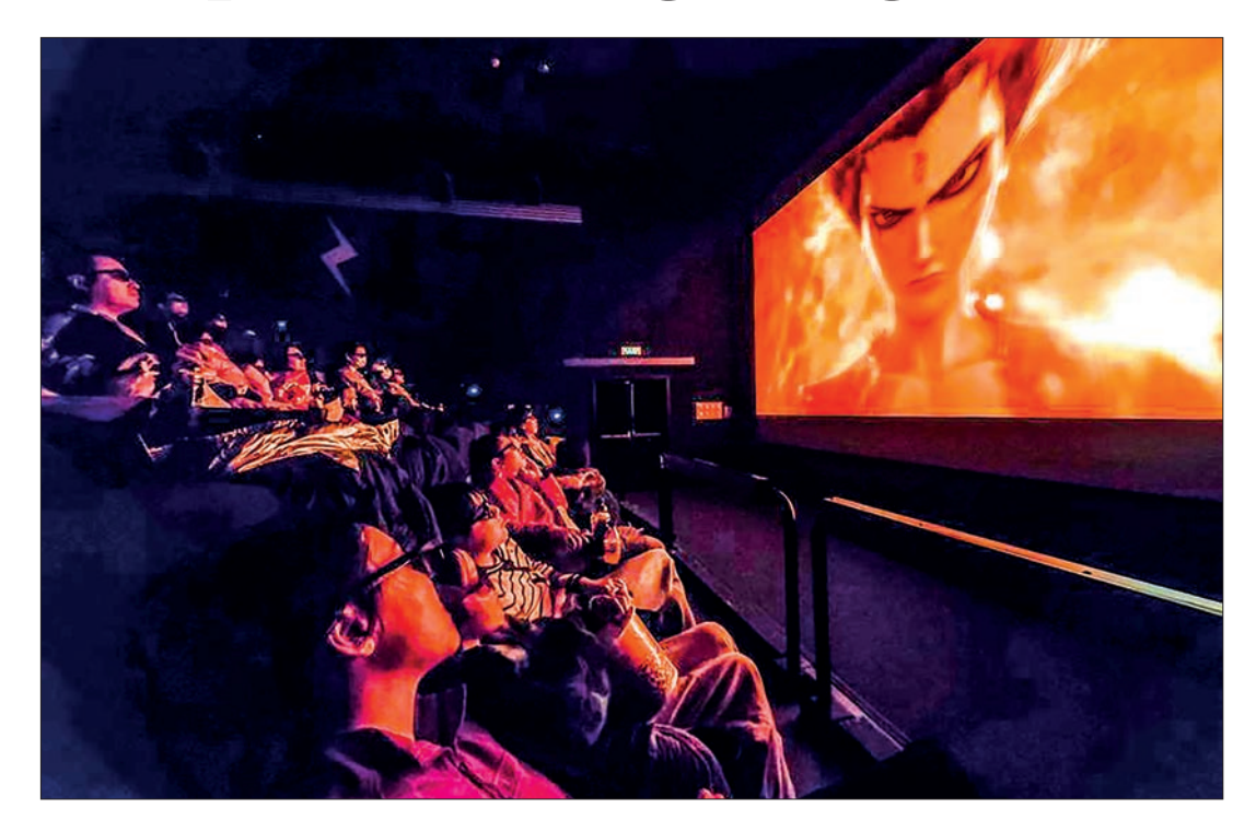
People watch "Ne Zha 2" in 4D at a cinema in Dongcheng District in Beijing, capital of China, 16 February 2025.

CHINESE animated blockbuster "Ne Zha 2" reflects a growing global interest in Chinese culture and serves as a testament to China's rising cultural soft power, a local scholar in culture and arts education told Xinhua.