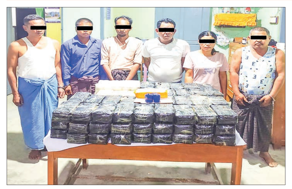
Six offenders are seen alongside seized drugs in Padaung Township.

THE police seized K1.53 billion worth of 1.02 million stimulant tablets at Bubet village inspection camp in Padaung Township on 28 February.