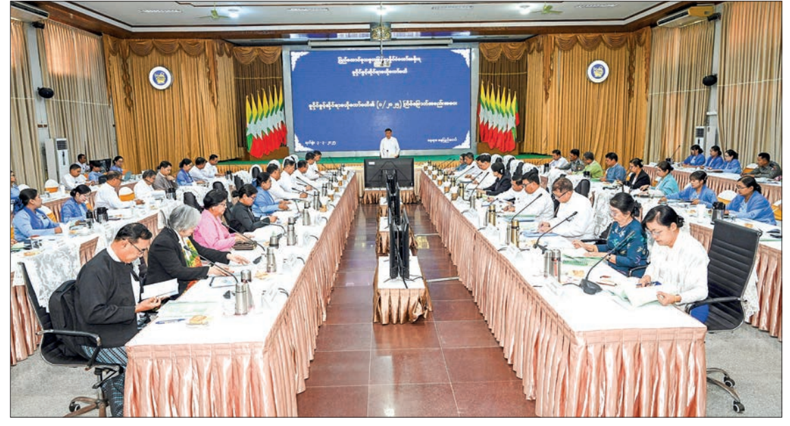
The first meeting of the Central Committee on Copyright in progress yesterday in Nay Pyi Taw, addressed by SAC Member Deputy Prime Minister MoTC Union Minister General Mya Tun Oo.

Speaking at the meeting, the Union minister, who is also chairman of the committee, said efforts are being made to establish an efficient and up-to-date copyright system that can support the socioeconomic development of the country. Among the four copyright laws enacted in 2019, the Trademark Law, the Industrial Design Law and the Copyright Law came into force in 2023, and the Patent Law in 2024. Moreover, a system to protect the copyright of entrepreneurs and inventors aiming to promote innovations and literature is also adopted like other regional coun-