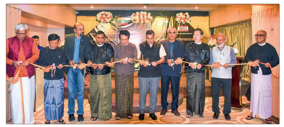
Officials cut the ceremonial ribbon to unveil the first meeting on Agriculture and Economic Development of Myanmar.

THE Myanmar-India Friendship and Development Association organized the first meeting on Agriculture and Economic Development of Myanmar, India, Singapore, Malaysia and Canada at Esperado Lake View Hotel in Yangon yesterday.