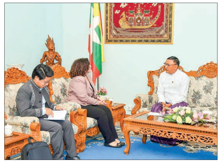
The Regional Director of UN Women Asia and Pacific Office in Bangkok calls on Deputy Foreign Affairs Minister U Ko Ko Kyaw.

Also, present at the meeting were senior officials of the Ministry of Foreign Affairs. - MNA