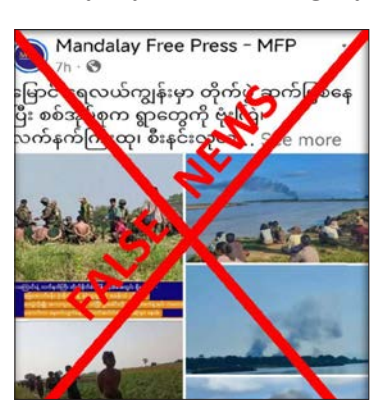
This screenshot discloses misinformation.

REPORTS have been spread by subversive media outlets claiming that security forces have carried out aerial bombings and artillery attacks on villages in the western part of Myaung Township, Sagaing Region, and the Yaylekyun area in Magway