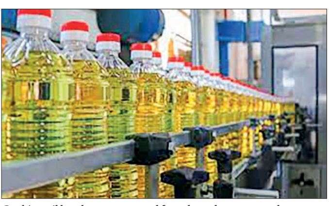
Cooking oil bottles are arranged for sale at the supermarket.

The Supervisory Committee on Edible Oil Import and Distribution under the Ministry of Commerce has been closely observing the FOB prices in Malaysia and Indonesia, adding transport costs, tariffs and banking services to decide the wholesale market reference rate for edible oil weekly. Despite the reference price, the market