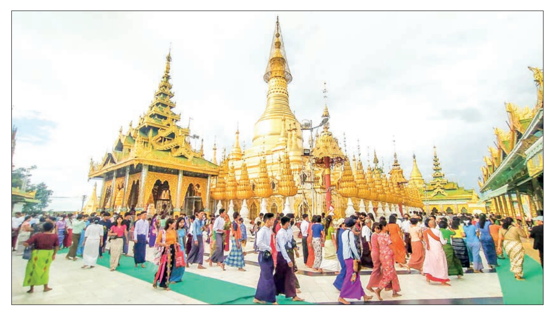
This photo captures devotees pilgrimaging the Shwesandaw Pagoda.

THE southern covered stairway of Shwesandaw Pagoda in Pyay Township, Bago Region, is being renovated with traditional Myanmar handicrafts, and an escalator is being installed, according to the Pagoda Board of Trustees.