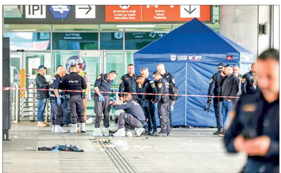
The attack took place at a bus and train station in the Israeli coastal city of Haifa.

A stabbing attack at a transport station in the Israeli city of Haifa left one person dead and several wounded on Monday,