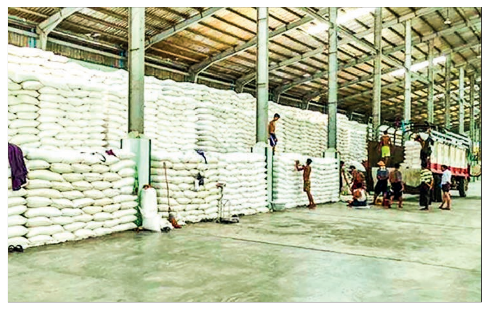
Workers efficiently stack export rice bags at warehouse.

The Ministry of Commerce issued reasonable prices for all varieties; K68,000-K80,000 per 108-pound bag of non-premium rice (Aemahta, Ngasein, Sinthukha, Ngasein Yakyaw, Kayinma, Yadanatoe, Tunpu, GW-11, Sawshoke 747, Theepu, Shweman, and Hnankauk among others), K82,000 per bag of rice varieties (Zeeya, Ngwetoe, Minaya, Hnankauk, Shweman) that are consumed locally and exported, K94,000 to K99,000 to Shwethwe, Anyatha, Pakan, Hmawby -2,3, 90-day short matured rice, Manaw Thukha, Sinthuka, Byawtun, Ayeyapadetha and Ayeyamin produced from Ayeyawady, Yangon and Bago regions, K90,000-K150,000 to moderate quality rice including Magyantaw, Ay-