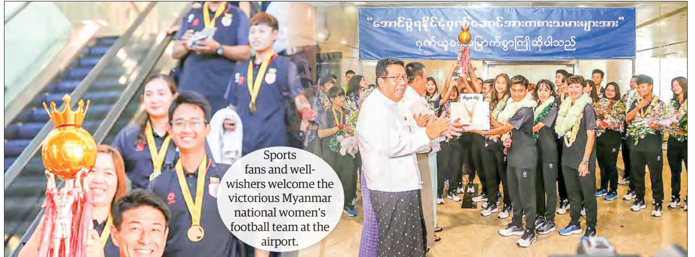
Sports fans and well-wishers welcome the victorious Myanmar national women's football team at the airport.