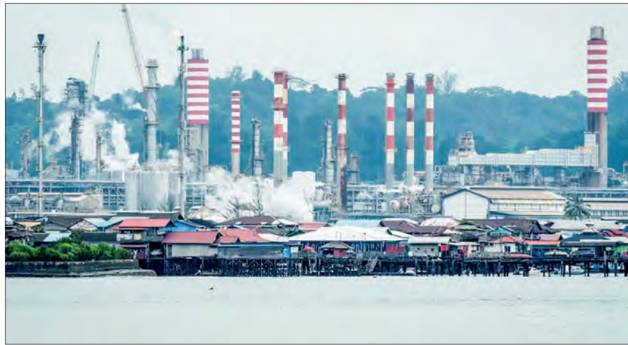
An oil refinery is seen from a ferry in Balikpapan in Indonesia's East Kalimantan province.

“The import permit for fuel oil, which previously lasted for one year, will now be changed to six