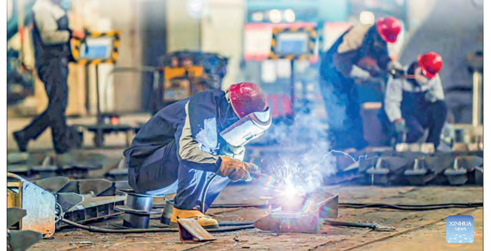
Trainees fully engaged in an intense welding practical session.

Applications will be available at Yadana Welding Training Centre (Aung San) from 24 February 2025. Interested individuals can submit applications by 7 March 2025, along with two passport-sized photos, a citizenship scrutiny card and an education certificate. They can enquire about details through 09 777387369 and 01 645759 of the department. — NN/KK