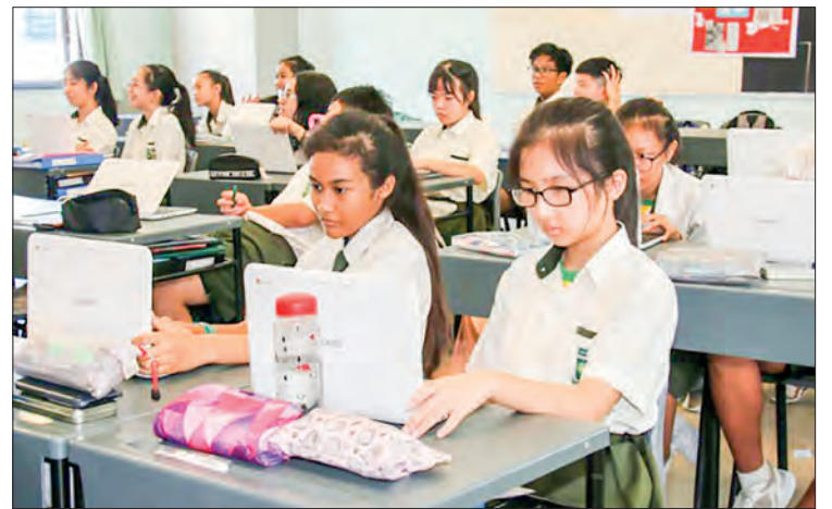
This photo reveals some students learning in Singapore.

A statement released on 15 February said that up to 320 Japanese companies would recruit more than 1,100 Myanmar workers. — MT/ZS