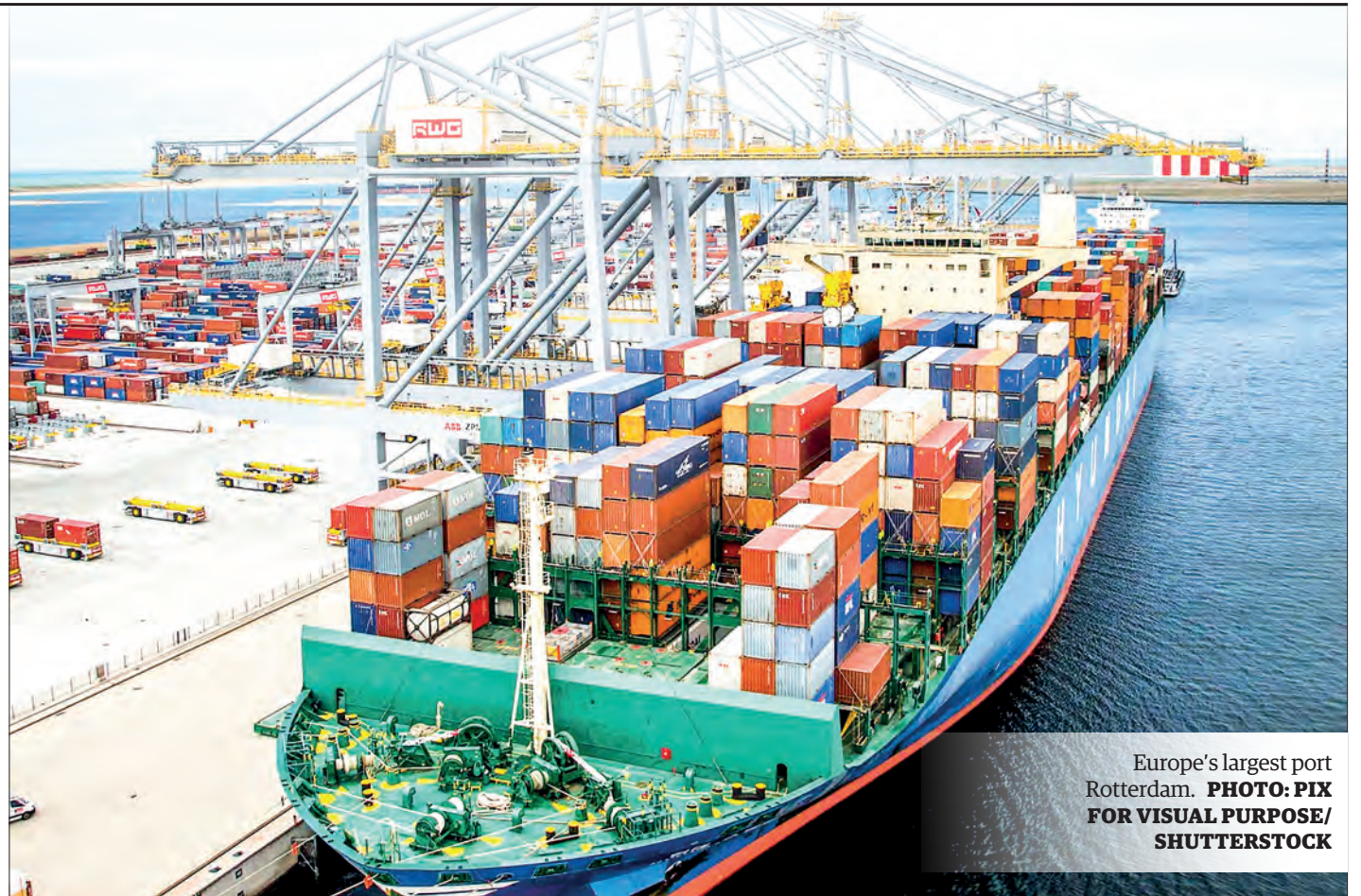
Europe's largest port Rotterdam.

As per the KCNA the goal of the exercise was to demonstrate the Korean army's “counterattack capability in any space” and “the readiness of its various nuke operation means” to “the enemies, who are seriously violating the security environment of the Democratic People's Republic of Korea and fostering and escalating the confrontation environment.” — ANI