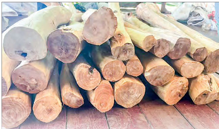
This image depicts the sandalwood logs Ayadaw produces.

SANDALWOOD retail trade has been on the rise in Ayadaw Township.