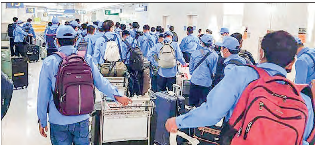
This photo captures some Myanmar workers at the airport in 2024.

The examinations will be held from 9 am to noon for Grades 1 to 3, from 9 am to 2:15 pm for Grades 4 to 5, from 9 am to 3:10 pm for Grades 6 to 9, and from 9 am to 4:05 pm for Grades 10 and 11. The names and seat numbers of the students who will be taking the exam for the respective classes can be obtained from the Myanmar Embassy on the day of the exam. — MT/ZN