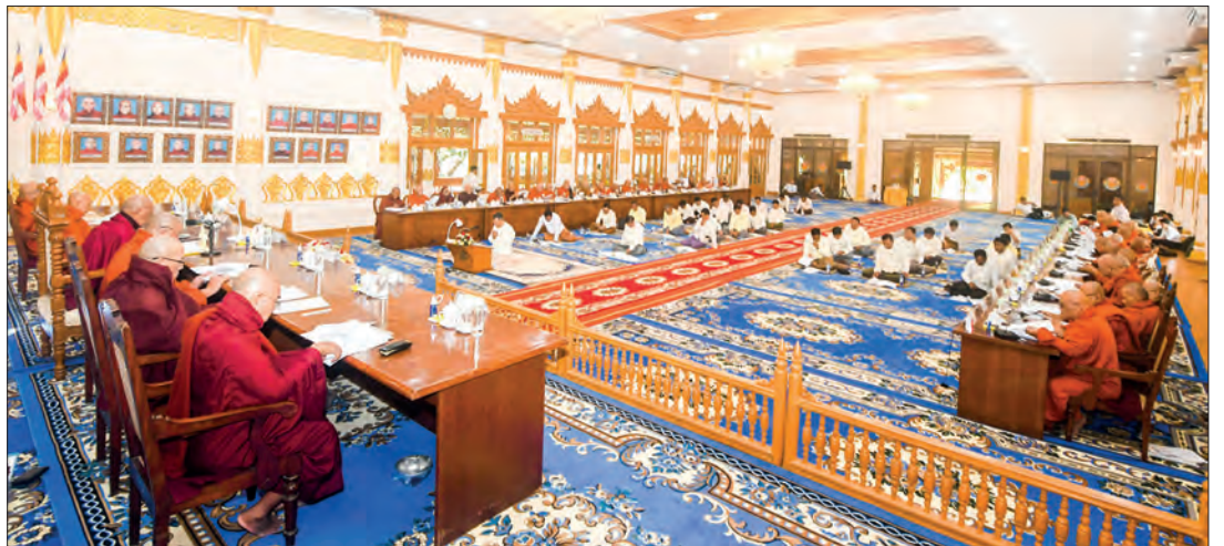
The second-day session of the 19 th plenary meeting of the Eighth 47-member State Sangha Maha Nayaka Committee in progress yesterday in Yangon.