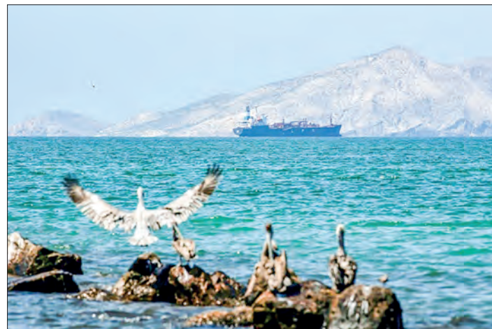
A tanker sails near an oil refining plant of state-owned Petroleos de Venezuela (PDVSA) in Puerto La Cruz in November 2021.

Chevron, the only US oil company in Venezuela, had previously stopped production in the country in 2018 due to sanctions by Trump in his first term. — AFP