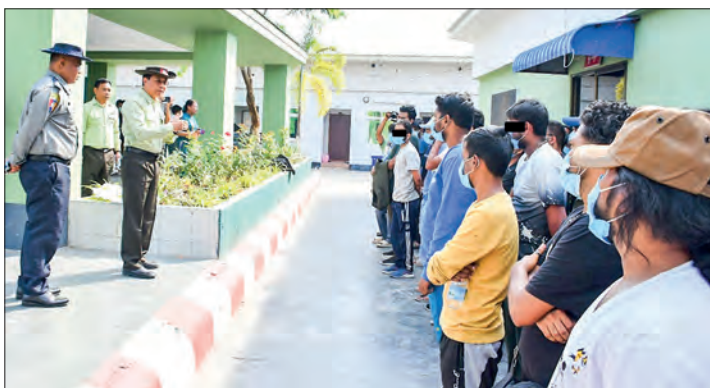
Immigration and officials processing detained foreign undocumented entrants.

Officials are collecting the personal information and records of those detained to facilitate their repatriation to their respective countries as