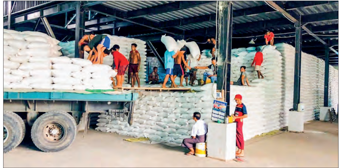
Workers neatly arranging export rice bags at the warehouse.

The Ministry of Commerce has been cooperating with departments and institutions concerned to achieve monthly export targets and beyond depending on the supply volume of rice, broken rice, pulses, corn, rubber and fisheries from the respective companies.