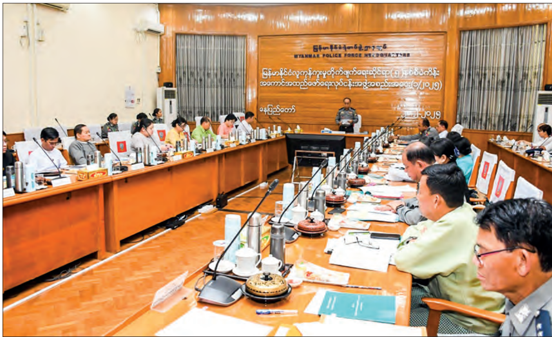
The first meeting of the Implementation Committee on Myanmar's Five-Year Plan to combat human trafficking in progress yesterday.

The committee is assisting foreign nationals who have entered Myanmar for various reasons and are facing difficulties. It collaborates with relevant embassies, the International Criminal Police Organization's