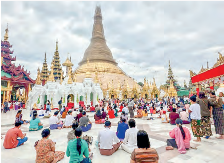
This serene photo captures devotees performing good deeds at Shwedagon Pagoda.

THE 2,613 th Buddha Pujaniya Taboung Festival will be held at the Shwedagon Pagoda for ten days, from 4 to 13 March, according to the pagoda board of trustees. During the festival, the board of