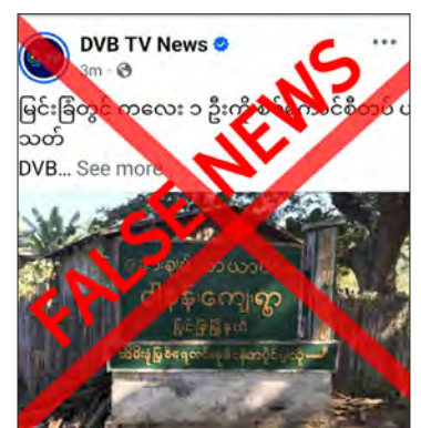
This screenshot reveals misinformation.

To maintain stability and security in villages, the authorities urge residents to report any information about terrorist activities to security forces in a timely and confidential manner. — MNA/KNN