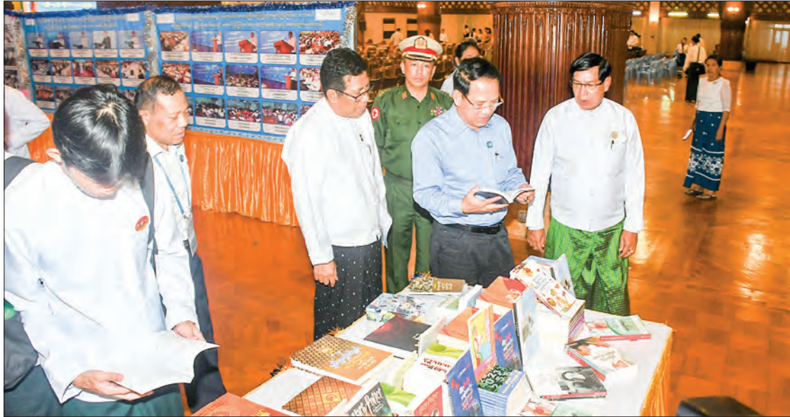
Union Minister U Maung Maung Ohn and Yangon Region Chief Minister U Soe Thein look into the books displayed at yesterday's event.

Speaking at the event, Union Minister for Information U Maung Maung Ohn, in his capacity as Chairman of the Myanmar Libraries Development Cooperation Committee, mentioned the guidance of the Head of the State highlighting "an illiterate person is like a person sitting who don't move forward while a literate person is like a walking person", and added that a book that one has not read is a new book. Plans are underway to reissue good books out of the old books. The readers should read, memorize and think. Some youths go to wrong way after being persuaded by the unscrupulous people as they do not read and are poor in