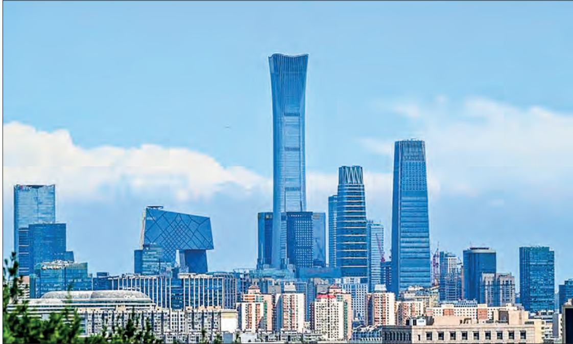
This photo taken from Jingshan Hill on 12 August 2024 shows the skyscrapers of the central business district (CBD) on a sunny day in Beijing, capital of China.

This growth is attributed to the country's focus on high-quality development, reforms, and modernization efforts.