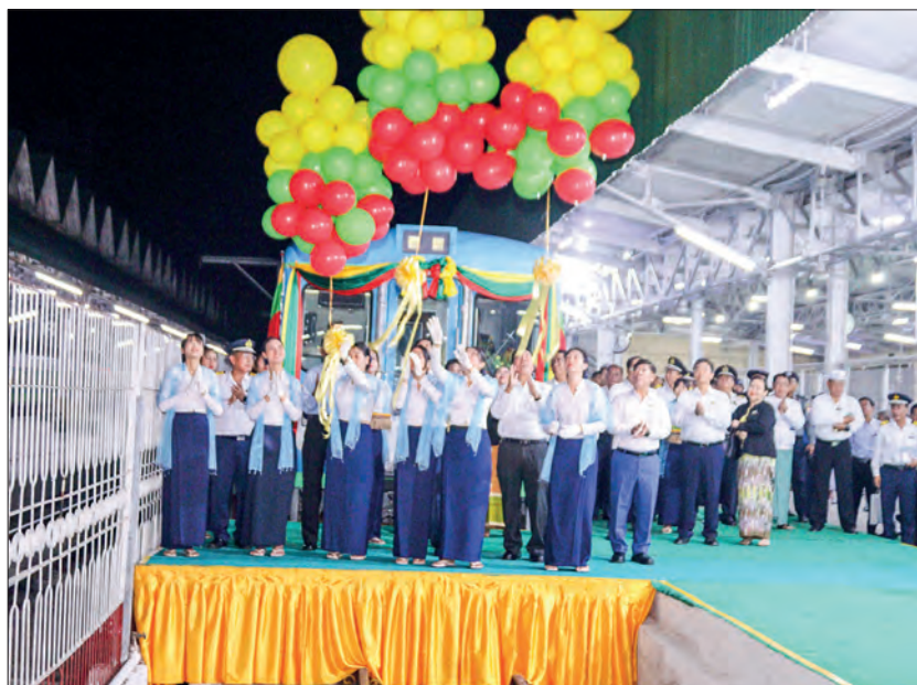
Photos capture Deputy Prime Minister and Union Transport & Communications Minister General Mya Tun Oo greeting MR personnel and passengers at Nay Pyi Taw Railway Station (left), and the inaugural express train ceremony in progress (right).

M YANMA Railways has launched new express train services to reduce travel time on the Yangon-Mandalay route from 19 to 11 hours. This expansion includes modern air-conditioned DEMU trains on the Yan-