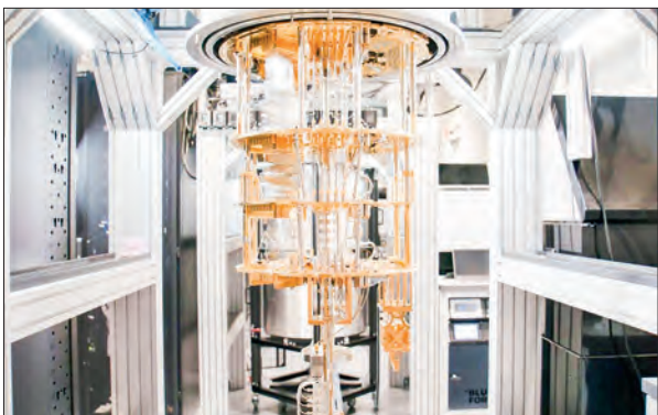
Developed by the team at the AWS Centre for Quantum Computing at the California Institute of Technology, Ocelot represents a breakthrough in the pursuit to build fault-tolerant quantum computers capable of solving problems of commercial and scientific importance that are beyond the reach of today's conventional computers.

“Today's announcement represents an important step in developing efficient means to scaling up to practical, fault-tolerant quantum computers,” the company added. — Xinhua