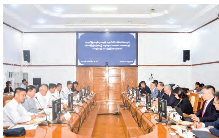
Union Minister Dr Kan Zaw and Union Minister U Tun Ohn lead a coordination meeting with CITIC Consortium Myanmar Port Investment Limited officials in Nay Pyi Taw yesterday.

Afterwards, the officials from CITIC Consortium Myanmar Port Investment Limited reported on the completion and ongoing plans, and the departmental officials discussed EIA/SIA and the Development Plan. After hearing the reports, Union Minister Dr Kan Zaw concluded the meeting. — MNA/KTZH