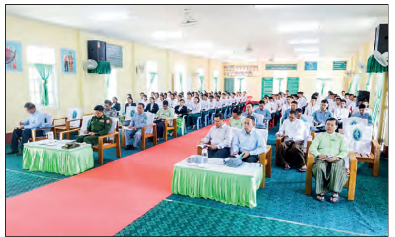
SAC Member Union Minister Lt-Gen Yar Pyae meets the principal, staff, faculty members and students from the Training School for Development of Nationalities Youth from Border Areas in Maubin Township on 26 February.

paving processes connecting the Pathein-Myaungmya-Labutta and Theinla Chaungphya villages. The process was conducted with the 2024-2025 budget. He also coordinated the reports of locals regarding the access to electricity, solar power installation in the village and basic education high school in Theinla village.