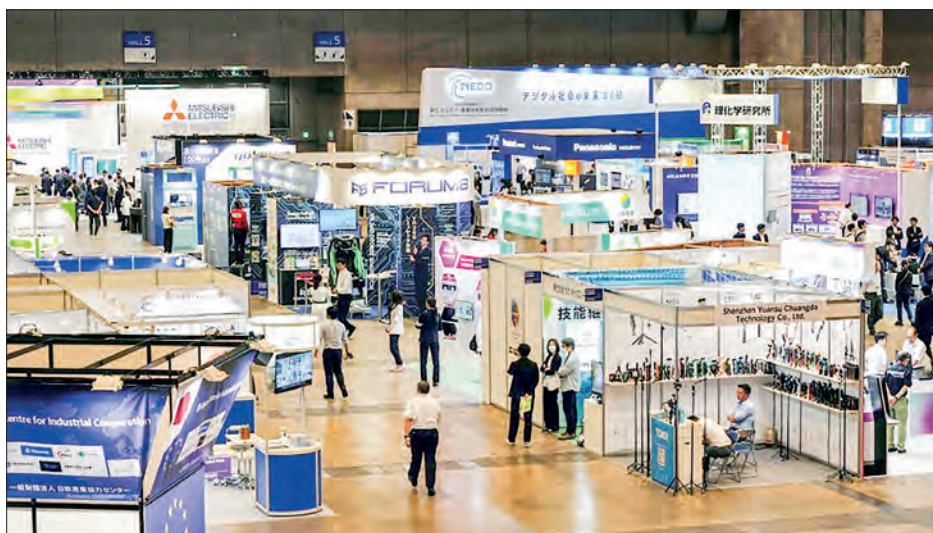
The Combined Exhibition of Advanced Technologies, Japan's major annual electronics show also known as CEATEC, opens at the Makuhari Messe convention centre in Chiba on 15 October 2024.

THE government on Friday approved a bill allowing the state to assess cases of misuse of artificial intelligence and advise firms on the issue, in what would be Japan's first legislation dedicated to the rapidly spreading technology.