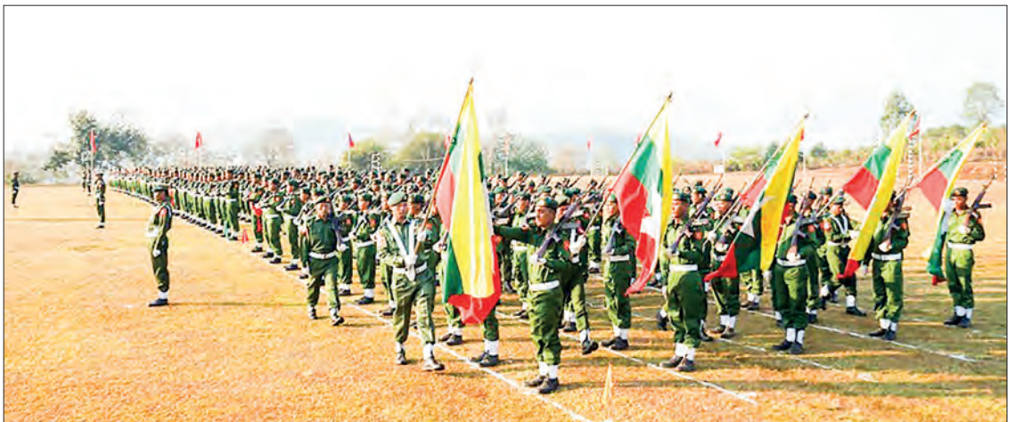
The graduation parade of the People's Military Service Training 8 in action yesterday.

The graduates received teamwork, nationalism, patriotism, team spirit and esprit de corps after the training, and they will serve duties at different regiments and units for na-