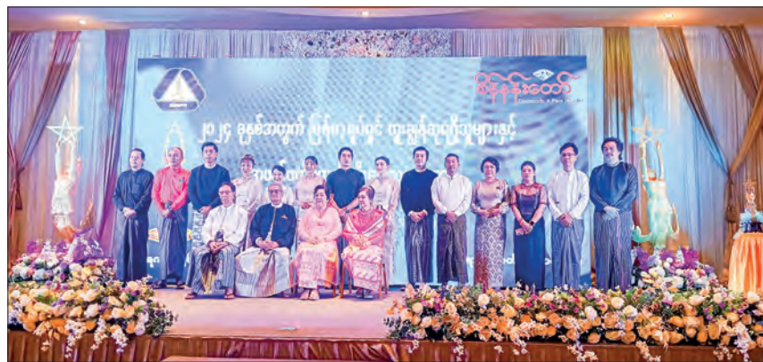
The commemorative group photo of the honourable dinner for Academy winners and organizers.

The 2024 Myanmar Academy Awards Ceremony was held on 9 February at the Myanmar International Convention Centre I in Nay Pyi Taw, and a total of 16 Academy Awards were presented.