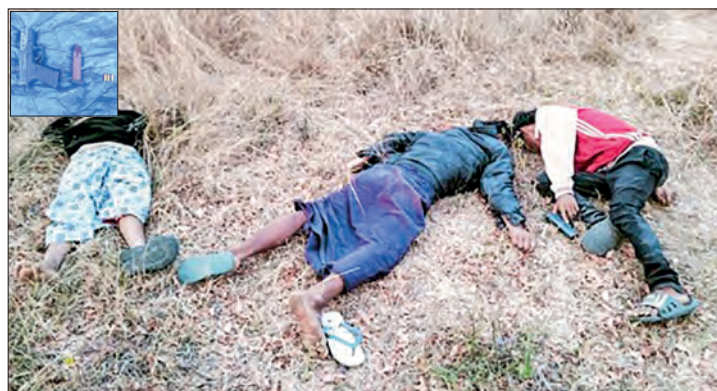
This image capture seized bodies near Pinmyo Village.

Following the clash, security forces recovered three bod-