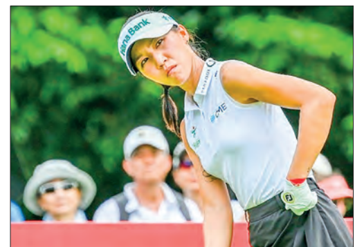
Lydia Ko of New Zealand looks on after a shot during round two of the HSBC Women's Championship.

"I'm definitely having more fun and I feel like I'm in a position where I can try new things and not veer off what was good from last year," said Ko. — AFP