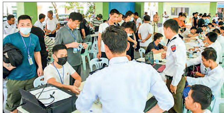
Immigration and officials processing undocumented foreign entrants.

MYANMAR, China and Thailand are collaborating through a trilateral cooperation framework to investigate and dismantle online scams and illegal online gambling operations. As part of these efforts, Myanmar authorities continue to crack down on foreign nationals involved in these illegal activities.