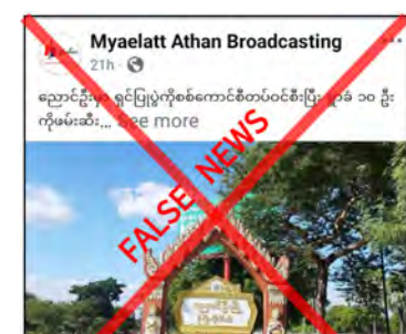
This screenshot discloses misinformation.

They intend to mislead the public about the efforts of security forces in maintaining regional stability.