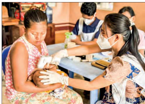
Displaced Sittway residents in Rakhine State receive free primary healthcare from a mobile clinic operated by the Myanmar Red Cross Society and the Norwegian Red Cross.

THE Myanmar Red Cross Society has opened a mobile clinic and is providing free primary healthcare to displaced households in Sittway, Rakhine State, according to the MRCS