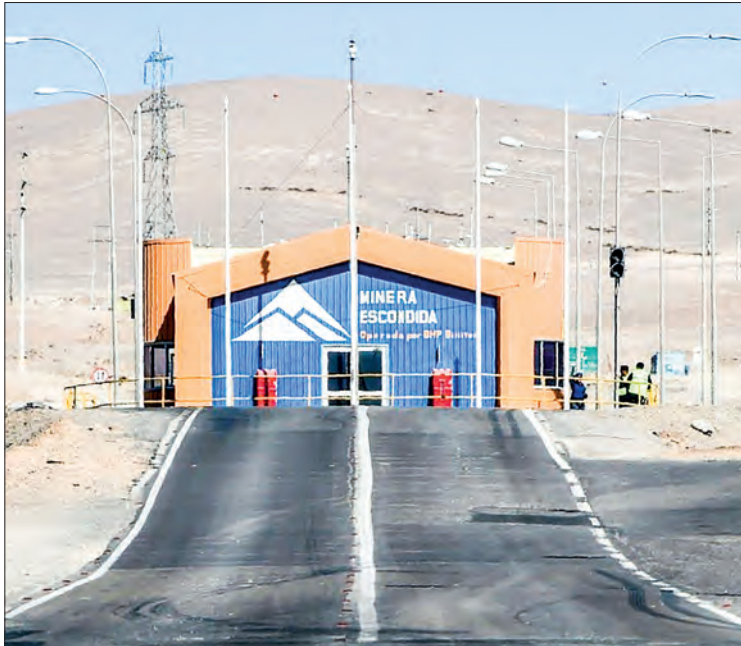
The Escondida mine in Chile is the world's biggest copper producer.

US President Donald Trump signed an order directing his commerce secretary to investigate copper imports, a probe that could lead to tariffs.