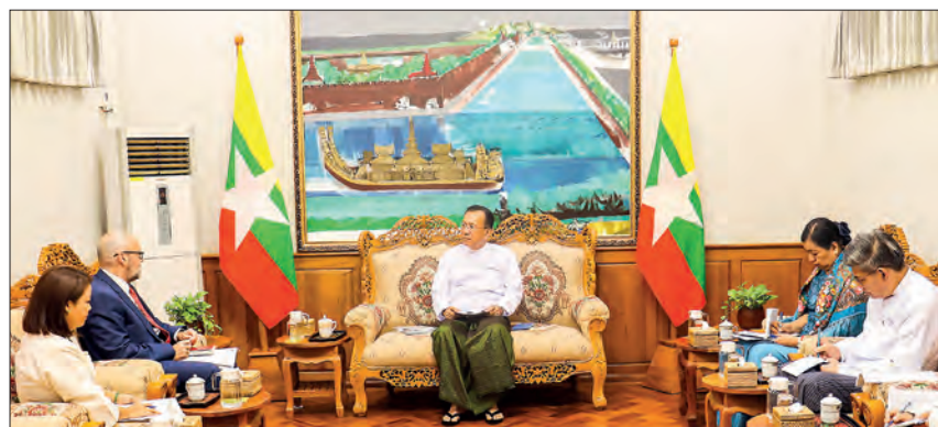
The UNFPA Representative calls on Union Minister Dr Kan Zaw.

Afterwards, the Senior General posed for a documentary photo alongside attendees and observed the MMQR payment system and the booths displayed at the event. — MNA/KTZH