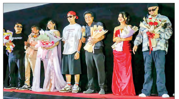
This image showcases cast members of the film ‘Littkyee Myah’.

‘Littkyee Myah’ will be released in cinemas nationwide on 28 February. The film features a star-studded cast, including Academy award-winning actors Nay Win and May Myint Mo, alongside Min Hein, Khin Hlaing, Joker, Tayza Lin Yaung, Lin Lin, Me Ko Khant, Sin Ma, Min Thu, Zaw Win Naing (Mann), Thwet Lett, and many other artistes. — ASH/MKKS