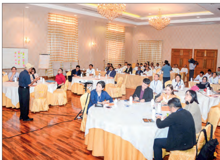
The second day of the workshop in progress yesterday.

THE second day of the "Capacity Building Workshop for Government Spokespersons on Effective Public Relations" was held yesterday at Horizon Lake View Hotel in Nay Pyi Taw.