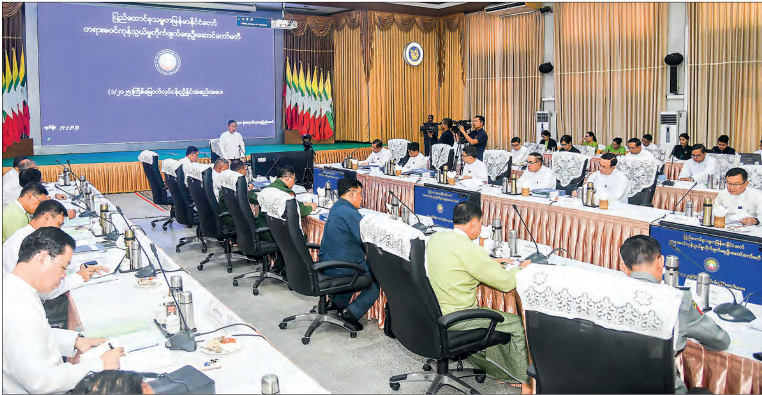
State Administration Council Vice-Chairman Deputy Prime Minister Vice-Senior General Soe Win addresses the first work coordination meeting of the Illegal Trade Eradication Steering Committee yesterday.