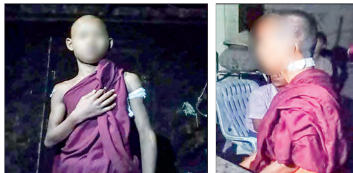
Photos reveal two injured novices (above) and the location map of drones dropping bombs (below).

peatedly targeting villages that do not support them, using tactics such as dropping bombs, launching surprise attacks and planting landmines. These acts have led to frequent casualties among innocent civilians and Buddhist monks. The brutal actions of terrorist groups have caused widespread fear among residents, prompting security forces to intensify protective measures in the affected areas. — MNA/KZL