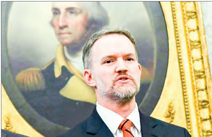
US lawmakers confirmed Jamieson Greer as President Donald Trump's trade envoy, a key figure in implementing his tariff policy.

US lawmakers voted Wednesday to confirm lawyer Jamieson Greer as Donald Trump's trade envoy, rounding out the president's top economic team with a key figure in tariff policy as the president threatens levies on friend and foe alike.