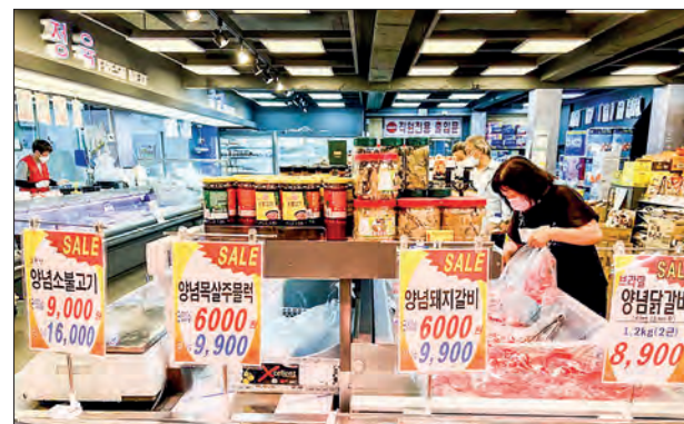
People shop at a supermarket in Seoul, South Korea, 5 June 2022.

Business income increased 5.5 per cent in the fourth quarter after edging up 0.3 per cent in the prior quarter. — Xinhua