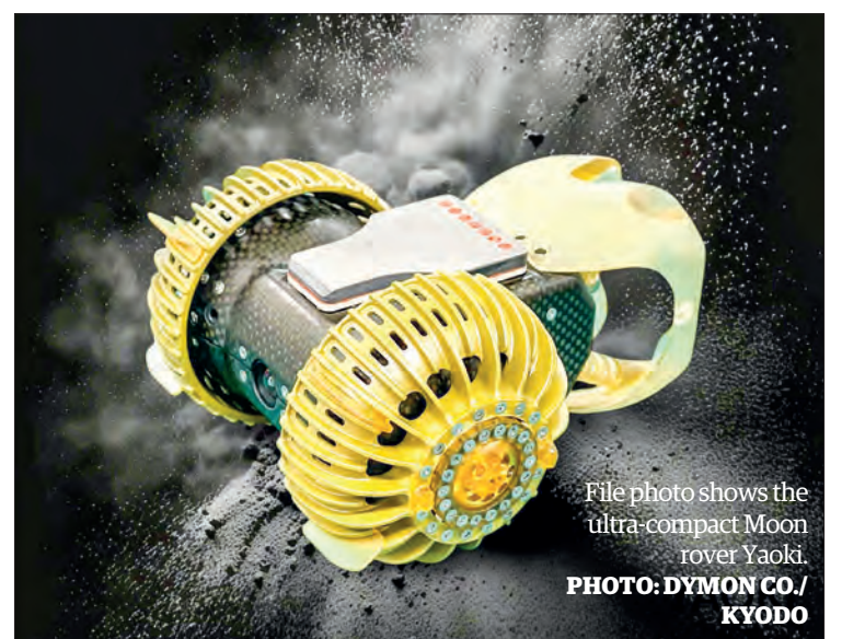
File photo shows the ultra-compact Moon rover Yaoki.

The name of the rover, which measures around 14 centimetres in length and width and eight centimetres in height, hails from the Japanese proverb "nana korobi, ya oki", which roughly translates as "fall seven times, get up eight", highlighting its ability to repeatedly return to an upright position after tipping over. — Kyodo