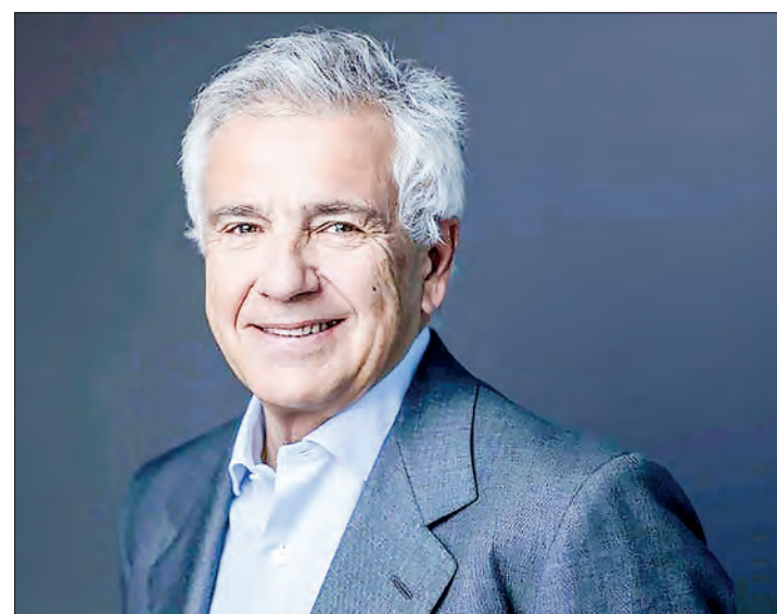
IOC presidential candidate Juan Antonio Samaranch Junior told AFP he has the experience to deal with the problems of an increasingly complex world.

If successful Samaranch Junior would make history -- his father of the same name was IOC president from 1980 to 2001 and transformed the organization into a commercial powerhouse.