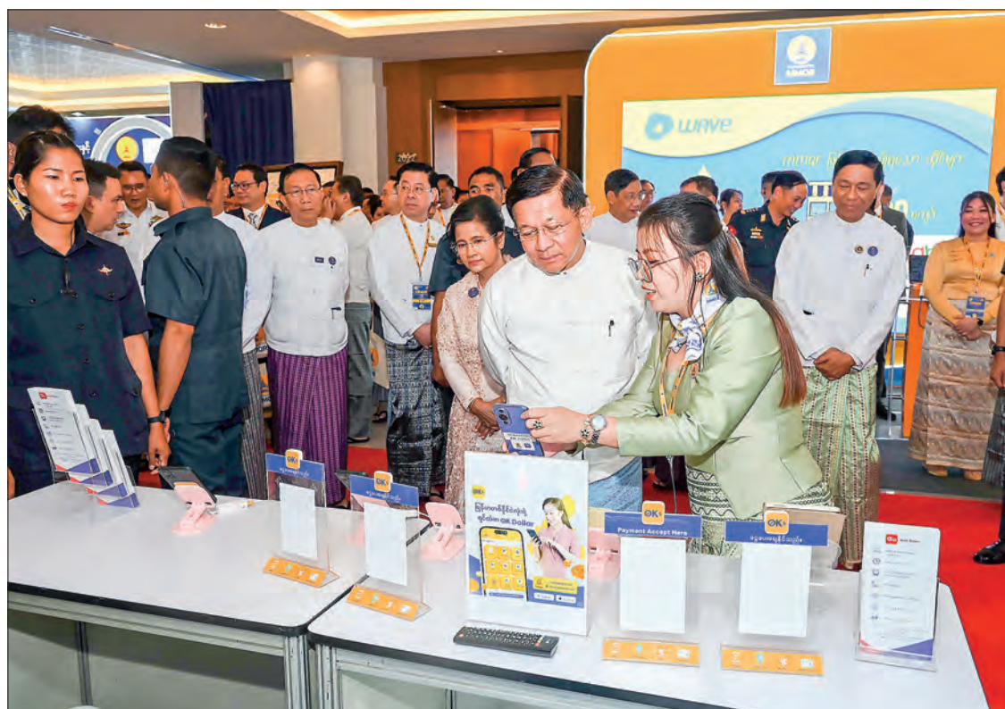
A presentation on the national QR standard MMQR digital payment system is delivered to the Senior General.

The Central Bank of Myanmar has developed a national level standard MMQR, enabling