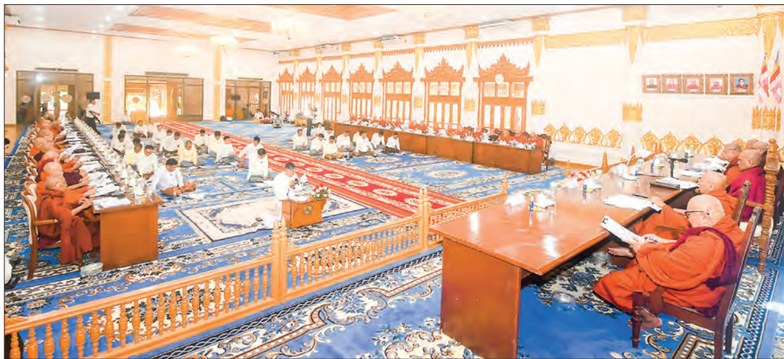
The first session of the 19 th plenary meeting of the Eighth 47-member State Sangha Maha Nayaka Committee in progress yesterday in Yangon.

Before the meeting, the Union ministers donated offertories to Sayadaws.