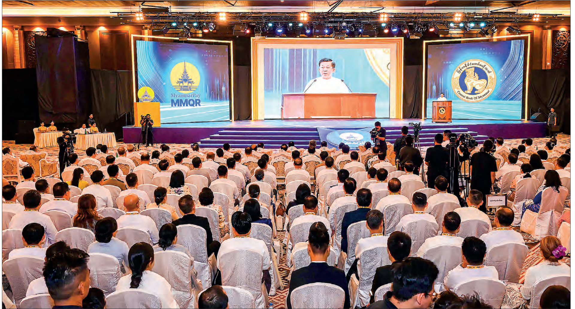
State Administration Council Chairman Prime Minister Senior General Min Aung Hlaing speaks on the inaugural occasion of the national QR standard MMQR yesterday in Nay Pyi Taw.