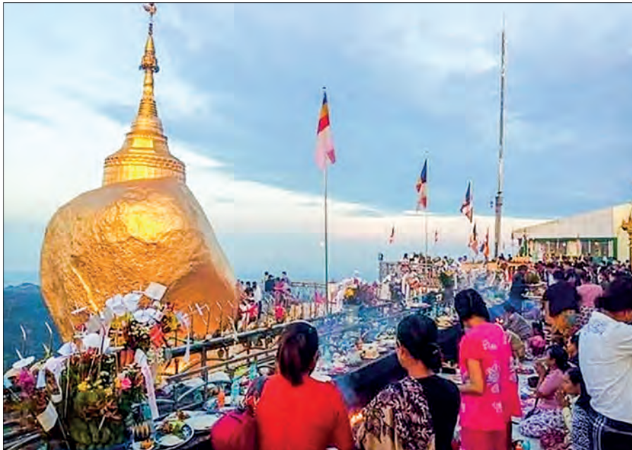
Devotees perform good deeds on the platform, set against the serene backdrop of Kyaiktiyo Pagoda.

Since November 2024, pilgrims from across the country have been