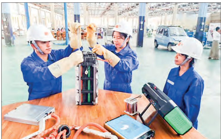
Trainees in the practical session.

Those enthusiastic can enrol in the training by 4 March, providing a citizenship scrutiny card copy, a health certificate by the Township Public Health Department, copies of education certificates, a household registration copy, a criminal clearance certificate and three licence-sized colour photos. The training is limited to 25 trainees. Individuals can enquire about details through the contact number of the Department of Technical and Vocational Education and Training at 09 443973606. — NN/KK