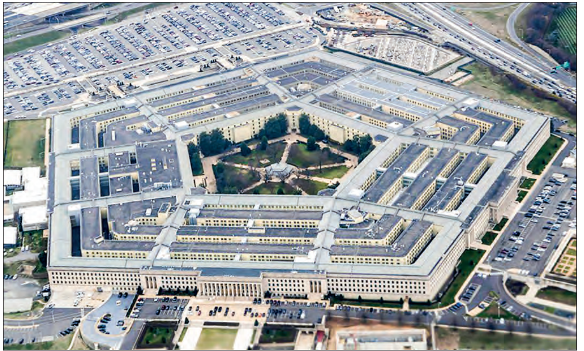
Photo taken on 19 February 2020 shows the Pentagon seen from an airplane over Washington DC, the United States.

His statement was in response to US President Donald Trump's recent remarks that he plans to have nuclear arms control talks with China and Russia, as well as his proposal to cut the three countries' defense budgets by half. Wu reiterated that China commits itself to a policy of no first use of nuclear weapons, pursues a nuclear strategy of self-defence, and keeps its nuclear strength at the minimum level required for national security. — Xinhua