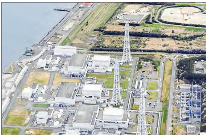
File photo taken on 13 April 2021 shows Tokyo Electric Power Company Holdings Inc's Kashiwazaki-Kariwa nuclear power plant in Niigata Prefecture.

The seven-reactor facility is one of the world's largest nuclear power plants capable of generating a total of 8.212 million kilowatts of electricity. It served as an important energy source to supply electricity to the Tokyo metropolitan area before the 2011 massive earthquake and nuclear disaster in northeastern Japan. — Kyodo