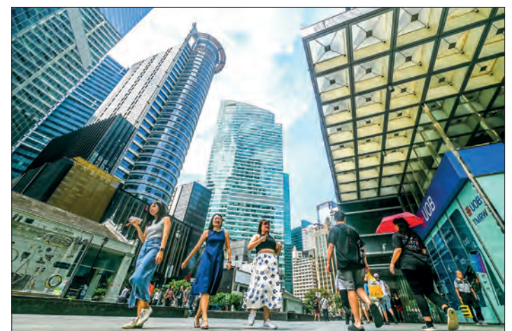
People walk out for a lunch break in the Raffles Place financial business district in Singapore on 13 August 2024.

In addition, the health and social services sector posted a 10.1 per cent increase in receipts, mainly attributed to a rise in medical revenue, the report said. — Xinhua