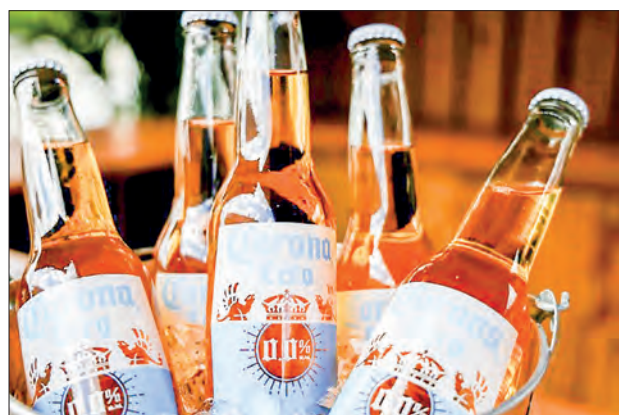
The Belgian-Brazilian firm posted a net profit of $1.77 billion for the year, up by six percent from 2023.

"While our overall volume performance this year was constrained by the soft consumer environments in China and Argentina, the global beer category remains vibrant with our volumes growing in the majority of our markets and by 0.9 per cent overall when excluding these two countries," the company said in a statement. — AFP