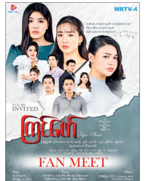
Actors from the ‘Kyinphaw’ drama series are featured on an advertisement poster.