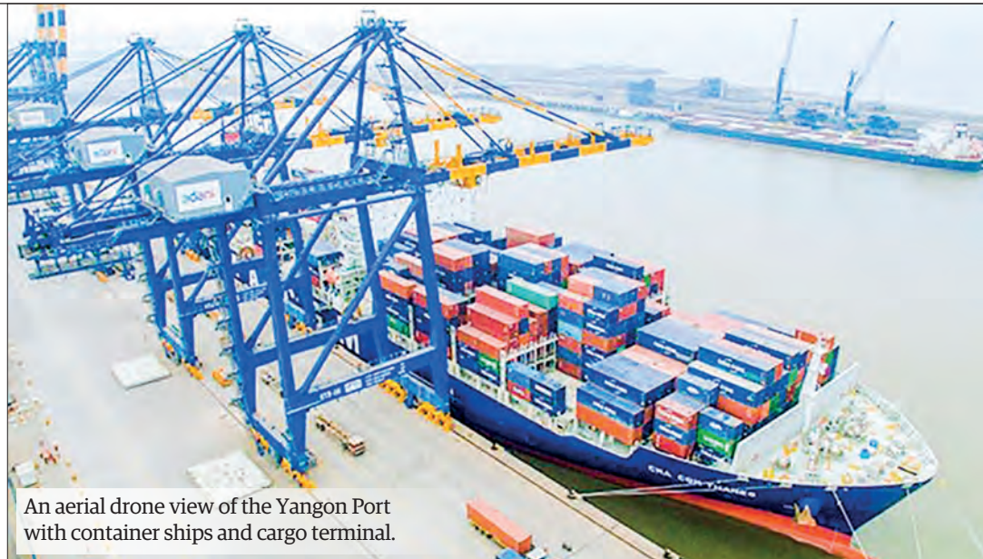
An aerial drone view of the Yangon Port with container ships and cargo terminal.