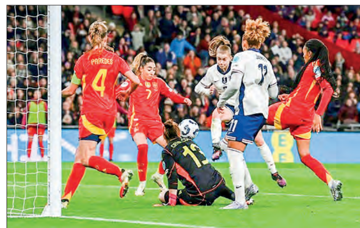
England's Jess Park scores against Spain in the Women's Nations League.

the Luis Rubiales case. Former Spanish football federation boss Rubiales was recently found guilty of sexual assault after kissing Spain star Jenni Hermoso on the lips without her consent during the World Cup medal ceremony. — AFP