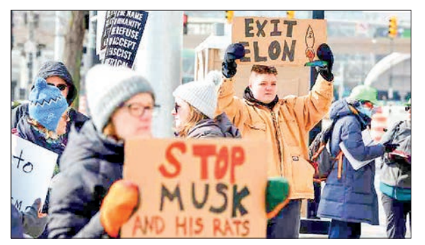
People hold signs during a protest against the administration of US President Donald Trump in Detroit, Michigan, on 22 February 2025.

(DOGE) works towards gutting federal staffing and spending. DOGE is a wide-ranging entity run by the tech entrepreneur and world's richest person, though its cost-cutting campaign has faced increasing resistance on multiple fronts, including court rulings and some pressure from lawmakers. — AFP