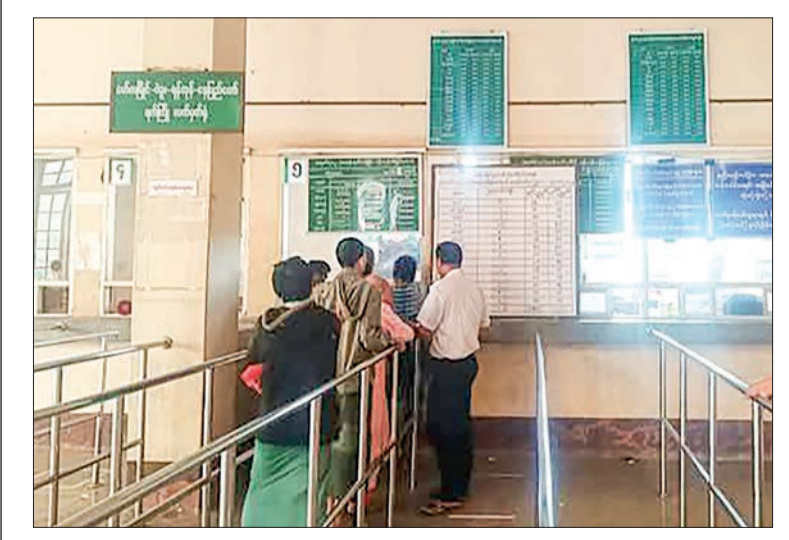
This photo reveals passengers purchasing tickets at Mawlamyine Railway Station.

Tickets for ordinary class are sold a day in advance, two tickets per purchase and upper-class tickets are sold three days in advance, two tickets per purchase, from 7 am to 3 pm daily, and an original CSC is essentially required. — MT/ZS