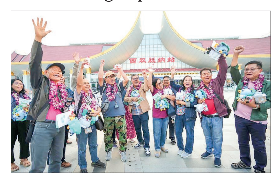
Tourists from a tour group, the first one from the Association of Southeast Asian Nations (ASEAN) member states since China introduced its new visa relaxation policy, pose for photos in front of the Xishuangbanna railway station in Jinghong city, Xishuangbanna Dai autonomous prefecture, Southwest China's Yunnan province, 18 February 2025.

ON Friday, a group of 15 tour- uangbanna, a popular tourist from the Institute of Geographists from Thailand and Laos destination in Yunnan province, wrapped up their four-day trip to Southwest China's Xishuangbanna Dai autonomous prefecture, boarding the China-Laos Railway for their return journey.