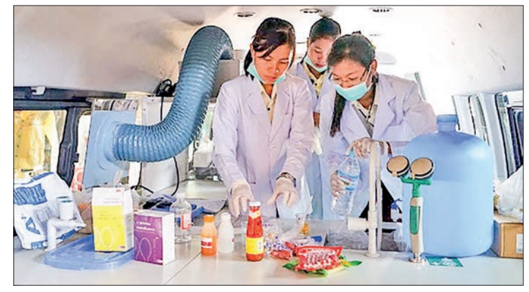
Laboratory testing of food products is in progress.

As of the third week of February in the current 2024-25 financial year, a total of 818 laboratory tests have already been conducted, consisting of 383 chemical tests and 435 microbiological tests. — ASH/KZL