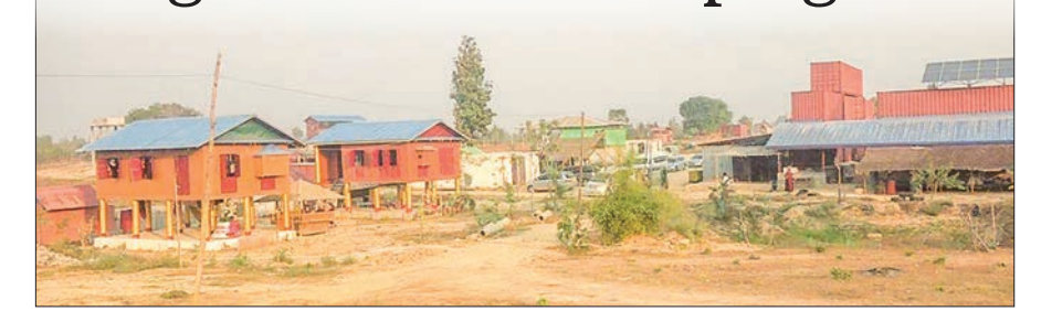
This photo showcases a Buddha Garden and a volunteer relief village being built near milepost 203 on the Yangon-Mandalay Expressway.

ACCORDING to the abbot of the Thabawa meditation centre Ashin Uttamasara, a volunteer relief village and a Buddha Garden are being built at the center near milepost 203 on the Yangon-Mandalay Expressway.