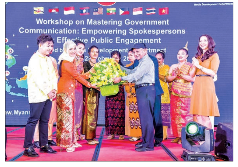
The workshop trainer present a bouquet to MRTV performers.