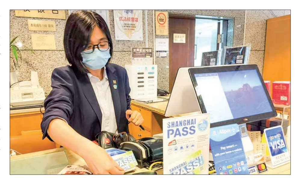
A clerk processes a payment with a shopper's Shanghai Pass multipurpose prepaid travel card at the gift shop of Shanghai Museum in east China's Shanghai Municipality on 22 May 2024.

Technology and investment will play an even