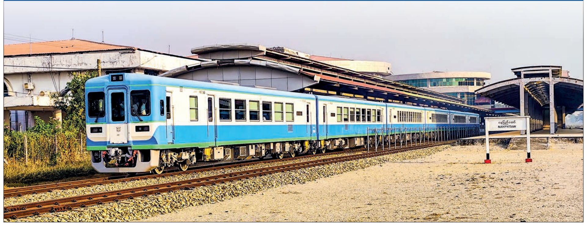
DEMU trains at Nay Pyi Taw Railway Station, ready to serve passengers on the Yangon-Nay Pyi Taw-Mandalay route.