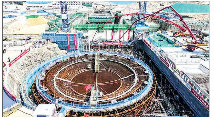
A total of six reactors have been planned for the project.

na's Guangdong Province began on Monday, according to China General