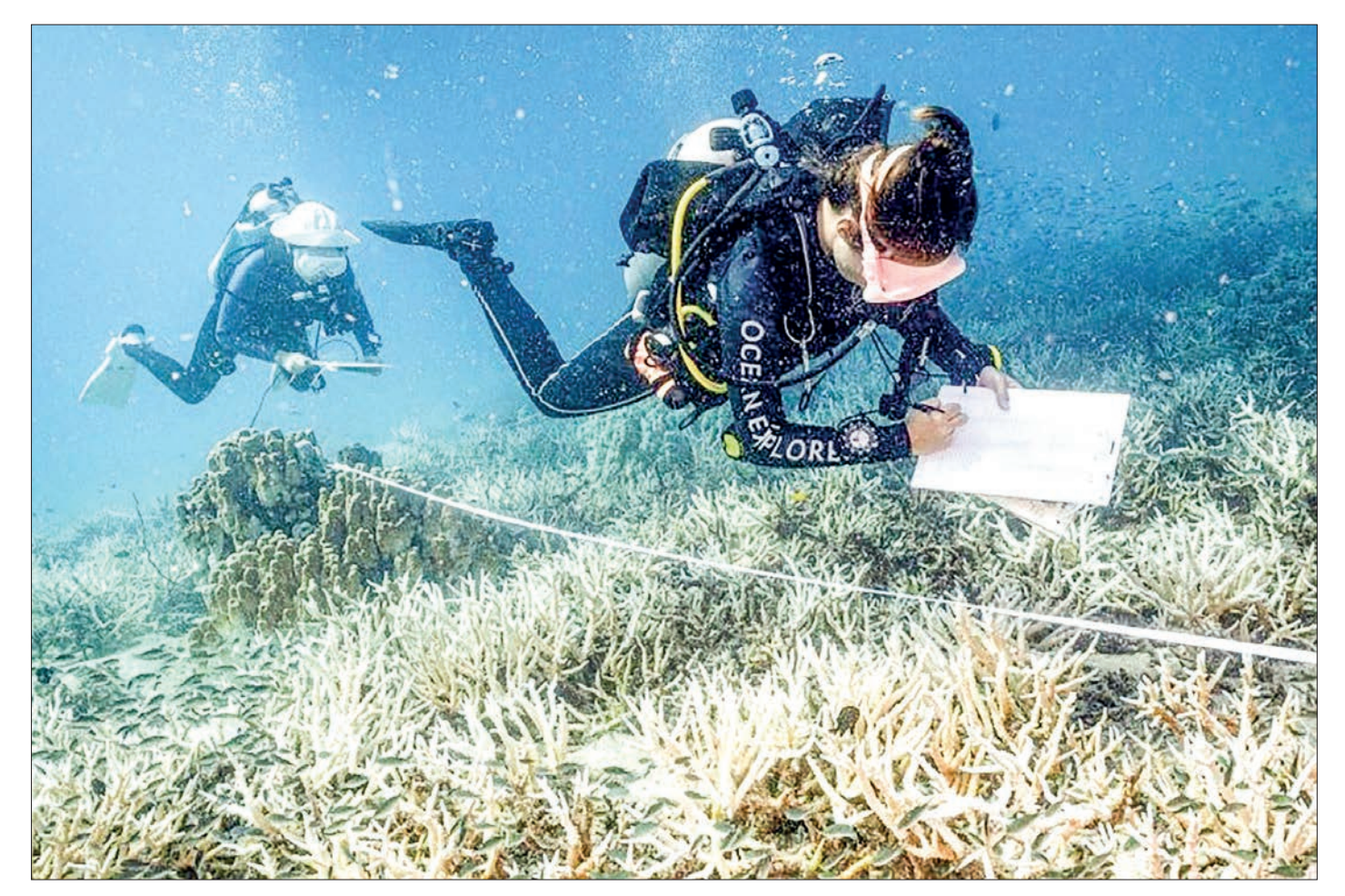
Discussions in Rome will focus on resource mobilization, the financial mechanism, the monitoring framework, and planning, monitoring, reporting, and review mechanisms.

The conference leader warns that global polarization is hindering efforts to protect the planet and address biodiversity loss.