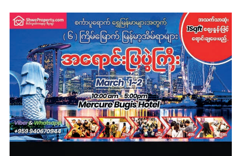
This image showcases a poster for the Myanmar Property Expo in Singapore.

The museum is open free for the public from 9:30 am to 4:30 pm daily except Mondays and public holidays. — Naung Naung (Beikthano Myay)/ KTZH