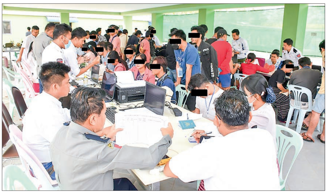
Immigration and officials processing the detained undocumented migrants.

From 30 January to 25 February 2025, the government arrested 2,538 foreigners who illegally entered the country, and 673 of them were transferred to their respective countries via Thailand, and the remaining 1,865 are also ready to be transferred.