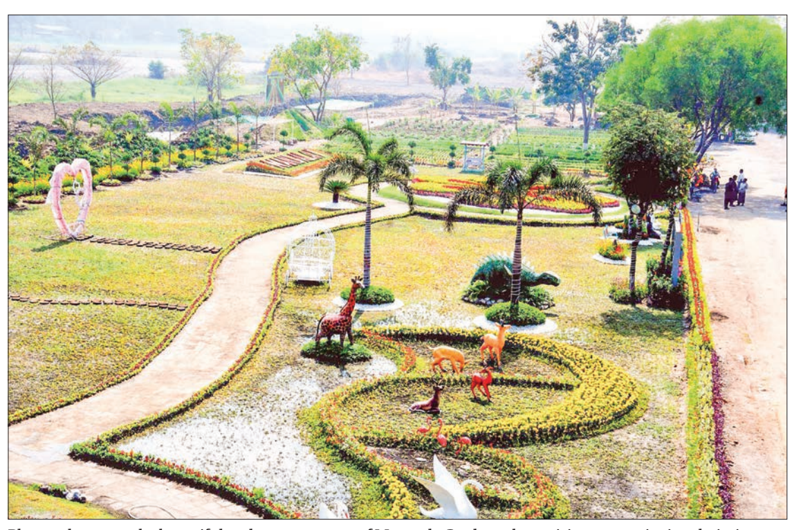
Photos showcase the beautiful and serene scenes of Myamala Garden, where visitors are enjoying their time.

spans around 680 square feet in length and 110 square feet in width. It includes several flower beds, including a 60-foot-wide flower circle, a 40-foot-wide flower circle, and a 30-footwide flower circle, featuring a variety of colourful flowers. The garden also offers seating areas for visitors and plans to improve access roads in and out of the garden.