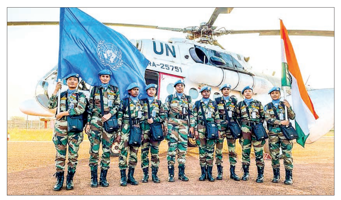
A contingent of Indian women peacekeepers, the country's largest single unit of female troops in a UN mission since 2007, arrives in Abyei to begin its deployment with the United Nations Interim Security Force.