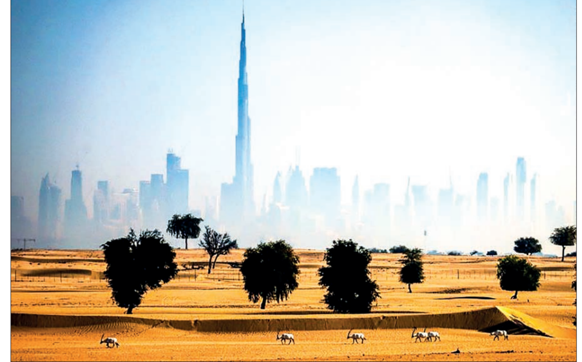
The UAE's population is concentrated in the coastal cities of Dubai, Abu Dhabi and Sharjah.

The three-year project, funded with $1.5 million from the UAE's rain enhancement programme, feeds satellite, radar and weather data into an algorithm that predicts where seedable clouds will form in the next the current method where images.