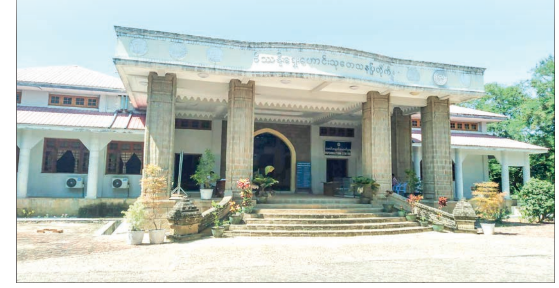
The facade view of the Beikthano Archaeological Museum.

THE Beikthano Archaeological Museum in the ancient Beikthano cultural zone, a UNES-CO World Heritage-listed site, about 12 miles from west of Taungdwingyi township of Magway Region was constructed on 12 July 2004. The construction was completed on 30 November 2007, and the museum was opened to the public on 1 September 2008.