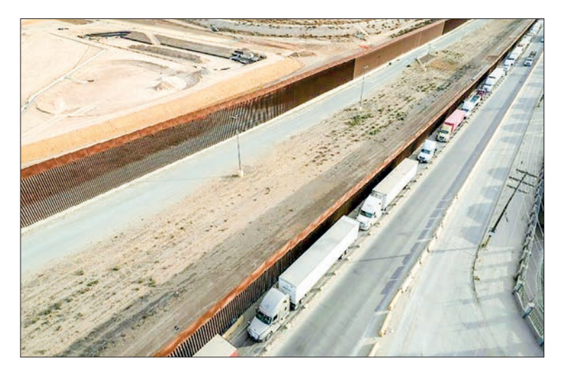
Mexico faces mounting pressure from Washington to do more to curb illegal flows of migrants and drugs, particularly fentanyl.

In an apparent bid to ease those concerns, Sheinbaum recently presented a plan to replace Chinese imports with domestically produced goods. - AFP