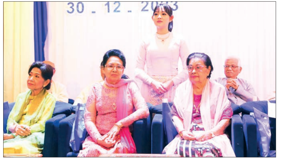
The 13 th annual tribute event by the Myanmar Music Association underway last year.