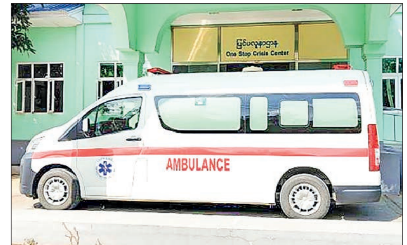
Emergency Ambulance Transport System.

of ambulance crews. The Emergency Ambulance Transport System will operate in the townships of Nay Pyi Taw. In the event of a road traffic accident, individuals can call the emergency number "192" to request an ambulance.