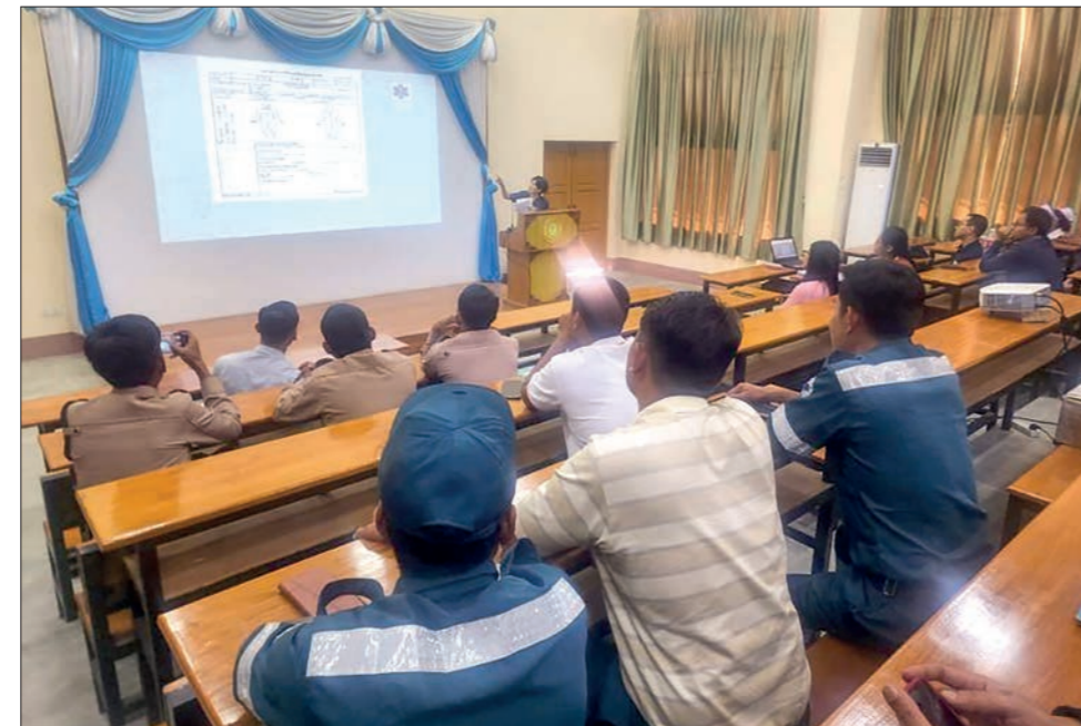
EMS Training at Nay Pyi Taw General Hospital (1,000-Bedded).

In the opening ceremony, the Union Minister highlighted that, according to the Global Status Report Safety (2023) published by the World Health Organization (WHO), road traffic accidents led to the highest number of fatalities in Southeast Asia in 2021, with the majority of deaths occurring among young people aged 5 to 29. It was emphasized that road traffic accidents are one of the leading causes of morbidity and mortality. To prevent such fatalities, adherence to vehicle regulations, road rules, and