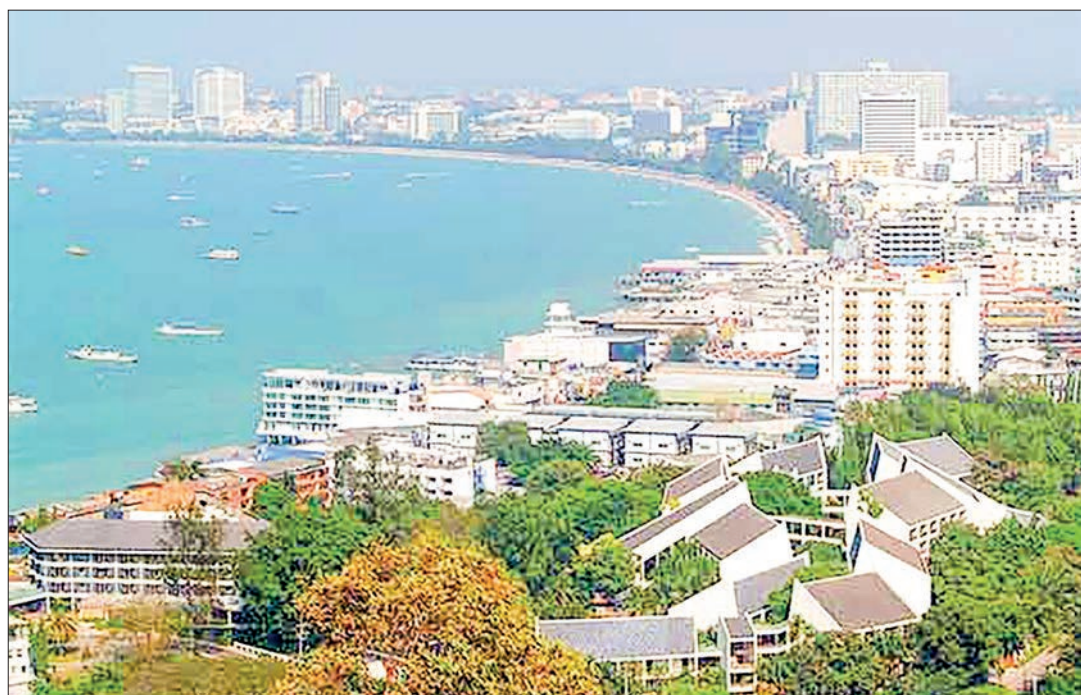
Pattaya is attracting increasing Indian property investment due to its proximity, direct flight connectivity, and affordable real estate. PHOTO: ANI

Popular areas like Pratumnak Hill and Jomtien Beach offer diverse property options. While foreigners can't own land directly, condominium freehold, leasehold villas, and company ownership provide legal investment paths. — ANI