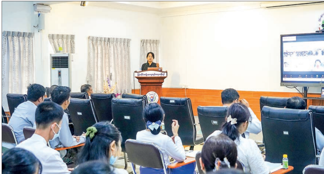
The Legal Awareness Dissemination Seminar underway yesterday.