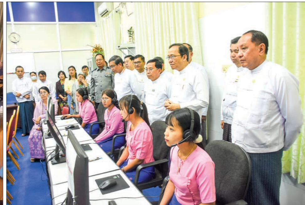
Union Minister and Chairperson of the Nay Pyi Taw Council observing the Operating EMS System at Nay Pyi Taw General Hospital (1,000-Bedded).

Furthermore, the Union Minister and the Chairperson of Nay Pyi Taw Council, along with other responsible individuals, visited the "EMS 192 Command and Control Center" located at Nay Pyi Taw General Hospital (1,000-Bedded). They observed the operations, including patient transport services, ambulance readiness, and the coordination