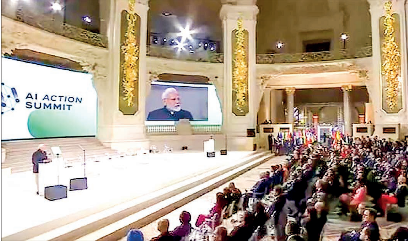
Prime Minister Shri Narendra Modi delivered the opening address at the AI Action Summit in Paris on 11 February 2025, outlining India's vision for responsible AI development.