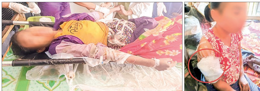
Pictures capture civilian victims being injured in the PDF terrorists' attack.

PDF terrorists committed an unprovoked attack on local farmers near Khuntowngyi Village in Shwebo Township, Sagaing Region, on the morning of 24 February. Armed with small weapons, terrorists fired at civilians engaged in agricultural work, injuring three women.