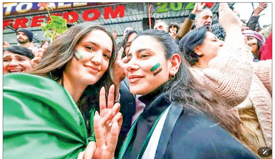
The Druze community in southern Syria constitutes about 3 to 4 per cent of the population, primarily residing in the Jabal al-Druze region.

"This picture says it all, and I ask that you engrave it on the tablet of your hearts so that we always remember what we are fighting for and who we are fighting against," Netanyahu said.