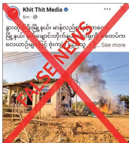
This screenshot discloses misinformation.

in the area for terrorist activities. As a result of the operation, terrorists were injured. However, subversive media outlets deliberately fabricated stories to mislead the public with false claims and propaganda. — MNA/KZL