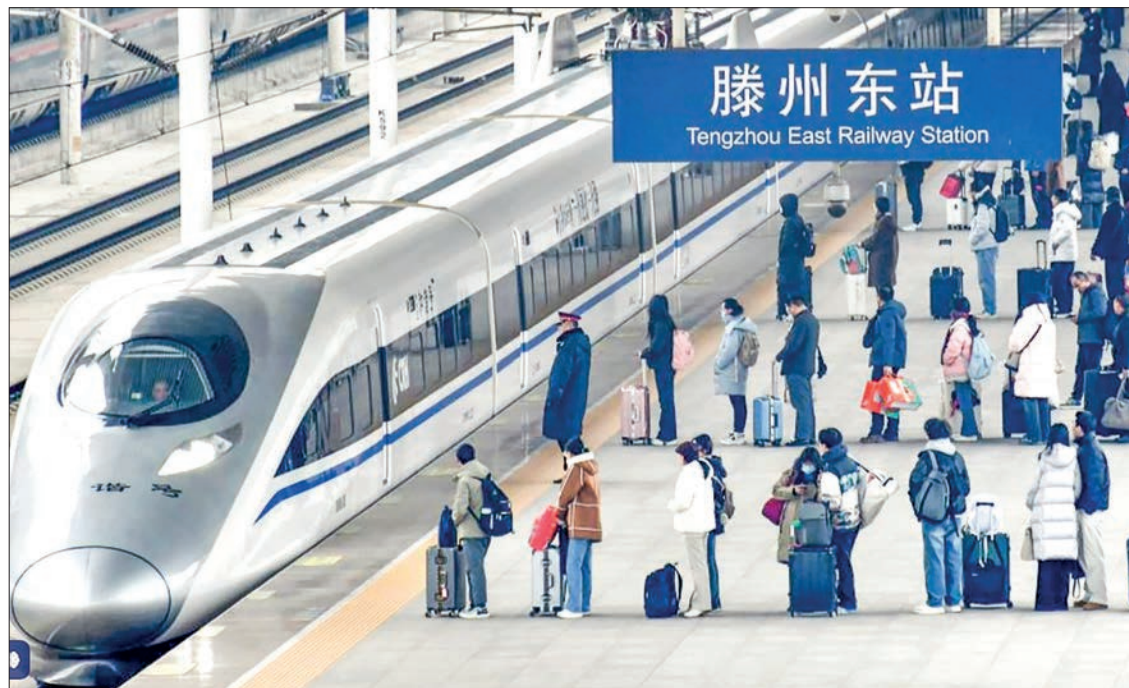
The total number of inter-regional passenger trips during the 40-day Spring Festival travel rush reached 9.02 billion.

ation Administration of China, the country's civil aviation sector