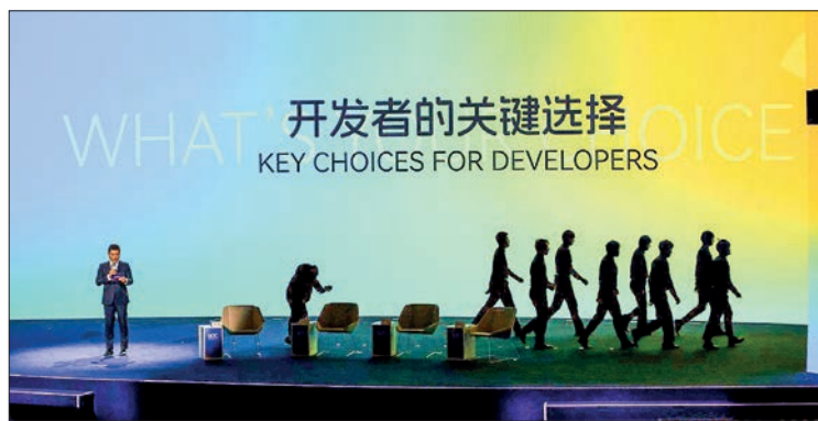
The 2025 Global Developer Conference is an AI event for developers to communicate, collaborate and innovate.