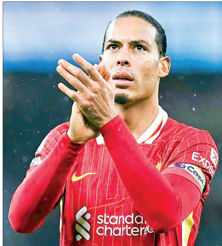
Liverpool captain Virgil van Dijk celebrates victory against Manchester City. PHOTO: AFP

Liverpool fans chanted "We're going to win the league" in the closing stages of the match, looking forward to celebrating just their second English league title since 1990.— AFP