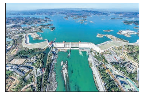
An aerial drone photo taken on 30 November 2024 shows a view of the Danjiangkou Dam in central China's Hubei Province.

The impact has been particularly pronounced in Beijing, where diverted water now accounts for nearly 80 per cent of the capital's urban water supply. A large proportion of Beijing's drinking water now travels over 1,000 kilometres along the project's middle route from Danjiangkou Reservoir in central China's Hubei Province. The water flows north via canals and pipelines, crossing beneath the Yellow River before arriving at Beijing's water treatment plants. In Tianjin, the project's reach has expanded to 15 of the city's 16 administrative districts, with infrastructure improvements extending water access to rural areas through various rural drinking water improvement initiatives. — Xinhua