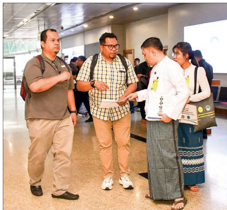
ASEAN delegates arrive at the airport.

effective engagement between media and the government, distributing keynote speeches, and exchanging skills and knowledge to solve the crisis in addition to building trust between the government and the public.