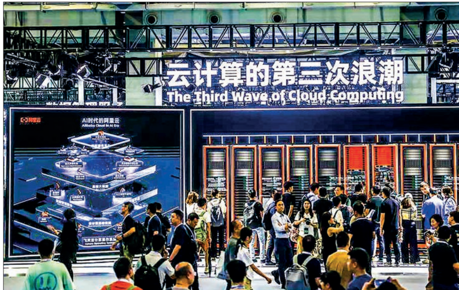
Visitors learn about cloud computing products and their application at APSARA Conference 2024 in Hangzhou, east China's Zhejiang Province, 19 September 2024.

ALIBABA Group announced on Monday that it will invest more than 380 billion yuan (about US$ 53 billion) in building