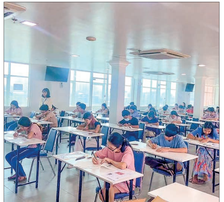
This photo shows candidates sitting for the TOPJ Japanese Language Proficiency Test in 2024.