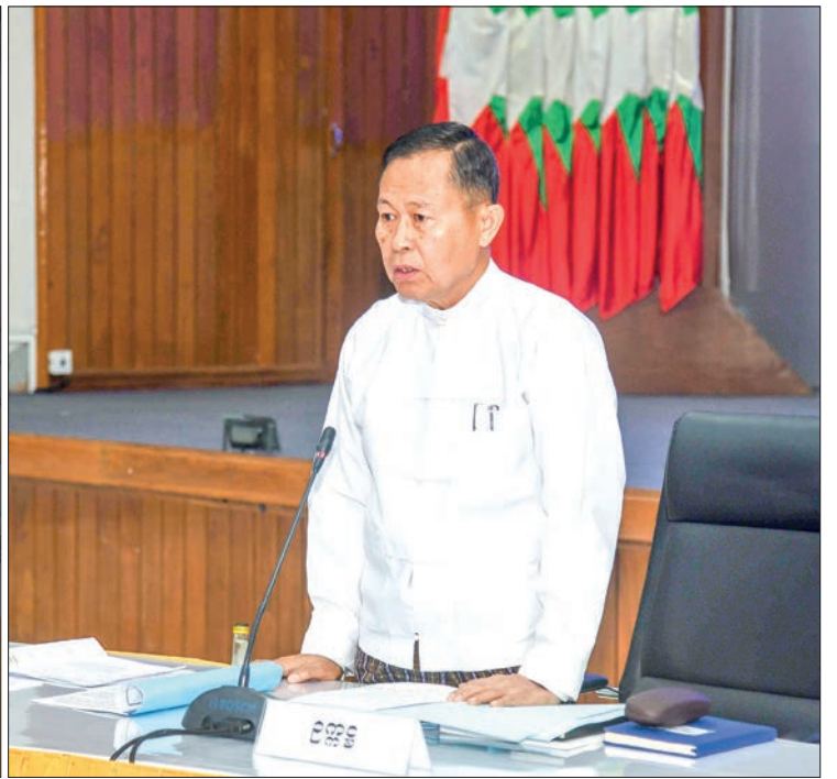
State Administration Council Vice-Chairman Deputy Prime Minister Vice-Senior General Soe Win addresses the eighth meeting of the National Committee on Social Protection.

The National Committee on Social Protection held its eighth meeting in Nay Pyi Taw yesterday.