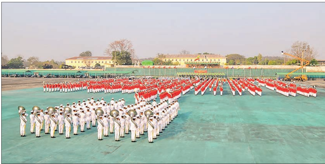
The images above and below capture the award ceremony for the 31 st Tatmadaw Military Band Competition, hailing the 80 th Anniversary of Armed Forces Day.