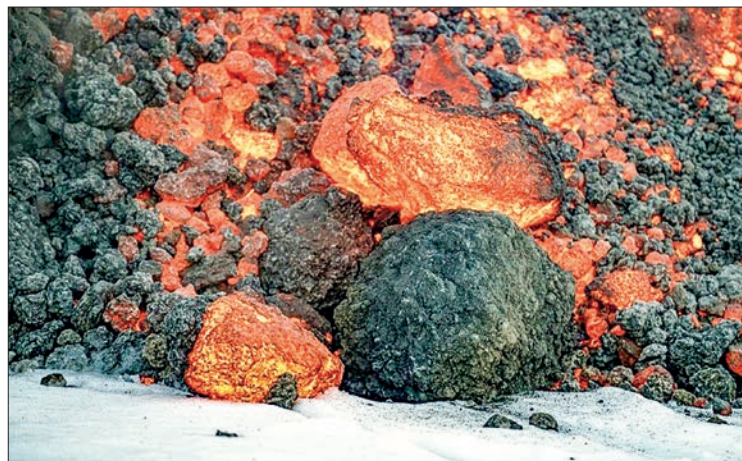
Seeping lava and gleaming white snow has proven irresistible to tourists at Mt Etna.

"It was a really small, insignificant eruption," Branca told AFP. — AFP