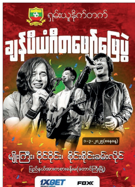
This image shows an advert for the Champion Music Concert.

On the day of the concert, Shan United and Hanthawady United will play their final match of the season, one of the last three fixtures for both teams. Shan United has won the Myanmar National League Championship for the fifth consecutive season without a single loss, making them one of the most dominant teams in the league's history. — ASH/KNN