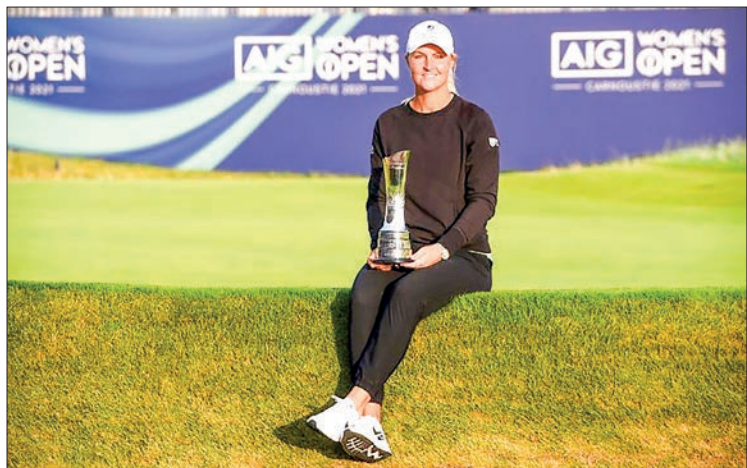
Sweden's triple major winner Anna Nordqvist will captain the European team as they bid to regain the Solheim Cup off the USA in 2026.

SWEDEN'S three-time major winner Anna Nordqvist will be Europe's Solheim Cup captain as they bid to regain the trophy in next year's edition, it was announced on Monday.