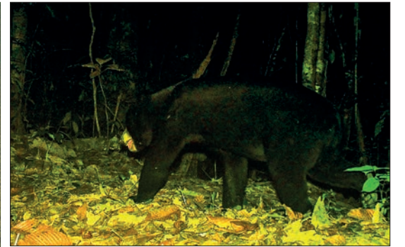
Camera trap footage captures wardens installing devices (left), a Bengal tiger, and a bear in the Htamathi Wildlife Sanctuary.