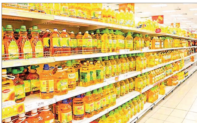
Cooking oil bottles arranged for sale in the supermarket.

gether with the Myanmar Oil Dealers’ Association and the cooking oil importing companies to offer affordable rates of imported palm oil for consumers.