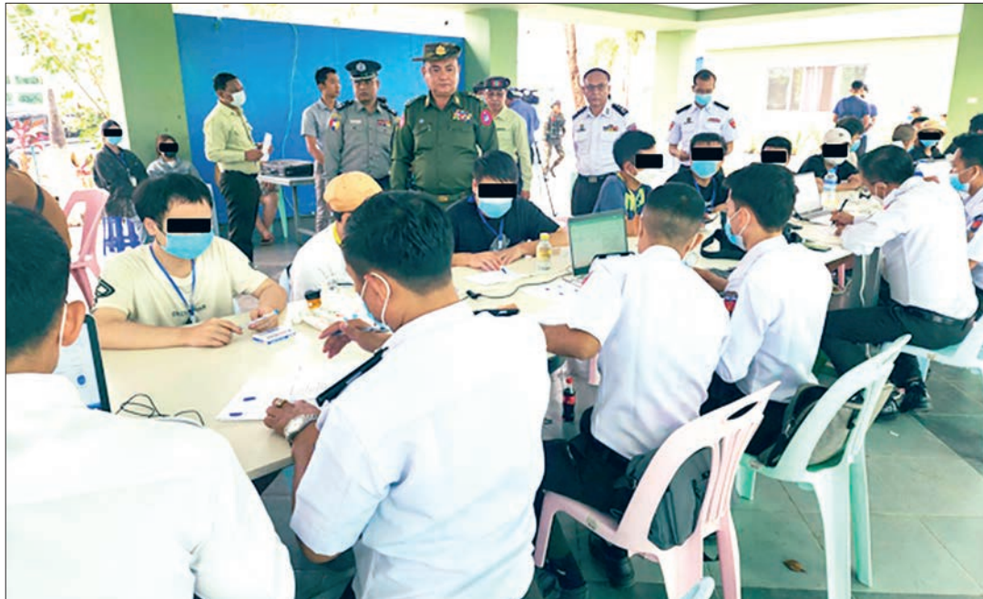
Immigration and officials processing detained foreign illegal immigrants.

THE Myanmar government continues its crackdown on illegal activities in border areas, including unlawful online gambling and telecom fraud. Authorities detained 150 more foreign illegal entrants yesterday in the Myawady, Shwe Kokko and KK Park areas, who had entered Myanmar through unauthorized routes. Officials are collecting