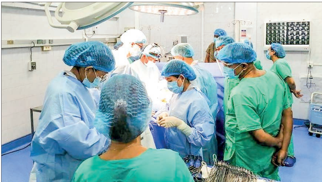
The 83 rd kidney transplant operation in progress on 20 February 2025.

THE 83 rd kidney transplant was successfully performed at the Mandalay General Hospital on 20 February.