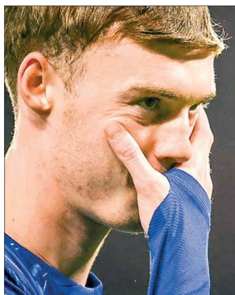
Cole Palmer has scored 14 Premier League goals this season.

ENZO Maresca has challenged his misfiring Chelsea squad to step up during a lean spell for Cole Palmer, admitting "we rely on Cole for everything".