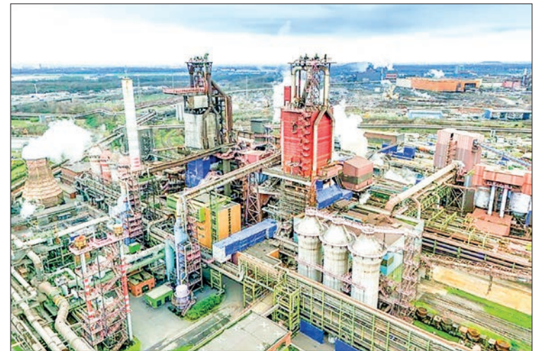
The blast furnace of German industrial conglomerate Thyssenkrupp Steel Europe AG in Duisburg, western Germany.

GERMAN business leaders called Monday for the swift formation of a new ruling coalition to usher in a “new beginning” for Europe's crisis-racked top economy after the conservatives' election win.