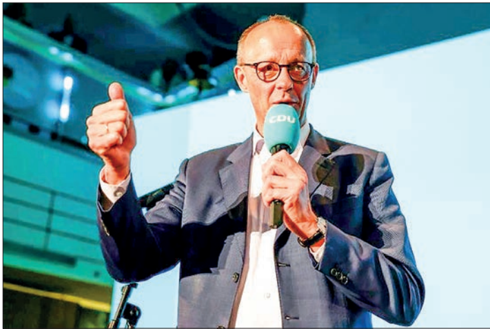
Friedrich Merz, leader of Germany's conservative Christian Democratic Union, is set to be the next chancellor.

Germany is currently facing a complex political landscape as Friedrich Merz navigates coalition talks following a recent election.