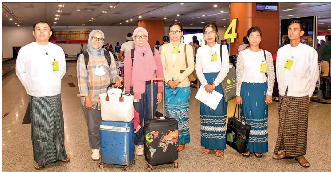
This photo showcases ASEAN delegates being welcomed at the Yangon International Airport.

The workshop is held as a project of the ASEAN subcommittee on culture with the ASEAN Cultural Fund aiming at mastering government communication empowering spokespersons for