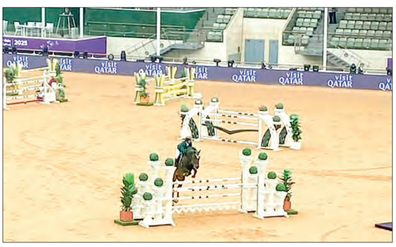
Image reveals scenes from the 36-nation equestrian show jumping competition held in Qatar.

The Myanmar Equestrian Federation is currently preparing for the XXXIII Southeast Asian