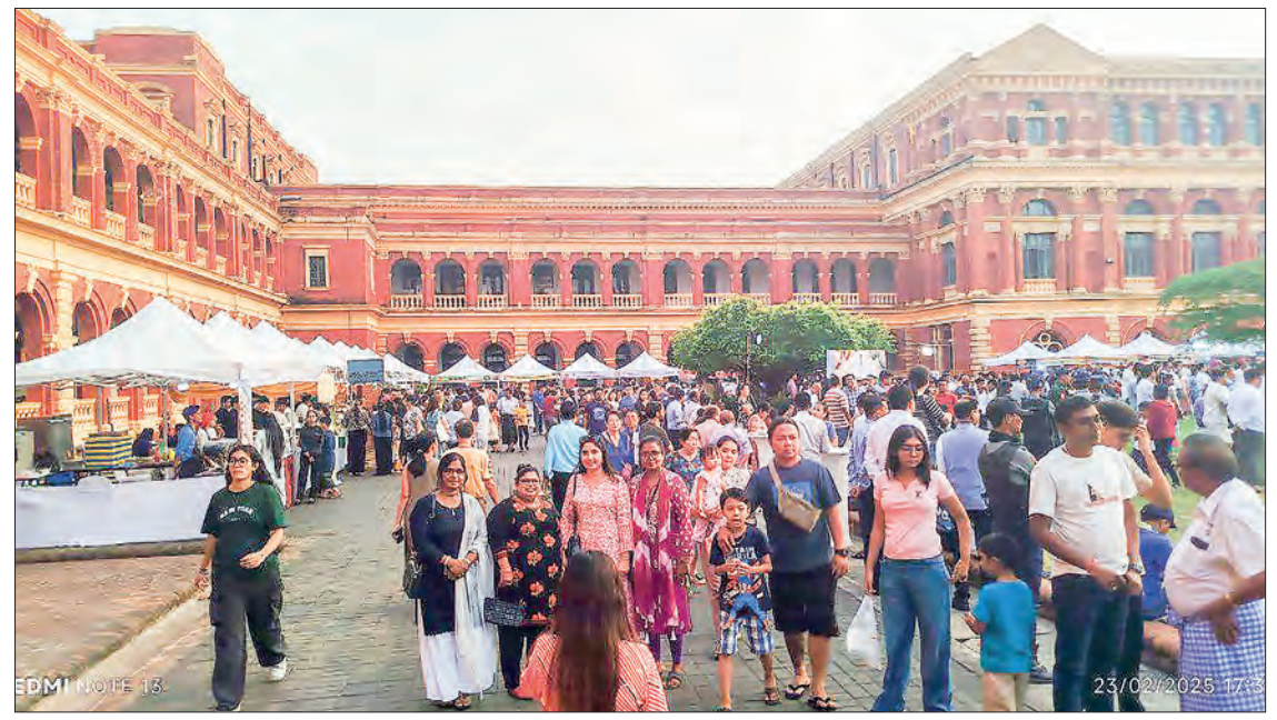
Dynamic scenes from the Mekong-Ganga Food Festival at the Secretariat Yangon on Theinbyu Road

The Union minister stated in his speech that today's event would provide an opportunity to enhance the friendship between the two countries by