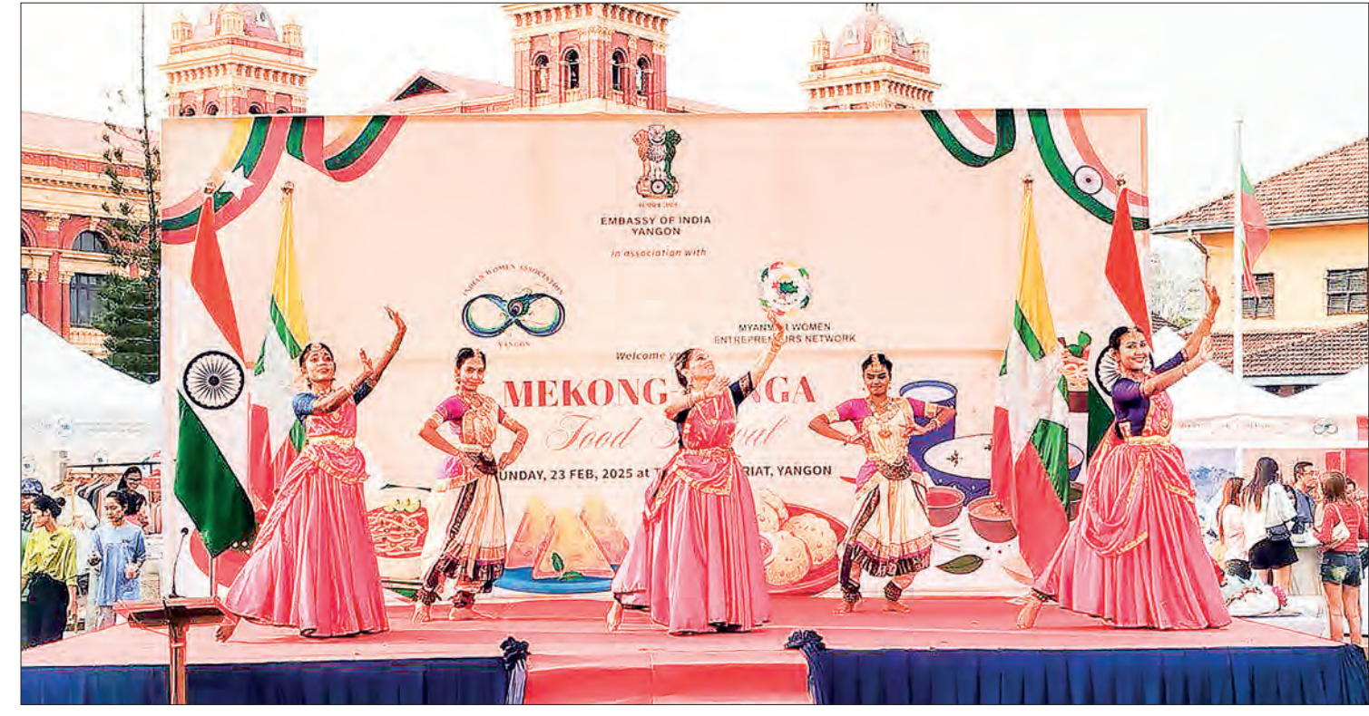
Dynamic scenes from the Mekong-Ganga Food Festival at the Secretariat Yangon on Theinbyu Road yesterday.