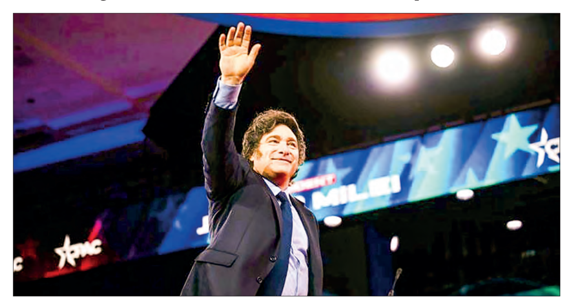
Argentine President Javier Milei addressed the annual Conservative Political Action Conference near Washington.

Milei announced his intention for Argentina to be the first country to join the proposed reciprocity agreement in trade that the Trump administration is advocating for, with the tariffs set to take effect on 2 April.