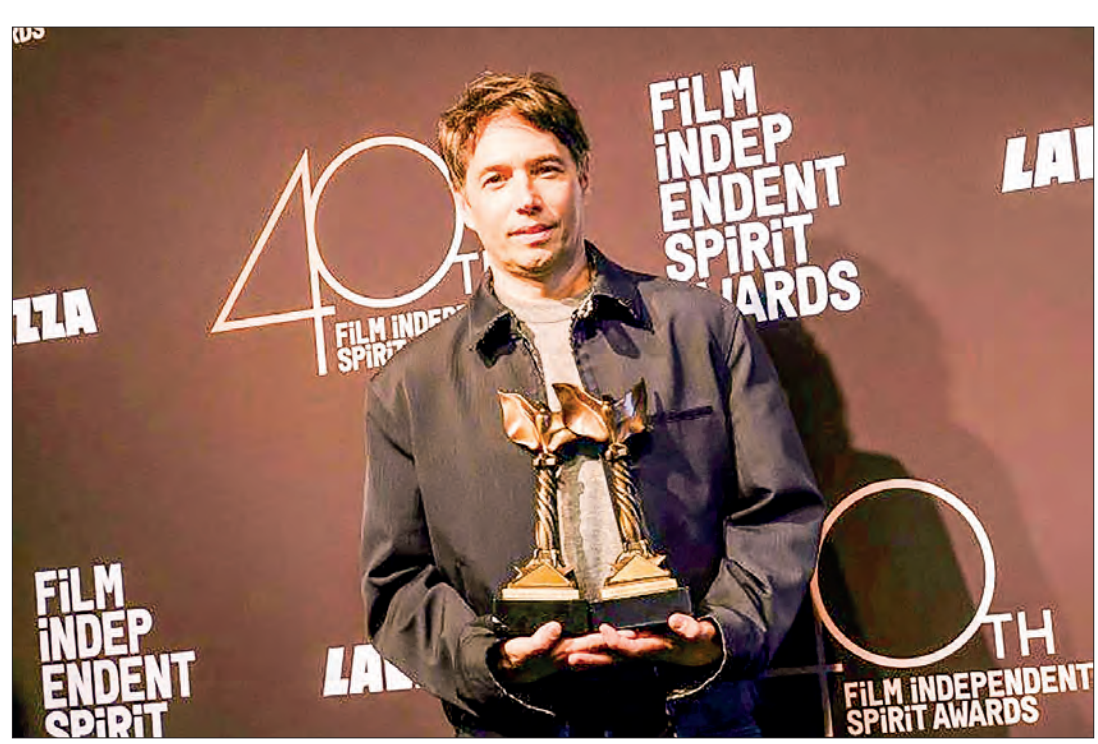
Sean Baker, long a leading figure of the US independent movie circuit, who is now shooting to mainstream success, has won multiple prizes for 'Anora'.