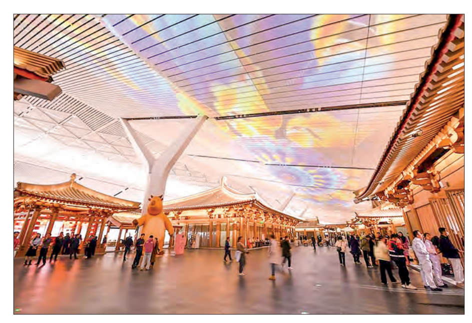
People walk at the departure hall of Terminal 5 of Xianyang International Airport in Xi'an, capital of northwest China's Shaanxi Province, 20 February 2025.

Founded over 3,100 years ago, Xi'an is home to the famous Terracotta Warriors and numerous other historic sites. It was the capital of 13 dynasties in China. The new air route offers more convenient choices for tourists to Kuala Lumpur, Shaanxi, and picturesque Yunnan and serves as a bridge for economic and