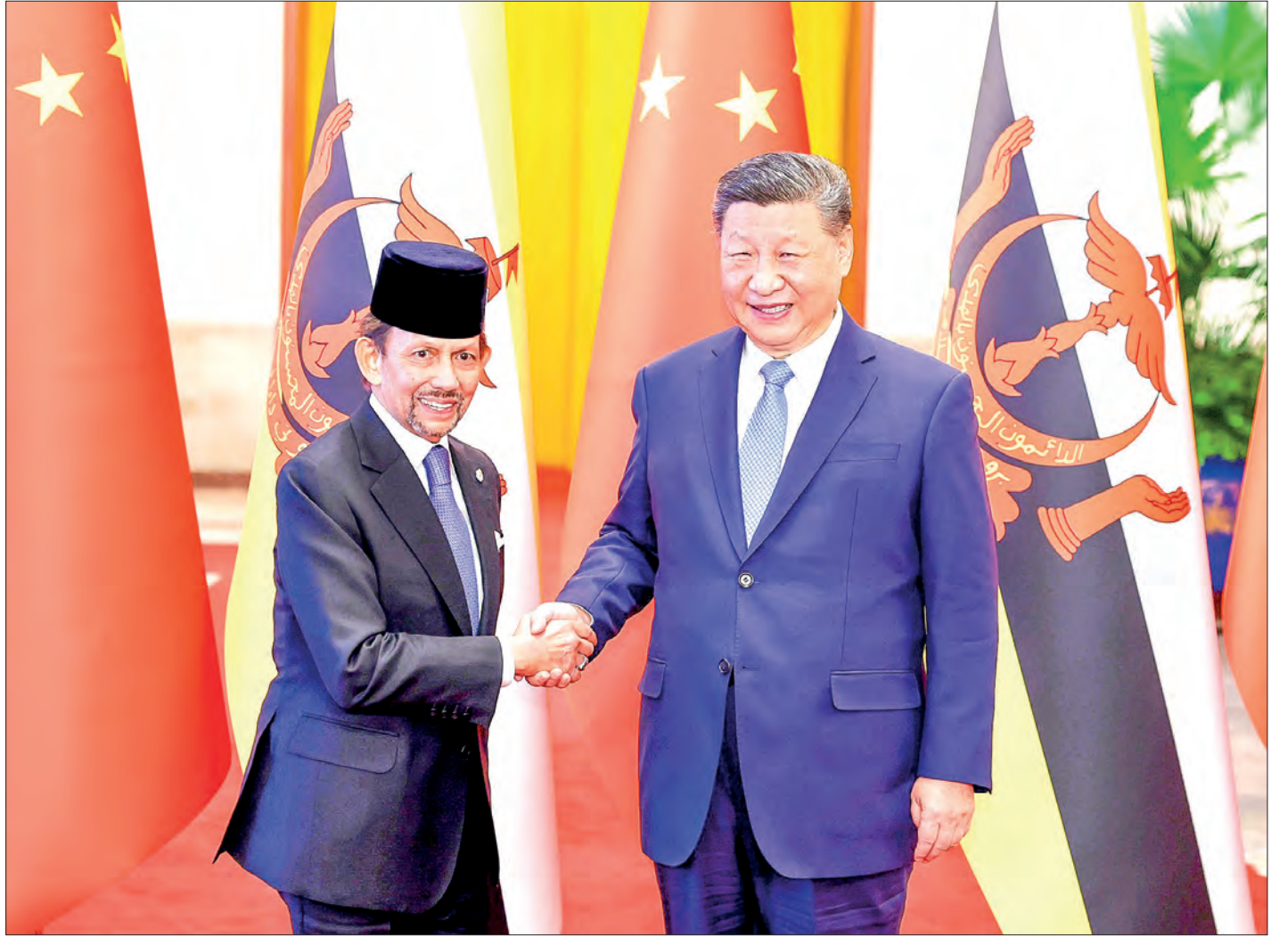
In this file photo dated 6 February 2025, Chinese President Xi Jinping meets Sultan of Brunei Haji Hassanal Bolkiah Mu'izzaddin Waddaulah in Beijing.

opment of China-Brunei relations and stands ready to work with Hassanal to make greater and more substantive efforts