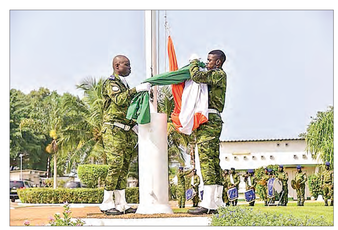
Ivorian soldiers rise an Ivorian flag during an official handover ceremony at the military camp in Abidjan, Cote d'Ivoire, on 20 February 2025.

He said that analog television currently occupies spectrum space equivalent to 26 channels, and transitioning to digital TV will significantly reduce this usage, freeing up bandwidth for 5G and other mobile communication needs. The country's Telecommunication Regulatory Commission is undertaking a project to construct 276 towers to enhance mobile broadband connectivity and support the rollout of 5G. These efforts are crucial to advancing the government's plan to expand Sri Lanka's digital economy to US$ 15 billion, Weeraratne said. The deputy minister added that the government has proposed the establishment of the Digital Economy Authority to oversee digitalization efforts across all ministries under a single authority. — Xinhua