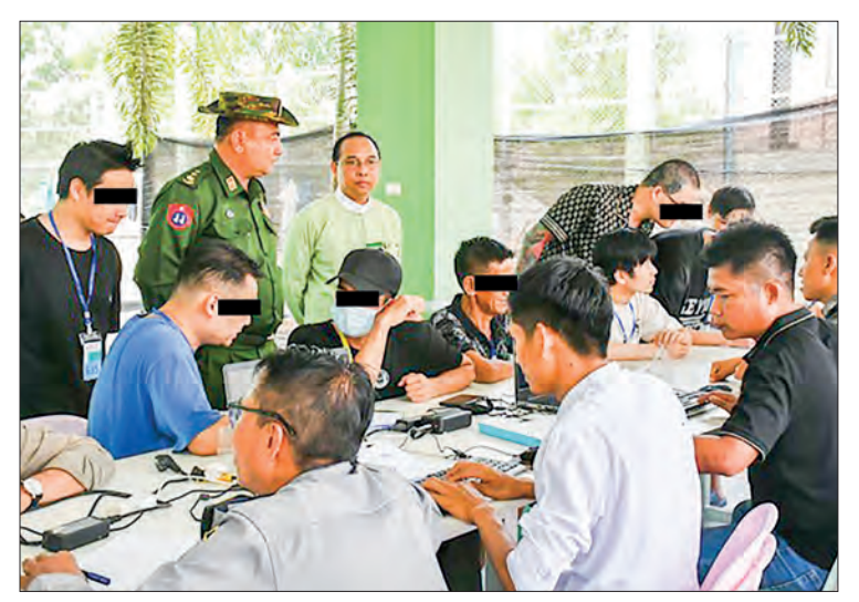
Immigration and officials processing the illegal entrants.

AUTHORITIES have detained an additional 109 illegal foreign nationals who had entered Myanmar through border routes after passing through neighbouring countries, including Thailand. These individuals were found in Myawady, particularly in the Shwe Kokko and KK Park areas, where they were involved in illegal online gambling, telecom fraud and other criminal activities.