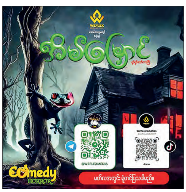
This image showcases a poster for the film 'Eain Myaung'.

MSME Development Fund Management Committee