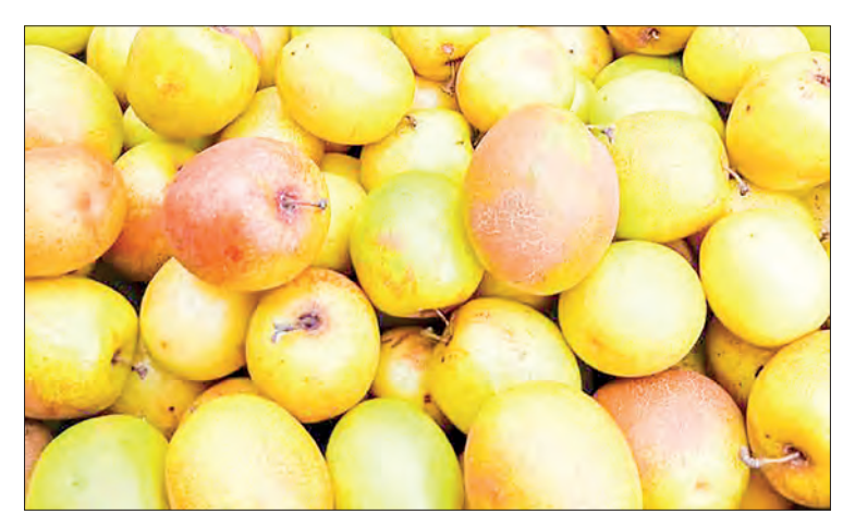
This image shows Laypin plums.

Laypin plum is crunchy and the flavour is distinctively sweet from the stage of young fruit and sweeter when it ripens. Despite being sweet, it is hardly to be infected and can be harvested from November to March.