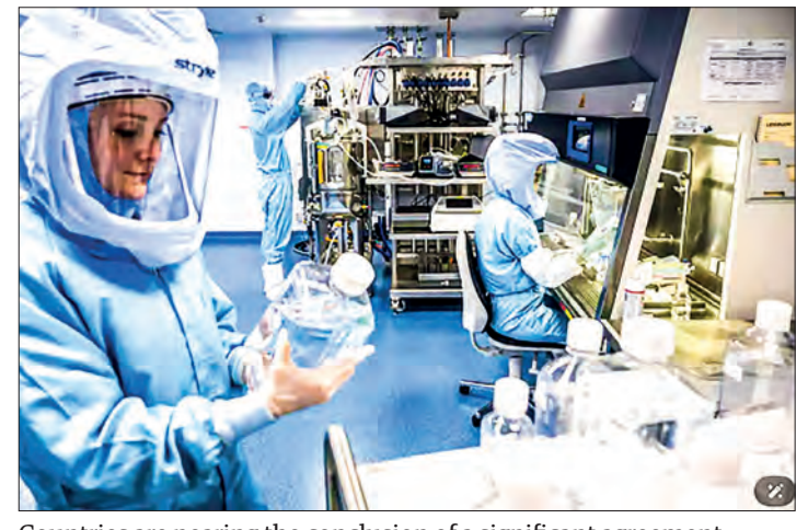
Countries are nearing the conclusion of a significant agreement focused on pandemic prevention, preparedness, and response.

THE head of the UN's health agency warned Friday that history would not forgive countries if they fail to strike a pandemic treaty at the last hurdle — with progress slow and time running out.