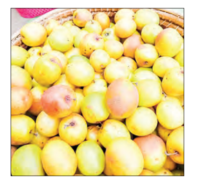
Laypin plum market stays strong despite season's end