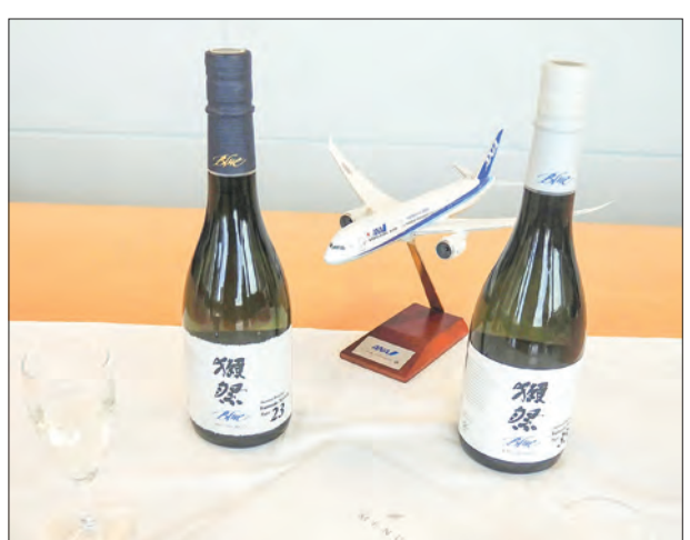
Photo taken in Tokyo on 18 February 2025 shows bottles of US-brewed Japanese sake Dassai Blue, which will be served on some international flights of All Nippon Airways Co.

ALL Nippon Airways Co will offer the US-brewed version of the popular Japanese sake "Dassai" to passengers on some international flights, the Japanese airline has said.