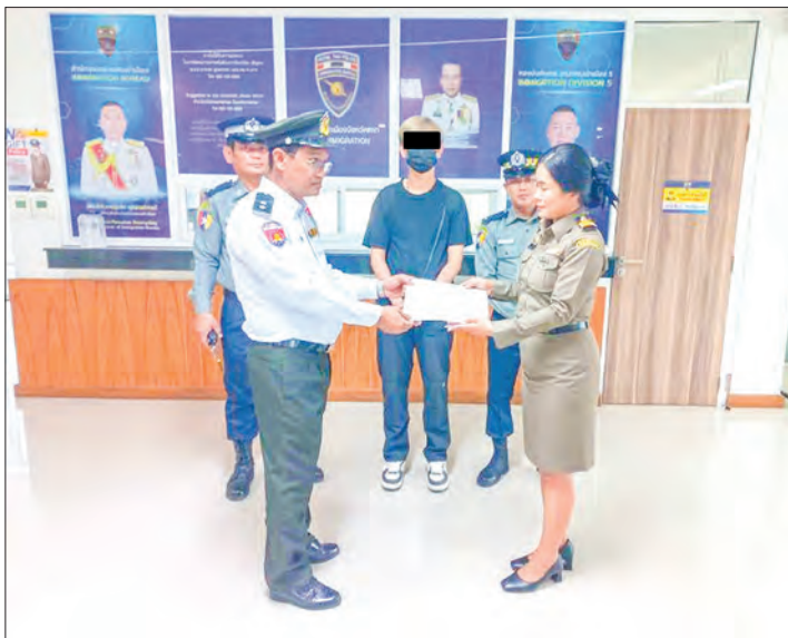
The handover ceremony for a Thai national in progress on 22 February 2025.