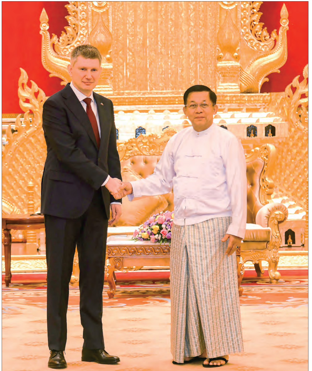
State Administration Council Chairman Prime Minister Senior General Min Aung Hlaing shakes hands with Mr Maxim Reshetnikov, Minister of Economic Development of the Russian Federation, during the latter's courtesy call yesterday.