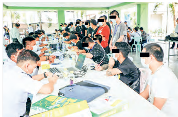
Immigration officials processing foreign detainees.

These 2,111 detainees are from China, Indonesia, Vietnam, Malaysia, Pakistan, India, Uganda, Ethiopia, Nepal, Thailand, Rwanda, Kenya, Kyrgyzstan, Cambodia and Chinese Taipei, and most are Chinese nationals.