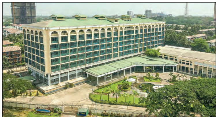
Aerial drone view of the Central Bank of Myanmar (CBM).

THE Central Bank of Myanmar (CBM) sold US$20 million on 21 February again.