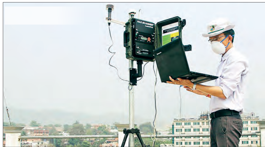
Air quality assessment in progress.

Air quality in Tachilek and Kengtung in Shan State, NyaungU in Mandalay Region, Patheingyi Township in Mandalay Region, and Ottarathiri Township in the Nay Pyi Taw Council Area is at a health