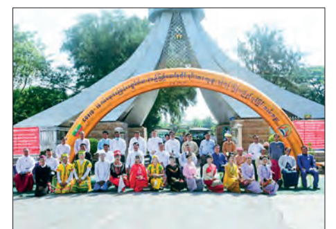
Group photo of people in traditional ethnic attire at the main gate.

Closed tender forms and regulations can be purchased at Union National Races Village (Yangon) in Thakayta Township, Yangon Region between 20 February to 6 March. Individuals can enquire about details through 09 450047588, 09 5123413, 01 9547055, and 09 421114496 of the office of the Union National Races Village or the ministry's website http://www.moea.gov.mm/ . Tender selection will take place on 10 March. — NN/KK