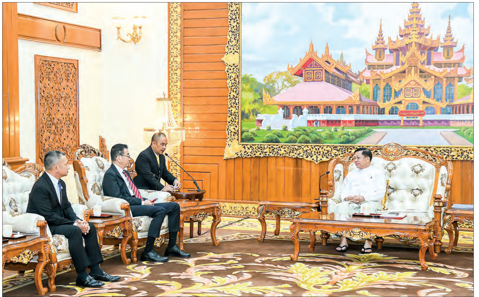
State Administration Council Chairman Prime Minister Senior General Min Aung Hlaing receives the delegation led by Thai Foreign Affairs Minister Mr Maris Sangiampongsa in Nay Pyi Taw yesterday.

A delegation led by Thai Minister for Foreign Affairs Mr Maris Sangiampongsa paid a courtesy on State Administration Council Chairman Prime Minister Senior General Min Aung Hlaing at the Bayintnaung Villa in Nay Pyi Taw yesterday morning.