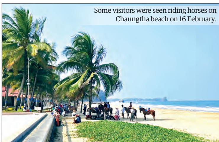
Some visitors were seen riding horses on Chaungtha beach on 16 February.