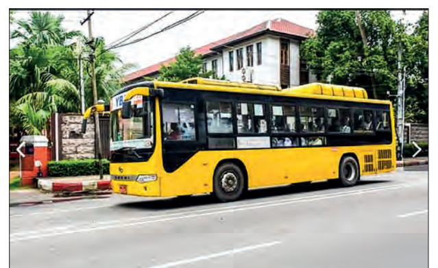
This image captures a YBS bus in downtown Yangon.

For public complaints, YUPT has provided the following phone numbers: 09 454546655 and 09 893475644 or its Facebook page. — MT/ZS