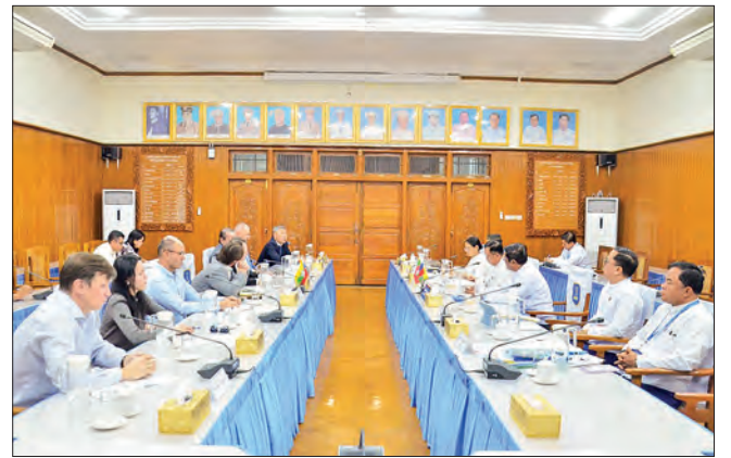
Union Minister U Nyan Tun holds talks with the Russian RC-Investments delegation in Nay Pyi Taw.

During the meeting, both sides discussed the successful cooperation between Myanmar and Russia in various sectors, the current collaboration between Russian companies on hydro, wind, solar, and thermal power projects for the development of Myanmar's electricity sector, and future cooperation opportunities. — MNA/MKKS