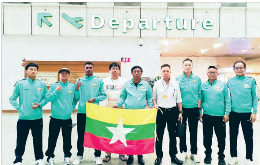
The Myanmar Lethwei team are seen at Yangon International Airport before leaving for Japan.

This marks the first overseas prize-fight for Myanmar Lethwei athletes, with a total of six bouts scheduled.