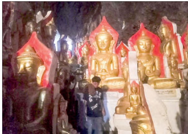
These photos showcase the ShweUmin Cave and Buddha Images inside.

THE Buddha Pujaniya Tabaung festival will be held in March at ShweUmin Cave in Pindaya Township, Danu Self-Administered Zone, southern Shan State, according to the Buddha Pujaniya festival organizing committee.