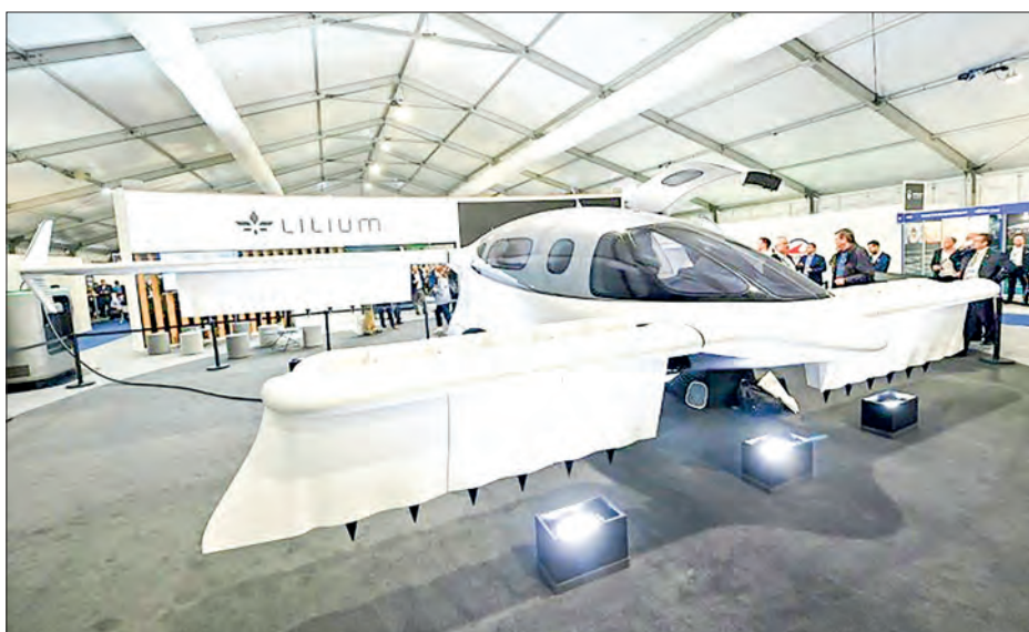
Lilium burnt through huge sums while trying to develop its jet.

nich-based company conceded on Friday that the funds “have not materialized in time”, forcing it to file for insolvency again.