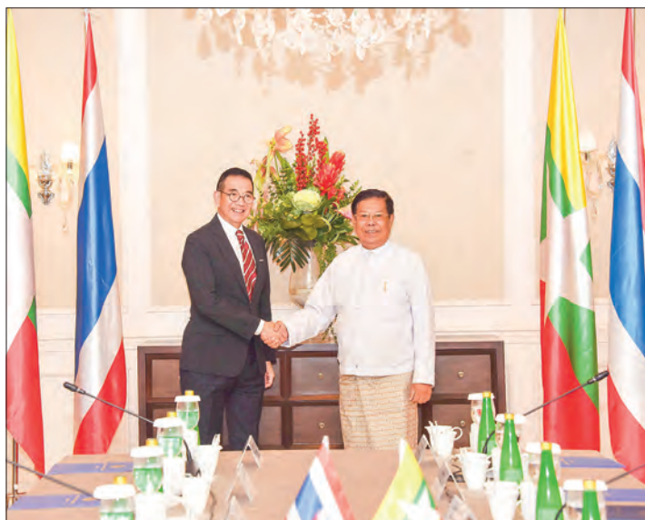
Deputy Prime Minister and Union Foreign Affairs Minister U Than Swe welcomes the Thai Foreign Affairs Minister.

During the bilateral meeting, both sides cordially exchanged views on further consolidation of existing bilateral relations and continued enhancement of multi-dimensional cooperation between the two countries, particularly in addressing illegal activities along the borders,