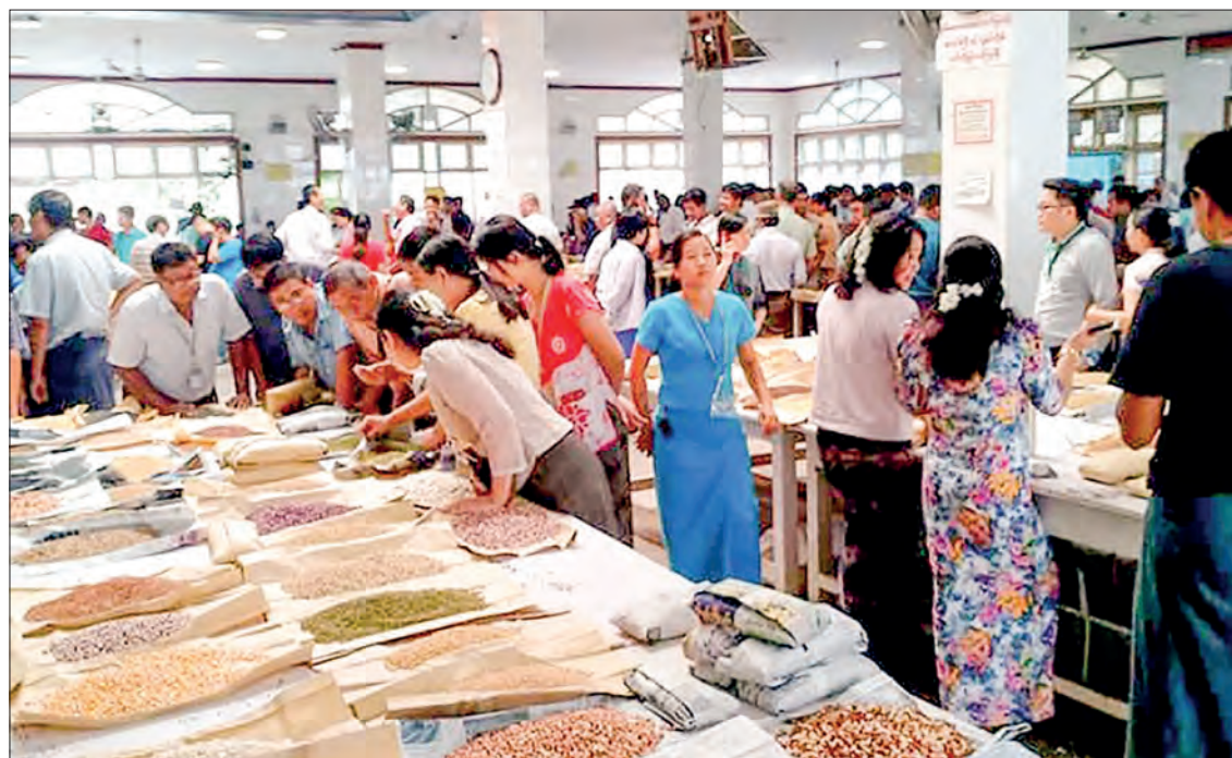
Samples of various pulses are seen on display in the domestic pulses and beans market.

Myanmar's various pulses exports hit over 775,290 tonnes of pulses valued at $669.89 million between 1 April and 19 July of the