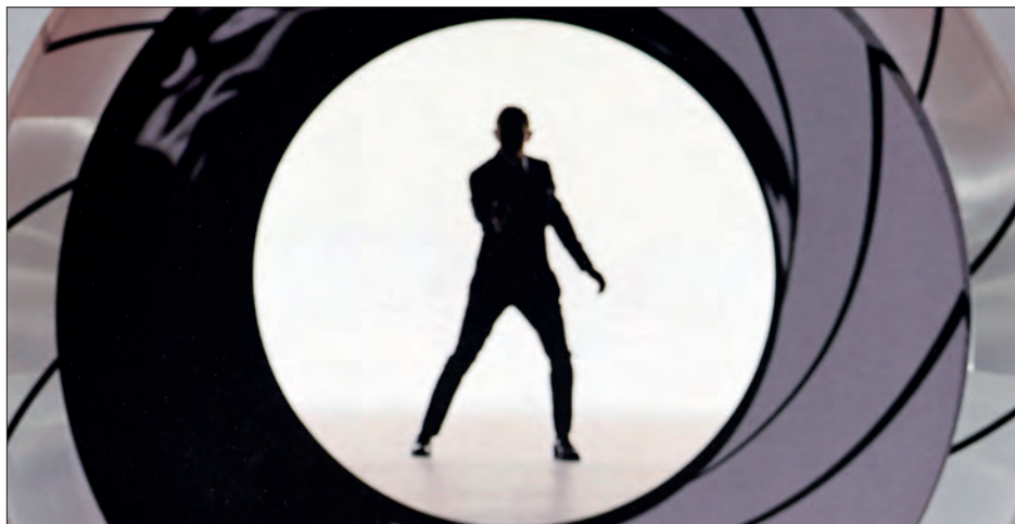
A photo taken on 28 September 2021 shows a projected image of British actor Daniel Craig during the World Premiere of the James Bond 007 film “No Time to Die” at the Royal Albert Hall in west London.