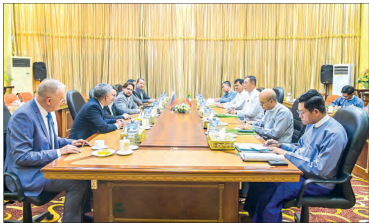
Union Minister U Khin Maung Yi meets the Russian RC-Investments Foundation Director yesterday.