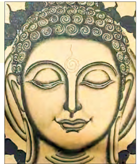
Tapestry painting featuring a Buddha Image.

With increasing recognition in the tourism sector, producers are striving to establish a strong market presence. Since the beginning of the year, tapestry paintings from Myinkaba Village have gained popularity among both domestic and international visitors. Continuous orders from various regions and states have contributed to the steady demand, solidifying these intricate artworks as one of Myanmar's treasured traditional