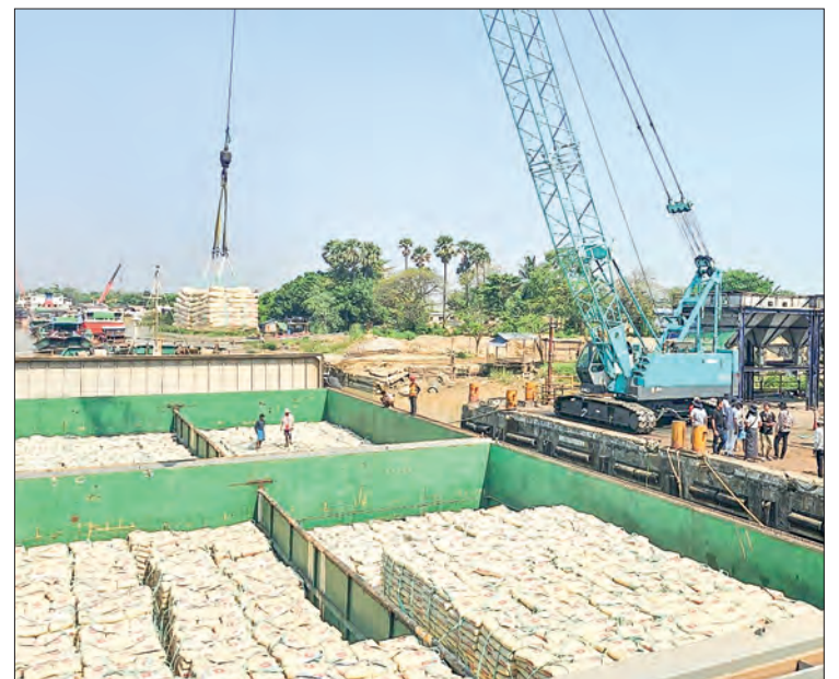
Unloading of imported cement bags at the port.

It is informed that the import of cement required for domestic construction activities during this period has been allowed and in addition to this vessel, the rest of the vessels which carry cement will be arriving week by week. — MNA/TTA