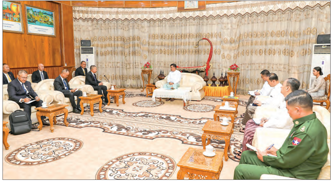
The Royal Thai Armed Forces Chief calls on SAC Member Deputy Prime Minister MoD Union Minister General Maung Maung Aye yesterday.

Officials from the Ministry of Defence also joined the meeting along with the Deputy Prime Minister and Union Defence Minister.