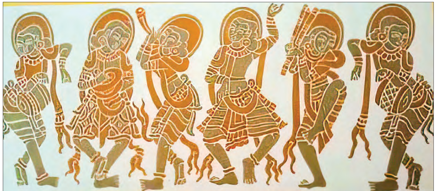
A tapestry showcasing a musical troupe, inspired by an ancient mural painting in Bagan's Myinkaba Village.

crafts with strong sales. — Nyein Thu (MNA)/KZL