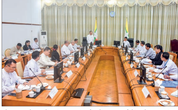
The second coordination meeting for the successful implementation of the Kyaukpyu Special Economic Zone in progress yesterday in Nay Pyi Taw.

At the meeting, Dr Kan Zaw, Chairman of the Myanmar Special Economic Zone Central Working Committee and Union Minister for Investment and Foreign Economic Relations stated that the concession agreement was made in 2020 between the Kyaukphyu Special Economic Zone Management Committee and the Kyaukpyu SEZ Deep Seaport Co Ltd, a subsidiary of China's CITIC Group. The addendum to the concession agreement was signed in 2023, extending the Long Stop Date by 18 months. He added that the extended long stop date will expire in June and it needs to complete the work before the expiration