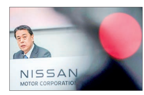
The reported proposal follows the failure of Nissan's merger talks with its rival

ed the credit rating of Nissan to junk, saying the decision "reflects Nissan's weak profitability driven by slowing demand for its ageing model portfolio". — AFP