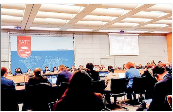
CBM Governor Daw Than Than Swe and Myanmar delegates attends the FATF plenary meeting in France.

THE Myanmar delegation led tion as per the international by Governor of the Central criteria and recommendations of FATF, reaching nine points, attempts to complete the remaining six points in time, amendment and enactment of Counter-Terrorism Law, Trusts Act and Custody and Disposal of Exhibits Law. She also highlighted the efforts to amend the Anti-Money Laundering Law and completely follow the Action Plan by the end of 2025-2026 FY by drafting the AML/CFT National Strategy (2024-2028), communication with foreign ex-