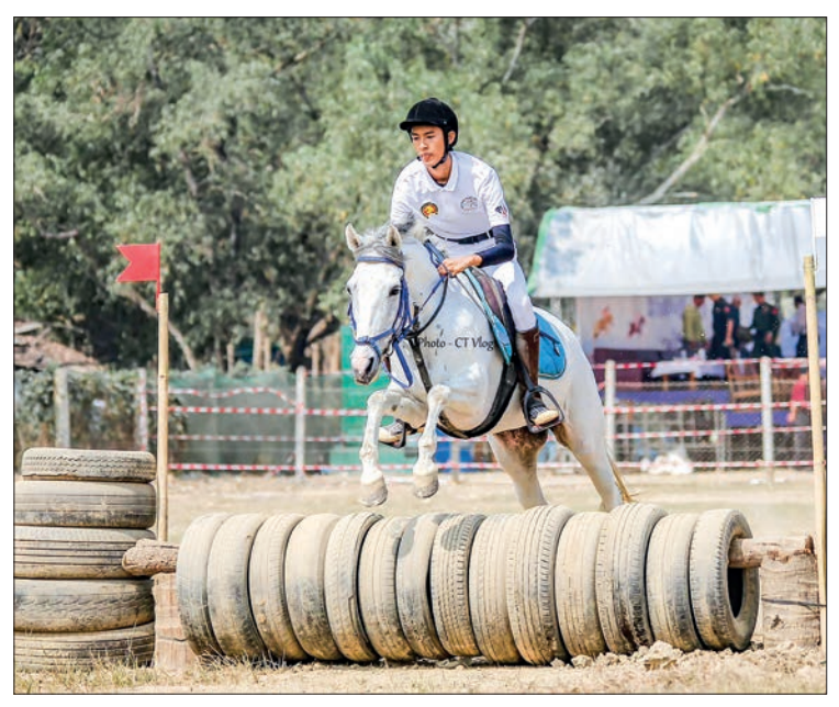
An equestrian athlete is seen training at the practice ground.

Erling Haaland is a doubt for Manchester City's clash against Liverpool.