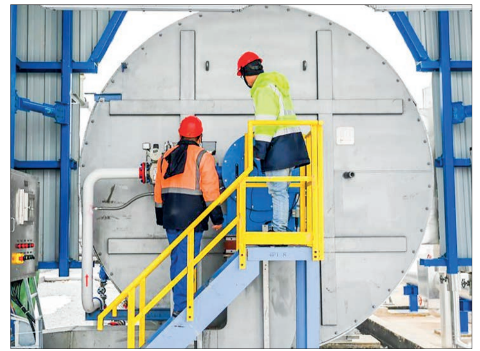
Chinese employees check the ground station facilities of the Tuz Lake underground natural gas storage expansion project, in Aksaray province, Türkiye, 12 February 2025. PHOTO: XINHUA

As a supporter of the BRI, Türkiye signed a memorandum of understanding with China in 2015 to align with its Middle Corridor plan, connecting Türkiye and Europe to China via a Trans-Caspian transport route. — Xinhua