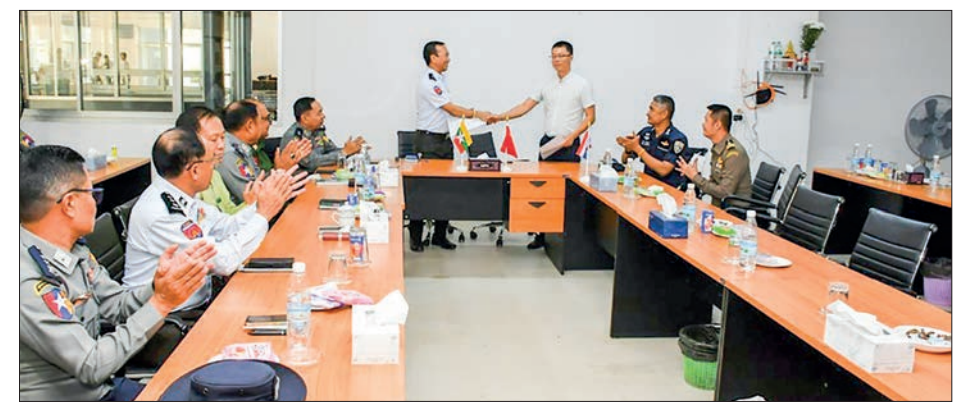
The handover event of 300 Chinese entrants in progress on 21 February.

THE government is strictly cracking down on online scams and online gambling by cooperating with international countries including neighbouring countries, especially through the Myanmar-China-Thailand Trilateral Cooperation, and systematically transferring the foreigners involved in these operations.