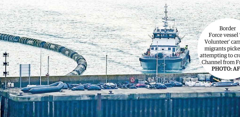
Border Force vessel 'BF Volunteer' carrying migrants picked up attempting to cross the Channel from France.

The tit-for-tat nature of these tariff threats reflects the broader shift toward more nationalist economic policies in the US and globally. — ANI