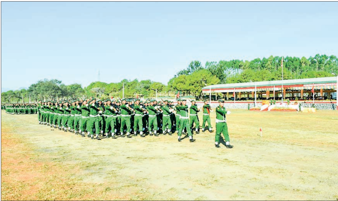
The graduation parade for the People's Military Service Training 7 underway yesterday.

THE graduation parades for the People's Military Service Training 7 took place yesterday morning at various training depots across the country, organized by relevant military commands. The ceremonies followed the training graduation schedule with the graduates taking an oath while holding the national flag.