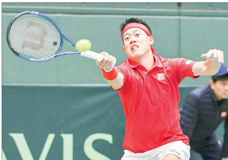
Japan's Kei Nishikori returns a shot to Britain's Jacob Fearnley in the second singles match in their first-round tie of the Davis Cup team tennis qualifiers on 31 January 2025, in Miki, Hyogo Prefecture.

Yoshihito Nishioka won, but Kei Nishikori lost Friday as Japan split the first two singles matches with Britain