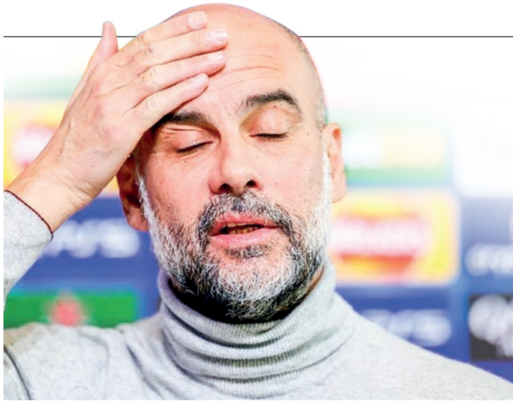
Manchester City manager Pep Guardiola.