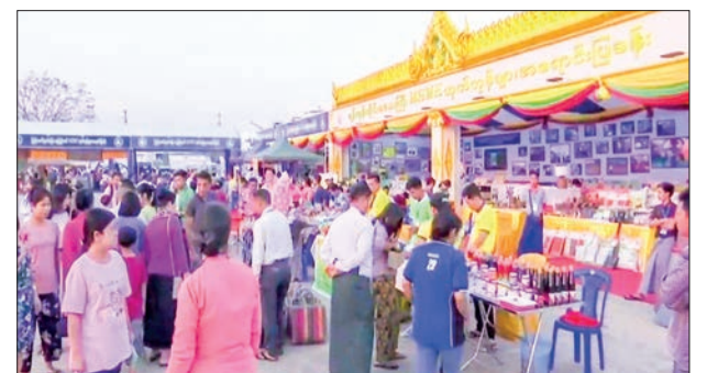
This image showcases the Union-level MSME Product Exhibition and Competition in commemoration of the 77th Union Day 2024.

Visitors can buy products, taste traditional foods and learn the culture and customs of ethnic groups in a single place. Preparations are underway in each sector to successfully hold the exhibition.