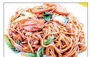
A traditional Myanmar 'Poneyaygyi' cuisine.

These menu items include fried pork Poneyaygyi rice, fried chicken Poneyaygyi rice, fried pork Poneyaygyi noodles, fried chicken Poneyaygyi noodles, pork Poneyaygyi curry, chicken Poneyaygyi curry, pork Poneyaygyi steamed rice, fried pork Poneyaygyi vegetable rice, Poneyaygyi vermicelli, pork Poneyaygyi clay pot, and Chinese and Thai dishes, according to Ko Nay Myo Hlaing, who created them. "In the past, many restaurants in Bagan-NyaungU sold only three types of Poneyaygyi curries- pork-mixed curry, salad rice and salad Poneyaygyi. We have developed many new menus in the five years since we opened our shop because we have our