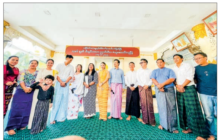
The filming launch for the 'Phoe Kauk' movie is in progress.

The launch ceremony for the 'Phoe Kauk' film took place on 30 January at the Eaindawya Pagoda in Dagon Township, Yangon. — ASH/KZL