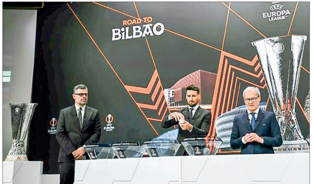
The draw for the Europa League play-offs took place on Friday.

FORMER winners Porto were drawn Friday to face Claudio Ranieri's Roma in the stand-out tie of the Europa League knockout phase play-offs, while Manchester United and Tottenham Hotspur were among the clubs to discover their potential opponents in the last 16.