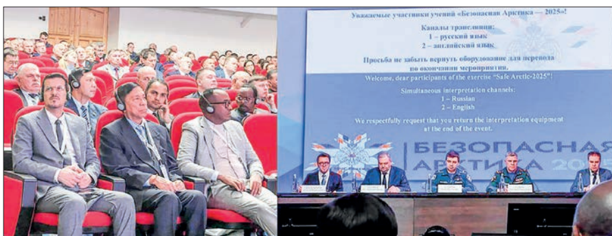
Union Minister Dr Soe Win and Myanmar delegates participate in the International Conference on Arctic Security in Russia.

During the exhibition, the Union minister observed various technological innovations, including unmanned small aircraft, small helicopters and motor vehicles used for hazard detection, automatic fire suppression and emergency response. He also examined specialized rescue suits designed for saving lives in extremely cold climates and advanced equipment for search and rescue operations and emergency medical care. He engaged in discussions and asked