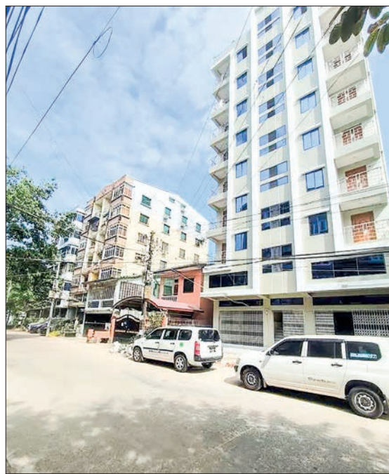
Apartments are seen in South Okkalapa Township.

In September 2024, rental was larger than buying and selling the Yangon real estate market. Among apartment and condominium tenants, some people moved to Yangon from other regions and states.