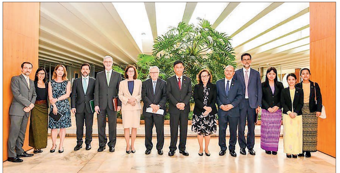
The commemorative group photo of the fourth Political Consultations meeting between Myanmar and Brazil on 28 January.

On the evening of 30 January 2025, the Deputy Minister for Foreign Affairs met separately