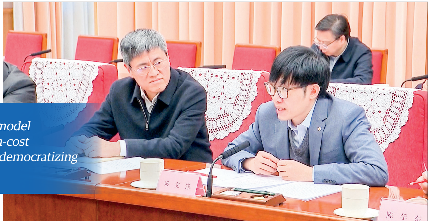
Liang Wenfeng, the founder of Chinese AI startup DeepSeek, speaks at the symposium presided by Chinese Premier Li Qiang to hear opinions and suggestions on a draft government work report on 20 January 2025.

DeepSeek's affordable AI model challenges traditional high-cost development, potentially democratizing advanced AI technology.