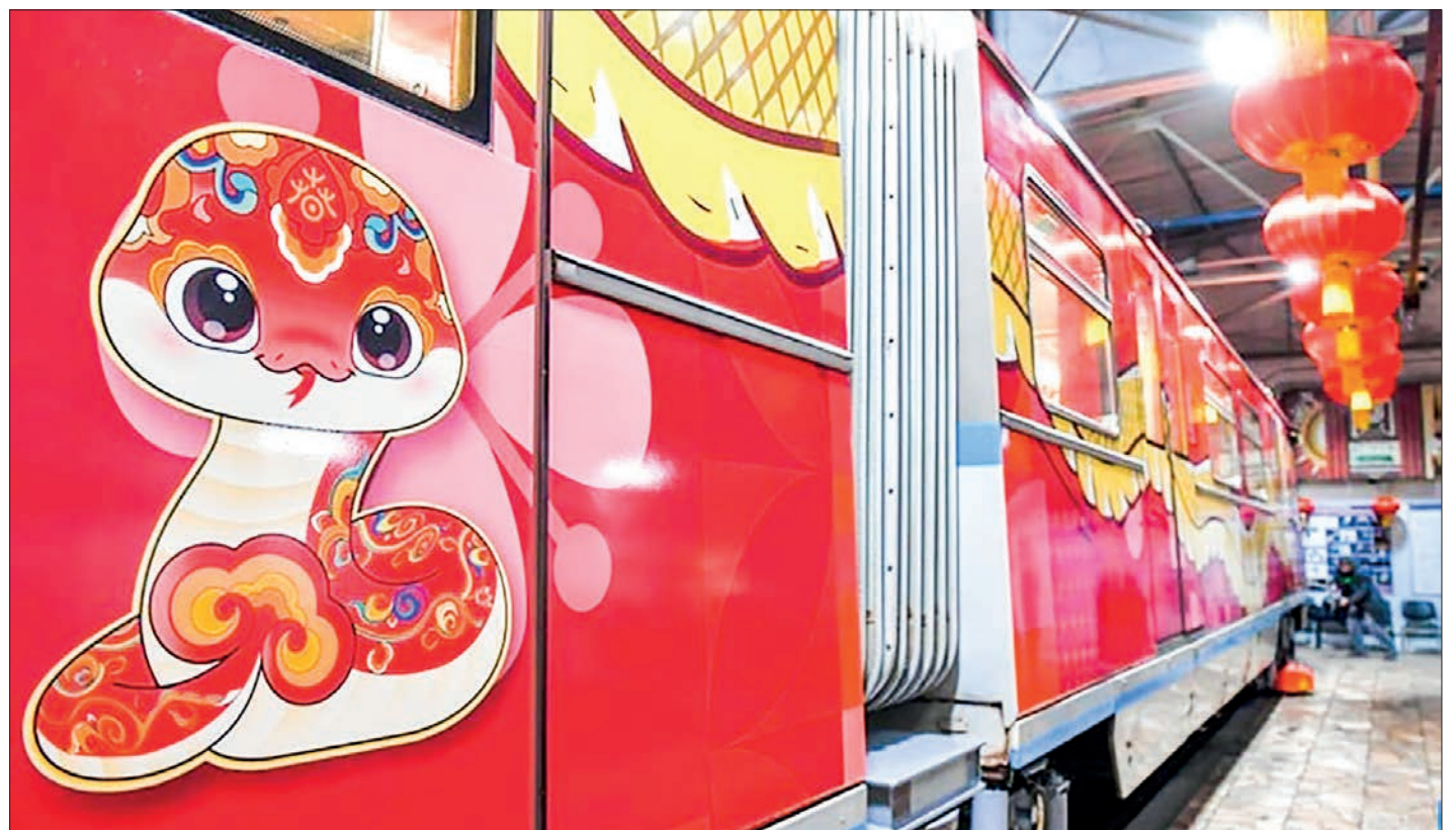
This photo taken on 29 January 2025 shows a view of a themed metro train in Moscow, Russia, on 29 January 2025. Moscow unveiled the themed metro train on Wednesday to mark the start of the Spring Festival, the traditional Chinese New Year according to the lunar calendar.

Moscow introduced a themed metro train to celebrate the Chinese Spring Festival. The train, featuring Chinese New Year symbols and the snake zodiac, highlights the cultural friendship between Russia and China.