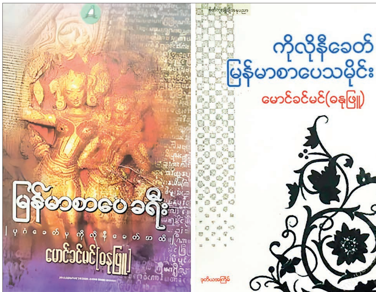
Front covers of books by the late Sayagyi Maung Khin Min (Danubyu).

of the second Kyaw Aung San Htar Sayadaw of the mid-18 th century, writer and the brilliant linguist and leftist the late Min Latt Yin Gaung's treatise in the early 1960s regarding Myanmar linguistics. I praised Saya's efforts in collating, researching and presenting the sixty treatises in a compact, concise but very informative format. Saya had been mostly complimentary of most of the authors of the sixty treatises. But a few critiques of a few Chapters perhaps are natural and justifiable. In particular, MKM critiqued the gratuitous comment of U Thein Pe Myint (10 July 1914-15 January 1978) regarding linguistics which appeared in his column 'Let me talk frankly' ဖွင့်ပွင့်လင်းလင်း ပြောပါရစေ of 15 February 1972. U Thein Pe Myint was a prominent author in the contemporary literary firmament. Nevertheless- dare I say it- he was not an expert in Myanmar linguistics as Maung Khin Min was. Hence Saya's brief criticism of U Thein Pe Myint's article of more than 52 years ago if belated was justified.