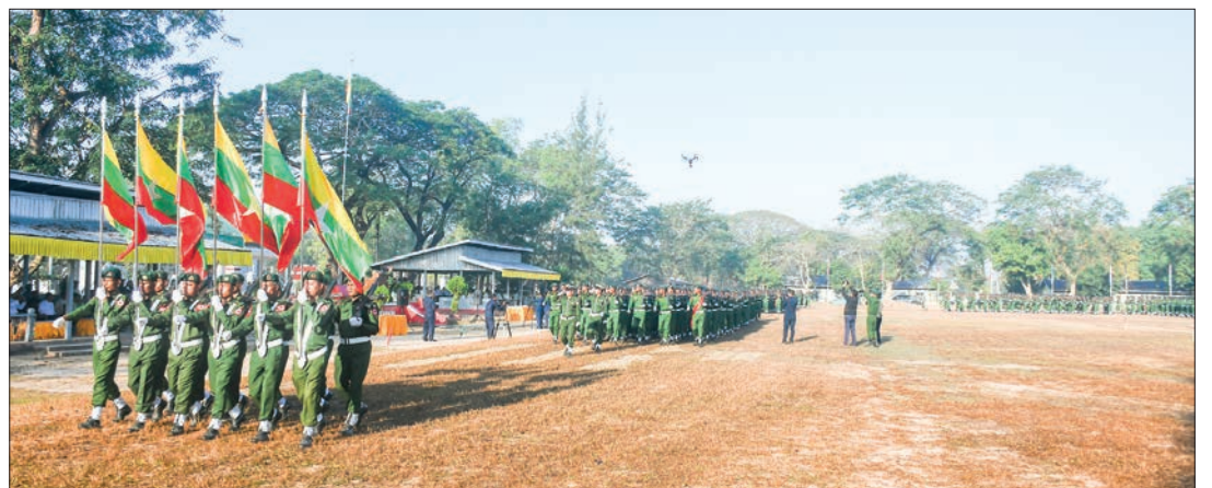
The graduation event for the People's Military Service Training 7 in progress yesterday.