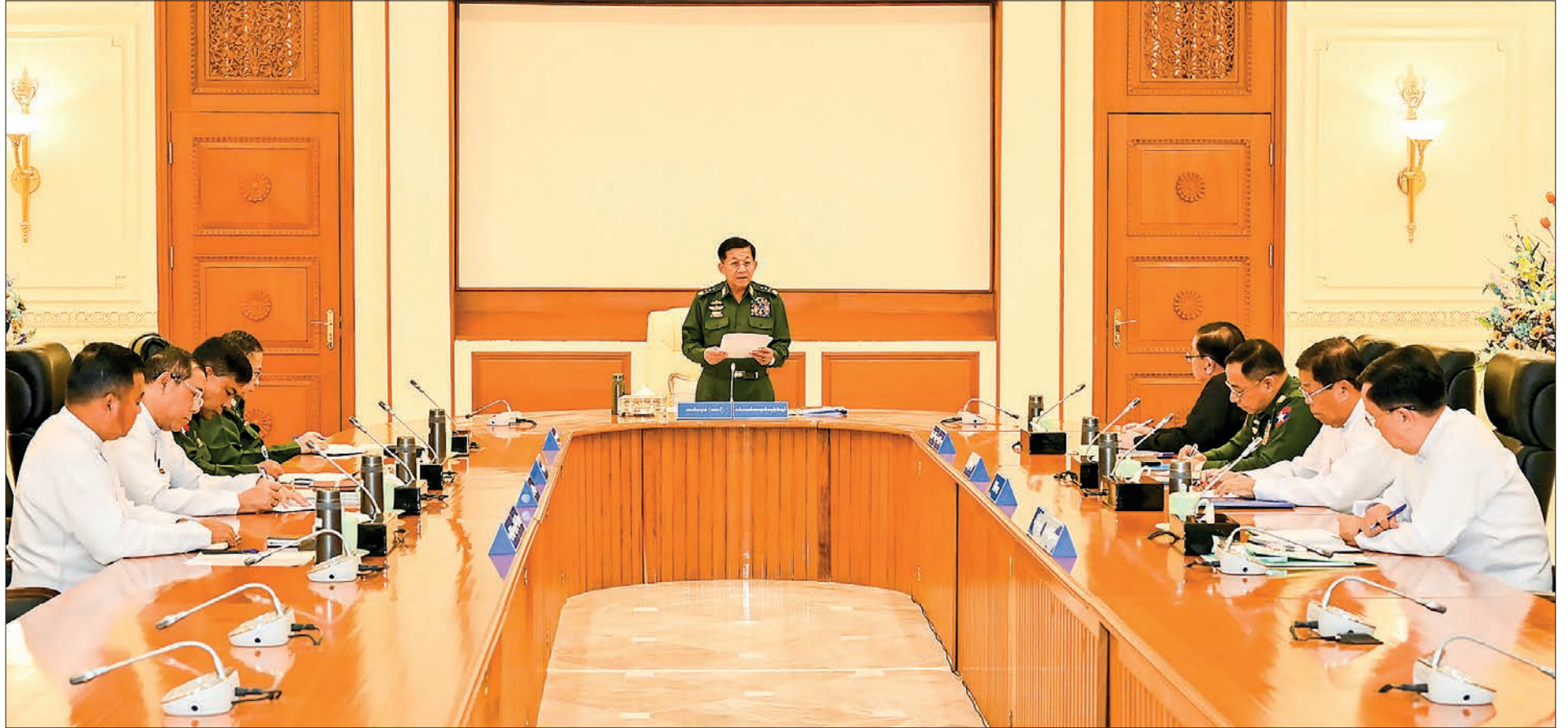
Pro Tem President (Duty) Defence Services Commander-in-Chief Senior General Min Aung Hlaing presides over the first 2025 Meeting of Myanmar's National Defence and Security Council in Nay Pyi Taw yesterday.

T he National Defence and Security Council of the Republic of the Union of Myanmar held its 1/2025 meeting at the Office of the State Administration Council Chairman in Nay Pyi Taw yesterday morning.