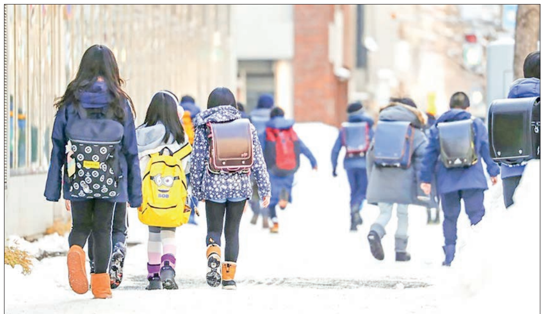
Japan reports a record 527 child suicides in 2024, highlighting a 14 per cent increase.

Health issues were the most common reasons behind suicides, accounting for 11,986 cases, followed by problems related to economic and life issues at 5,075 and family problems at 4,334. — Kyodo