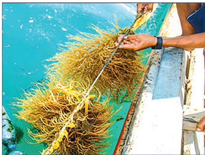
A fishery worker harvesting seaweed.

There are many species of seaweeds and they grow in saltwater and changing tem-