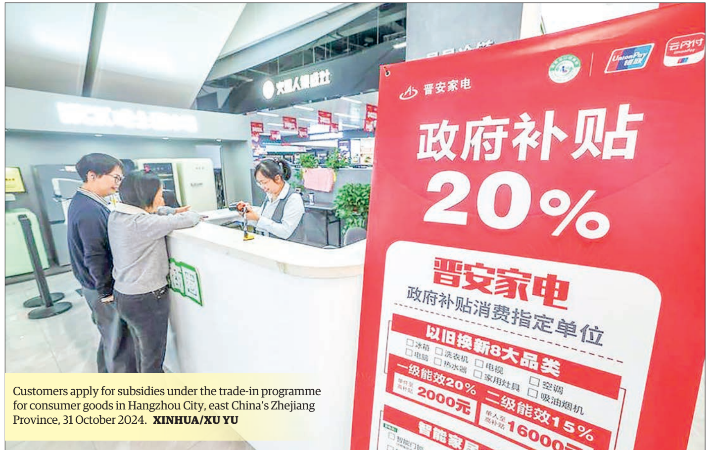
Customers apply for subsidies under the trade-in programme for consumer goods in Hangzhou City, east China's Zhejiang Province, 31 October 2024.

China's consumer trade-in programme saw high participation during the Spring Festival season, with millions of electronic devices, vehicles, and appliances traded in, boosting retail sales and consumer sentiment.