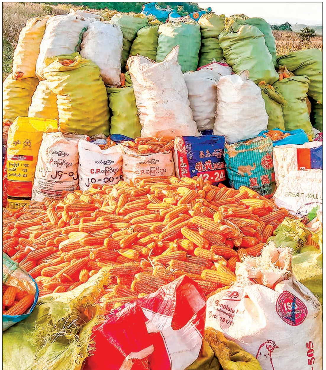
This image shows a stockpile of maize in a warehouse, ready for export.