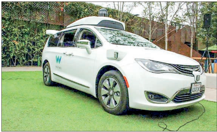
Waymo starts testing its driverless robotaxis on Los Angeles freeways, with plans to expand the service to the public after initial employee-only access.

Waymo plans to expand its driverless robotaxi service to the public after an initial phase of employee-only access, following prior approval for operation.