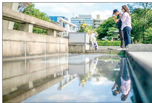
Around 140,000 people died in Hiroshima, with the United States never apologizing for its use of atomic bombs against Japan. PHOTO: AFP

Around 140,000 people died in Hiroshima and some 74,000 others in Nagasaki including many who survived the explosions but died later from radiation exposure. — AFP