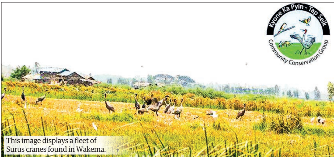
This image displays a fleet of Surus cranes found in Wakema.