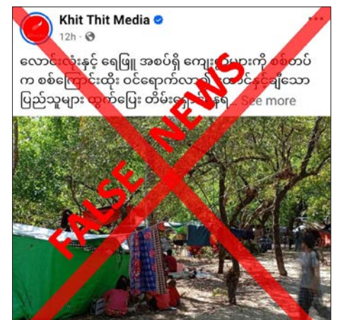
This screenshot validates misinformation.

MALICIOUS news media spread false reports claiming that security forces have raided villages at the edge of Launglon and Yebyu townships, Taninthayi Region, since January, causing residents to flee.