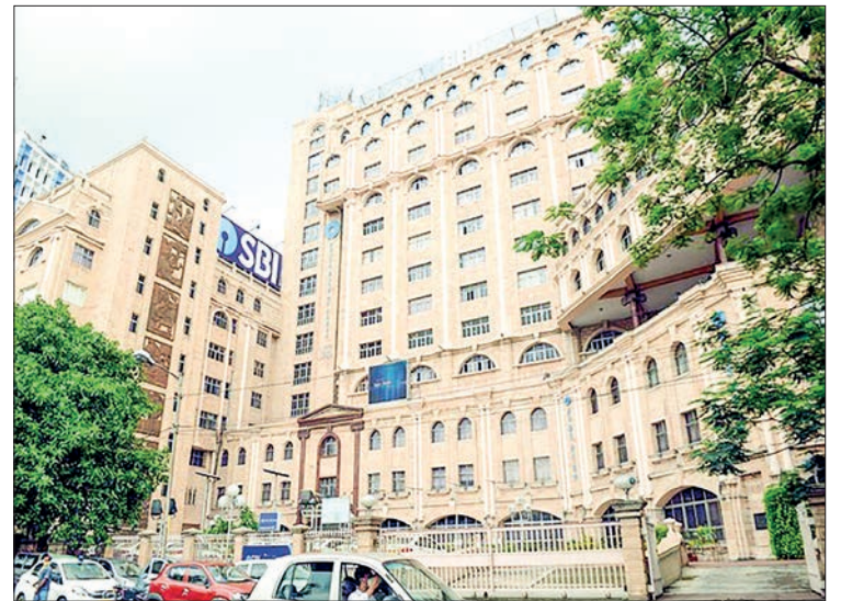
State Bank of India (SBI) building, Kolkata.

The report suggested that net interest margins (NIMs) of most banks are likely to decline in the coming months as deposit rates catch up and monetary easing comes into play. Many banks have adjusted their lending strategies, reducing consumer loans while focusing more on mobilizing retail deposits to strengthen their balance sheets. — ANI