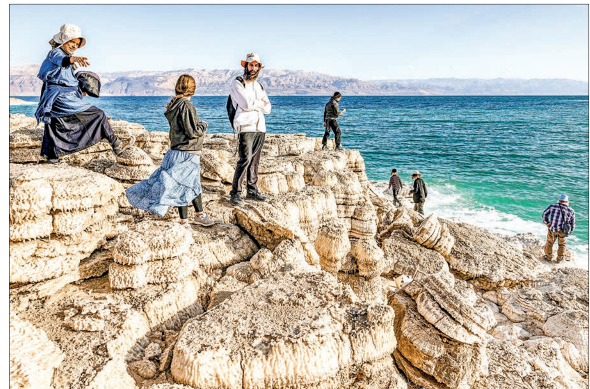
Hikers stand on salt formations during an excursion along the northern Dead Sea shore near the Israeli settlement of Ovnat in the east of occupied West Bank on 29 December 2024.

The only remaining Israeli resorts are on the man-made