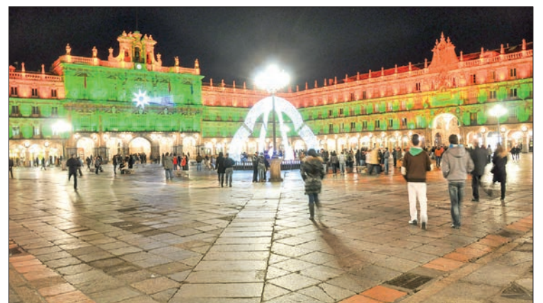
Plaza Mayor in Spain is a historic square in Madrid, renowned for its impressive architecture and vibrant atmosphere, drawing both locals and tourists alike to its lively cafes and events.

Tourism, which represents around 13 per cent of the economy, has driven the sector which has flourished after the COVID-19 crisis paralyzed travel. — AFP