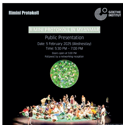
This photo showcases a poster of Rimini Protokoll in Myanmar public presentation.

THE Goethe-Institut Myanmar and the renowned German-based theatre company Rimini Protokoll will jointly present a contempo-