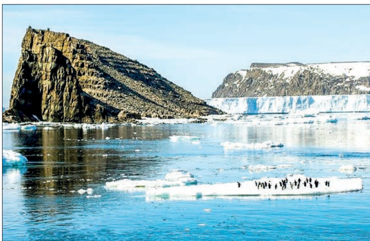
The climate changes and ice melts, the patches of land will become milder and less isolated -- enabling colonization by species from lower latitudes.

Anikó Tóth, lead author of the new research from UNSW, said that Antarctic ice-free lands are home to uniquely adapted flora, several species of arthropods, microbes and to breeding colonies of penguins, gulls, albatrosses and other seabirds. — Xinhua