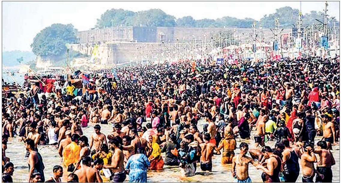
Prayagraj: Devotees take a dip at Triveni Sangam during ongoing Mahakumbh, in Prayagraj on Tuesday.

Along with this, I wish for the speedy recovery of all the injured. Under the guidance of the Chief Minister, the Uttar Pradesh government and the