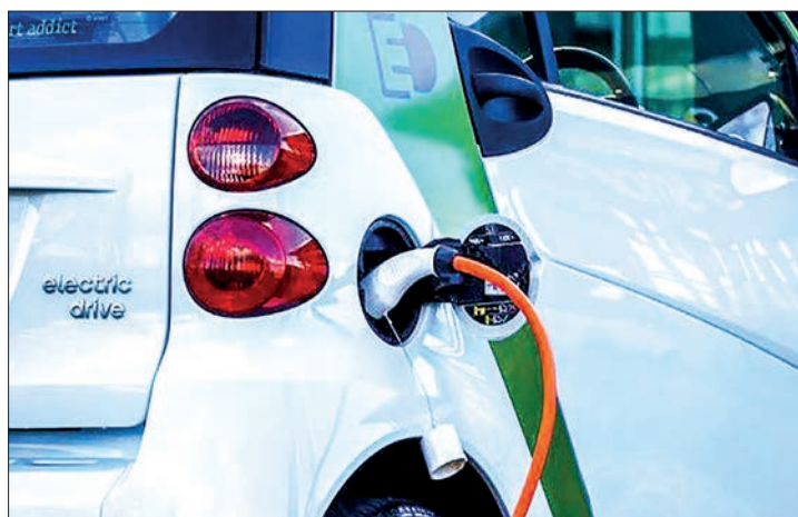
EV sales grew 22 per cent globally in 2024 despite a market slowdown.

While the overall passenger vehicle market struggled in 2024, the EV segment told a different story – thanks to booming demand. Global passenger vehicle (PV) sales in 2024 remained stagnant, growing by just 1 per cent year-on-year, according to Counterpoint Research's latest Global Passenger Vehicle Forecast. Geopolitical tensions, fear of looming recession and reduced consumer spending in key markets have all contributed to this temporary slowdown in the global automotive market. — ANI