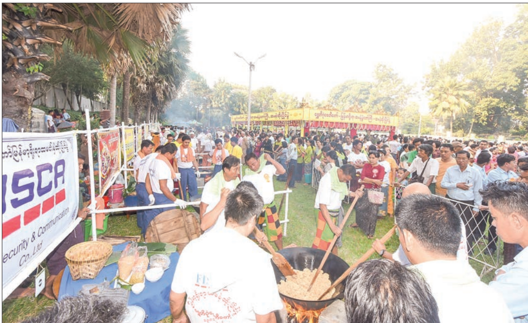
This photo showcases the Htamane-making competition being held at the Shwedagon Pagoda in the previous year.