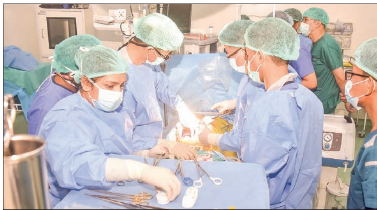
The second-day operation is underway.

The liver extraction from the donor started at 9:30 am and the extracted liver was transplanted at 5 pm. The operation took about 11 hours. Both the patient and the donor are reportedly in good health after the operation. They are now in the