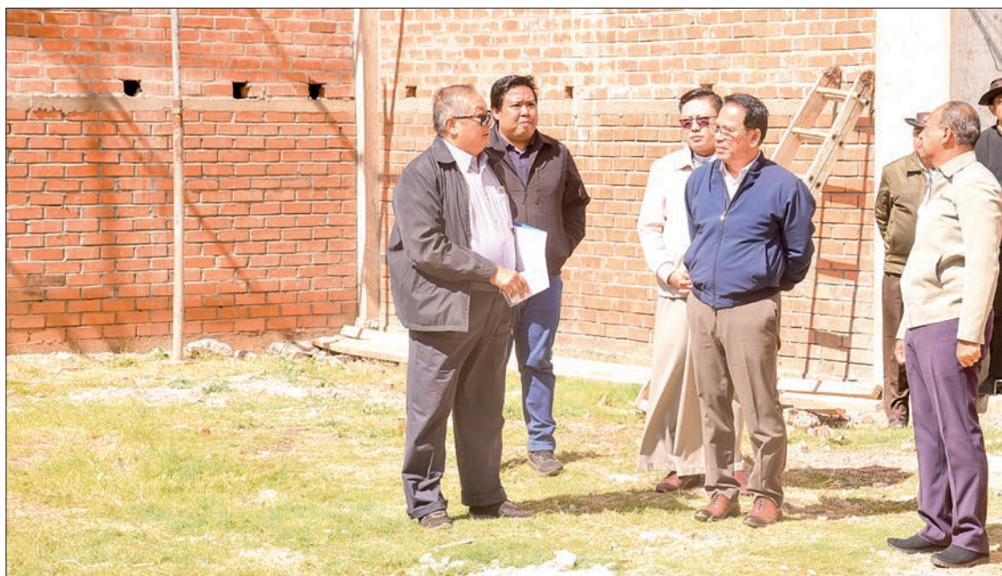
Union Minister U Maung Maung Ohn, Shan State Chief Minister U Aung Aung and officials view the construction sites of infrastructure and studios in Pindaya.

Similarly, the Union minister and the Shan State chief minister visited Shwephonep-wint Pagoda in Taunggyi and