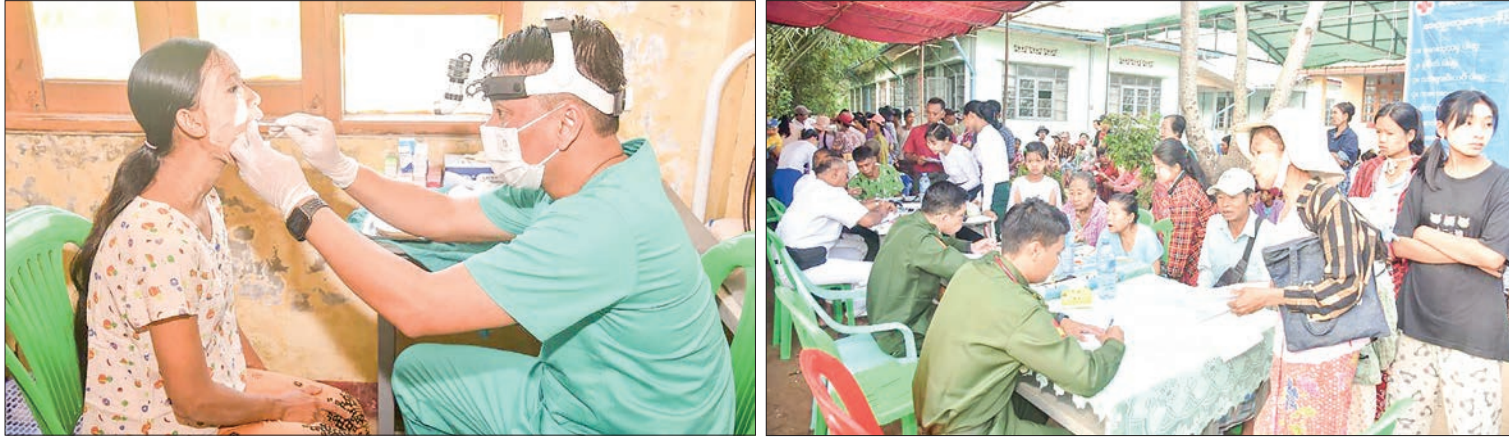
Images showcase Tatmadaw hospital vessels delivering healthcare services in Kyone Mange.

TATMADAW'S mobile medical team, comprising specialists, doctors and nurses provided healthcare services to residents along the Ayeyawady River. The team operating aboard Tatmadaw hospital vessel Shwepuzun and river vessel Saku conducted medical services yesterday at the Basic Education Middle School in Kyone Mange Village, Kyaiklat