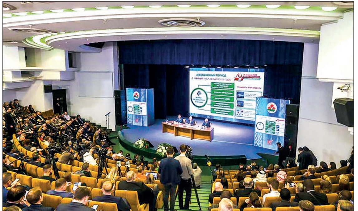
UEC Members observe progress of Belarusian election in this photo.

A total of 486 international election observers from 52 countries monitored the election. Reports indicate that the current president, Aleksandr Lukashenko, won with 86.82 per cent of the votes. The Myanmar delegation returned to Yangon via Bangkok, Thailand, yesterday evening. — MNA/MKKS