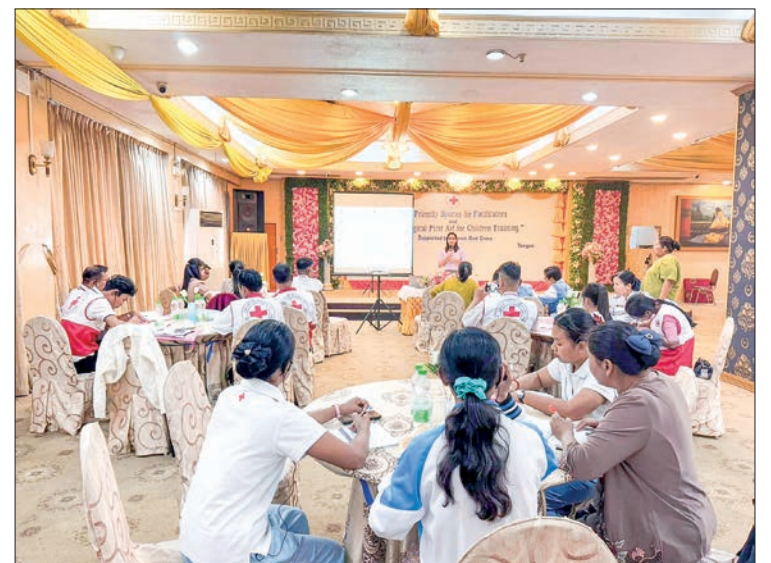
This image captures the opening ceremony of the Child-Friendly Spaces for Facilitators and Psychological First Aid for Children Training.

The first training took place on 20-24 January in Yangon, with the participation of 24 staff and volunteers from Sagaing and Magway regions and southern Shan State. — ASH/KK