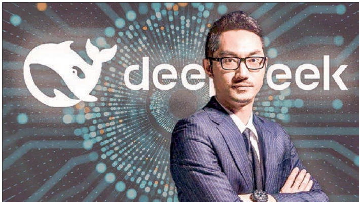
DeepSeek is a Chinese AI company founded in 2023. Liang Wenfeng, DeepSeek AI CEO.