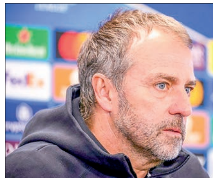
Barcelona's German coach Hansi Flick said he and his staff were backing Wojciech Szczesny in goal over Inaki Pena.

FC Barcelona head coach Hansi Flick confirmed on Tuesday that Wojciech Szczesny has become his first-choice goalkeeper ahead of Inaki Pena.