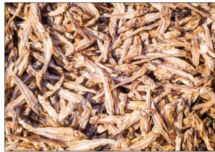
Dried 'Nganitu' (Red-bellied Pacu) are organized for sale in the market.

Local fishery products were exported to overseas markets through the Kawthoung-Ranong border in June 2024, according to local traders from Myeik Township. In addition to fishery products,