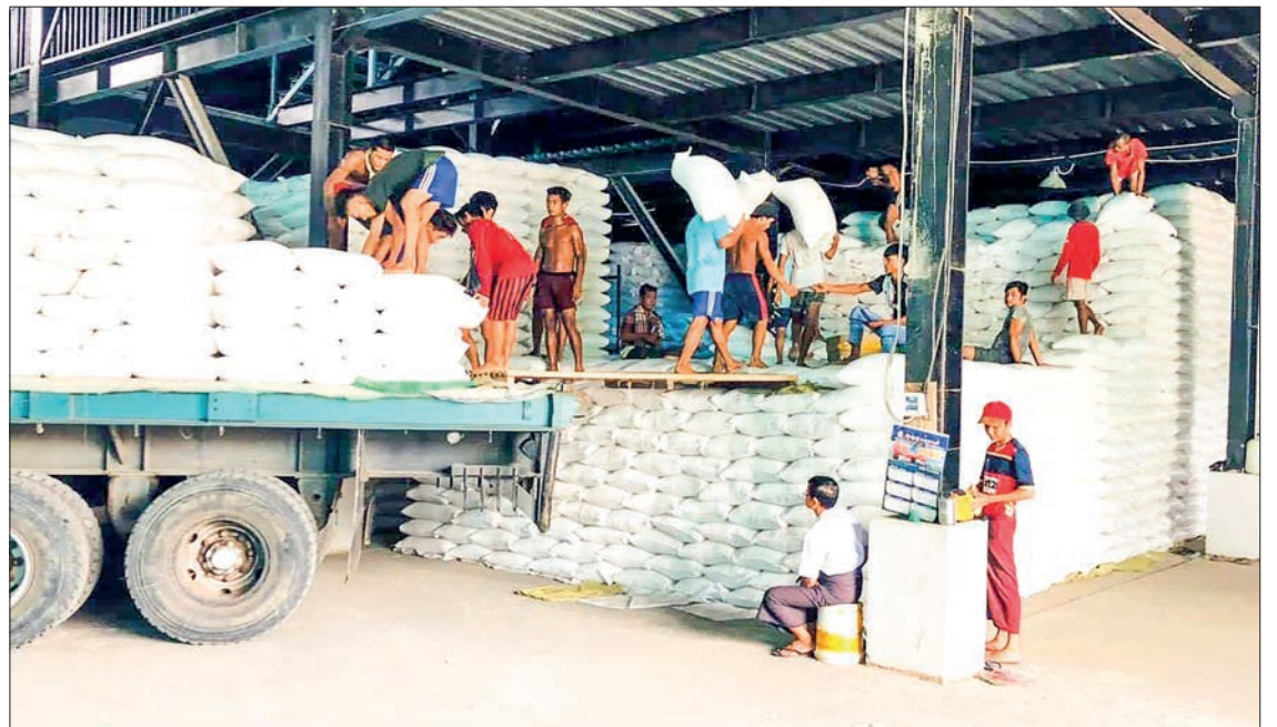
Workers diligently stack rice bags in the warehouse.

ed to achieve 2.5 million tonnes of rice export in the FY 2023-2024, generating earnings of one billion dollars. However, rice exports fell short of the target with 1.6 million tonnes worth $845 million.