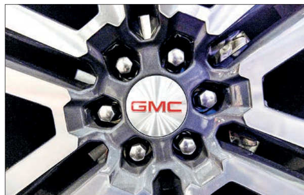
A GMC (General Motors) logo is displayed on a tire hubcap at the AutoMobility LA 2024 auto show at the Los Angeles Convention Centre in Los Angeles on 21 November 2024.

The big US automaker reported a quarterly loss due to costs from restructuring a China initiative, though that was offset by a 2025 earnings forecast that topped analyst expectations. However its projections did not try to quantify