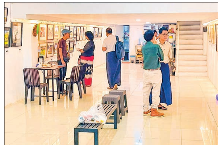
Visitors are seen at the group art exhibition 'Confluence'.