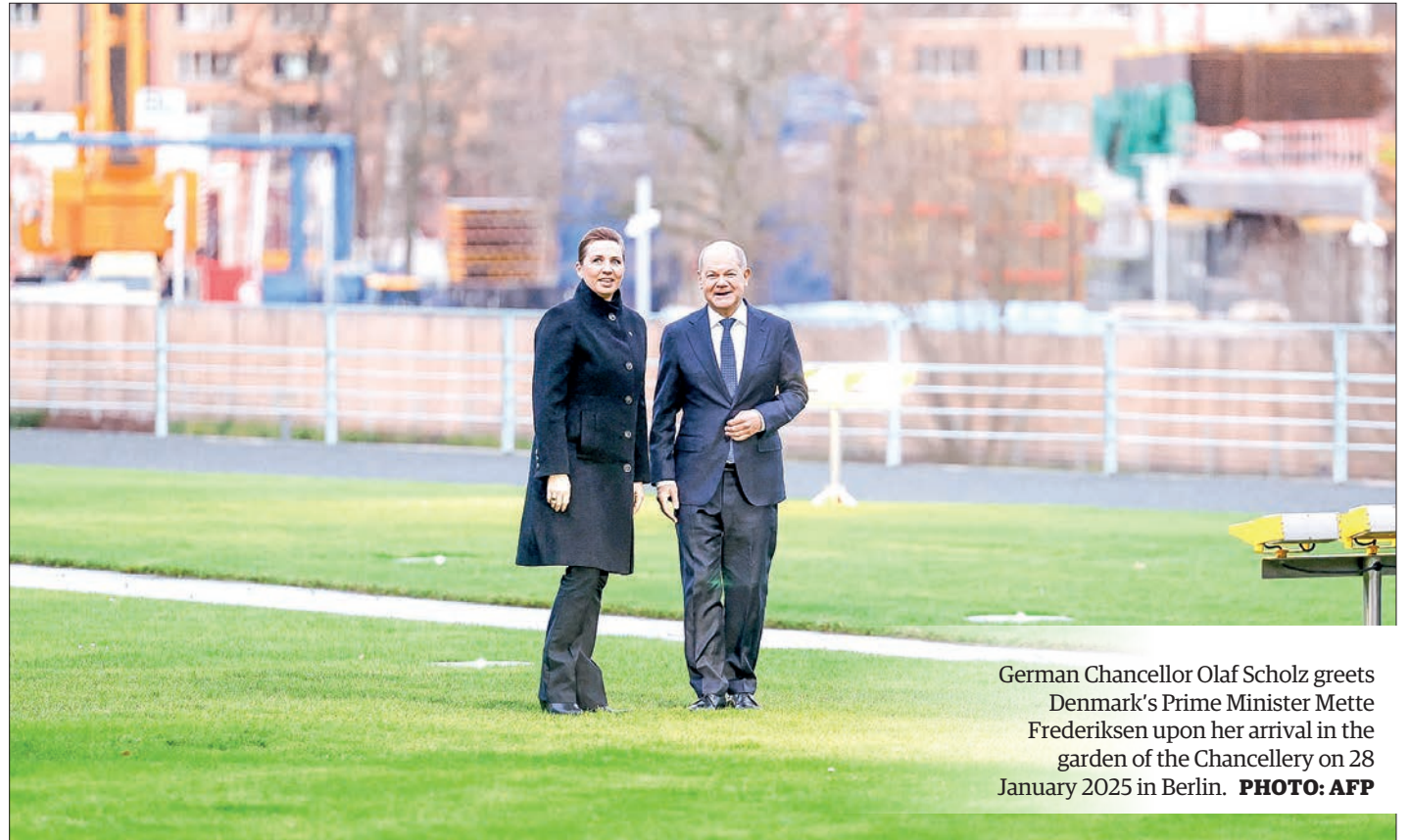
German Chancellor Olaf Scholz greets Denmark's Prime Minister Mette Frederiksen upon her arrival in the garden of the Chancellery on 28 January 2025 in Berlin.

French President Emmanuel Macron, before heading to Brussels later in the day to see NATO Secretary General Mark Rutte.