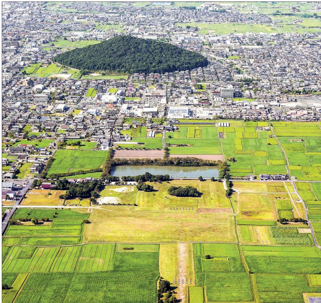
File photo taken on 9 September 2024 shows the site where Fujiwara Palace stood in Kashihara, Nara Prefecture. It is one of the "Ancient Capitals of Asuka and Fujiwara" for which Japan seeks UNESCO World Heritage listing.