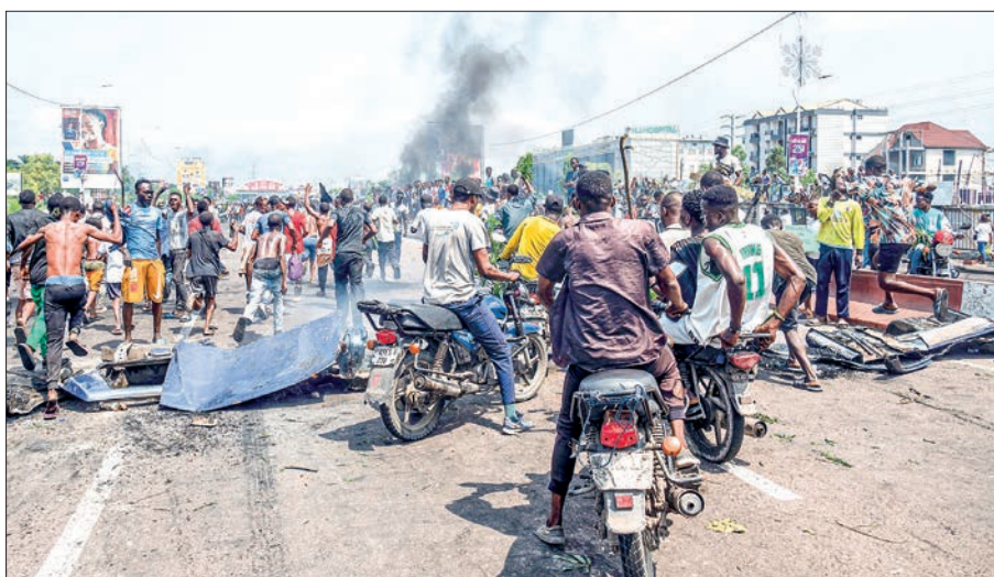
Protesters gather as smoke billows from burning tires during a demonstration against the escalating conflict in eastern Democratic Republic of Congo in Kinshasa on 28 January 2025. PHOTO: AFP

The main city in eastern Democratic Republic of Congo has become a battleground since fighters from the Tutsi-led M23 armed group and Rwandan forces entered central Goma on Sunday after a weeks-long advance. — AFP