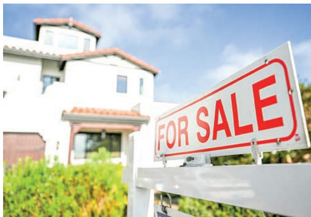
A for sale sign is displayed outside of a home for sale on 16 August 2024 in Los Angeles, California. United States real estate industry rules governing agent commissions will change on 17 August as part of a legal settlement between the National Association of Realtors and home sellers.

"The market for new homes has held up better than that for existing ones thanks in part to widespread use by builders of incentives, including mortgage rate 'buydowns' in which they make up-front payments on customers' behalf to lower mortgage costs," noted Bloomberg. — Xinhua