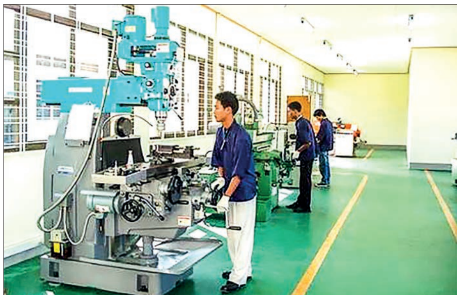
Trainees engage in a practical training session.

THE No 2 Industrial Training Centre (Mandalay) of Department of Industrial Collaboration under the Ministry of Industry, will conduct one-year Industrial Skills Training (Batch 13) from 5 May