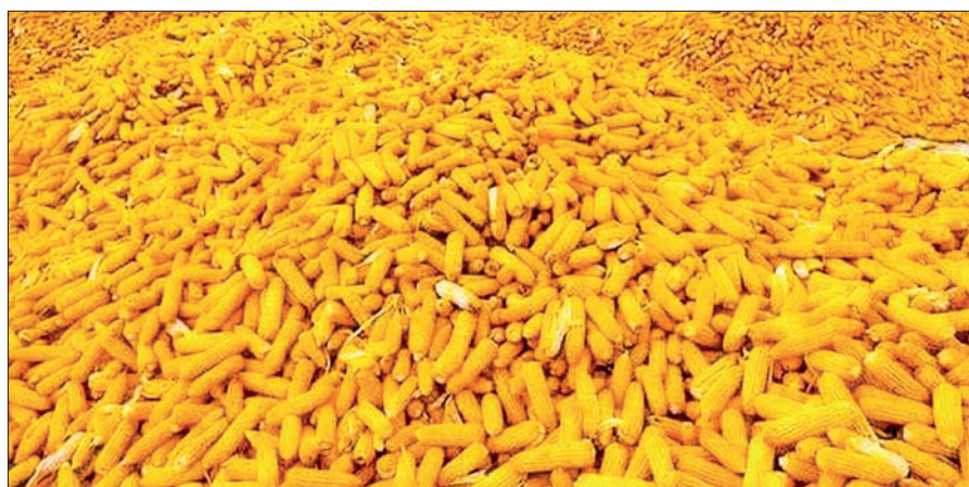
This photo features corn feedstuffs, a key raw material for livestock feed.

Myanmar's maize is primarily exported to the Philippines, Vietnam, China and India through maritime trade. They are also sent to neighbouring countries at borders.