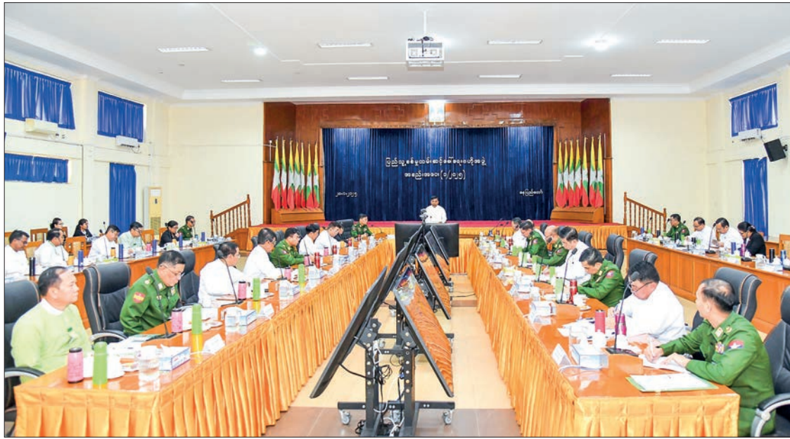
The first meeting of the Central Body for Summoning People's Military Servants in progress yesterday, chaired by SAC Member Deputy Prime Minister MoD Union Minister General Maung Maung Aye.

Therefore, the relevant officials should take effective actions against those who commit destructive actions against the People's Military Service Law, and there are also completed le-