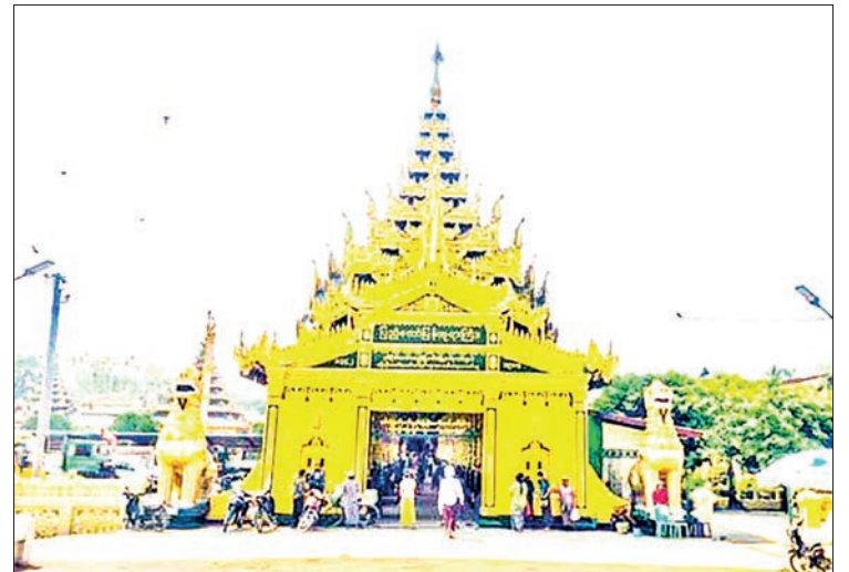
This image showcases pilgrims at the Zalun Pyidawpyan Pagoda.