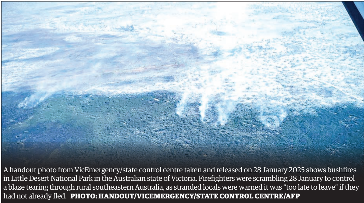
A handout photo from VicEmergency/state control centre taken and released on 28 January 2025 shows bushfires in Little Desert National Park in the Australian state of Victoria. Firefighters were scrambling 28 January to control a blaze tearing through rural southeastern Australia, as stranded locals were warned it was "too late to leave" if they had not already fled.

FIREFIGHTERS were desperately trying to stop a cluster of fast-moving blazes in southeast Australia on Tuesday, as thousands of acres of national park burned and a farming community was forced to evacuate. Lightning strikes on Monday evening ignited several fires in the Grampians National Park, a forested mountain range about 300 kilometres (186 miles) west of Victoria's state capital Melbourne.