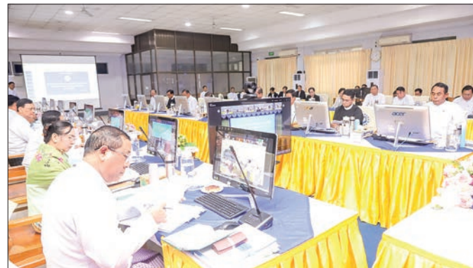
The seventh meeting of the Myanmar National Committee on the Elimination of Child Labour underway yesterday, addressed by SAC Member Union Minister Lt-Gen Yar Pyae.

stakeholders, including government bodies and civil soci-