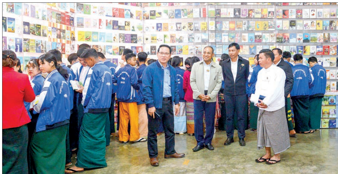
Union Minister U Maung Maung Ohn (L) is pictured during the inaugural event for “Developing Libraries and Raising Reading Habits” in Taunggyi yesterday.

He also mentioned the guidance of the Head of the State highlighting “an illiterate person is like a person sitting who don’t move forward while a literate person is like a walking person”,