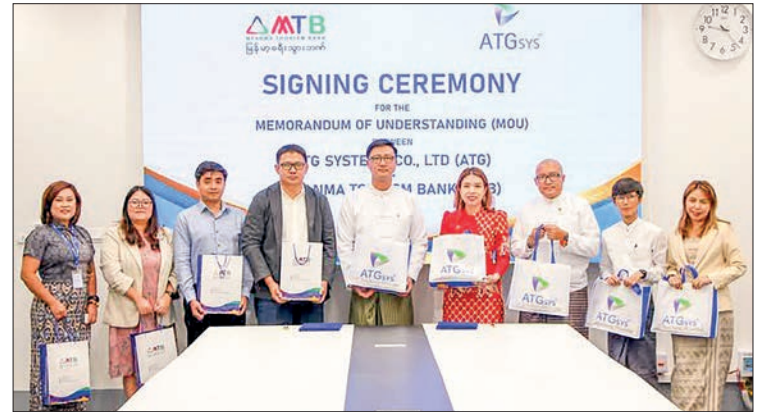
The MTB and ATG Systems Group pose for the documentary group photo during the signing ceremony.