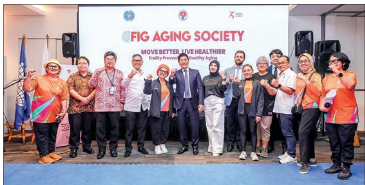
International Gymnastics Federation President Morinari Watanabe (6 th from L) poses with people involved in the Aging Society Programme at a launch event in Jakarta on 23 January 2025.

THE International Gymnastics Federation recently launched an exercise programme for the elderly in Indonesia aimed at helping the country reduce healthcare costs and demonstrate that sports can make a social contribution beyond providing entertainment.