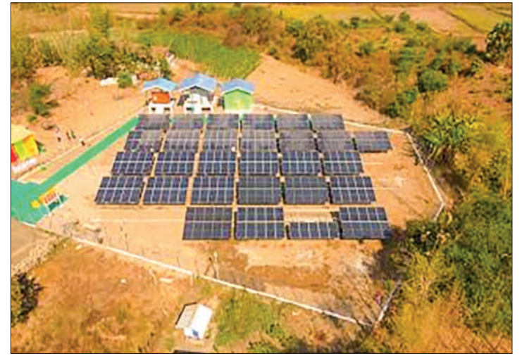
This photo reveals a small-scale solar power plant in Htainpinmyaung village in Kyangin Township, Ayeyawady Region.

“For this year, rural electrification projects using solar home systems are being implemented in villages within Shan State (East) and Ayeyawady Region, funded by more than K8 billion from the Union Budget Fund. Additionally, two villages in Bokpyin Township, Tanin-