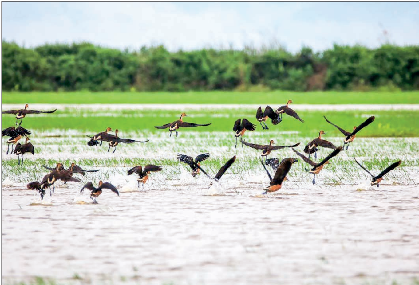
This photo captures hibernating birds at the Moeyungyi Wetland Wildlife Sanctuary in Bago Region.