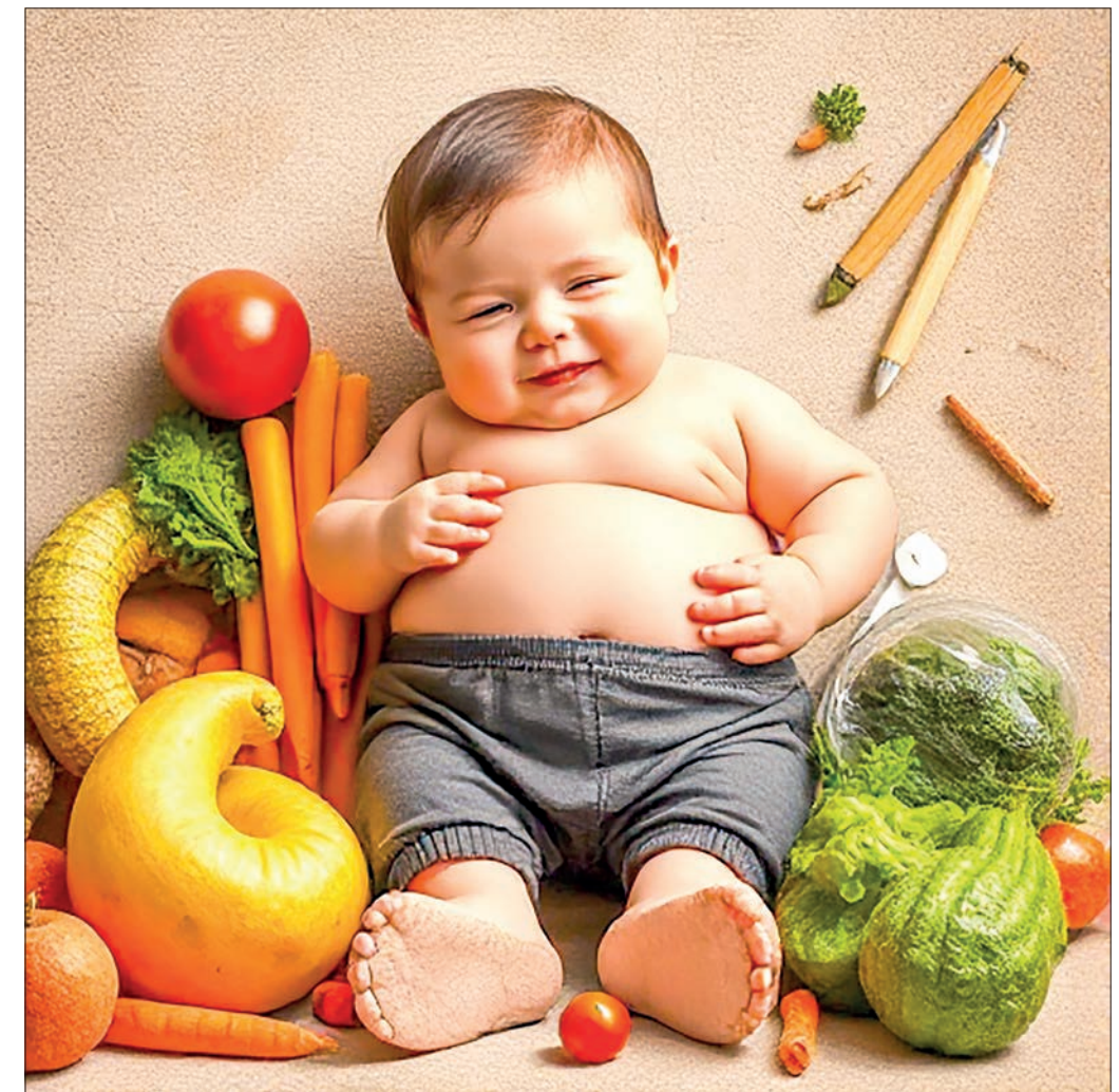
The study involved 6,713 individuals, with a median age of 12.1 years at the start of treatment. ILLUSTRATIVE IMAGE: CONCEPT ART

Overall, better obesity treatment responses were associated with improved long-term health outcomes, including lower risks of type 2 diabetes, hypertension, dyslipidemia, and