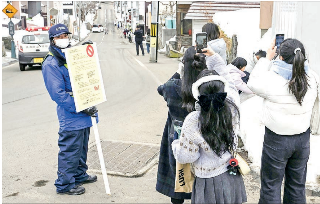
A security guard (L) holds up a sign with warnings as tourists take photos at Funamizaka slope in Otaru, Hokkaido, on 28 January 2025.

The spot, Funamizaka slope, is a key location for the 1995 Japanese movie "Love Letter", which enjoyed great popularity in China and South Korea. Complaints have risen over tourists blocking narrow roads to take photos of the slope, which has