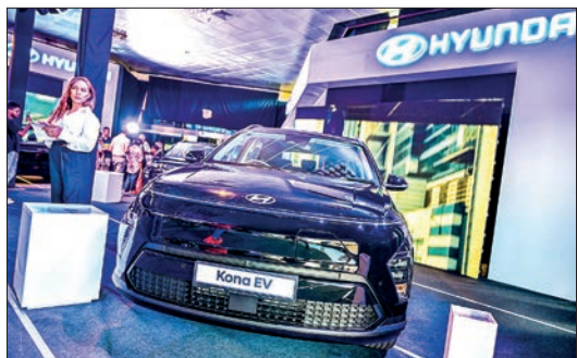
Visitors look at cars at a motor show in Colombo on 6 December 2024.

SRI Lanka announced the lifting of a five-year ban on vehicle imports Tuesday as the country showed further signs of emerging from its worst economic meltdown.