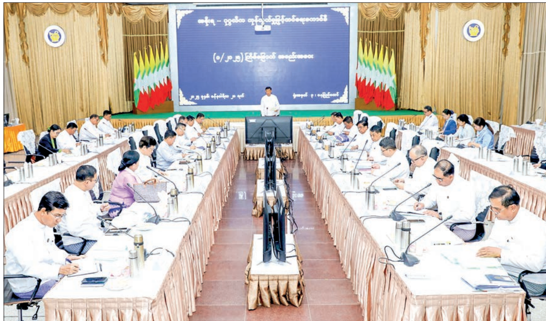
The first meeting of the Government-Private Trade Promotion Council in progress yesterday, presided over by SAC Member Deputy Prime Minister MoTC Union Minister General Mya Tun Oo.

He added that the relevant departments and organizations