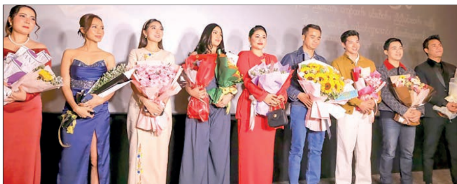
Artistes attending the launch event of the drama series 'Kyaylatka Mee Eain Shin' (The Rural Lamp Owner).