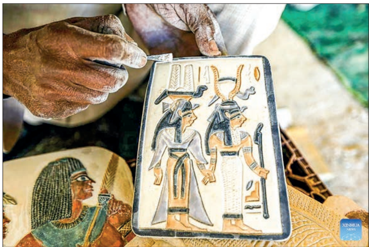
An artisan works on an alabaster artwork at a workshop in Luxor, Egypt, on 10 January 2025. PHOTO: XINHUA

Though alabaster carving once faced decline, it now enjoys a resurgence fuelled by younger generations' interest. — Xinhua