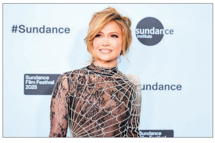
Jennifer Lopez attends the "Kiss Of The Spider Woman" Premiere during the 2025 Sundance Film Festival at Eccles Centre Theatre on 26 January 2025 in Park City, Utah.

"It's about how love can cure any divide. These two people who couldn't be more different in this cell together — doesn't matter their sexuality, their political beliefs. None of