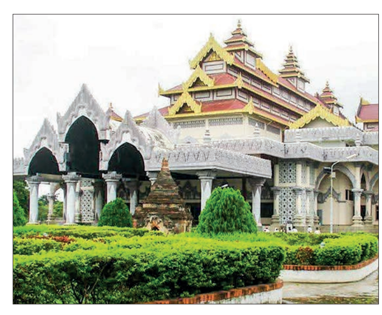
This image showcases the Bagan Archaeological Museum.

At present, there is the arrival of 100-200 local visitors