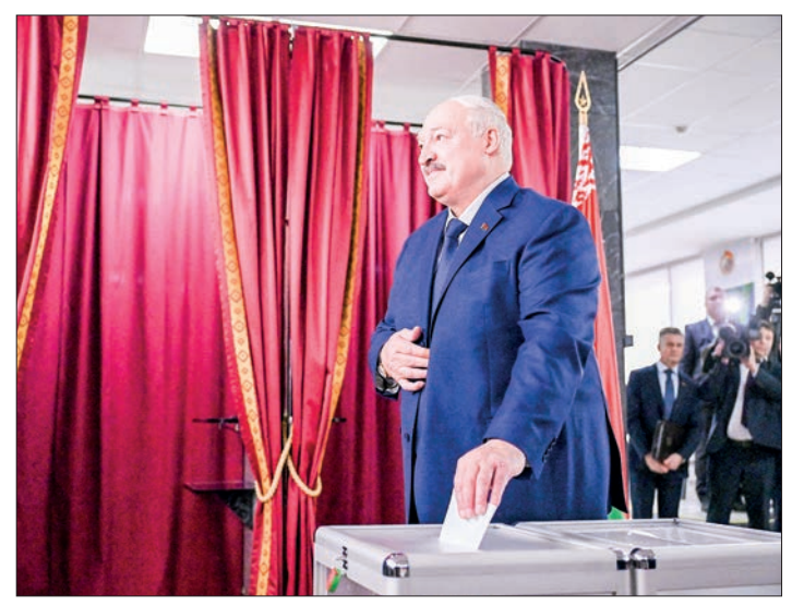
Belarusian President and presidential candidate Alexander Lukashenko casts his ballot during Belarus' presidential election at a polling station in the capital Minsk on 26 January 2025.

elected by direct ballot and the term of office is five years. The Belarus election commis-