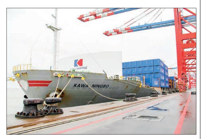
Photo taken on 24 January 2025 shows the "KAWA Ningbo" cargo ship of the "China-Europe Express" in Wilhelmshaven, Germany. The first container ship of the "China-Europe Express", the fastest direct route connecting Europe and China's Yangtze River Delta region, arrived at its destination at the Jade Weser Port in Wilhelmshaven on Friday.

For industries like automotive, lithium batteries, and solar energy, where time-sensitive, high-value goods are the norm, this efficiency can