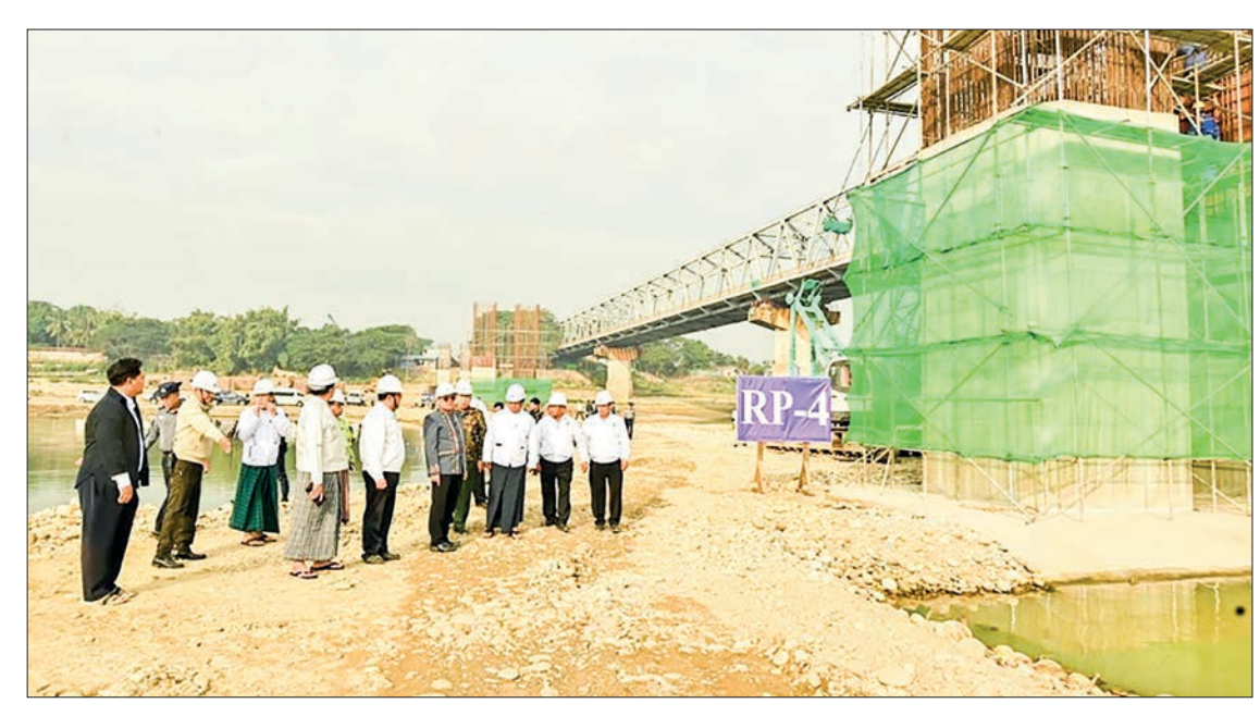
This photo shows officials inspecting the construction site of the Bala Min Htin Bridge II.

Once completed, the new bridge will span a length of 979 metres (about 3,212 feet) and feature bored pile concrete piers and reinforced concrete platforms. It will incorporate a Steel Box Girder and RCC Slab structure. The bridge will have a carriageway width of over 27 feet and a load capacity of up to 75 tonnes.