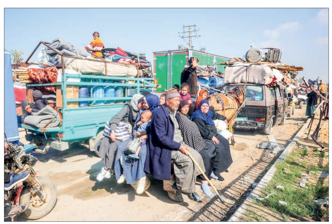
Displaced Gazans ride in the back of a horse-drawn cart as they cross the Netzarim corridor from the southern Gaza Strip into the northern part on 27 January 2025.

ASSES of displaced Palestinians began streaming towards the