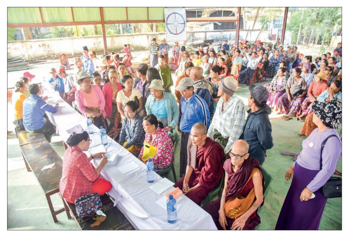
Tatmadaw medical team provides treatments to monks and local people in Pyapon.

TWO Tatmadaw vessels — the Shwepuzun and the Saku — arrived in Dhaminseik village, Pyapon Township, Pyapon District, with Tatmadaw doctors, specialists and medical officers to provide healthcare services to the