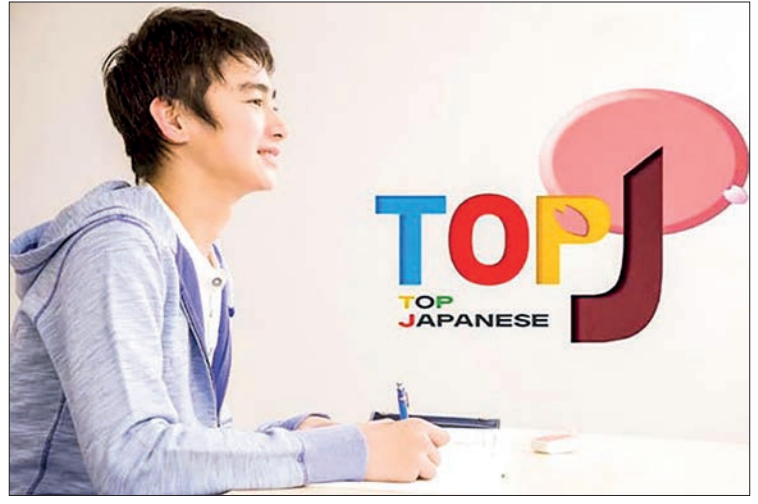
TOP-J exam logo and a student.

APPLICATIONS, for TOP-J which is scheduled on 9 March 2025 in Yangon and Mandalay, will be accepted starting on 27 January, announced by Myanmar Association of Japan Alumni (MAJA).