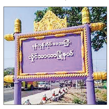
Hlinethaya Township entrance.

"Now, buyers go to observe with the help of agents so they have more options. Some buyers choose a property based on wards and some do based on their likes such as price, building condition and location. So, we can't say which wards are the most attractive for buyers," he added. — Thit Taw/ZS