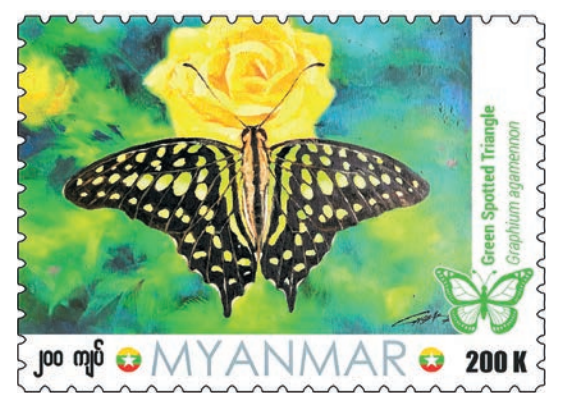
New postage stamp featuring the "Green Spotted Triangle" butterfly.

THE Myanma Post under the Ministry of Transport and Communications, in collaboration with the Ministry of Natural Resources and Environ-