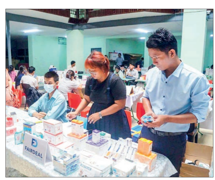
Pharmaceuticals are being sold at distribution prices of the pharma companies.

"The companies started to sell hard-to-find medicines at Myanmar Trade Promotion Organization's office in Yangon on Merchant Road in Pabedan Township, Yangon, on 17 July. The sales will expand to a place located in the compound of Nawade Cinema in Mayangon Township, Yangon, and the sales centre on the first floor of the Thiri Oattha Market in Bago Region on 29 July. The pharma sales in Pyinmana happened on 12-17 August 2024. It is the second time for the pharma fair in Pyinmana, at the distribution price of the companies on 27-31 January. Individuals can