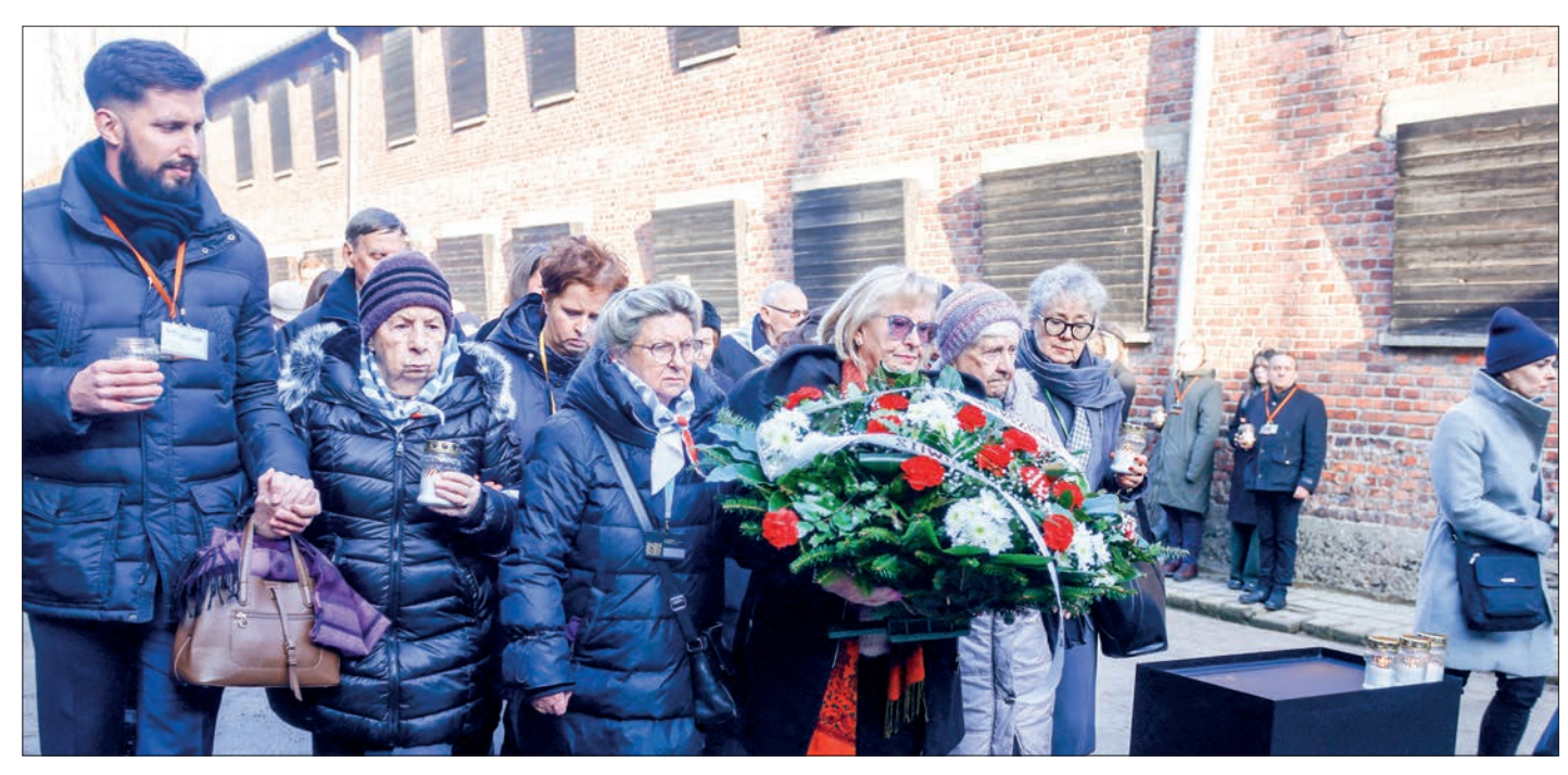
Survivors, relatives and representatives of the Memorial and Museum Auschwitz-Birkenau lay wreaths and light candles at the so-called Death Wall next to the former Block 11 of the former Auschwitz I main camp in Oswiecim, Poland on 27 January 2025, during commemorations on the 80<sup>th</sup> anniversary of the liberation of the German Nazi concentration and extermination camp Auschwitz-Birkenau by the Red Army.

Speaking to AFP ahead of the anniversary, survivors around the world