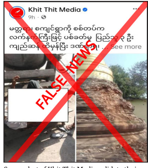
Screenshot of Khit Thit Media validate their

In response to the incident, a relevant official explained that security forces are maintaining control of the area and performing security duties under the law to prevent terrorists from hiding and to ensure the safety of the people. Security forces did not fire at villages without any reason. Terrorists are attacking with heavy weapons inside villages to disrupt the stability and peace of the region and to instil fear in villages that have no support for them. These attacks have destroyed homes and the deaths, injuries, and harm to innocent civilians. As such, malicious media spread misinformation on social media to mislead people about security forces. — MNA/TTA