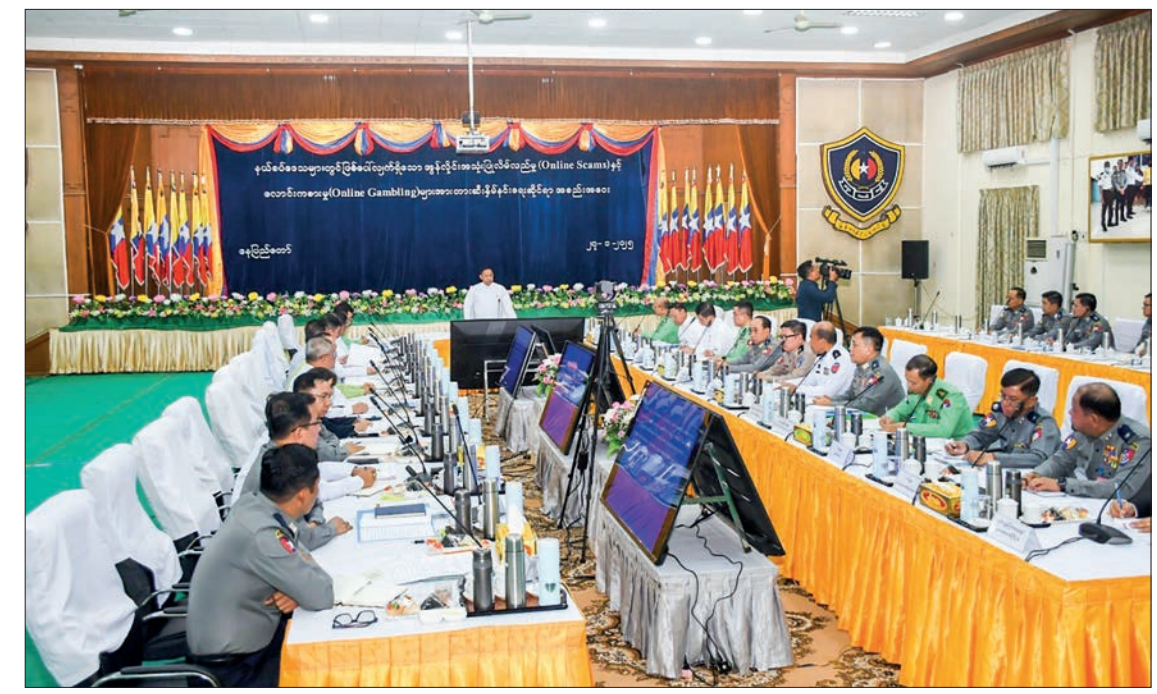
A meeting on combatting online scams and online gambling in border areas in progress in Nay Pyi Taw yesterday, attended by SAC Member Union Home Affairs Minister Lt-Gen Yar Pyae.

Speaking at the meeting, the Union minister said the online scams are connected with financial fraud, human trafficking, drugs, forced labour and money laundering. The foreigners who face difficulties are recused and transferred to their respective countries. Although some entered the country illegally through some neighbouring countries, the government did not take action on humanitarian grounds and bilateral relations