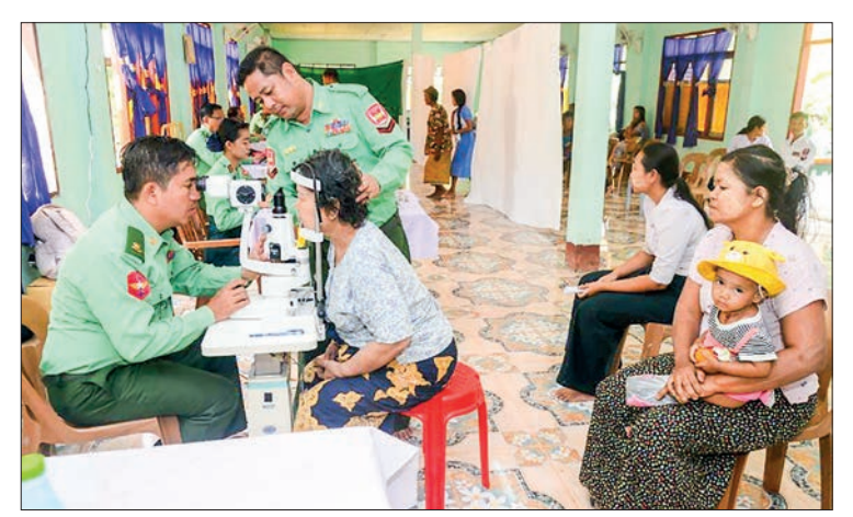
Tatmadaw medical officer examines an eye patient at Zadetgyi Island Kawthoung of Taninthayi Region.

Two patients in need of hospital care were sent to the nearest Tatmadaw hospitals for further treatment.