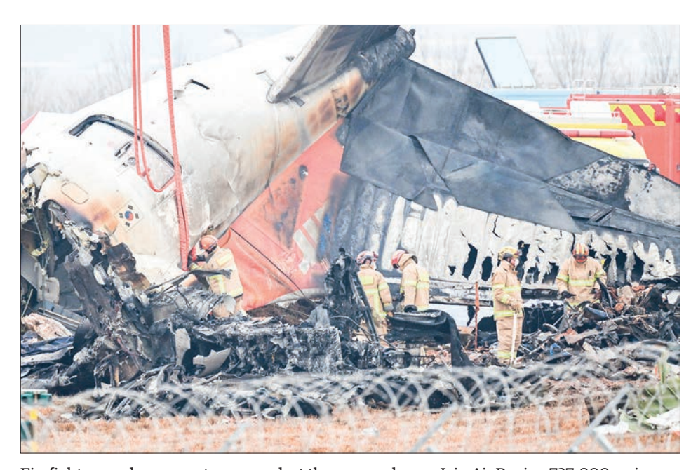
Firefighters and recovery teams work at the scene where a Jeju Air Boeing 737-800 series aircraft crashed and burst into flames at Muan International Airport in Muan, some 288 kilometres southwest of Seoul on 30 December 2024.

BIRD feathers and bloodstains were found in both engines of the Jeju Air plane that crashed in December, according to a preliminary investigation released Monday.