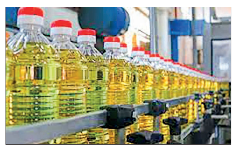
Cooking oil bottles are arranged for sale at the supermarket.

The domestic palm oil consumption is estimated at one million tonnes per year. The local palm oil production is just about 400,000 tonnes. About 700,000 tonnes of palm oil are yearly imported through Malaysia and Indonesia to meet domestic demands. — NN/KK