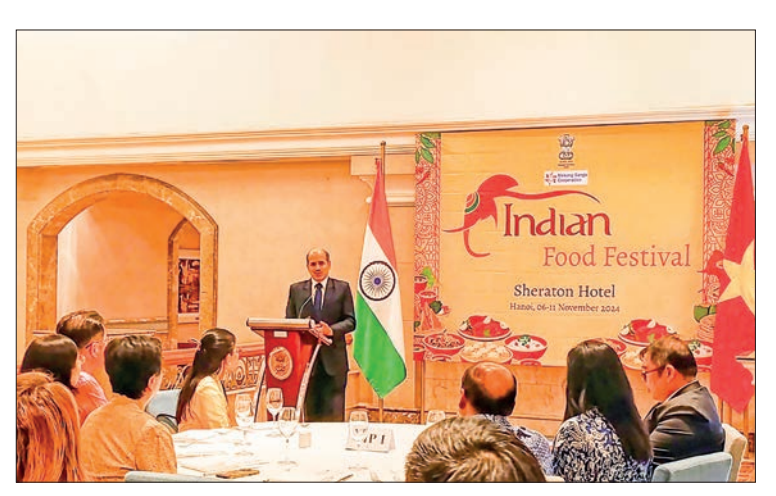
This photo depicts the Indian Food Festival held in Hanoi on 11 November 2024.

event, the Indian Embassy held the 2025 World Hindi Day celebrations on 10 January to pro-