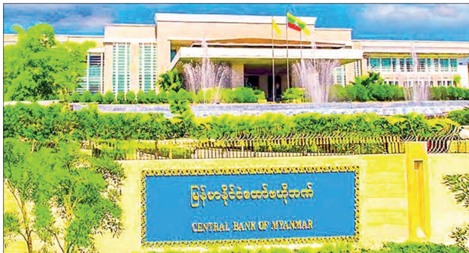
The facade of the Central Bank of Myanmar (CBM) in Nay Pyi Taw.

CBM aims to curb the instability in the foreign exchange market and the currency devaluation. According to CBM's notification on 15 March, it has been joining with law enforcement agencies to combat and prosecute those who attempt to manipulate the currency market under the existing