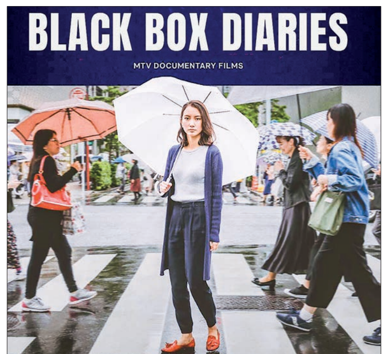
Black Box Diaries, directed by Shiori Ito, is included in the nominees for this year's Academy Awards in the long-form documentary category.

The use of unauthorized security footage has raised questions about its screening in Japan, with the final decision pending.