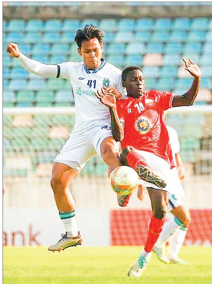
Yangon United and Rakhine United players in action during the Myanmar National League match.