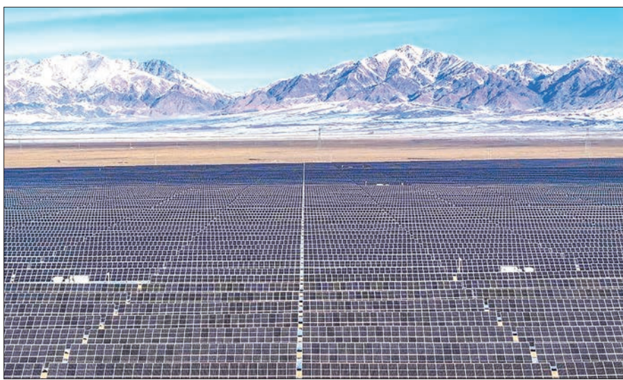
An aerial drone photo taken on 6 January 2025 shows a partial view of the Shichengzi photovoltaic power station in Hami City, northwest China's Xinjiang Uygur Autonomous Region.

New energy storage refers to energy-storage technologies other than conventional pump storage. An energy-storage system charges when wind power or photovoltaic power generates a large volume of electricity or when the power consumption is low, and it discharges otherwise. — Xinhua