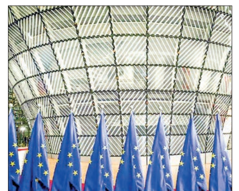
The 27-nation EU is scrambling to revamp its economic competitiveness.

EU chief Ursula von der Leyen told this week's gathering of the world's elites in Davos that Brussels "must make business much easier all across Europe". — AFP