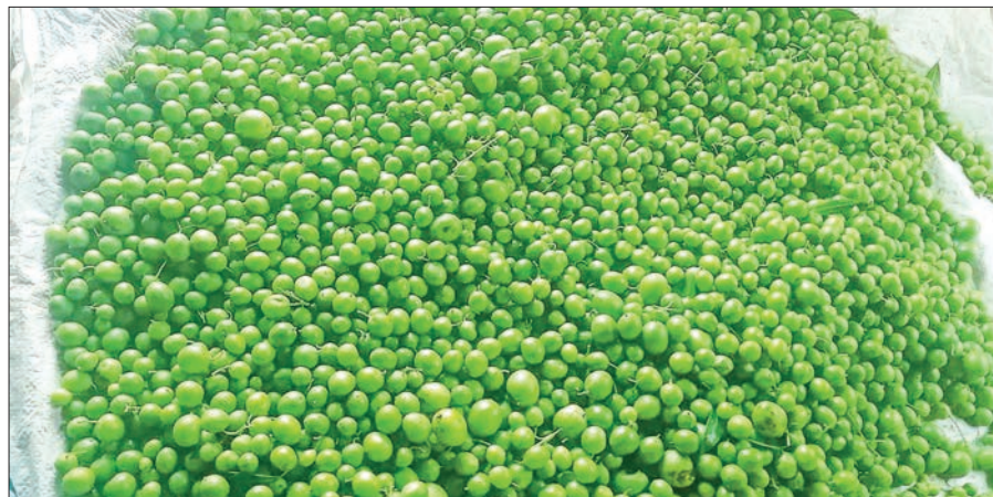
This image depicts Myeik's seasonal Marian plums.

Currently, there are many orders by not only Myanmar people in Thailand but also Thai people as they use it in restaurants.