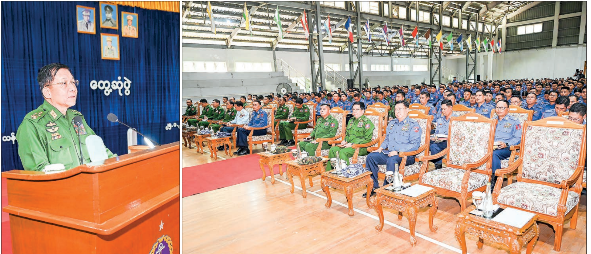
State Administration Council Chairman Defence Services Commander-in-Chief Senior General Min Aung Hlaing delivers a speech at a meeting with Tatmadaw members and their families at the Thanlyin Station, Yangon Command, Yangon Region, yesterday.