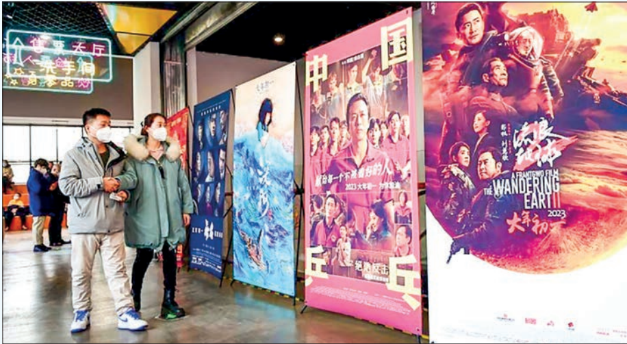
China's film market shows strong 2025 start, with Spring Festival pre-sales surpassing 525 million yuan, boosting optimism.