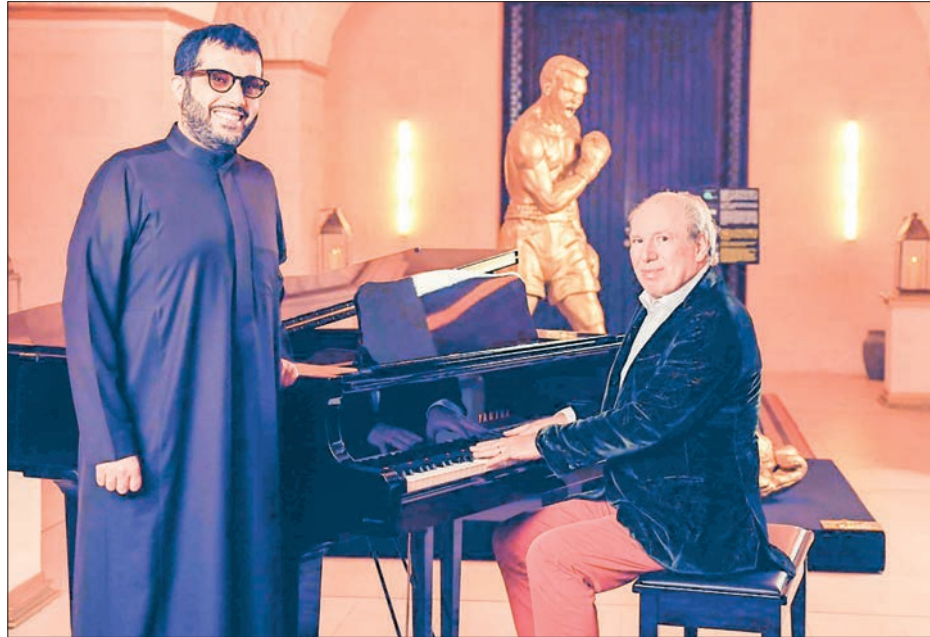
Saudi Arabia has enlisted Oscar-winning composer Hans Zimmer to rework its national anthem.

all these projects and I hope we will reach a final agreement on them," he said.