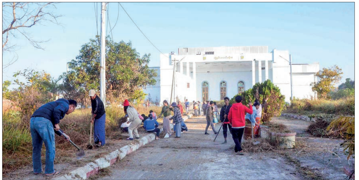
This photo shows office staff cleaning Loikaw University in Loikaw, Kayah State, yesterday.

He also visited the Loikaw-Lawpita Road (3.5 kilometres long, 18 feet wide) upgrade project from asphalt to asphalt-concrete (AC) and inspected the 100 per cent completion of the Loikaw-Lawpita Road Well Graded Layer (8 inches), 3.5 kilometres long, 20 feet wide road project and the progress sites of asphalt concrete (AC) road paving, hard shoulder paving and roadside drainage excavation. The Deputy Director of the State Road Department explained in detail the completion of the work and the ongoing work. The Kayah State chief minister directed that the work site be safe, meet the specified standards, ensure good drainage, and allow people to