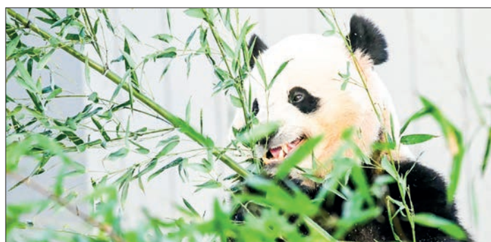
Giant panda Bao Li eats bamboo during the public debut at the Smithsonian's National Zoo in Washington, DC, on 24 January 2025.

After reopening cinemas, allowing women to drive and admitting the first non-Muslim tourists in 2018, the makeover has gone into overdrive with a slew of mega-projects including resorts and NEOM, a futuristic city in the desert costing $500 billion. — AFP