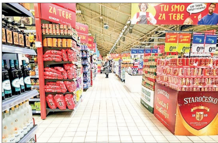
Many stores in Croatia were nearly empty on Friday as consumers heeded a shopping boycott over high prices.

SUPERMARKET aisles were quiet across Croatia on Friday as consumers protested high food prices by joining a boycott