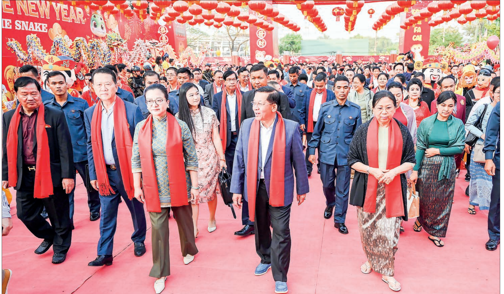
Chairman of the State Administration Council Prime Minister Senior General Min Aung Hlaing and his wife Daw Kyu Kyu Hla attend the Chinese New Year celebration in the Year of Snake for 2025 held at the National Indoor Stadium I in Thuwunna of Yangon yesterday.