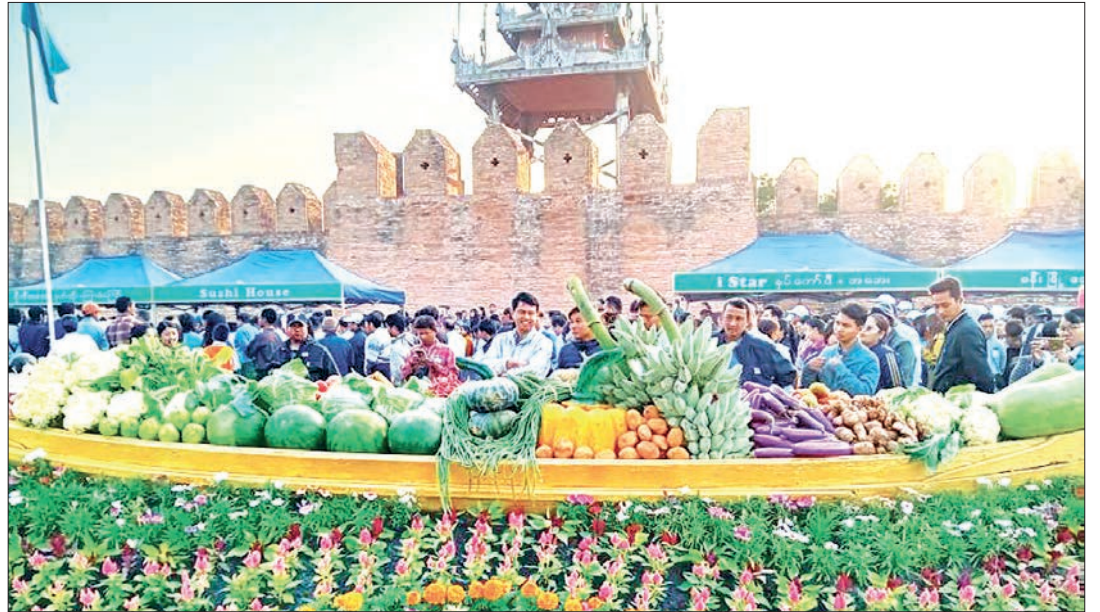
This photo showcases the Mandalay Mayor's Cup Vegetable, Fruit and Horticultural Show in the previous year.

The Chinese Embassy in Yangon celebrated the Chinese New Year reception at the Inya Lake Hotel yesterday evening, attended by SAC Member Deputy Prime Minister and Union Minister at the Prime Minister's Office Admiral Tin Aung San, on behalf of State Administration Council Chairman Prime Minister Senior General Min Aung Hlaing.