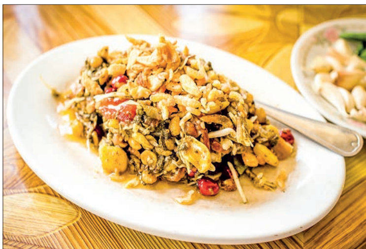
This photo of Myanmar tea leaf salad is a delicacy with a combination of textures and many flavours including green tea leaf, vegetables and crunchy beans.

In turn, scenic charter train services including the Aungban-Kalaw and Kalaw-Myindaik rail sections with a capacity of 15 passengers per train have been operational since 24 January. — ASH/KZL