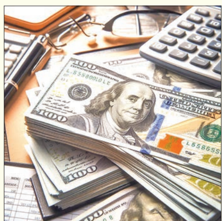
Greenbacks at the exchange counter.

the market rate depending on supply and demand, starting from 5 December 2023. — NN/KK