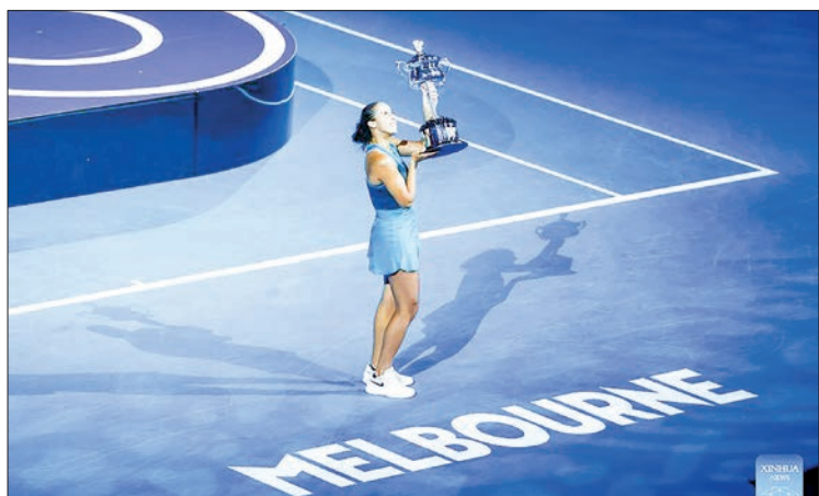
Madison Keys poses with the trophy during the awarding ceremony after the women's singles final between Aryna Sabalenka of Belarus and Madison Keys of the United States at Australian Open tennis tournament in Melbourne, Australia, 25 January 2025.

AMERICAN Madison Keys, 29, lifted her first Grand Slam trophy on Saturday after denying