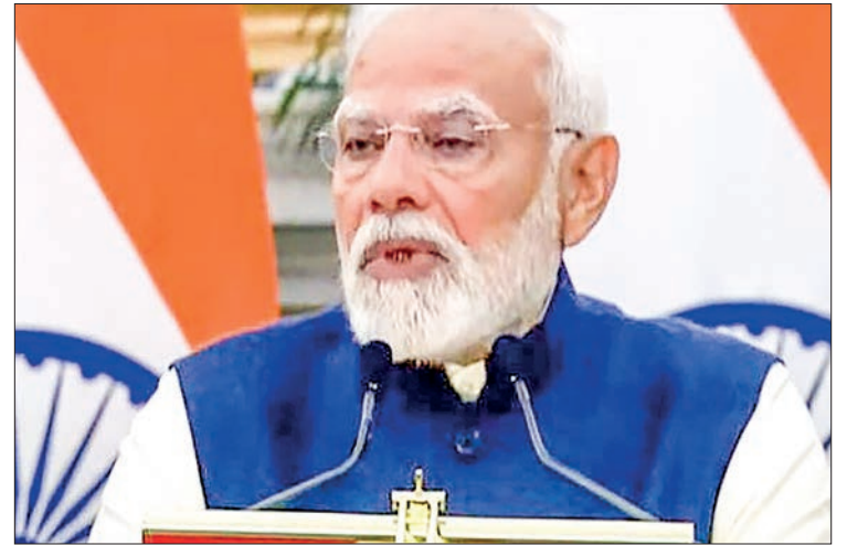
India and Indonesia have agreed to strengthen their cooperation in the defence sector, particularly in defence manufacturing and supply chains.

PM Modi said that he held "comprehensive discussion" with Prabowo Subianto on various aspects of mutual cooperation. — ANI