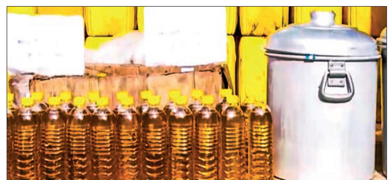
Palm oil bottles are organized for sale in the market.

The domestic palm oil consumption is estimated at one million tonnes per year. The local palm oil production is just about 400,000 tonnes. About 700,000 tonnes of palm oil are yearly imported through Malaysia and Indonesia to meet domestic demands. — NN/KK