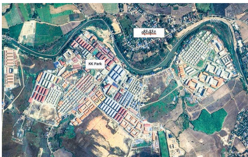
Location map of the KK Park, site of widespread illegal online gambling.