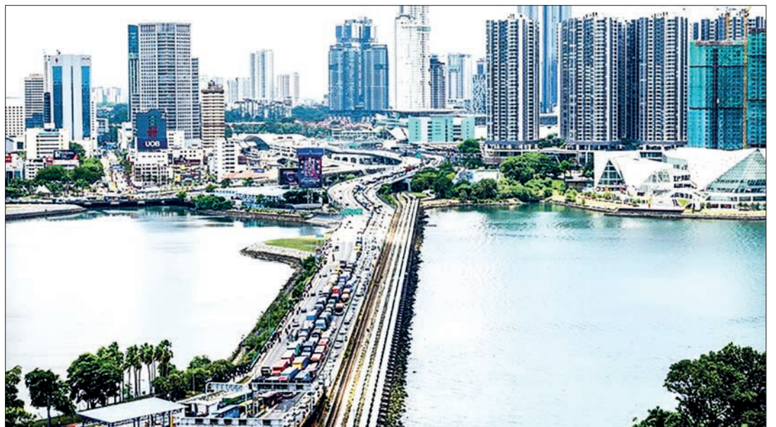
This file picture shows vehicles forming a long queue to enter the Woodlands checkpoint in Singapore on 17 March 2020 from across the causeway of the southern Malaysian state of Johor.

On 20 December 2024, a record-breaking 562,000 crossings were recorded in a single day, surpassing the previous high of over 553,000 on 13 December 2024. — Xinhua