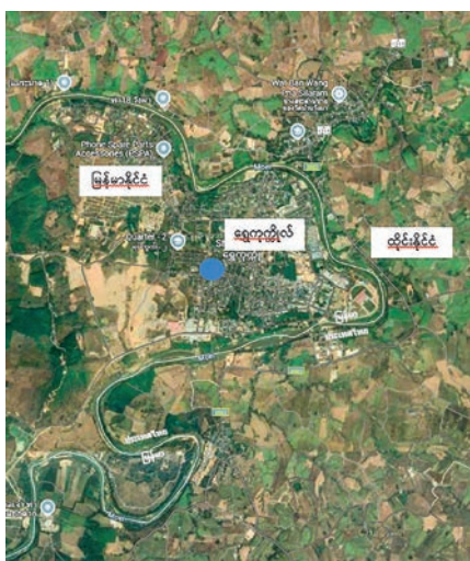
Location map of Myawady-Shwe Kokko, hub of illegal online gambling and related crimes.

In doing so, most of the foreigners illegally enter the country via some neighbouring countries including Thailand to run businesses for their interests. However, the government investigated them under the law and transferred them to their respective countries on humanitarian grounds and bilateral relations. The illegal residents who commit online scams and online gambling are found in border areas including Laukkai, Muse, Tachilek and Myawady and transferred to their countries. From 5 October 2023 to 13 January 2025, 53,388 Chinese were transferred to China, while 648 to Thailand, 20 to Korea, 22 to Laos, 1,149 to Vietnam, 19 to the Philippines, 142 to Malaysia, 21 to Chinese Taipei, two to Singapore, one to Poland, one to Spain, 13 to Russia, 38 to Indonesia, three to Uganda, two to Egypt, three to Cambodia, 96 to India, 13 to Morocco, 29 to Ethiopia, 26 to Nepal, three to Pakistan, two to North Ireland, one to Kazakhstan, two to Kenya, 60 to Sri Lanka, one to South Africa, one to Hong Kong of China, two to Sierra Leone, one to Ghana, one to Burundi and one to Turkmenistan, totalling 55,711 foreigners.