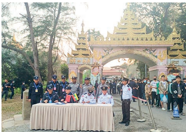
Handover ceremonies for arrested scammers on the Sino-Myanmar border.