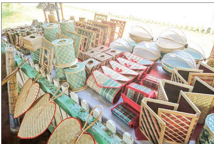
Showcasing Myanmar's bamboo products.

A workshop for promoting bamboo products and export potentials was held on 17 January 2025 at the Ministry of Commerce in Nay Pyi Taw to enhance Myanmar's bamboo sector and bolster bamboo exports, according to the Myanmar Trade Promotion Organization.