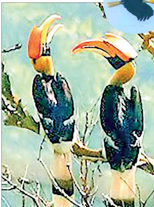
Photos reveal the majestic beauty of hornbills, renowned for their royalty and devotion. They are among the world's most endangered species.

"Myanmar possess 11 species of hornbill out of 60. There are nine species in Taninthayi Region. The Lampi Marine National Park has unique species like mammal bat and hornbill. Most of the hornbills reside in the mangrove forest. Different countries have different shapes of hornbills. For example, the hornbill in India is grey. The ones in Myanmar have huge long yellow beaks and tails, the chest and wings are black,