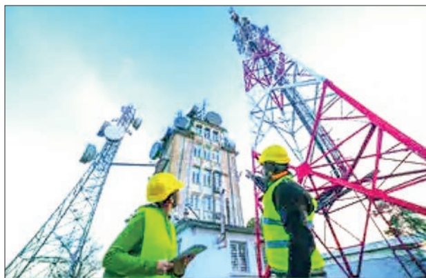
The report stated that the recent developments highlight the challenges faced by the industry in balancing revenue growth and customer retention.

It said "that there is likely to be another round of 15 per cent+ tariff hikes in late 2025. However, we will not be surprised if entry level plans see no tariff hikes". — ANI