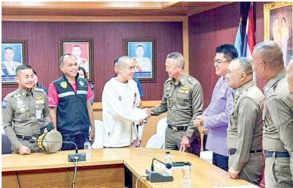
Thai officials welcome Chinese actor Wang Xing, victim of online scam coercion.

The media also expressed the news that the missing Chinese national Mr Wang Xing (actor) at border areas of Thai-Myanmar (Mae Sot-Myawady) was transferred to Thailand through the proper communication of relevant organizations. According to the investigation, Mr Wang Xing was contacted by a Chinese man via WeChat Account of Thai media company GMM Grammy and persuaded to film in Thailand. On 3 January, he left Shanghai, China, for Thailand by flight and arrived at Su-