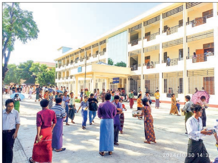
Yenangyoung University Campus with students.

Additionally, graduates of energy-related disciplines will have opportunities to join the Ministry of Energy, with plans to facilitate job placements for