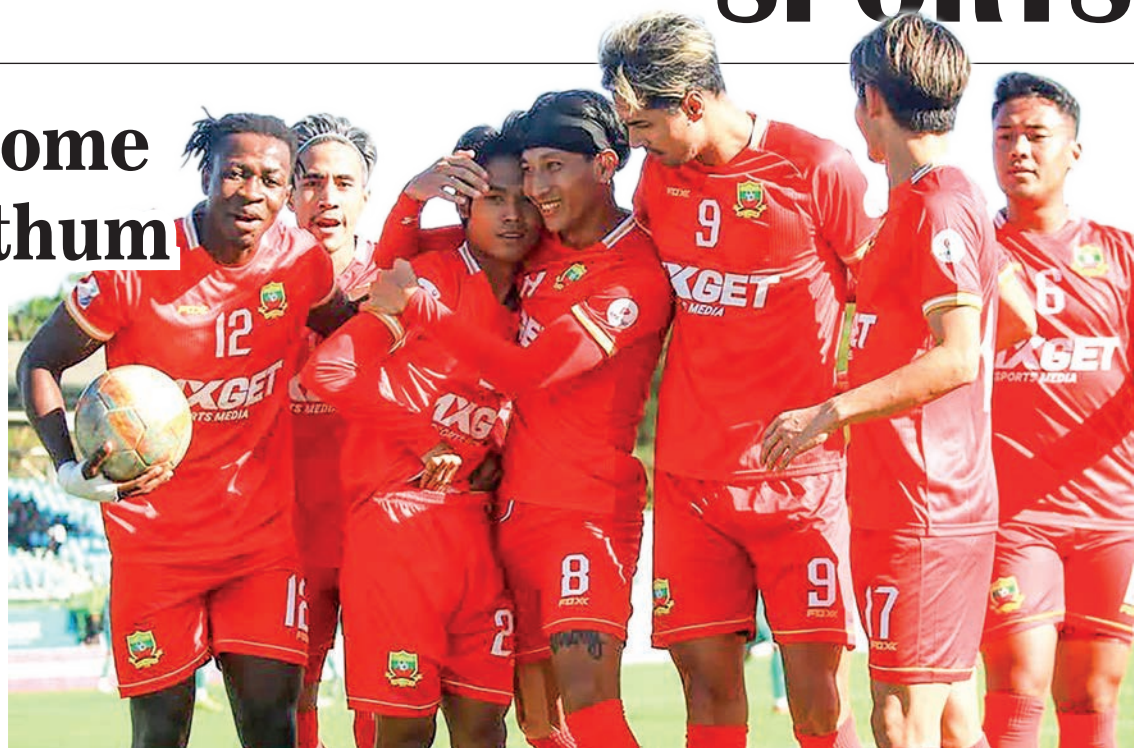
Players from Shan United seen in a group photo during the ASEAN Club Championship.

Shan United FC lost to Vietnamese club Thanh Hoa with a score of 1-3 away in the ASEAN Club competition, Indonesian club Makassar 3-4 away, and Malaysian club Terengganu FC 0-5 at home. The team to face