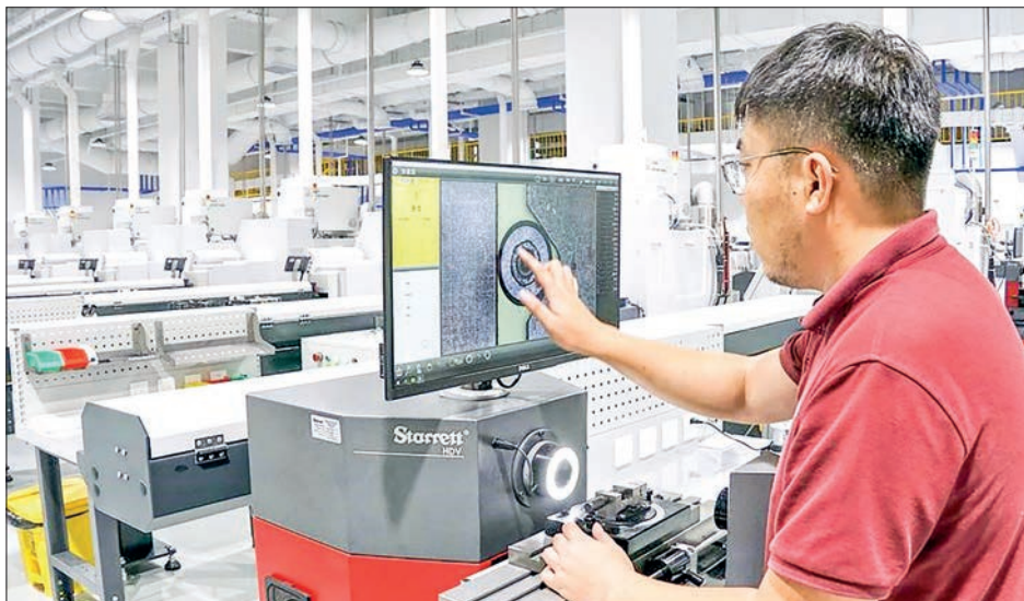
A technician operates a device at a workshop of Beijing CRS Medical Device Co Ltd, a precision manufacturing company specializing in the research, production and sales of sterile dental implants in Beijing, 13 October 2024.

Sectors such as pharmaceuticals and health, green energy and environmental protection, and smart city technologies are witnessing the most substantial growth.