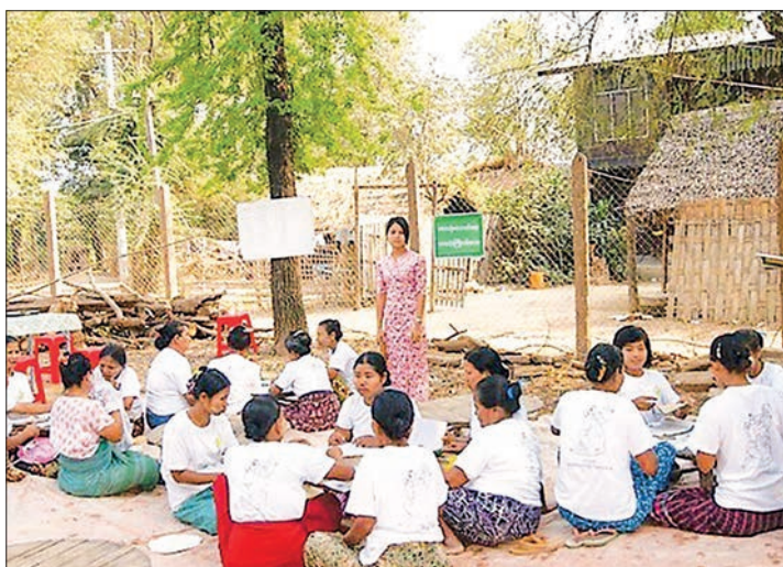
This photo discloses the status of teaching illiterate and out-of-school youths.

In addition to traditional instruction, mobile applications were utilized with the support of the Ministry of Sci-