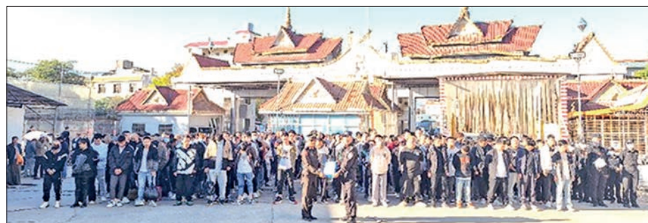
Handover ceremonies for arrested online gambling fraudsters on the land border areas.