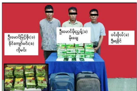
Offenders are seen with seized drugs and related items.