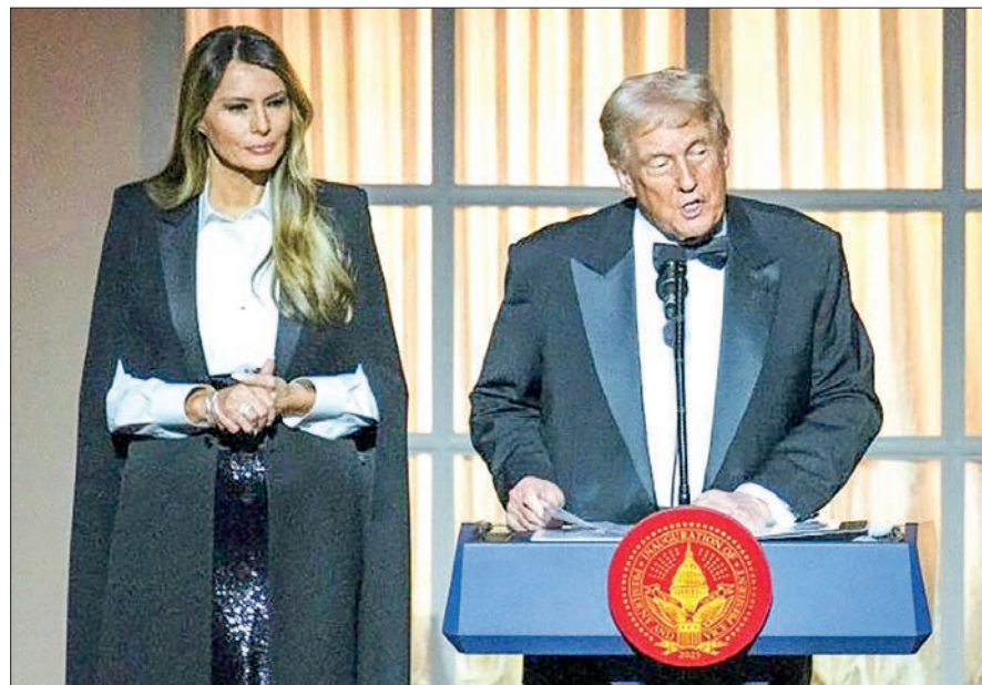
US President-elect Donald Trump and his wife Melania at a candlelight dinner at the National Building Museum in Washington, DC, on the eve of his inauguration.

Trump mentioned that his upcoming executive orders will address border security, energy, federal spending, TikTok, and Diversity, Equity, and Inclusion (DEI) programs.