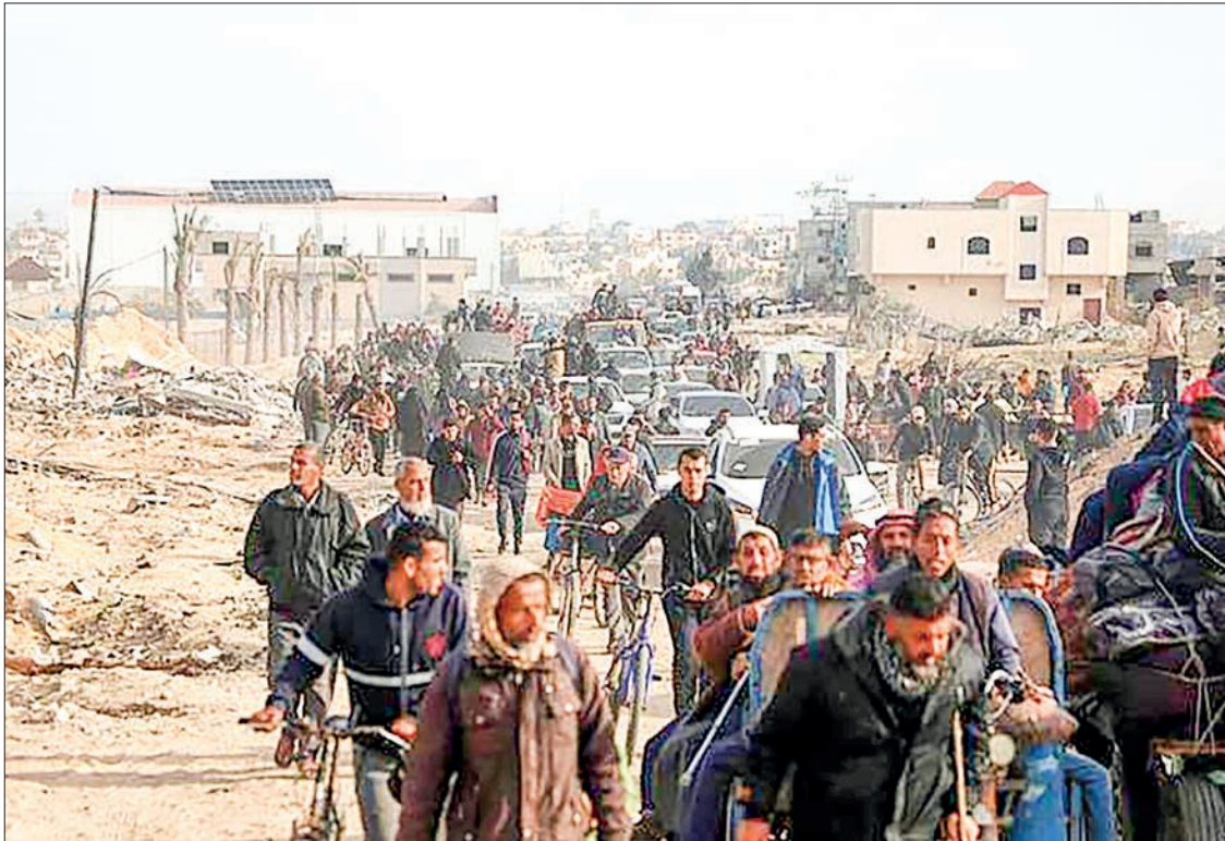
Palestinians return to the southern Gaza Strip city of Rafah on 19 January 2025.

It will be carried out in coordination with international and UN bodies, aiming to expedite relief aid and clear rubble from key infrastructure like hospitals and schools.