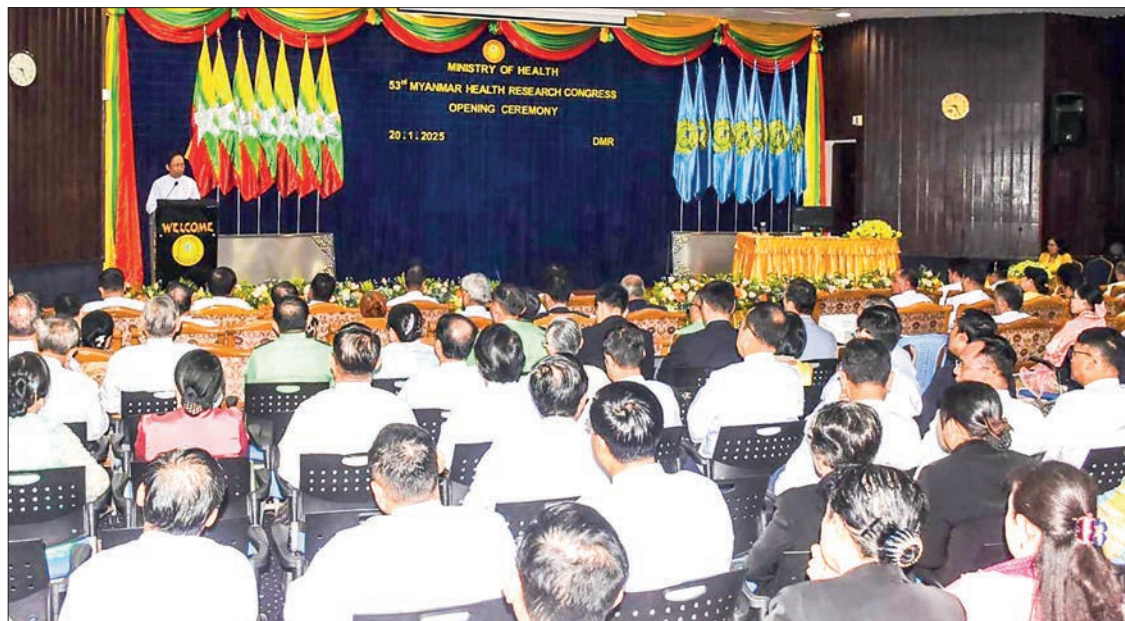
The 53 rd Myanmar Health Research Congress in progress yesterday with Union Health Minister Dr Thet Khaing Win speaking on the occasion in Nay Pyi Taw.