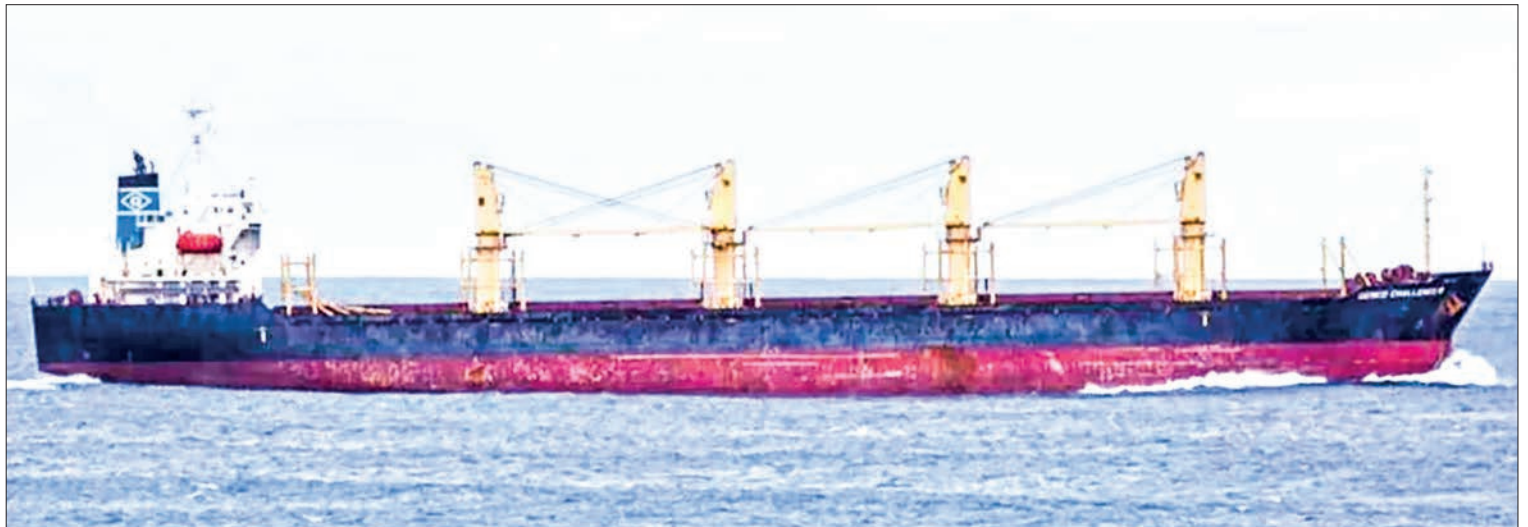
The Business Standard issued in Bangladesh depicts that MV Golden Star arrived in Chattogram with 22,000 metric tonnes of rice from Myanmar on 17 January 2025.

Bangladesh and Myanmar have been cooperating in the rice sector since 2017. The first contract was 100,000 metric tonnes in 2017, the second 100,000 metric tonnes contract was implemented in April 2021, the third was 200,000 metric tonnes in the 2022-2023 financial year and this is the fourth contract which is 100,000 metric tonnes and to be completed between January and