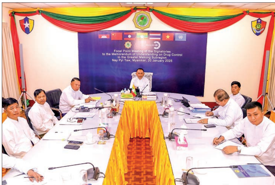
The Central Authorities Meeting of the Mekong MoU on Drug Control member states underway online yesterday.