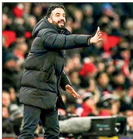
Manchester United boss Ruben Amorim.

RUBEN Amorim might not have been historically accurate when he labelled his Manchester United flops as "maybe the worst team" in the club's history, but his astonishing claim did expose the extent of the problems facing the beleaguered boss.