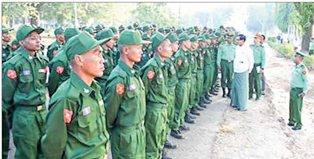
The opening of the People's Military Service Training 9 in progress.

The People's Military Service Law, enacted on 10 February 2024 aims to educate citizens in military knowledge and prepare them to safeguard the nation's defence, unity, and sovereignty. The inaugural course, People's Military Service Training 1 began on 8 April 2024 and produced disciplined and dedicated trainees who are now actively serving in respective battalions and units and contributing to national defence and security responsibilities effectively.