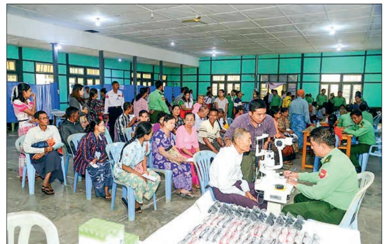
Kyunsu locals receive healthcare services from the Tatmadaw mobile hospital ship.

Local Tatmadaw officials visited the site to observe the healthcare activities, offer support, coordinate logistical needs, and provide encouragement to the residents receiving medical care.