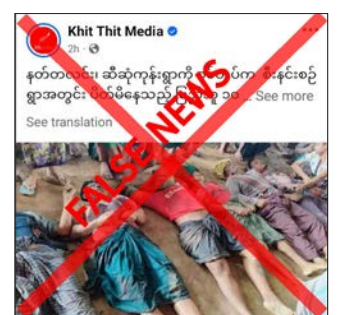
This screenshot validates misinformation.

These false claims were circulated by malicious media outlets, intending to defame security forces. — MNA/MKKS