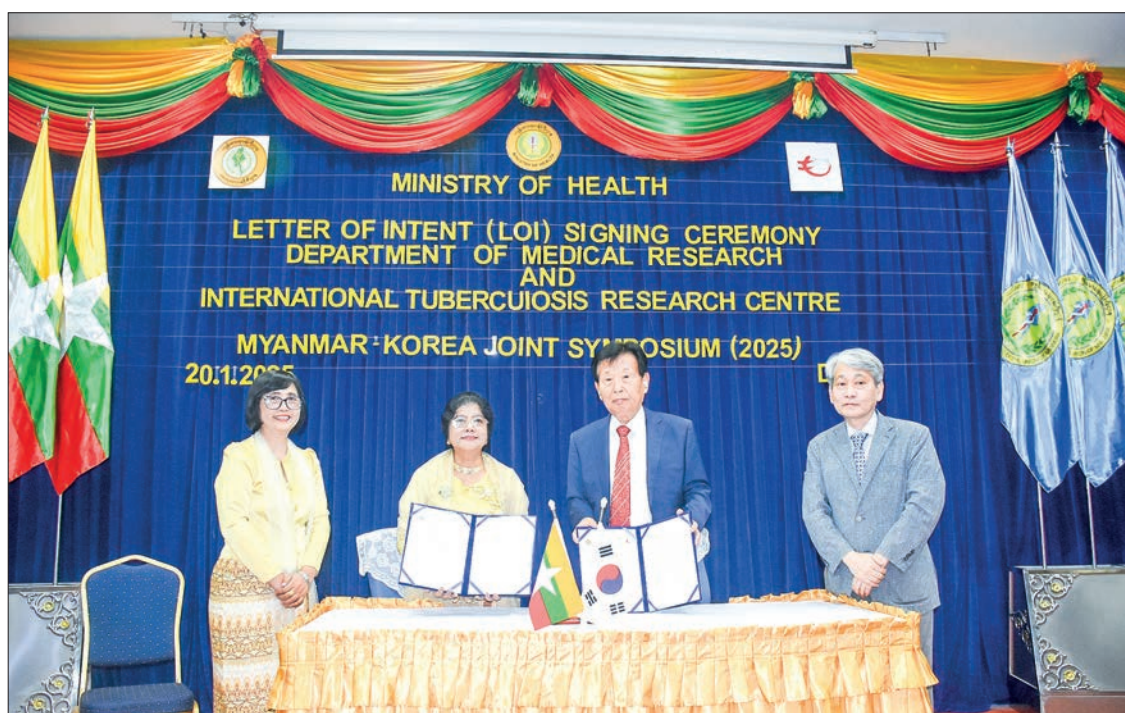
The signing ceremony of the Letter of Intent (LoI) between Myanmar and Korea underway yesterday.

On the first day, researchers presented papers on various health studies including body mass index and cardiovascular data among middle-aged individuals in Yangon, physical fitness for Myanmar adults and nutritional assessments for elderly patients. Other studies covered severe Escherichia coli strains in blood poisoning cases and genetic analysis of blood cancer patients at North Okkalapa Teaching Hospital. Attendees engaged in discussions following each presentation.