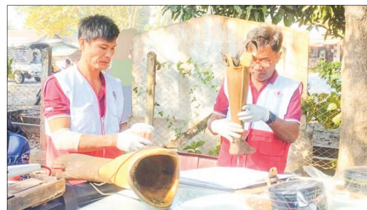
ICRC, MRCS's O&P professionals are seen providing prostheses to amputated people to help in Bago Region.

This field trip programme comprises an officer, four orthotics and prosthetics professionals and volunteers of the township Red Cross. — NN/KK