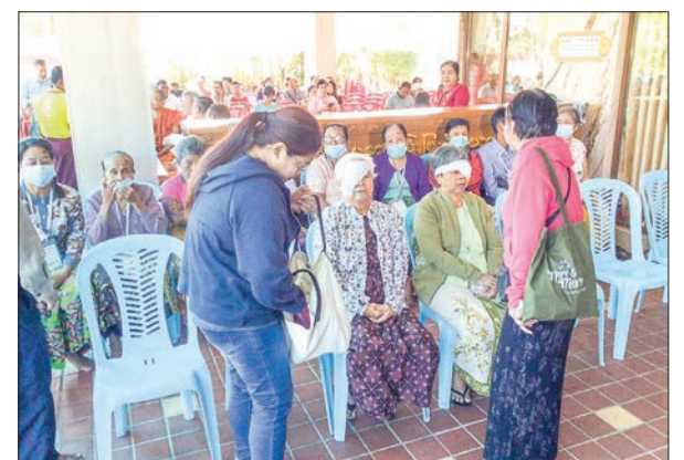
Patients receiving medical tests at the Sitagu Cakku Dana Hospital (Yangon).

"The 10 th Sitagu eyesight donation programme will be organized by the hospital to provide free eye tests and surgeries to patients from across the country. So far, the number of people who have registered for eye surgeries has reached 1,300. The Sitagu Sayadaw has requested that the eye donation event start on 11 February. The date for the eye tests will be announced later," said an official from the hospital.