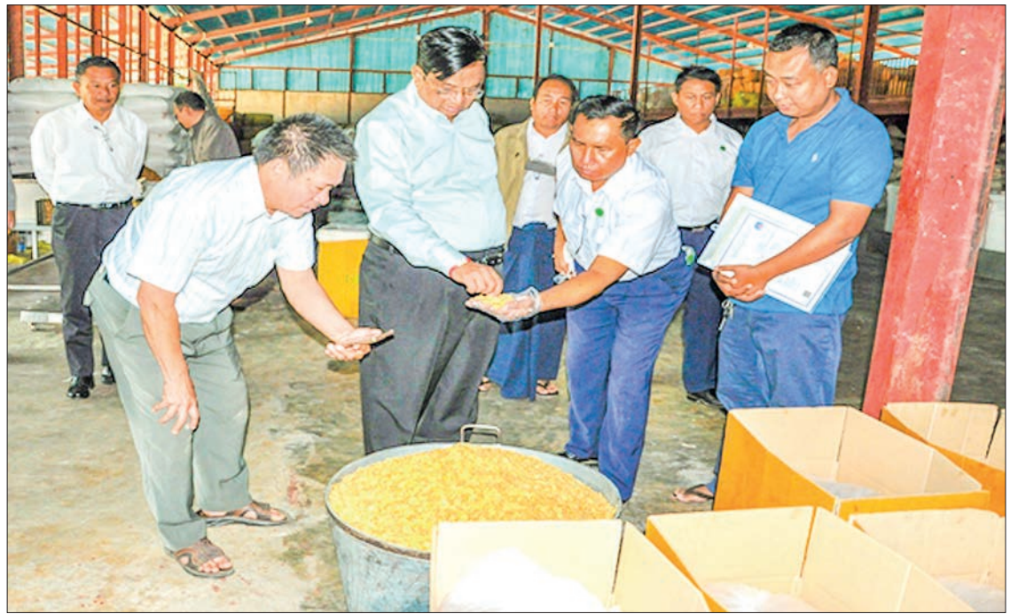
Union Minister for Industry Dr Charlie Than visits UK crispy fried onion workplace in Kyaukpongon Village, Thazi Township, yesterday.

The government has established a fund to promote the MSMEs and grants loans to the business persons. Those who receive loans should invest