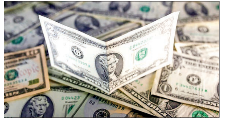
Greenbacks at the foreign currency exchange counter.

The Customs Department levied tax over export and import goods at K2,100 per US$ of reference rate in the past.— NN/KK