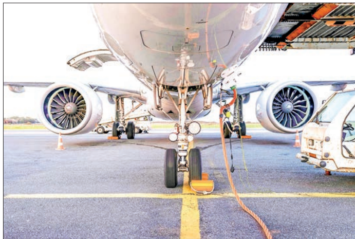
The Maintenance, Repair, and Overhaul (MRO) sector in India is rapidly evolving.

The Ministry of External Affairs (MEA) sees India as a future hub for MRO activities.