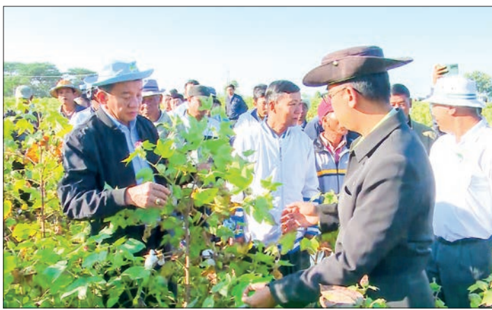
Thriving irrigated crops are under inspection in Bago on 16 January.

The deputy minister looked into 5,000 duck farms in Natpadee Village and thriving 150-acre cold-season black gram farms. He urged officials and farmers to broadly raise farmer awareness in growing crops using quality seeds and agricultural water supply to meet the standards. He fulfilled the needs of farmers and provided agricultural