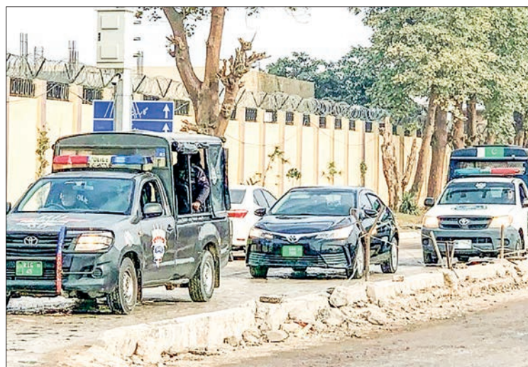
Police vehicles escort a car (C) carrying an accountability court judge as they arrive at the Adiala prison in Rawalpindi before the graft case hearing.

With many power lines felled, about 30,000 properties remained without electricity Saturday — down from a peak of more than 260,000, said the state’s emergency services minister, Jihad Dib. “This is an incident that is affecting the whole state,” he told reporters. — AFP