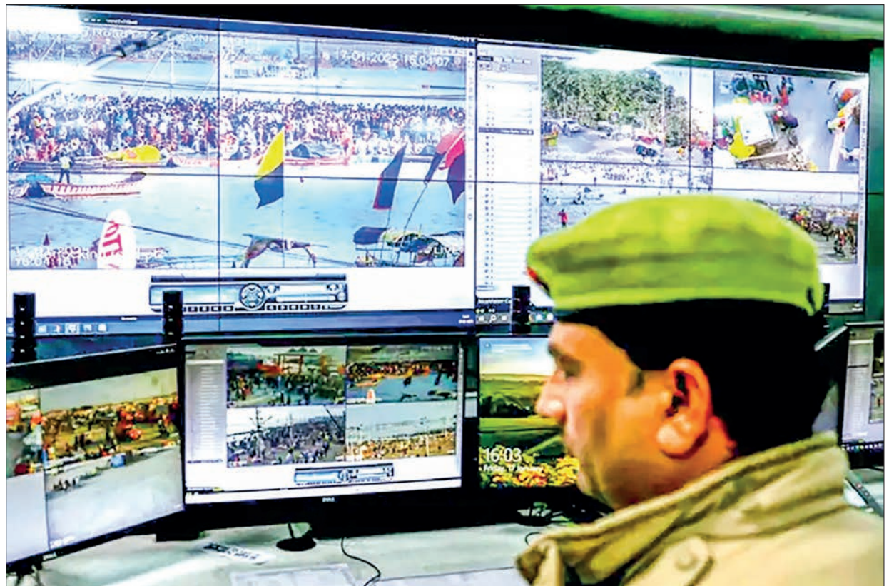
Police monitor the situation via screens at the Integrated Command and Control Centre, set up to manage and control the crowd, during the Maha Kumbh Mela festival in Prayagraj on 17 January 2025.