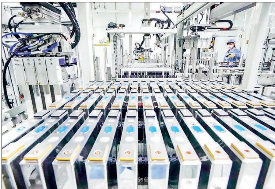
A worker operates on a production line at a lithium battery factory in Tangshan, north China's Hebei Province, 29 November 2020.

The initial investment in the plant is 285 million euros.