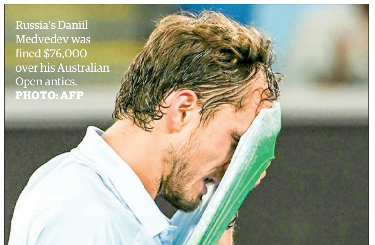
Russia's Daniil Medvedev was fined $76,000 over his Australian Open antics.

Fixture 16 continues today with ISPE FC facing Myawady FC at Thuwunna Youth Training Centre. — Ko Nyi Lay/KZL