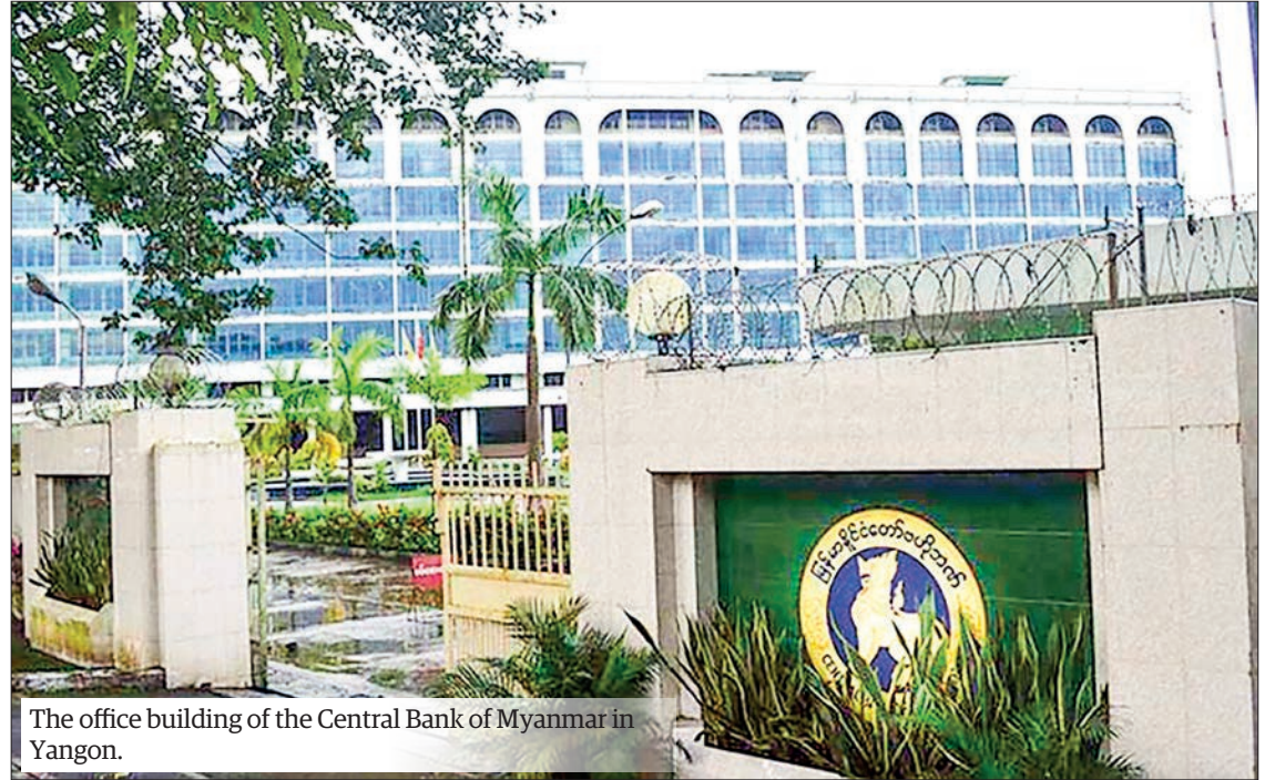
The office building of the Central Bank of Myanmar in Yangon.

CBM aims to curb the instability in the foreign exchange market and the currency devaluation. According to CBM's notification on 15 March, it has been joining with law enforcement agencies to combat and prosecute those who attempt to manipulate the currency market under the existing laws. CBM