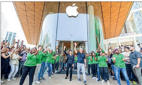
Apple opened its first physical stores in Mumbai and Delhi in 2023.