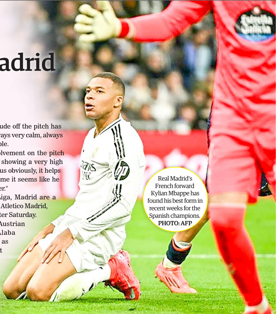
Real Madrid's French forward Kylian Mbappe has found his best form in recent weeks for the Spanish champions.

Ancelotti said Austrian defender David Alaba was likely to appear as a substitute against Las Palmas, having not played since suffering a severe knee injury in December 2023. — AFP