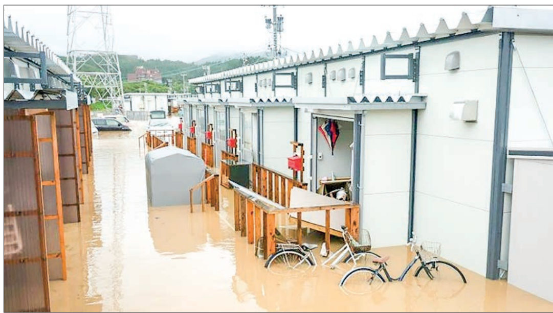
Flood waters inundate temporary housing complexes built for people who lost their homes during the 1 January earthquake in September 2024.

53 per cent of respondents expressed satisfaction or partial satisfaction with society—a 3-point increase from the previous year.