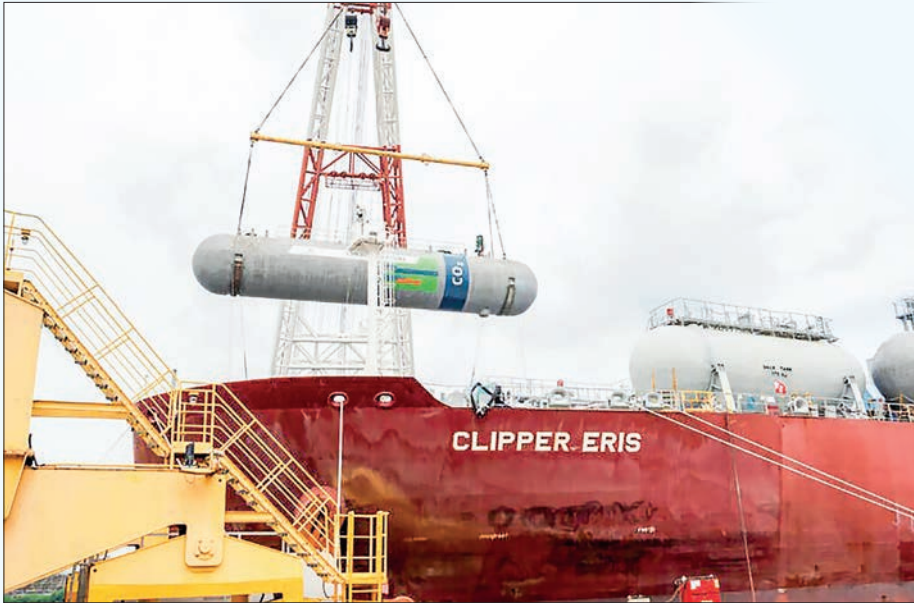
The Clipper Eris, a 160-metre-long ethylene carrier, was retrofitted with this system in a Singapore shipyard.