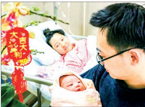
A newborn baby, whose Chinese zodiac sign is dragon, is seen with family members at a hospital in Heshan, south China's Guangdong Province, 10 February 2024.

China is soon to wrap up the Year of the Dragon on the Chinese lunar calendar, which traditionally features a baby boom. The dragon, or loong, is a symbol of good fortune in Chinese culture and considered the most auspicious among the 12 zodiac animals. — Xinhua