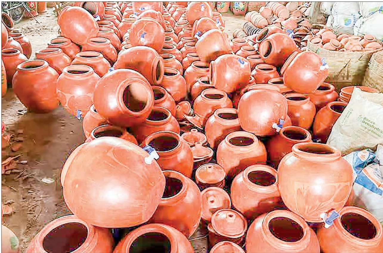
Natural earthen pots have gained increasing popularity in the market.

Customs Dept sets dollar-kyat rate at K3,590 for tariffs