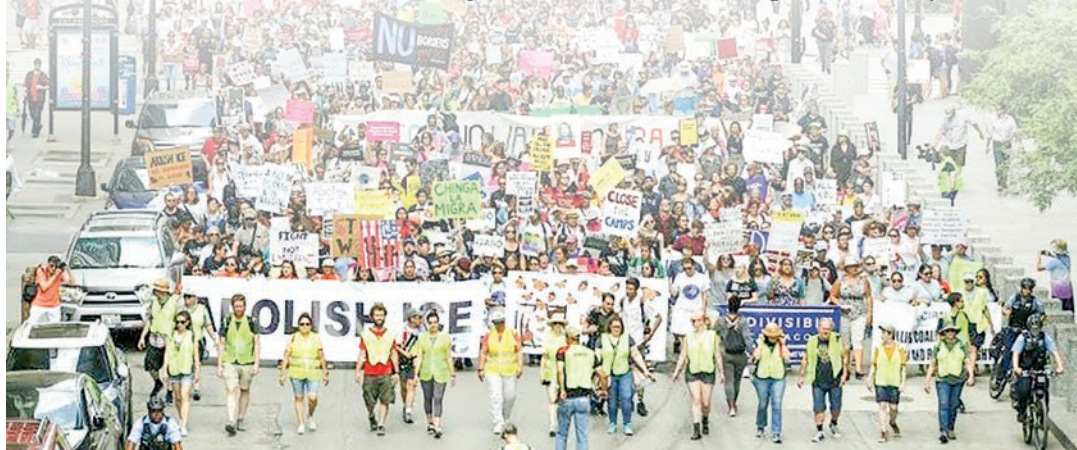
Trump’s proposals to hike tariffs and curtail immigration would likely constrain the supply side of the economy and push up prices. Protesters in Chicago marched to demand an end to ICE raids, calling for an end to migrant detention, criminalization, and deportation on 13 July 2019.

Gourinchas spoke to AFP at the IMF’s headquarters in Washington, a day before the publication of its key World Economic Outlook (WEO) report on Friday. — AFP