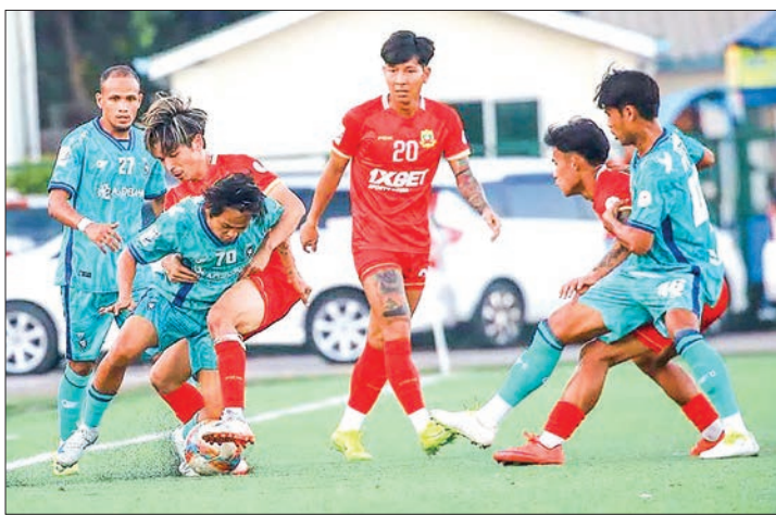
Shan United (red) and Yangon United players (green) in action during their intense MNL showdown.

DEFENDING champions Shan United secured a crucial 1-0 away victory over Yangon United and maintained their lead at the top of the 2024-2025 Myanmar National League (MNL) after the second day of Fixture 16 on 18 January.