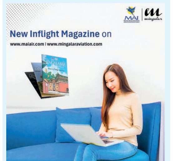
A woman is reading Mingalaba Inflight Magazine Vol 30 online.

The 82-page MAI's Mingalaba Inflight Magazine includes unique features of neighbouring countries including Myanmar, the travel sector, food and local specialities. It can be read on board or downloaded at https://mai-air.com/plan-your-journey/onboard-experience/inflight-entertainment . — Htun Htun/ZS