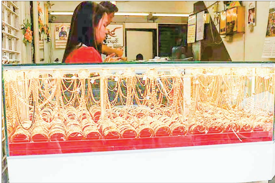
A display of gold ornaments is seen at the gold outlet in Yangon.

THE Ministry of Natural Resources and Environmental Conservation has notified gold shop owners to obtain a gold trading licence by 17 February 2025, warning that failure to do so will result in legal action.