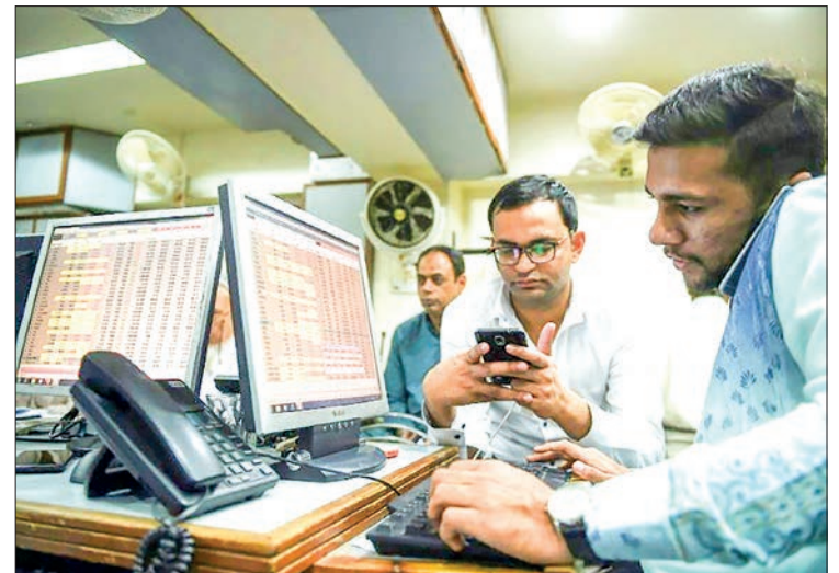
The Prime Minister welcomed the current account surplus, emphasizing the positive direction of economic policies.

Commenting on the development, Pakistani Prime Minister Shehbaz Sharif said that the continuous surplus in the current account reflected the right direction of economic policies of the country. — Xinhua