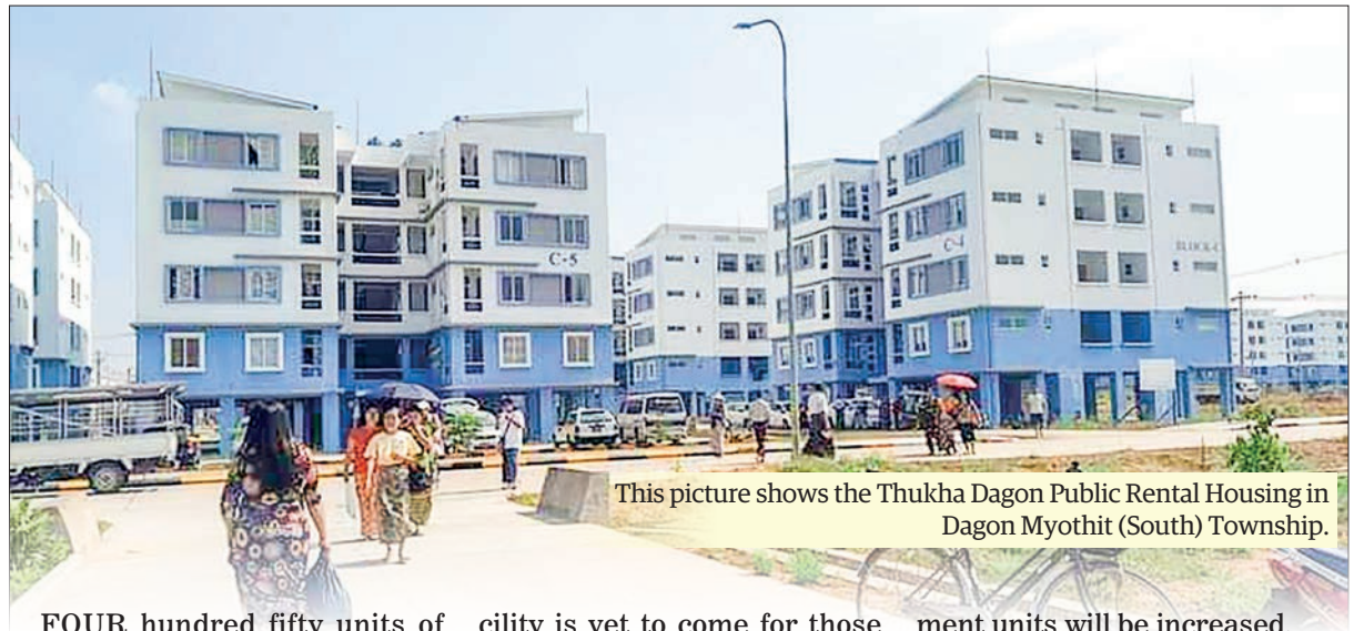
This picture shows the Thukha Dagon Public Rental Housing in Dagon Myothit (South) Township.

FOUR hundred fifty units of Thukha Dagon Public Rental Housing, being developed in Dagon Myothit (South) Township, will be rented for the public, the Department of Urban and Housing Development (Yangon Region) under the Ministry of Construction said.