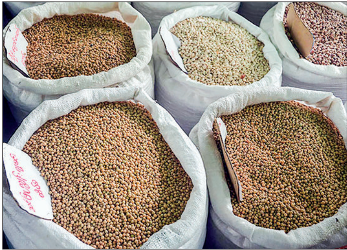
Beans and pulses neatly arranged for sale in the market.

THE Agriculture Department invited soybean companies to submit an Expression of Interest to export soybeans to China.