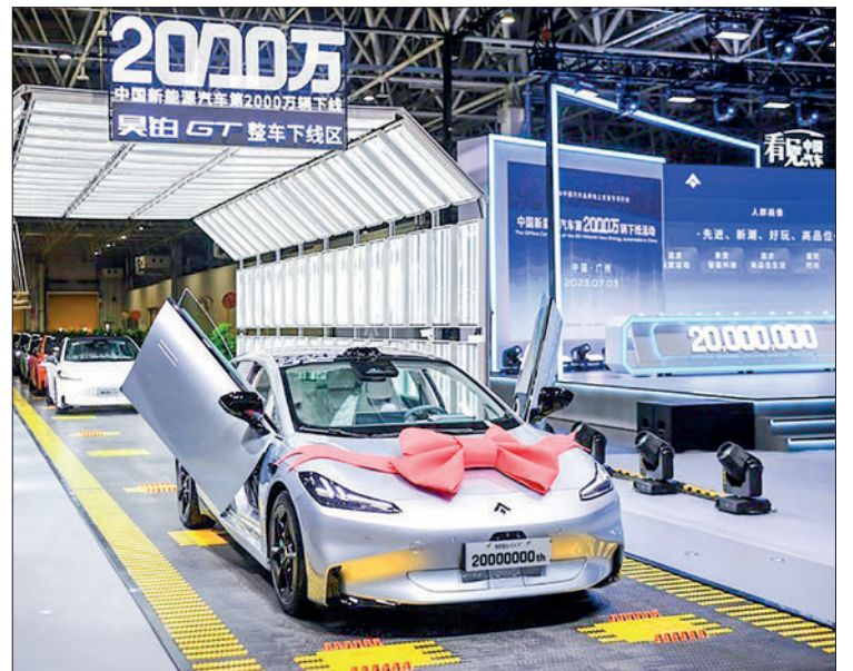
This photo taken on 3 July 2023 shows China's 20 millionth new energy vehicle (NEV), which is produced by GAC Aion New Energy Automobile Co. Ltd, in Guangzhou, south China's Guangdong Province.

Observers have highlighted the immense potential of domestic demand, noting that it will further drive the development of the NEV industry. — Xinhua