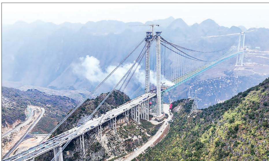
This photo shows a view of the Huajiang Grand Canyon Bridge in Southwest China's Guizhou province, 17 January 2025.

pected to be touched upon. The leaders are expected to discuss the development of the situation in the Middle East, including in Syria and the Palestinian-Israeli conflict, in the South Caucasus, as well as the state of affairs surrounding the Iranian nuclear programme, the Kremlin said. — SPUTNIK