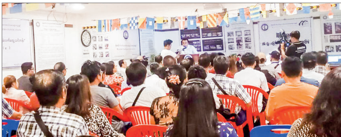
This photo depicts a talk event on home loans for seafarers.

A talk on suitable real estate for Myanmar seafarers to invest in and home loan access was held at the Myanmar Seafarers Federation office in Kyauktada Township on 17 January.