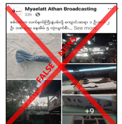
This screenshot reveals fabricated stories.

These malicious news media outlets intentionally circulate misleading information to cover up terrorists' actions and to create misunderstandings among the public about security forces. — MNA/KZL