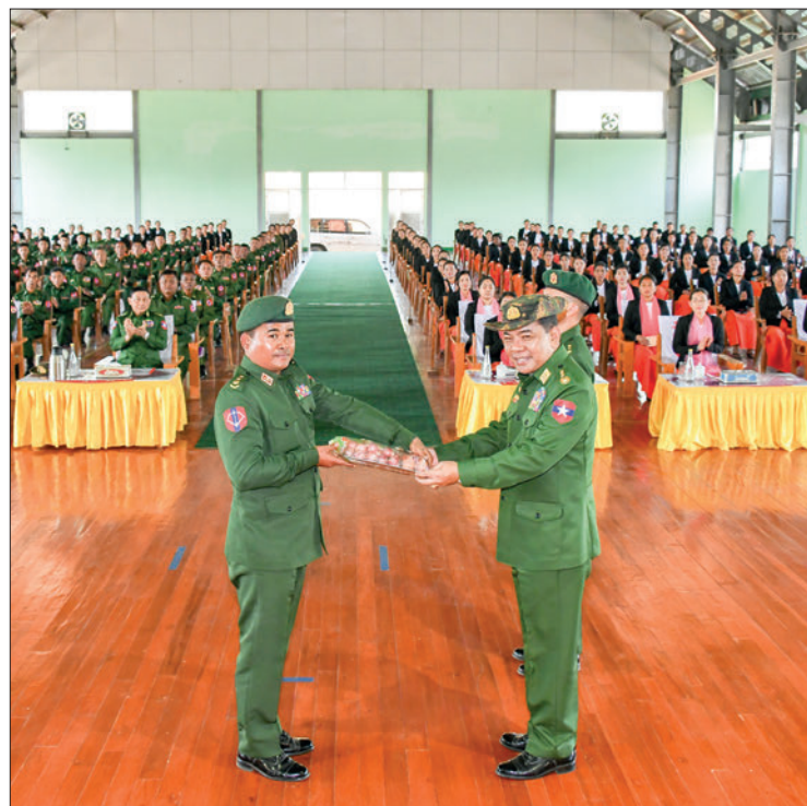
SAC Member Deputy Prime Minister Union Defence Minister General Maung Maung Aye offers presents to the regional military station.

At noon, General Maung Maung Aye and the party met district and township-level departmental officials at the meeting hall of the district general administration department in