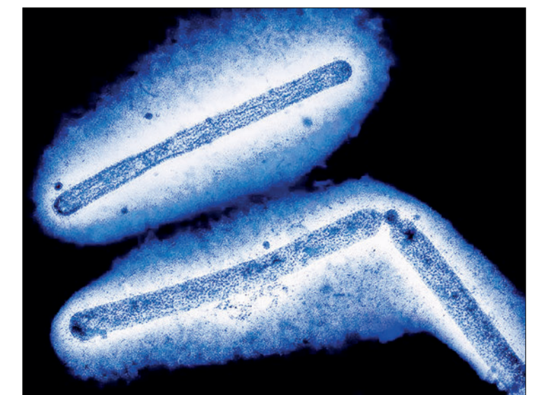
In all, 67 people in the United States have been infected with avian influenza since the outbreak began last year.

Since the outbreak began last year, 67 people in the US have been infected with avian influenza.