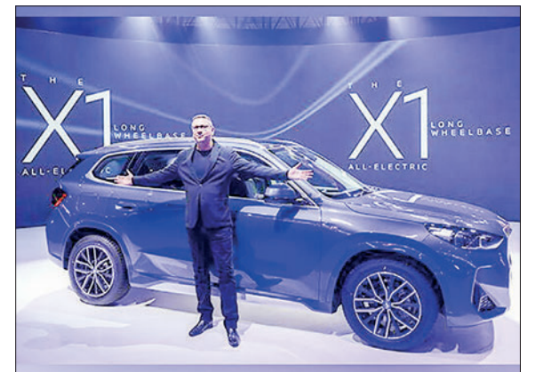
BMW India launched the first-ever BMW X1 Long Wheelbase All Electric at the Auto Expo 2025.

A premium offering that offers practicality and sustainability, all in one package, making it the obvious choice as your first BMW. Exuding space, comfort and versatility, it is the perfect premium SUV for rising aspirations of new Bharat. As the first 'Made in India' EV from BMW, the X1 Long Wheelbase beckons a new era of innovation and excellence. — ANI