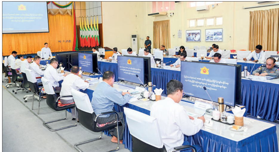
State Administration Council Vice-Chairman Deputy Prime Minister Vice-Senior General Soe Win chairs the meeting to hold the Union-Level MSME product exhibitions and competitions yesterday.

The Vice-Senior General underscored that advanced products will emerge from MSME exhibitions and competitions, and the export of these products can earn foreign exchange.