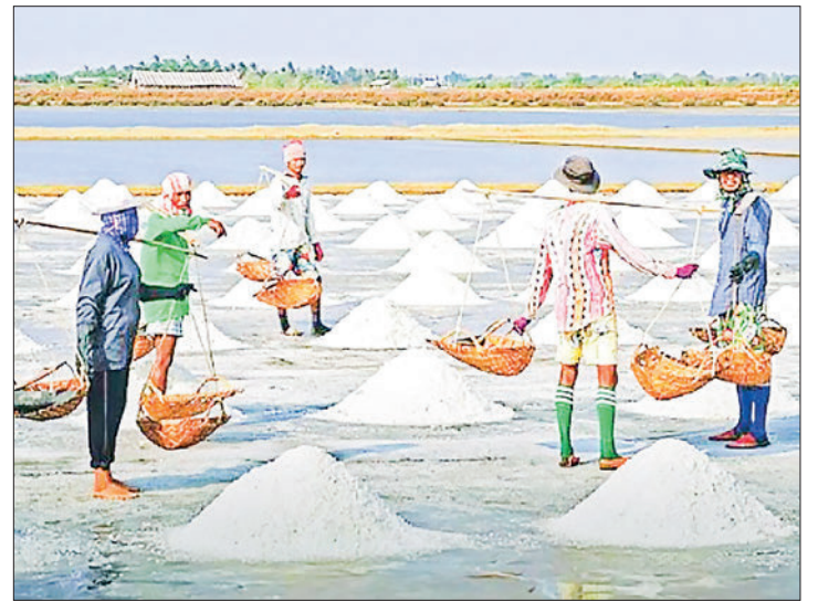
This image reveals a salt field and its harvesting workers in Ayeyawady Region.

“The salt market was very active this week. Salt farmers are happy and economical to work with the current price. Licensing wasn't as many as that of last month. Some salt is being produced in Labutta and Ngaputaw townships. Since the salt season was late, most farms have not produced yet. Salt production is a little late this year. This is due to the weather conditions,” he added. The market is normal and