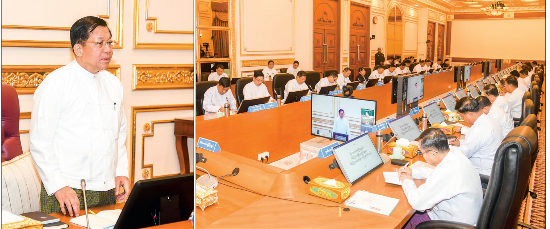
State Administration Council Chairman Prime Minister Senior General Min Aung Hlaing addresses the Union government meeting yesterday in Nay Pyi Taw.