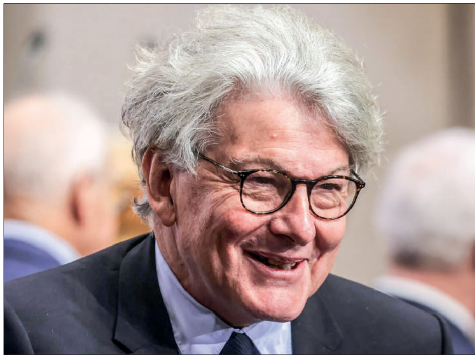
Thierry Breton continues to tussle publicly with tech billionaire Elon Musk over EU regulations.

Former EU tech enforcer Thierry Breton joins Bank of America's advisory council, facing criticism for allegedly violating a lobbying ban.