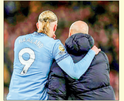
Manchester City forward Erling Haaland has signed a contract that keeps him at the club until 2034.

The Myanmar Boxing Council previously organized the PBM1 and PBM2 tournaments in 2024 and plans to send promising boxers to compete in international events.