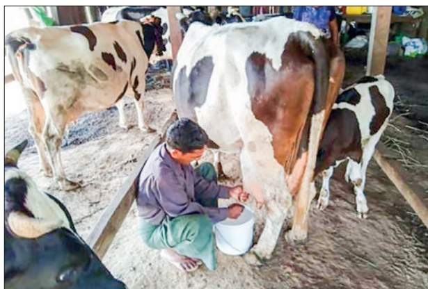
This picture captures the milking process at a dairy farm.

Before the recent amendment, Section 22 of the Law stated that LBVD could provide opinions on damage claims, compensation for asset loss or seeking assistance, triggered by infectious livestock disease in the farms of individuals or institutions. Insurance coverage beyond compensation and damage claims is added to the amended law. Those individuals or institutions to establish livestock breeding farms or livestock monitoring camps, those engaged in domestic livestock producing, processing or selling, livestock breeding, artificial insemination equipment, honey bee breeding, livestock products, genetically modified organisms, feedstuff, veterinary medicine, animal equipment, and those executing slaughterhouse or butcher house business on commercial purposes need to seek a permit from the officials concerned following the stipulations of the LBVD. — ASH/KK