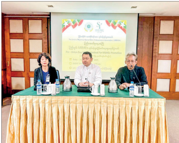
This image shows a press briefing on the upcoming 78 th Union Day pre-event MSME Promotion Fair at the Secretariat Yangon.