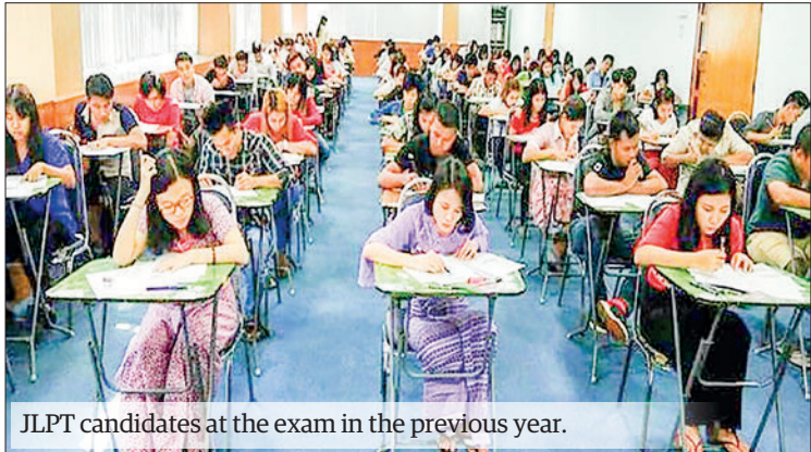
JLPT candidates at the exam in the previous year.

Corrected certificates will be available within a year, and no further corrections will be allowed. Correction is allowed one-time only so candidates must ensure a thorough check before requesting correction, it said. — MT/ZS