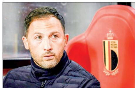
Hot seat: Domenico Tedesco watching his Belgium team lose at home to France in the Nations League in October.

"I have improved a lot. It is so nice to work with him. Not only because he is the best, but he is also the most hard-working person I have ever seen". — Xinhua