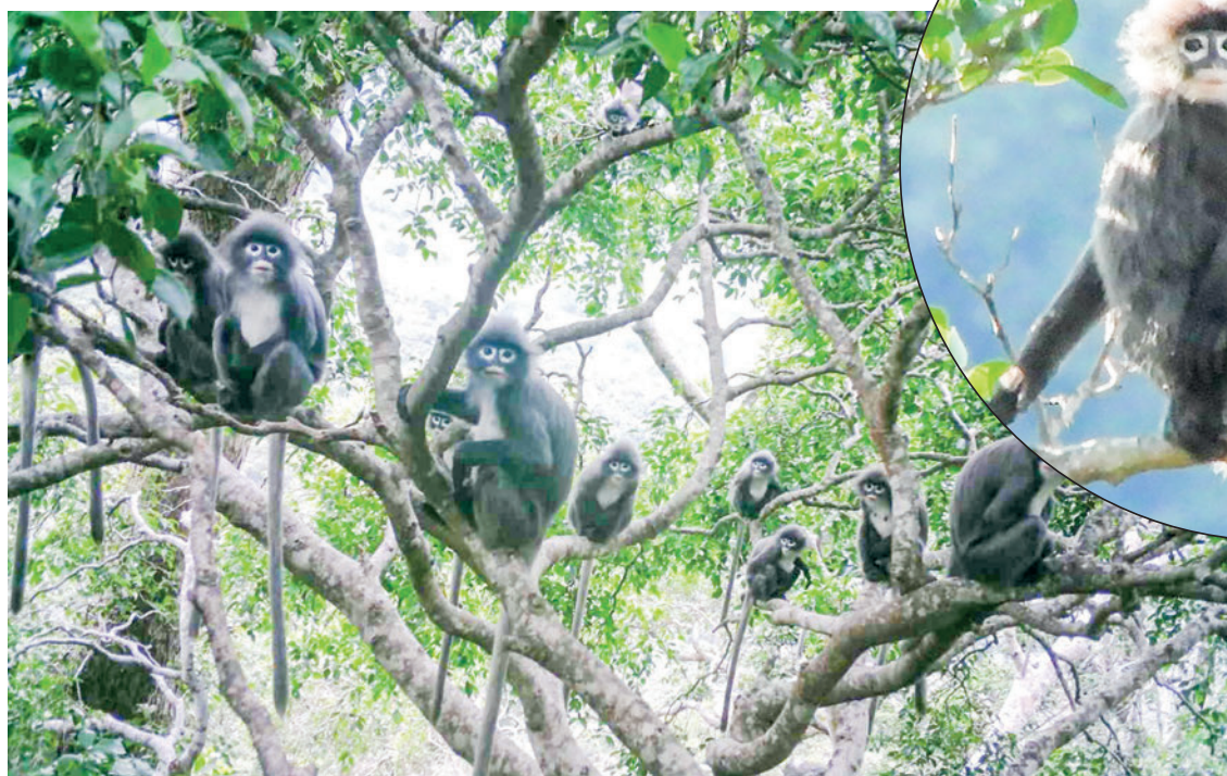
Popa Langur, locally known as 'Myauk Zeekwet' (capuchin monkey and dusky leaf mokey) inhabit the Mount Popa region.

Monkeys only found in volcanic valleys are called dusky leaf monkeys, also known as Cantor's Langur, were listed as endangered on the International Union for Conservation of Nature's (IUCN) Red List in 2016, and a new species on 11 November 2020 called Popa Langur. They also reside in Nwalaboh Hill, Hmanpya Hill