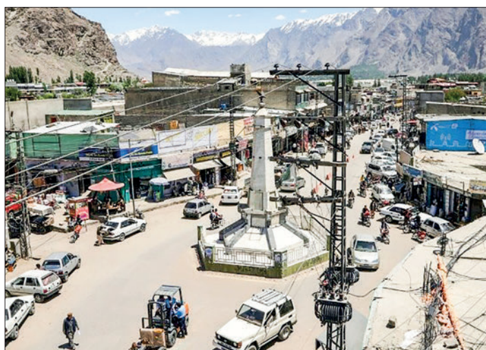
EVs are the right step to address air pollution that needs to be scaled up to contain climate change.

EV policy is expected to lower travel costs by up to three times compared to petrol and diesel-powered vehicles. — Xinhua