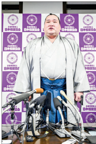
Yokozuna Terunofuji speaks during his retirement press conference at Tokyo's Ryogoku Kokugikan on 17 January 2025.