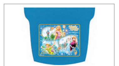
Supplied photo shows a seat headrest cover design for the Disney-themed shinkansen, inspired by the new "Fantasy Springs" area at Tokyo DisneySea.

The onboard melody will be "I See the Light", a song from the Disney film "Tangled." — Kyodo