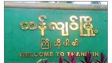
This image showcases the entrance signage to Thanlyin.

At present, transactions have been seen in Thanlyin's