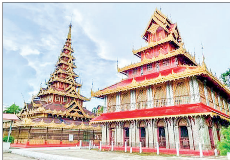
U Nar Auk Monastery in Kadoekawhnet Village in Mon State.

ARRANGEMENTS are being made to sell tour packages for visiting Mon and Kayin states, as well as Bago Region, to both domestic and foreign travellers, according to an official from Heartcraft My-