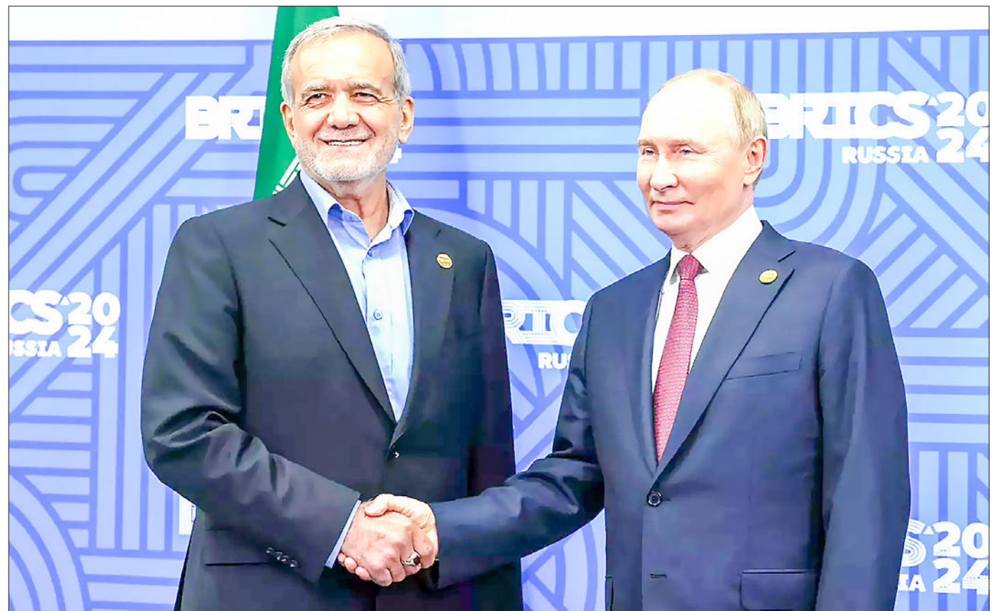
Iranian President Masoud Pezeshkian and Russian President Vladimir Putin shake hands as they pose for photos before a meeting on the sidelines of the 16 th BRICS Summit in Kazan, Republic of Tatarstan, Russia.

The Kremlin indicated that topics of mutual interest will be addressed during the discussions.