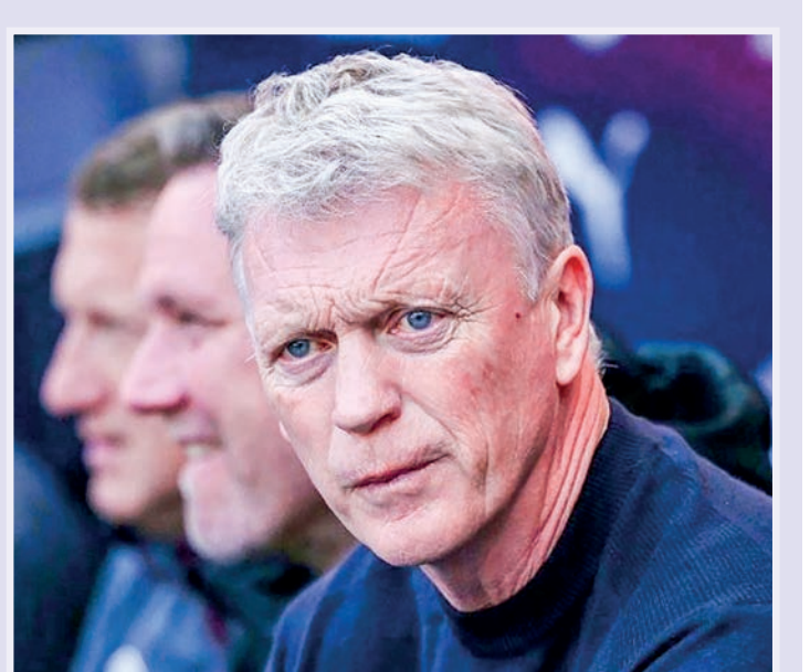
David Moyes returned for a second spell in charge of Everton on Saturday.

"I enjoyed 11 wonderful and successful years at Everton and didn't hesitate when I was offered the opportunity to rejoin this great club," said Moyes on the Everton website.