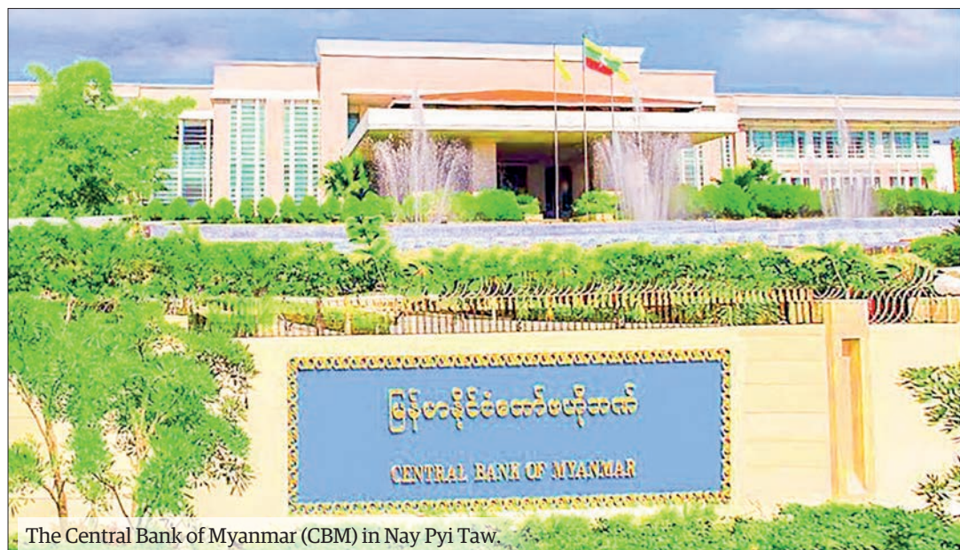
The Central Bank of Myanmar (CBM) in Nay Pyi Taw.

CBM aims to curb the instability in the foreign exchange market and the currency devaluation. According to CBM's notification on 15 March, it has been collaborating with law enforcement agencies to combat and prosecute those who attempt to manipulate the currency market under the existing laws. CBM allowed authorized dealers (private banks) to operate online foreign exchange trading freely as per the market rate depending on supply and demand, starting from 5 December 2023. — NN/KK