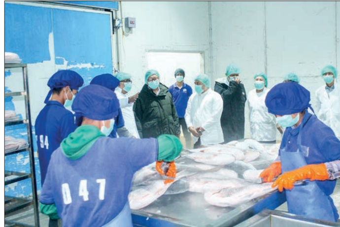
Deputy Minister Dr Aung Gyi observes the process line of fishery products cold storage in Yangon.

DEPUTY Minister for Agriculture, Livestock, and Irrigation Dr Aung Gyi inspected Two Rivers Co Ltd in Insein Township, Yangon Region, on 10 January, where he observed the processing and packaging of fish and shrimp for export to Saudi Arabia according to market demand. Officials from the company explained that