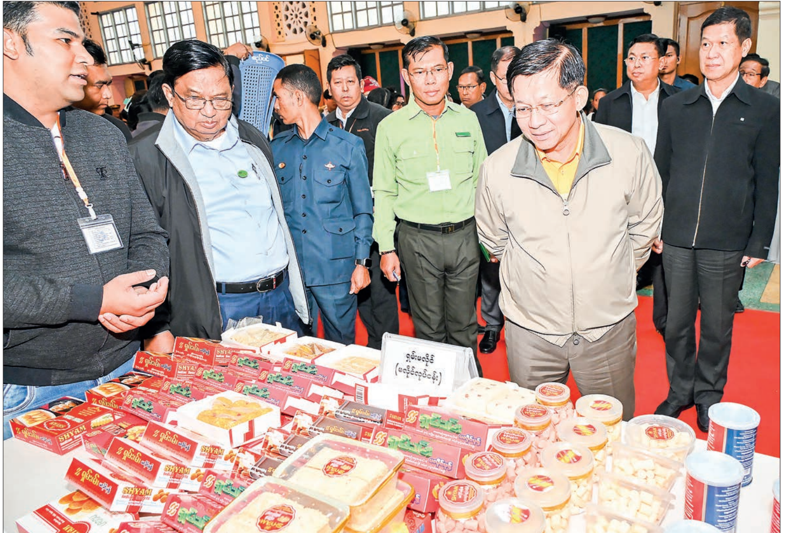
State Administration Council Chairman Prime Minister Senior General Min Aung Hlaing views the displays at the meeting with micro-, small- and medium-sized enterprise (MSME) businesspeople in PyinOoLwin yesterday.