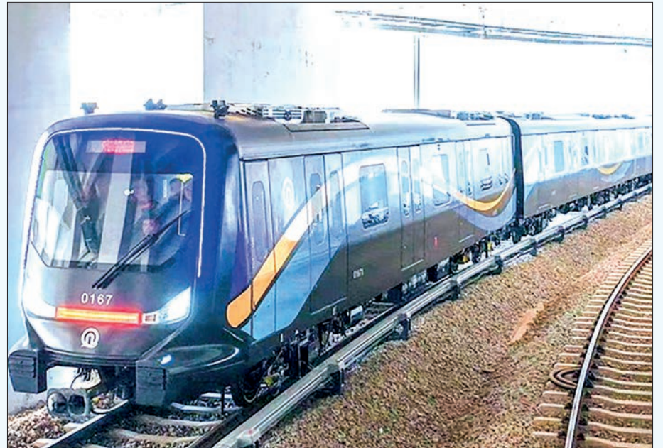
The total vehicle weight is 11 per cent lighter than conventional trains.

Notably, the use of carbon fiber materials also reinforces the vehicle's body, boosts its impact resistance and extends the durability of its structure. — Xinhua