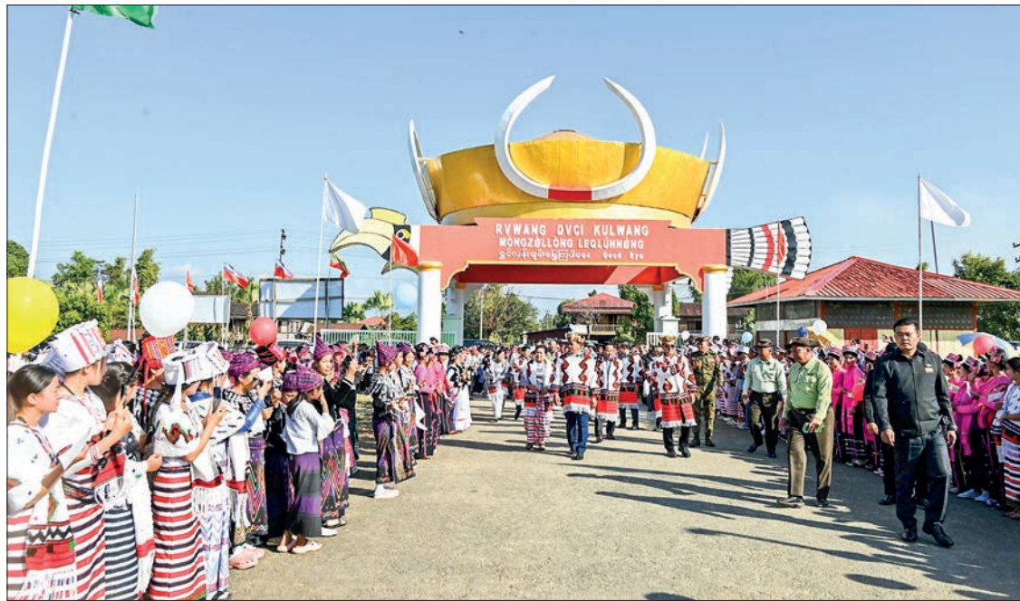
State Administration Council Member Deputy Prime Minister and Union Minister Admiral Tin Aung San attends the 2025 Rice Security Festival at Rawang National Park in Dottan Ward, PutaO, yesterday.

Speaking at the event, the Admiral highlighted the chances for the youths to see the social, cultural, law and technological related subjects through