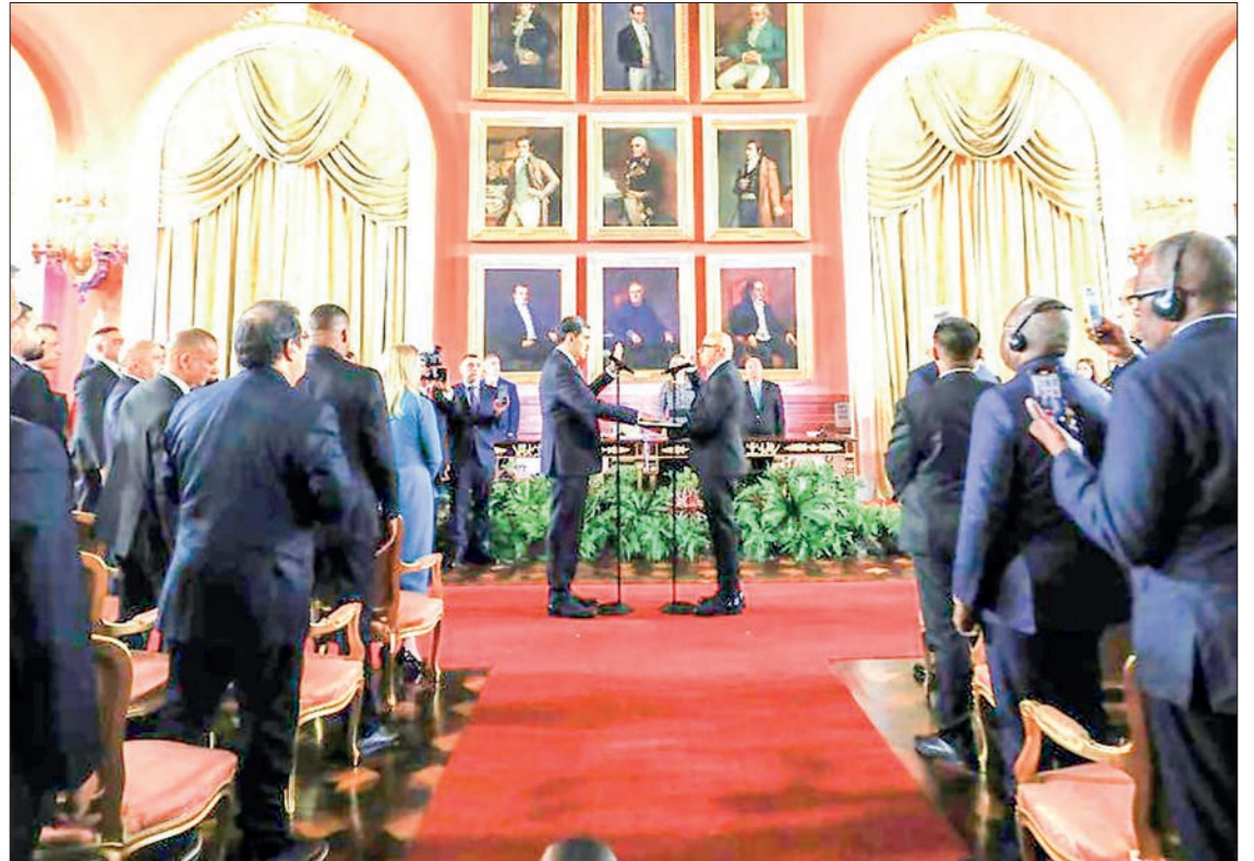
Nicolas Maduro is sworn in as Venezuelan president for a third term in Caracas, Venezuela, 10 January 2025.

The reform, he said, aims to update “the principles of the Constitution based on the new economy and society”, and “to defend the country from new technological threats”. “Today, I will sign the decree to create a broad national commission for drafting the constitutional reform project, aiming for a process of democratization and defining Venezuela’s new society and economy,” Maduro said. — Xinhua