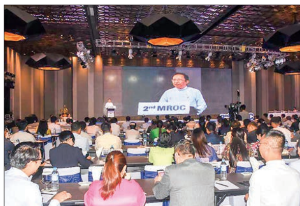
The 2 nd Myanmar Radiation Oncology Conference in progress yesterday at the Wyndham Grand Hotel in Yangon.

The hybrid-format conference runs from 11 to