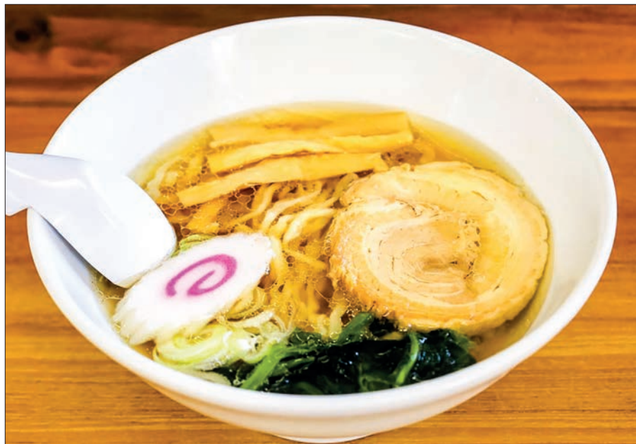
File photo taken in Sano, Tochigi Prefecture, in October 2023, shows a bowl of ramen noodles.

meat and vegetable toppings with broth. Despite rising costs, the average price of a bowl of ramen is still under 700 yen, according to Teikoku Databank. A popular lunchtime staple or late-night guilty pleasure, ramen has also found fans overseas. But with 2024 ingredient costs as of October up by an average of over 10 per cent from 2022, businesses face having to bring prices closer to 1,000 yen. Though low compared with many dining options, crossing that line is seen as a blow to ramen's everyman image that could drive away diners. — Kyodo