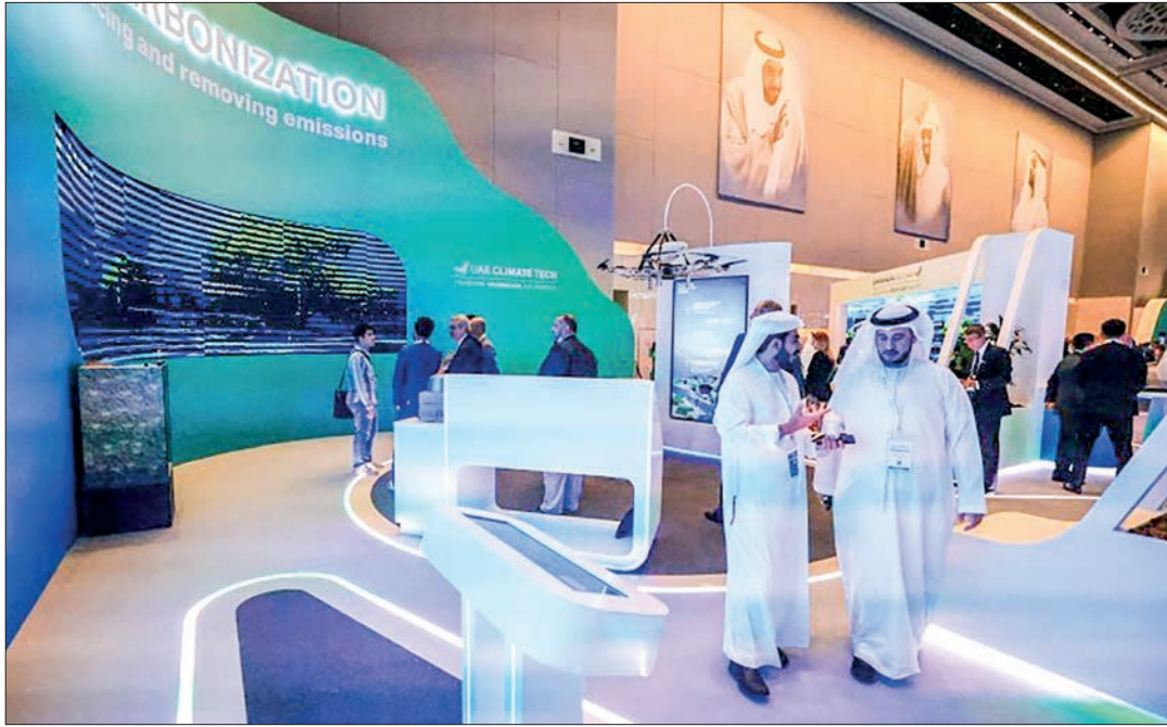
The climate tech conference, UAE Climate Tech, took place on 10 and 11 May 2023 in Abu Dhabi. It was a significant event focused on decarbonization technologies and climate action.