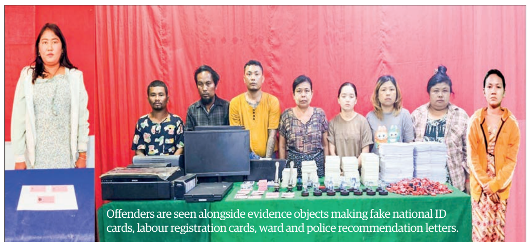
Offenders are seen alongside evidence objects making fake national ID cards, labour registration cards, ward and police recommendation letters.

POLICE arrested nine offenders involved in making fake citizenship scrutiny cards, labour cards, wards and police recommendation letters in January.