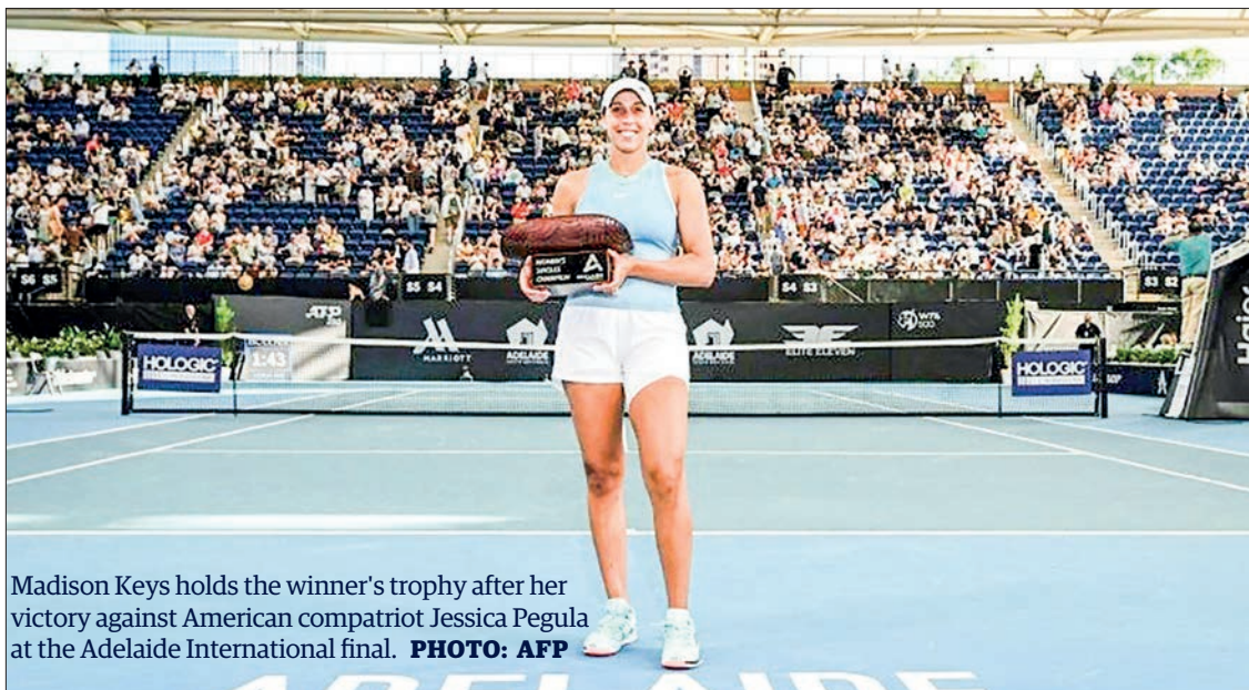
Madison Keys holds the winner's trophy after her victory against American compatriot Jessica Pegula at the Adelaide International final.

FELIX Auger-Aliassime and Madison Keys completed the perfect preparation for the Australian Open Saturday when they claimed top honours at the Adelaide International.