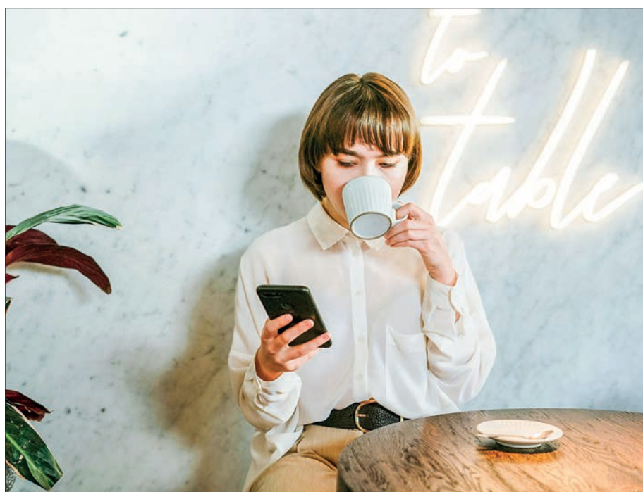
SK Telecom's AI assistant, A., ranked second with 2.45 million users.

South Koreans spent 900 million minutes on generative AI services in December, an eightfold increase from 110 million minutes a year earlier.