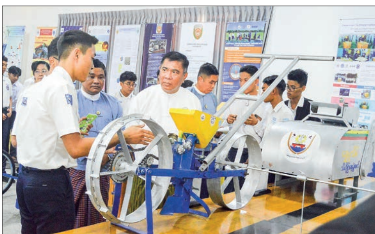
Union Minister for Science and Technology Dr Myo Thein Kyaw observes the innovative projects presented by students from universities, government technological institutes and government technical high schools.

YOUNG students participated in the domestic-level basic innovation competition yesterday morning at Naypyitaw State Polytechnic University in Pobbathiri Township. The event aimed to select participants for the Fifth ASEAN-India Grassroots Innovation Forum's Innovation Project Competition.