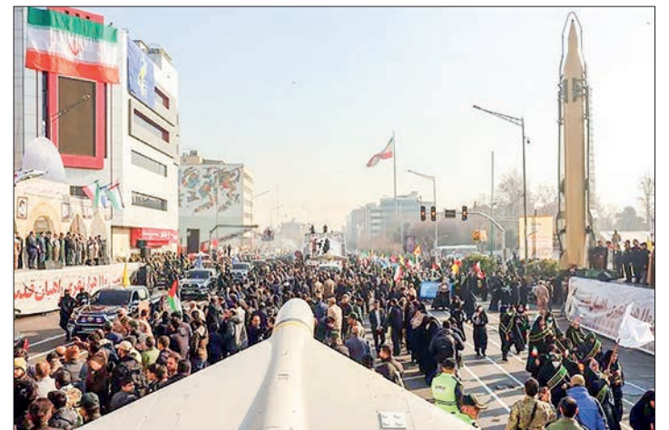
Members of Iranian paramilitary forces (Basij) march next to a Iranian long range Sejil missile, during an anti-Israeli rally to show their solidarity with the Palestinian people, in Tehran.

On Friday, thousands of Basij fighters, which are linked to the Revolutionary Guards, paraded with heavy weapons and vehicles through the streets of Tehran, showing their readiness to face “threats”. — AFP