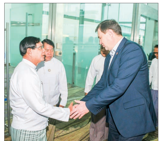
Belarusian Foreign Minister Mr Maxim Ryzhenkov and his delegation are seen off at the Yangon International Airport.

THE Belarusian delegation led by Mr Maxim Ryzhenkov, Minister of Foreign Affairs of the Republic of Belarus, left Yangon by flight, yesterday.