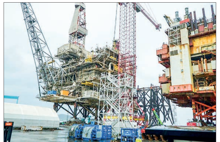
High regularity on the fields and increased capacity following upgrades in 2023 contributed to this achievement.

The Sri Lankan government is targeting $5 billion in tourism revenue in 2025 by attracting 3 million tourists, tourism officials recently said. — Xinhua