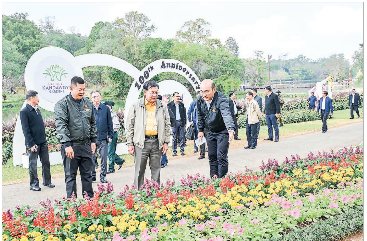
Senior General Min Aung Hlaing observes flower beds at the 17 th flower festival to mark the 100 th anniversary of the garden in PyinOoLwin yesterday.

The Senior General highlighted that residents have to participate in shaping PyinOoLwin as a flower city, a green city,