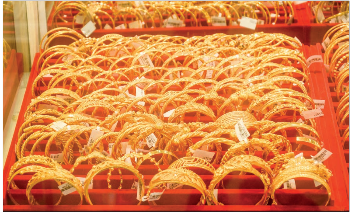
Gold ornaments are displayed for sale at one gold outlet in Yangon.

Then, the committee links with the Ministry of Information to announce the daily gold reference prices. It amends prices upon real-time information of