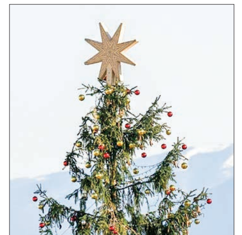
Sweden's food safety agency says eating Christmas tree needles can be safe.

of Ghent posted tips for recycling the conifers into dinner table items. Ghent had cited what it said were ancient Scandinavian customs of using dried needles to flavour butter. Sweden's Food Safety Agency said it agreed with their Belgian counterparts that commercially bought Christmas trees "are not considered food because they may have been treated with plant protection products not authorized for edible crops".