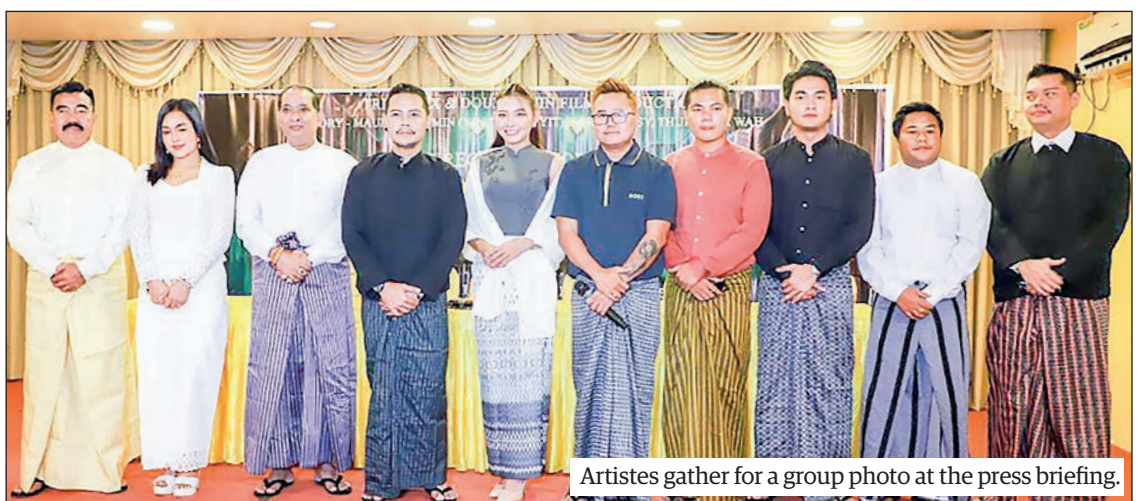
Artistes gather for a group photo at the press briefing.