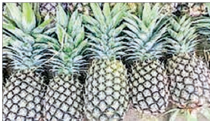
Myanmar's pineapples enter Chinese markets.

According to GACC's notification, the Ministry of Agriculture, Livestock and Irrigation