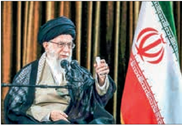
Iran's supreme leader Ayatollah Ali Khamenei is seen meeting foreign ministry officials in Tehran on 21 July 2018.

Khamenei urged Iraq to “stand against” the US efforts to maintain and expand its military presence, emphasizing the need for Iraq to resist foreign occupation.