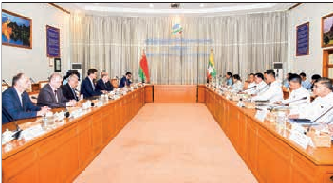
SAC Member General Nyo Saw receives the Belarusian delegation led by Foreign Minister Mr Maxim Ryzhenkov yesterday in Nay Pyi Taw.

During the meeting, they discussed signing an agreement on cooperation in bilateral development programmes between the two countries, promising business cooperation, investment in agriculture, livestock and dairy produce, value-added commodities and food production, electricity, industry, automobile assembly, medicine and raw medical supplies production and investment opportunities at the Thilawa Special Economic Zone. Belarusian Foreign Min-