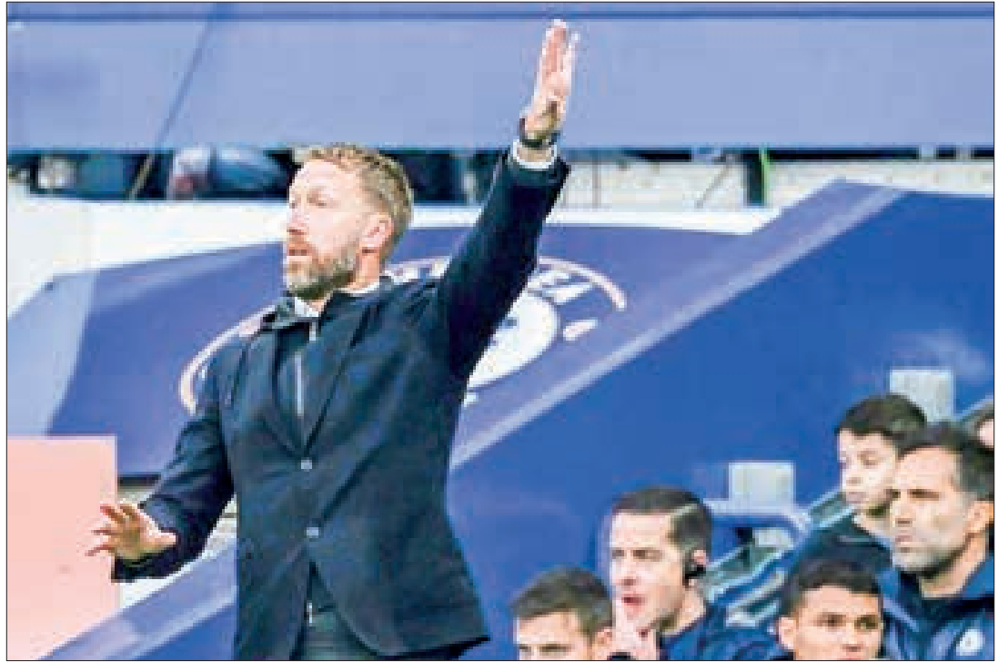
Graham Potter is back in football as West Ham boss.

FORMER Chelsea boss Graham Potter was named West Ham's new manager on Thursday on a two-and-a-half-year contract, the club said, a day after sacking Julen Lopetegui.