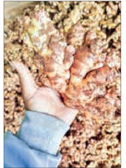
A vendor shows gingers that are traded at the market.

Previously, Myanmar exported ginger to China, Thailand, India, Bangladesh, Yemen, Indonesia, Pakistan, Malaysia, Singapore and the United Arab Emirates, according to figures released by the Department of Trade.