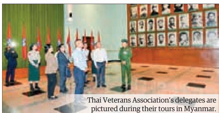
Thai Veterans Association's delegates are pictured during their tours in Myanmar.

Zegyo Market and Mandalay Hill in Mandalay. On 9 January, they explored the Mandalay Royal Palace before departing for Thailand via air from Mandalay. — MNA/KZL