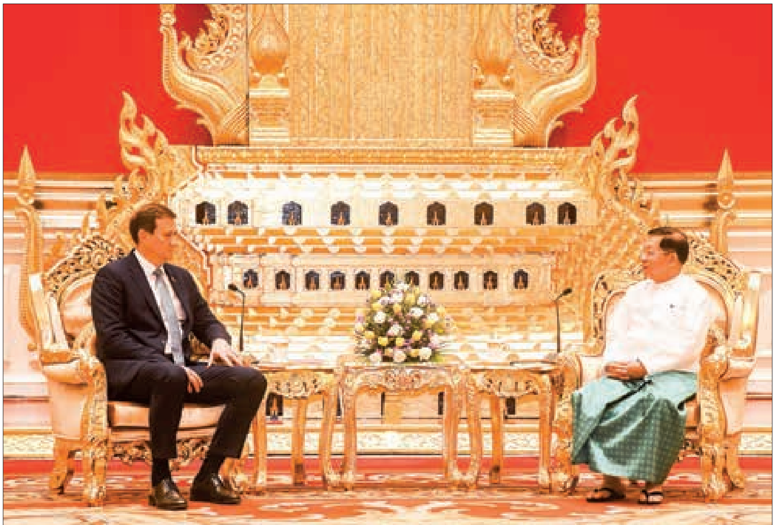
State Administration Council Chairman Prime Minister Senior General Min Aung Hlaing receives Mr Maxim Ryzhenkov, Minister of Foreign Affairs of the Republic of Belarus in Nay Pyi Taw yesterday.

Chairman of the State Administration Council Prime Minister Senior General Min Aung Hlaing received Mr Maxim Ryzhenkov, Minister of Foreign Affairs of the Republic of Belarus, at the Credentials Hall of the Office of SAC Chairman in Nay Pyi Taw yesterday afternoon.