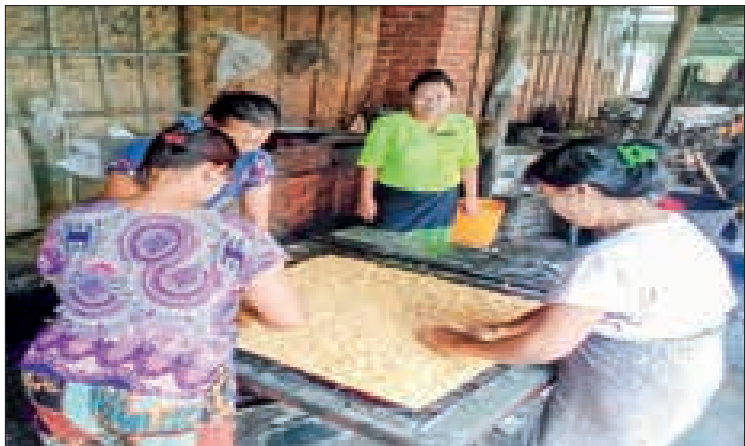
A Mayway-making business.

Mayway, a popular traditional snack of Myanmar, is being produced seasonally but Mayway makers said they have planned to upgrade the manufacturing so that it can be available throughout the year with the help of technology.