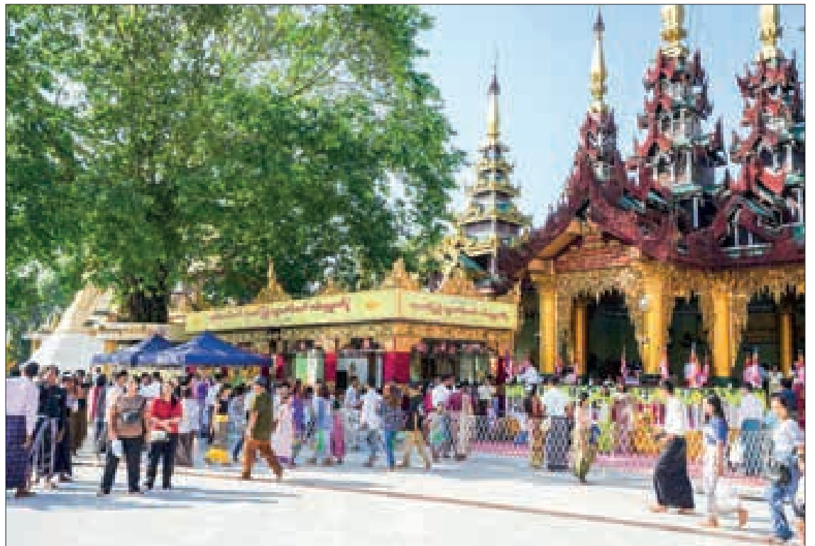
Pilgrims are seen at the Shwedagon Pagoda.

To accommodate the growing number of visitors, the Shwedagon Pagoda has been open daily for pilgrimage from 4 am to 10 pm since 21 June 2024, allowing devotees to worship peacefully. — ASH/MKKS