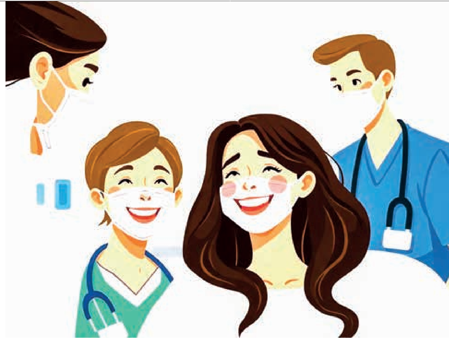
Promoting public relations enhances patient satisfaction and directly contributes to a hospital's development, prestige, and image. ILLUSTRATION: VISUAL ART

The Emergency Department is the best resort for seriously ill patients and persons severely wounded due to accidents and disasters. Usually, the minds of patients arriving there are overtaxed with financial constraints, social problems and psychological upset. Therefore, the staff should extend a warm welcome to these sorrow-stricken patients with a sweet smile on their faces. They should not wear a stern face in the presence of patients and their relatives. The staff on duty should be in their uniforms which can boost patients' confidence in them. Moreover, the staff should be kind, courteous and helpful to patients. The staff should listen to them attentively and deal with their inquiries politely. In addition, the staff should guide them in detail and treat them in an encouraging and consoling manner. The staff should always remember to say "Thank you" to every patient. This can prevent