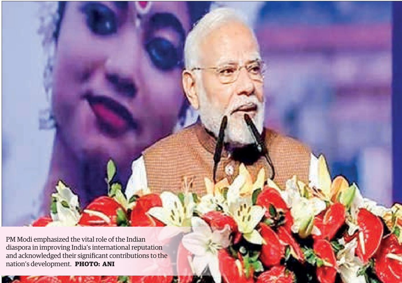
PM Modi emphasized the vital role of the Indian diaspora in improving India's international reputation and acknowledged their significant contributions to the nation's development.