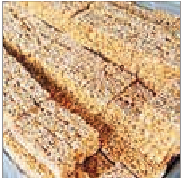
A traditional Myanmar snack, Mayway.

ONE of Myanmar's traditional snacks, 'Mayway', made in Zalun Township has received orders from Yangon Region and other areas.