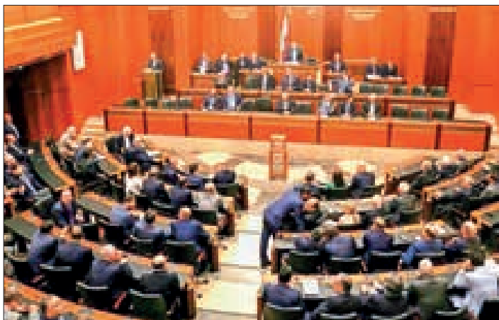
Lebanese MPs attend the 12 th parliamentary session to elect a new president.

Egypt's continuous political and humanitarian support for Lebanon, especially at such a critical stage and under difficult circumstances. — Xinhua