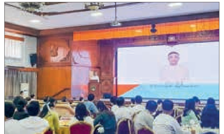
The Optimizing Myanmar's Role in ASEAN Workshop in progress on 9-10 January 2025.

At the workshop, U Ko Ko Kyaw, Deputy Minister for Foreign Affairs delivered an opening remark highlighting Myanmar's active participation in regional, sub-regional and international organizations, including the United Nations, ASEAN, BIMSTEC and Mekong Sub-regional Organizations, the Asia-Europe Meeting (ASEM), the Asian Cooperation Dialogue (ACD), and the Shanghai Cooperation Organization (SCO) in line with Myanmar's independent, active and non-aligned foreign policy. He further emphasized the importance of mutually beneficial cooperation of the bilateral, regional and multilateral platforms through the intensified efforts fostering vigorous foreign relations to advance the national, political, economic, and social objectives of the country. He encouraged all participants from relevant ministries to identify priority areas to optimize Myanmar's cooperation in ASEAN by con-