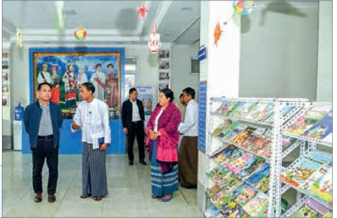
Union Minister U Maung Maung Ohn inspects the Community Centre in Myitkyina on 8 January.

He proceeded to the MRTV Retransmission Station (Myitkyina), inspected the broadcasting processes, and met the staff. — IPRD/KTZH