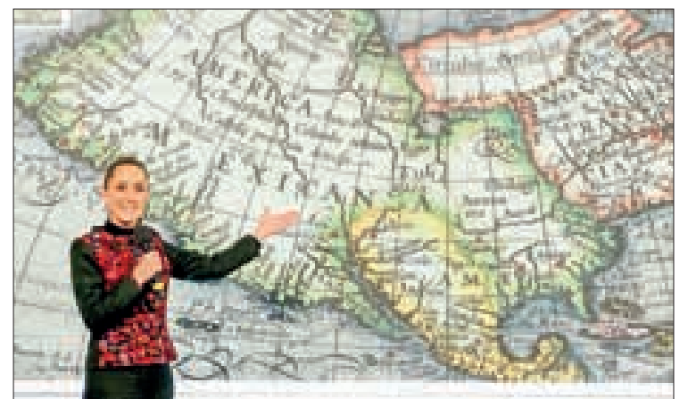
Mexico's President Claudia Sheinbaum displays a 17 th -century world map showing “America Mexicana” – pushing back at Donald Trump.

Trump, who will be sworn in for a second term on 20 January, said Tuesday he planned to rename the Gulf of Mexico “the Gulf of America, which has a beautiful ring”. — AFP