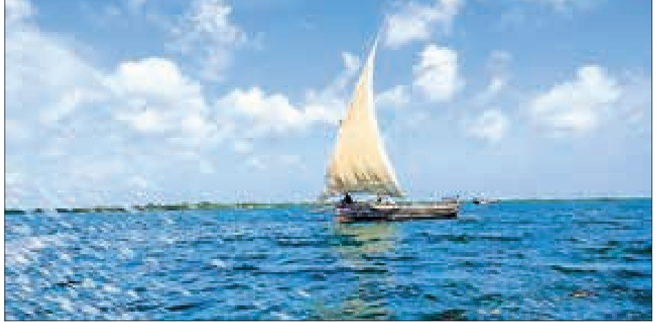
People sail a dhow in Indian Ocean, Lamu County, Kenya, on 23 November 2022.