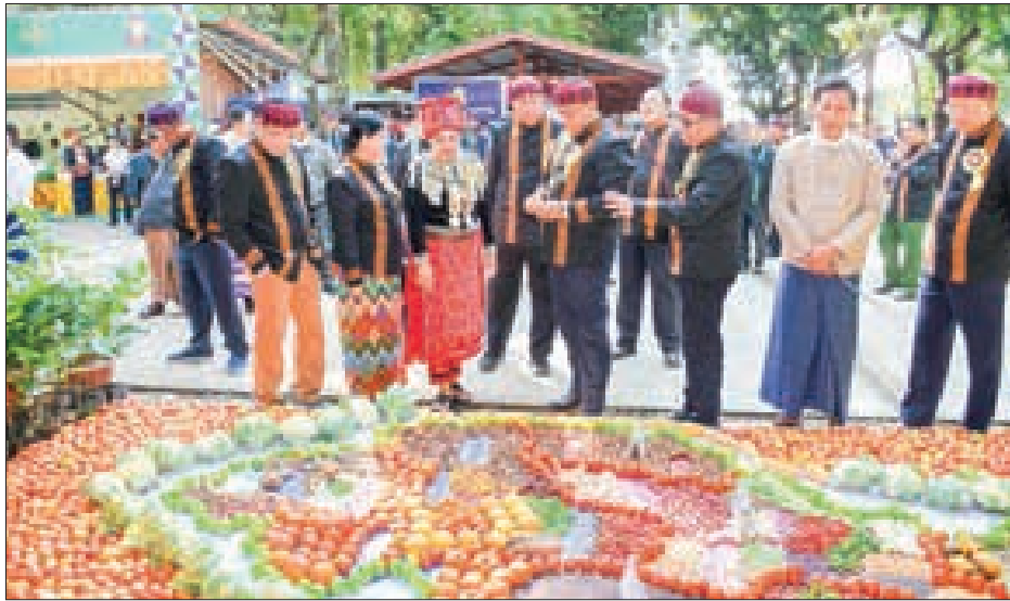
SAC Member Deputy PM and Union Minister Admiral Tin Aung San and dignitaries observe the exhibition at the Kachin State Day celebration yesterday.

Then, they observed the decoration, collective exercise section and performance of students in the resort, and gave cash prizes to them. They also enjoyed the performance of students marking the