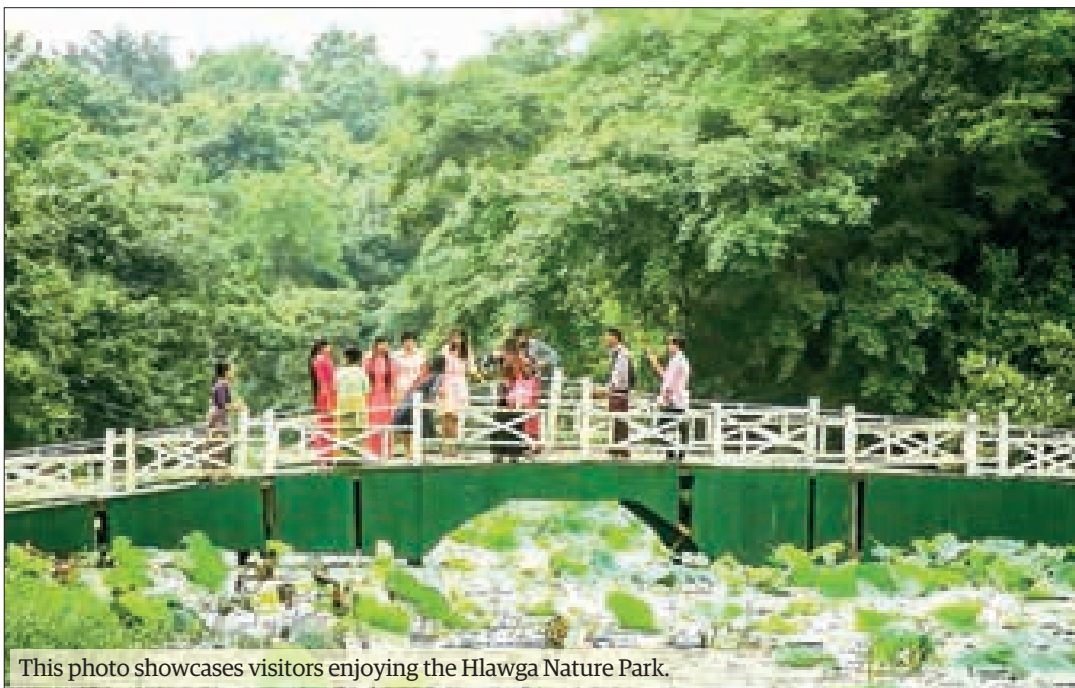
This photo showcases visitors enjoying the Hlawga Nature Park.

Those who want to learn about bird watching or just for fun can choose Hlawga Bird-watching, while sports enthusiasts can enjoy trekking, adventure boating, and SUP riding together with families and friends. The park has invited the public to visit the Hlawga Nature Park, which is easily accessible and is the closest place to the Yangon metro to experience the natural atmosphere. — MT/ZN