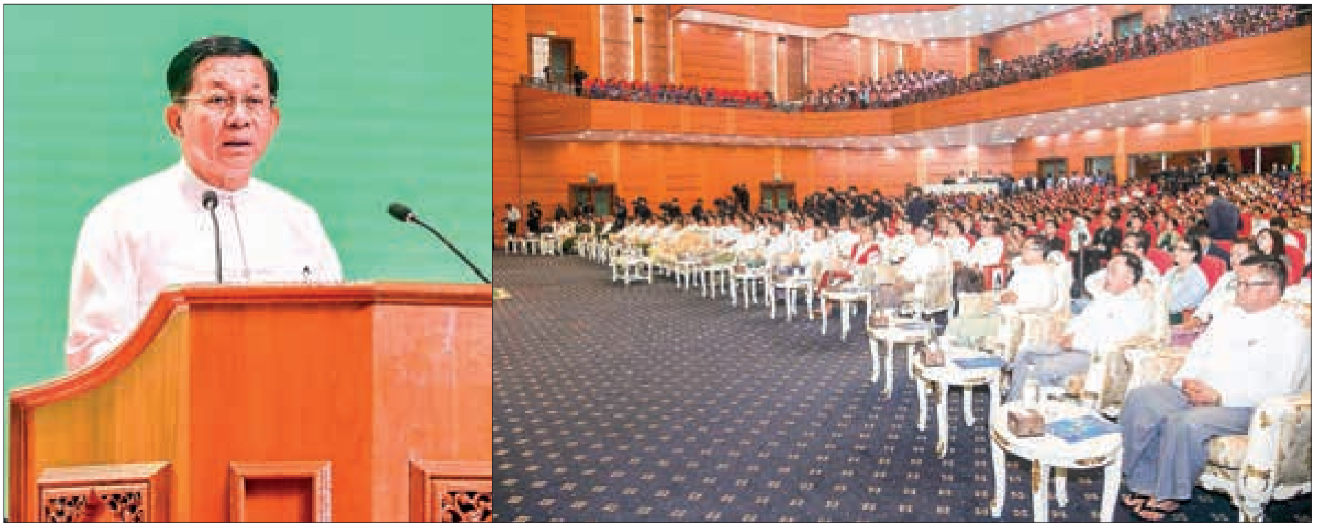
State Administration Council Chairman Prime Minister Senior General Min Aung Hlaing delivers the opening speech at the International Conference on Applied Research in Education 2025 yesterday.

(Excerpt from guidance given by Chairman of the State Administration Council Prime Minister Senior General Min Aung Hlaing to Shan State cabinet members and state-level departmental officials on 3 September 2024)