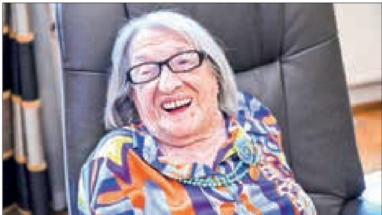
Agnes Keleti who won five Olympic gymnastics gold medals after surviving the Holocaust has died aged 103.