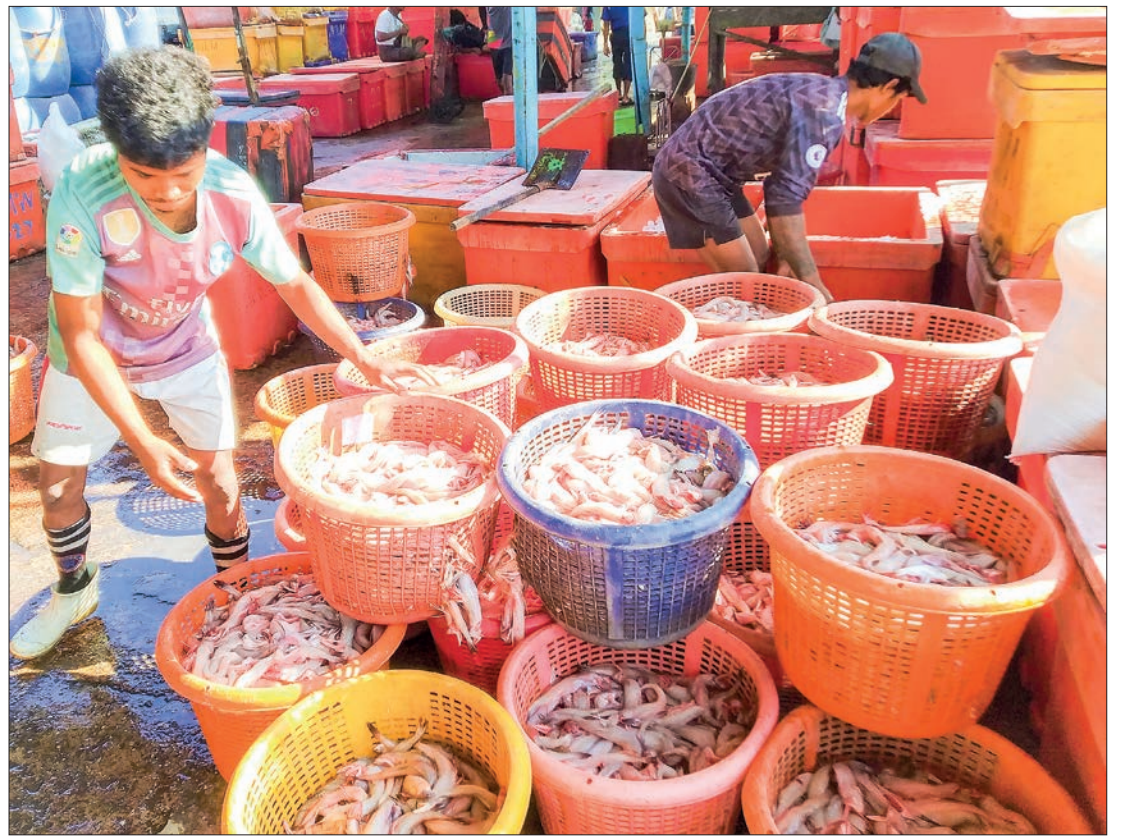
Bombay duck are pictured at the Kyimyindine Sanpya Fish Market in Yangon.