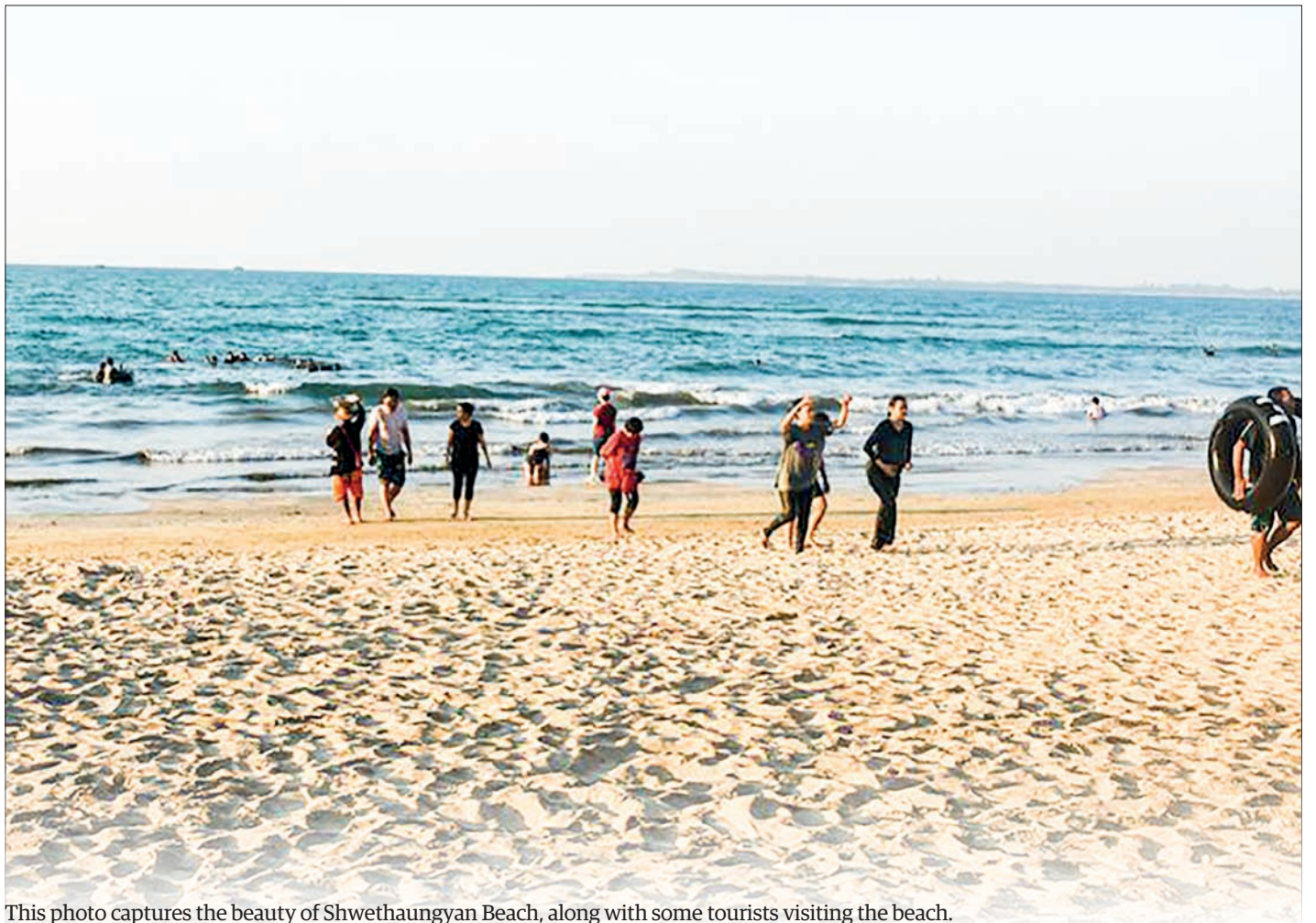
This photo captures the beauty of Shwethaungyan Beach, along with some tourists visiting the beach.