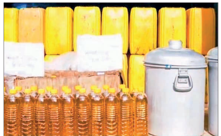
This photo shows some types of cooking oil bottles being sold in the domestic market.

Myanmar has a growing demand of 1.1 million tonnes of cooking oil per year. Beyond domestic production, about 900,000 tonnes of oil are yearly imported. — ASH/KK