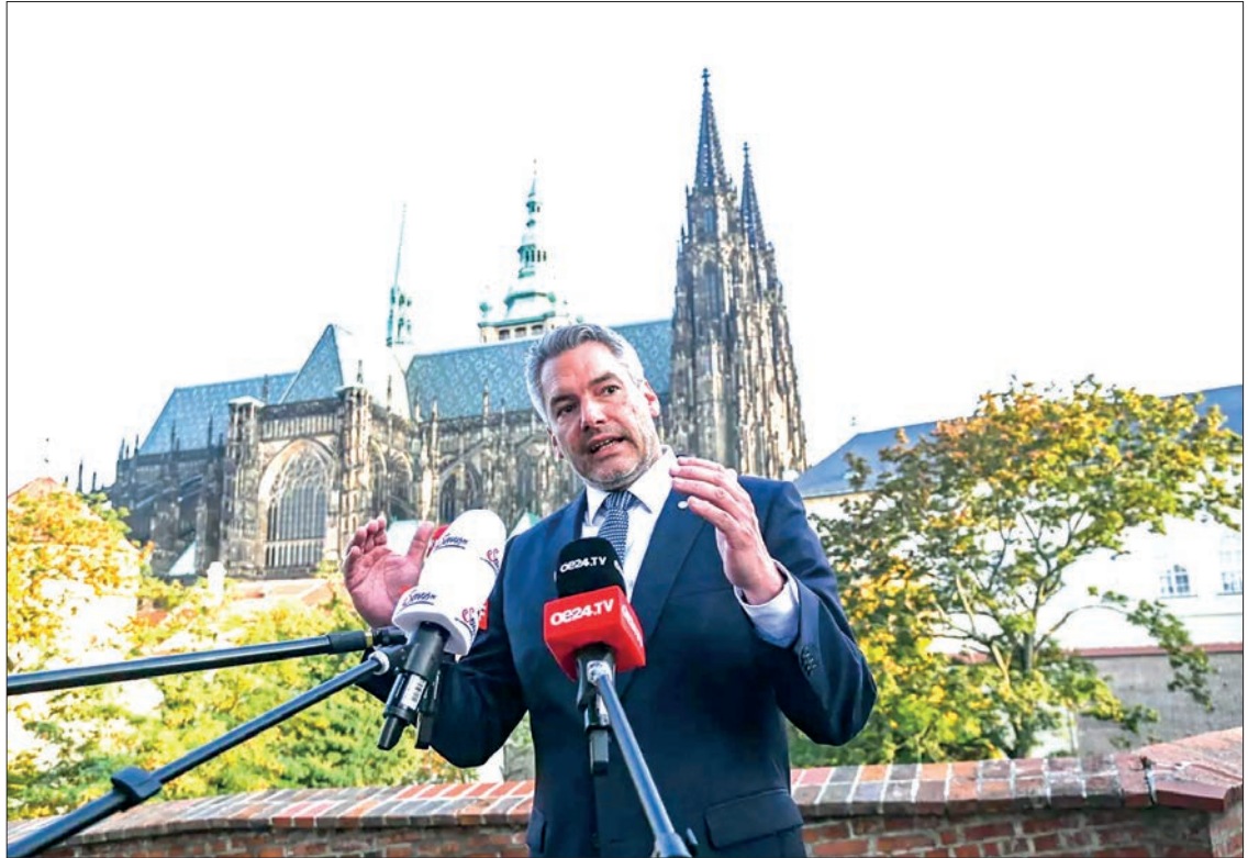
Austrian Chancellor Karl Nehammer attended a news conference after the Informal Summit and Meeting within the European Political Community at Prague Castle, in Prague, Czech Republic.

Nehammer refused to form a coalition with the Freedom Party, and has sought to cobble together a new government with the New Austria and Liberal Forum (NEOS) and the SPOe, respectively, with both attempts ending in failure. — SPUTNIK