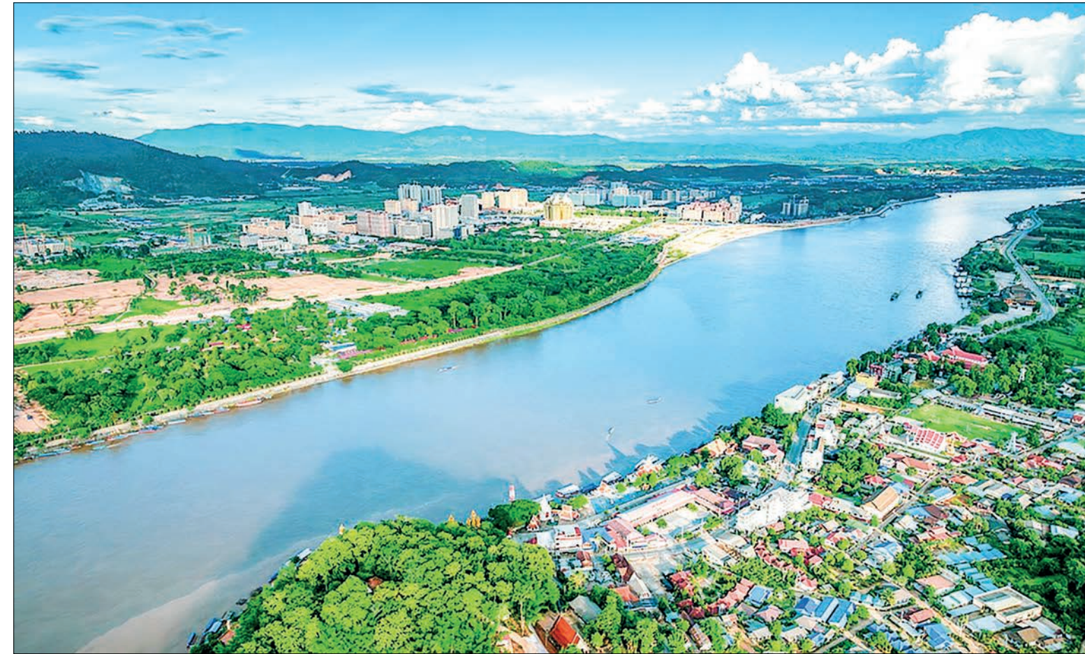
Southeast Asian countries have increasingly turned to compact, issue-specific groupings like the Ayeyawady-Chao Phraya-Mekong Economic Cooperation Strategy (ACMECS) and the Cambodia-Laos-Vietnam Development Triangle Area (CLV-DTA). The Mekong River is the longest river in Southeast Asia.