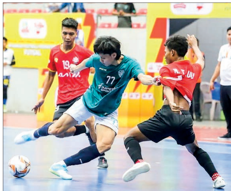
MIU and SGF futsal teams in action during the Futsal League.

Generations are in third place with five points, while VUC and M2K share four points each. YCDC Marga and SGF have three points each, YRG and Winner Soccer have two points each and Futsal Lovers has one point.