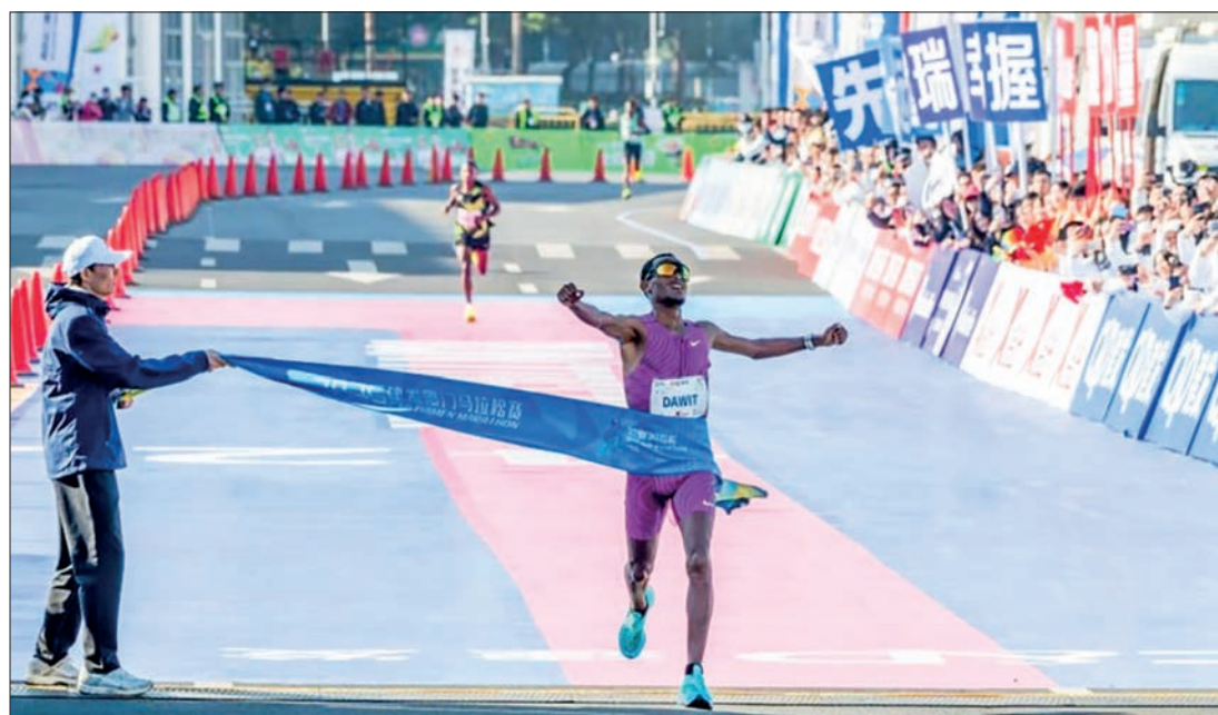
Dawit Wolde of Ethiopia crosses the finish line during the men's event of the Xiamen Marathon 2024 in Xiamen, southeast China's Fujian Province, 5 January 2025.