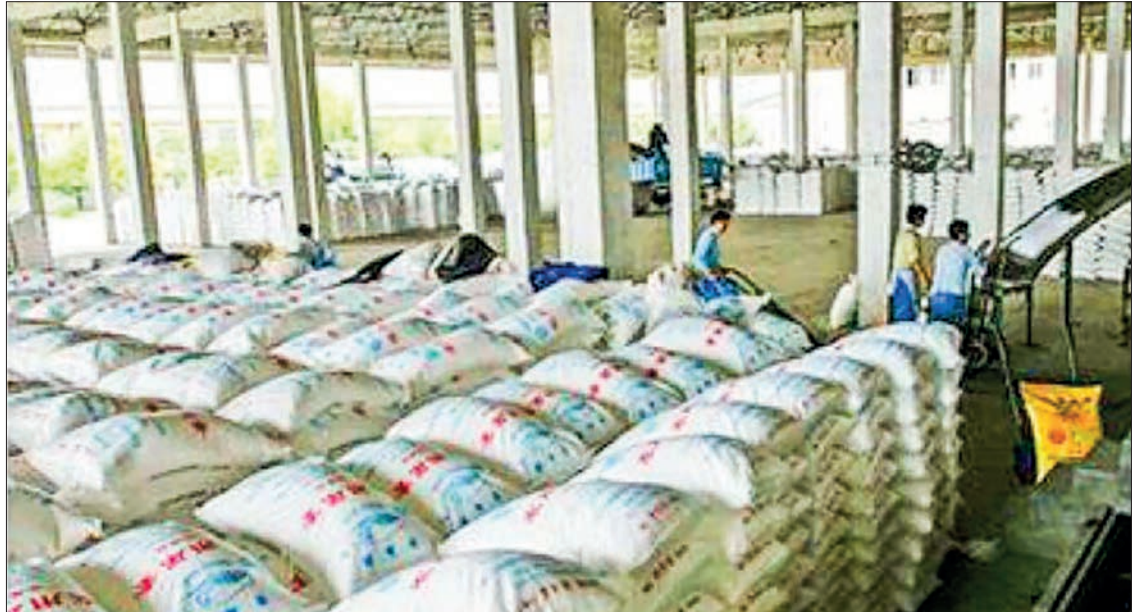
Bags of imported fertilizers in the domestic market.

At present, the Fertilizer Committee holds a quarterly meeting to ensure quality fertilizers for growers without facing shortages. Under the approval of Fertilizer Technology Group, 11,573 fertilizer registrations