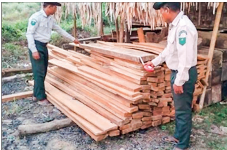
Confiscated illegal timbers in Bago Region.

Authorities seized illegal intermediate goods, foodstuffs, personal goods and timbers approximately K335.161 million from 2 to 4 January and action was taken against offenders under the law. — MNA/TTA