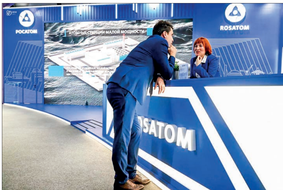
People gather at the stand of Russian State Atomic Energy Corporation Rosatom during the 2023 Russian Energy Week international forum at the Manezh Central Exhibition Hall in Moscow, Russia.