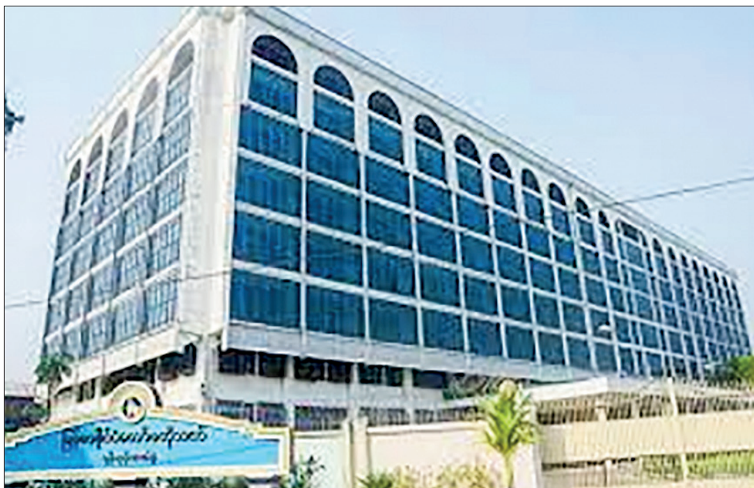
The Central Bank of Myanmar.

expiration of validity and 6,823 registrations are still under processing for now. — NN/KK