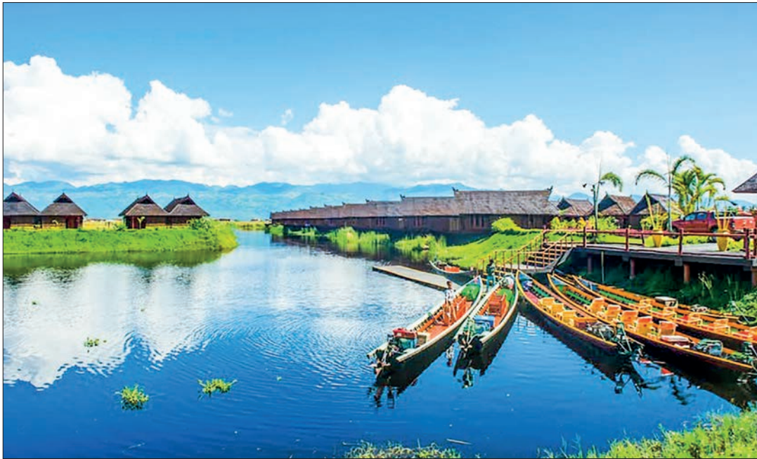
This photo showcases some sceneries and visitors in the Inlay region.

ACCORDING to the Shan State Directorate of Hotels and Tourism, over 7,000 domestic and foreign travellers visited Inlay region in Nyaungshwe Township, Shan State (South), in October and December 2024.