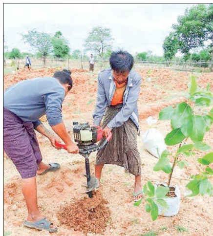
The Yenantha Dinga Brothers Parahita members were planting shade trees.

To ensure the survival of the plants, the gardeners are provided with houses in the gardens and financial support as maintenance fees. — Thit Taw/ZN