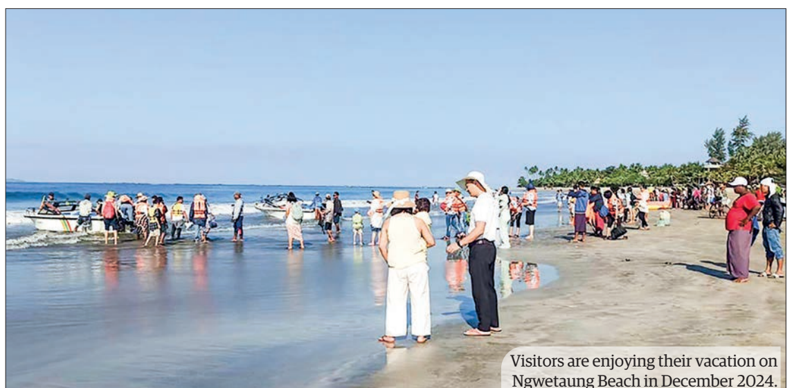
Visitors are enjoying their vacation on Ngwetaung Beach in December 2024.

safe and pleasant experience, the Ngwetaung Beach offers a range of services, including bi-