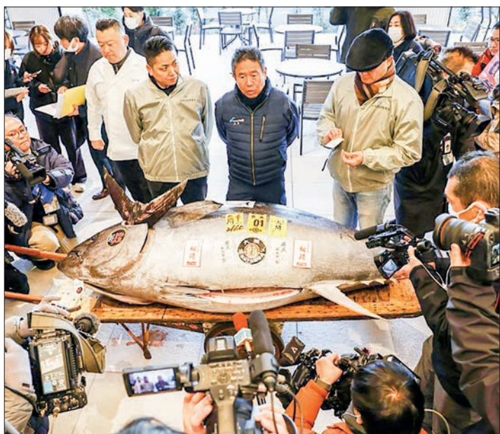
Photo shows the bluefin tuna that fetched 207 million yen ($1.3 million) during the year's first auction at Tokyo's popular Toyosu fish market on 5 January 2025.

A bluefin tuna fetched 207 million yen ($1.3 million) during the year's first auction at a popular fish market in Tokyo on Sunday, the second highest price on record and fueling hopes for a continued economic recovery in Japan.