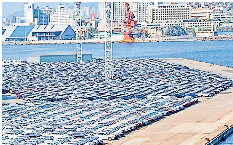
Sales of electric vehicles, on the other hand, dropped 21.2 per cent to 91,385 units in 2024, the data showed.

SOUTH Korean carmakers' domestic sales of eco-friendly cars hit a new record last year, driven by the popularity of hybrid