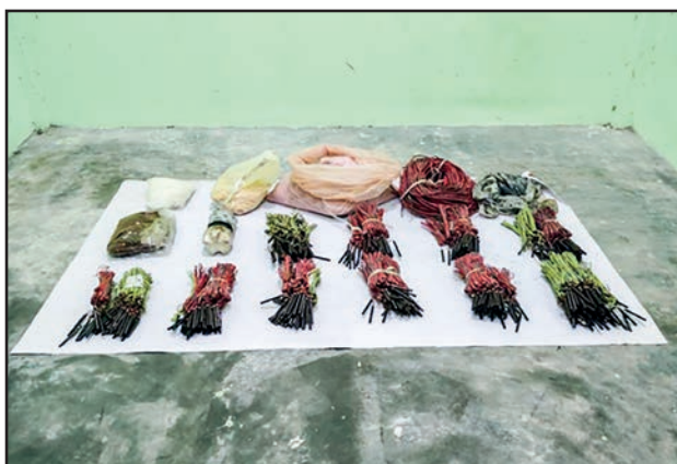
Photos show explosive materials and its related items and arms and ammunition seized in the precinct of the Yadana Theingka Monastery on Insein Road, West Gyogon Ward, Insein Township.

The terrorist group, Together Urban Force, under the command of Ko Myo (aka Sayar Kyaung, aka U Lay Gyi), carried out six bombings and two unprovoked assassinations in public places with the aim of undermining the State's governance and instilling fear among innocent people. — MNA