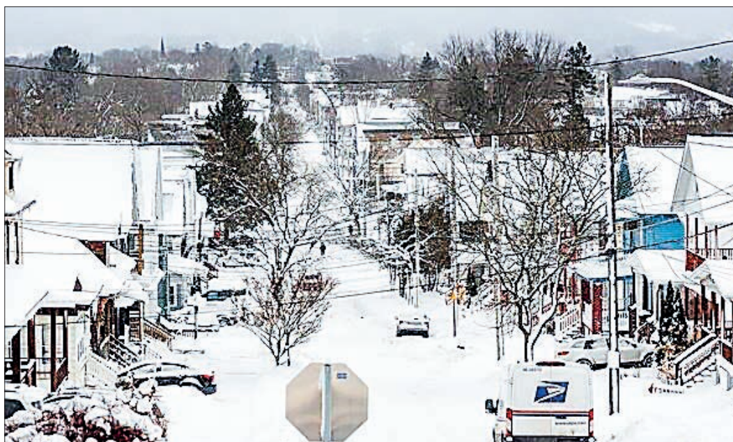
The major winter storm of 2025 is bringing heavy snow, freezing rain, and severe thunderstorms from the Central Plains to the East Coast.

In central Kansas, icy roads caused multiple truck