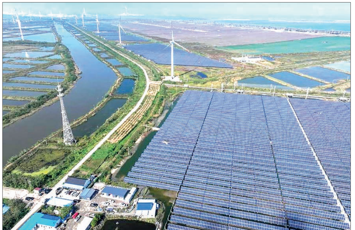
A drone photo taken on 3 November 2024 shows a photovoltaic power project in Rudong County of Nantong City, east China's Jiangsu Province.

With a total installed capacity of 400 megawatts, the Rudong project, spanning 4,300 mu (about 287 hectares), features a newly constructed 220 kV onshore booster station, a 60 MW/120 MWh energy storage facility, and a hydrogen production and refueling station with a production capacity of 1,500 standard cubic metres per hour and hydrogen refueling capability of 500 kilogrammes per day. Once fully operational in 2025, the project is expected to generate an average of 468 million kilowatt-hours of electricity annually, equivalent to saving approximately 151,000 tonnes of standard coal each year. — Xinhua