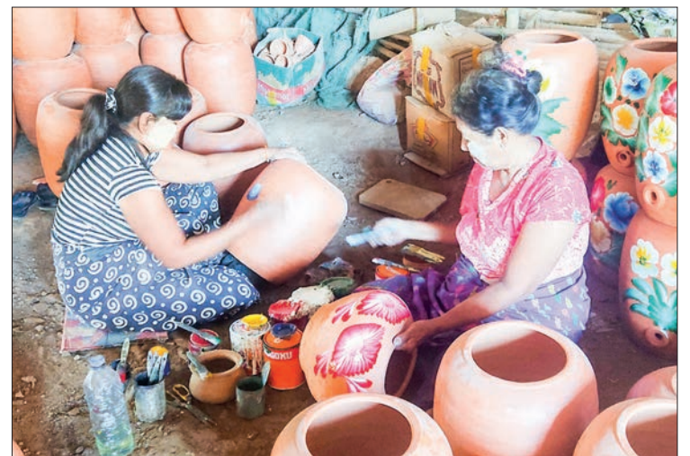
Female workers are seen in production process of pottery industry in Twantay Township.