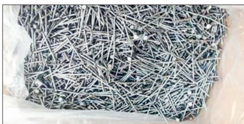
Confiscated illegal construction materials at Thilawa Port.