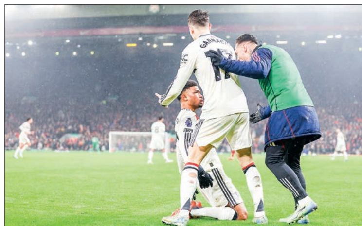
Manchester United's Ivorian midfielder #16 Amad Diallo (C) celebrates with teammates after scoring their second goal during the English Premier League football match between Liverpool and Manchester United at Anfield in Liverpool, north west England on 5 January 2025. PHOTO:AFP

The Portuguese's plan to frustrate Liverpool worked but the home side did have the chances early on to make the breakthrough. — AFP