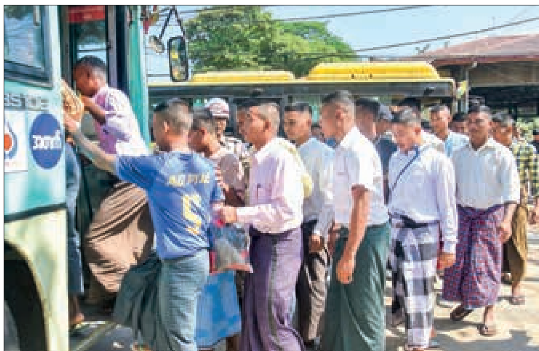
Some released prisoners from the Insein Prison are pictured boarding the bus for their homes in front of the prison in Yangon yesterday.

THE government has granted amnesty to 5,864 local prisoners and 180 foreign prisoners from prisons across the nation in commemoration of the 77 th Independence Day and on humanitarian grounds.