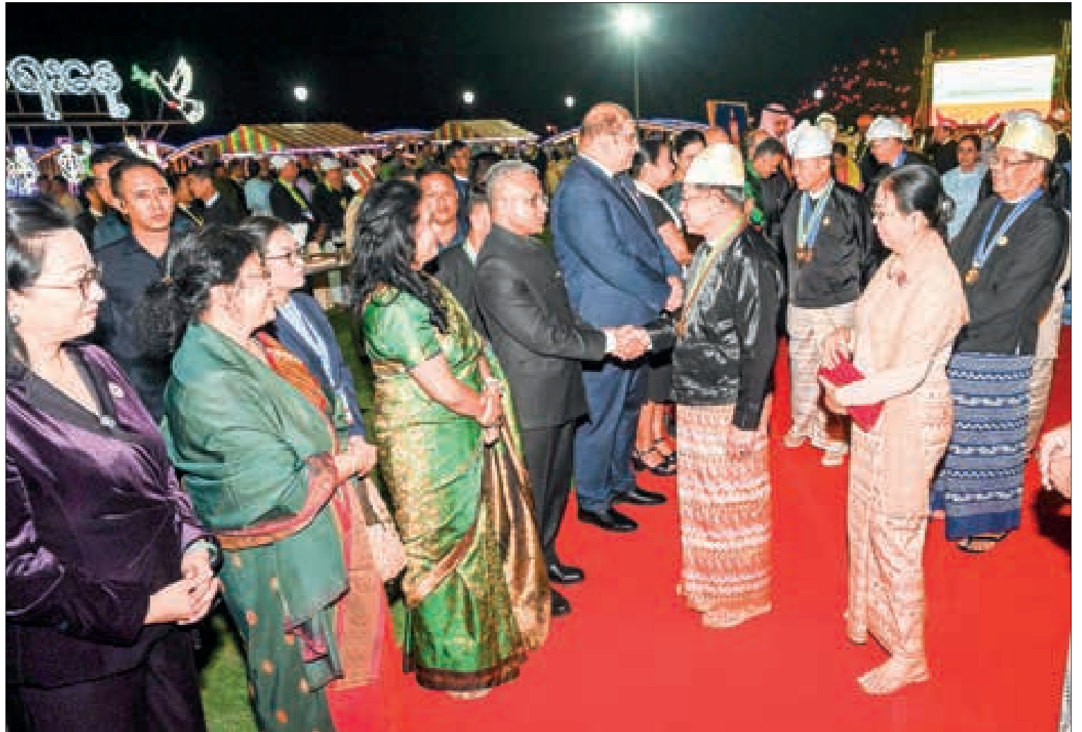
Chairman of the State Administration Council Prime Minister Senior General Thadoe Maha Thray Sithu Thadoe Thiri Thudhamma Min Aung Hlaing cordially greets diplomats at the 77 th Anniversary of Independence Day dinner in Nay Pyi Taw yesterday.