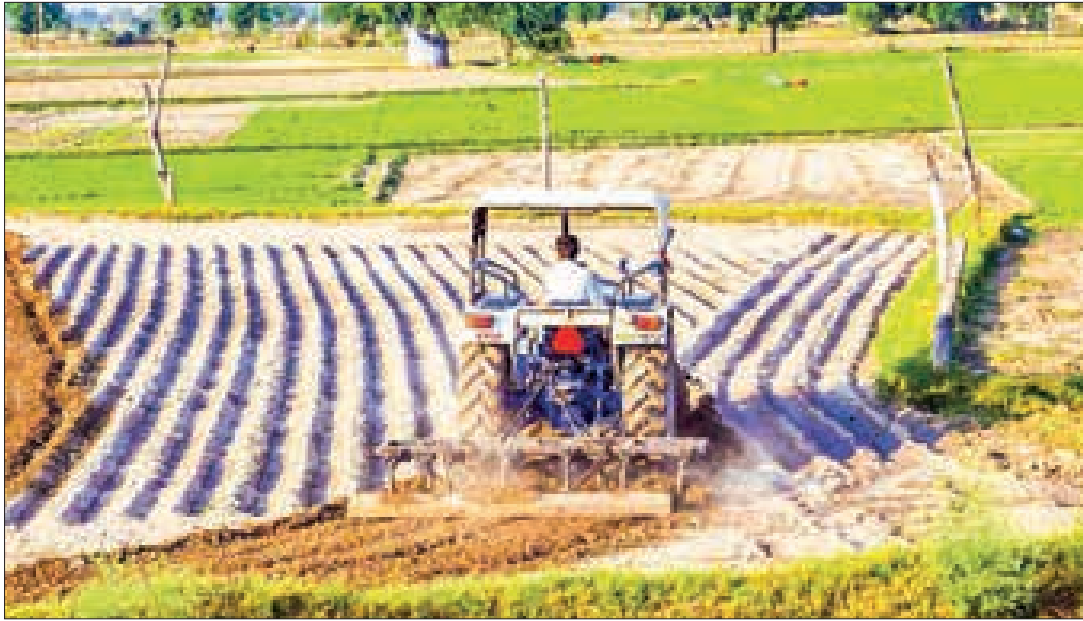
Agriculture still employs a large portion of India's population. Introducing advanced farming techniques, better irrigation systems, and more equitable land reforms can increase productivity and income for farmers.