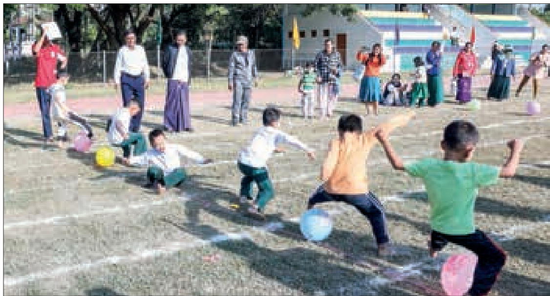
Deputy Minister for Information U Ye Tint enjoys a competition of students at No 11 Basic Education High School in Zabuthiri Township at the Independence Day fun and sports event in Nay Pyi Taw Council Area yesterday.

Simultaneously, sports competitions were unfolded in various basic education schools and residences within the Nay Pyi Taw Council Area. Students, family members, and residents participated, and awards were distributed by educators, school heads, and officials from each ward based on sports achievements. — MNA/MKKS