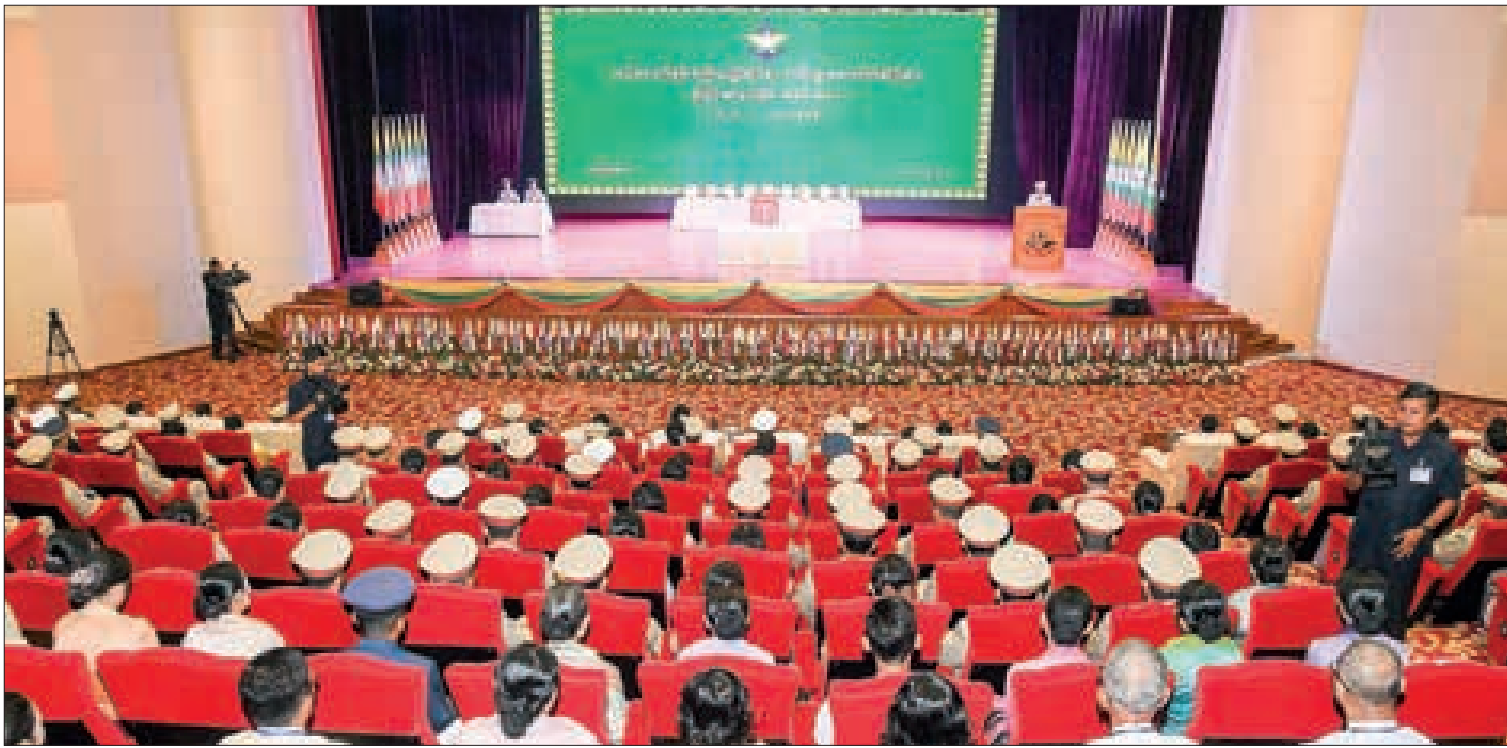
State Administration Council Chairman Commander-in-Chief of Defence Services Senior General Thadoe Maha Thray Sithu Thadoe Thiri Thudhamma Min Aung Hlaing delivers the address at the conferring of honorary medals on recipients at Zeyathiri Beikman in Nay Pyi Taw yesterday.