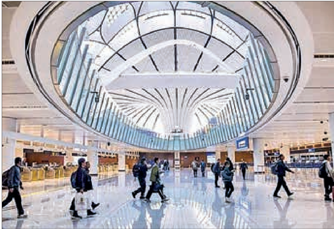
Foreign tourists go through customs at the Beijing Daxing International Airport in Beijing, capital of China, 27 December 2024.

emergency response efficiency and carry out special security inspections for the upcoming Spring Festival travel rush.