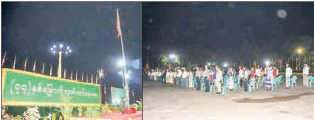
The 77 th Independence Day flag-hosting and saluting ceremony in progress in Yangon yesterday.