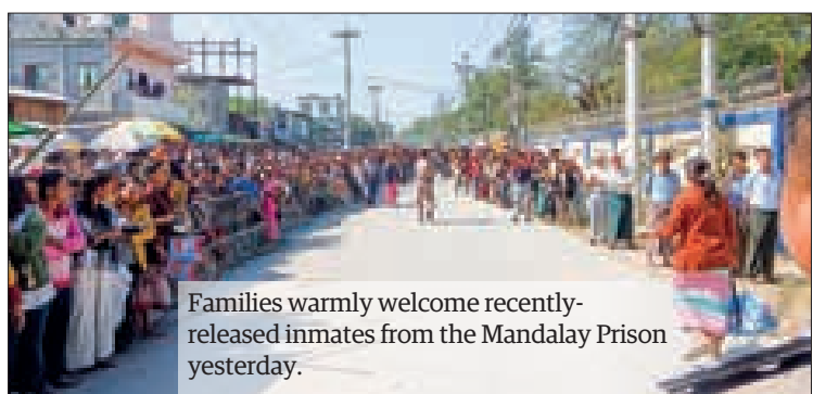
Families warmly welcome recently-released inmates from the Mandalay Prison yesterday.

Yesterday’s release included a total of 1,141 prisoners across five prisons and seven labour camps within the Mandalay Region, comprising 877 males and 264 females. — MNA/KZL