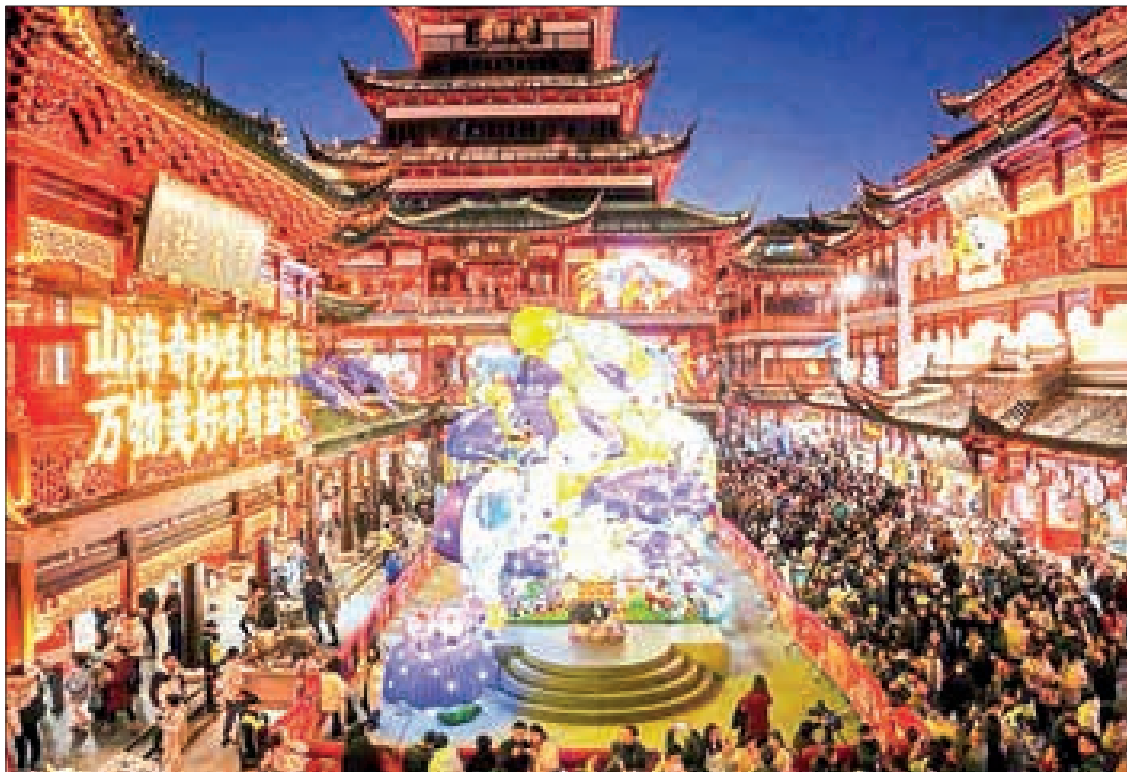
People visit the Yuyuan Garden Lantern Festival at Yuyuan Garden in east China’s Shanghai, 1 January 2025.

The event aims to meet people’s consumption needs during