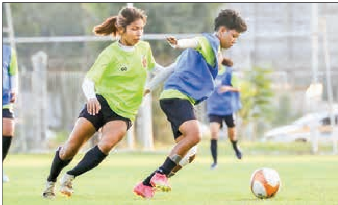
The Myanmar women's national football team is seen under training.

Team Myanmar will also compete in the ASEAN Women's Championship, the AFC Women's Asian Cup qualifiers and the 33 rd Sea Games in Thailand.