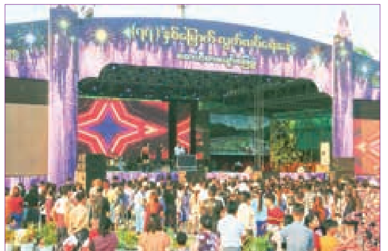
A crowded audience watches the music concert at the music shows at People's Square in Yangon to commemorate the 77 th Independence Day, yesterday.

To maintain cleanliness and order at the festival, garbage bins have been placed for visitors to properly dispose of their waste, and mobile toilets have been provided. — Zaw Min Latt (MNA)/MKKS