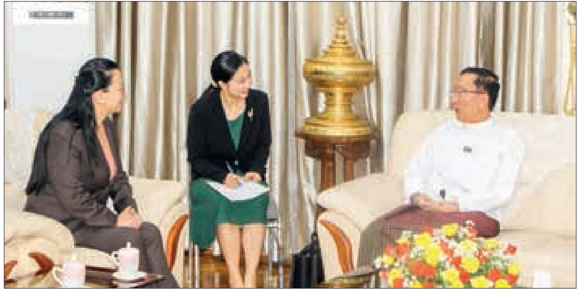
China's Ambassador Ms Ma Jia calls on Deputy Prime Minister Union Minister U Win Shein in Nay Pyi Taw on 3 January 2025.

Also present at the meeting were Deputy Minister U Min Htut and departmental officials.