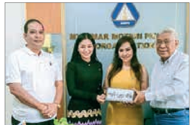
This photo showcases actress Saung Yoon San donating K2.5 million to MMPO.

event from 3 to 6 April, 2024. During the event, sector wide members of the film industry received rice, cooking oil, and other foodstuffs. — ASH/MKKS