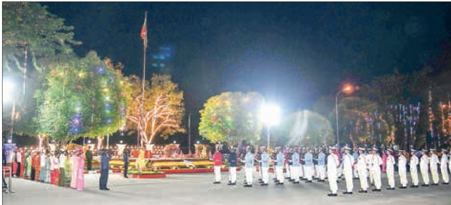
The 77 th Independence Day flag-hosting and saluting ceremony in progress in Nay Pyi Taw yesterday.

At 6 am, union-level dignitaries, union ministers, the Union Auditor-General, the Chairman of Union Civil Service Board, the Nay Pyi Taw Council Chairman, the Governor of Central Bank of Myanmar, Union level officials, the commander of Nay Pyi Taw Command, deputy ministers, departmental heads, service personnel, national races and people took the respective positions in