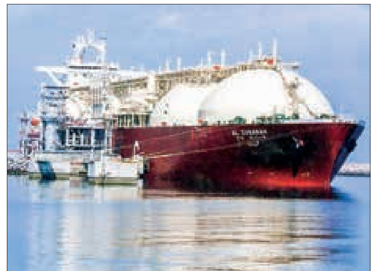
A file photo shows a Qatari liquid natural gas (LNG) tanker being loaded up with LNG at Ras Laffan, northern Qatar.

On the other hand, increases were recorded mainly in Chemicals and Related Products by QR1.5 billion (24.5 per cent), Machinery and Transport Equipment by QR1.2 billion (53.3 per cent), Manufactured Goods Classified Chiefly by Material by QR0.4 billion (17.1 per cent), and Crude Materials, Inedible, Except Fuels by QR0.1 billion (24.8 per cent). — ANI