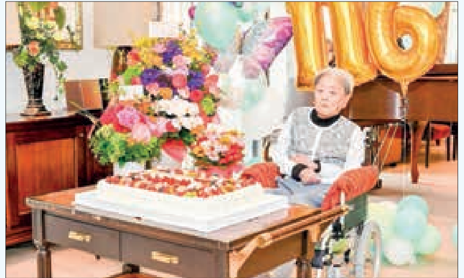
The world's oldest person, Japanese woman Tomiko Itooka, has died aged 116, the city where she lived, Ashiya, announced on Saturday. Itooka celebrates her 116 th birthday in the city of Ashiya, Hyogo prefecture.

She was subsequently recognized as the world's oldest living person by Guinness World Records in September 2024, following the death of the previous holder, Maria Branyas Morera, a 117-year-old from Olot, Catalonia, Spain.