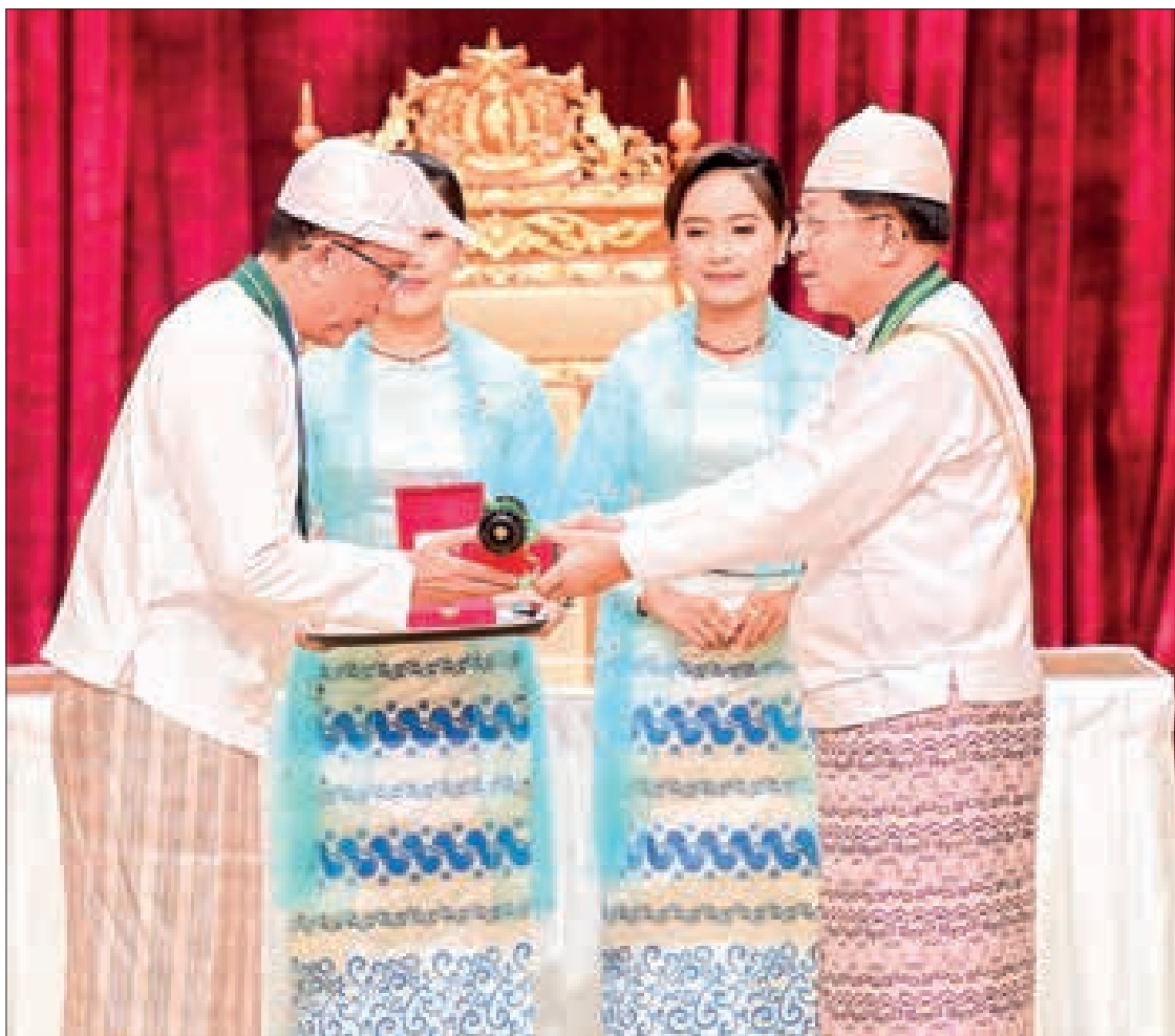
State Administration Council Chairman Prime Minister Senior General Thadoe Maha Thray Sithu Thadoe Thiri Thudhamma Min Aung Hlaing confers the Sithu title on Deputy Prime Minister Union Minister for Planning and Finance U Win Shein at the conferring of honorary titles on recipients at SAC Chairman's Office in Nay Pyi Taw yesterday.

State Administration Council Chairman Prime Minister Senior General Thadoe Maha Thray Sithu Thadoe Thiri Thudhamma Min Aung Hlaing attended a ceremony to confer honorary titles to mark the 77 th Anniversary of Independence Day to relevant recipients yesterday.