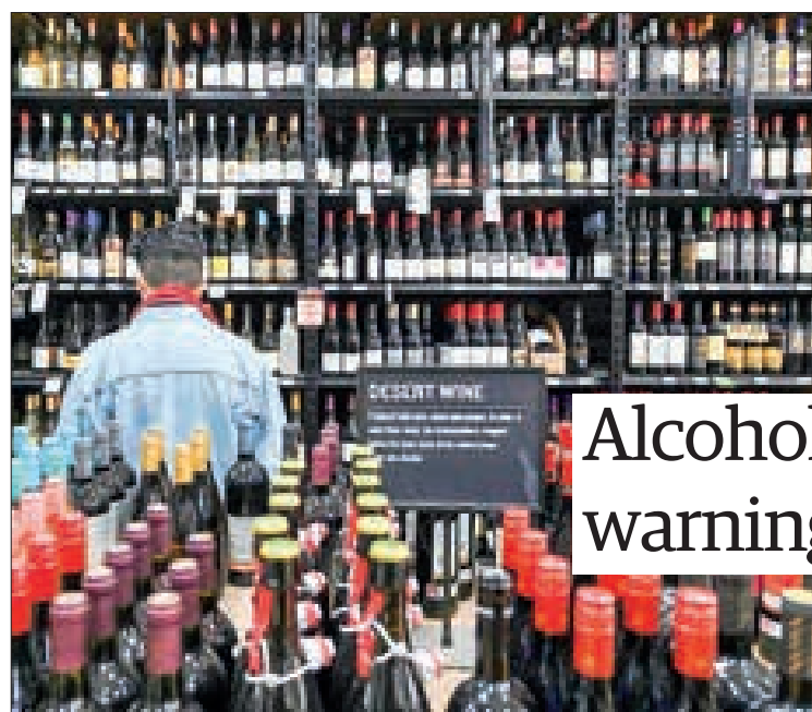
US Surgeon-General Vivek Murthy called for health warnings on alcoholic drinks to highlight their cancer risk.

Kowa, whose business fields range from textile trading to the manufacturing of medical products, has developed sheets from the thread that can be mixed with carbon fiber reinforced polymers used in applications such as golf clubs and other sporting equipment to create a light and strong material. — Kyodo