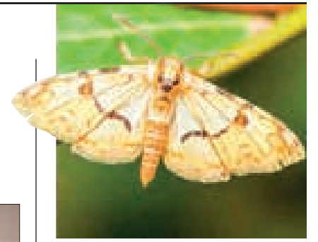
The larvae expel a versatile, biodegradable thread to build protective nests by binding leaves, twigs, and other materials.

travel season, which will run from 14 January to 22 February according to the CAAC. — Xinhua