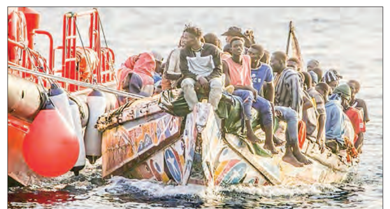
Spain has moved to the forefront of the European Union's migration crisis.

A record 46,843 migrants reached Spain's Canary Islands illegally in 2024 via the increasingly deadly Atlantic route, the second consecutive year of unprecedented arrival numbers, official data showed on Thursday. The landmark came as the European country received 63,970 irregular migrants last year, the vast majority in the Atlantic archipelago, up from 56,852 in 2023, the interior ministry said.