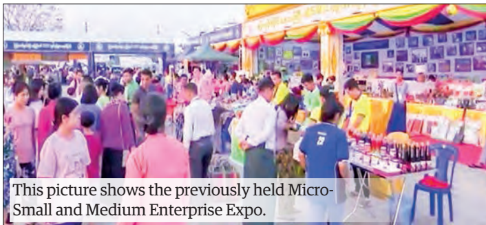
This picture shows the previously held Micro-Small and Medium Enterprise Expo.

That expo will be held on a grand scale near Up-patasanti Pagoda in Nay Pyi Taw. Businesses showcasing One Region One Product (OROP) will be awarded