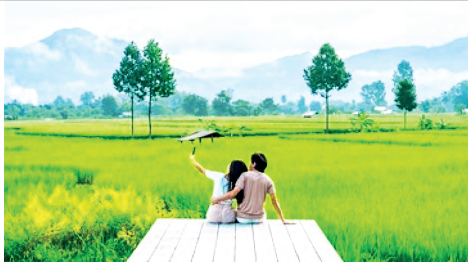
Myanmar's landscapes also lend themselves beautifully to this rewinding of romance. Imagine wandering together through a golden paddy field at sunset or sharing a quiet moment in the cool shade of a monastery's courtyard.

In this rewinded approach to love, the art of storytelling becomes paramount. Myanmar's oral traditions — from folktales to love ballads — offer a blueprint for expressing affection through words. Imagine sitting beneath a star-filled sky, listening to someone recount a story of two lovers overcoming obstacles. Such narra-