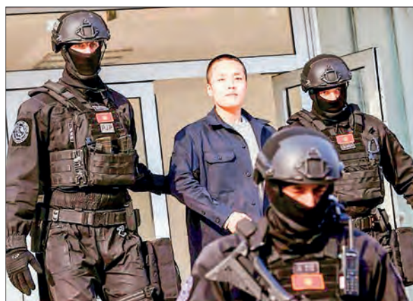
South Korean cryptocurrency entrepreneur Do Hyeong Kwon at a court appearance in Podgorica, Montenegro, in March 2024.

“Do Hyeong Kwon will now be held accountable in an American courtroom for... his elaborate schemes involving Terraform’s cryptocurrencies, which resulted in over $40 billion in investor losses,” Attorney General Merrick Garland said in a statement. — AFP