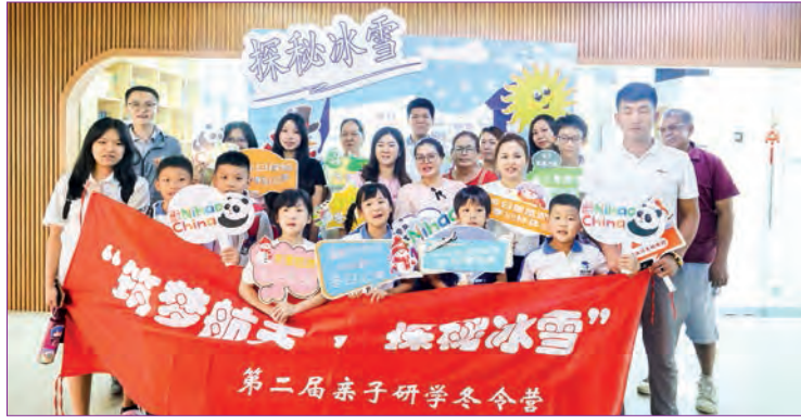
This image depicts a documentary group photo of the Myanmar schoolchildren and parents in China.

The programme, facilitated by the Bowen School with assistance from the Chinese Embassy, aims to strengthen people-to-people ties and foster friendship as part of the ongoing bilateral relations between Myanmar and China.