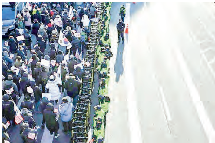
Police keep watch as supporters of South Korea's impeached President Yoon Suk Yeol gather.

Yoon's defence team has maintained that the warrant is illegal, asserting the investigation office is not authorized to probe insurrection. "Legal action will be taken regarding the unlawful circumstances of the execution process of the illegal warrant," the defense team said in a message sent to media on Friday. — Kyodo