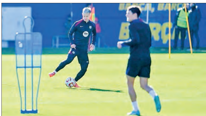
Barcelona midfielder Dani Olmo (L) is in an uncertain situation with the club not yet registering him.

Barcelona signed Olmo for around 60 million euros ($62 million) in the summer and according to Spanish media his contract includes a clause which would allow him to be