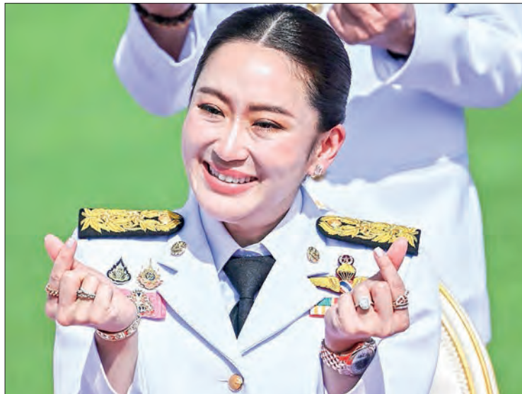
Thailand's Prime Minister Paetongtarn Shinawatra has declared more than $400 million in assets, including at least 75 luxury watches, valued at almost $5 million.

baht ($400 million) in assets, a document posted on media websites showed.