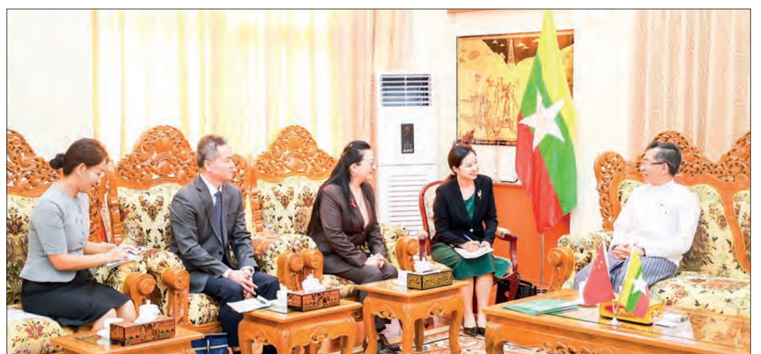
China's Ambassador Ms Ma Jia calls on Union Minister U Ko Ko Lwin yesterday.

UNION Minister for Energy U Ko Ko Lwin held talks with Ambassador Ms Ma Jia of the People's Republic of China to Myanmar yesterday at the guest hall of the Union Minister's office in Nay Pyi Taw.