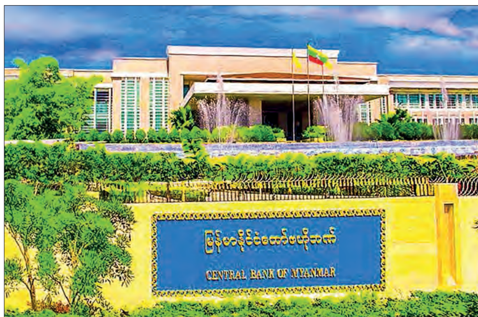
The facade of the Central Bank of Myanmar in Nay Pyi Taw.

KBZPay is committed to digital wallet security measures in cooperation with mobile network operators and the Central Bank of Myanmar. During the inspection process, KBZPay refunded scam-induced loss of 31 users from 31 December 2024. — NN/KK