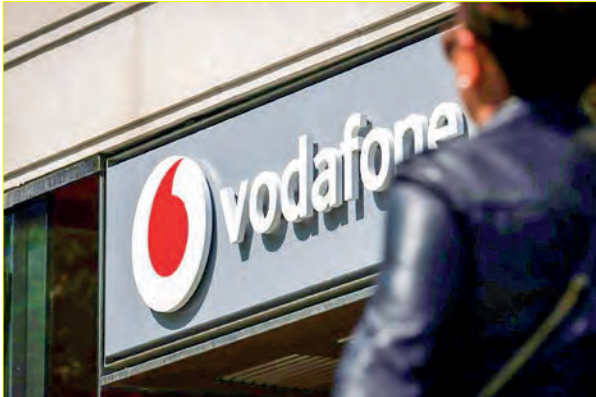
Vodafone on Thursday added that it would continue to provide certain services to Vodafone Italy for up to five years.

It follows agreements to sell Vodafone’s Spanish division and the merger of its UK unit with rival Three, owned by Hong Kong conglomerate CK Hutchison.