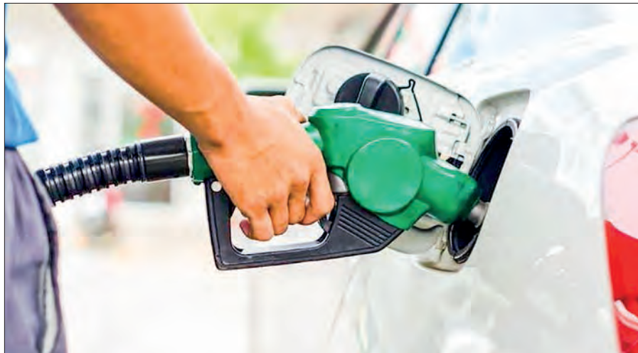
A vehicle being fuelled at the filling station in Yangon.

The committee is inspecting the fuel stations to see whether they are overcharging. Authorities are