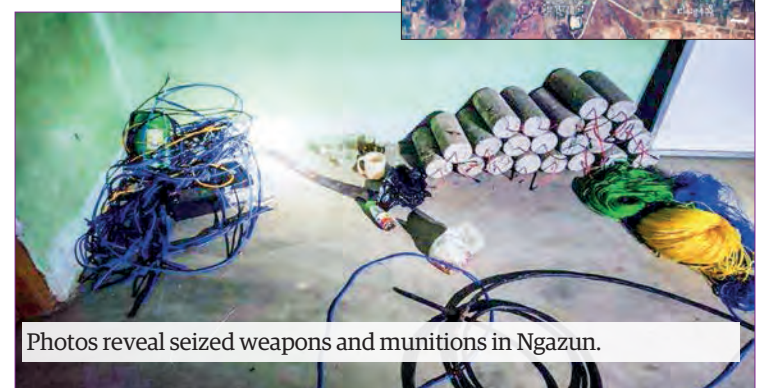
Photos reveal seized weapons and munitions in Ngazun.