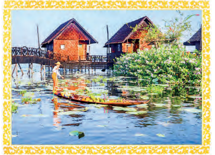
Inlay Lake.

[An excerpt from the radio speech delivered by Bogyoke Aung San on 1 January 1947]