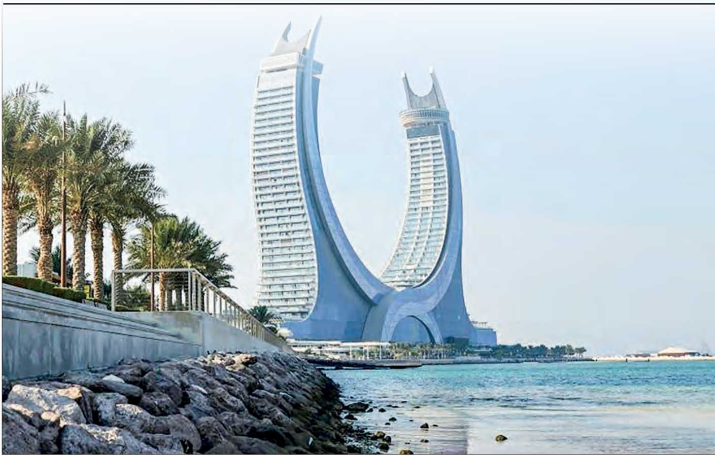
Israel will send a delegation to Doha on Friday to resume negotiations for a hostage agreement related to Gaza.