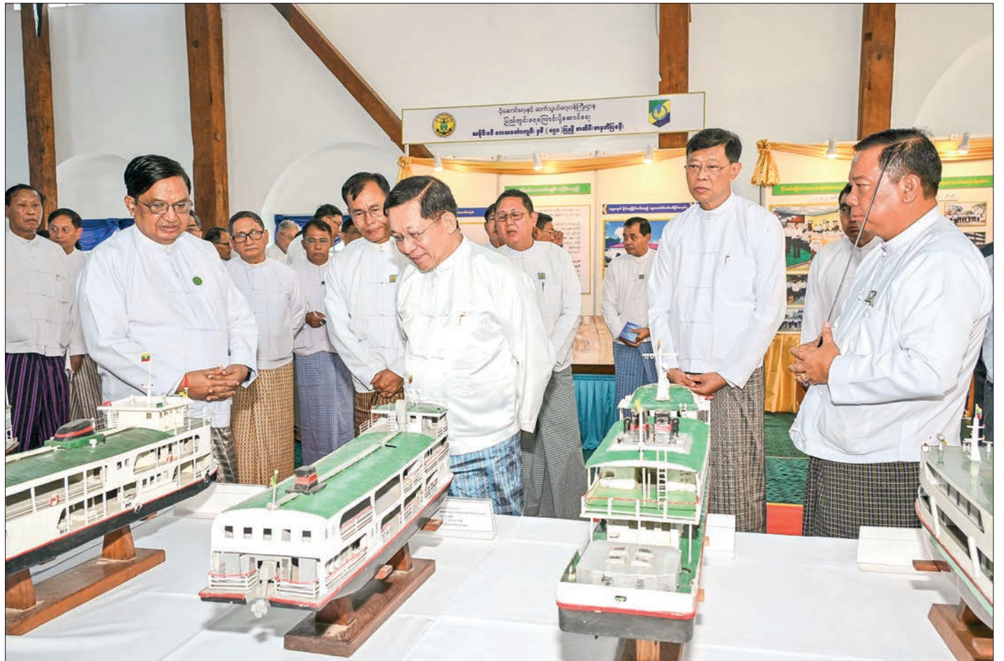
State Administration Council Chairman Prime Minister Senior General Min Aung Hlaing tours the exhibition at the sesquicentenary celebration of the Dala Dockyard in Yangon.

The Senior General highlighted that State-owned dockyards need to consider long-term interests with high capabil-