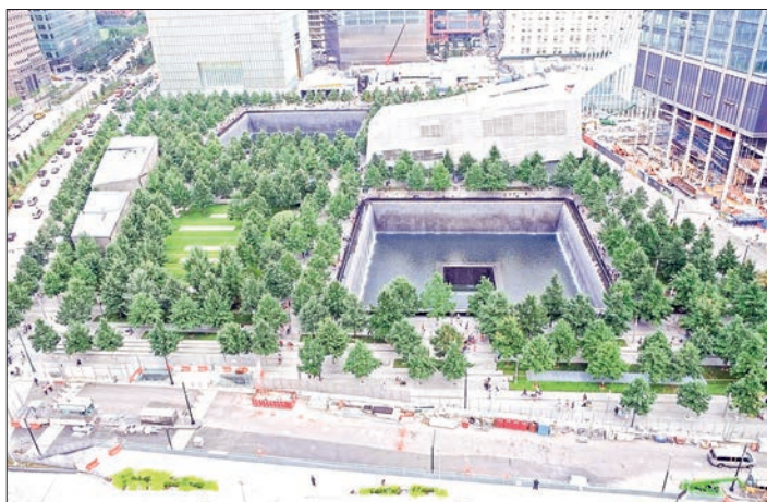
The National September 11 Memorial & Museum is a tribute to the nearly 3,000 victims of the terrorist attacks of 11 September 2001, and the six individuals killed in the 1993 World Trade Centre bombing.