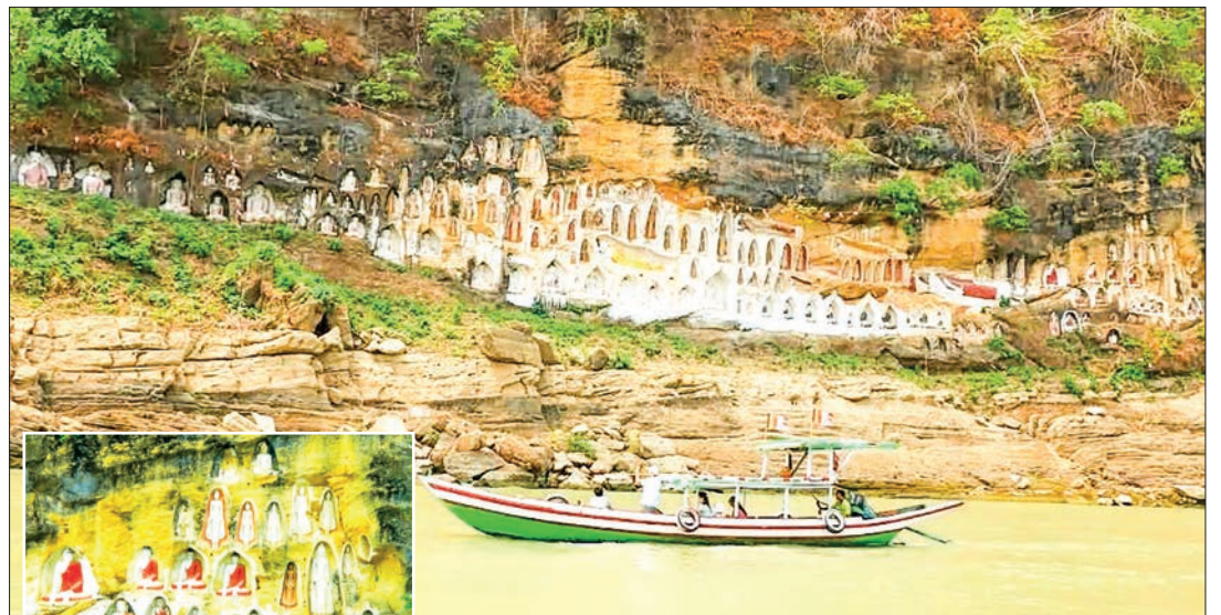
Photos showcase Akaukaung with cliff carvings of Buddha images along the Ayeyawady River (above) and pilgrims gathering for the Akaukaung pilgrimage (below).

DURING the New Year holiday, there are many day trip visitors from Yangon Region to Pyay-Akaukaung, Bago and Zalun Pyidawpyan Pagoda, according to some travel companies and tourists.