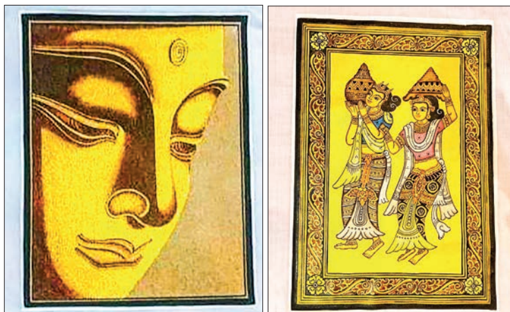
Photos showcase sand paintings created by an artist.