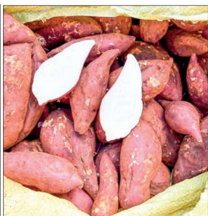
Korean sweet potato gains popularity in the domestic market.

ACCORDING to traders from Taunggyi Township, Korean sweet potato (white sweet potato) has been popular recently in the domestic market and most orders are placed from Yangon Region.