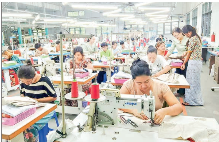
Diligent female workers sewing garments at their workplace.

The fee is K120,000 for non-members. Members can enjoy a K20,000 discount. Trainees will receive a completion certificate. Those enthusiastic can enrol in the course by 13 January through https://shorturl.at/DiFA3 . For further details, individuals can contact 09 965209010 during office hours. — NN/KK