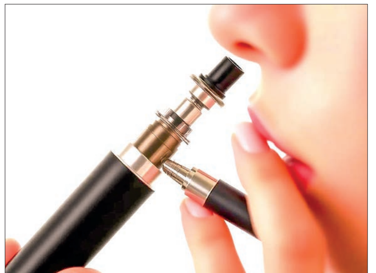
Vapes, often promoted as a less harmful alternative to traditional cigarettes, have gained popularity in recent years.

Health experts warn that nicotine consumption is particularly damaging to the adolescent brain, potentially leading to long-term addiction and increasing the likelihood of using other drugs. Additionally, the environmental impact of disposable vapes, which contribute to significant plastic waste, has also sparked concern. — AFP