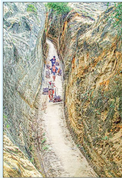
This image shows the Japky Road near Yenangyoung.

Currently, the region has about 50 officially licensed hotels and guesthouses. Efforts are ongoing to enhance service quality provided by these facilities to ensure a comfortable stay for all visitors. — ASH/TMT