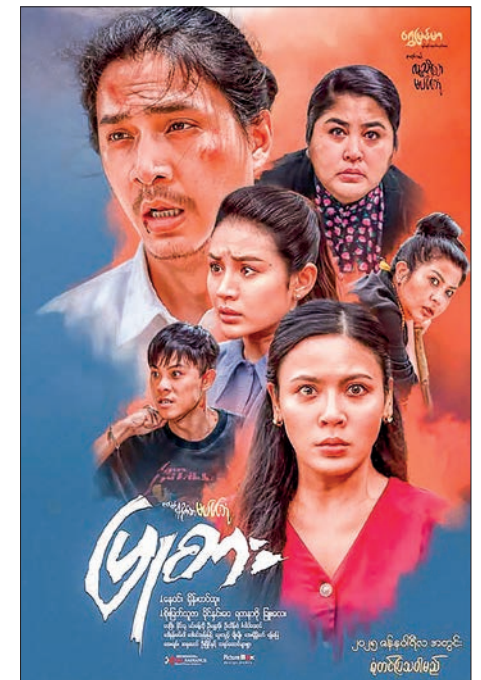
This image showcases a poster for the 'Pyusa' film.