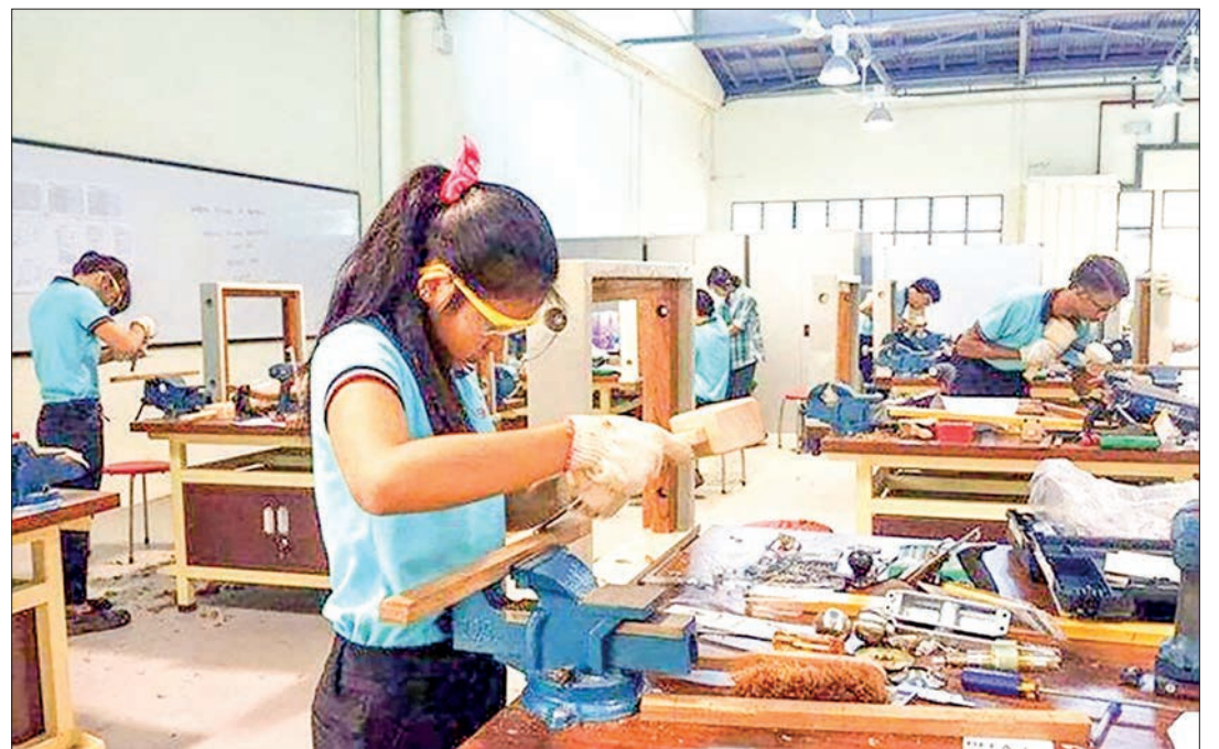
Trainees keenly engaged in their practical session.

THE Department of Social Welfare under the Ministry of Social Welfare, Relief and Resettlement will be recruiting trainees for school-based domestic vocational training courses at its schools in ten big cities including Yangon.