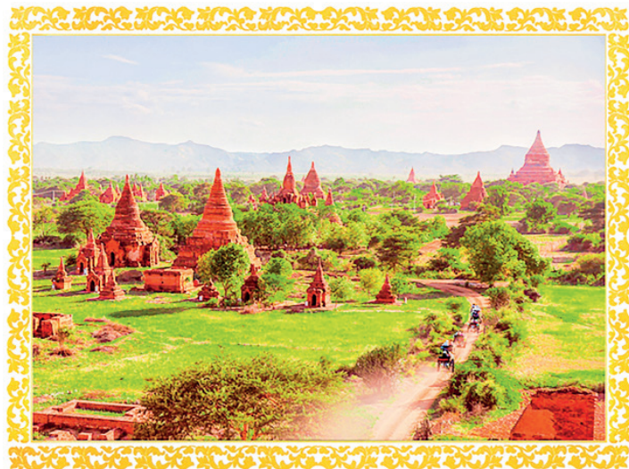
Bagan landscape.

(An excerpt from the speech delivered by Chairman of the State Administration Council, Prime Minister Senior General Min Aung Hlaing on the occasion to mark the Ninth Anniversary of the Signing of the Nationwide Ceasefire Agreement (NCA) held on 15 October 2024)