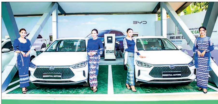
A promotional event featuring BYD electric vehicles and a demonstration of a charging station.

ACCORDING to the Ministry of Construction, building additional EV charging stations along the Yangon-Mandalay Expressway (the Nay Pyi Taw-Yangon section) is expected to be completed within three months.