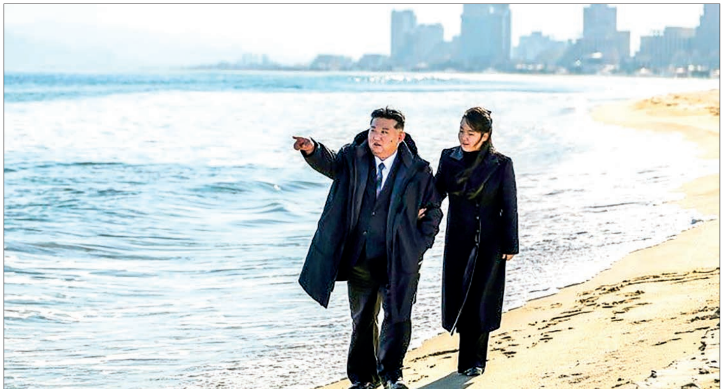
North Korean leader Kim Jong Un and his daughter toured a new resort development, according to state news agency KCNA.

North Korean leader Kim Jong Un launched plans for a new beachside tourist resort as part of the ongoing Wonsan-Kalma development project.