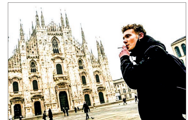
Milan's new tough ban on smoking on city streets or crowded public areas does not apply to e-cigarettes.