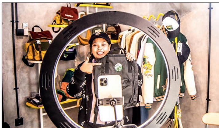
A merchant promotes a product via livestreaming on the TikTok in Sleman district, Yogyakarta, Indonesia, on 8 September 2023.

"In 2025, we will remain focused on empowering local sellers, including MSMEs, to thrive in the digital economy and ultimately make local brands the primary choice for Indonesians," said Aditia Grasio Nelwan, head of communications at Tokopedia and TikTok E-commerce, in an interview with Xinhua. — Xinhua