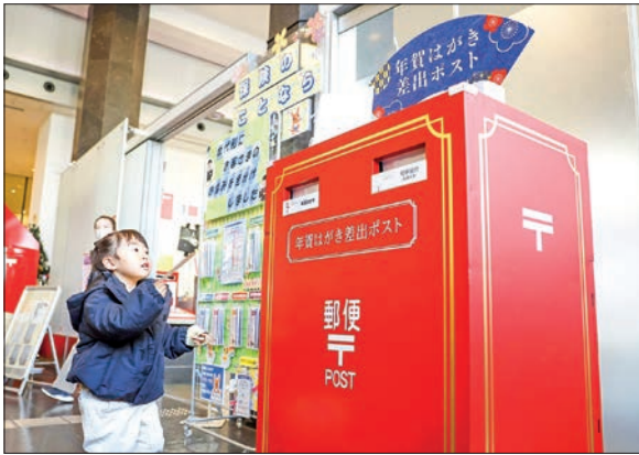
A girl puts a postcard in a special mailbox for New Year's cards at a Tokyo post office on 15 December 2024.

Lucky bags, which keep shoppers guessing what is inside until they purchase them, and other New Year's items came second, followed by dining out, according to research firm Intage Inc. — Kyodo