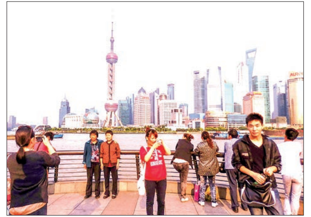
Shanghai attracts tourists with its blend of modern skyscrapers, historic landmarks, vibrant culture, and iconic attractions like the Bund and Yu Garden.

policy changes after the pandemic, exploring China is now easier than ever before. China has expanded