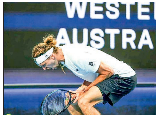
World number two Alexander Zverev pulled out of the United Cup with a bicep injury.

ELENA Rybakina's Kazakhstan dumped defending champions Germany out of the United Cup on Wednesday with world number two Alexander Zverev sidelined by an arm injury barely a week away from the Australian Open. The upset in Perth sent the Kazakhs into the semi-finals of the 18-nation tournament.