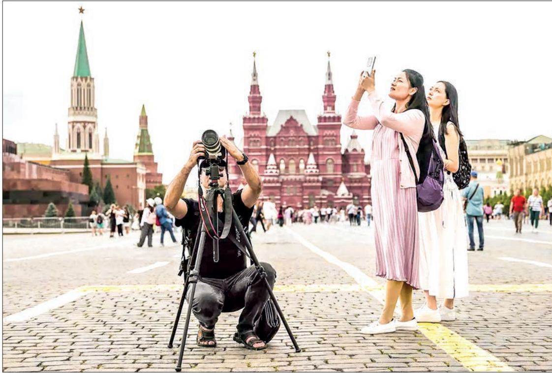
A new tourist tax has come into effect across Russia on Wednesday, replacing the previous resort fee.

In July 2024, Russia's Tax Code added a "Tourist Tax", empowering regions with tourism sectors to adopt it locally.