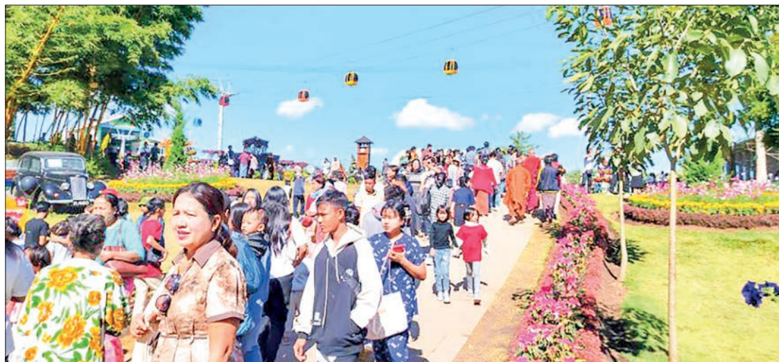
Visitors exploring the Pwe Kauk Waterfall and its surroundings near the PyinOoLwin-Lashio road.

pared various models using different types of flowers for the BE Falls Flower Festival.