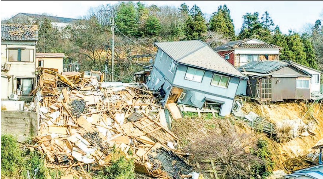
A powerful 7.5 magnitude earthquake struck the Noto Peninsula in Ishikawa Prefecture, Japan, on 1 January 2024.

As of late December, 21,000 residents in Ishikawa Prefecture remain evacuated, with infrastructure restoration and demolition incomplete.