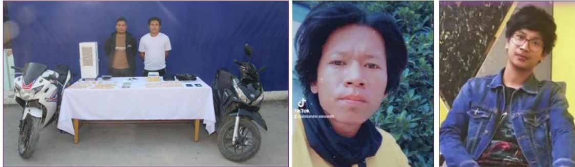
The arrested offenders are shown with the stolen gold and motorbikes used in the robbery (left), while two suspects remain at large (centre and right)

Authorities traced a Honda CBR 150 (licence plate 36W/96027) motorcycle used