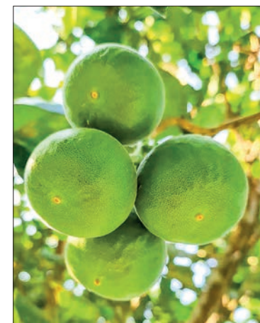
Pomelo fruits thriving at Kyaikto farm.

“The fruit yield was quite low last year. It was almost out of stock this time last year. Pomelo is available until February. Then, Mon's sweet fruits