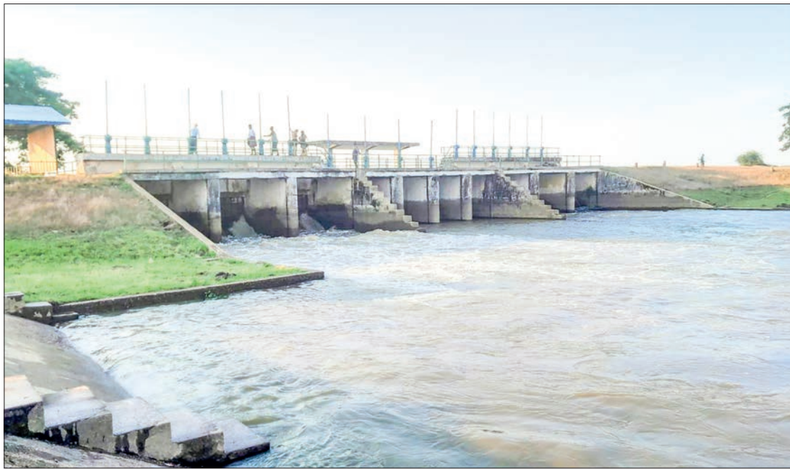
The Moeyungyi Dam.

These dams in Bago Region support over 80,000 acres in Bago District and more than 60,000 acres in Nyaunglebin District. Among them, the Kawliya Reservoir in Nyaunglebin has the capacity to store water for more than 160,000 acres, benefiting a wide area, including Thanetpin, Kawa, and Waw townships in Bago Region, as well as Kayan