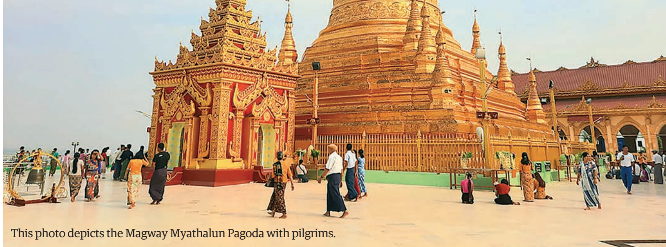
This photo depicts the Magway Myathalun Pagoda with pilgrims.