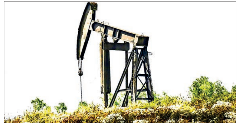
The landlocked country's vital oil was shipped through Port Sudan, with Khartoum's transit fee.

"The ministry of petroleum is hereby declaring the 30 th December 2024 as the official kick-off date for the resumption of