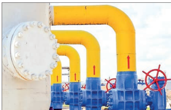
Gazprom confirms no gas transit via Ukraine after agreement expiration, halting supply at 8 am Moscow time.

The expired Gazprom-Naftogaz deal leaves no legal or technical capacity for Russian gas transit through Ukraine.