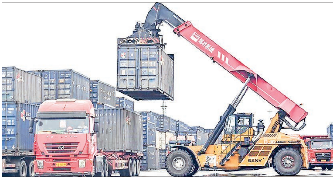
A crane uploads containers at a railway container distribution center in Qinzhou City.

The departure marked the first time the annual train volume reached 10,000 on the new western land-sea corridor, reflecting a 5.1 per cent year-on-year increase.