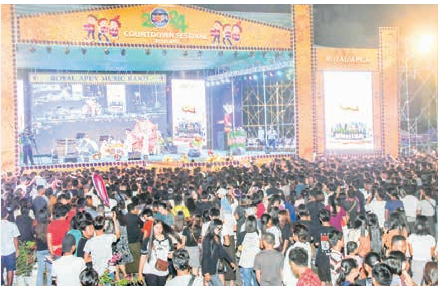
People join New Year Countdown Live Show for 2024 in People's Square in Yangon yesterday.

As the New Year arrived and the Old Year departed, people across the nation joyfully welcomed the New Year 2024 with New Year Countdown Live Shows and market festivities.