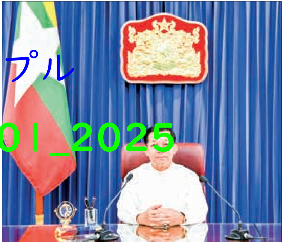
Chairman of the State Administration Council Prime Minister Senior General Thadoe Maha Thray Sithu Thadoe Thiri Thudhamma Min Aung Hlaing.