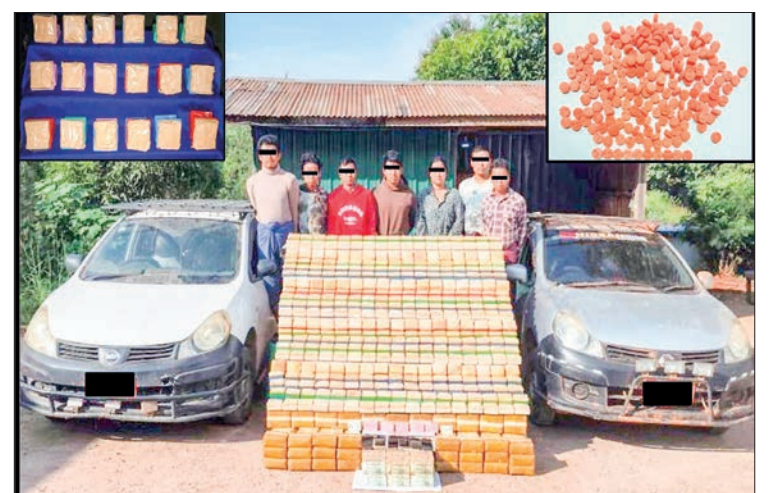
Offenders seen alongside confiscated drugs and vehicles.

Legal proceedings are underway, and an ongoing investigation is conducted to apprehend others involved in the case. — MNA/MKKS