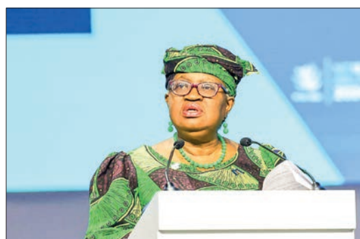
WTO chief Ngozi Okonjo-Iweala is likely to face turbulence in her second term given Donald Trump's renewed tariff threats. PHOTO: AFP

the appointment process for the next mandate had initially been scheduled to take months. — AFP