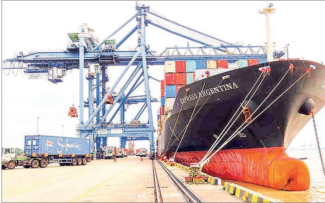
An overseas container vessel docks at Yangon Port for loading and unloading.

Myanmar Port Authority has arranged maritime trade channels to handle increasing imports to meet domestic demand, bolster exports, and improve port capacity for significant ship arrivals. Myanmar Port Authority notified that it will inform exporters and importers of ship arrival schedules promptly upon extended schedule.