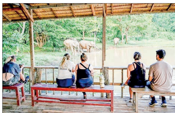
Tourists check out the elephants at the ECC's 500-hectare sanctuary.

Around 10 elephants die each year for every one to two born, a rate that puts the animals at risk of dying out completely in the Southeast Asian nation. Efforts to conserve Laos' dwindling elephant population focus on breeding programmes, DNA analysis, and sanctuary care to preserve genetic diversity and support potential wild population recovery amidst declining numbers. — AFP