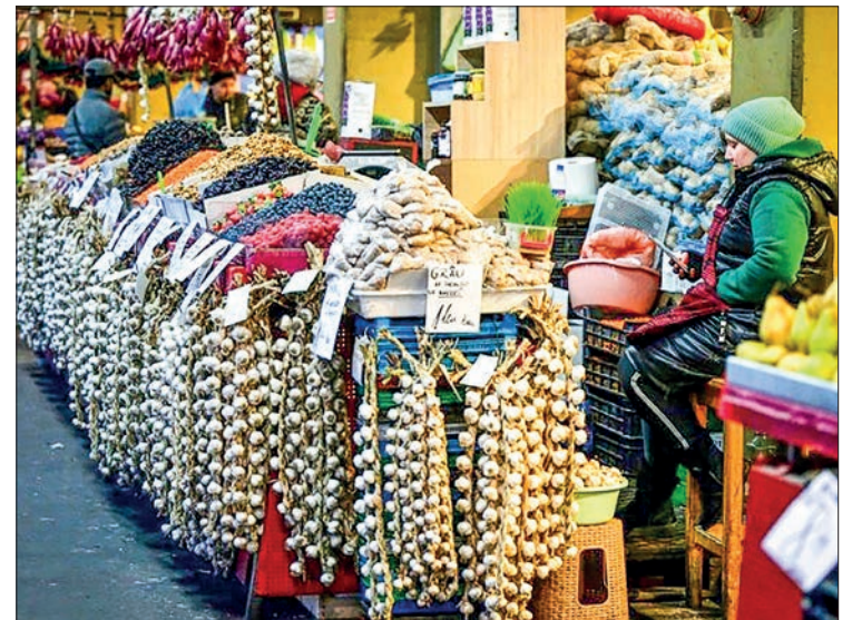
Experts say Romania's inflation is linked to its excessive budget deficit.

While Romania's inflation has fallen from 10 per cent last year, it remains high with consumer prices at an annual rate of 5.1 per cent in October, according to the EU statistics office. — AFP