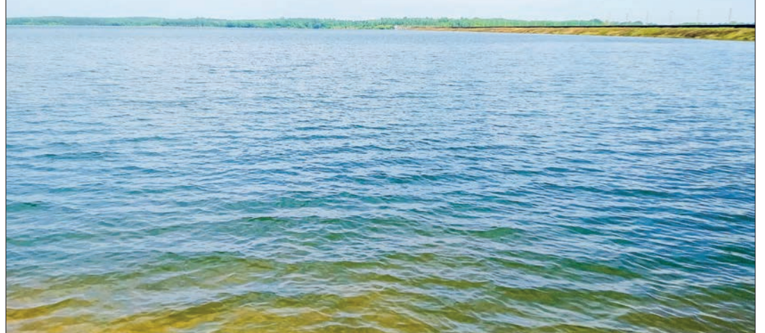
Mazin Dam, which is one of the dams in Bago Region, protects flooding in Bago Region.

DUE to the impact of Typhoon Yagi, several ASEAN countries faced severe flooding. In Myanmar, Bago is one of the affected areas where management to mitigate damages to urban areas, villages, and farmlands could be conducted with eight reservoirs prior to the typhoon’s arrival, according to the Bago Township Department of Irrigation and Water Utilization Management.