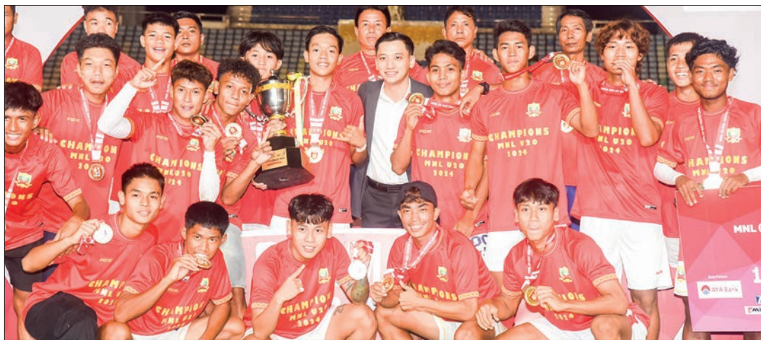
This photo showcases the Shan United U-20 team celebrating their championship victory.