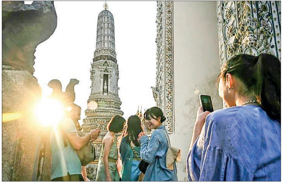
Thailand is banking on the return of tourists to boost its economy.

Looking ahead, economic activities continue to be driven by the tourism and service sectors, while exports and industrial output are gradually recovering, said BOT Assistant Governor Chayawadee Chai-Anant. — Xinhua