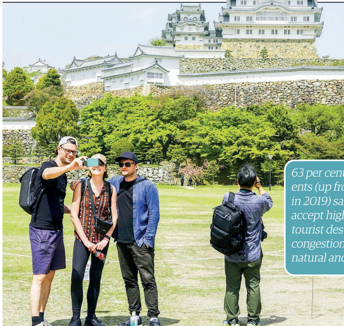
Foreign tourists (bottom L) pose for a photo in front of Himeji Castle in Hyogo Prefecture on 17 April 2024.