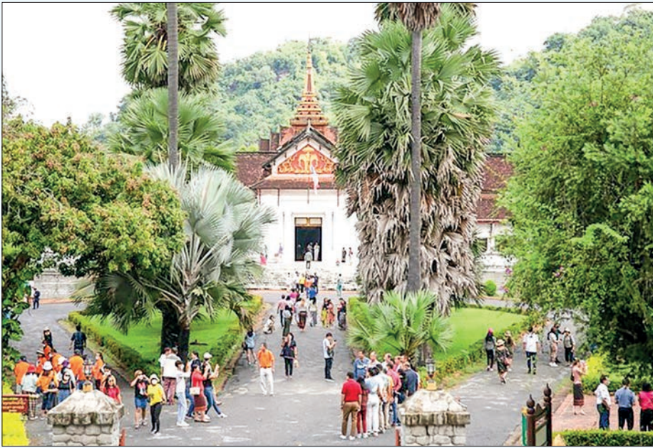
Tourists visit the town of Luang Prabang, a UNESCO world heritage site in Laos, 15 July 2022.