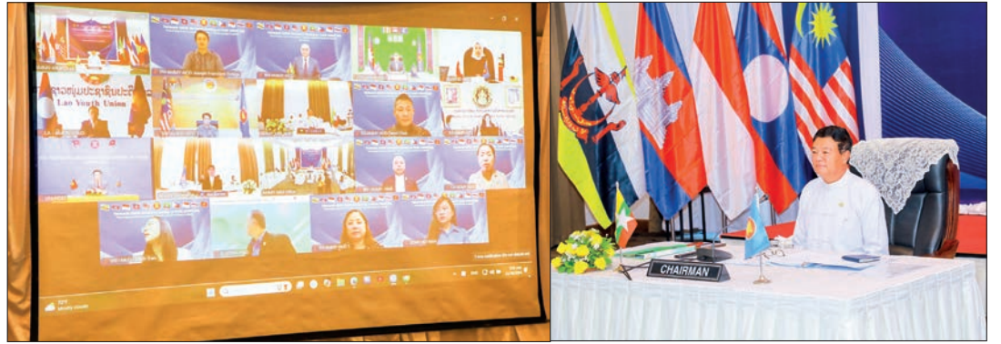
The 13 th ASEAN Ministerial Meeting on Youth (AMMY) and the 9 th ASEAN Plus Three Ministerial Meeting on Youth (AMMY+3) in progress yesterday.

In 2011, approximately 40,000 HIV-positive patients were able to receive ART treatment. However, according to the latest data, by the end of September 2024, over 215,000 patients had received treatment, representing a fivefold increase compared to 2011. The peak of new HIV infections occurred in 2000, with nearly 30,000 new cases, but this number has since decreased by about one-third, to just over 10,400 cases in 2023. — MNA/TRKM