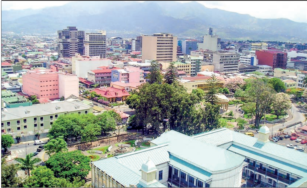
San José, Costa Rica, is the vibrant capital city known for its rich cultural heritage, bustling markets, and proximity to lush rainforests and volcanoes.