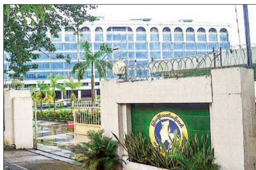
The office building of the Central Bank of Myanmar in Yangon.

CBM aims to curb the instability in the foreign exchange market and the currency devaluation. According to CBM's notification on 15 March, it has been joining hands with law enforcement agencies to combat and prosecute those who attempt to manipulate the currency market under the existing laws. CBM allowed authorized dealers (private banks) to operate online foreign exchange trading freely as per the market rate depending on supply and demand, starting from 5 December 2023. — NN/KK