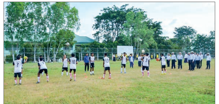
Union Minister for Electric Power U Nyan Tun observes training sessions of the MOEP's athletes who will compete in the Fifth National Sports Festival yesterday.

Following this, the Union minister inspected the Nay Pyi Taw No (1) 230 kV main substation in Ottarathiri Township and the 33/11 kV Wunna Theikdi sports substation in Zabuthiri Township. They checked the power distribution systems for sports venues to ensure a continuous, safe, and reliable electricity supply. They also reviewed equipment such as transformers, electrical devices, and power lines to ensure they remained in good condition and instructed proper maintenance. Union Minister U Nyan Tun further inspected the power supply arrangements from substations to sports venues, ensuring all were functioning efficiently. — MNA/KZL