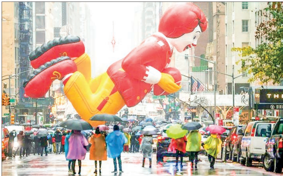
A Ronald McDonald balloon floats during the annual Macy's Thanksgiving Day Parade in New York.

Salesforce said its 2024 figures are based on shopping data from 1.5 billion consumers captured across its customers and other data feeds in its Commerce Cloud, Marketing Cloud, and Service Cloud. — Xinhua