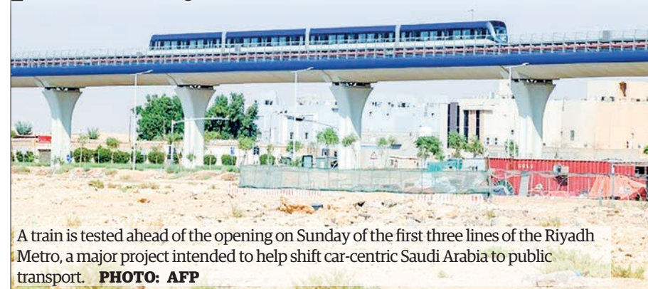
A train is tested ahead of the opening on Sunday of the first three lines of the Riyadh Metro, a major project intended to help shift car-centric Saudi Arabia to public transport.

The Riyadh Metro is a fully automated (driverless) system, designed to transport over 3.6 million passengers at maximum capacity.