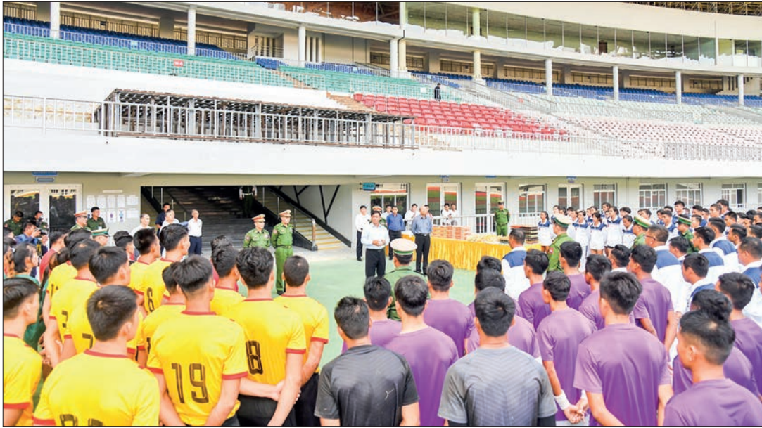
SAC Member Deputy Prime Minister and Union Minister for Defence Admiral Tin Aung San encourages the Defence Ministry's sports teams to prepare for the upcoming Fifth National Sports Festival yesterday.