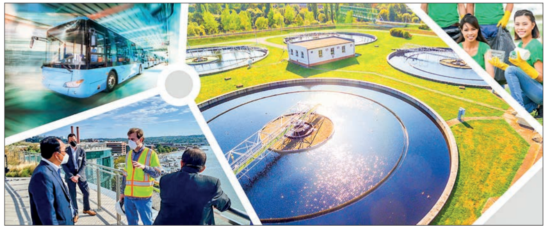
An illustration showcasing a vibrant Southeast Asian city with a sustainable, resilient, and inclusive urban solution.

Chairman of the State Administration Council Prime Minister Senior General Min Aung Hlaing delivered a speech at the ceremony to launch the operation of the new Diesel Electric Multiple Unit (DEMU) along the Yangon Circular Railway, at Yangon Railway Station in Mingala Taungnyunt Township of Yangon Region.