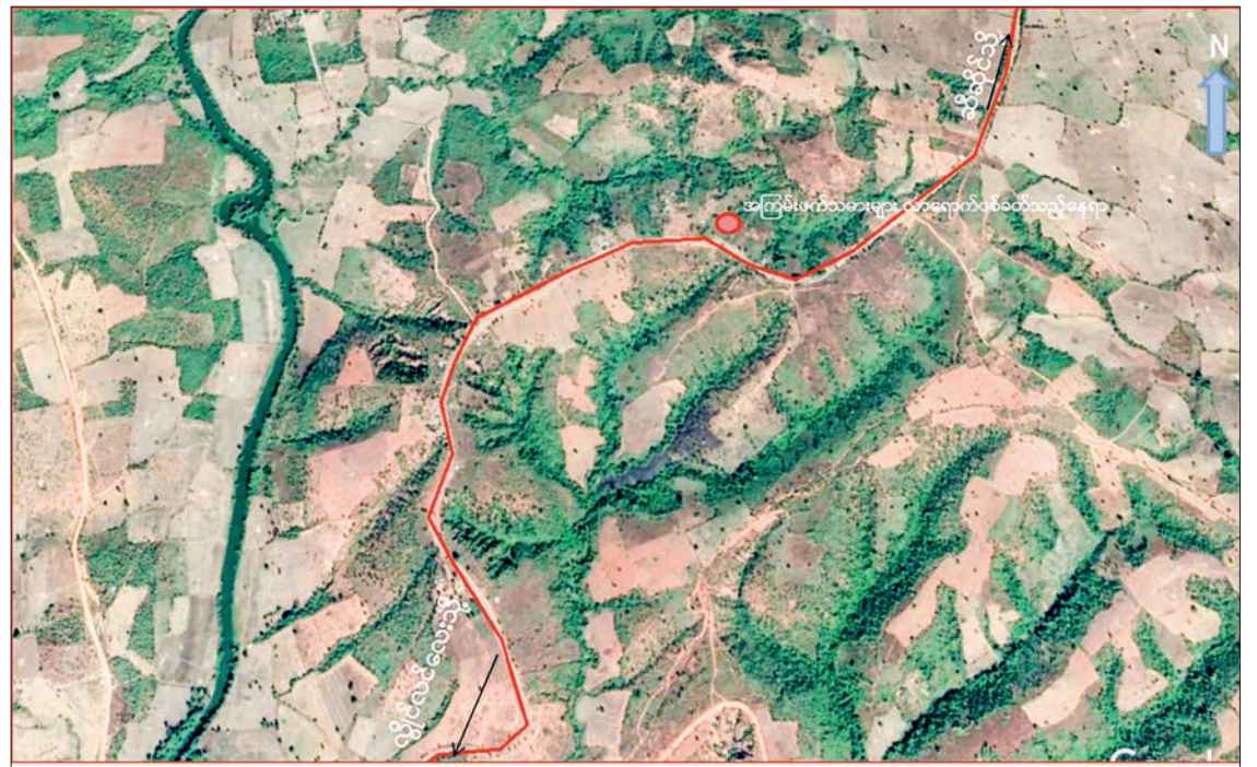
The map shows the KNDF and PDF terrorists attack at the vehicle which carries monks on the Loikaw-Hsihseng Road yesterday.