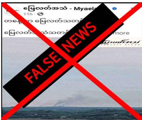
Screenshot of Myaelat Athan validates misinformation.

MALICIOUS media circulated misinformation claiming that security forces torched Kyaukpone and Khepyit villages in Sedoktara and