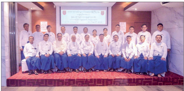
New members of the Myanmar Chinlone Federation.

The executive body comprises 17 members, along with a secretary, joint secretary, and subcommittees on referees, international relations, demonstrations, mobilization, communications, fundraising, and event organization.