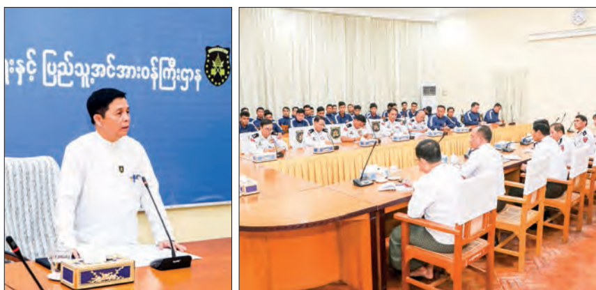
Union Minister U Myint Kyaing meets members of the MoIP men's volleyball team yesterday.

Following his speech, the Union minister provided financial support to the team and assured them of additional resources as needed. The Ministry of Immigration and Population will participate in the men's volleyball competition at the Fifth National Sports Festival. — MNA/KZL