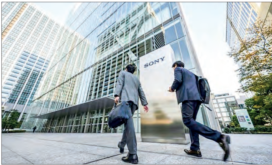
Sony used its music industry experience to develop a new distribution model for gaming consoles.

Ken Kutaragi overcame skepticism to create PlayStation, revolutionizing gaming with 3D graphics and iconic titles.