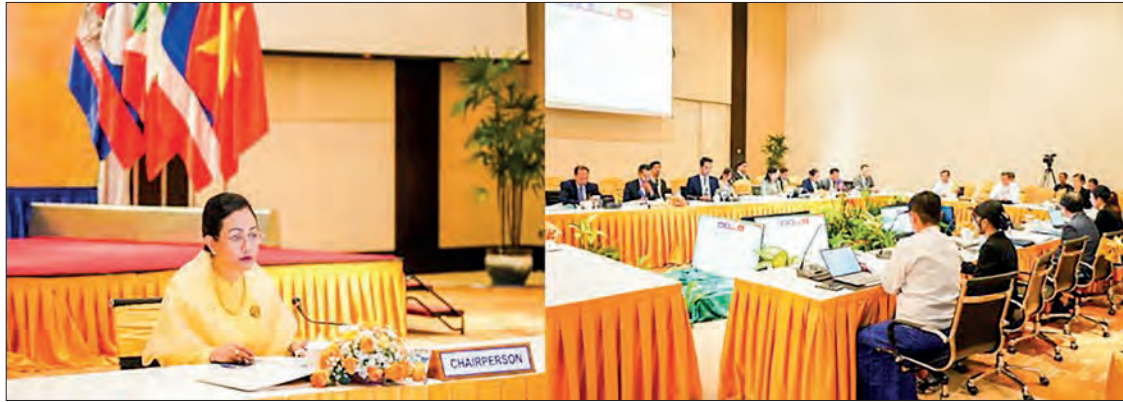
The seventh CLMV and sixth ACMECS Tourism Ministers and Senior Officials Meetings in progress yesterday in Yangon, chaired by Union Minister Dr Thet Thet Khine.

The meeting discussed and approved measures to facilitate regional tourism, simplify entry procedures, connect regional tourist destinations, expand direct flights from distant tourist markets, collaborate to