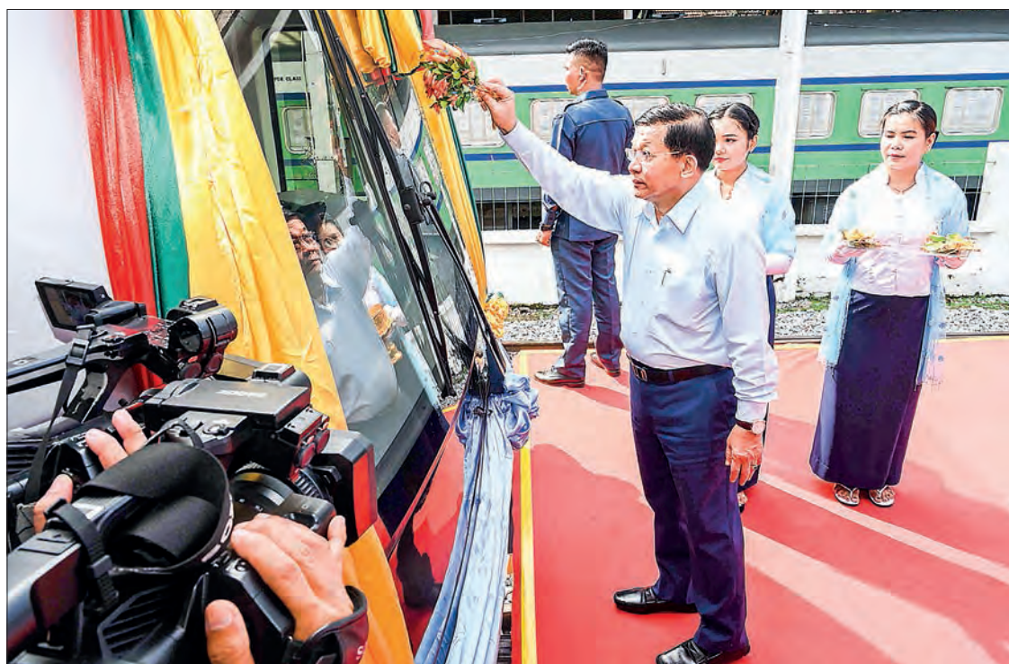
SAC Chair PM Senior General Min Aung Hlaing sprays scented water on DEMU locomotive for Yangon Circular Railway launch.

along the route to give speedy transport services to the people on a daily basis.