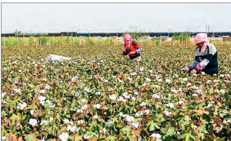
Farm workers pick cotton wool on the plantation.

prices are about 60 per cent lower than those of Myanmar. Every country lays down different policy patterns to fix oil prices, the Supervisory Committee on Oil Import, Storage and Distribution of Fuel Oil stated. — NN/KK