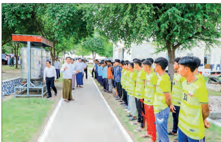
Union Minister U Min Thein Zan meets athletes at the Transit Centre (Ywataw) in Nay Pyi Taw yesterday.

During his inspection, the Union minister met participating teams and urged the athletes to prioritize their health and to train diligently to become record-setting athletes who can bring honour to the nation. He emphasized selecting athletes who meet high standards and providing them with consistent training opportunities. Athletes were encour-