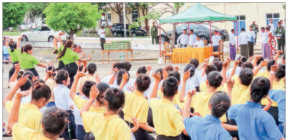
Performers from the Ministry of Religious Affairs and Culture rehearse for the Fifth National Sports Festival.