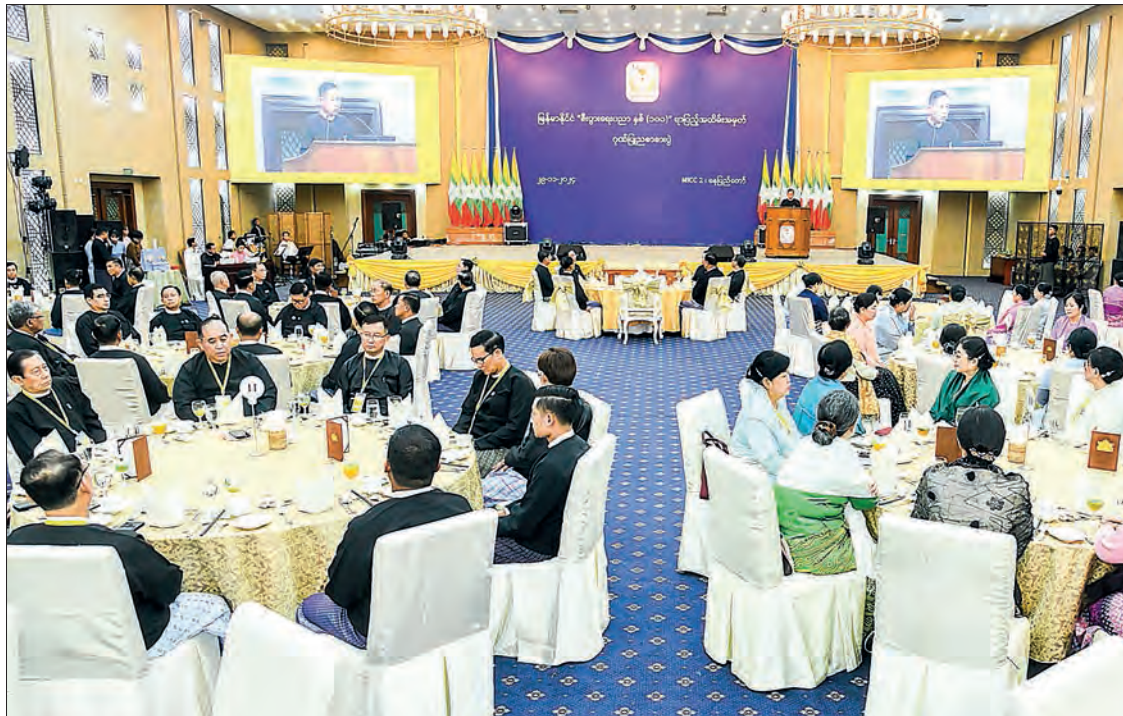
State Administration Council Vice-Chair Deputy Prime Minister Vice-Senior General Soe Win joins the honorary dinner for 100 years of Myanmar Economics Education.