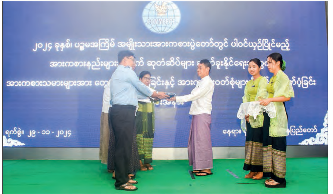
Union Minister U Tun Ohn presents sportswear to athletes from the Ministry of Commerce.

UNION Minister for Commerce U Tun Ohn inspected athletes who will participate in the Fifth National Sports Festival 2024 and encouraged athletes from the men's and women's volleyball team, futsal team, Sepak Takraw team, and athletic team.