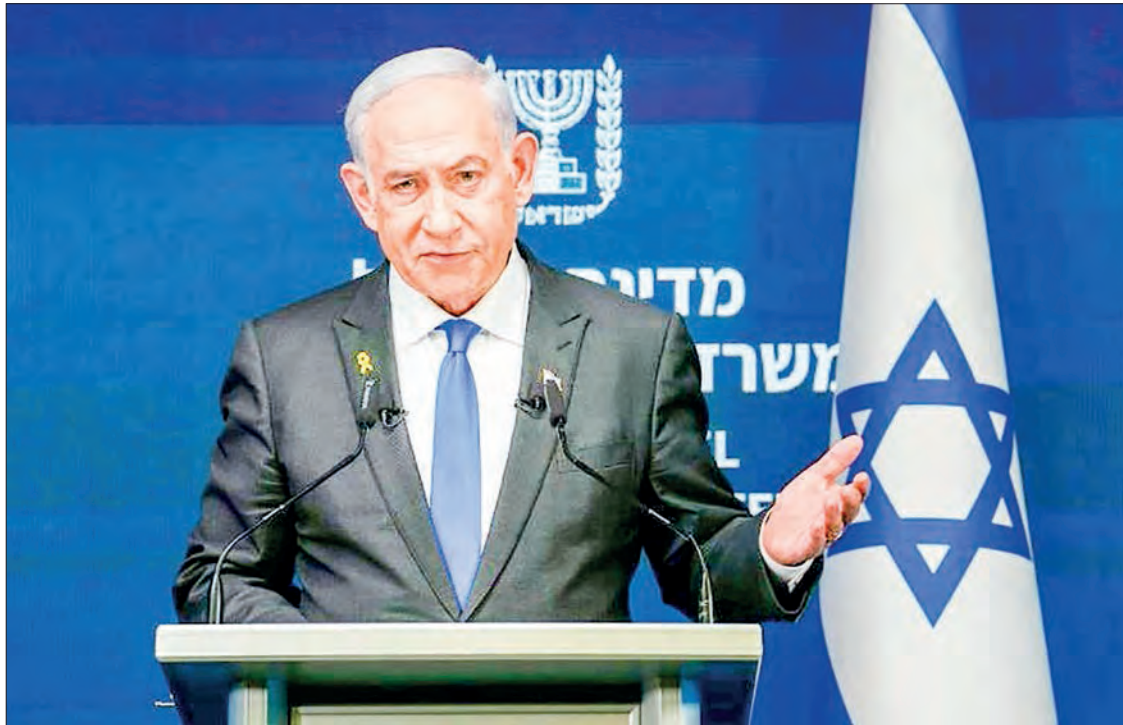
Israeli Prime Minister Benjamin Netanyahu has repeatedly vowed to stop Iran acquiring a nuclear weapon, by military means if necessary.

Iran to hold nuclear talks with Britain, France, Germany after UN censure and ahead of Trump's return.