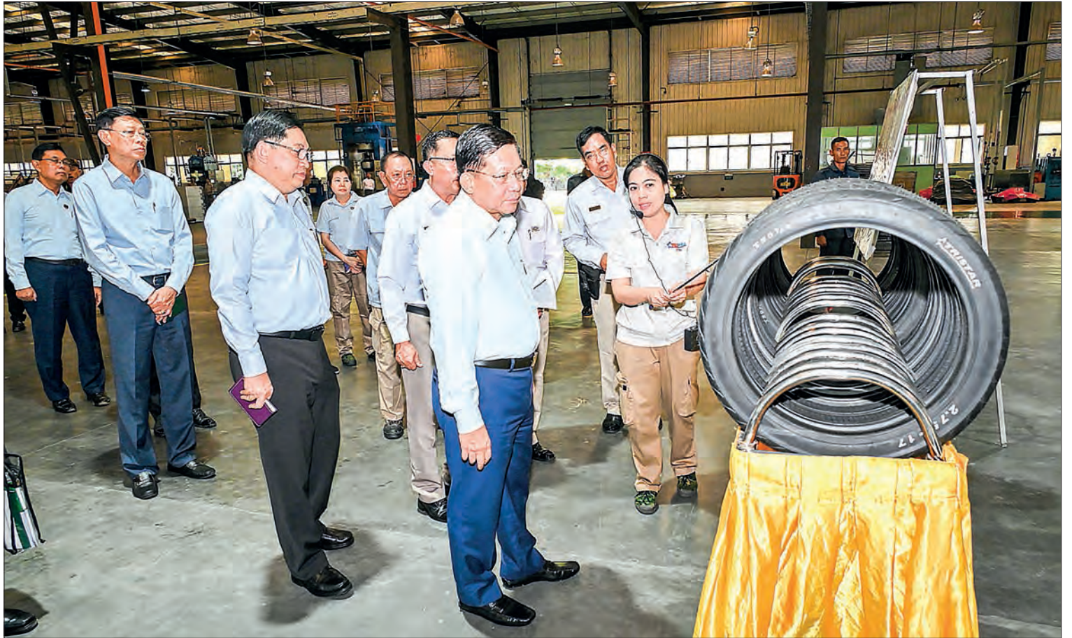
SAC Chair PM Senior General Min Aung Hlaing looks into tyre products during his inspection tours at the Tyre Factory (Ywama) yesterday.

He noted that it is necessary to seek market shares