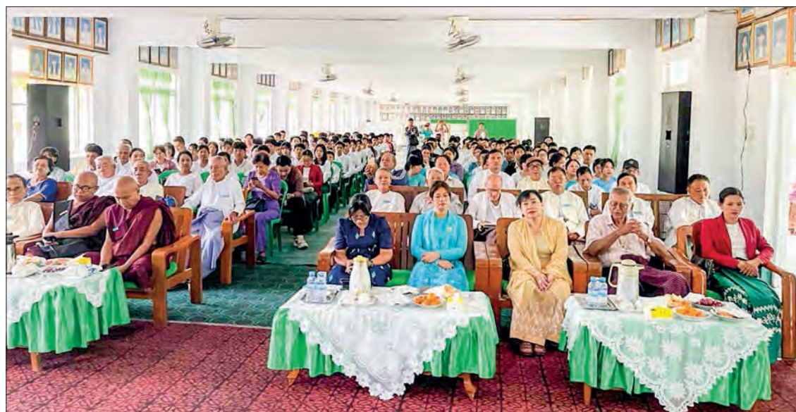
Literati Day and Nawaday Literary Awarding event in progress yesterday in Pyay.