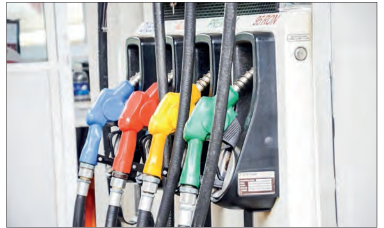
As per the statement, 90 per cent of fuel oil in Myanmar is imported, while the remaining 10 per cent is produced locally. Pump machine at petrol station.

As per the statement, 90 per cent of fuel oil in Myanmar is imported, while the remaining 10 per cent is produced locally. Domestic fuel prices are highly correlated with international prices. The State is steering the market to mitigate the loss experienced by the importers, sellers and energy consumers. Consequently, the government is trying to distribute the oil at