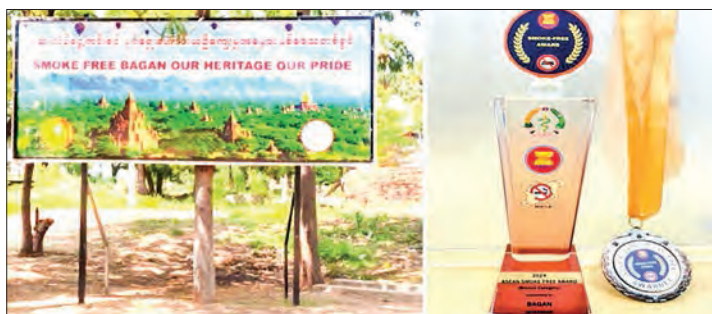
This image showcases a poster promoting a smoke-free area.

"The aim is to create smoke-free areas in tourist destinations frequented by domestic and foreign travellers. Additionally, we will establish other smoke-free areas in places related to tourist destinations, such as universities, basic education schools, airports, ports, and passenger vehicles.