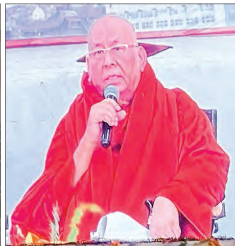
Sitagu Sayadaw addresses the 3 rd Convocation of Lumbini Buddhist University and the 20 th University Day Ceremony on 29 November 2024 in Kathmandu, Nepal.