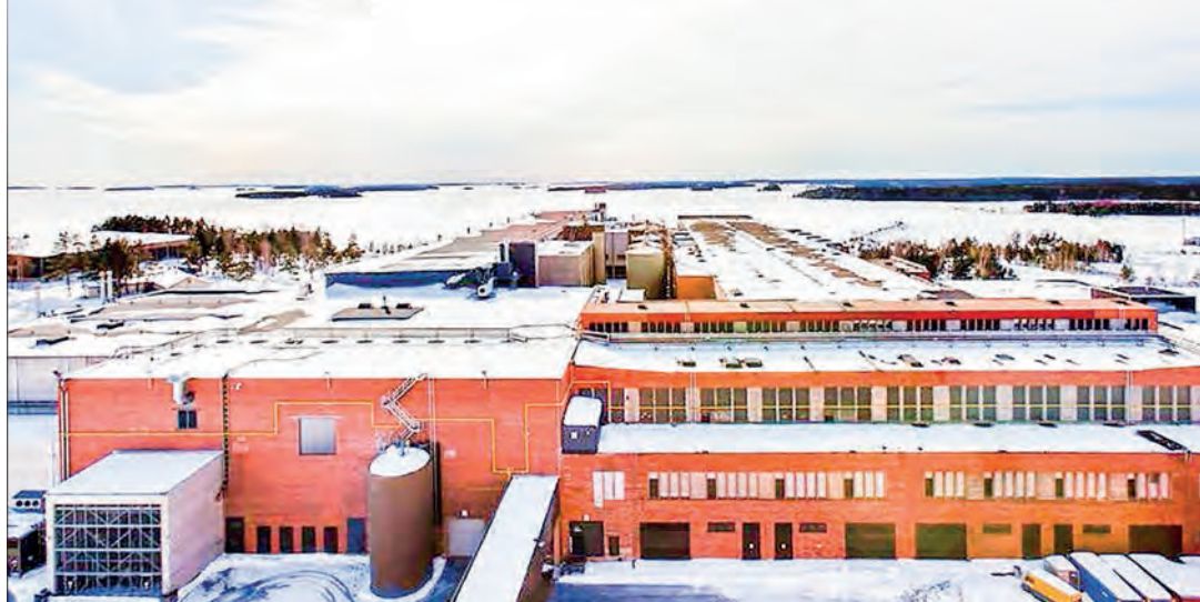
The picture shows the exterior of Google's data centre in Hamina, located approximately 145 kilometres east of the country's capital Helsinki.

first data centre in Hamina, a city located approximately 145 kilometres east of the country's capital Helsinki, in 2009. In May this year, the US tech giant announced a new one billion-euro investment to expand its Hamina campus, which is expected to create more jobs in the next two years, according to local media reports. (1 euro = US $1.06) — Xinhua