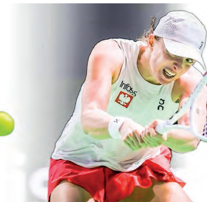
Iga Swiatek has been hit with a one-month ban.

Consequently, Swiatek was given a one-month suspension,