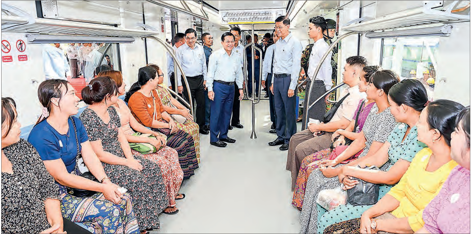
State Administration Council Chairman Prime Minister Senior General Min Aung Hlaing warmly greets co-passengers on newly launched DEMU train in the Yangon Circular Railway yesterday.

Salient points from the speeches delivered by the Senior General in launching the DEMU train on the Yangon Circular Railway 1. As battery electric trains will be run in the country in the future, preparations must be made to build locomotives and carriages locally through technological research. 2. Transformation of EMU into BEMU system must be prioritized as well as diesel locomotives into BELs to save the cost of fuel for diesel locomotives. 3. It is necessary to calculate traffic safety in using BELs facilitated with signal apparatuses which are speedier than diesel locomotives.