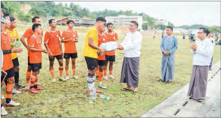
Union Minister Dr Myo Thein Kyaw provides sportswear to athletes.

The Ministry of Science and Technology will participate in the Fifth National Sports Festival with 85 athletes competing in five events: men's football, men's volleyball, men's Sepak Takraw, men's futsal, and men's golf.