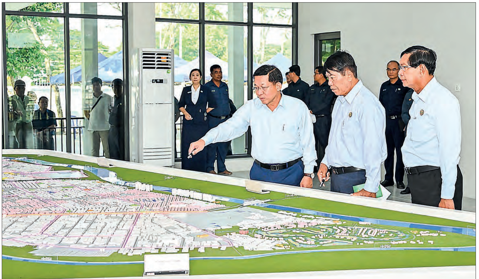
State Administration Council Chair Premier Senior General Min Aung Hlaing is pictured during his inspection tours on urban development achievements in Hlinethaya Township yesterday.

The Senior General stressed the need to calculate the construction of extended lecture halls and other supporting buildings to meet the