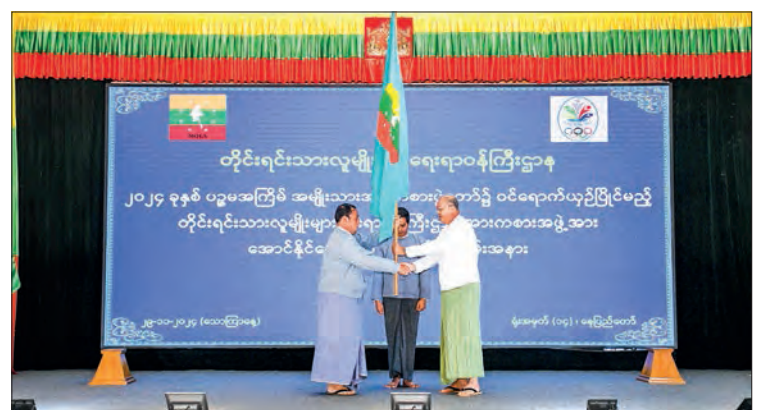
Union Minister Jeng Phang Naw Taung hands over the flag of victory.

The team leader led athletes in reciting four sports resolutions and presented an update on the team's training preparations. — MNA/KZL