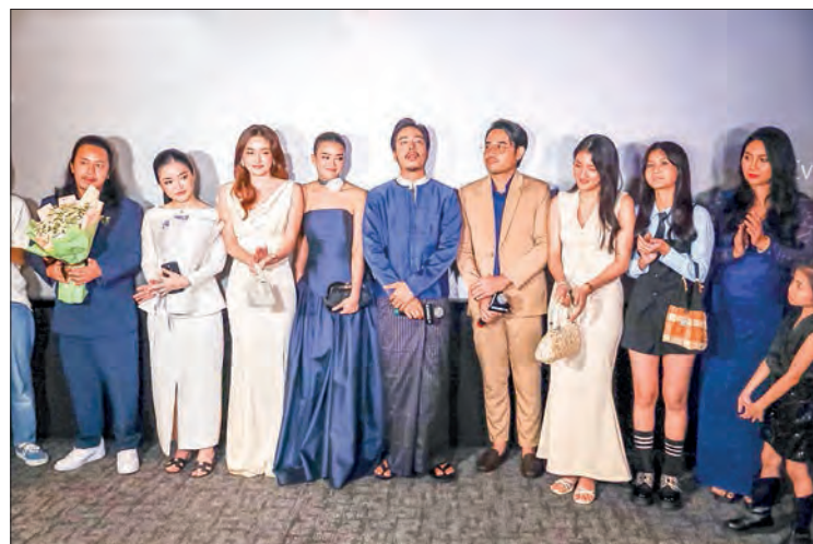
This image showcases artistes and participants at the press show.