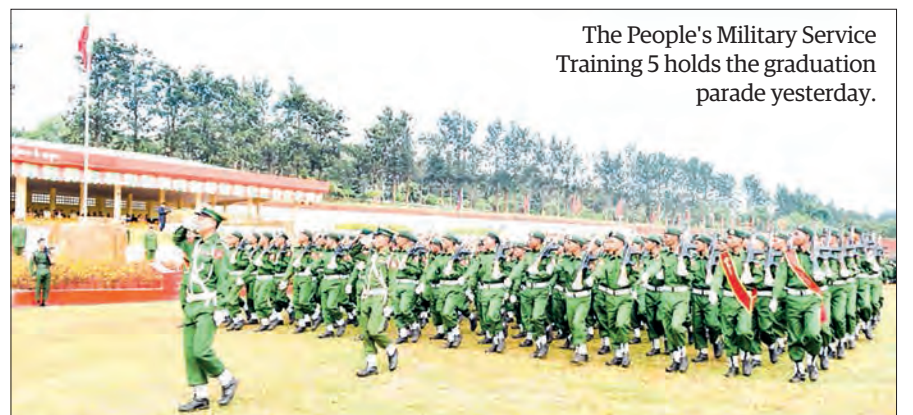
The People's Military Service Training 5 holds the graduation parade yesterday.

The fifth training batch, which started on 9 September 2024, provided a comprehensive curriculum covering both theoretical and practical aspects of military science. During the training period, participants engaged in various arenas, including combat strategy, tactical deployment, and physical drills. Practical training included small arms handling, unit-based assault manoeuvres, mine handling, and battlefield engineering. Leadership and field administration modules were also incorporated to ensure that trainees are well-rounded in both military operations and organizational management. — MNA/TKO