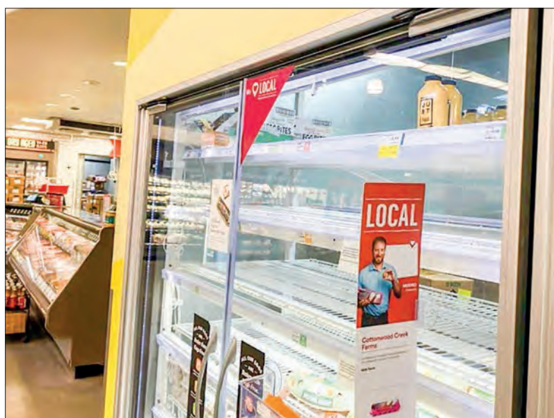
Photo taken on 10 January 2023 shows that shelves of a grocery store are bare of eggs in Westminster, Colorado, the United States. Egg shortages and skyrocketing prices at grocery stores continue to impact American consumers as a result of the historic avian flu that is spreading rapidly among wild birds and has triggered the killing of millions of poultry.

“What we really need globally, in the US and abroad, is much stronger surveillance in animals: in wild birds, in poultry, in animals that are known to be susceptible to infection, which includes swine, which include dairy cattle, to better understand the circulation in these animals,” she said. — AFP