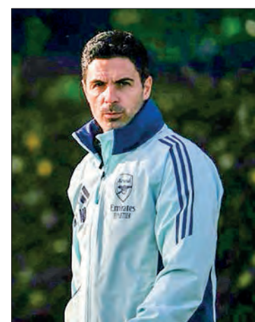
Arsenal will climb to second in the Premier League table if they beat West Ham.

Victory at the London Stadium on Saturday would likely lift Arsenal to second in the table ahead of the Sunday matches, which includes a pivotal clash between Liverpool and City.