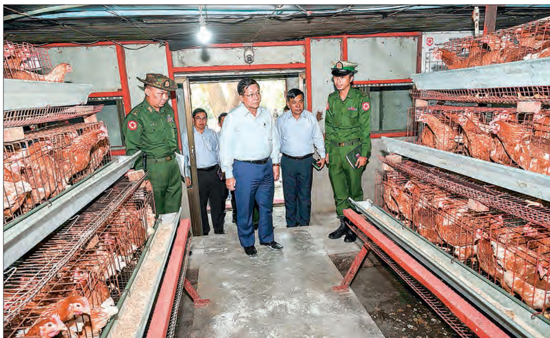
Senior General Min Aung Hlaing views the No 1 Agriculture and Livestock Farm of the Yangon Command.

The Senior General visited the farm and fulfilled the needs reported by those in charge of the sections.