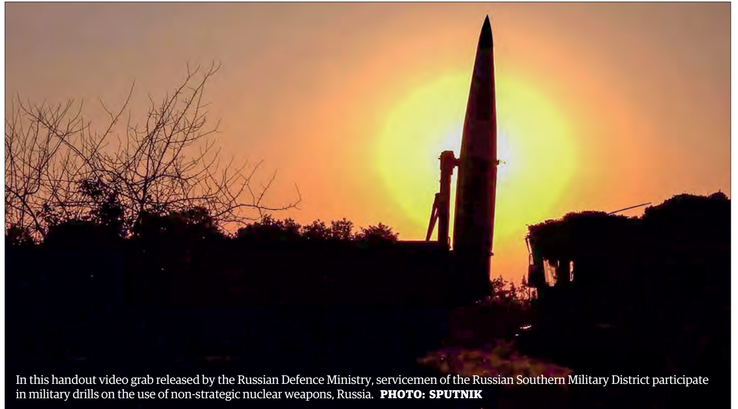
In this handout video grab released by the Russian Defence Ministry, servicemen of the Russian Southern Military District participate in military drills on the use of non-strategic nuclear weapons, Russia.

“What do you think, at the level of common sense? If the country with which we are essentially fighting now