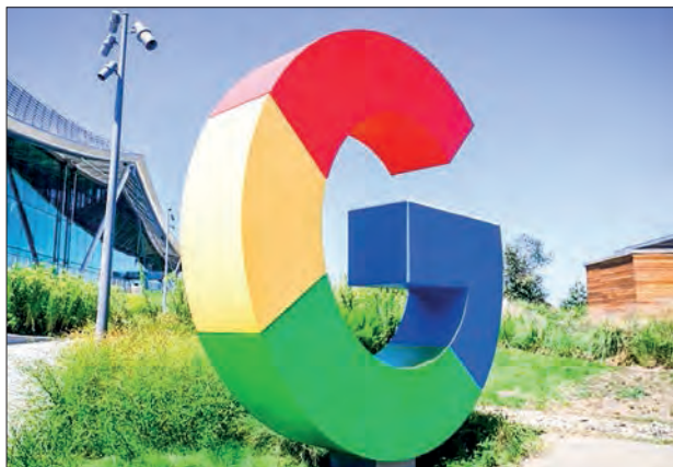
Google's advertising practices are also subject to investigations or proceedings in Britain, the EU and the United States.