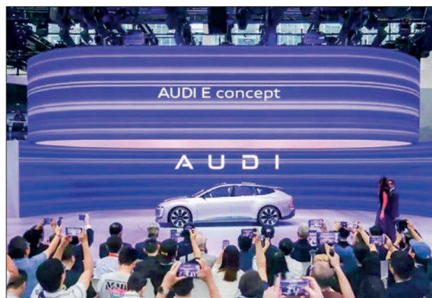
SAIC Volkswagen is China's first joint venture for passenger cars.

VOLKSWAGEN Group and SAIC Motor announced on Wednesday that they have signed an extension for their joint venture contract in Shanghai until 2040, further strengthening their long-term partnership.