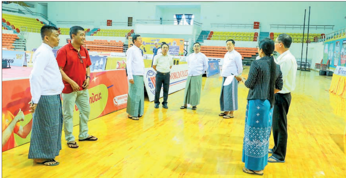
Union Minister for Sports and Youth Affairs U Min Thein Zan inspects the preparations at various sports venues within Nay Pyi Taw's Wunna Theikdi Sports Complex yesterday.

other key venues, including the Weightlifting Sports Hall, Box-