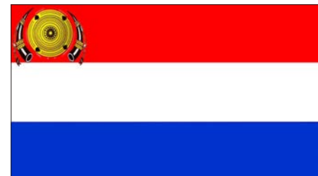
The flag design of the Karen National Democratic Party.