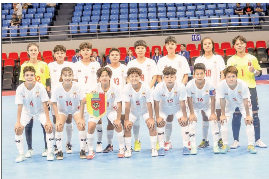
Myanmar women's football squad.

MYANMAR will host the Group D matches of the 2025 AFC Women's Futsal Qualifiers, which include the participation of the Myanmar national team.