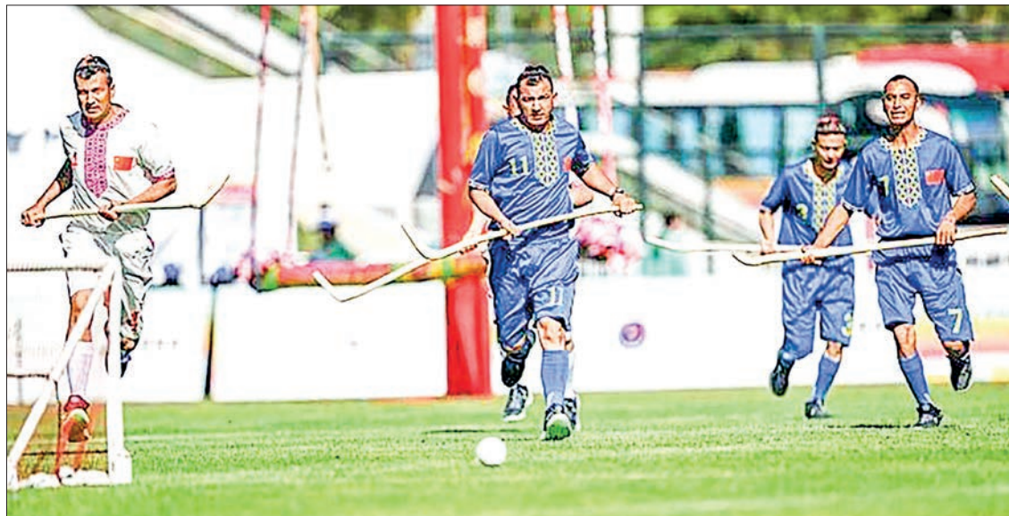
Athletes of Xinjiang compete in a Maire Ball match at China's 12 th National Traditional Games of Ethnic Minorities in Sanya, south China's Hainan Province, on 24 November 2024.