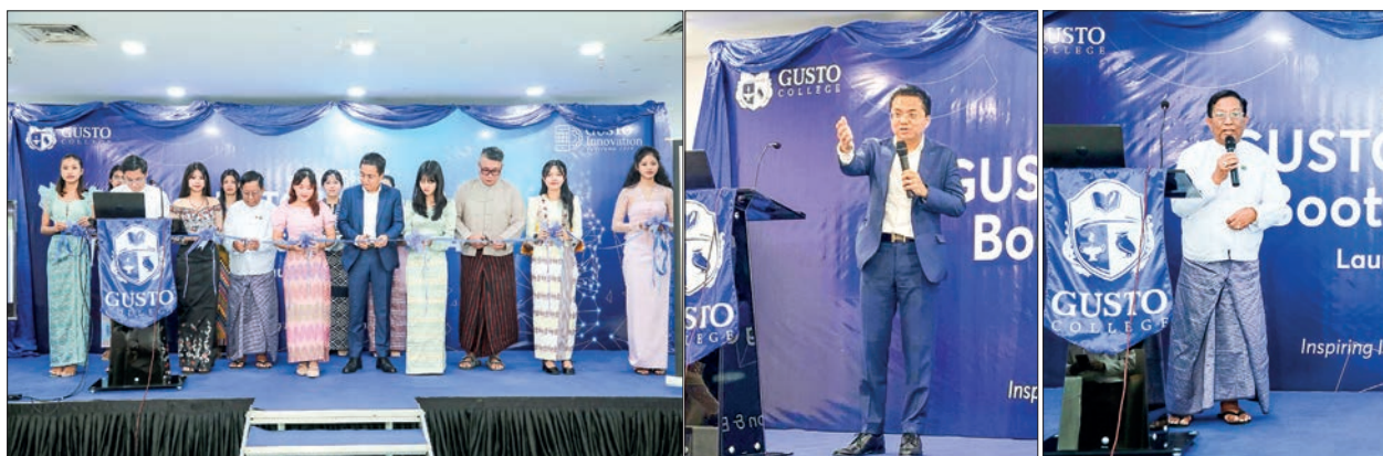
Pictures showcase the third edition of GUSTO Innovation Bootcamp 2024 hosted by GUSTO College.

"Innovation is a foundation of development and education is a tool to upgrade humankind's ca-