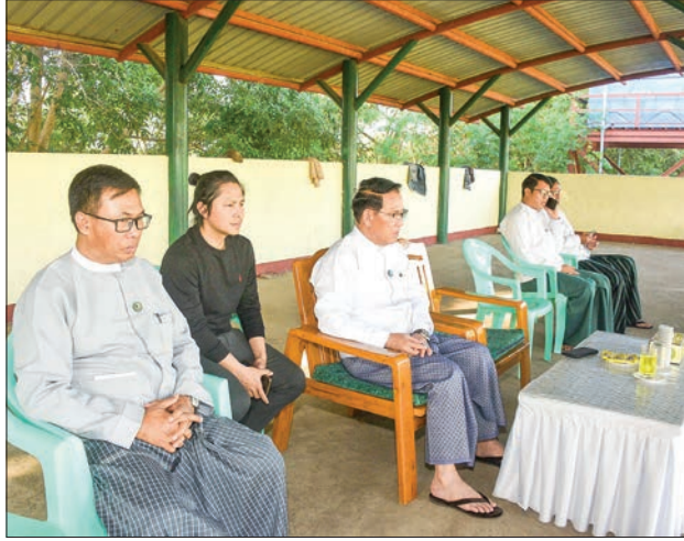
Union Minister for Information U Maung Maung Ohn inspects the rehearsals and preparations for the opening and closing events of the Fifth National Sports Festival at Wunna Theikdi Stadium B yesterday.

Union Ministers U Maung Maung Ohn and U Min Thein Zan inspected the installation of