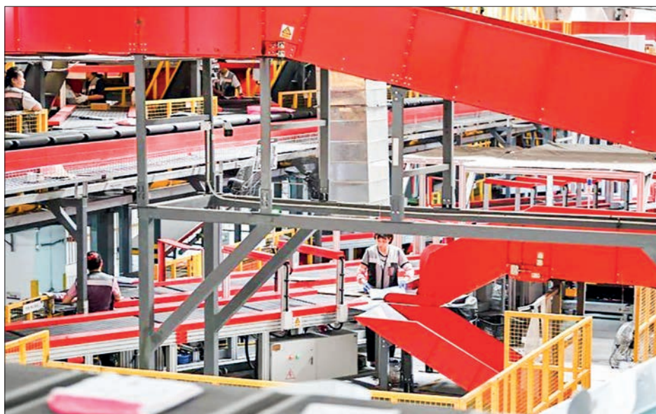
Workers sort parcels at a transit hub of SF Express in Tianjin, north China, 18 June 2024.

The market outlook for advertising companies has continued to improve, and their development confidence has significantly increased, the administration said. — Xinhua