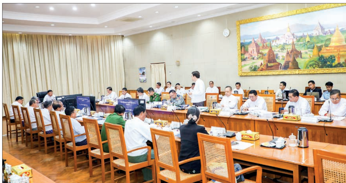
SAC Member Deputy Prime Minister MoTC Union Minister General Mya Tun Oo presides over the fourth meeting of the Central Committee on Ensuring the Smooth Flow of Trade and Goods yesterday.

He continued that the export volumes exceeded the import volumes and so the country received Trade Surplus. Meanwhile, the CMP sector showed a decline when compared with the same