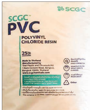
Confiscated illegal construction materials in Yangon.

Additionally, the combined teams impounded a Sunlong bus (worth approximately K90 million) carrying industrial materials