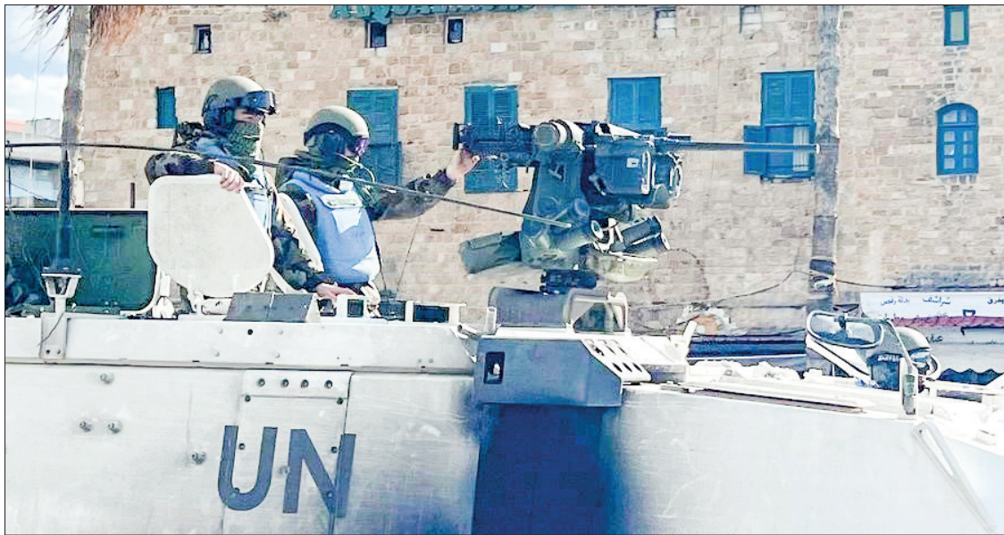
This photo shows a convoy of the United Nations Interim Force in Lebanon (UNIFIL) in Sidon, Lebanon, 25 November 2024.

The ceasefire was driven by three key reasons: focusing on the Iranian threat, allowing Israeli forces to replenish supplies after delays, and isolating Hamas by separating it from Hezbollah.