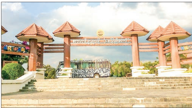
The photos (top and above) capture some places developed in Nay Pyi Taw.

THE Nay Pyi Taw Council has announced ongoing efforts to transform Nay Pyi Taw into a Clean City, Green City, and Smart City.