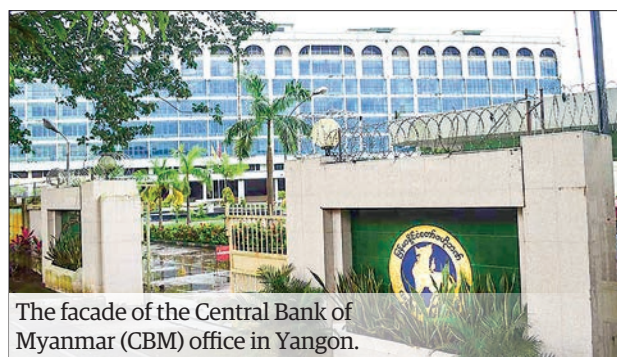
The facade of the Central Bank of Myanmar (CBM) office in Yangon.

THE Central Bank of Myanmar (CBM) injected over 1.79 million yuan into the financial market on 26 November after selling 17.8 million Thai baht and US$25,000 on 22 November.