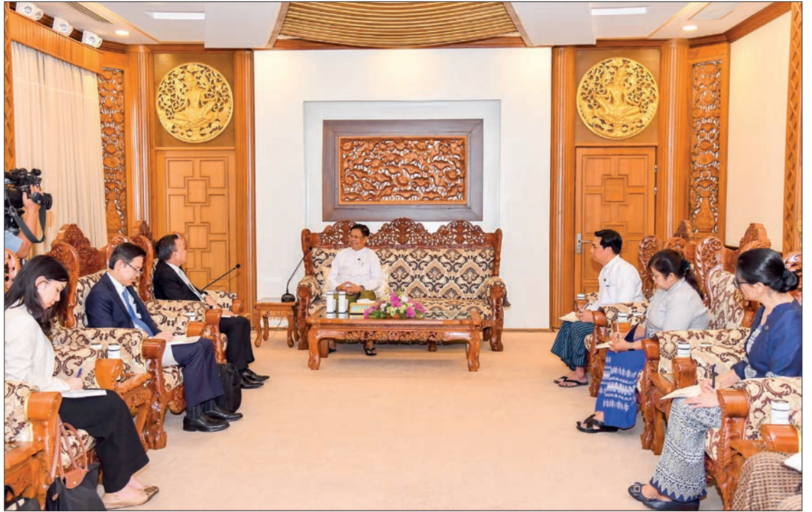
Deputy Prime Minister and Union Minister for Foreign Affairs U Than Swe meets Adviser to the Minister of Foreign Affairs of Thailand Mr Dusit Manapan in Nay Pyi Taw yesterday.

on the further enhancement of bilateral relations and ongoing cooperation and discussed matters pertaining to the advancement of multi-sectoral cooperation, maintenance of security and stability along the border and strengthening people-to-people contacts as well as closer collaboration at both regional and multilateral arenas. — MNA