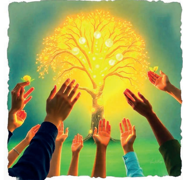
Appreciation is essential for healing, connection, and inspiration.