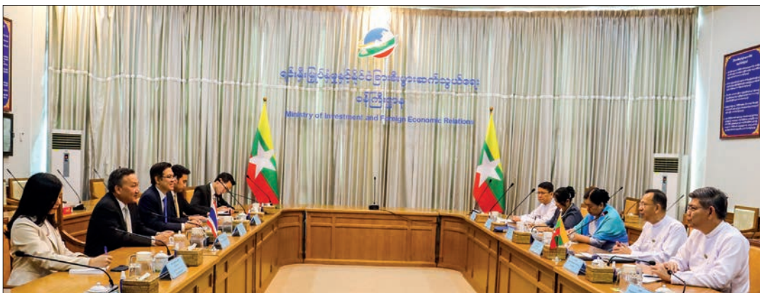
Union MIFER Minister Dr Kan Zaw discusses with the delegation led by Mr Dusit Manapan, Adviser to the Minister of Foreign Affairs of Thailand, in Nay Pyi Taw, yesterday.

Senior officials from the Ministry of Investment and Foreign Economic Relations, and representatives from the Ministry of Foreign Affairs of Thailand were also present at the meeting. — MNA