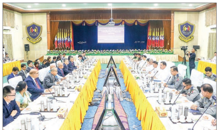
A meeting between the Supervisory Committee on Prompt Legal Action and Deportation of Foreigners Who Enter Myanmar Illegally and the foreign diplomats in Myanmar in progress in Nay Pyi Taw yesterday

An open and constructive discussion followed between committee members and the heads of foreign embassies and diplomats. Topics included the challenges of identifying, assisting, and rescuing foreign nationals, as well as deporting them in line with official processes. Participants shared ideas and explored potential solutions to address these challenges more effectively. — MNA/TMT