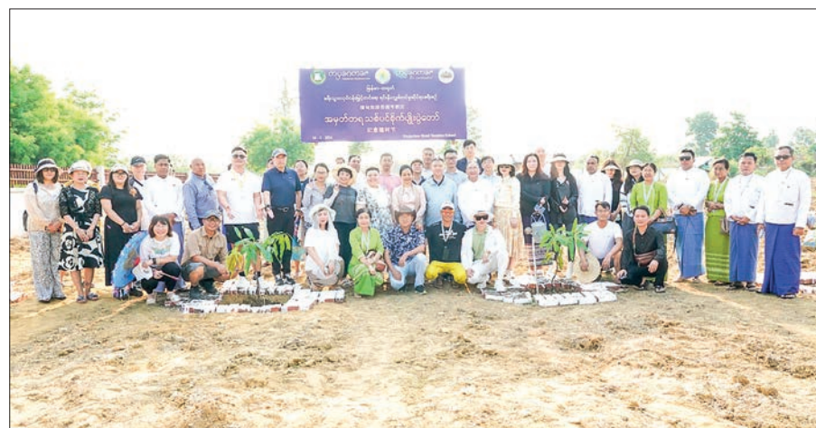
This photo showcases a group photo at one of the tour destinations in Myanmar for Fam-Trip.

These efforts underline the ministry's commitment to strengthening international tourism partnerships and showcasing Myanmar's diverse attractions. — ASH/TMT