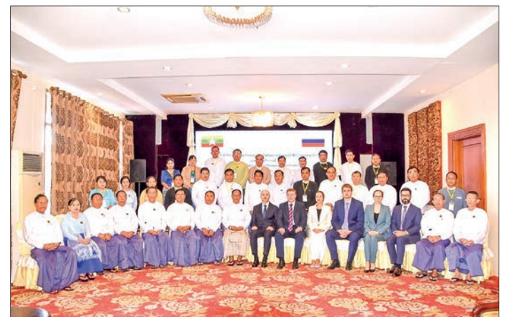
Attendees of a roundtable on recovering assets from corruption and workshop on anti-corruption pose for the documentary group photo in Nay Pyi Taw yesterday.

He also highlighted the intention of the commission to grab public participation in anti-corruption activities and create a society that condemns corruption at all to establish clean government and good