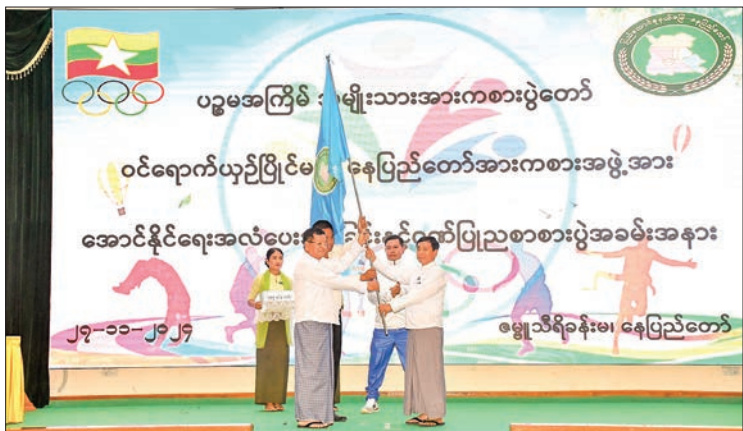
The Nay Pyi Taw Council chair hands over the flag for victory.

THE Nay Pyi Taw Council held a ceremony yesterday evening at the Zabuthiri Hall to present the victory flag and host a celebratory dinner for the Nay Pyi Taw sports team, which will compete in the Fifth National Sports Festival of 2024.