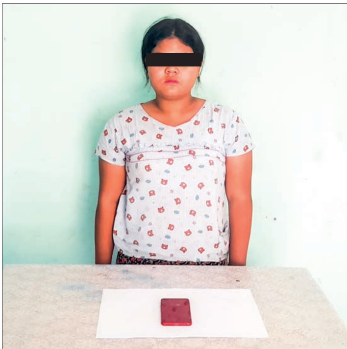
The offender with the cell phone used in her fraudulent schemes.

UNSCRUPULOUS individuals have been using social media, especially Facebook, to create fake pages claiming to sell counterfeit currency, deceiving and defrauding potential buyers. In response, security forces formed special investigation teams to track and apprehend these scammers.