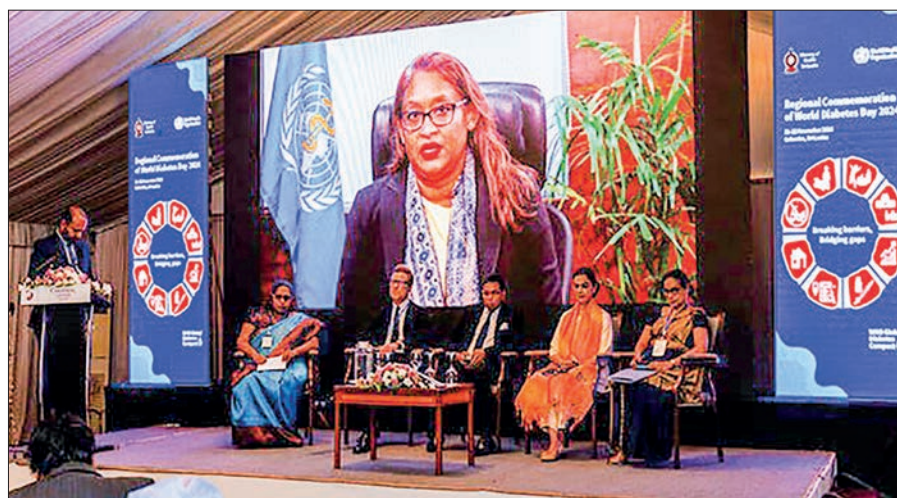
Health experts and officials adopted the "Colombo Call to Action" to strengthen diabetes prevention and control in the WHO South-East Asia Region.

in immense hardships and economic loss to people with diabetes, their families, health systems and national economies. — ANI