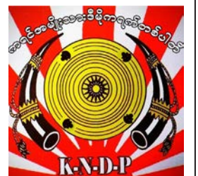
The emblem of the Karen National Democratic Party.