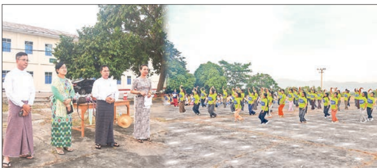
Deputy Minister for Religious Affairs and Culture Daw Nu Mra Zan observes the rehearsal focused on the presentation of the 'Six Eras' dance for the National Sports Festival in Nay Pyi Taw yesterday.

The performance highlights six historical eras – Pyu, Bagan, Inwa, Konbaung, Yadanabon, and the present day. Each era is represented through unidentical unique dance movements, musical compositions, and symbolic designs reflecting its cultural significance. The rehearsal is being supervised by the pro-rector (Training) from the National University of Arts and Culture (Mandalay). — MNA/KZL