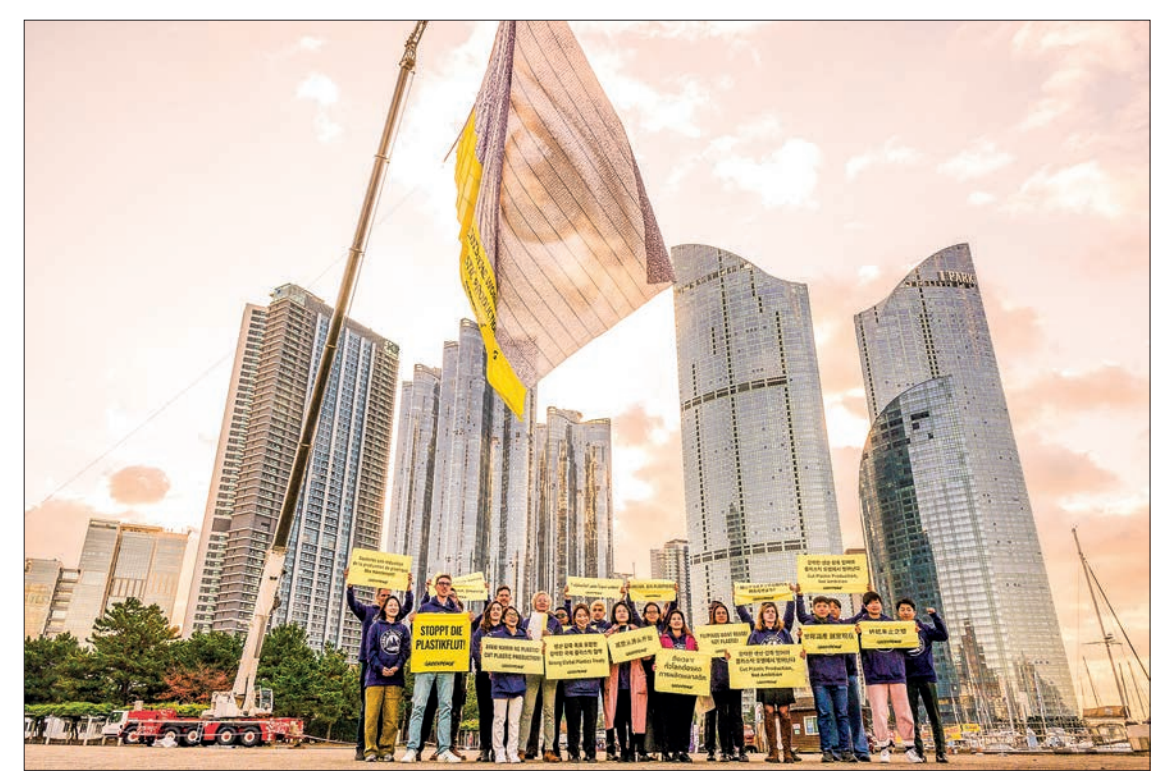
A flag with an eye and writing that reads "Governments, the world is watching, cut plastic production now" is displayed above Greenpeace activists holding placards in Busan on 25 November 2024 before the opening of the Fifth Session of UN Intergovernmental Negotiating Committee on Plastic Pollution (INC-5) at a nearby venue.

And while almost everyone agrees it is a problem, there is less consensus on how to solve it.