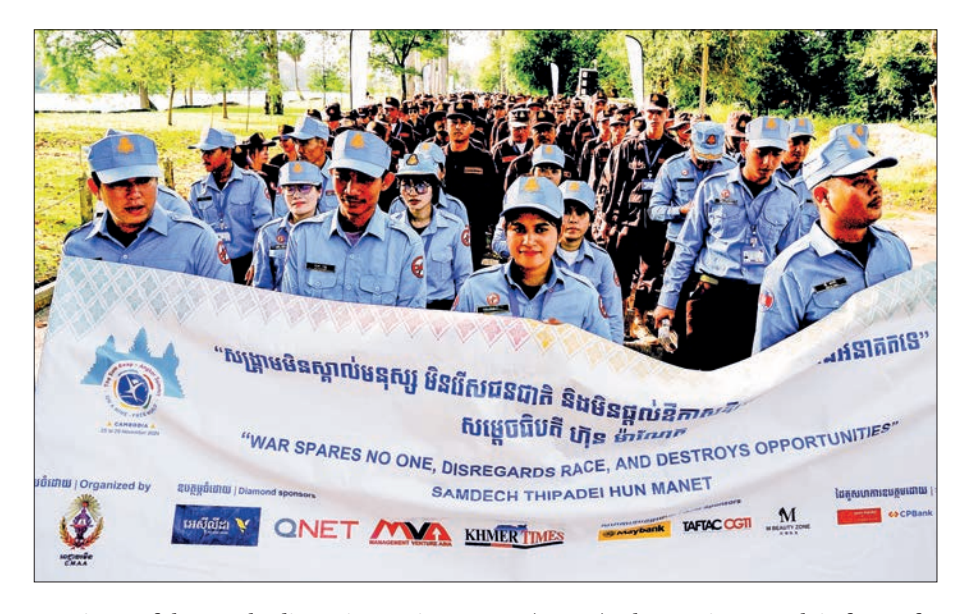
Deminers of the Cambodian Mine Action Centre (CMAC) take part in a march in front of the Angkor Wat temple for the banning of landmines as part of the Siem Reap-Angkor Summit on a Mine Free World, in Siem Reap province on 24 November 2024.

THE Siem Reap-Angkor Summit on a Mine-Free World was held here in northwest Cambodia's Siem Reap province on Monday, discussing actions to build a safer and more peaceful world from mines.