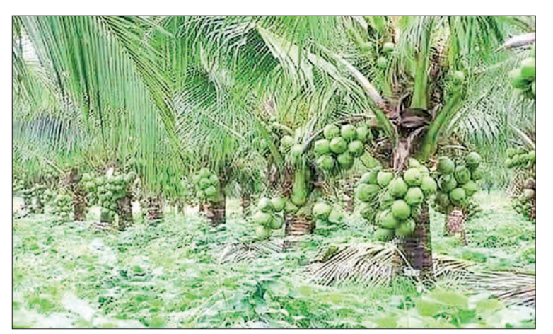
Dwarf coconut plants are thriving with abundant fruits.

In April this year, raw dwarf coconuts grown in Myanmar were exported to Thailand, according to coconut farms. Dwarf coconut can be made into finished products and the domestic market is likely to develop if packaging improves, and raw materials produced from the coconut can be used in making jelly and juice. — Thit Taw/ZS