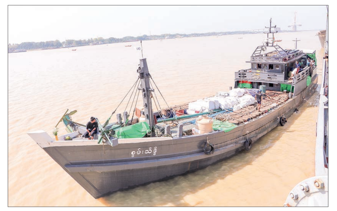
A vessel en route to deliver relief items to Rakhine State.

UNDER the guidance of the National Disaster Management Committee and the supervision of the Transport and Communications Committee, relief materials are being transported to Rakhine State using vessels, aircraft, and