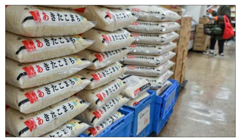
Bags of rice sit stacked high in a supermarket in central Tokyo on 22 November 2024.

Prolonged inflation has also impacted consumer behaviour, with many opting to save on everyday items. The association noted a decline in customer numbers compared to the same period last year. On the outlook, the association expects the upcoming winter bonuses and holiday shopping will help revive consumer spending. — Xinhua