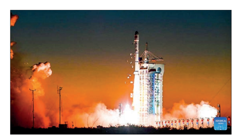
A Long March-2C carrier rocket carrying two satellites blasts off from the Jiuquan Satellite Launch Centre in northwest China, 25 November 2024.

March-2C carrier rocket on Monday, placing two satellites into space.