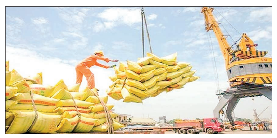
Export rice bags seen being loaded onto the overseas-bound merchant vessel at Yangon Port.

A total of 6,400 companies also failed to submit the AR in 2023. The registration and