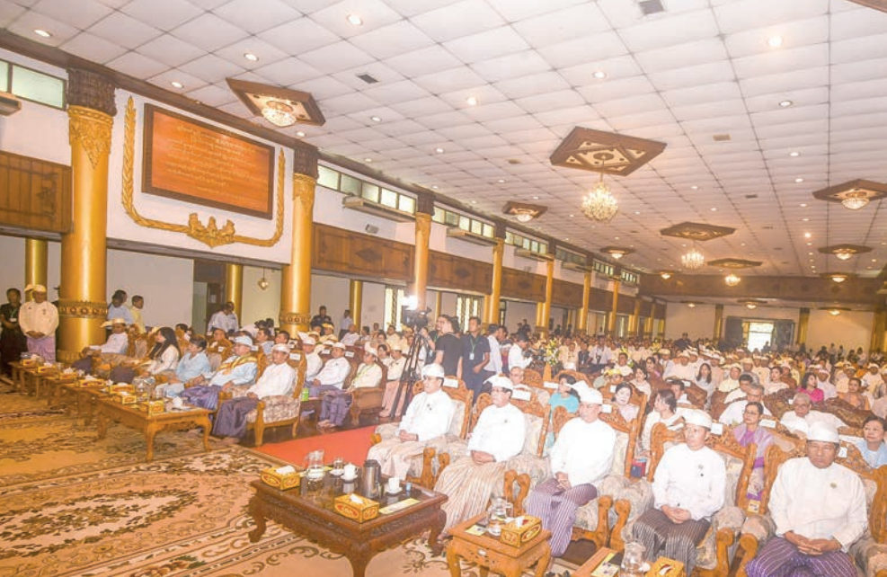
The 104th Anniversary of National Victory Day celebration and the religious titles offering ceremony in progress yesterday, attended by Union Minister U Maung Maung Ohn, dignitaries and the congregation in Nay Pyi Taw.

THE commemorative ceremony of the 104th Anniversary of National Victory Day and the religious title conferring ceremony were held at Tatmadaw Religious Hall near the southern corner of the Shwedagon Pagoda in Yangon yesterday.