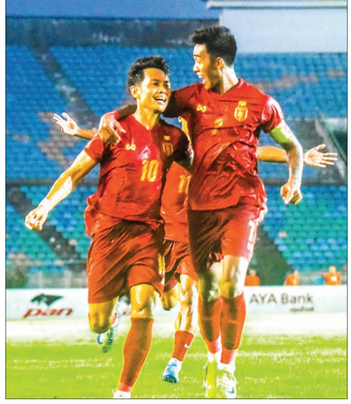
Myanmar players celebrate after scoring against the Lebanon team during a friendly match in Yangon

In the ASEAN Cup tournament, which will be held from 8 December 2024 to 5 January 2025, Myanmar is falling in Group B together with Vietnam, Indonesia, the Philippines and Laos. Myanmar will play against Indonesia in its opening match at Thuwunna Youth Training Centre on 9 December 2024. — Ko Nyi Lay/KZL