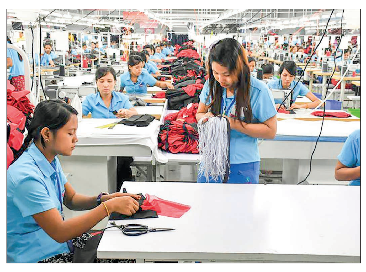
This photo shows a local garment factory which is operating with the CMP (Cut, Make and Pack) system.